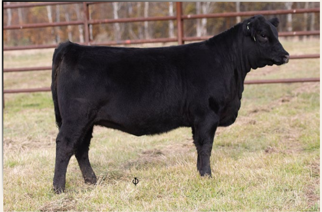
Heifer Calf EASTONDALE ANGUS

This heifer calf has been a favourite Merit Sting daughter here all summer. Merit Sting 7047E needs no introduction as he has said it all for himself over the past couple of years in the show ring. Now he is writing his next chapter with the progeny he sires. If you are coming to Saskatoon for the bull calf Sweepstakes the day before the Touch of Class sale you can see for yourself why we are so high on the siring ability of Sting. The Countess cow family stands right on the top rung of the ladder here at Eastondale.