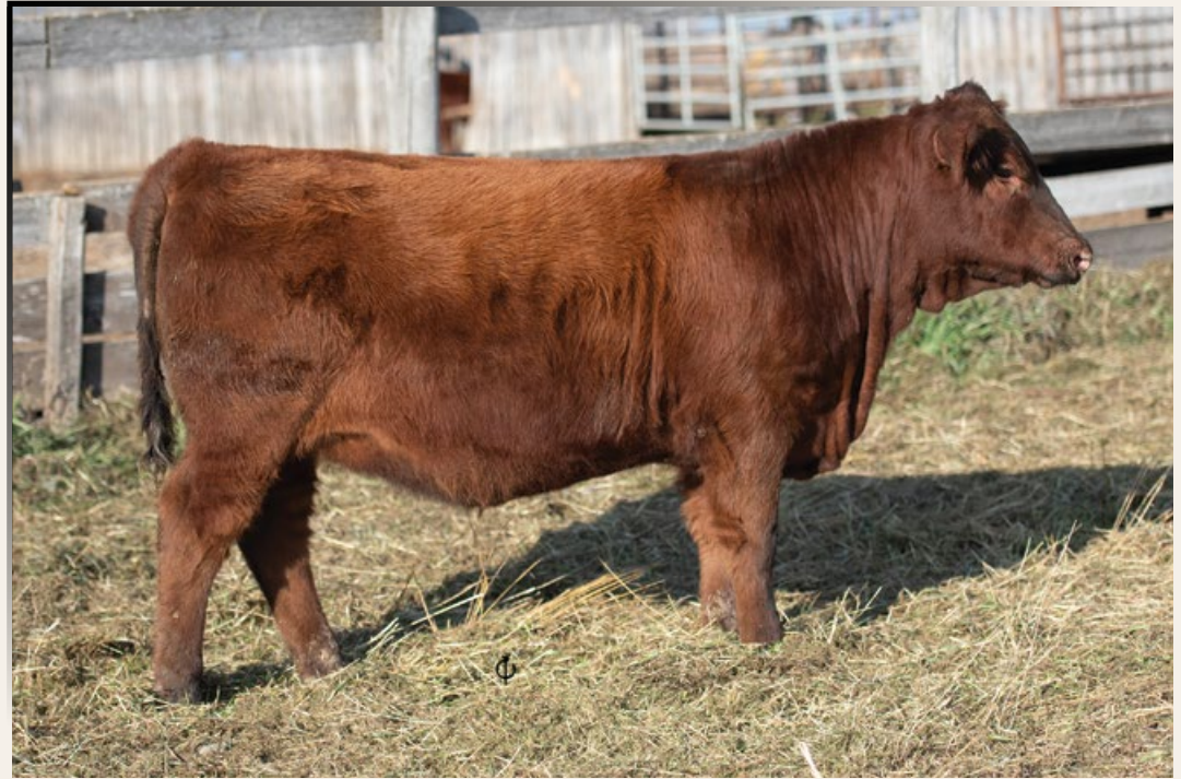
Heifer Calf TRIPLE L ANGUS