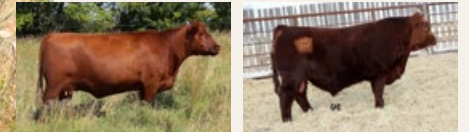
Dam and Full brother to Lot 21

Exposed to Red U2 Head Games April 22nd – May 21st Observed bred April 22nd Exposed June 1st to July 1st to Red Howe Eliminator 178F (son of 282Y donor)