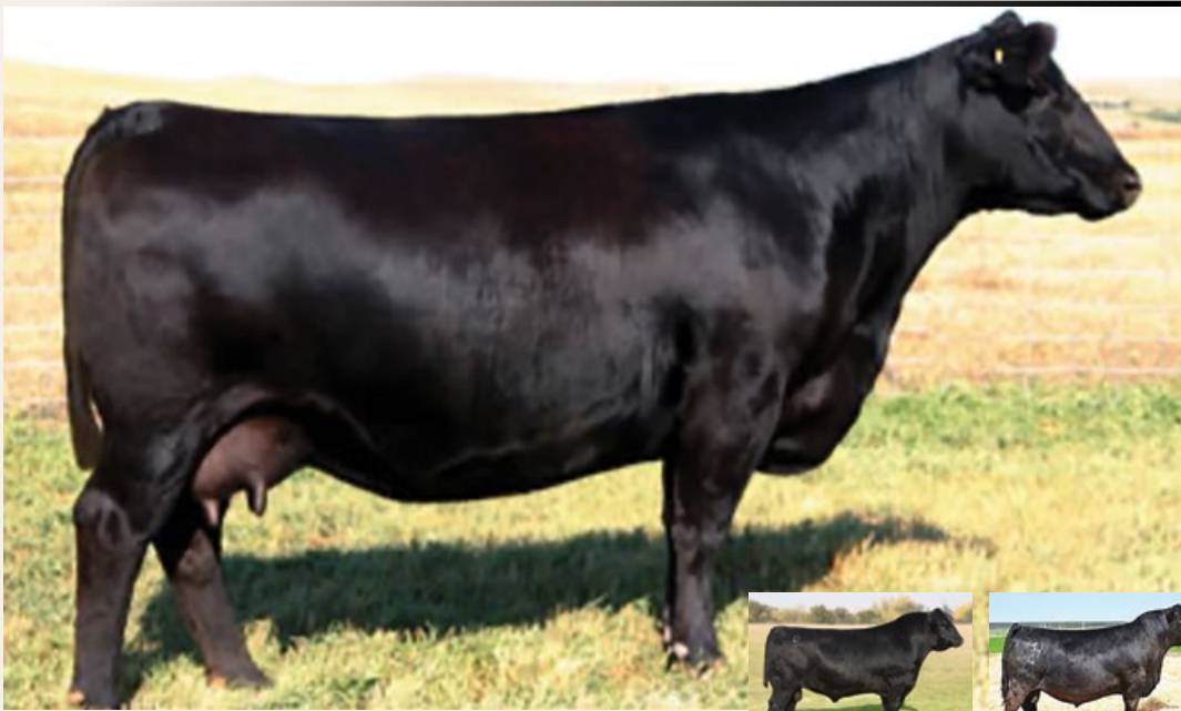
Baldrige 38 Special HA Cowboy Up

5218 come to us as an aged cow with a package of cows from SAV and has done nothing but kick out good ones since then. Her first calf in Canada produced a herd bull for MacArthur Livestock, then Rood Ranch and then Matejka Farms. Since then when not in transplant we have retained 3 more daughters of this special cow.