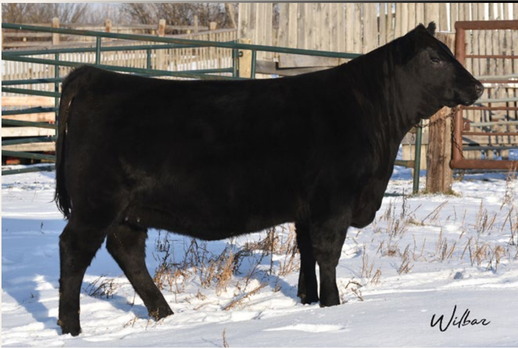
Heifer Calf WILBAR CATTLE CO