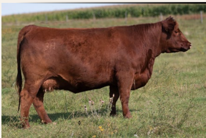
Sister to Lot 54