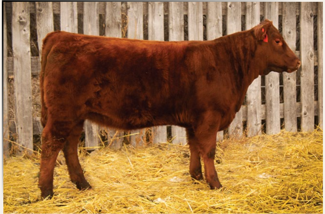
Heifer Calf J BAR DEE FARMS

Red J Bar Dee Pride 25 G has been a stand out heifer from day one. Her dad was the high selling bull in the Wilbar Bull sale. Her dam came to us from Pasquia Red Angus where we had the pick of the pen. She has been one of the top producing cows from day one and has knocked it out of the park again with this beautiful Element calf.