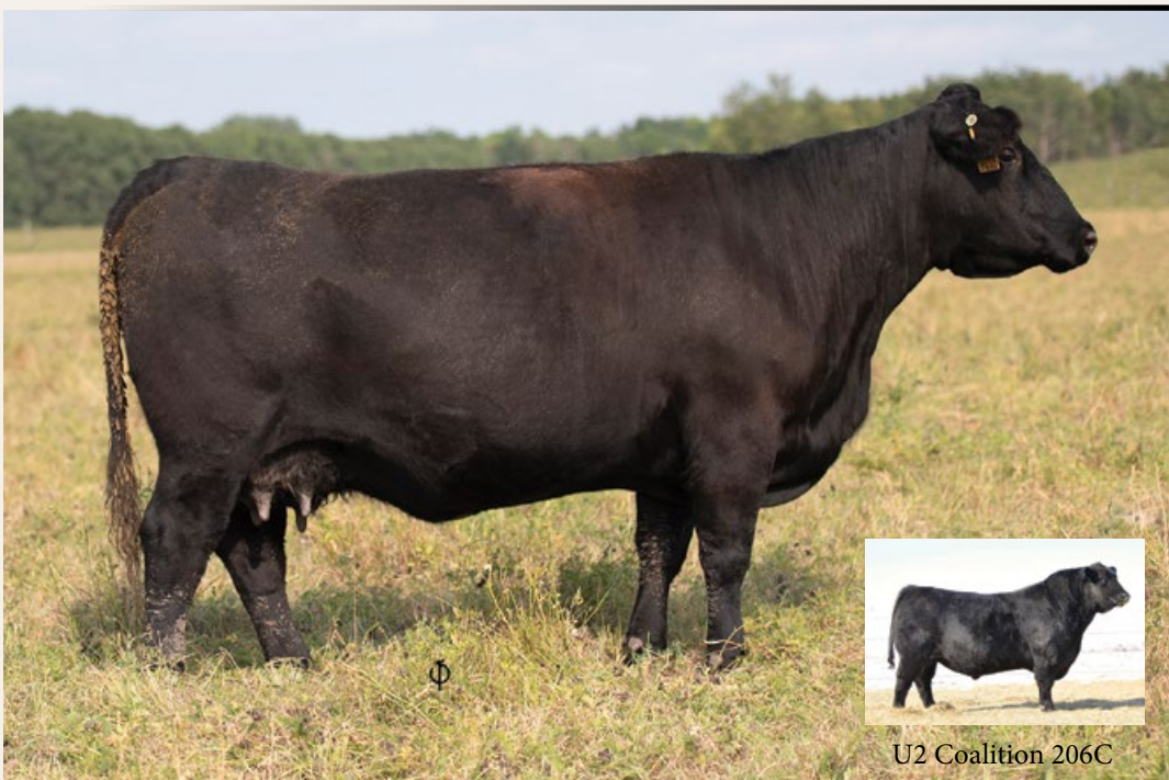
U2 Coalition 206C

Two sons to date have averaged $12000 both selling to commercial producers and her current year Sting son is a pen feature as well. In 2017 her heifer calf was the chosen pick of our heifer calves by NYK Cattle and NB Cattle Co. Another daughter was dam of our high selling bull a 4M Element son selling in this springs bull sale to J & S Angus of Keneston AK. Another VRD sired female was retained in herd as a bred heifer. Forever Lady 22'11 has superior foot structure as did her mother the GDAR Forever lady 9136 donor.