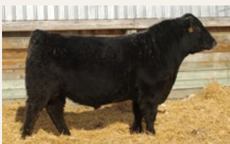
Service sire FRL Thunder 5F

Exposed FRL Thunder 5F April 1 to June 1. Favorable to early February calf.