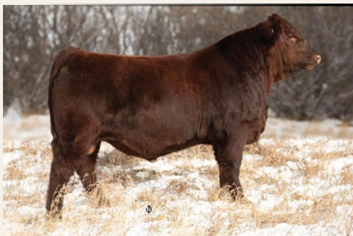
Son of Lot 54