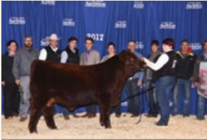
Service sire Red Wrights Triple L 6E

Service Red Wrights Triple L 6E April 1st - May 4th. Red Kenray Staunch May 12th - June 30th. Preg check favorable early service.