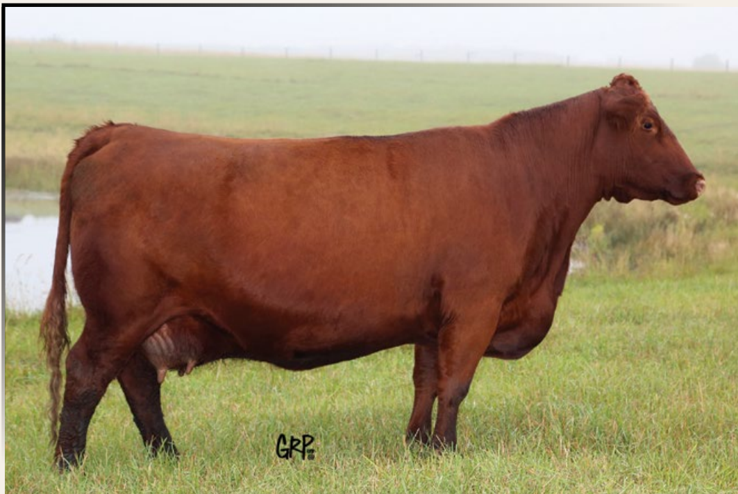
Future Flush ADAMSON FARM

Brylor will open up their semen tank for the new buyer as well that contains the likes of Assassin, Mariota, Resource 137E, Copenhagen 3Y, Renown, Staunch, Racer, Roughrider, Roosesevelt, Let's Roll and Next Step. Maria 53A come to Brylor as the $7000 High Seller out of the Keystone Classic. 53A production highlights include a $8000 heifer to Wraz and a $14,000 heifer to 2 Step Cattle Co in Arkansas which then went on to win the Arkansas State Fair. She now has a red Poker Face bull calf that she raised this summer that we have plans for the EEC this next year. A group of Czechs toured our place this fall and loved the pair! If you need volume and capacity to your herd then I suggest this flush on Maria as she can provide it.