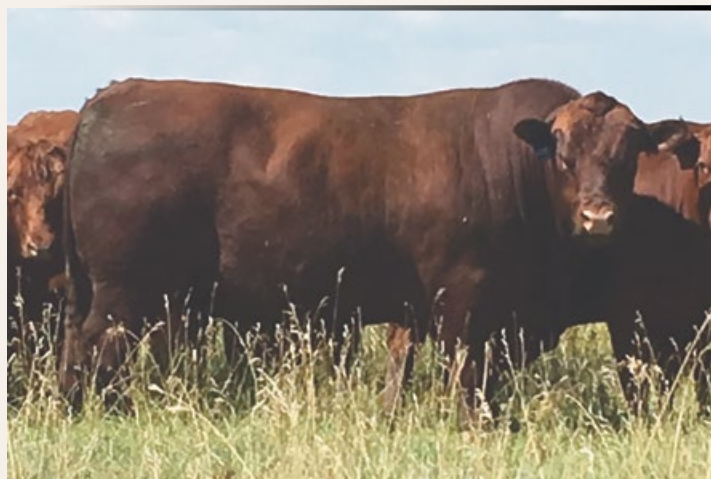
Red Flying K Boss 95C

Feature bull in spring of 2016 from Flying K and one of the high selling red angus bulls in 2016. Anyone who has seen Boss has appreciated his overall depth, muscle pattern, dark red colour, foot structure and herd bull presence. His sons have been extremely popular the past two bull sale seasons and stamps them in terms of quality and consistency. The daughters he has left behind are incredible in terms of body type, udder quality, and overall structure.