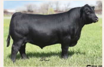
Service sire Musgrave Stunner