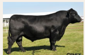
Service sire Sitz Logic

AI'd: April 18th to Sitz Logic Y46 Due: January 26th, 2020