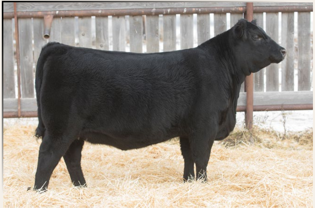
Heifer Calf NORTHERN VIEW ANGUS

Here is a powerful, deep sided, long quartered and big topped Beauty. Despite her power she possesses, she still displays solid femininity and angularity in her front end and head. The Duchess females have been very productive, as Duchess 84A has produced two females we have in our herd. They are doing very well as young cows here all possessing the qualities you want in an Angus cow-good temperament, great udder, sound structure and raise a super calf each year. We used Attractive for two years now. Attractive was selected for his strong phenotype, excellent shape and performance as well as a proven and consistent pedigree and EPD set. The first crop of calves are very eye appealing with solid structure and design. We are very excited for his second crop of calves hitting the ground in 2020. Duchess 96G was shown at the Manitoba Ag Ex where she was the Jr. Reserve Champion female. Duchess 96G is halter broke, responds nicely to the show cane. She would make an excellent junior/4H show project.