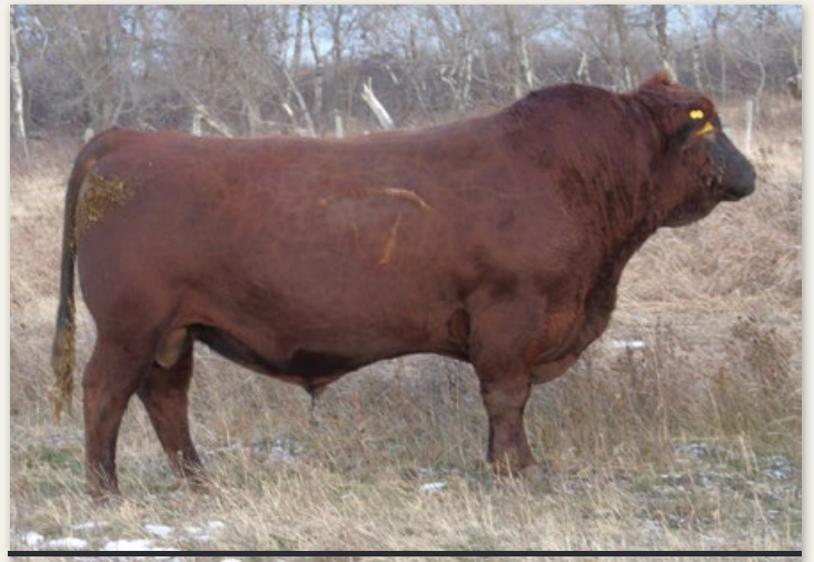
Service Sire of Lot 11

P.E to Next Step May 11, 2020. Preg checked Oct 9 to be 5 months along. Expect a Feb calf.