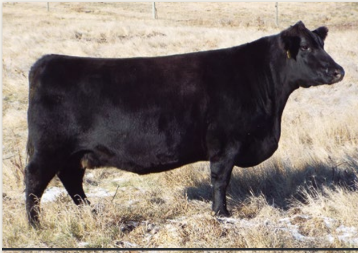
Dam of Lot 14