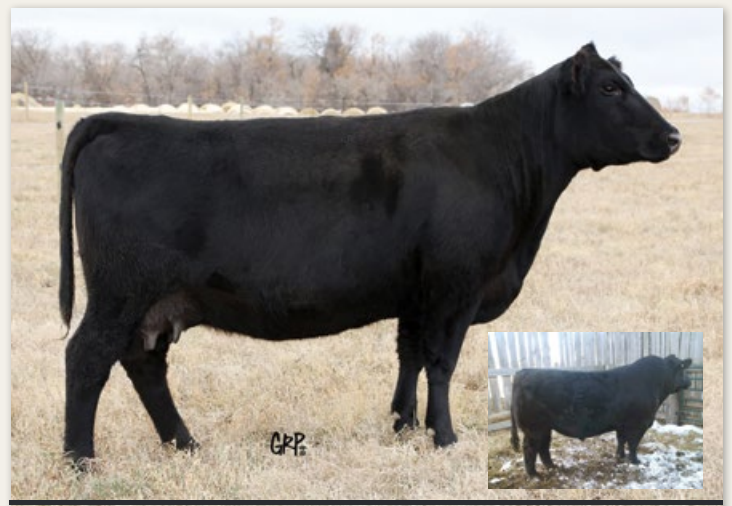
Lot 45 and Service Sire

P.E to Hamco Xcalibur 79F from May 12, 2020. Preg check Oct 9 to be 5 months along. Expect a Feb calf.