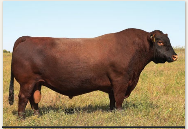
Red JLL Final Deal 78Z, Sire of Red Burdick Deal 16E

The Final Deal son that we chose to move on with after his sire was sold to the good folks at Twin Heritage. He is just quietly plugging along doing a good job. His females I believe will be his legacy in the future.