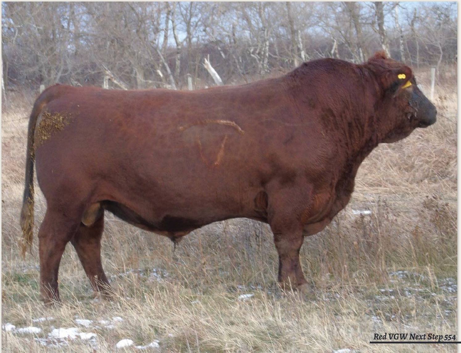
Red VGW Next Step 554