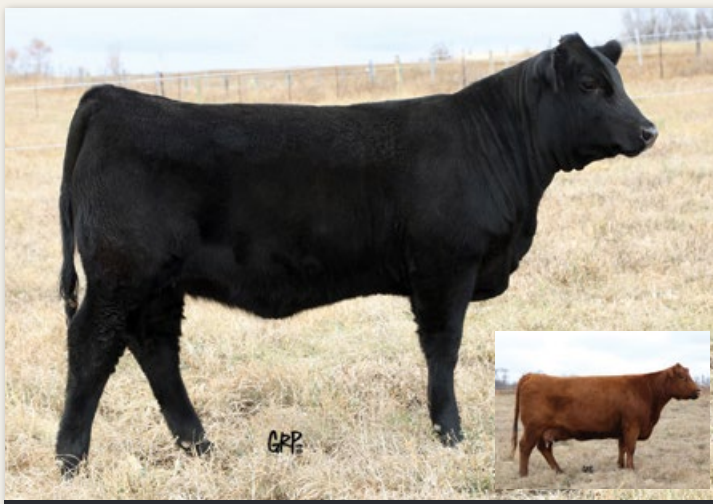
Lot 55 and Dam

I believe this will be one of the great ones for her new owner. Her dam is a beautiful female a real eye catcher that would have been very high up in the offering but unfortunately her preg check eliminated her from the offering. She is from the proven Tibbie cow family with a unique pedigree and many great females behind her not to mention the total outcross in Next Step with an incredible coat of hair.