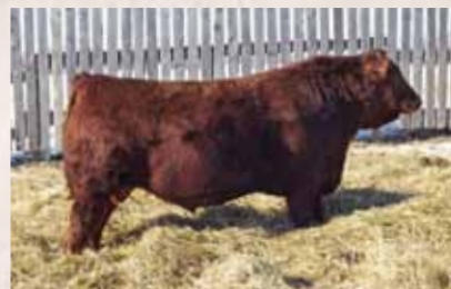
RED BRIDGEWAY RIDDLER 9D