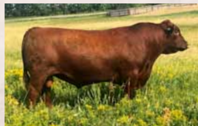
RED MAR MAC DEBUT 70D