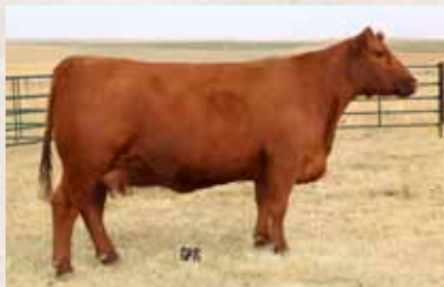
RED BRYLOR MRS YOUNG 99A