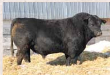
MAR MAC TIGER 170A