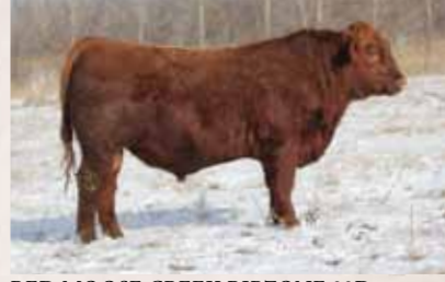
RED MOOSE CREEK RIPZONE 89D