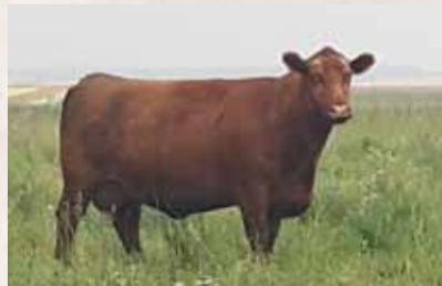
RED BRYLOR BONITA 65X