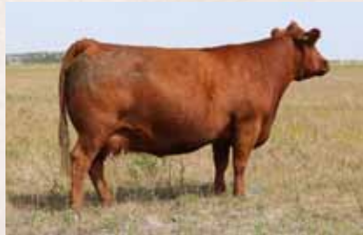
RED MAR MAC LADY TROOPER 114Z