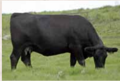
MAR MAC TIGER LILY 25Y