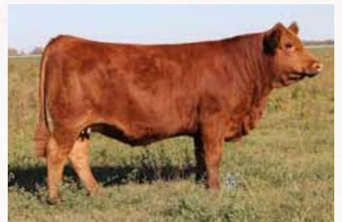
A HIGH SELLING FULL SISTER | 67D

Selling Choice on 39, 40 & 41 SELLING 2 OF THE 3 LOTS