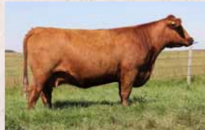
RED MAR MAC PRINCESS 14A