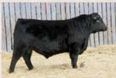
CORNERGLEN INSIGHT 50C