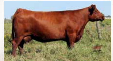
DAM | RUBY 10T

The Ruby cow family is another one of the foundation families. Ruby 10T has been a very functional, moderate framed female who never missed. 10T's daughters were right at the top at the 2015 New Generation Female sale selling to Blair's, Ag, Wraz Red Angus and Fraser Farms. Her daughter 24Y is a Ribeye female who is like her mother never misses. 24Y was Heifer Calf Champion the last time the National Angus show was in Brandon and progeny working at T Bar K, Guild Farms, Rooke Farms and 6E's half brother is an exciting March son of our Ripzone bull. A cow family you can build a herd of cows around.