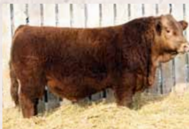
IPU MARKSMAN 54A