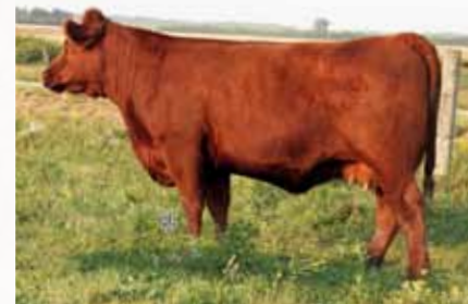
MATERNAL SISTER | BONITA 51B