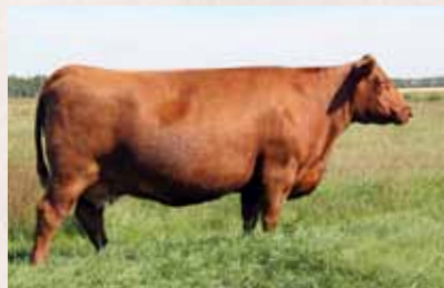
RED MCRAE'S SIERA 38U