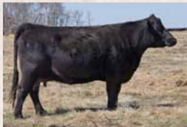
MCRAE'S BRIDGET 125T