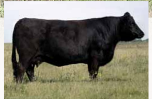
GRAND DAM | CARLI 14N

BRED A.I. MAY 7 TO HART'S STATES OF WAR - 1180101- (NO EXPOSURE)