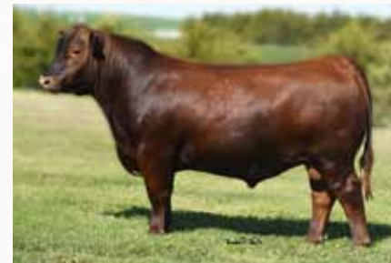
SERVICE SIRE | RED 9 MILE FRANCHISE