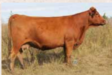
MAR MAC SOUTHERN GIRL 76Z