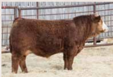
DOUBLE BAR D ROYAL 445D