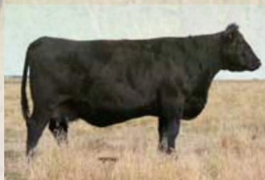
MCRAE'S BRIDGET 19F