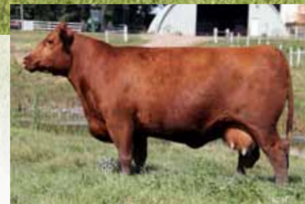
DAM | BONITA 65X

Mar Mac Farms would like to retain a future flush in 104E.