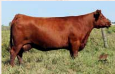
RED MCRAE'S RUBY 10T