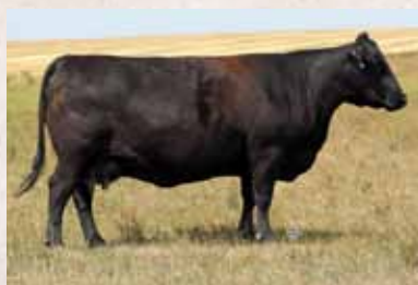
MAR MAC BRANDI 28Z