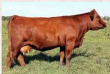
MAR MAC PATTY 106Y