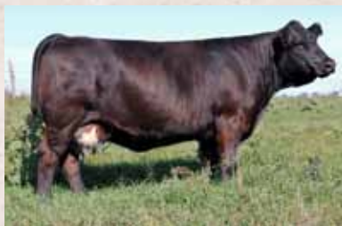
MAR MAC CARLI 28W