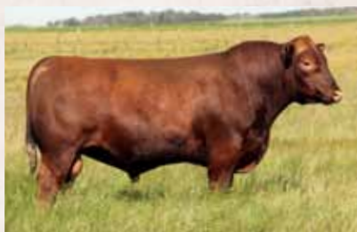
RED CHOPPER K CAPACITY 308B