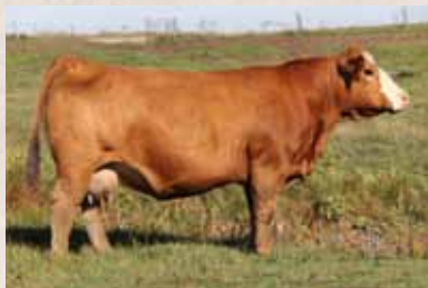
D BAR C DEB 881U