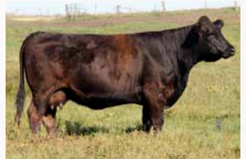
DAM | CARLI 86X