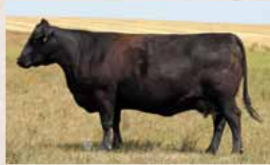
DAM | MAR MAC BRANDI 28Z

BW 2.8 | WW 45 | YW 77 | MILK 21 | TM 43