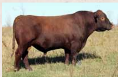
RED FLYING K NEPTUNE 28Z