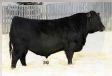
HF TOMAHAWK 229E