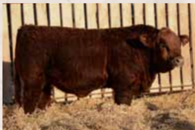
EGC EVEREST 145E