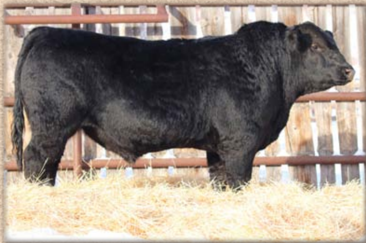
Lot 30 - FR HI DEFINITION 40H

Large capacity with a modest birthweight. Good leg structure and spring of rib. A very correct bull. His stylish dam has a well-made udder.