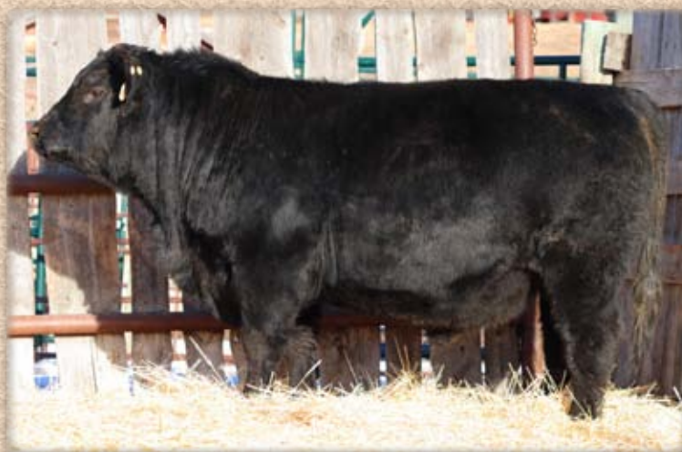
Lot 50 - FR CROSSFIRE 43H

Moderate framed bull with a big body. Good leg structure, nice temperament, and lots of depth.