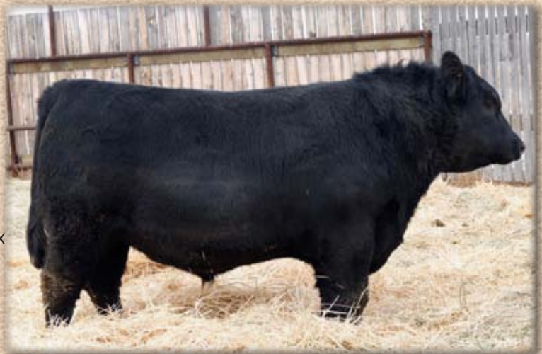
LOT 77 - BEAR CREEK WINDY 159H

Recommended for heifers. Here's a great windy son on offer. From an incredible young Jackson cow who stood right at the top of the replacement pen, this guy has a lot to offer. His grandmother is 138B, a purchased Crescent Creek cow that has performed very well for us, always bringing in a brute of a calf. If you're in the market for a top end heifer bull that you would use on heifers or cows, check this bull out.