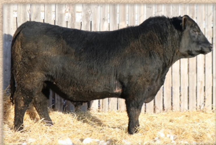
Lot 3 - JC CRAIG'S RESOURCE 39H