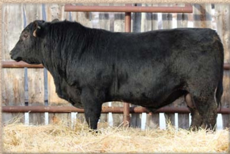
LOT 43 - FR MOMENTUM 41H

This prospect has a masculine look, quiet temperament, solid feet, long frame, and extra thickness across the hips. Dam has become a top producer.