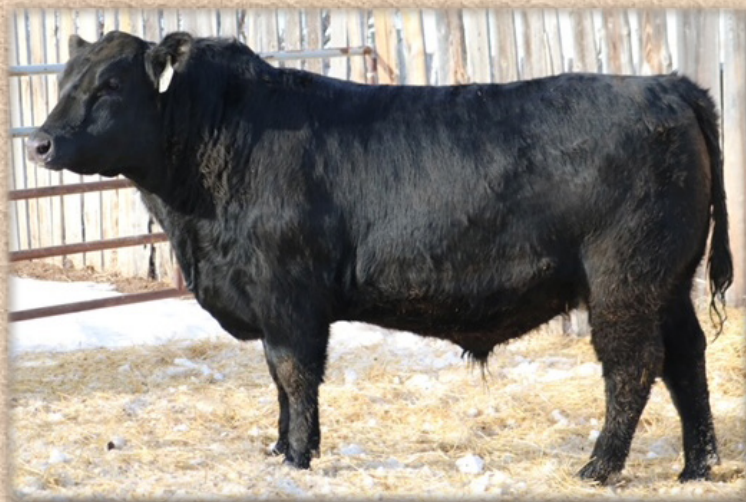
Lot 22 - JC CRAIG'S HOOVER DAM 17H