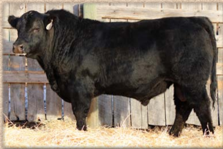
Lot 36 - FR MOMENTUM 17H

A long herd bull with a big hip, clean fronted with a smooth shoulder. His dam has been a fertile producer.