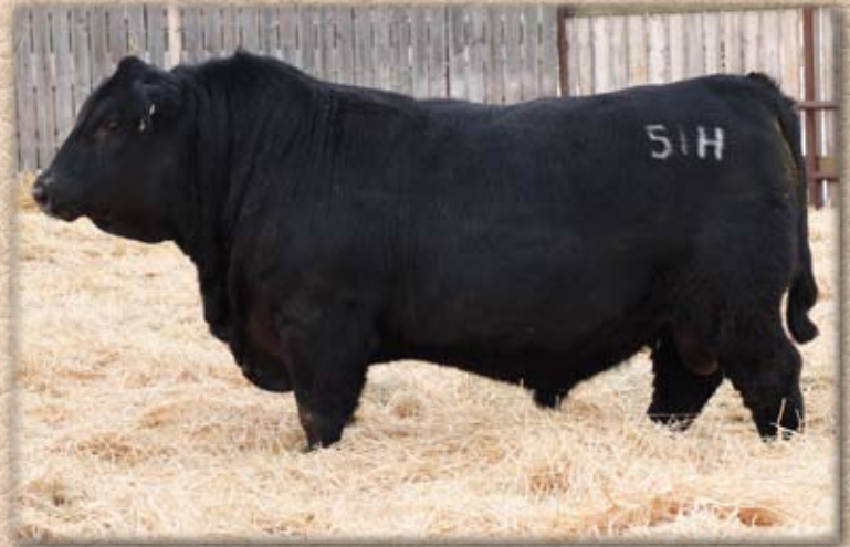
LOT 55 - BEAR CREEK JACKSON 51H

This is an impressive bull from any angle. You will appreciate his masculinity and thickness. His fleshing ability is second to none. His fleshing ability and muscle have stood out since he was a baby calf. I've always really liked this bull and he's only continued in his development.