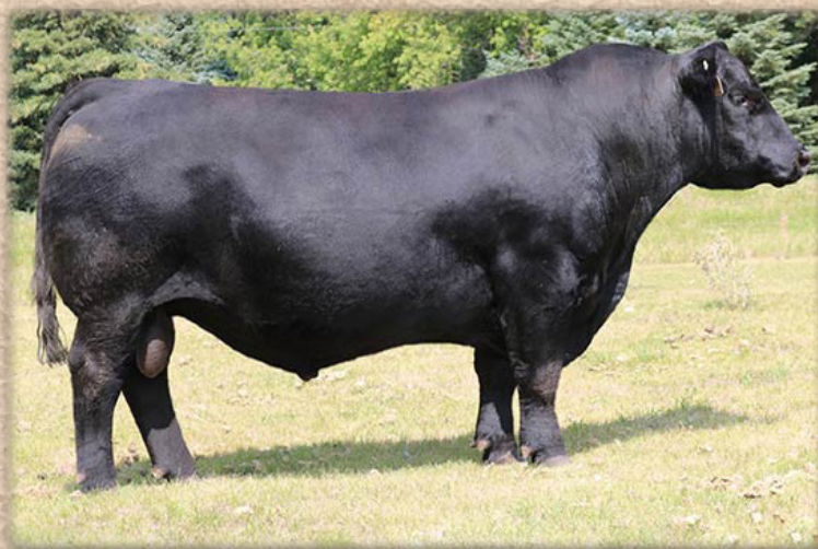
SIRE - MC CUMBER TRIBUTE 702

Recommended for Heifers. From the excellent Mc Cumber Tribute 702. This is an extremely tanky, deep-bodied calf with nice shoulders and clean fronted that should calve with ease. We A'd heifers to Tribute and they all calved extremely easy. Now with Tribute semen becoming very difficult to acquire and seeing the calves we have from him I wished we had more of it in the tank, so don't miss your chance to check this guy out.