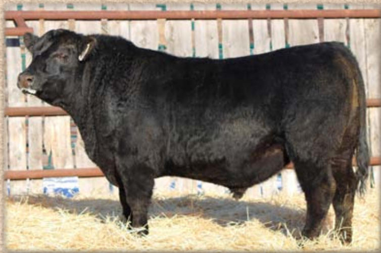
Lot 46 - FR MOMENTUM 62H

Moderate framed bull with a clean look. 23E consistently throws a lighter birthweight.