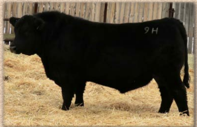
Lot 57 - BEAR CREEK JACKSON 9H

You will find this guy in the pen, he's hard to fault with tons of length, rib, and a huge top. He comes from a really nice Tour of Duty daughter whose calf froze last spring and was sold. Seeing how this bull turned out adds to the disappointment of having lost her. Don't miss the opportunity on this guy. He's an awesome bull that's really hard to fault.