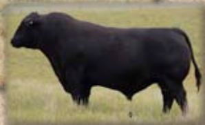
Lot 76- BEAR CREEK STONE 21H