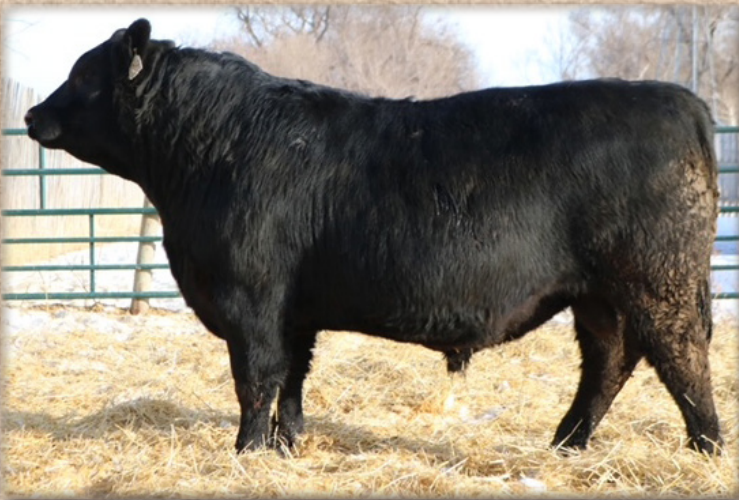
Lot 13 - JC CRAIG'S FORTITUDE 63H