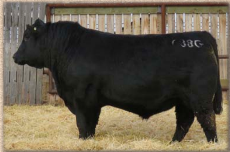
Full Brother to Lot 54 - BEAR CREEK JAKE 088G