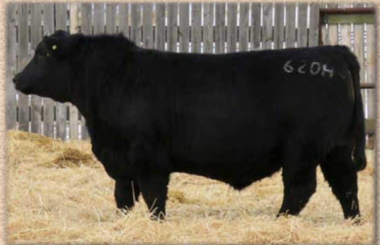
LOT 56 - BEAR CREEK JACKSON 620H

Here's another eye catching Jackson son. He really has the Jackson look with traditional angus style. There is a lot to like about this bull: wide, deep, and packed with muscle.