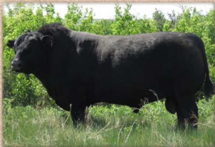
SIRE - MERIT STONEY CREEK 4023

We had high hopes when we purchased 'Stoney', and he exceeded all of them. His heifers are flat out amazing, the bull calves are the most consistent that we have raised. If you are looking for thick, hairy cattle to add spring of rib, and stick some meat on while doing it with moderate birth weights then Stoney sons are the bulls you need. It is amazing how these bulls weigh up with their thickness and length. They are angus cattle through and through and his last calf crop that we will be selling. So don't miss an opportunity on one, I know we will miss marketing son's from him.