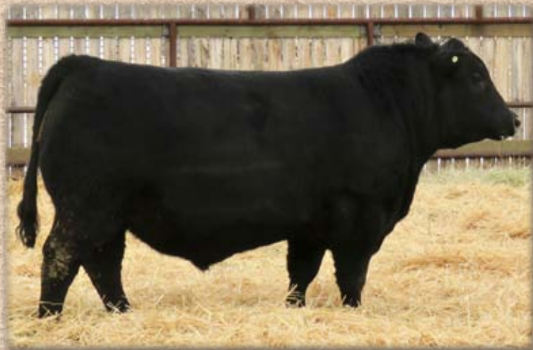
Lot 70 - BEAR CREEK JACK 34H

We retained this bull for our own use and we haven't been disappointed, his calves are phenomenal. He posted some the best weight gains we've had within our program, with even his EPD's reflecting that. He's a long, hard-muscled bull that travels like a cat with a great foot on him. I figured his bulls would check the boxes, but I think I like his daughters even more, they have an exceptional amount of feminine attractiveness to them. The first set will calve out this spring. 88F's bull calf crop averaged 3.5lbs per day of age, beating both Jackson and Stoney Creek's bull calf average daily gains of 3.2lbs per day of age. Also take note that every bull in the sale is from an 'E' cow, a first calver. We kept 6/7 bulls for the sale from him off young cows.