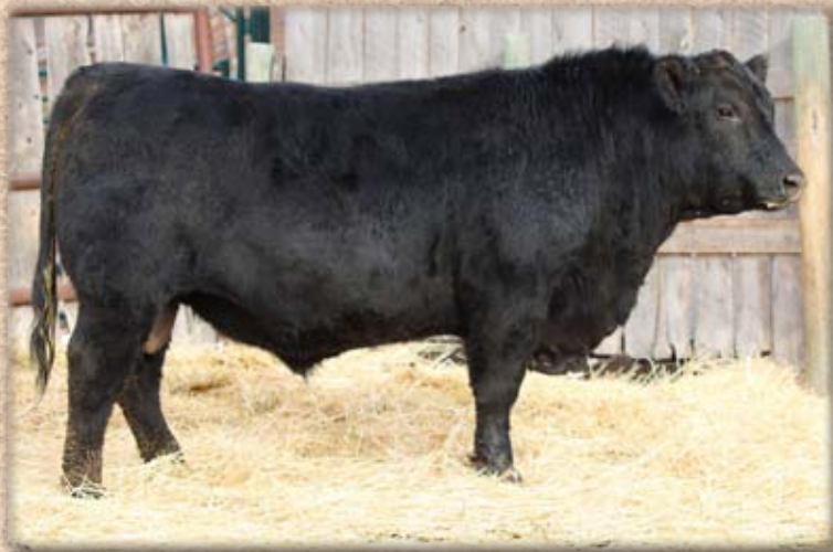
Lot 40 - FR MOMENTUM 30H

Lots of potential for any program in this bull. Good growth. A balanced bull from a solid producing cow.