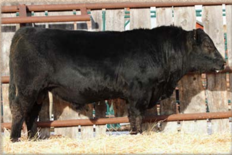
Lot 35 - FR MOMENTUM 16H

Solid bull here with a long full body and square hips. He is quiet to work with. Top end weaning weight and growth.