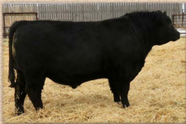
LOT 73 - BEAR CREEK JACK 36H

This is a nice complete bull with a herdsire presence. From an excellent Stoney mom from our 48Z cow who also has a bull in the sale. Not much to fault here, a proven package of hard-working, good-footed genetics.