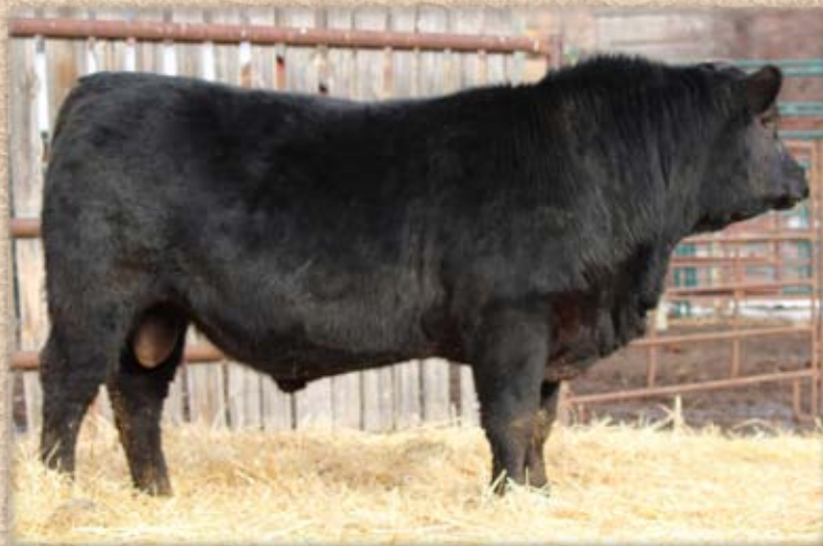
Lot 49 - FR CROSSFIRE 34H

I used Crossfire on my heifers looking for calving ease with a kick of performance. Results proved moderate birth weights and tremendous growth. They are tanks - thick topped, deep sided with muscle definition. His offspring are head turners.