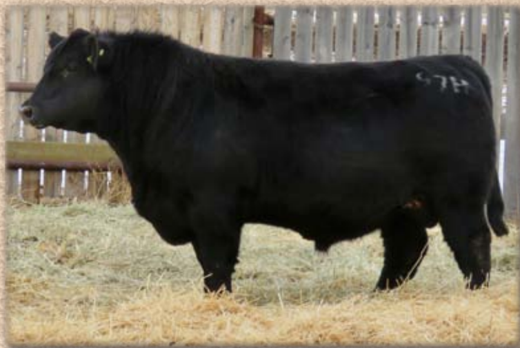
Lot 58 - BEAR CREEK JACKSON 97H