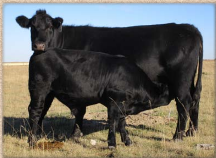
FR LEADING HEROINE 82A & FR HI DEFINITION 40H

Here is a standout bull. Square shoulders and hips. Big bone, solid feet, and beautiful muscle expression. Naturally gentle, easy to handle nature. 82A is a front pasture kind of cow.