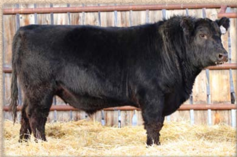
Lot 41 - FR MOMENTUM 32H

A very stylish bull from birth. The full package, with a classic Angus head, a moderate frame, and a deep flank.