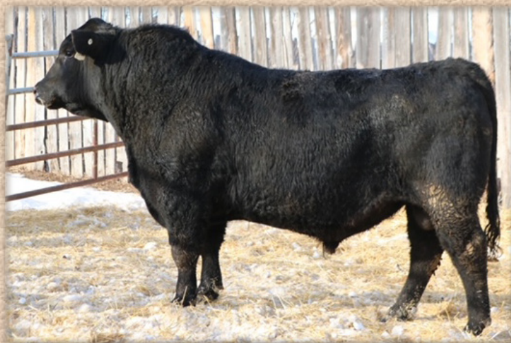
Lot 1 - JC CRAIG'S RESOURCE 5H