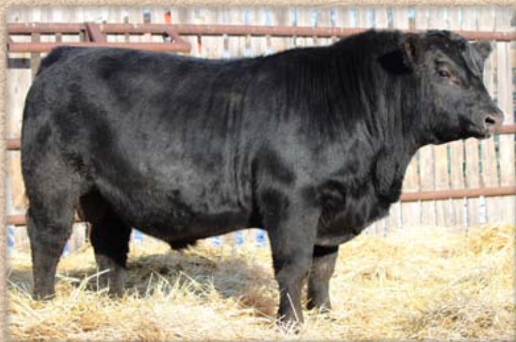
Lot 52 - FR CROSSFIRE 59H

Once again from this group a very quiet deep framed bull. His feminine moderate framed dam is proving to be a solid producer with his half-sister staying in the herd.