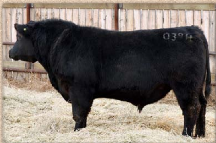
Lot 71 - BEAR CREEK

A lot of bull here. He has clean lines with a nice front-end, big hip, strong top, and lots of a middle.