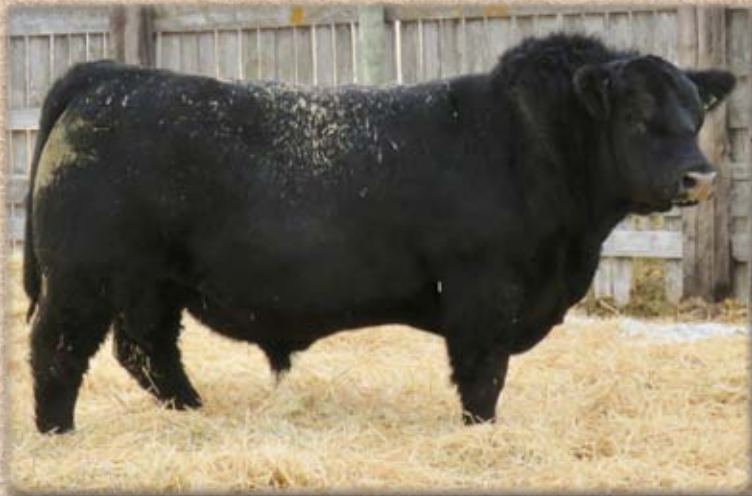
Lot 65 - BEAR CREEK STONEY 127H

It's a real toss-up who I like more, 127H or 79H. This bull exemplifies our breeding program. A Stoney son from an excellent Jackson daughter and a 26T grandmother, he has the three best bulls we ever walked stacked in his pedigree. If you're herd sire shopping, you need to check this guy out. He's a freight train of meat and muscle, has extra bone to him, excellent neck extension, and great hair. I'm not sure how to fault him, his rump sticks out over his hawks, he's stands as square as possible. I'd definitely use this guy if he wasn't related to most every cow we have.