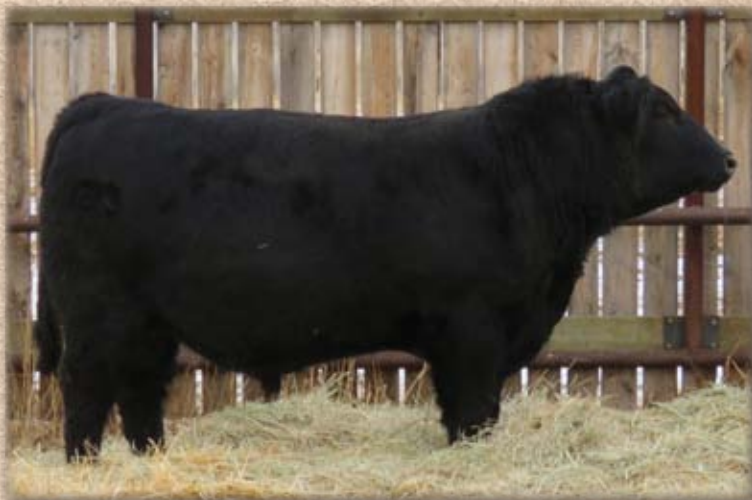
Lot 66 - BEAR CREEK STONEY 09H