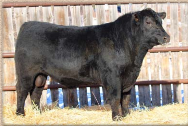
Lot 37 - FR MOMENTUM 21H

He is well put together with a smooth profile and big top. Dam is a quality Senorita 26Y daughter.