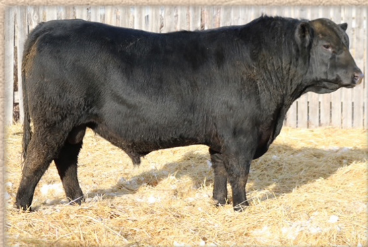
Lot 2 - JC CRAIG'S RESOURCE 34H