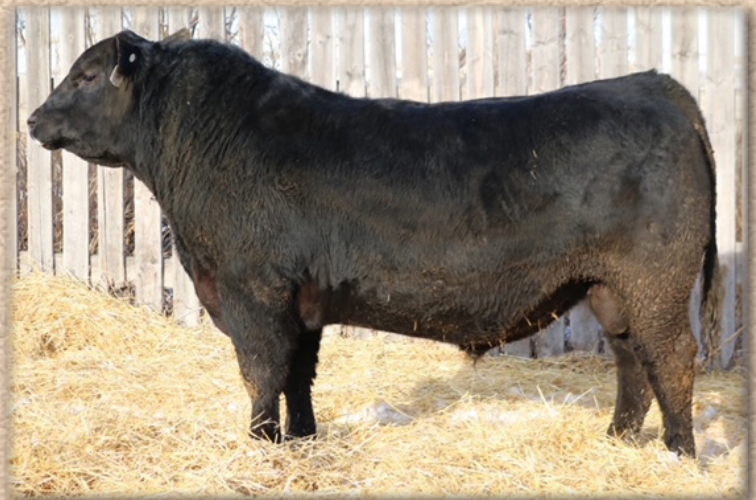
Lot 21 - JC CRAIG'S ELEMENT 71H