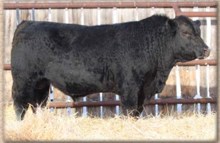
Lot 48 - FR MOMENTUM 70H

Another good Momentum son. Extra length and capacity to this guy. A great herd bull look.