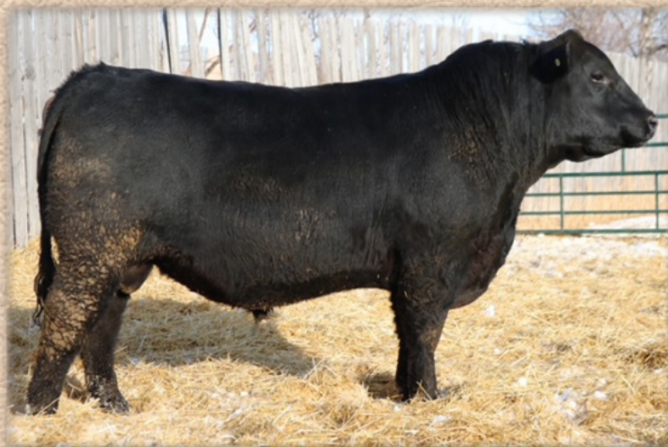
Lot 15 - SARAH'S 3H