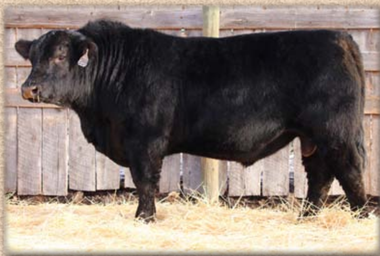
Lot 39 - FR MOMENTUM 28H