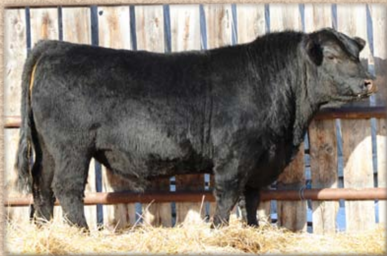
Lot 29 - FR HI DEFINITION 39H