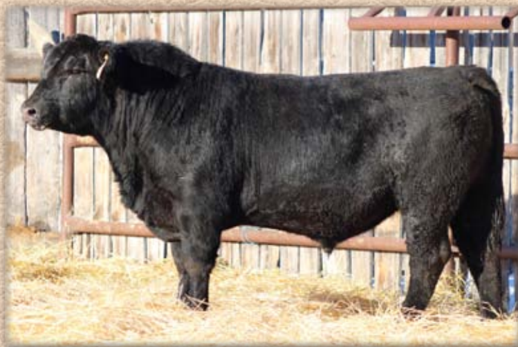
LOT 42 - FR - MOMENTUM 36H