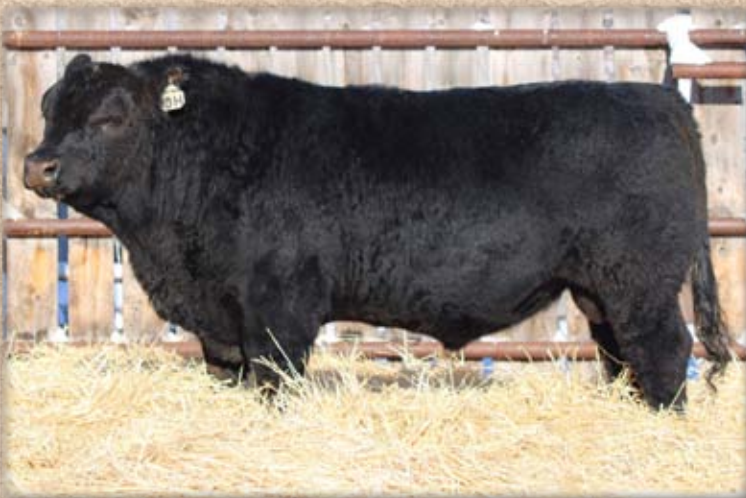
Lot 34 - FR MOMENTUM 10H