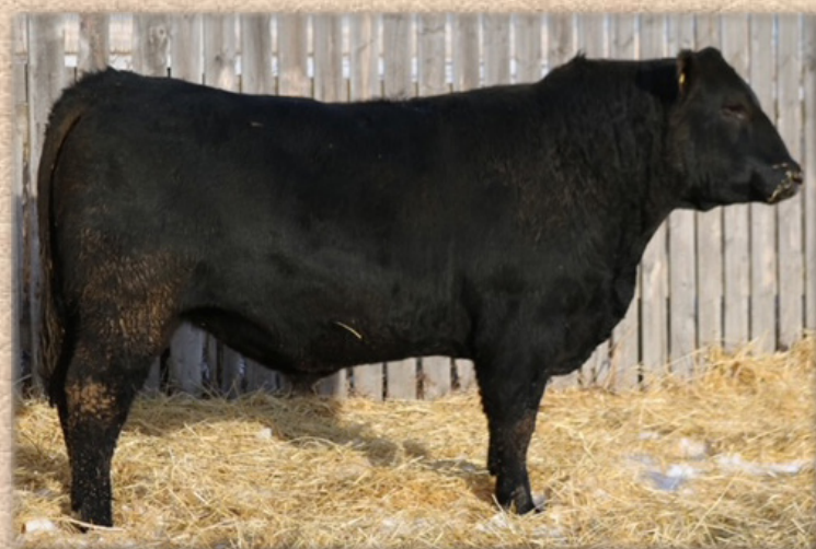
Lot 11 - JC CRAIG'S FORTITUDE 53H