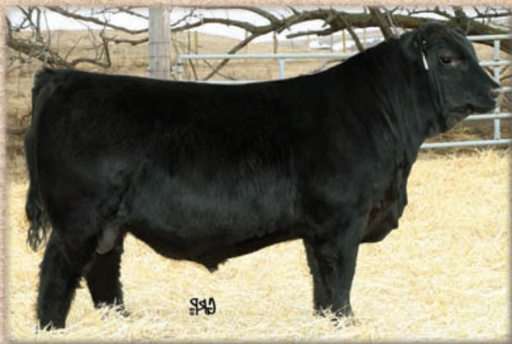
SIRE - SIX MILE CROSSFILE 376D