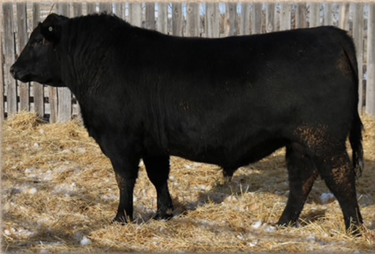
Lot 18 - JC CRAIG'S ELEMENT 35H