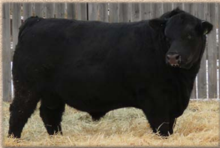
LOT 67 - BEAR CREEK STONY 605H

Here's a double up of Merit genetics, we purchased this 77X daughter from Trent and Janelle and she crossed well with Stoney.