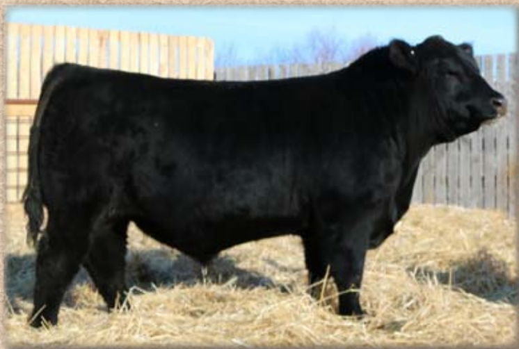
SIRE - CRESCENT CREEK MOMENTUM 10E