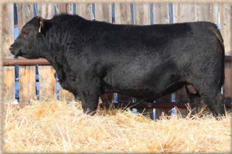
Lot 45 - FR MOMENTUM 49H