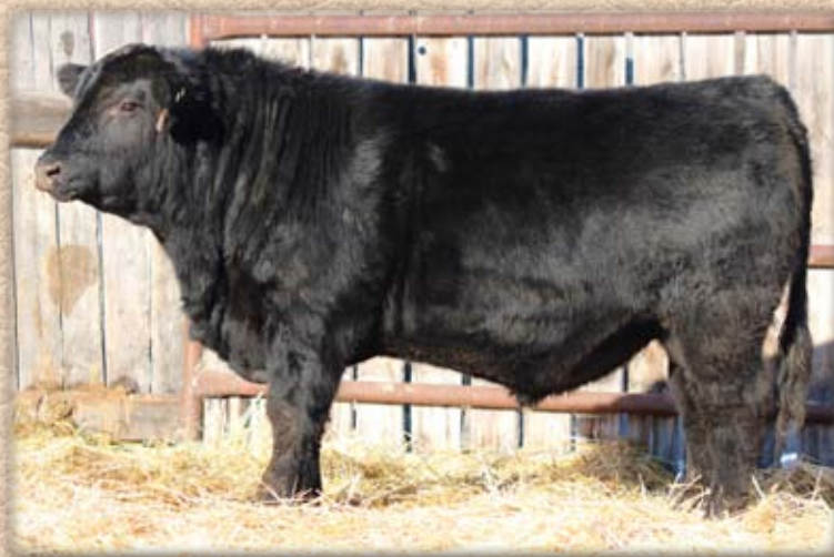
Lot 51 - FR CROSSFIRE 51H

This Crossfire bull demands your attention. Great hip and lots of depth to this guy. His dam is from the Senorita cow family I have been developing. Great traits with a pedigree of performance.