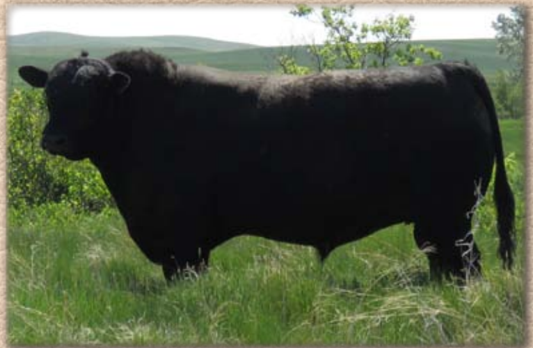
SIRE - EASTONDALE 61 WINDY 03'15

Windy is an impressive herd bull. He moves like a cat, is long, full of meat, and has successfully bred our heifers for years, but with too many daughters in the replacement pen, bumped him to cows last year. Windy did very well for us, always covering his field and remaining sound. There's a lot of good from his sons. We've retained a windy son to continue his excellent genetic profile within our own herd.