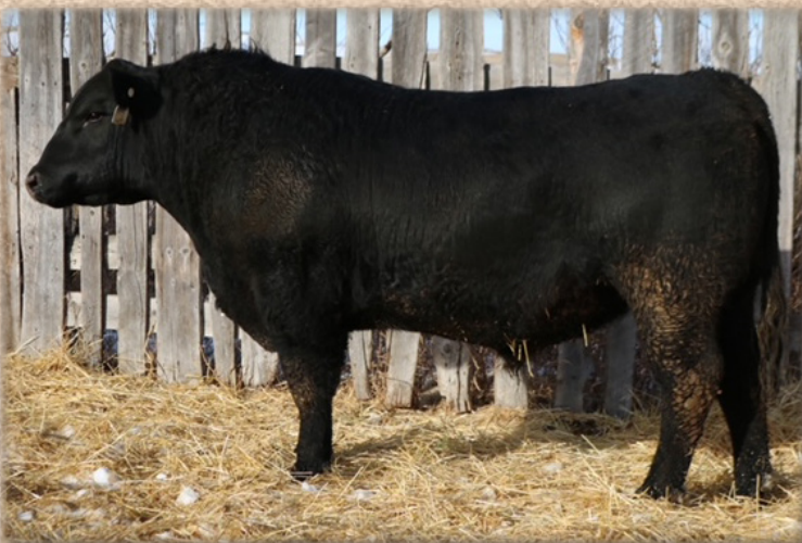
Lot 19 - JC CRAIG'S ELEMENT 37H