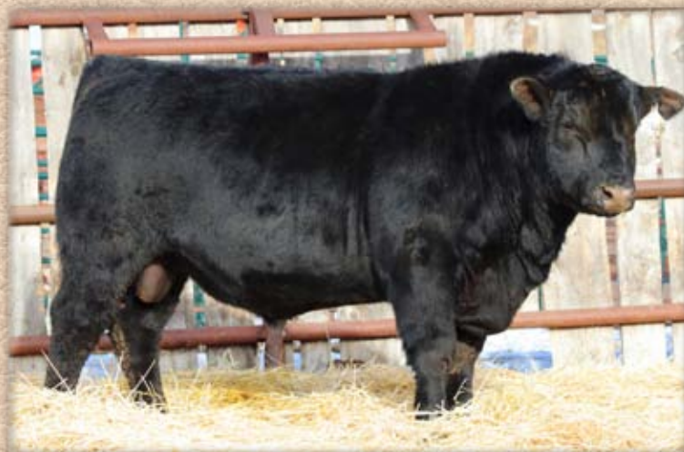
Lot 28 -FR HI DEFINITION 24H

Long spined and thick across the top with good temperament and a stylish look. Good growth throughout. His dam is a broody cow with abundant milk.