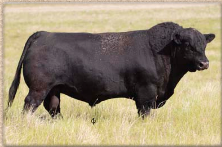
SIRE - EASTONDALE JACKSON 63'15

Jackson is impressive. Starting with large, good feet, legs with a little extra bone to them and natural thickness with a masculine angus head. His bulls are sure to please, they check all the boxes, but even more so do his heifers; they are incredibly consistent with a stamp to them. We've calved a couple crops of heifers and they're becoming some of our strongest cows. Aside from that, he's an outcross pedigree that does not sacrifice quality in any shape or form. Jackson is gone now from an injury, but we are using a son and will his impact on our herd for many years to come.