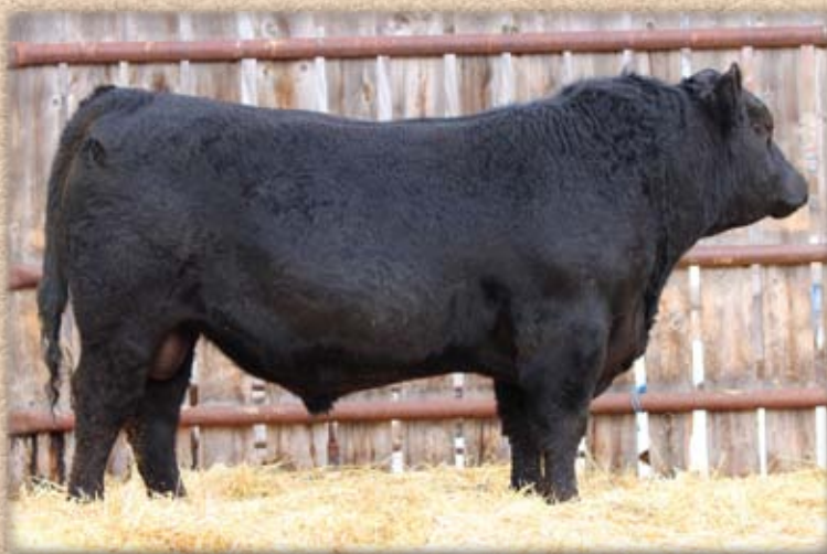
Lot 44 - FR MOMENTUM 46H

He will make friends sale day. A quiet bull with a nice working temperament, lots of hair, and a big body.