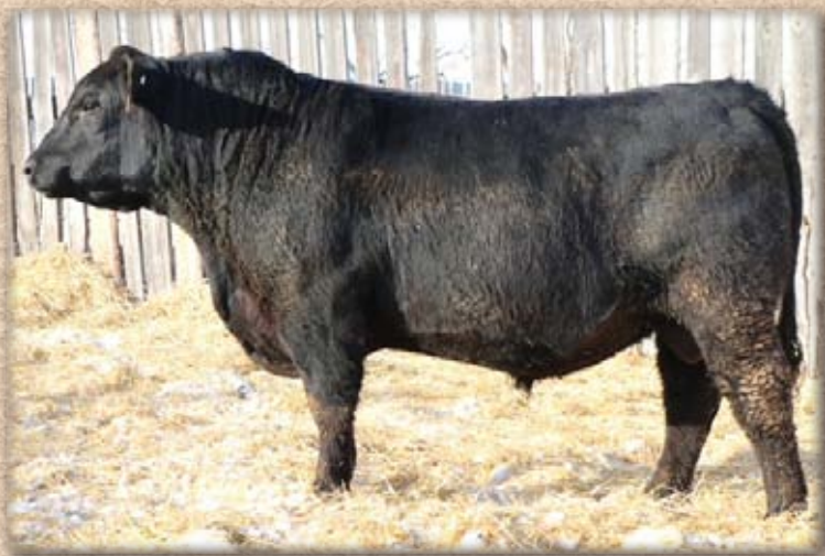
Lot 4 - JC CRAIG'S RESOURCE 60H