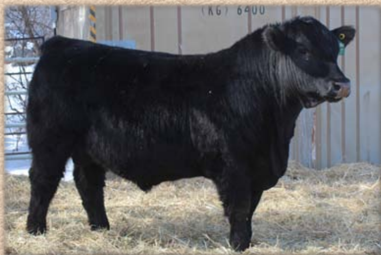
SIRE - YOUNG DALE HI DEF 119F

I was looking for increased performance when I purchased High Definition. With his weaning weight ratio of 98 and yearling weight ratio of 119, he brings plenty of performance! He carries his extra length and heavy boned frame on stout, correct legs and excellent feet. He also has great muscle expression and hair. His gentle nature makes him easy to handle. A standout herd sire, he passes on these exceptional traits to his offspring.