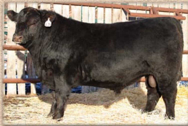
Lot 32 - FR HI DEFINITION 67H

Have a good look at 67H. Length, thickness, style, and growth. He is built very correct from the ground up. A workable temperament. His dam Senorita 26Y has been a real feature here for many years. Good footed, level uddered, and small teated. I retained two maternal half-brothers for my own commercial herd and debated about letting this one go. There are also 4 of her daughters in production on the ranch.