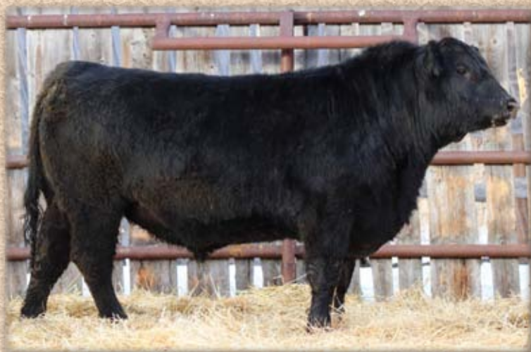
Lot 47 - FR MOMENTUM 68H

A smooth patterned bull. Nice temperament, good leg structure, and a solid foot. A very sound bull.