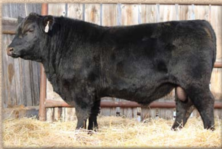
Lot 31 - FR HI DEFINITION 50H

Thick, chunky quarters on this guy. Full of red meat. Dam is a solid old cow that is still productive going into her 12th year.