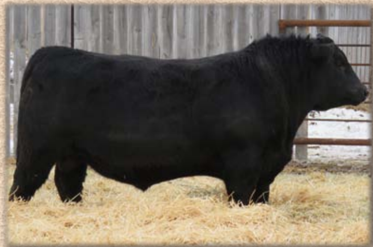
Lot 53 - BEAR CREEK BLACKJACK 79H

Definite herd sire here. His full brother was our high seller going to Lorenz Angus last year and he has another exceptional brother coming up next year. We thought so much of this bull we sorted twenty young cows into a field with him last year. We seriously considered keeping him but with a half brother working in herd we wouldn't be able to use him as much as we would like. He is from an excellent cow that's designated an elite cow by the Canadian Angus Association. This bull just offers so much consistency and excellency to any program.