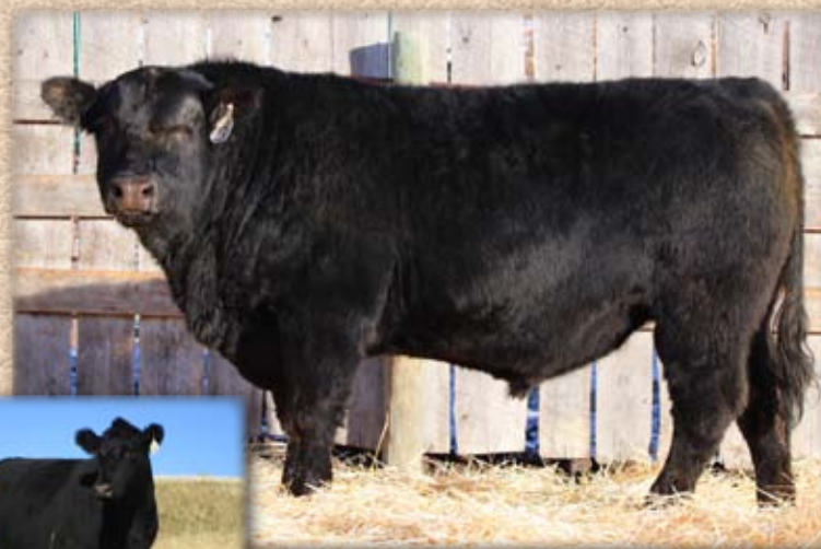
Lot 38 - FR MOMENTUM 23H

Thick framed, heavy boned, soggy. He stands up well on his heel and moves with herd bull presence.