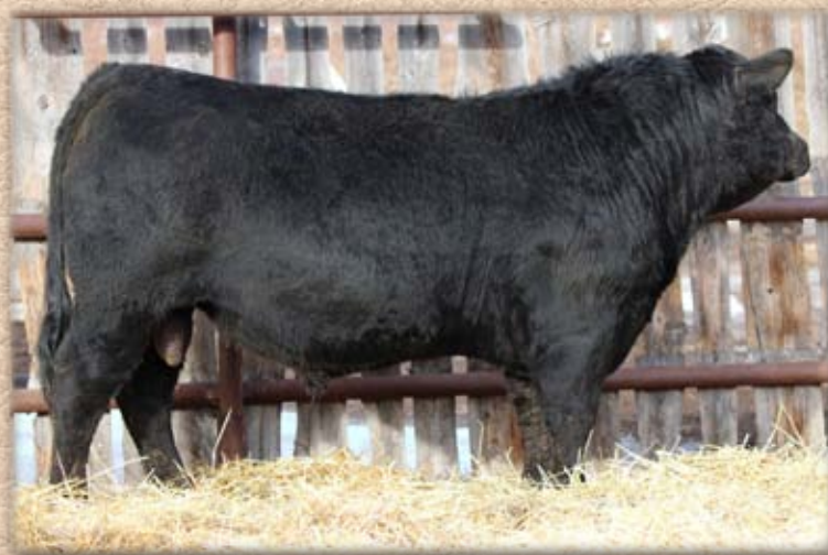
Lot 33 - FR HI DEFINITION 76H

He is a bull with lots of potential and great conformation. Good hip with a smooth shoulder.