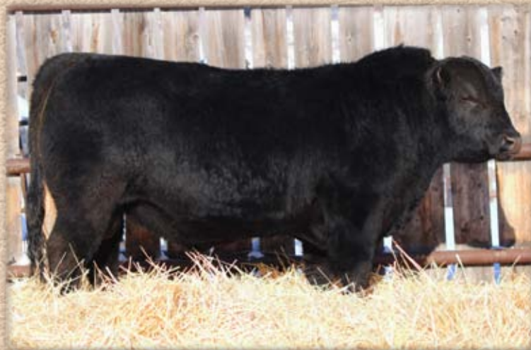
LOT 27 - FR HI DEFINITION 19H

A whole lot of bull here! Extra-long frame, heavy bone, and thick across the top. Quiet with a good heel and claw set to stand on. He is from an older cow that just keeps producing the good ones.