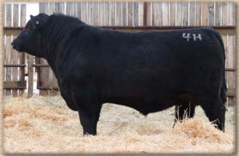
Lot 78 - BEAR CREEK WINDY 4H

Recommended for heifers. Another strong windy son, from an excellent uddered young cow. There is lots of calving ease in this bull.