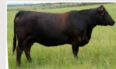
Dam - Blackcap CSP 19A

SITZ TRAVELER 8180 S A V EMULOUS 8145 CIRCLE A 216 LTD 9374 R R EDELLA PURSUIT 5827 RITO 707 OF IDEAL 3407 7075 BR POLLY 8077-472 RIVERCREST GRID MAKER 29P RIVERCREST BLACKCAP CSP 83R