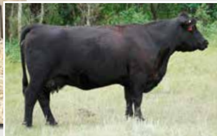
Dam - Blacklass 41A

Dam 41A (Elite Dam): 3 males Avg BW: 82 lbs WW Ratio: 112 3 females Avg BW: 76 lbs WW Ratio: 104