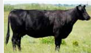
Dam - Daisy CSP 45A

An outstanding PayWeight son, an attractive clean fronted bull with plenty of thickness and performance. He has Herd bull status written all over him. Sept 25 Act WW: 810 lbs Dam 45A: 3 males Avg BW: 84 lbs WW Ratio: 104 3 females Avg BW: 83 lbs WW Ratio: 102