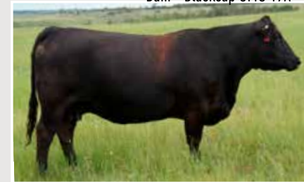
Dam - Blackcap CTTS 19A

This calf fell behind at the start as his mother got hurt in the spring and took all summer to recover. Despite all that he did pretty good for himself. His dam is one of our best. Sold maternal sons to Laidlaw Ranching and AJS Ranch. She is also the dam to our herd sire, Headliner 1D. Sept 25 Act WW: 710 lbs Dam 19A: 4 males Avg BW: 78 lbs WW Ratio: 98 1 female Avg BW: 74 lbs WW Ratio: 100