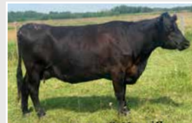
Grand Dam - Lady 11B