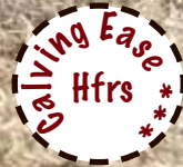
Dam - Caroline 37Y

A rock solid Lendary son that is structurally sound from the ground up. Calving ease bull that carries plenty of performance. We used a maternal brother to him last year and sold two maternal brothers in the past both to Deer Hill Ridge Angus Farm. Sept 25 Act WW: 815 lbs Dam 37Y: 5 males Avg BW: 80 lbs WW Ratio: 105 2 females Avg BW: 86 lbs WW Ratio: 94