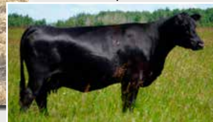
Elite Dam - Erica Kay CSP 5Z

Feature Herd Sire Prospect with thickness throughout. Thick butted, calving ease bull with top end performance. He has loads of style and a gentle disposition. Will work on heifers but has enough performance for cows. Sept 25 Act WW: 810 lbs Dam: 5Z (Elite Dam): 6 males Avg BW: 84 lbs WW Ratio: 106 1 female Avg BW: 61 lbs WW Ratio: 98