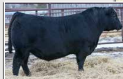
Reno as a Yearling

Brooking Renovation 9068 was the high seller of his sire group. He is a stout featured, wide backed, easy fleshing bull. We are getting his first calf crop this spring and they are everything we had hoped for so far.