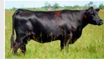
Dam - Duchess CSP 13A

Dam 13A: 4 males Avg BW: 79 lbs WW Ratio: 98 2 females Avg BW: 74 lbs WW Ratio: 91