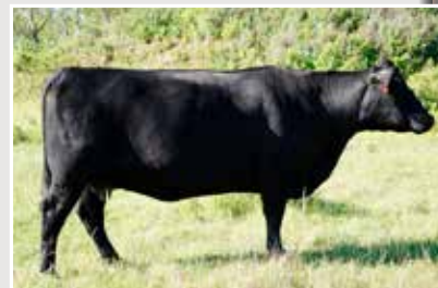
Dam - Anne 24C

Dam 24C: 3 males Avg BW: 80 lbs WW Ratio: 101