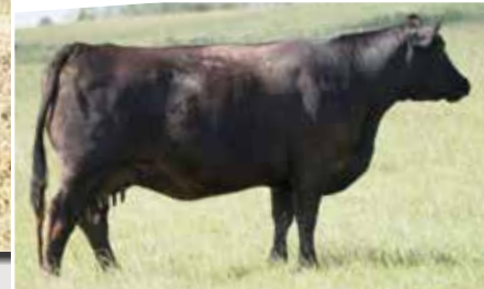
Dam - Anne CSP 75A

Feature Herd Sire Prospect that is structurally sound from the ground up. He demands your attention with his herd bull presence and gentle disposition. Full brother to the Lot 1 bull from 2019. Sept 25 Act WW: 890 lbs Dam: 75A 2 males Avg BW: 87 lbs WW Ratio: 102 3 females Avg BW: 77 lbs WW Ratio: 103