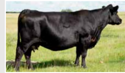
Dam - Blackcap CTTS 4X

Sept 25 Act WW: 965 lbs Dam 4X: 4 males Avg BW: 82 lbs WW Ratio: 107 3 females Avg BW: 75 lbs WW Ratio: 111