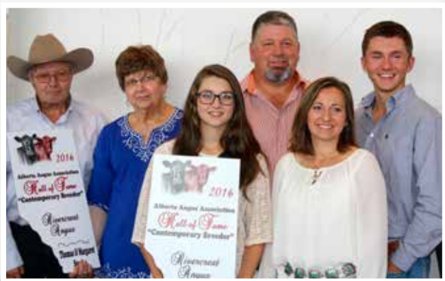
2016 Hall of Fame Contemporary Breeder Award