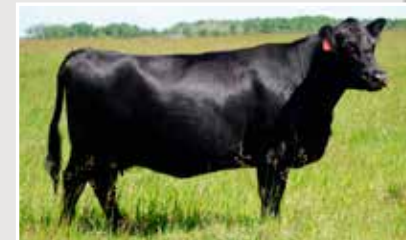
Dam - Tibbie CSP 34B

Dam 36B: 3 males Avg BW: 78 lbs WW Ratio: 98 1 female Avg BW: 66 lbs WW Ratio: 102