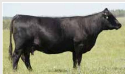
Grand Dam - Blossom CTTS 1Z

A super smooth, stylish calving ease bull that is stashed with maternal traits and performance. Sold a maternal brother to Bruce Armitage and Stacy Fuller. His mother is an Elite Dam. Sept 25 Act WW: 750 lbs