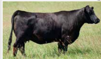
Dam - Princess CSP 66B

A calving ease bull that carries all the top end performance. His dam is quickly becoming one of our finest. Sold a maternal brother in 2019 to Riverside Angus for $9000 and last year a maternal brother went to Lazy HE Ranch. Can be used on hfrs but has enough performance for cows. Sept 25 Act WW: 800 lbs Dam 66B: 3 males Avg BW: 79 lbs WW Ratio: 104 2 females Avg BW: 89 lbs WW Ratio: 97