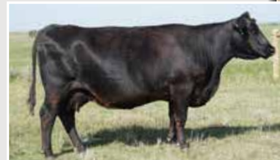
Grand Dam - Blossom 23X

Sleep all night calving ease bull. A complete, well balanced Ambush son with style and good maternal traits. He also has 2 generations of Elite dams in his pedigree.