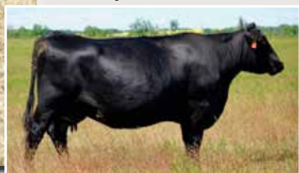
Dam - Georgina CSP 27Y

Dam 27Y: 6 males Avg BW: 78 lbs WW Ratio: 100 3 females Avg BW: 67 lbs WW Ratio: 94