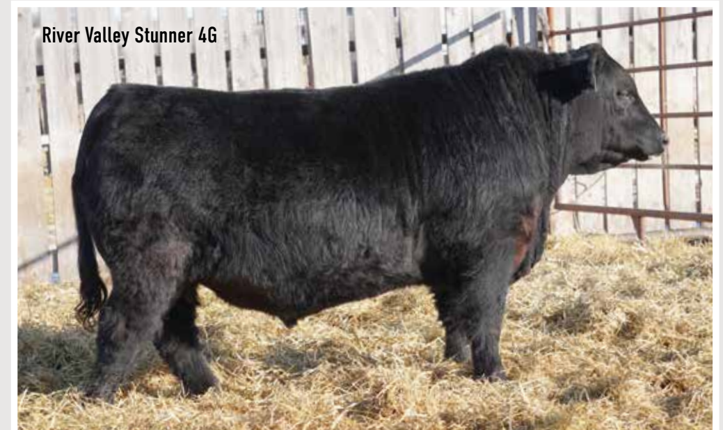
River Valley Stunner 4G

Hooch's maternal brother, River Valley Stunner 4G, was our high seller last year selling to Hamilton Farms.