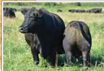
Frieso 1116Y Prairie 9050: Dam

• Full throttle is one amazing herdsire prospect. His sire HF Stature has stamped his first calves with calving ease, eye appeal, and performance. Alta Genetics has leased the International semen rights on Stature. His dam the first Angus cow we bought is a poster cow for Manitoba Angus. This bull will impress you.