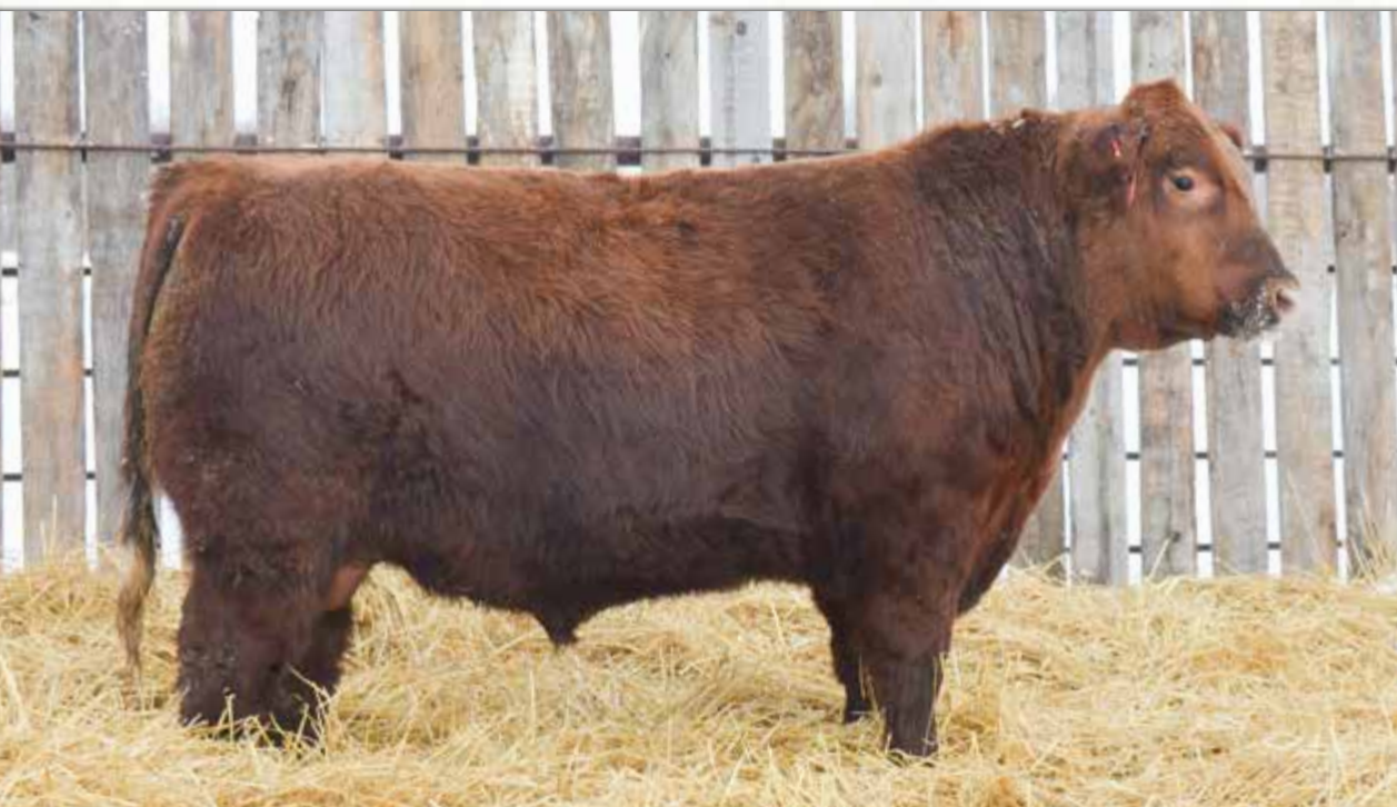
ARY 812F 2022325 January 18, 2018 BW: 70 lbs. ADJ WW: 729 lbs. ADJ YW: 1,309 lbs.

CONNELLY ONWARD SITZ HENRIETTA PRIDE 81M MVF PERFECT BLEND 32H BROOKMORE PRINCESS 104H