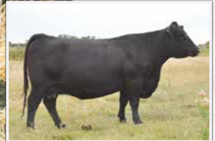
ARY Blackbird 8B: Dam

•Full House has all the right cards - performance, structure, balance, and eye appeal. His dam is a model female weaning about 60% of her body weight.