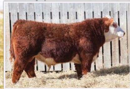
Blair's 208Z Titlest ET 13C: Sire

• A "Titlest" son that is stylish and pleasing on the eye. He is deep made and stout enough to maintain a perfect balance while on the profile. He will stand out on sale day, and he's red eyed to boot. • Top 5% Fat, MPI, 10% MM, TM, MCE, FMI, 15% REA, 20% YW, and 25% WW, PWG • Heifer Approved