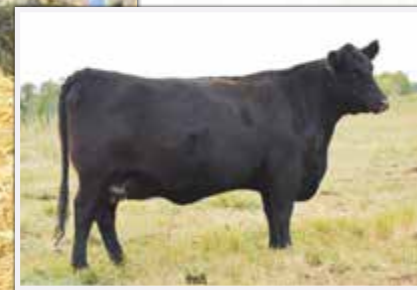
ARY Lass Trader 606D: Dam

MOGCK SURE SHOT MOGCK MARY 1255 XO CROWFOOT JOKER 8814U CROWFOOT LASS TRADER 6016S