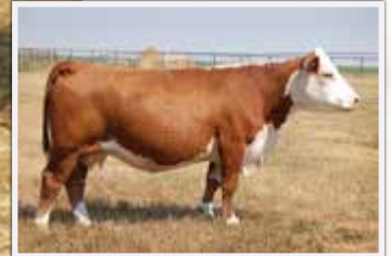
Xkeona 1A: Maternal Grand Dam

Polled Male RSK 51F PC03049893 February 17, 2018 BW: 90 lbs. ACT WW: 912 lbs. Feb. 5 WT: 1225 lbs.