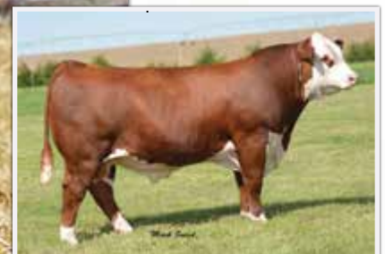
R Leader 6964: Sire

•Top 1% Fat, 5% WW, YW, FMI, 10% TM, MPI, PWG, and 15% SC •Heifer Approved