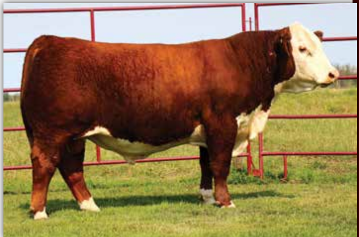
HARVIE COOL WATER ET 190B