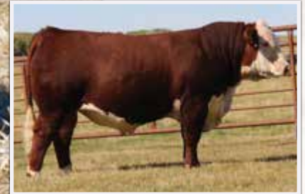
KJ BJ 719Z Truman 695D: Sire

•Top 5% WW, YW, and 25% SC, REA •Owned with: Martin Chobotar, MB