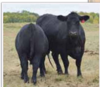
Georgia 260D and 803F

ARY 803F 2022318 January 12, 2018 BW: 80 lbs. ADJ WW: 862 lbs. ADJ YW: 1,485 lbs.