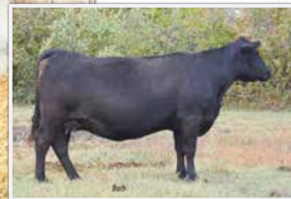
ARY Mayflower 516C: Dam

•Powerbull here, a powerful son of Six Mile Black Hawk Down. Here is a cow bull that will add tons of performance and maternal power. Freedom walks free and proud.