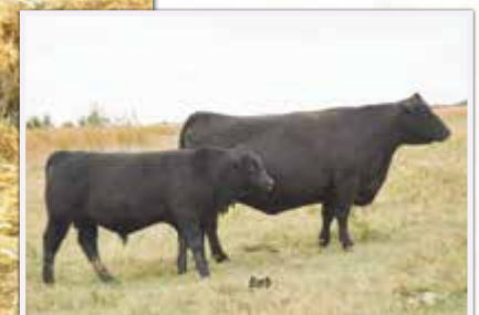
Brookmore Daisy 79Z: Dam

•WHEN YOU WANT TO HIT THE FINISH LINE FIRST! Finish line is a top prospect calving ease bull. His dam is one of our favorite Brookmore females, she was the high seller out of an Atlasta sale, and she is now an Elite/Premier dam. We believe Finish Line will be a bull to produce great females without giving up any performance. •Heifer bull