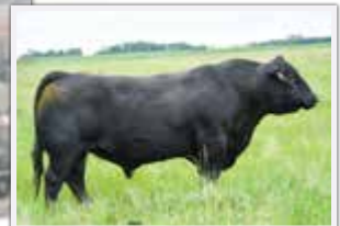
HF Stature 87D: Sire