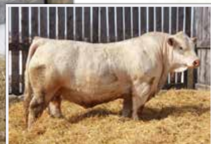
MCL Sparrow Moty 411C: Sire

•This guy comes out of the hard working 70X cow family, she is a hard worker every year. You can get a deal on this guy, going to be the buy of the sale.