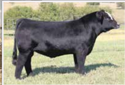
Mr CCF Vision: Sire

• Easy doing type, in a stout package. This guy was a stud in the spring and continues to be top of the pen. He did not freeze his tail he got it stepped on in the recip pen. HOLY was I mad that day.