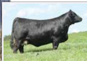
LFE Violet: Dam

•Power, Power, belly dragging, soft muscled Westcott son here. Talk about a bull that has a story written about him already, with the history of his dam and sire in the Simmental breed. If you want to add pounds, this is the bull for YOU!