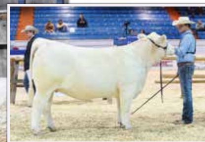
MCL PLD Starpower 12C: Dam

• If you're looking for a calving ease white bull or just thinking about trying Charolais this is the bull. Smooth made in a lower birth weight package. Don't forget boys and girls, Charolais calves don't need a tag like the Angus calves.