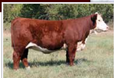
RSK 29W Miss Sage 26D: Dam