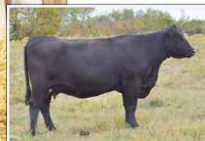
Eastondale Betsy 143'15: Dam

•Flavour is a top herdsire prospect by Whitlock. We used Whitlock on our heifers, he is a sire that builds in calving ease and performance. We purchased his dam from Eastondale Angus as the high selling heifer calf out of the Touch of Class sale. •Heifer bull