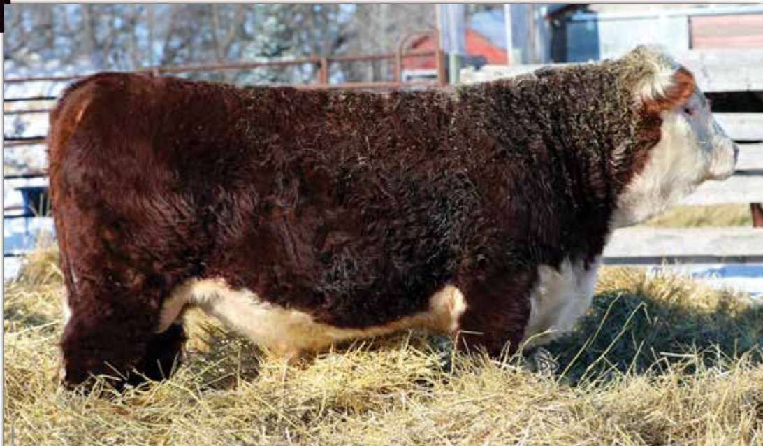
Polled Male RSF 4F PC03046802 January 17, 2018 BW: 75 lbs. ACT WW: 800 lbs.

Box 1358 Portage La Prairie, Manitoba R1N 3N9 Phone: (204) 871-3559 rsf@signaldirect.ca