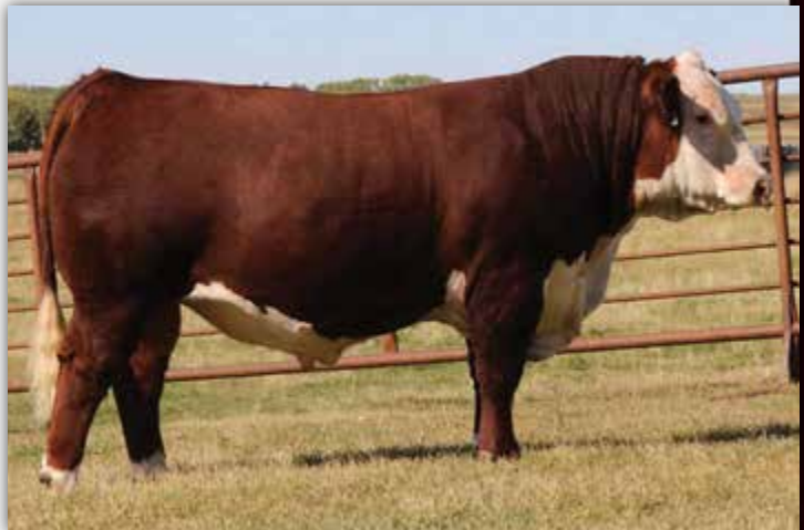
KJ BJ 719Z TRUMAN 695D