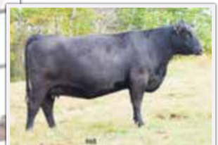
ARY Maxie 610D: Dam

ARY 827F 2022339 January 28, 2018 BW: 66 lbs. ADJ WW: 758 lbs. ADJ YW: 1,367 lbs.