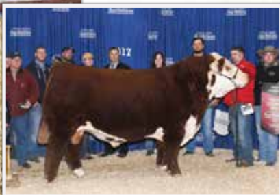
RSK E 2046 Digby ET 20C: Sire