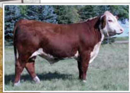
Harvie AD Harlen ET 199B: Sire

TH 122 71I VICTOR 719T DLF IEF HYF RSK 15T MISS SUGAR CANE 17X DLF IEF HYF HARVIE TAILOR MADE ET 7W DLF IEF HYF RSK 4L SAGE 23S DLF IEF HYF