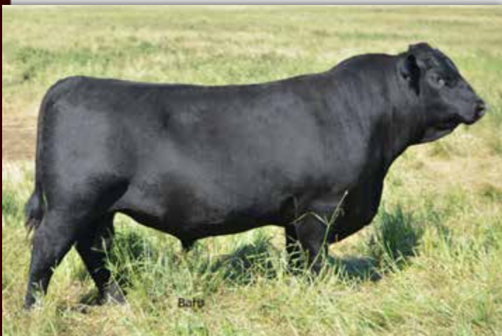
S7R SUPER DUTY 23C