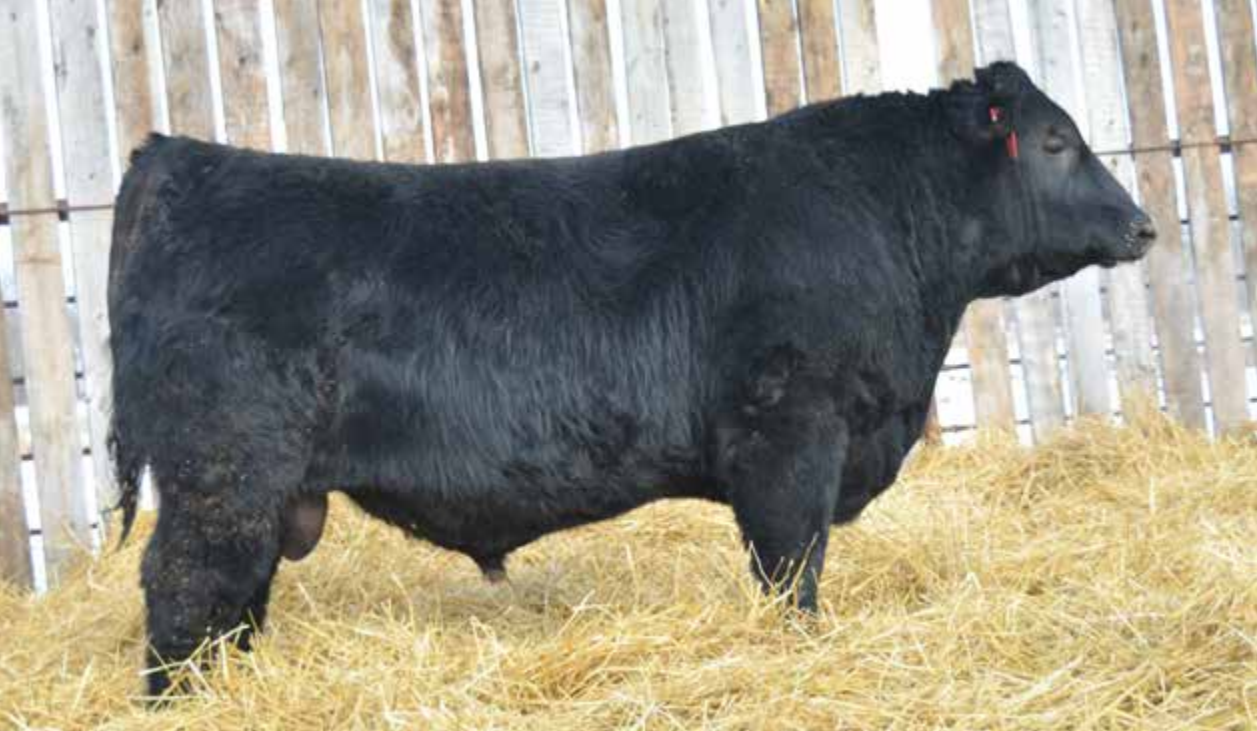
ARY 810F 2022326 January 18, 2018 BW: 82 lbs. ADJ WW: 800 lbs. ADJ YW: 1,490 lbs.

•Look at the great set of EPD's on First Rate - top calving ease, growth, and maternal. Here is a bull that you can use on your heifers and cows, his dam always adds performance to her progeny as I believe he will to his. •Heifer bull