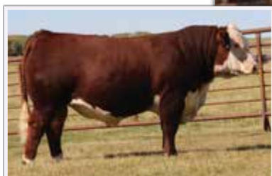
KJ BJ 719Z Truman 695D: Sire