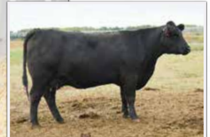
ARY Countess 609D: Dam

•Freeway is a powerful Bank Note son out of a first calf heifer. Freeway will sire calves with a moderate frame and natural thickness. His dam is a powerful daughter of SAV Ten Speed.