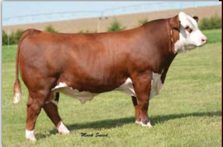
R LEADER 6964