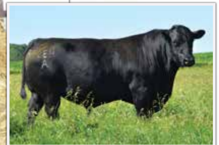
Lazy E Excitement 439A: Sire

TJF AMBUSH 20X TJF MS FREEDOM 35U DOUBLE AA OLD POST BANDOLIER MCRAE'S BRANDI 46S KOF 46S