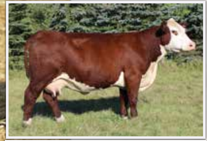
RSK 4L Sage 23S: Dam & Donor

•A member of our 2018 show string, I loves the shape and pattern that this bull exhibited. When you start to analyse him, you can really see how he puts it all together and a very usable package. Combine the cherry red color and pigment with his genetic package and his potential breeding value is a game changer. •Top 15% Fat