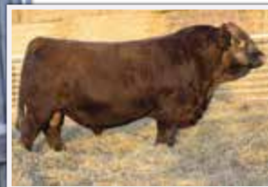
WFL Westcott 24C: Sire