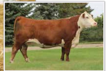
Miss Tamara ET 28Z: Dam and Donor

•Top 1% Fat, 10% WW, YW, MPI, and 15% FMI, PWG •Heifer Approved