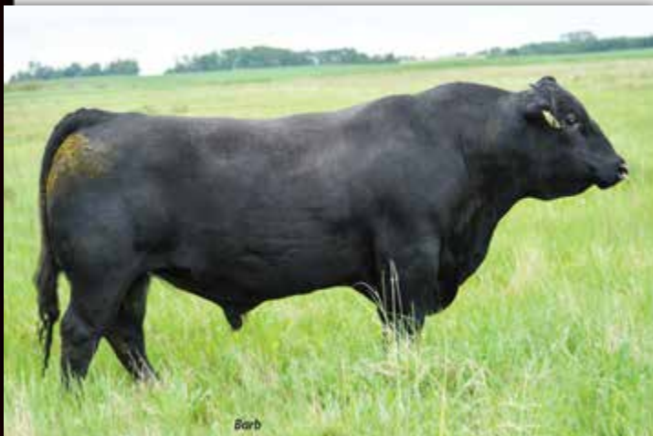
HF STATURE 87D