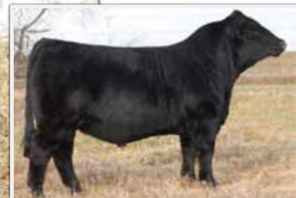
CCLT Alliance 91C: Dam

• Length of spine, in a sleek package. I had a full sister to this guy that would make any cattle man go crazy.