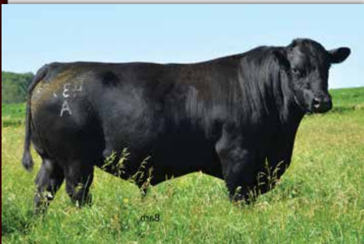
LAZY E EXCITEMENT 439A