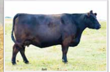
Brookmore Karama 70Y: Dam

•Herdbull! Look at this complete individual. What a great pedigree; a Basin Payweight out of a Bismarck daughter of the great 24M cow from Brookmore. His dam was one of our private treaty picks right off the top of the Brookmore herd. Look at his great set of EPD's.