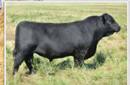
S7R Super Duty 23C: Sire

• Fact is sired by our herdsire Super Duty who was the high seller from Section 7 and out of the high selling cow from the Gerlei Dispersal. This bull will sire calves that will perform.