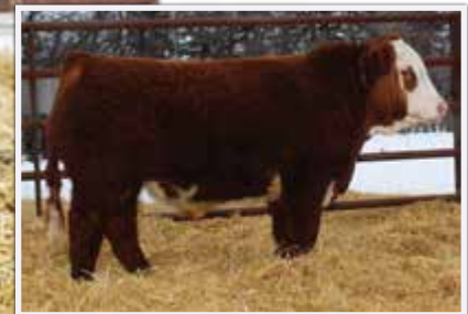
Can-Am 75C: Sire & High Seller 2016