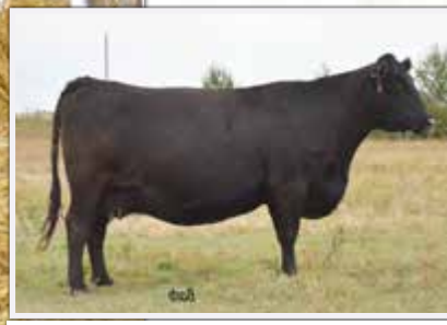
ARY Maxie 506C: Dam

•Foundation is an excellent performance son of HF Hot Lotto, his dam is one of our top Rage daughters, and his maternal grand dam is an elite/premier dam. Foundation will provide calving ease, strong maternal traits and performance. •Heifer bull