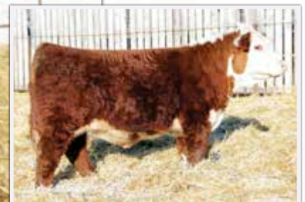
RSK 14E: Maternal Brother

HARVIE TAILOR MADE ET 7W DLF IEF HYF RSK 4L SUNSHINE 25S DLF IEF HYF MEADOW-ACRES CONNECTED 13K 86R DWT MISS RASBERRY 17R