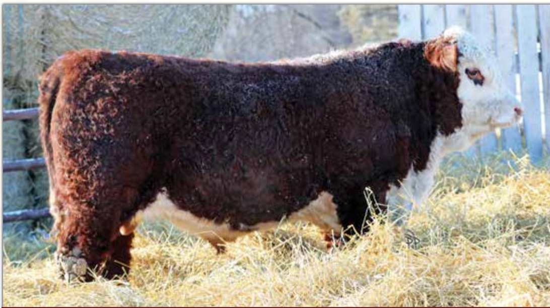
Polled Male RSF 10F PC03045884 February 16, 2018 BW: 95 lbs. ACT WW: 860 lbs.

Frontier 10F is out of RSK 199B Miss Tamara 56D who we bought in the Elite Genetics fall sale as a bred heifer and she did not disappoint. With a birth weight of 95 lbs unassisted and a September 1st wean weight of 860 lbs! Very impressive for a first calver considering the dry conditions we had last summer. Frontier is sired by none other than the popular Truman 695D bull. Frontier will add pounds and length to your calves. His daughters will be great milkers as his dam was my heaviest milking 2 yr old. We considered retaining this bull for our own herd but after some discussion we made the tough choice to offer him for sale.