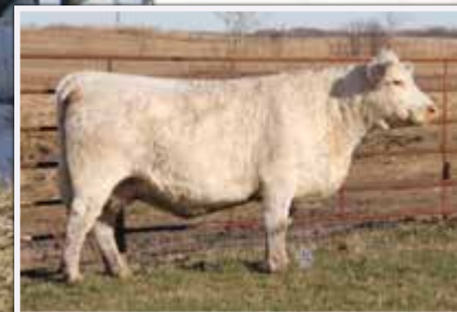
Winn Mans Robyn 839U: Dam

• I had a male and female last spring to this mating and the best heifer in my pen is his full sibling. She was second in class at Agribition. This guy is deep sided, deep quartered and would be a bull that would do well siring tan/silver calves.