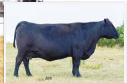
Brookmore Aleta 73Y: Dam

•Boy does his name suit him; those that have seen him have loved him. His dam is a former provincial gold show champion female. His sire has produced solid performance and consistency.