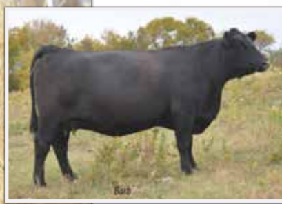
ARY Sapphire 628D: Dam

•Fortune is a heifer bull deluxe. Look at the calving ease on this son of HF Stature. Fortune's dam a picture perfect female did an excellent job as a first calf heifer. Use Fortune to help increase your bottom line. •Heifer bull