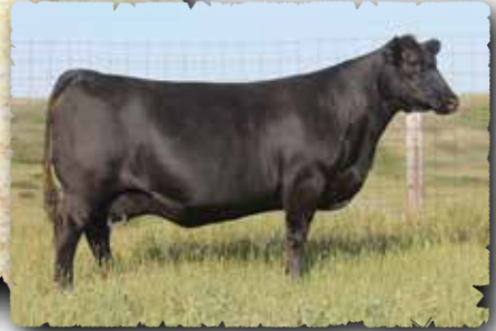
QUEEN OF PEAK DOT 936Y The dam of lot 76