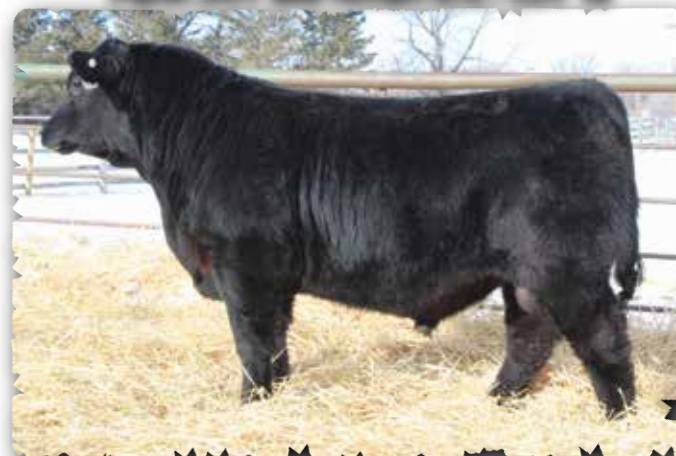
PEAK DOT BIG RIVER 61K - LOT 20