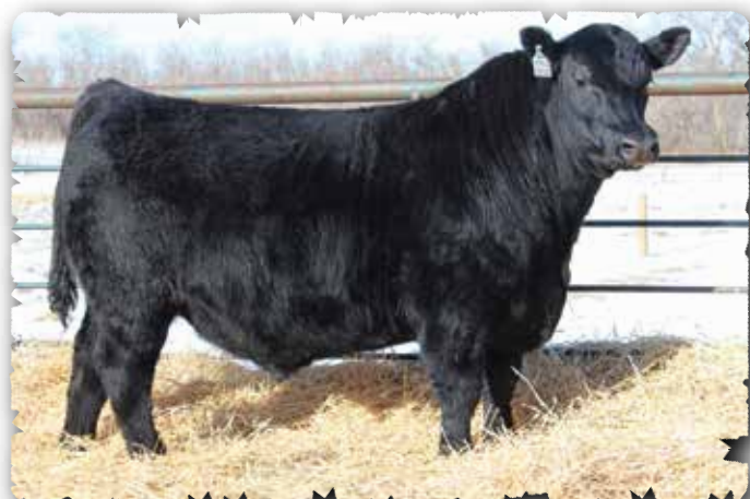
PEAK DOT BLOODLINE 707K - LOT 44