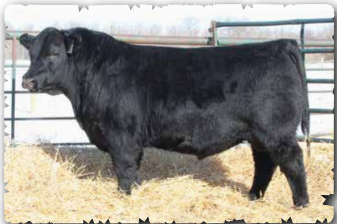
PEAK DOT THREE RIVERS 129K - LOT 29

>Recommended for cows. Powerful build. Loaded with meat and muscle from end to end. Weaning ratio 101. >Top 1% for weaning weight, yearling weight, Docility and Carcass WT EPDs. >Ranks in the top 4% of the breed for heifer pregnancy EPD. >Dam has immense volume and body depth.