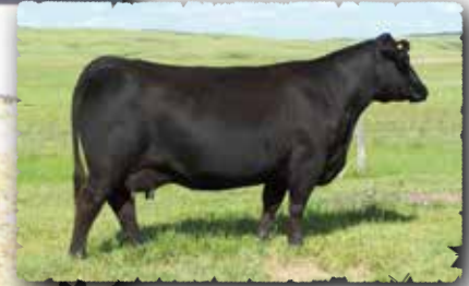
PANSY OF PEAK DOT 904U