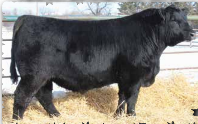
PEAK DOT BIG RIVER 810K - LOT 4