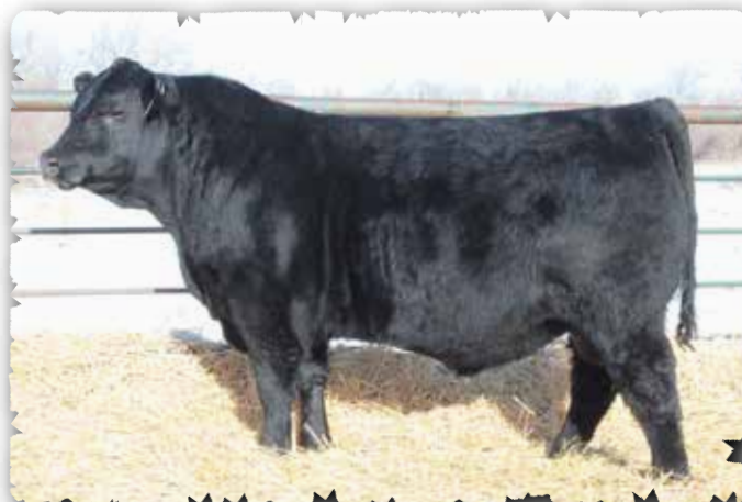
PEAK DOT THREE RIVERS 125K - LOT 23

> Recommended for cows A top ranking bull on paper and in the pen. > Top 1% for weaning weight and yearling weight, and carcass weight. top 1% for foot claw and angle EPD > Dam is listed as an Elite/Premier dam with the Canadian Angus. Stems back to the herd matriarch Lady of Peak Dot 782L who has 68 progeny.