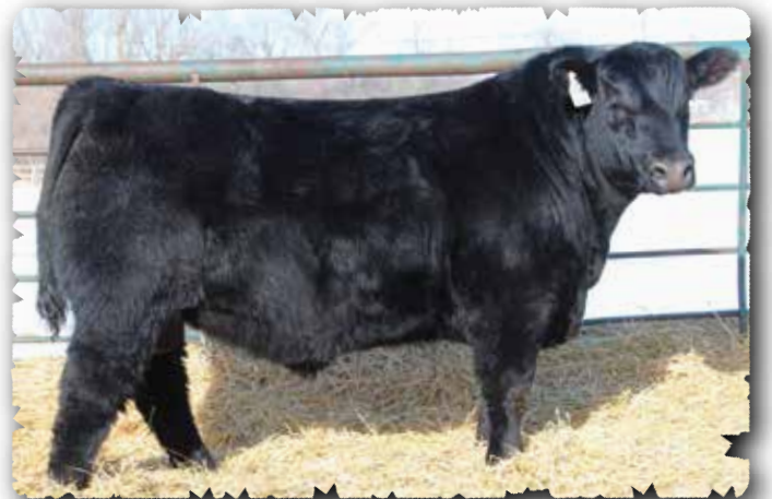
PEAK DOT COLOSSAL 161K - LOT 101

>Recommended for heifers or cows >A stout functional good bull with maternal value. Weaning ratio 110. >Top 1% for weaning weight, yearling weight, carcass weight, foot angle EPDs. >Top 6% for REA and Top 15% for marbling. >Grandam is a deep made easy fleshing donor with 11 progeny. Full brother in blood to lot 104