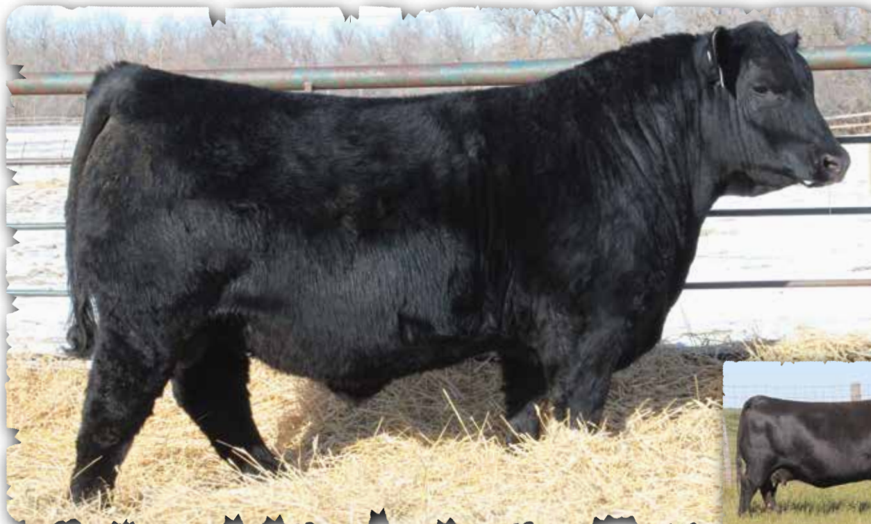
PEAK DOT BLOODLINE 701K - LOT 41

SAV Bloodline 9578 is the lead off $250,000 top selling bull from the 2020 SAV Sale. He is a performance powerhouse and the most popular and widely used bull of his calf crop in the Angus breed. He is a dominating sire of extra growth, volume, muscle pounds and power. His progeny are among the best topping sales across the country. His sons are big stout power bulls with muscle rib shape and pay weight. His pathfinder dam is unmatched for phenotype, performance and production.