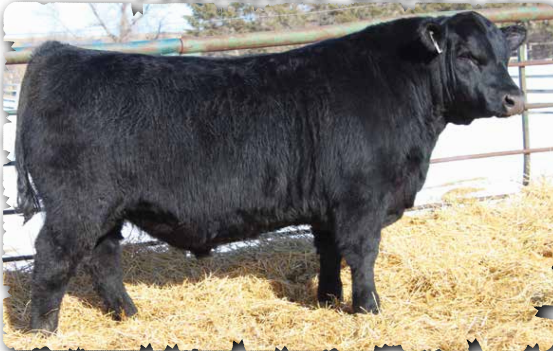
PEAK DOT ATTRACTIVE 509K - LOT 125