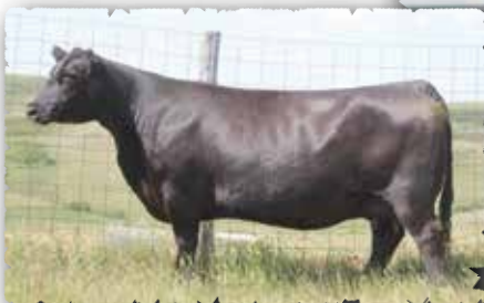
PEAK DOT BARDOLIA 1026Z The dam of lot 25

>Recommended for heifers. An absolute stunner in the bull pen. >Weaning ratio 114. Top 1% for foot angle and claw. Top 2% for weaning, yearling and carcass weight. >Perfectly made nice uddered dam by SAV Radiance ranks in the top 1% for milk EPD >Maternal brother to the $24,000 Peak Dot Innovation 62D and last years lot 1 $34,000 Peak Dot Profound 100J to Jay-lyn Farms.