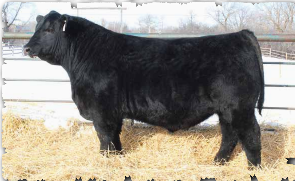
PEAK DOT THREE RIVERS 127K - LOT 22