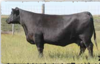
DUCHESS OF PEAK DOT 155Y