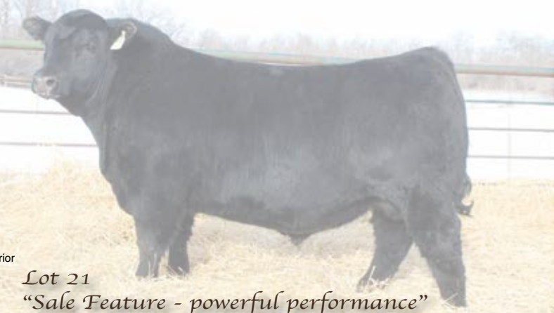
Lot 21 "Sale Feature - powerful performance"

>Recommended for cows >One of the top herdsire prospects to sell anywhere this year. Attractive with length thickness and superior structure and impressive EPD profile. >Ranks in top 1% for Weaning and Yearling EPDs and holds a weaning ratio of 119. >Top of the breed Hoof claw and angle EPDs. Top 1% for carcass WT EPD. >Dam is listed as an Elite/Premier Dam with an average weaning ratio of 107 on her last 5 calves.