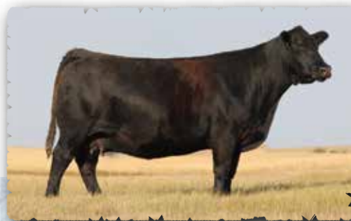
PEAK DOT HEROINE 2007D The dam of lot 1

"Absolutely one of the best we have ever raised with incredible phenotype, performance and cow power,"