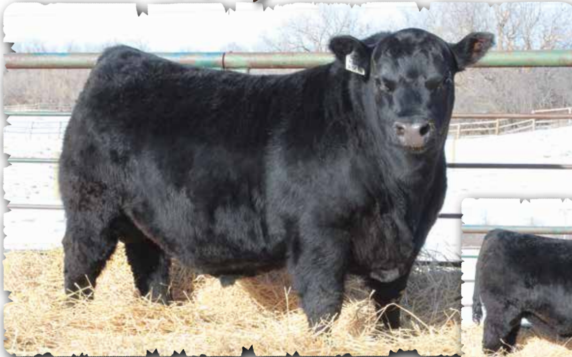
PEAK DOT ROUGHRIDER 3130K - LOT 72