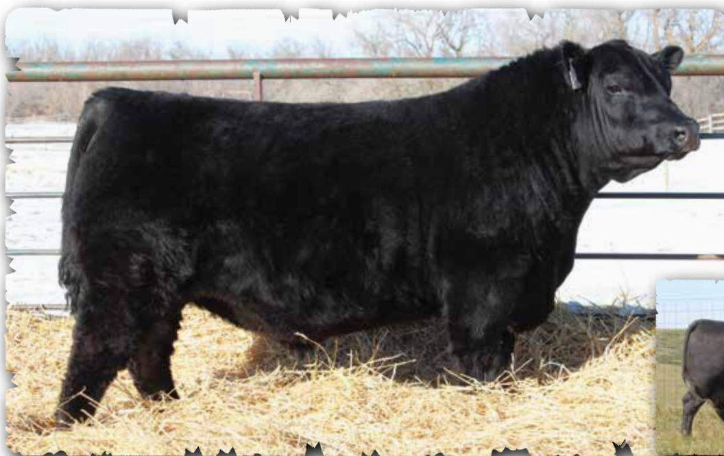
PEAK DOT MOSAIC 5K - LOT 53