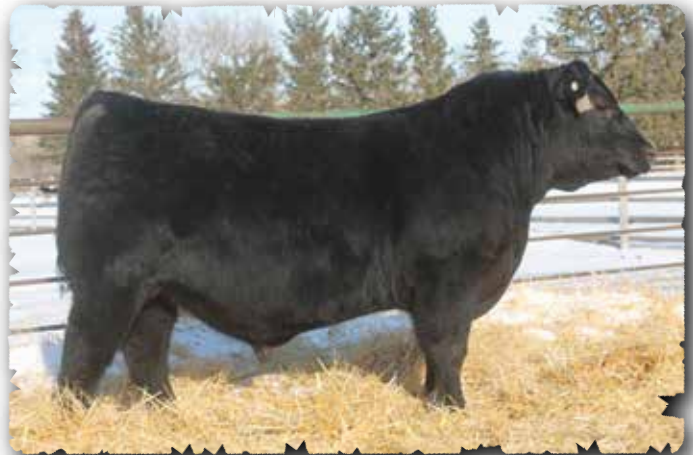
PEAK DOT ROUGHRIDER 455K - LOT 76

>Recommended for heifers >A smooth patterned bull with thickness and fleshing ability. >grandam is a embryo donor and mother of lot 82