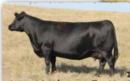
PEAK DOT MAYFLOWER 303B The dam of lot 27