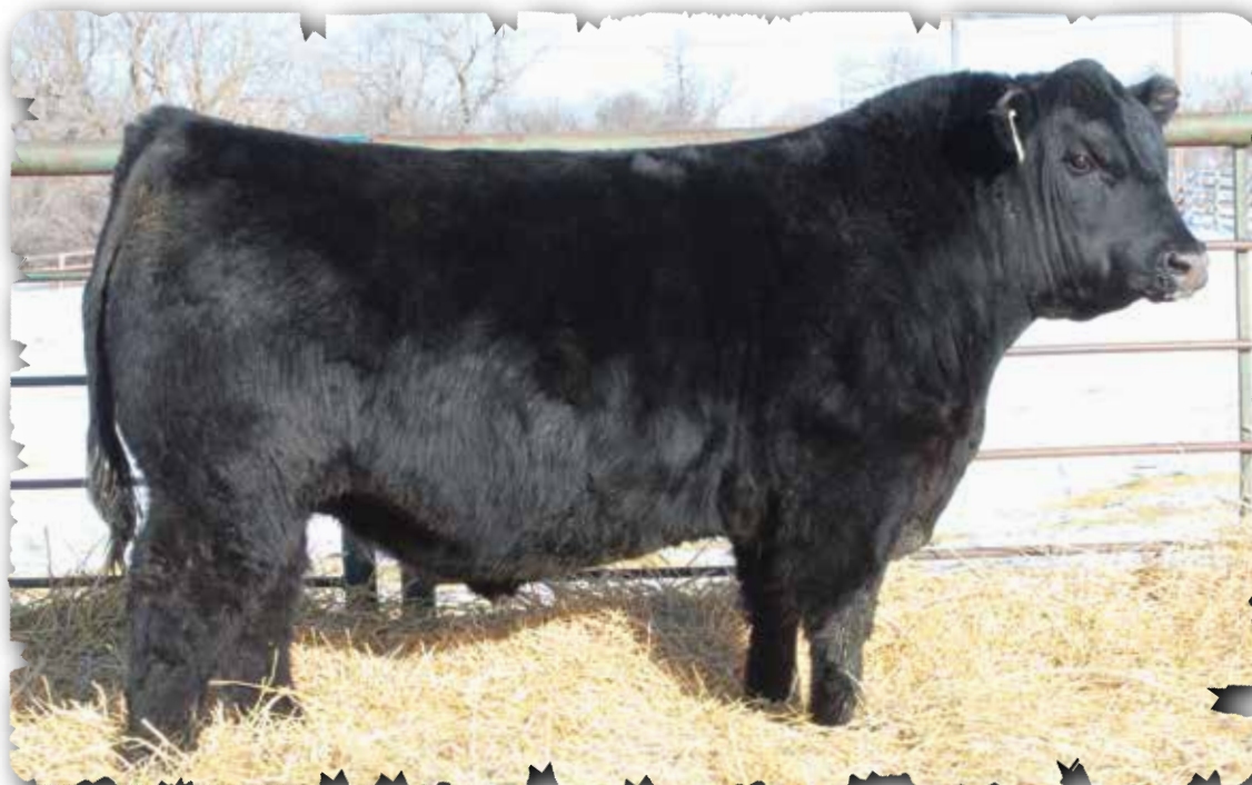
PEAK DOT NO DOUBT 3K - LOT 166

Peak Dot No Doubt 209D is an exceptionally good footed son of No Doubt with a tremendous amount of body thickness and capacity. He is a low birth weight sire. Commercial cattle producers will appreciate the added size, length and pounds his sons offer. Owned with Hillcrest Enterprises.