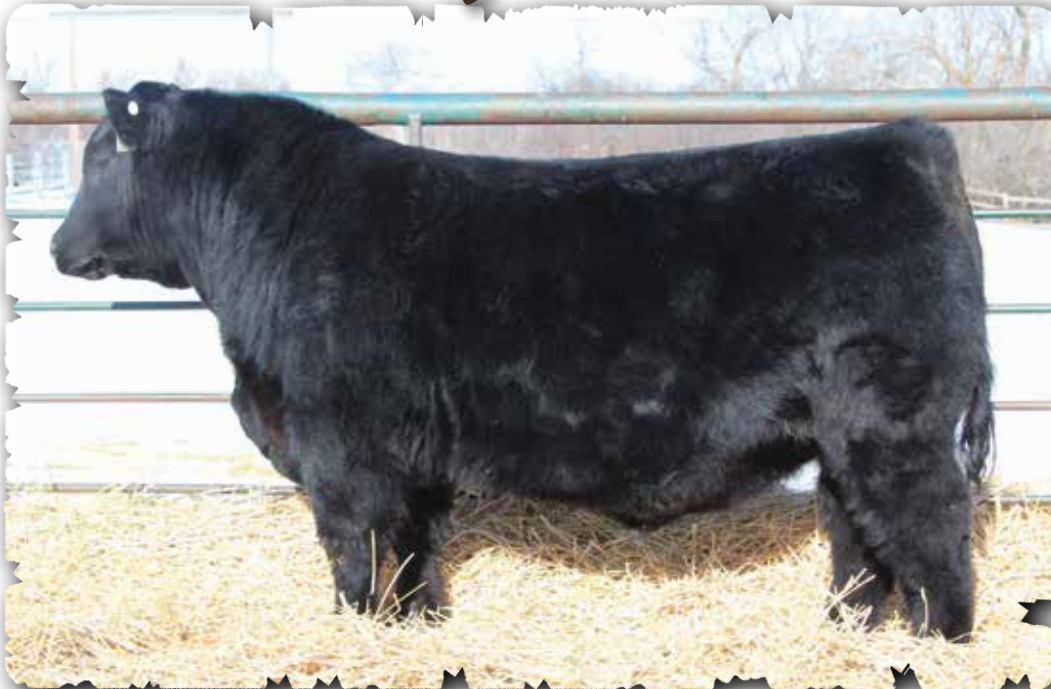
PEAK DOT NEWFOUND 395K - LOT 84