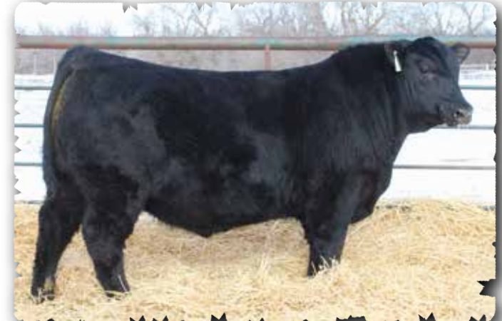
PEAK DOT ROUGHRIDER 412K - LOT 77

>Recommended for cows >A nice headed bull with volume and thickness. Weaning ratio 111. >Dam is a stout bodied deep made productive looking Eliminator daughter with a solid production record. 49 progeny and several daughters working in the herd. A perfect uddered donor. >Grandam is listed as an Elite Dam with CAA.