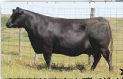
HEROINE OF PEAK DOT 225Z