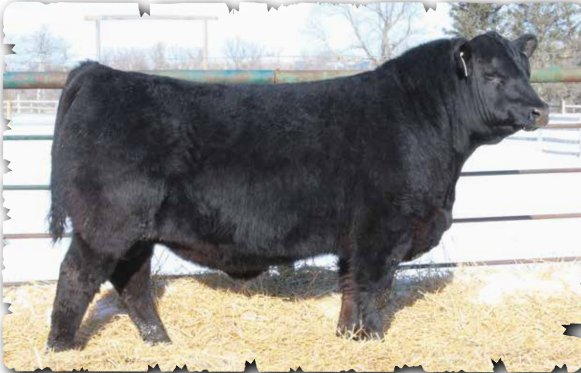
PEAK DOT NO DOUBT 409K - LOT 180