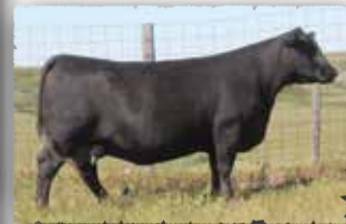
PEAK DOT BARBARA 483A The grandam of lot 123