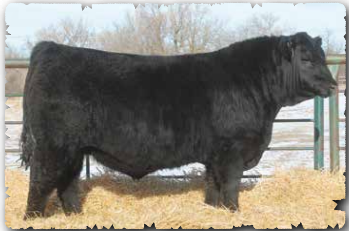
PEAK DOT NO DOUBT 424K - LOT 177

>Recommended for heifers >A low birth weight bull with a tremendous top and thickness.. >Nice uddered broody Eliminator dam. A maternal brother sold to Alan Duffner.