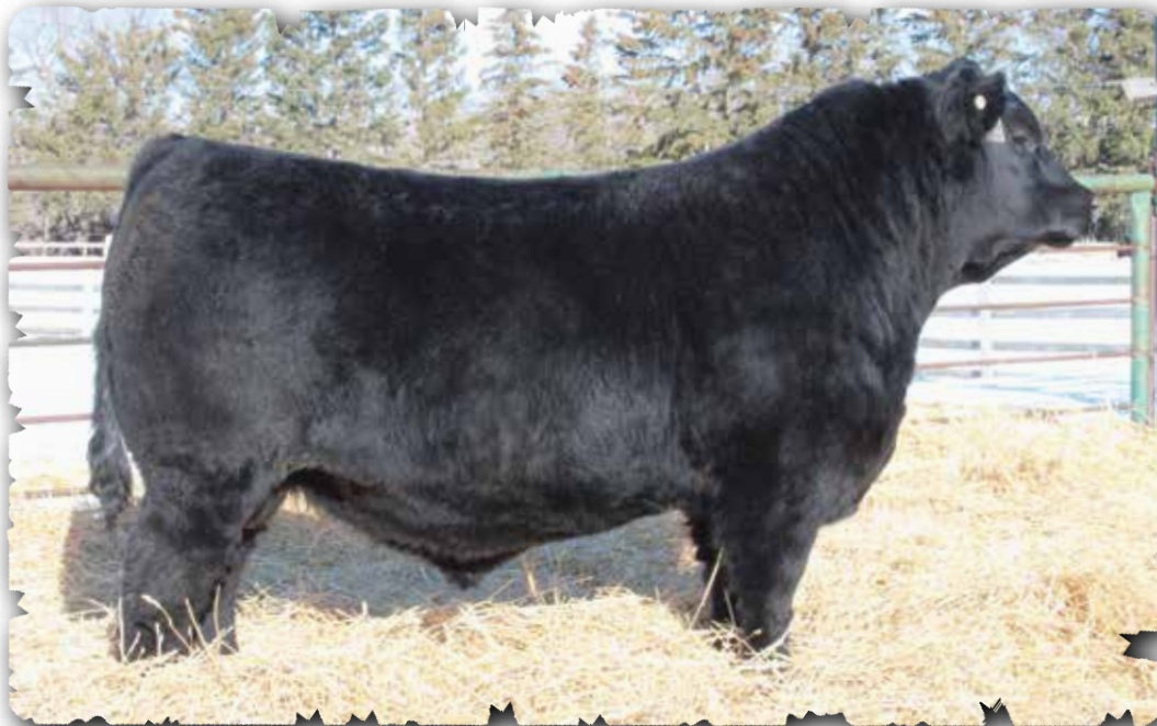
PEAK DOT TRUST 17K - LOT 54

Trust is gaining attention and is being used by several reputable commercial and purebred cattle ranches that just flat out like good, balanced, correct cattle with performance, eye-appealing phenotype and natural thickness. His dam has a flawless udder, good feet, true breed character and is one of the very best No Doubt daughters in the herd. You will want to keep all of his daughters. Contact: Semex Beef for semen.