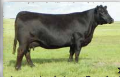
ERICA OF PEAK DOT 478U The maternal grandam of lot 117