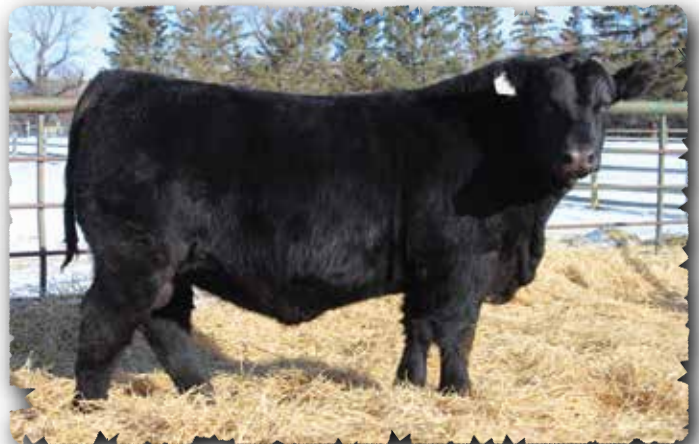
PEAK DOT BIG RIVER 3143K - LOT 6