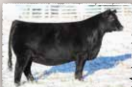
Peak Dot Queen 15G Purchased by KT Ranch for $24,000