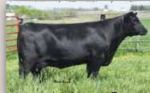
SAV MISS BOBBIE 2407 The dam of Earnhardt

BW +3.3 WW +64 YW +101 MILK +20 MARB +65 REA +40 CW +39