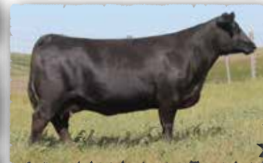
PEAK DOT HEATHER 541B The dam of lot 45