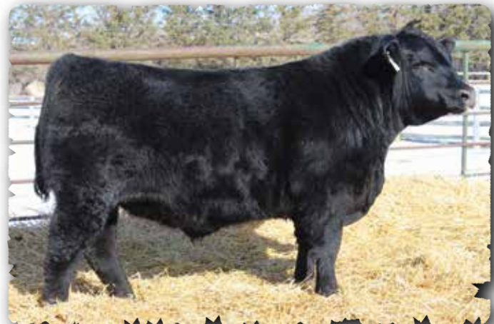
PEAK DOT BOOST 156K - LOT 121

>Recommended for heifers. A big upstanding Boost bull with extra length and growth. Top7% REA. >Broody, deep bodied dam by Profound. Grandam has an average weaning ratio of 110 on her last six calves and is listed as an Elite/Premier dam by the CAA. She is the mother of the $35,000 Peak Dot Franchise purchased by Perrot Cattle Company and Canadian Sires