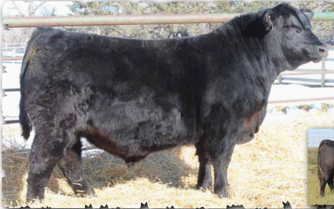
PEAK DOT BRUTUS 505K - LOT 142