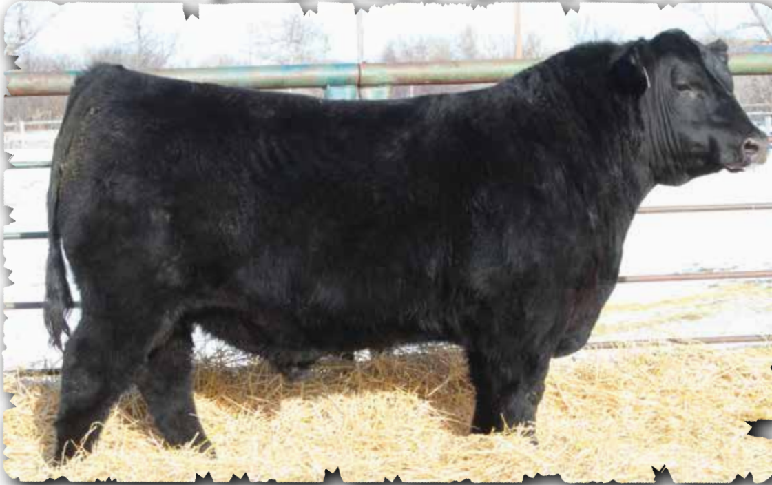
PEAK DOT NO DOUBT 51K - LOT 170