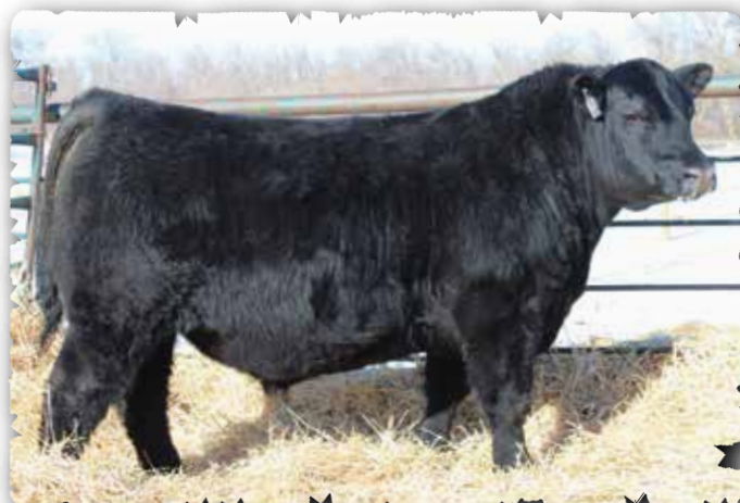
PEAK DOT LANCASTER 6K - LOT 65