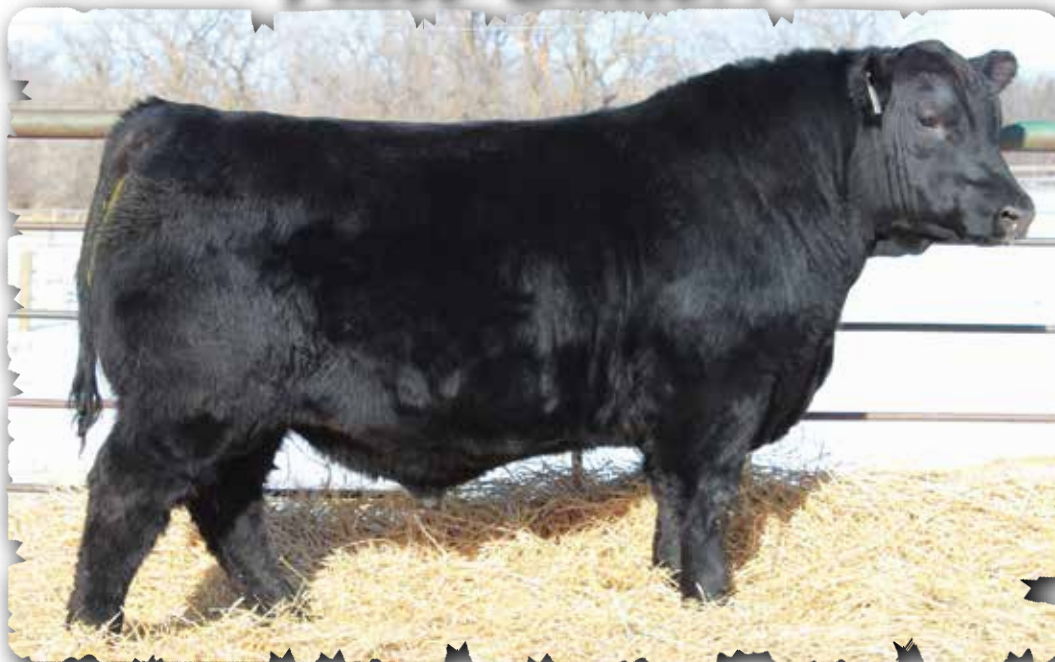
PEAK DOT TRUST 43K - LOT 55