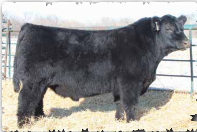
PEAK DOT NO DOUBT 415K - LOT 168