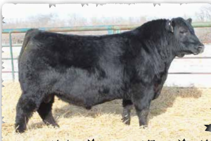
PEAK DOT COLOSSAL 106K - LOT 94

>Recommended for heifers. >A thick made upstanding Colossal bull with extra volume and growth. Weaning ratio 105. > Grandam is a embryo donor with 29 progeny.