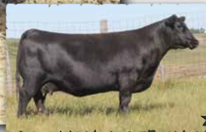
PEAK DOT PRISCILLA 239A