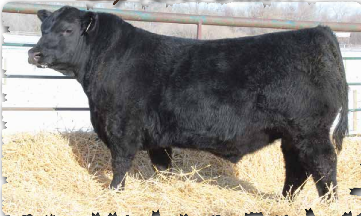
PEAK DOT BIG RIVER 263K - LOT 13