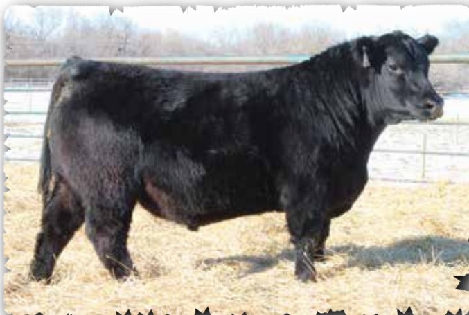
PEAK DOT BRUTUS 303K - LOT 144