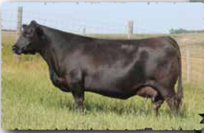
PEAK DOT LADY 9Y