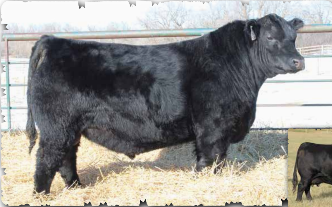
PEAK DOT BRUTUS 226K - LOT 136