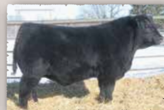
PEAK DOT RIDER NATION 131G Purchased by Hillcrest Enterprises for $32,500