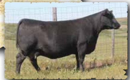
PEAK DOT BARBARA 483A The grandam of lot 152