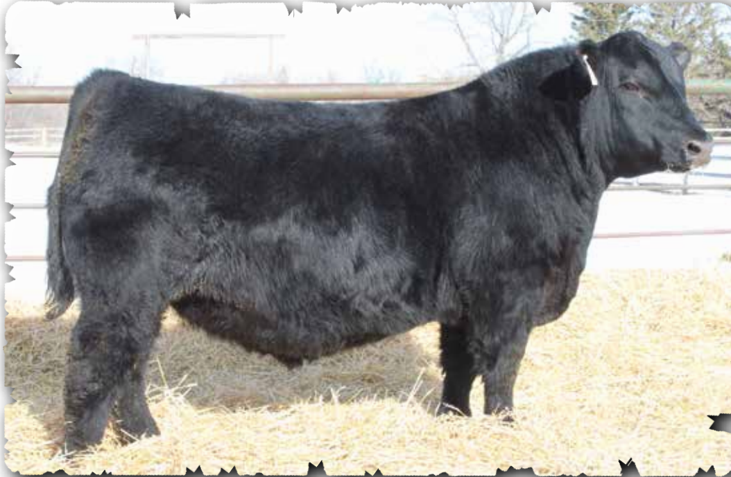
PEAK DOT BOOST 200K - LOT 114