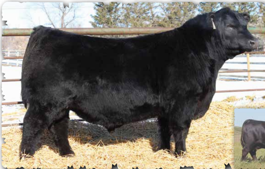
PEAK DOT BRUTUS 521K - LOT 130