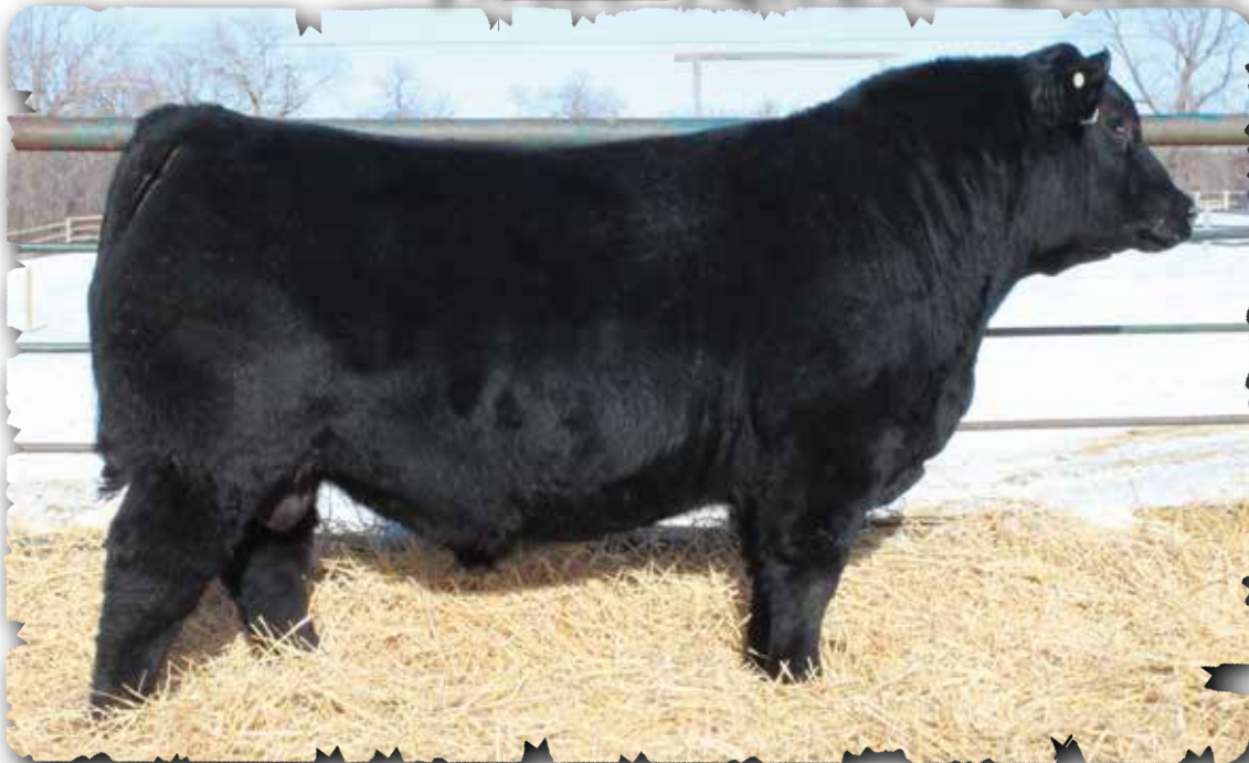
PEAK DOT THREE RIVERS 206K - LOT 31