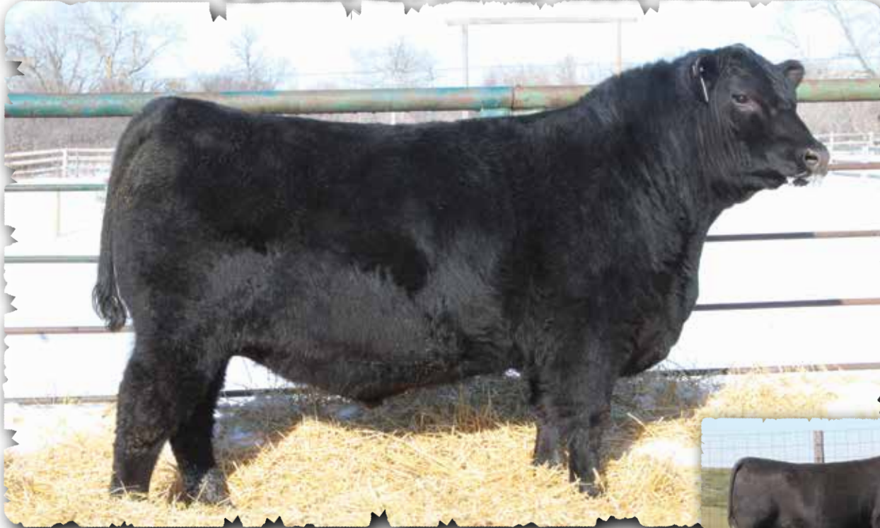
PEAK DOT TENDERLOIN 270K - LOT 152