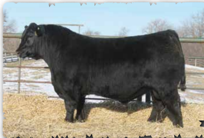
PEAK DOT THREE RIVERS 63K - LOT 24

> Recommended for cows Weaning ratio 112. > Extra power in this bull's pedigree. Will add some growth and sheer thickness to his calves. > Ranks in the top 1% for weaning and yearling EPD. Top 25% marbling, top 6% REA. Top 1% Carcass WT > Backed by two generations of Elite/Premier Dams and also of the dam of the $30,000 Peak Dot Mosaic 112J selling to Skogen Livestock and the $17,000 Peak Dot Strong Arm selling to Bohrsen Marketing.