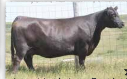
PEAK DOT BARDOLIA 1026Z The maternal great grandam of lot 114