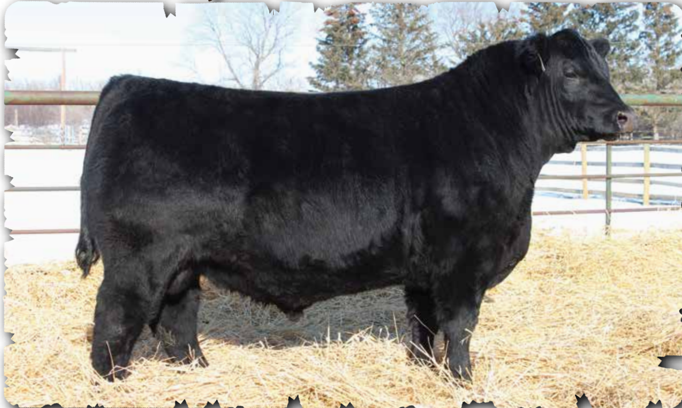
PEAK DOT BIG RIVER 139K - LOT 1