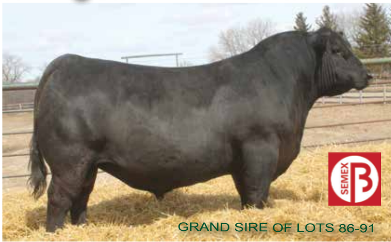
GRAND SIRE OF LOTS 86-91