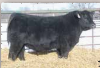
PEAK DOT LANCASTER 26G Purchased by Glasman Farms. for $56,000