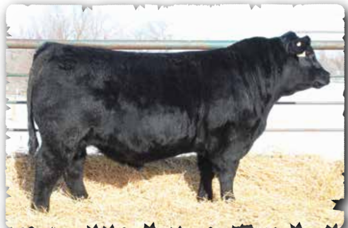
PEAK DOT THREE RIVERS 276K - LOT 33

>Recommended for heifers or cows. Weaning ratio 103 >Ranks in the top 1% for weaning weight, yearling weight, and hoof claw EPDs. >Dam is no miss, moderate sized and feminine fronted with a nice udder and Milk EPDs in the top 1%. She is listed as an Elite Dam with the CAA.