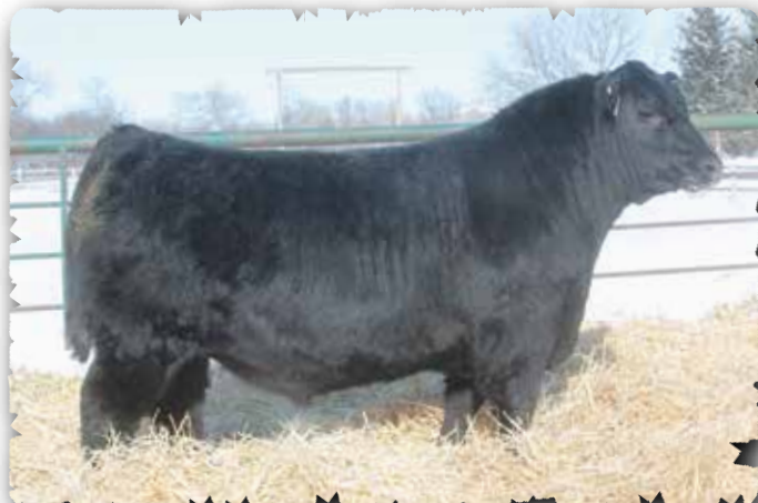
PEAK DOT BRUTUS 151K - LOT 138

>Recommended for heifers or cows >A Brutus son with ideal phenotype and superb structure. >Second heaviest weaning weight bull in the entire auction. Weaning ratio 123. >Dam is a donor with a perfect udder. Sons have sold to Alan Krahn, Lane View Farms, River Meadow Ranch and Dale Zukowski