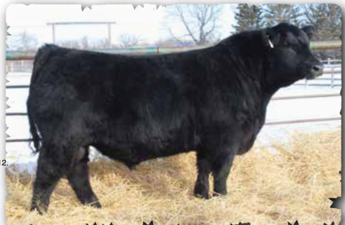
PEAK DOT THREE RIVERS 69K - LOT 32

>Recommended for cows >A big performance bull with size, thickness, muscle, volume and natural fleshing-ability. Weaning ratio 112. >EPDs rank him in the Top 1% for weaning weight, yearling weight, foot angle and claw EPDs. >Grandam is listed as an Elite Dam with the CAA