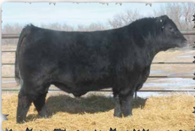
PEAK DOT NO DOUBT 18K - LOT 169