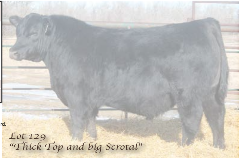
Lot 129 "Thick Top and big Scrotal"

>Recommended for heifers or cows >A standout! Thick topped, loaded with muscle and as solid as you can build one. Weaning ratio 116. >Excellent Scrotal development. Top 1% for Scrotal EPD. >Well made dam has an excellent udder and a daughter sired by Ellingson Profound retained in the herd.