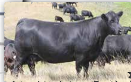
PEAK DOT BAMBI 16C The dam of lot 158