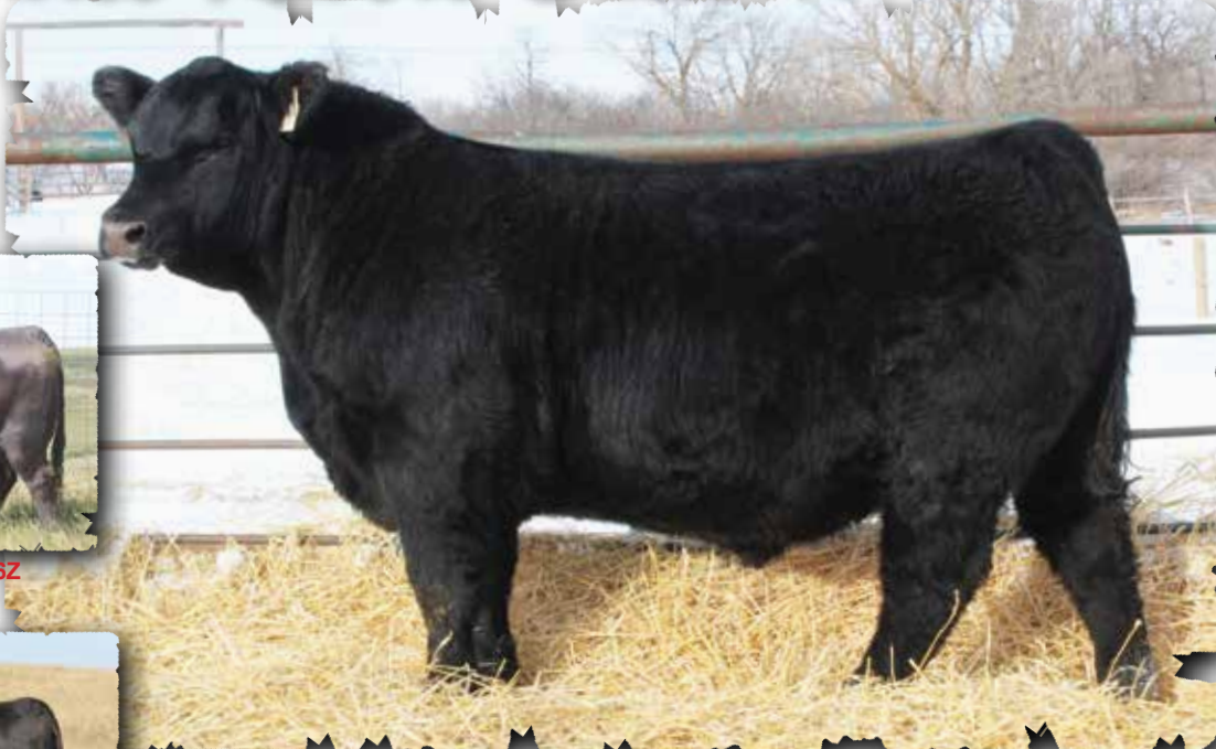
PEAK DOT THREE RIVERS 123K - LOT 25