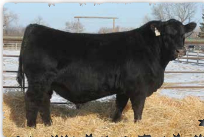
PEAK DOT BOOST 227K - LOT 118

>Recommended for heifers >Proud fronted, attractive bull with thickness, muscle volume and style. Weaning ratio 114. >Productive dam ranks in the top 1% for milk EPD.