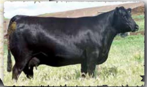
DUCHESS OF PEAK DOT 610T The maternal grandam of lot 78