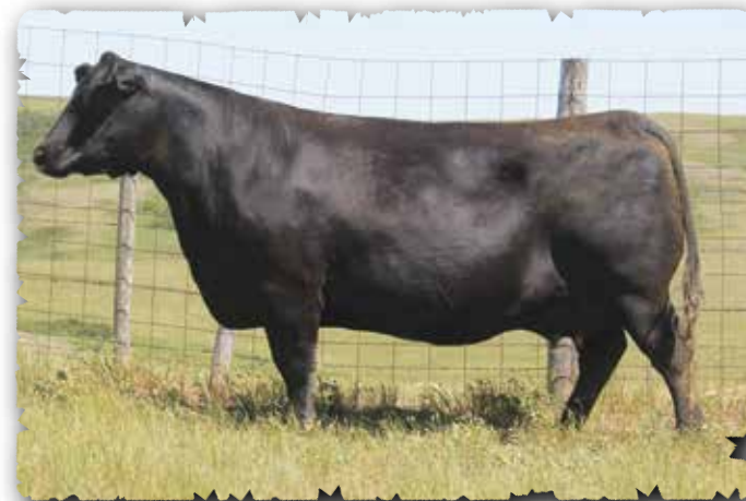
HEROINE OF PEAK DOT 225Z The grandam of lot 154

>Recommended for heifers >A tank. As deep and thick as they come and also is recommended safe for use on heifers. >Dam is backed by 3 generations of top end donor cows. Weaning ratio 108