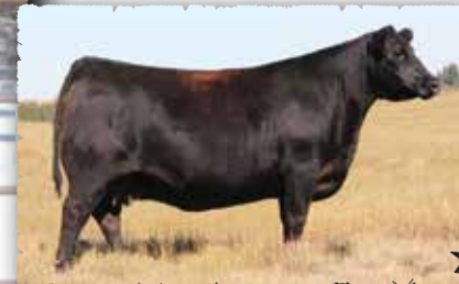
PEAK DOT BARBARA 807H The dam of lot 133