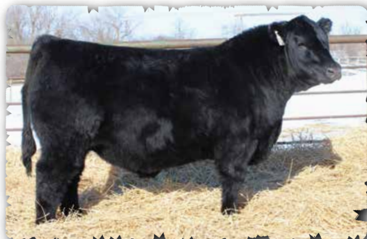
PEAK DOT TRUST 407K - LOT 57