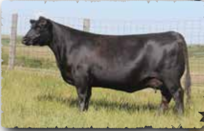
PEAK DOT LADY 10C