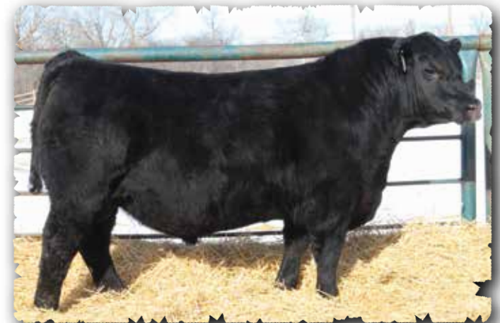
PEAK DOT COLOSSAL 389K - LOT 102

>Recommended for heifers. >A big upstanding Colossal bull with extra length and growth. Top 1% weaning and yearling weight. >Top 7% for marbling, top 8% for REA. >Full brother to Herdsire Peak Dot Colossal 99H. No Doubt dam is one of the top EPD cows in the herd.