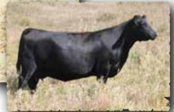
PEAK DOT PRIDE 88B The great grandam of lot 2,3,4

>Recommended for heifers or cows >Flush brothers. Calving ease bull with thickness, muscle and volume and performance. >They all posted moderate birth weights and weaning weights well over 800lbs. >A flush sister was the top selling Big River daughter in the 2022 Fall Sale. >Donor dam is a herd favorite with excellent femininity, fertility, feet and udder quality. Grandam is an Elite/Premier Dam with nursing ratio of 110 on her first four calves. She is also the dam of Peak Dot and Glassman Farms herd- sire Peak Dot Lancaster and Peak Dot and Hillcrest Enterprises herdsire Peak Dot Seedstock 38F.