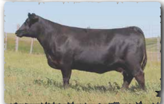
PEAK DOT HEATHER 541B The dam of lot 38

>Recommended for heifers. >A must see in person. Abundant muscle shape, thickness and extension. >His dam Peak Dot Heather 541B is an impressive looking donor with 29 progeny. She is a big time producer that has raised many feature bulls in years past and daughters retained at Peak Dot at the top of our program. Her first daughter offered at public auction sold for $15,000.