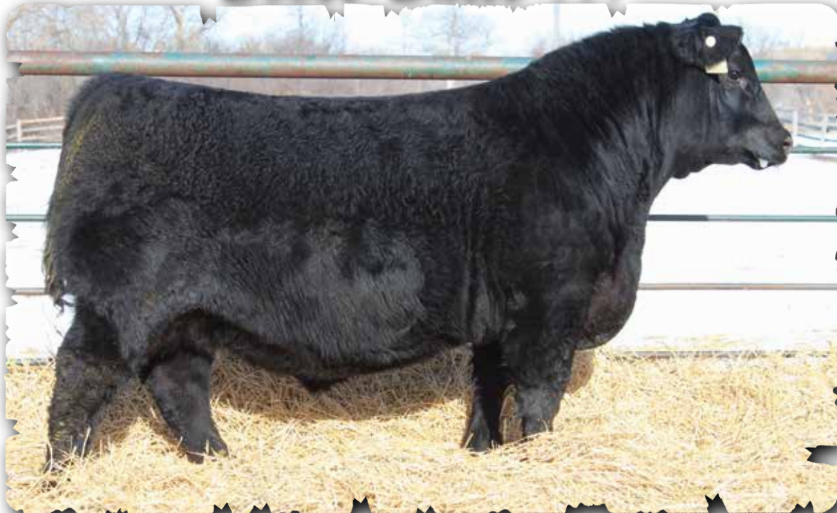
PEAK DOT BOOST 187K - LOT 111