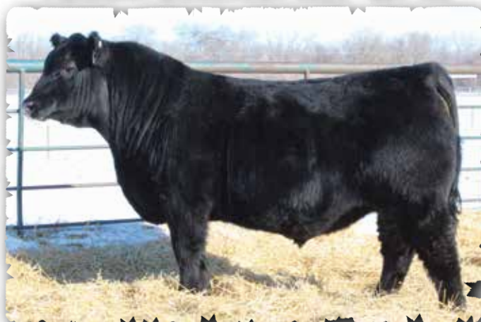
PEAK DOT EARNHARDT 430K - LOT 159