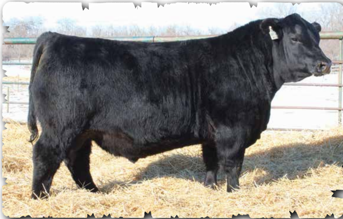
PEAK DOT BRUTUS 163K - LOT 129

Sure to be a household name someday soon, Brutus is a great one combining phenotype, cow family, EPDs, individual performance and carcass traits. Top selling bull from Brookdale Angus. Brutus was the heaviest weaning and yearling weight bull and had the highest IMF scan of the entire calf crop. He is backed by a highly maternal cow family and has two of the most influential cows in the entire Angus breed Baldrige Isbel Y69 and SAV Blackcap May 4136 in his pedigree make up. Owned with Semex Beef.