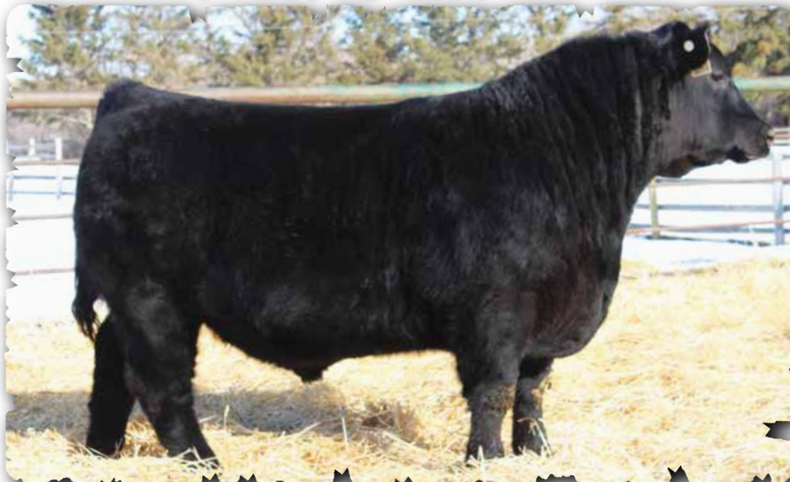
PEAK DOT TRUST 328K - LOT 58