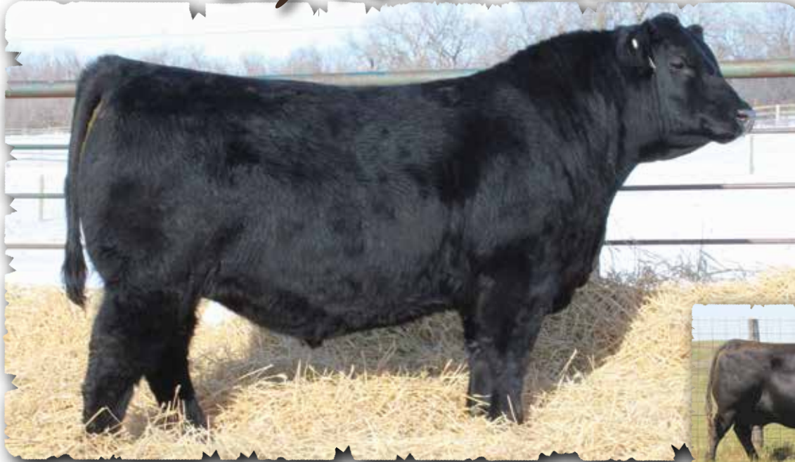
PEAK DOT BIG RIVER 45K - LOT 7