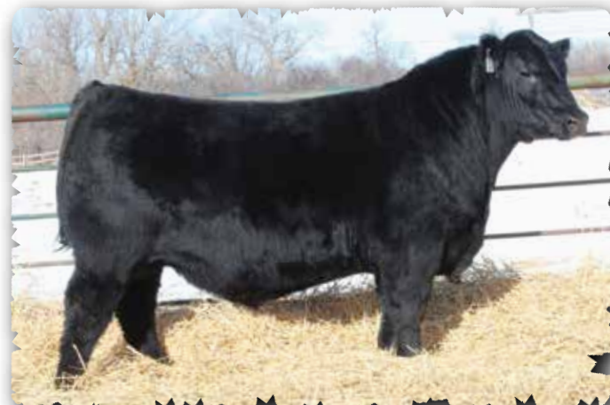
PEAK DOT BLOODLINE 710K - LOT 43