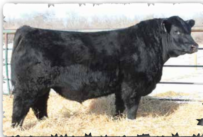
PEAK DOT BLOODLINE 807K - LOT 46