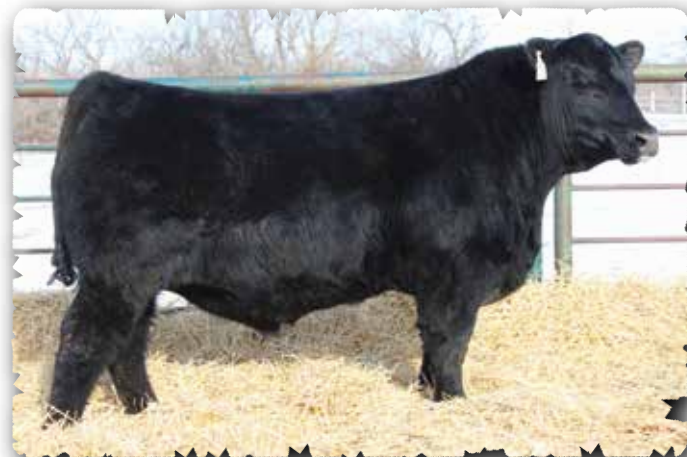
PEAK DOT BOOST 176K - LOT 115

>Recommended for heifers >This attractive Colossal son has a great top and excellent rump structure. Weaning ratio of 106. >Profound dam is backed by two consecutive generations of embryo donors.