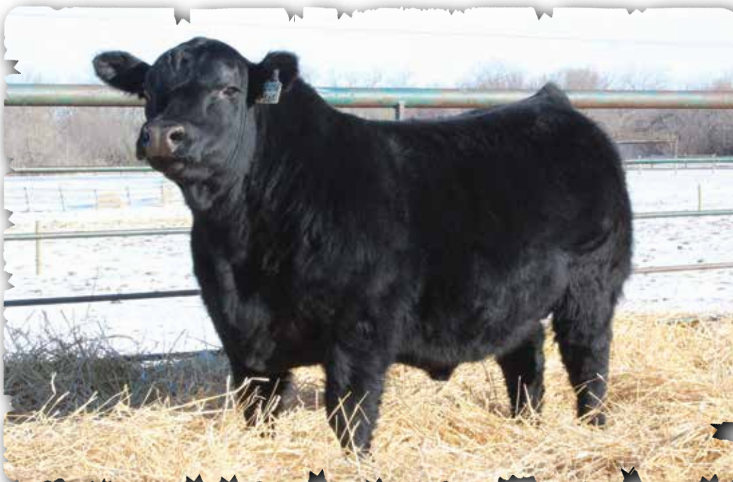
PEAK DOT NEWFOUND 436K - LOT 85