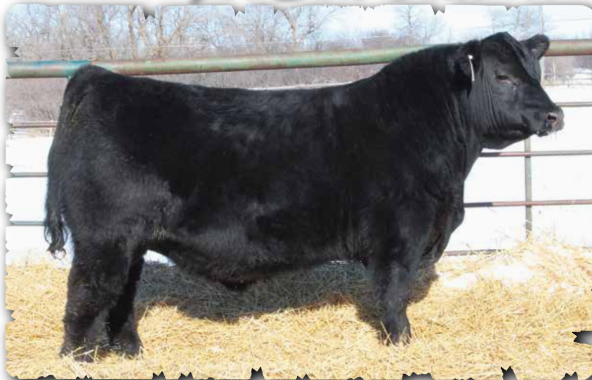
PEAK DOT FOR SURE 493K - LOT 188