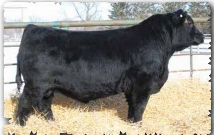
PEAK DOT BIG RIVER 121K - LOT 11

>Recommended for cows. >Great performance, good topped and thick made. Weaning ratio 103. >Good footed, backed up by his strong foot EPDs, top 15% for Marbling.