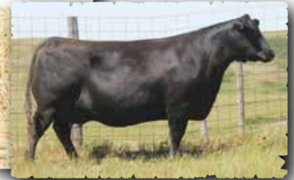
HEROINE OF PEAK DOT 225Z