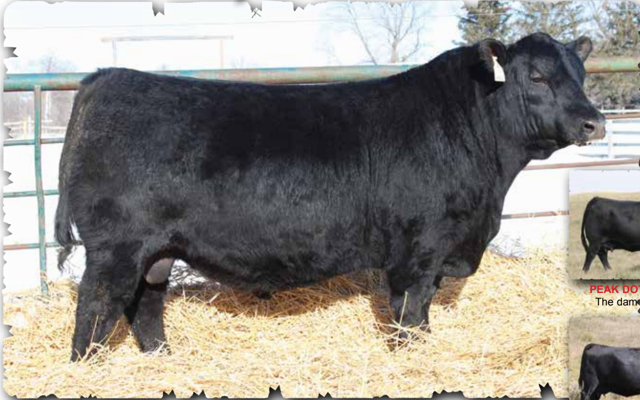
PEAK DOT BIG RIVER 706K - LOT 2