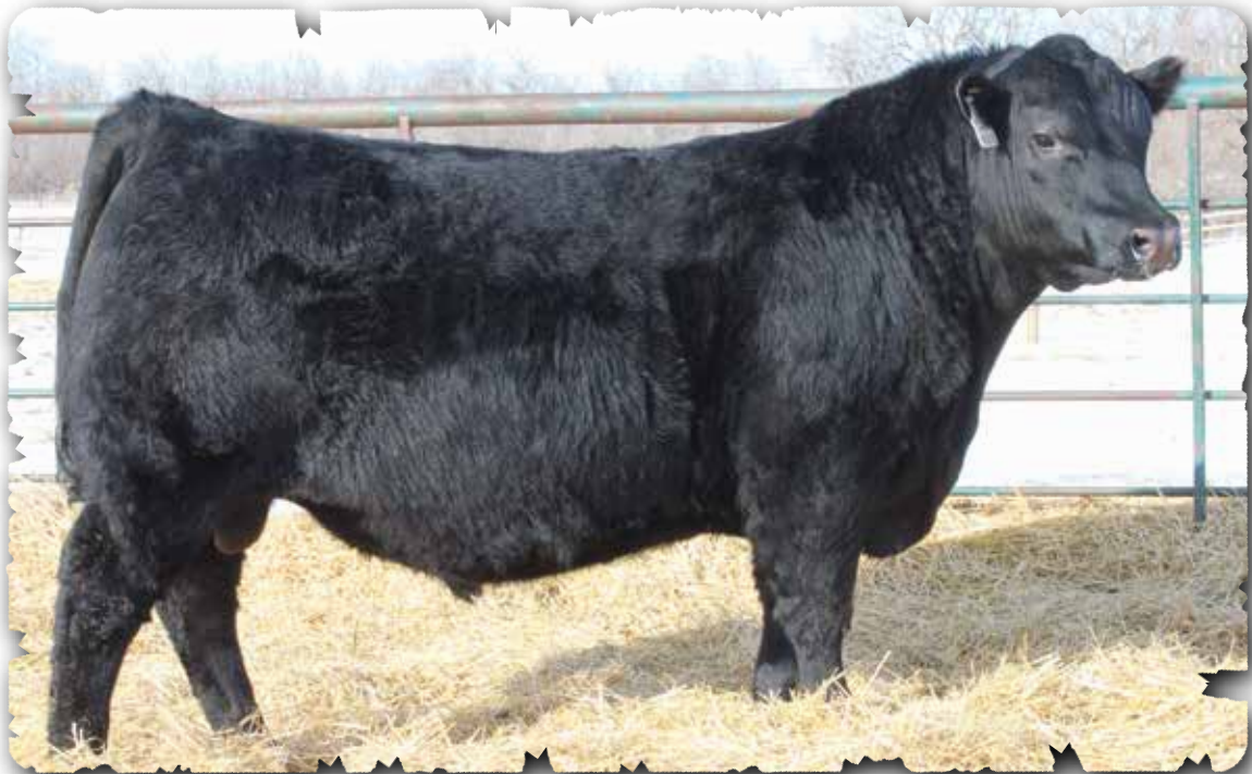
PEAK DOT COLOSSAL 3100K - LOT 103