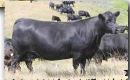
PEAK DOT BAMBI 16C The maternal grandam of lot 121