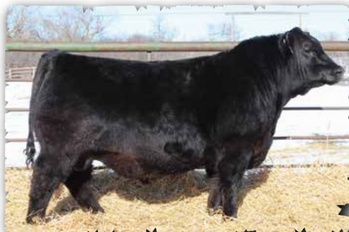
PEAK DOT BRUTUS 324K - LOT 132

>Top 1% for weaning weight, yearling weight. Top 15% marbling.