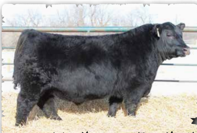
PEAK DOT COLOSSAL 56K - LOT 95

>Recommended for heifers >A well made bull blending thickness, substance and style. Weaning ratio 104. >Top 6% for marbling. >Grandam is a embryo donor with 29 progeny.