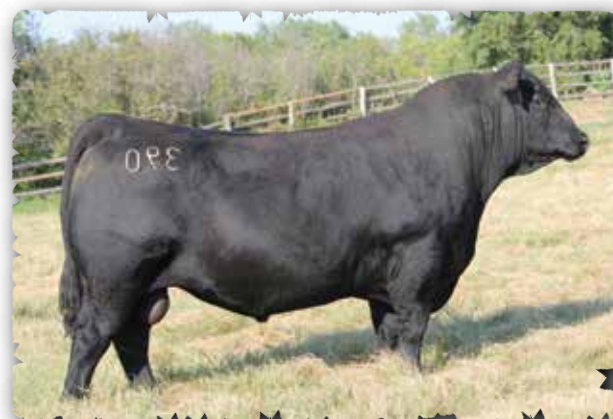
BROOKDALE BRUTUS 390 Summer picture of Brutus taken shortly after he finished up the 2022 breeding season

>Recommended for heifers A sure-fire calving-ease bull with a thickness, muscle and style. >Top 10% for marbling. Weaning ratio of 107.