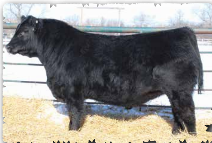
PEAK DOT EARNHARDT 585K - LOT 158

>Recommended for heifers or cows >A good looking bull, smooth and athletic in his movement. Durable and built for ranch country. Weaning ratio 107. >Top 10% for Marbling. Top 20% REA. >Dam is big bodied female with a nice udder and small teat size. Grandam is a donor and mother of lots 41, 42, 43, and 44