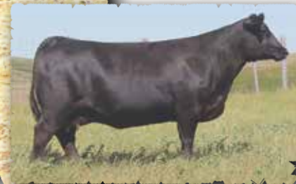
PEAK DOT HEATHER 541B The grandam of lot 130