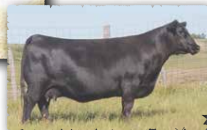
PEAK DOT PRISCILLA 239A The grandam of lot 159