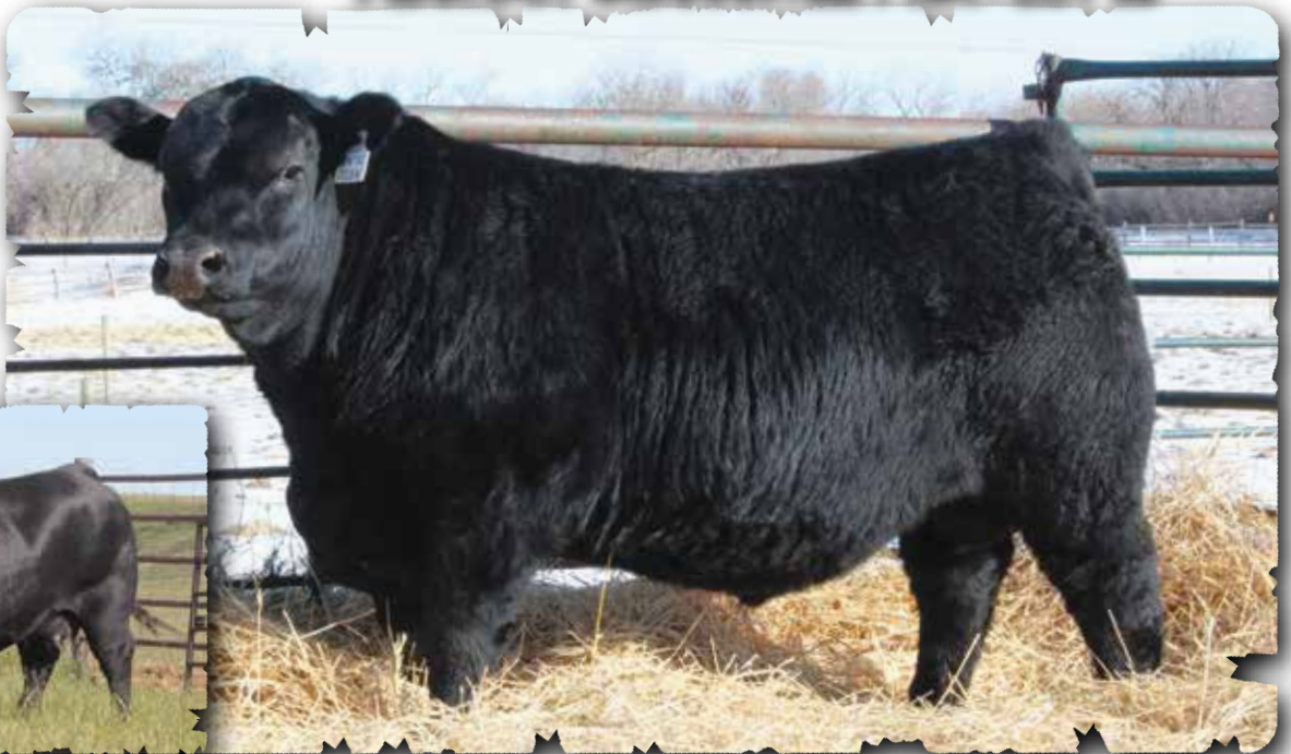
PEAK DOT GUARANTEE 703K - LOT 40