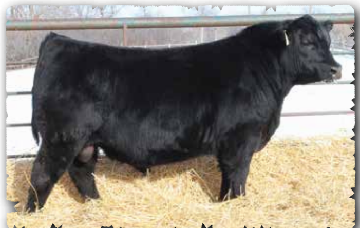
PEAK DOT BIG RIVER 110K - LOT 12

>Recommended for heifers or cows >Exceptional power and performance. Very good maternal genetics. Weaning ratio of 107. >TOP 1% for WW,YW. Top 3% for foot claw and angle EPD. Top 5% for marbling. >Backed by three consecutive generations of donor cows Grandam has 54 progeny.