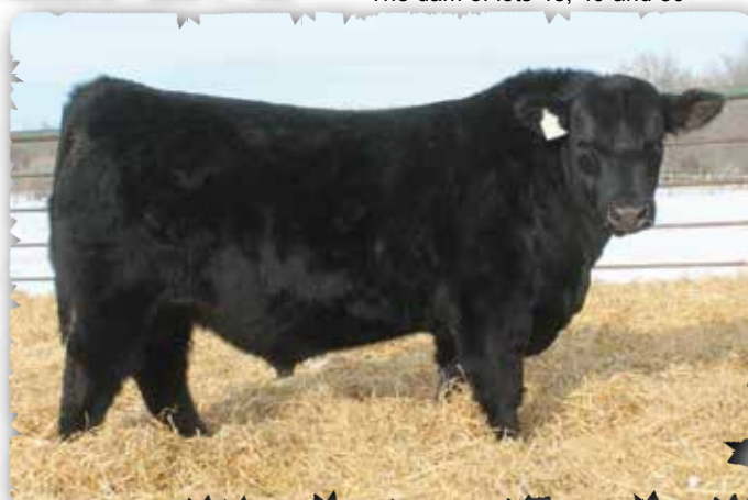
PEAK DOT BLOODLINE 804K - LOT 49