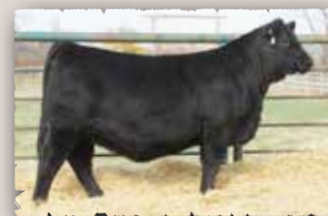
Ellingson Big River Daughter