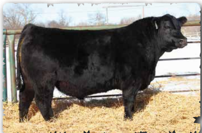
PEAK DOT BRUTUS 180K - LOT 135