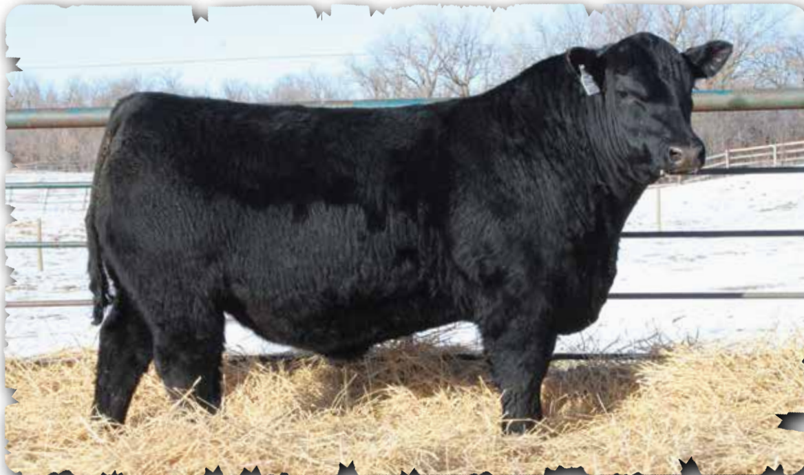
PEAK DOT GUARANTEE 711K - LOT 38

Guarantee was a find of Schooley Cattle Company's in Iowa and he is one of the most exciting sire prospects to arise in some time. Guarantee has an outcross pedigree to the Canadian herdbook and a unique phenotype for his bloodline. He is a calving ease bull filled with presence and attractiveness along with true muscle, depth, and width. To find a sire with his pedigree and physical attributes is one thing, but he combines it with an outlier EPD profile with huge spread from birth to yearling and strong traits across the board. Guarantee's dam raised two sale topping bulls with her first two progeny and then unfortunately was lost much too soon, but her production is proven.