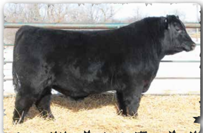
PEAK DOT ROUGHRIDER 229K - LOT 74

>Recommended for cows >Bigger framed, thick topped, loaded with muscle and as solid as you can build one. >Weaning ratio 102. Top 4% for weaning weight EPD.