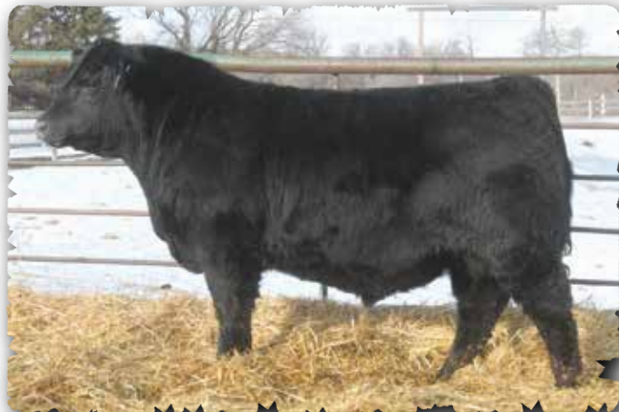
PEAK DOT BRUTUS 366K - LOT 140

>Recommended for heifers. >A low birth bull with big numbers and performance. Weaning index 117. >Top 1% WW, 1%YW. Top 1% for Heifer Pregnancy EPD. Top 7% for Marbling. >Beautifully designed dam has an excellent udder and traces back to three consecutive generations of donor cows.