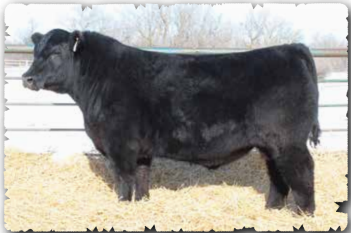
PEAK DOT THREE RIVERS 107K - LOT 30

>Recommended for heifers >Very stout made bull with lots of capacity, volume and thickness. Weaning ratio 114. >Ranks in top 1% for foot angle EPDs. Top 1% for yearling weight. >Dam is a moderate sized wide based and listed as an Elite Dam with the CAA. Maternal brother sold to Stacey Duncan, Someday Ranch and Westbench Colony.