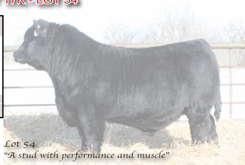
Lot 54 "A stud with performance and muscle"

>Recommended for cows. >A big performance bull with size, thickness, muscle, volume and natural fleshing-ability. >Just over 900lb weaning weight with a weaning ratio 100. >Dam has abundant milk. Maternal brothers have sold to Murry Nielson, Athabasca Colony and Bakus Ranch.