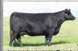
LADY OF PEAK DOT 402U The grandam of lot 120