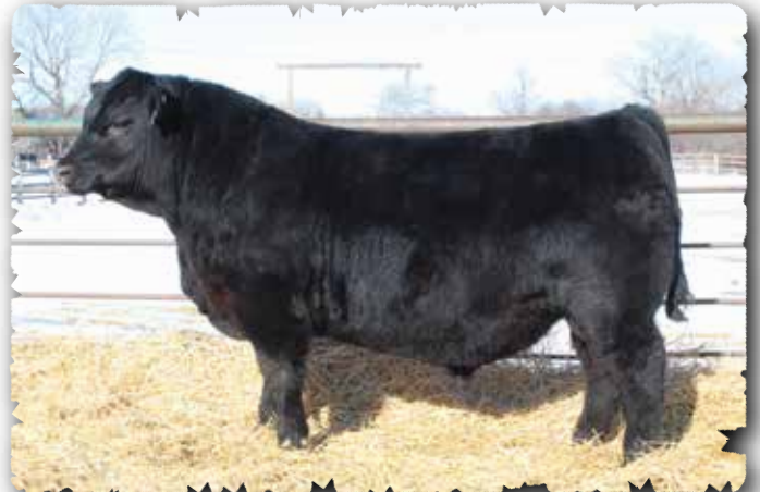
PEAK DOT EARNHARDT 421K - LOT 161

>Recommended for heifers or cows >A bull with eye appeal and superb correctness and tons of maternal value. >Dam is a backed by two consecutive generations of embryo donors, Her grandam is listed as an Elite Dam with the CAA.