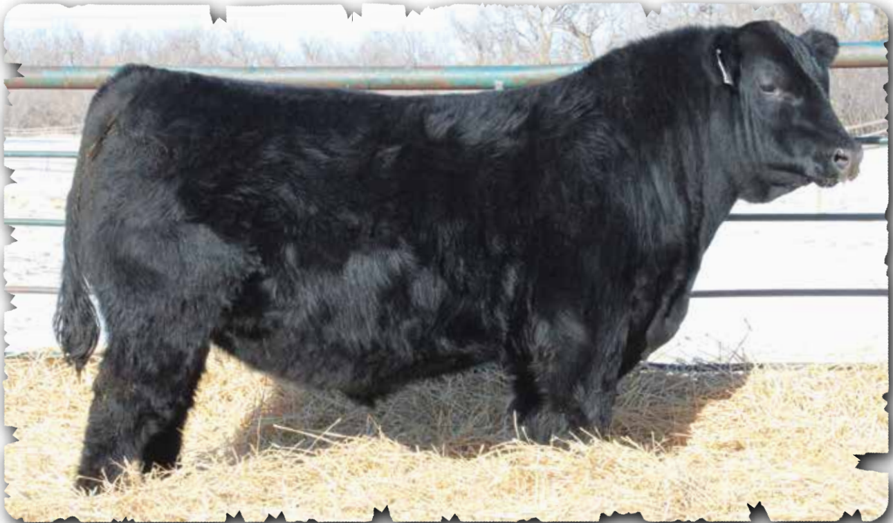
PEAK DOT NEWFOUND 3134K - LOT 83

The popular lot 1 $35,000 top selling Profound son in the 2021 Peak Dot Ranch Bull Sale. Newfound may be the most balanced individual ever raised at Peak Dot Ranch. He replicates the same unmistakable herd bull presence that his sire does. His eye catching phenotype and excellent feet have been appreciated by even the most astute cattle visitors. He weaned off just under 900lbs for a weaning ratio 117. His EPDs rank him in the top 1% for weaning weight, top 3% for yearling weight, and top 20% for marbling. His dam sired by Unanimous is as impressive as you will find. She has recently been successful flushed twice freezing 23 and 30 quality embryos per flush. Owned with Hillcrest Enterprises.