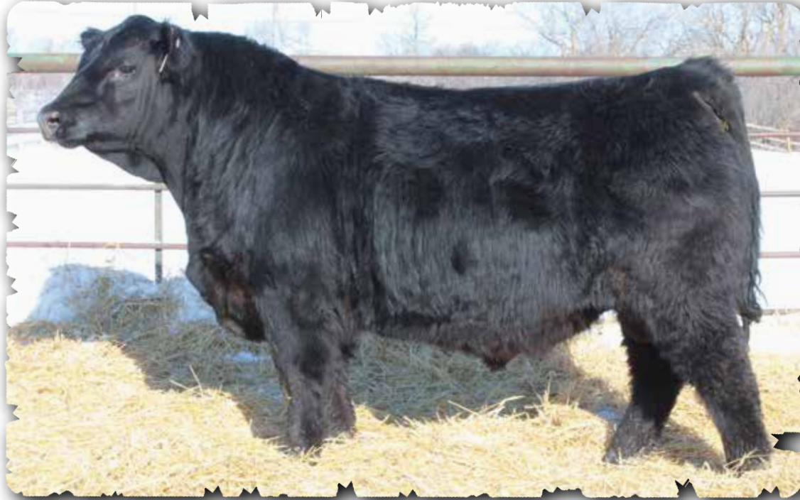
PEAK DOT EARNHARDT 558K - LOT 160