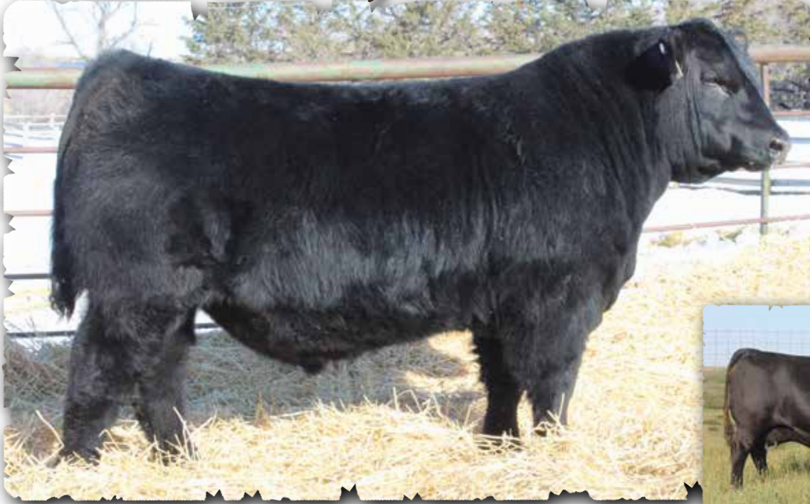
PEAK DOT ROUGHRIDER 3157K - LOT 75