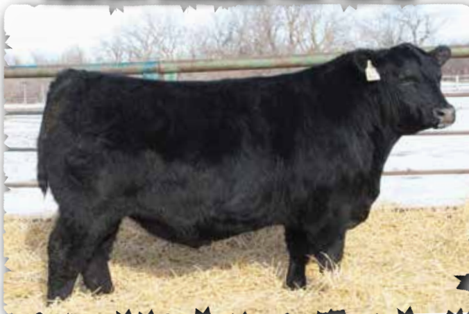
PEAK DOT COLOSSAL 95K - LOT 97