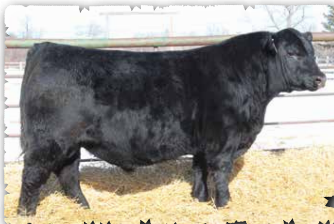
PEAK DOT BOOST 325K - LOT 119