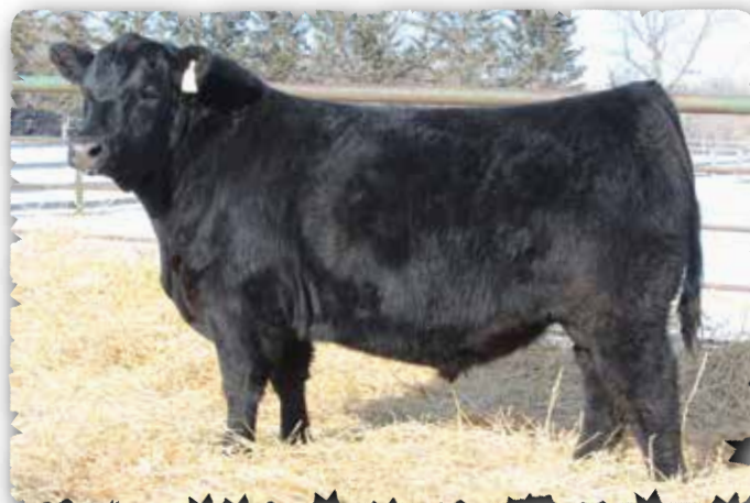
PEAK DOT BIG RIVER 108K - LOT 14