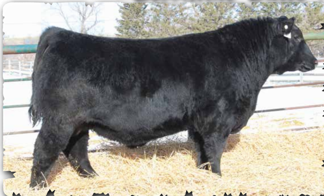
PEAK DOT BLOODLINE 716K - LOT 45