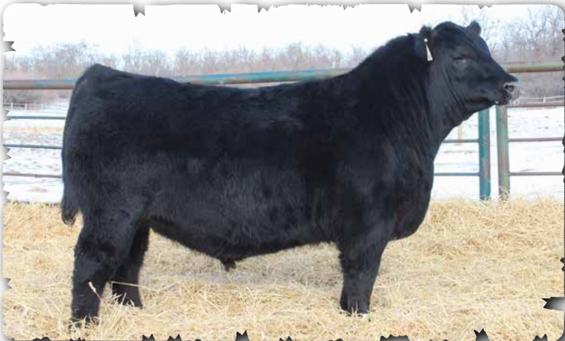
PEAK DOT ATTRACTIVE 396K - LOT 124

One of the top selling bulls we purchased along with Semex from the 2016 Schiefelbein sale. Attractive is a calving-ease bull that will add growth and a good set of feet and legs. His dam is one of the best cows we have found in all our travels. She has produced over $200,000 and is one of the main anchors in the Schiefelbein embryo program. Attractive has a great disposition and so do his sons.