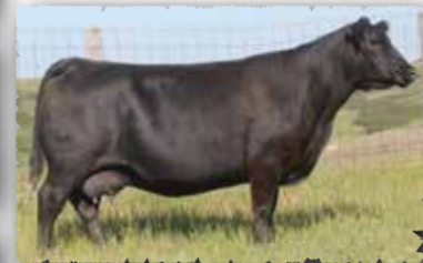
PEAK DOT LADY LAWN 551B The dam of lot 46 and 47