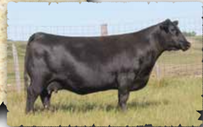
PEAK DOT PRISCILLA 239A The dam of lots 41, 42, 43, and 44