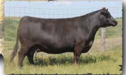
LADY OF PEAK DOT 62Y The grandam of lot 100