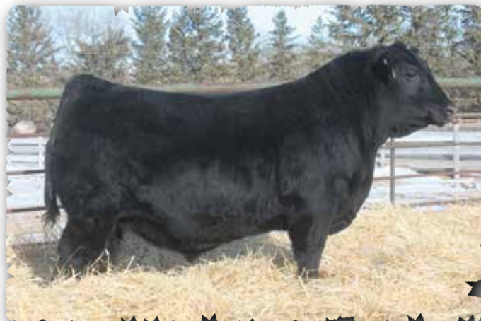
PEAK DOT NEWFOUND 83H

The maternal brother to lots 48, 49 and 50