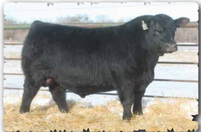
PEAK DOT ROUGHRIDER 3137K - LOT 73

>Recommended for heifers or cows >A fault free bull that is very solid in his structure. >Well built dam has a quality udder and abundant milk.