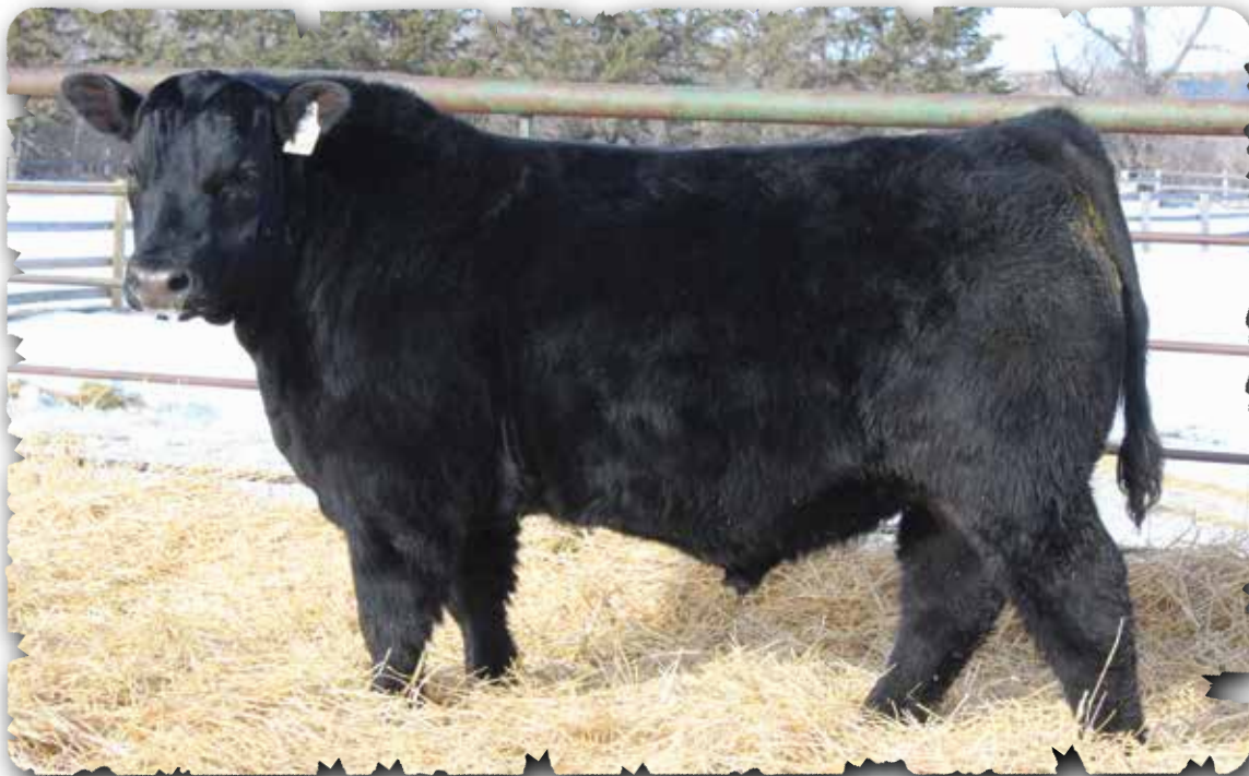
PEAK DOT PROFOUND 316K - LOT 86

Ellingson Profound is the crowd favorite and top selling bull from the 2019 Ellingson Angus Sale. He is regarded as one of the greatest bulls to come out of the Ellingson program. He offers next-generation power genetics for those who make their living selling feeder calves. His sons are stand outs in terms of muscle shape, vast body depth, volume, outstanding thickness and superior foot quality. Profound first sons topped the sale last year here at Peak Dot and also at Ellingson Angus in 2022. His dam is a second generation donor that records a production birth ratio of 2/98, a nursing ratio of 2/106, a yearling ratio of 2/106, an IMF ratio of 3/103, and a ribeye ratio of 3/102 and has settled to first service A.I. every year of her production career. The Profound daughters are equally as impressive, attractive fronted, naturally thick, soft made and easy fleshing.