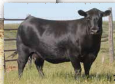
PEAK DOT MIA 247C The dam of lots 48, 49 and 50