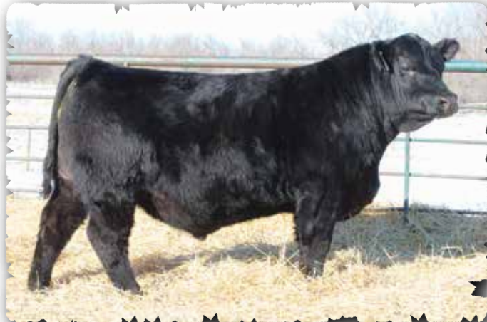
PEAK DOT BRUTUS 225K - LOT 137

>Recommended for heifers or cows. >Grandam is listed as an Elite Dam with the CAA. >A good one from a great cow. Stout-rumped and thick-quartered with plenty of style. Weaning ratio 103. >Dam is a beautiful brood cow with ideal body type, udder quality, fleshing-ability, docility and perfect feet. All very important traits.