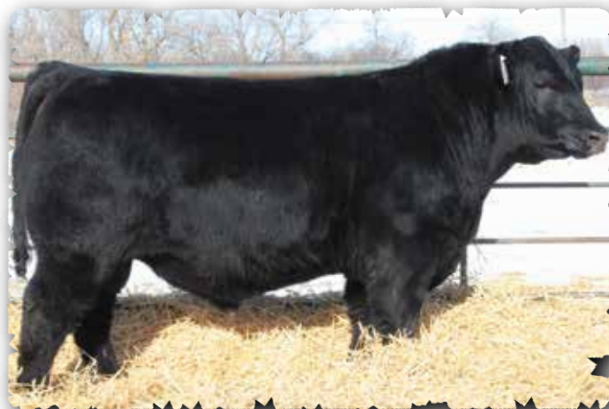
PEAK DOT BLOODLINE 802K - LOT 47