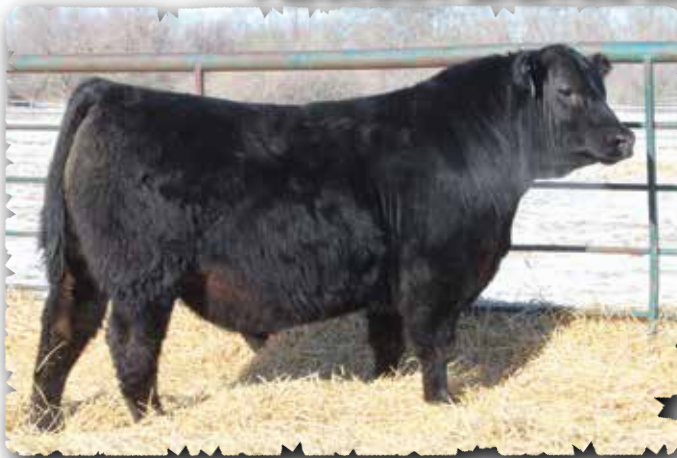
PEAK DOT BRUTUS 479K - LOT 143