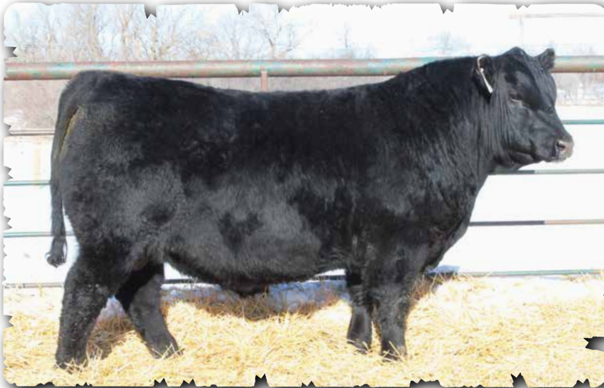
PEAK DOT NO DOUBT 3142K - LOT 185