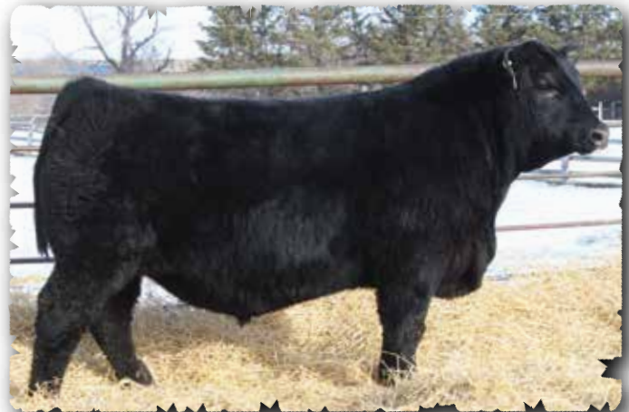
PEAK DOT COLOSSAL 516K - LOT 104