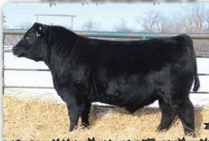
PEAK DOT BIG RIVER 47K - LOT 19