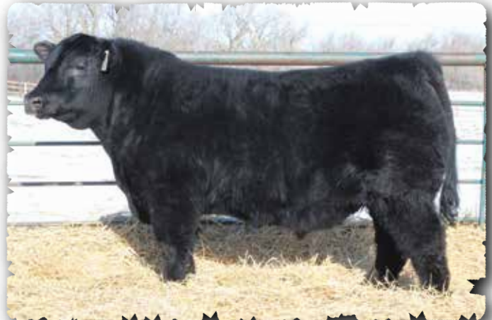
PEAK DOT LANCASTER 141K - LOT 67

>Recommended for heifers >A stylish, well muscled low birth weight bull that will leave nice looking daughters. Weaning ratio 101 >Top ranking hoof and claw EPDs. Dam is a Tour of Duty daughter with a near perfect udder backed by two generations of donors with over 75 combined progeny.