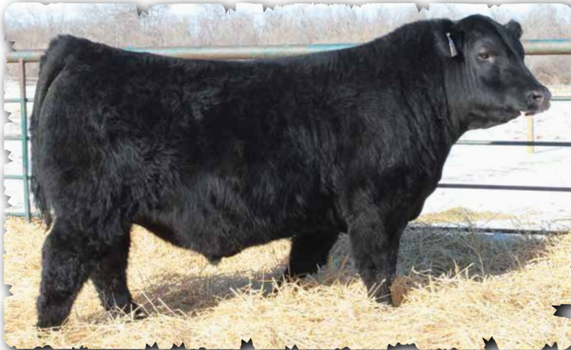
PEAK DOT LANCASTER 7K - LOT 63