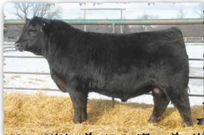
PEAK DOT BRUTUS 254K - LOT 141

>Recommended for cows >A performance bull with size, thickness, muscle, volume and natural fleshing-ability. Weaning ratio 111. >A maternal brother sold to Travis Klatt