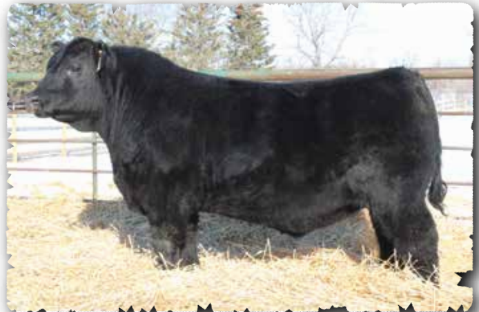
PEAK DOT LANCASTER 39K - LOT 68