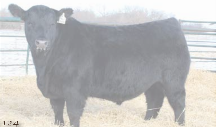
Lot 124 "Phenotype, performance and internal cow power"

>Recommended for heifers >A low birth weight bull with natural thickness and great performance. Weaning ratio 108. >Top 1% for weaning weight and yearling weight. Top 12% for marbling. >Grandam is listed as an Elite Dam with CAA.