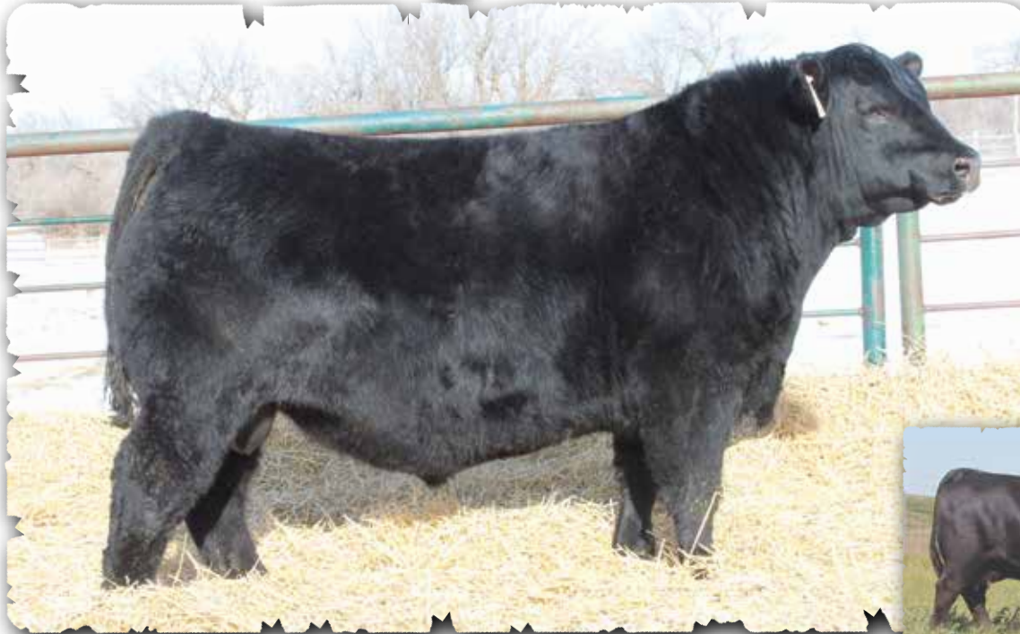
PEAK DOT COLOSSAL 65K - LOT 93