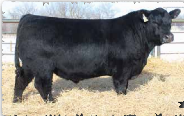
PEAK DOT BIG RIVER 713K - LOT 3

>Recommended for heifers or cows >Flush brothers. Calving ease bull with thickness, muscle and volume and performance. >They all posted moderate birth weights and weaning weights well over 800lbs. >A flush sister was the top selling Big River daughter in the 2022 Fall Sale. >Donor dam is a herd favorite with excellent femininity, fertility, feet and udder quality. Grandam is an Elite/Premier Dam with nursing ratio of 110 on her first four calves. She is also the dam of Peak Dot and Glassman Farms herd- sire Peak Dot Lancaster and Peak Dot and Hillcrest Enterprises herdsire Peak Dot Seedstock 38F.