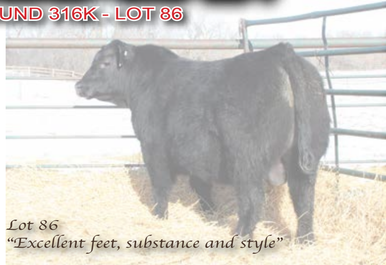
Lot 86 "Excellent feet, substance and style"

->Recommended for cows and heifers. ->Plenty of body capacity and thickness in this good bull. Top ranking foot scores. ->Weaning ratio 103. ->Dam is an excellent Roughrider daughter, thick made and easy fleshing.