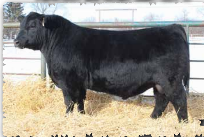
PEAK DOT BIG RIVER 84K - LOT 18