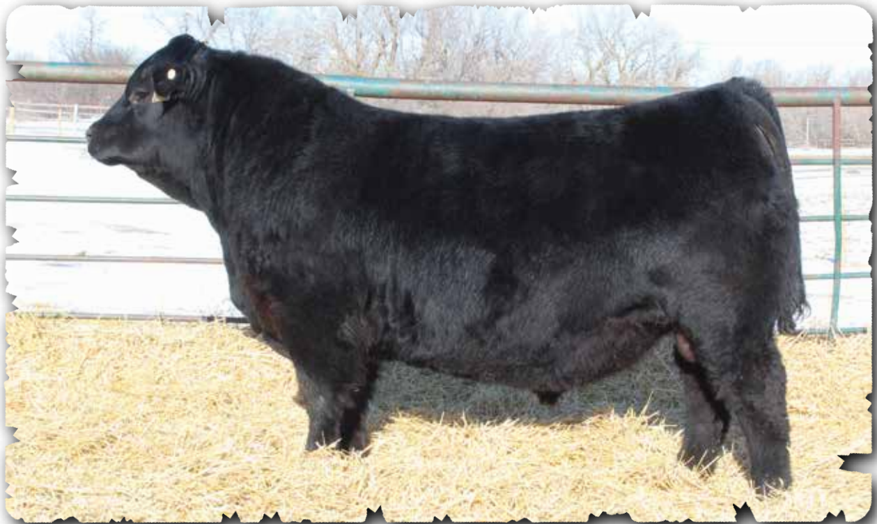
PEAK DOT TENDERLOIN 355K - LOT 148

Tenderloin was our top pick of the 2021 Poss bulls. He is an attractive, high marbling, thick made bull that combines calving-ease, performance, carcass and maternal traits along with a big scrotal and gentle disposition. His dam is one of Nolan Poss favorite cows in the Poss herd. He is bred very similar to the popular $900,000 Poss Deadwood with the combination of Poss Maverick and Poss Easy Impact 0119 in his pedigree make up. Owned with Semex Beef.