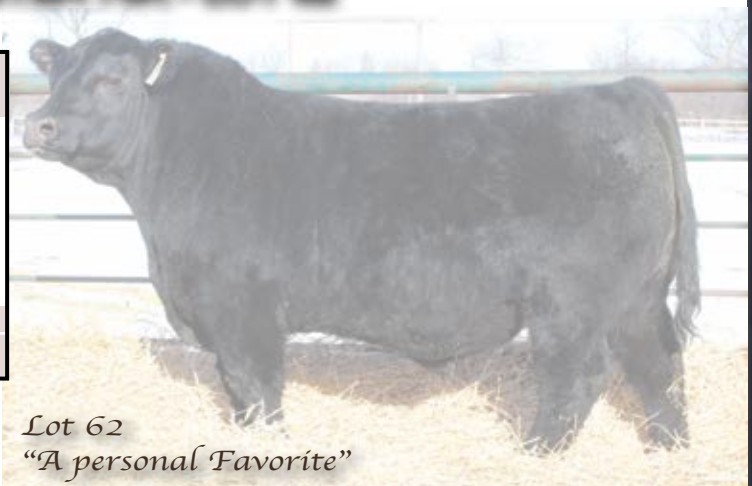
Lot 62 "A personal Favorite"

>Recommended for Cows >You will want to look this one up sale day. Muscle, power and pounds with structural integrity. >Top 1% for weaning weight and yearling weight EPDs. Weaning ratio 115. >Young dam has excellent feet and top ranking hoof EPDs.