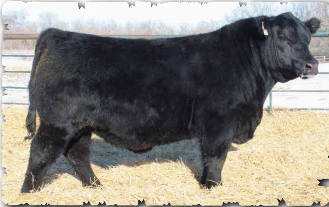
PEAK DOT NO DOUBT 28K - LOT 176