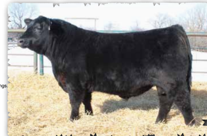
PEAK DOT THREE RIVERS 171K - LOT 35

>Grandam is listed as an Elite Dam with the CAA.