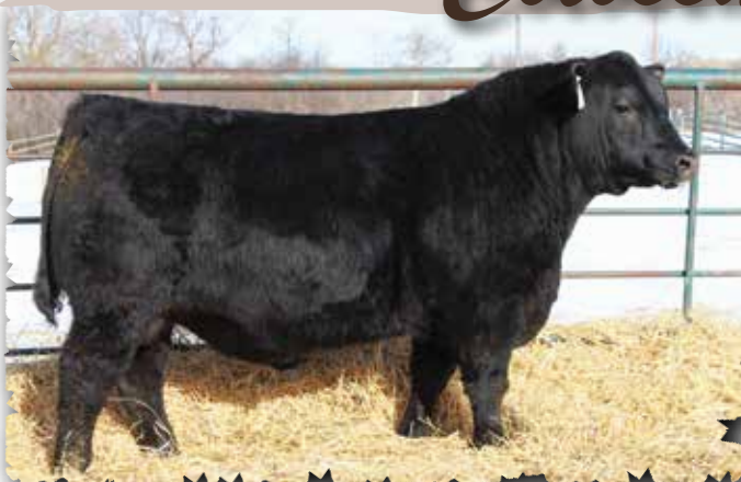
PEAK DOT COLOSSAL 115K - LOT 96