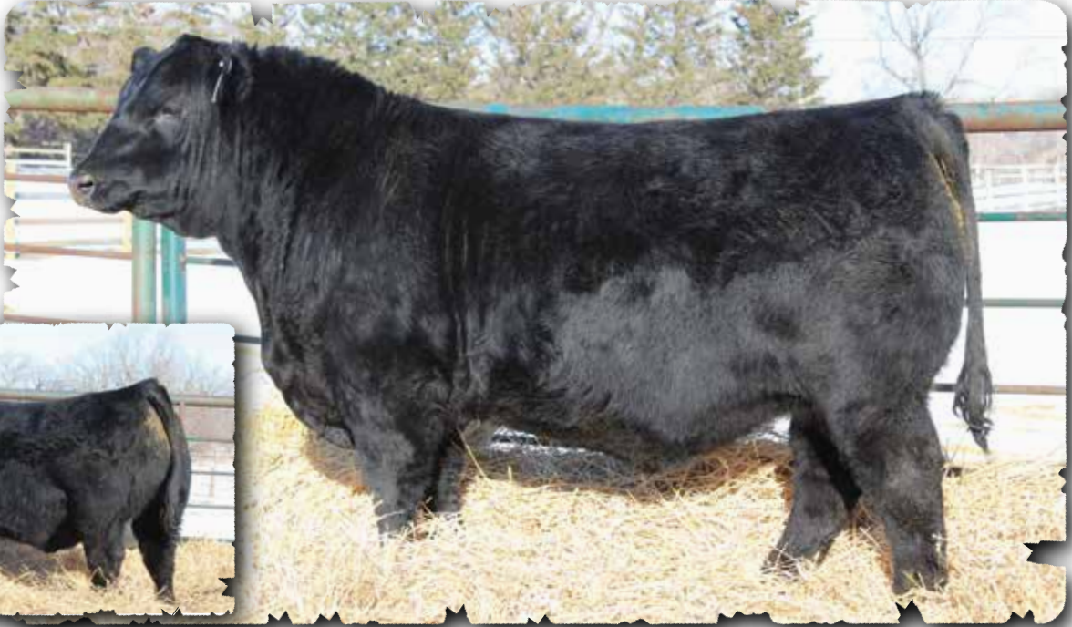
PEAK DOT GUARANTEE 712K - LOT 39