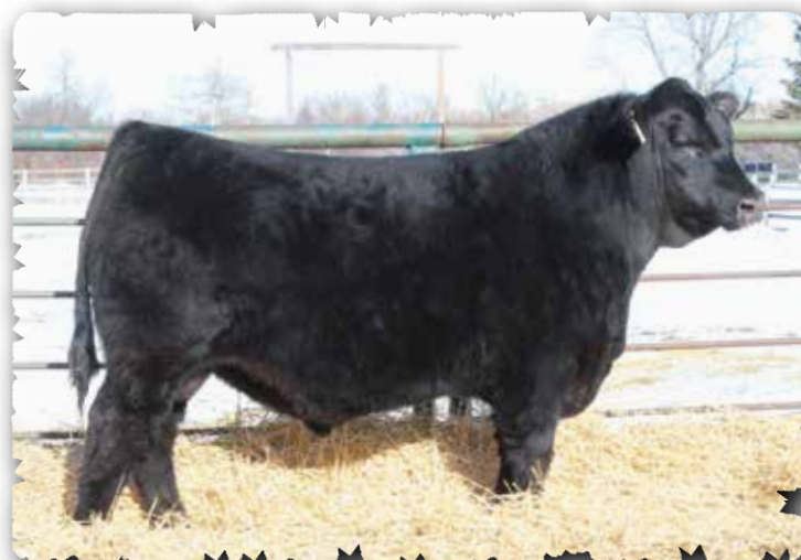
PEAK DOT TRUST 518K - LOT 60

>Recommended for cows or heifers >A bull with ample thickness and muscle shape. Weaning ratio of 100 >Top 1% for Milk EPD and the highest milk EPD bull in the sale. >Grandam is listed as an Elite Dam with the CAA.