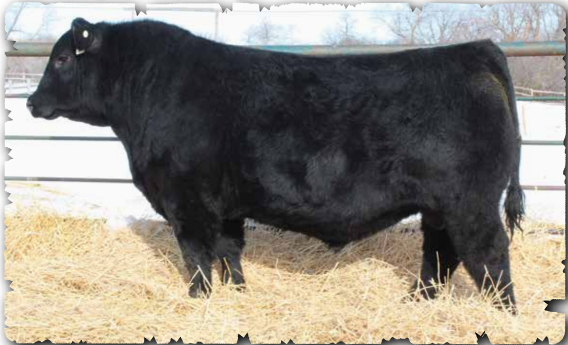
PEAK DOT THREE RIVERS 83K - LOT 28