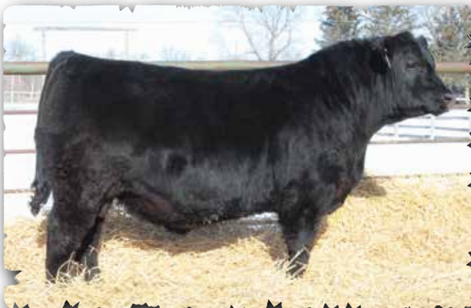
PEAK DOT BIG RIVER 99K - LOT 9