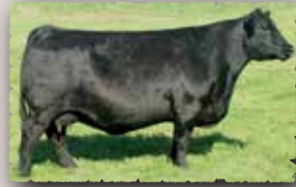
FROSTY ANSWER 3979 The dam of Attractive

One of the top selling bulls we purchased along with Semex from the 2016 Schiefelbein sale. Attractive is a calving-ease bull that will add growth and a good set of feet and legs. His dam is one of the best cows we have found in all our travels. She has produced over $200,000 and is one of the main anchors in the Schiefelbein embryo program. Attractive has a great disposition and so do his sons.