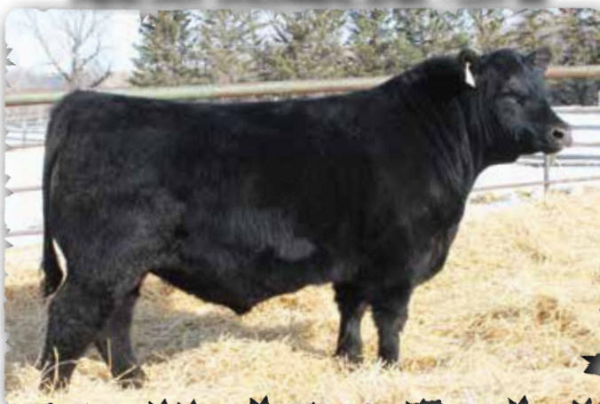
PEAK DOT COLOSSAL 308K - LOT 99