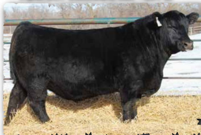
PEAK DOT COLOSSAL 273K - LOT 98