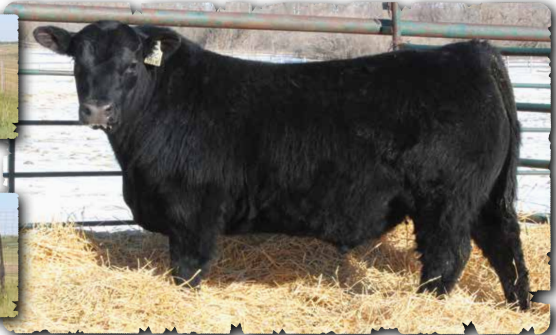
PEAK DOT LANCASTER 351K - LOT 66