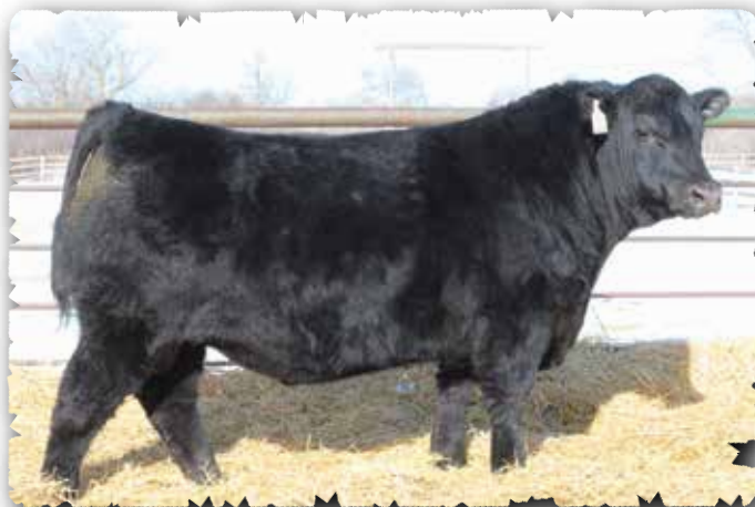
PEAK DOT BOOST 212K - LOT 113

>Recommended for heifers >A big, solid bull with lots of muscle expression and herd bull presence. Weaning ratio 108. >Ranks in the top 2% Weaning weight and yearling weight EPDs. Top 7% for marbling. Top 10% for REA. >Beautiful For Sure dam has top ranking EPDs for weaning weight, yearling weight and carcass weight.