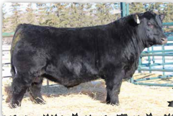
PEAK DOT LANCASTER 8K - LOT 64