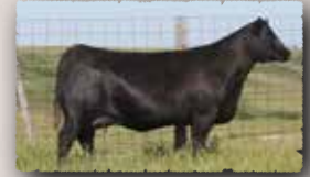
PEAK DOT QUEEN 303D The dam of Trust

Trust is gaining attention and is being used by several reputable commercial and purebred cattle ranches that just flat out like good, balanced, correct cattle with performance, eye-appealing phenotype and natural thickness. His dam has a flawless udder, good feet, true breed character and is one of the very best No Doubt daughters in the herd. You will want to keep all of his daughters. Contact: Semex Beef for semen.