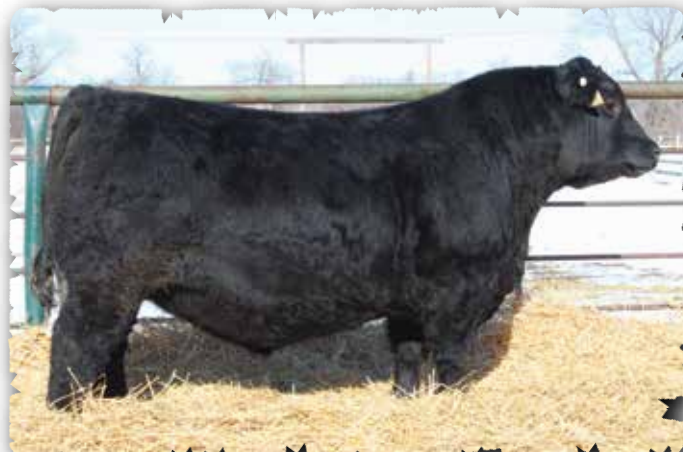
PEAK DOT BRUTUS 146K - LOT 131