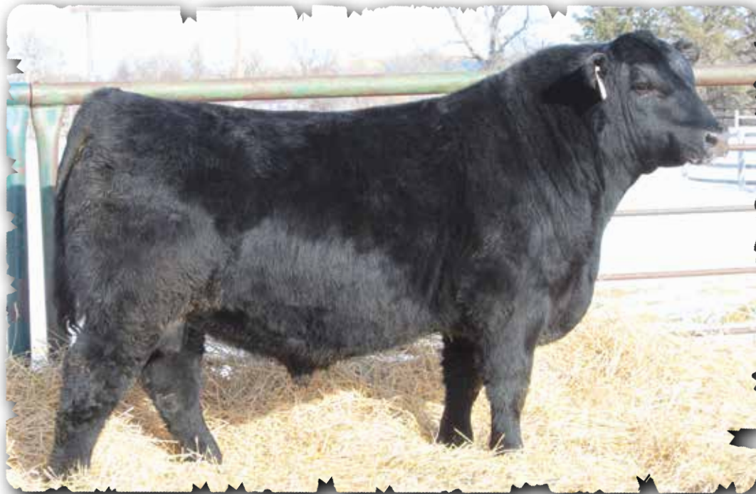
PEAK DOT BOOST 265K - LOT 117