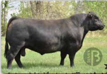
VARILEK GEDDES 7068 The sire of lot 51