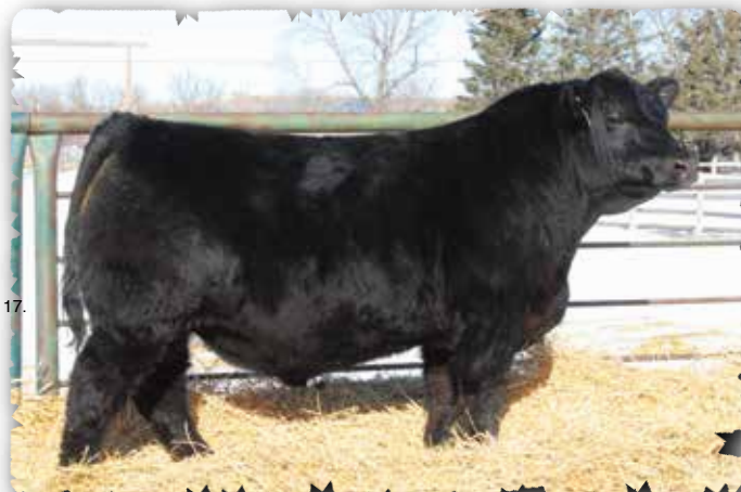
PEAK DOT BRUTUS 296K - LOT 134

>Recommended for heifers. A complete, well balanced bull with tremendous females in his make up. >Top 1% for weaning weight, yearling weight. >Dam and grandam are two of the most powerful cows you will find in body type and presence. Grandam has achieved Elite Dam status with the CAA.