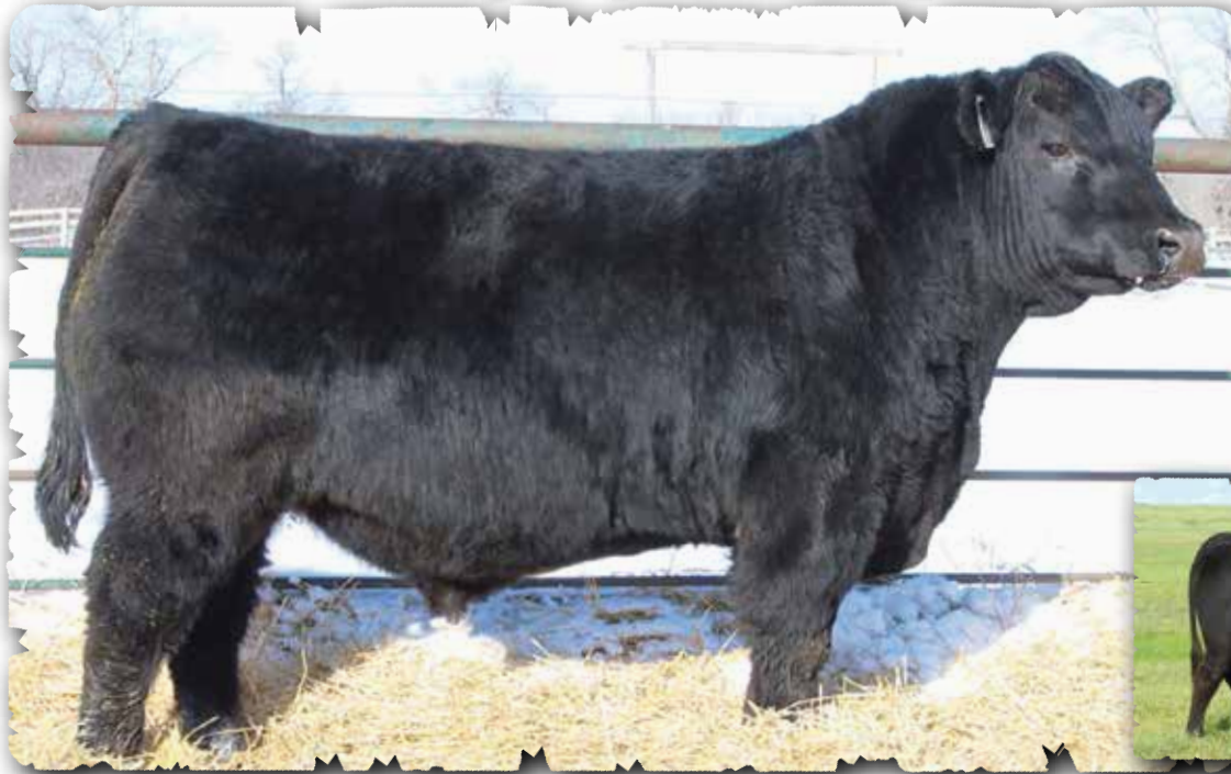
PEAK DOT NO DOUBT 42K - LOT 167