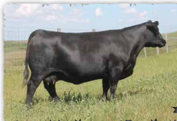
PEAK DOT LADY 532B The grandam of lot 145

>Recommended for cows >A well made bull blending thickness, substance, style and power. Weaning ratio 112. >Top 1% for weaning weight and yearling weight. Top 10% for REA. >Excellent females. Dams grandam is a donor. Great grandam is listed as a Elite dam with CAA.