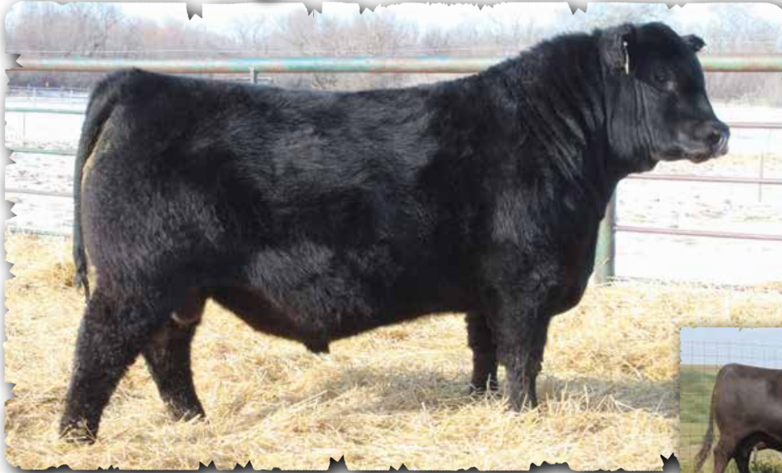
PEAK DOT COLOSSAL 426K - LOT 100