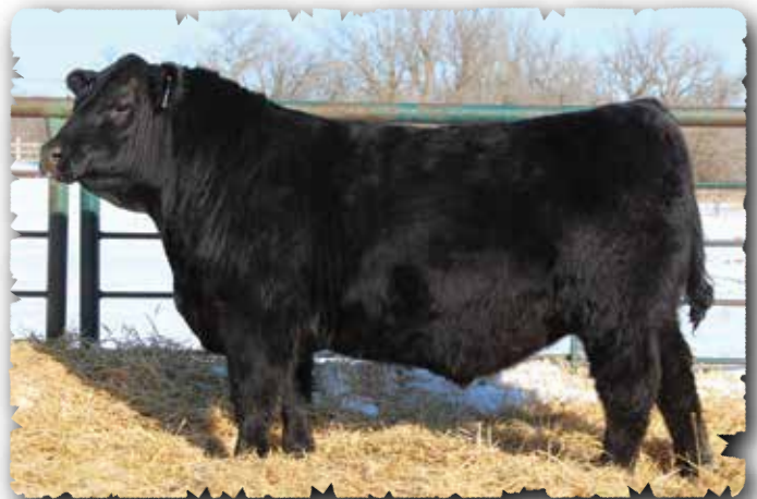
PEAK DOT TENDERLOIN 282K - LOT 151

>Recommended for heifers >Abundant body depth and thickness. Excellent number across the board. >Top 2% for weaning weight, yearling weight and carcass weight. Top 7% for marbling. >Dam is a feminine nice fronted stylish Ellingson Proposition daughter with a neat well attached udder.