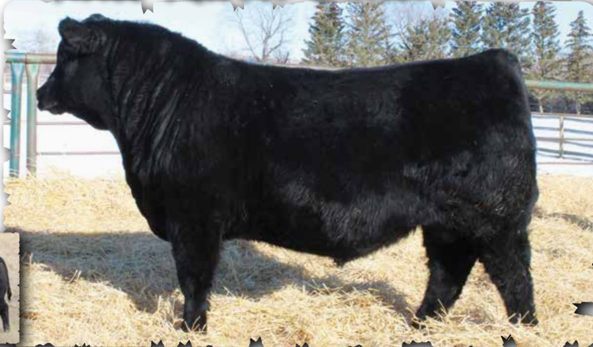
PEAK DOT JESSICA 115C