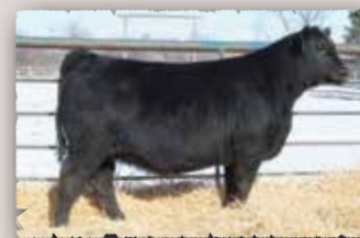
Ellingson Big River Daughter