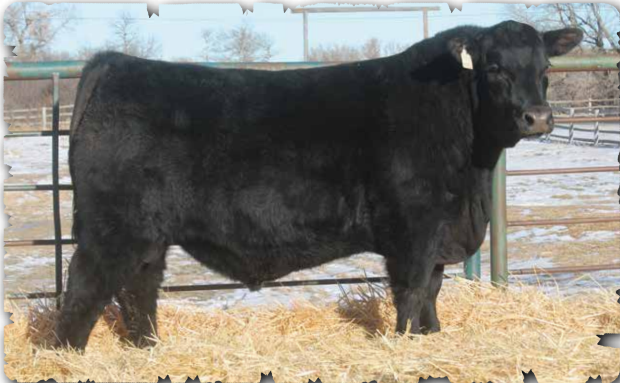
PEAK DOT PREDOMINANT 3150K - LOT 82

Predominant was one of the most influential herdsires ever purchased by Peak Dot Ranch. For years his sons topped sale after sale at Peak Dot and across the country. Commercial ranchers loved the Predominant sons for their excellent feet, added thickness and volume. We still have customers tell us some of the best bulls and females they ever owned were Predominant sons and daughters. Predominant daughters are beautiful broody females with extra body depth, capacity and excellent udders.