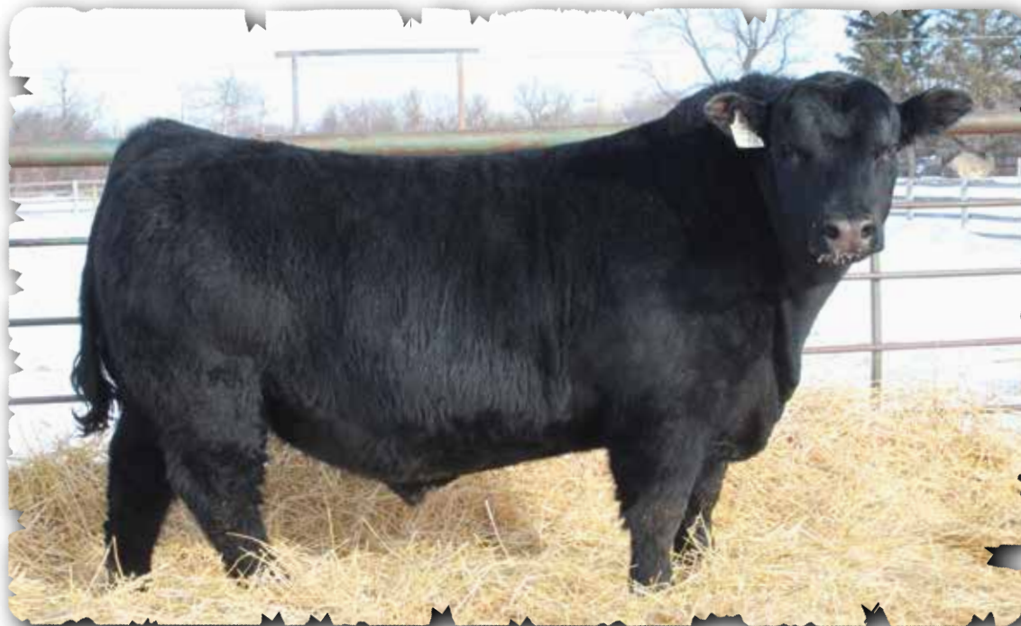
PEAK DOT THREE RIVERS 64K - LOT 21

Three Rivers has taken the breed by storm. As one of the heaviest utilized sires over the past couple of years in the breed, he has quickly become an ultra-proven sire. Improving skeletal size, length, pounds, bone and muscle density in a one-generation mating is not typically something done, but is consistently accomplished with Three Rivers. His performance EPDs have stayed as strong as they were after the first progeny data was turned in. His sons have an appetite for gain that we have never seen before. He will add legitimate pounds and power to your next load of feeder calves. Many of his sons should add length of body, shape, dimension, circumference of bone and a rugged look. His donor dam is a modest-sized Chaps daughter with abundant rib shape, a strong udder attachment, ideal teat size and near-perfect foot shape.