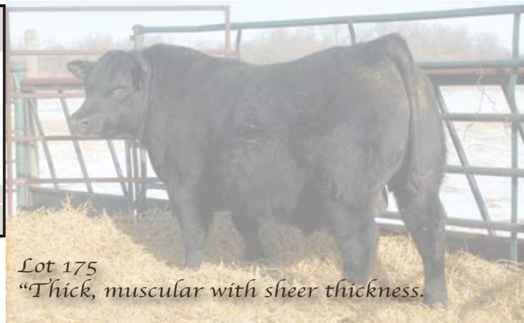
Lot 175 "Thick, muscular with sheer thickness."

>Recommended for heifers or cows >A well built bull with a tremendous top and muscular look. >Dam has neat well attached udder with small teat size.