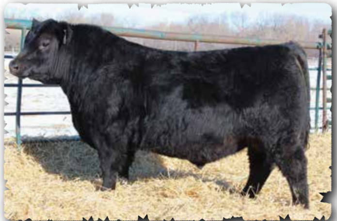
PEAK DOT TENDERLOIN 170K - LOT 150

>Recommended for heifers >Very stout made bull with lots of capacity, volume and thickness. Weaning ratio 108. >Ranks in the top 1% for weaning and yearling and carcass weight. Top 10% for marbling. >Dam is a moderate sized wide based.