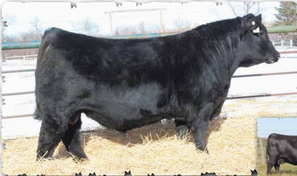
PEAK DOT BLOODLINE 702K - LOT 42