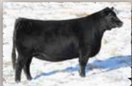
Peak Dot Lady 270G Purchased by Shawn Stadnyk for $10,000