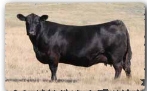
PEAK DOT BARDOLIA 19C The grandam of lot 148