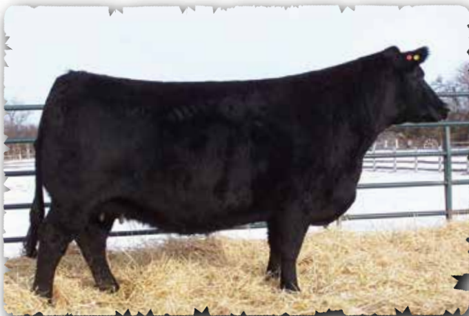
QUEEN OF PEAK DOT 652S The grandam of lot 189