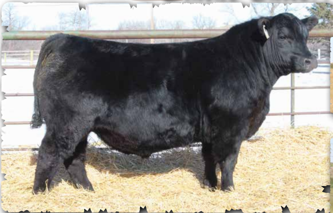
PEAK DOT BRUTUS 256K - LOT 133