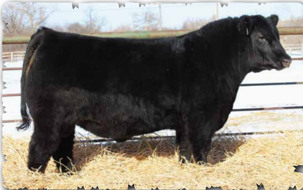
PEAK DOT MOSAIC 20K - LOT 52