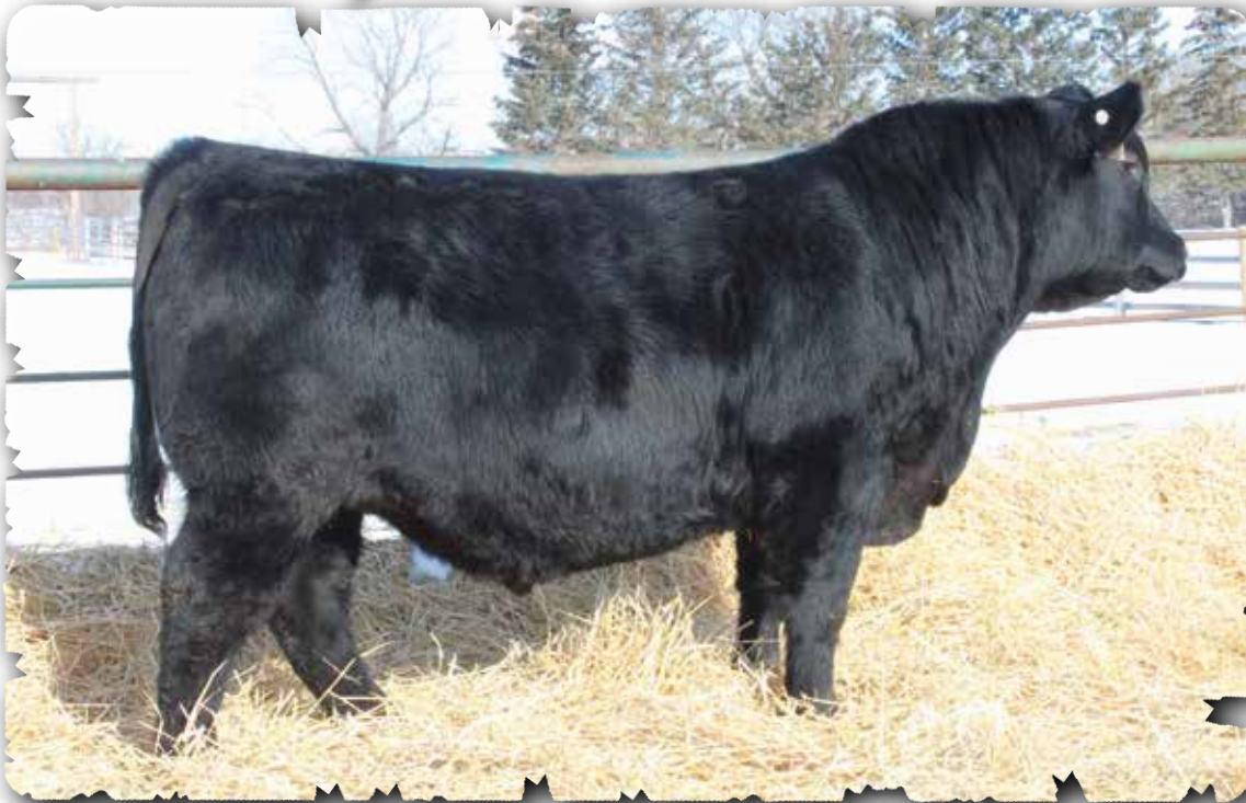
PEAK DOT BIG RIVER 3135K - LOT 5