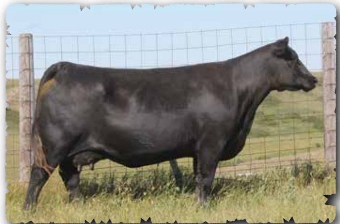
PEAK DOT LADY 1030A The grandam of lot 116

>Recommended for heifers or cows >A chunk, Very correct well made bull. Lots of spring in his ribs. Weaning ratio 110. >Top 1% for weaning weight, yearling weight. Top 5% for REA. >Dam is a favorite among the calving crew due to her perfect udder structure and outstanding phenotype. >Grandam is beautifully designed, nice uddered, deep ribbed and nice fronted donor with 35 progeny.