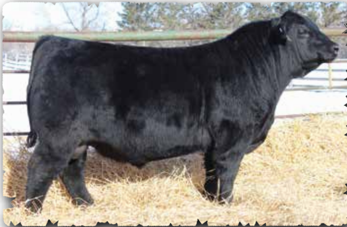
PEAK DOT BIG RIVER 3138K - LOT 8