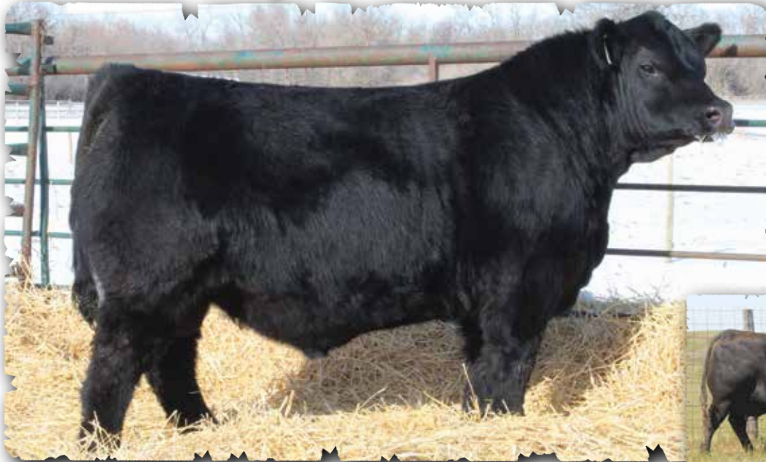
PEAK DOT BIG RIVER 68K - LOT 10