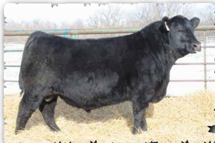
PEAK DOT ATTRACTIVE 580K - LOT 126

>Recommended for heifers >A bull with eye appeal and superb correctness. Weaning ratio 101. >Dam has produced several featured bulls in past sales selling to Forwood Farms, Mertz Ranch, Herb Friesen, Seven Blackfoot Ranch, Brad Gjermundsen and Remington Land and Cattle.