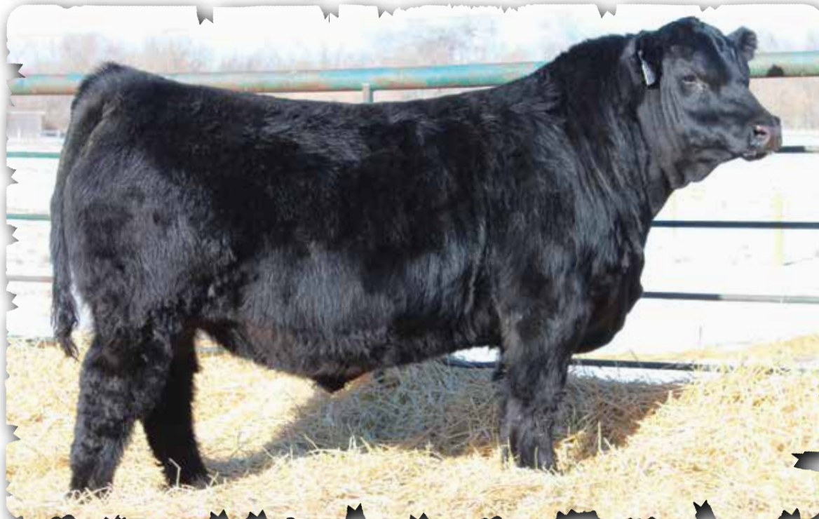
PEAK DOT BRUTUS 476K - LOT 145