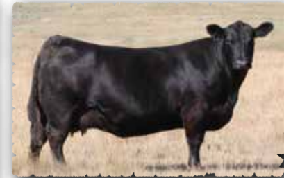
PEAK DOT BARDOLIA 19C The grandam of lot 114