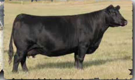
PEAK DOT MIA 2058D The dam of lot 136