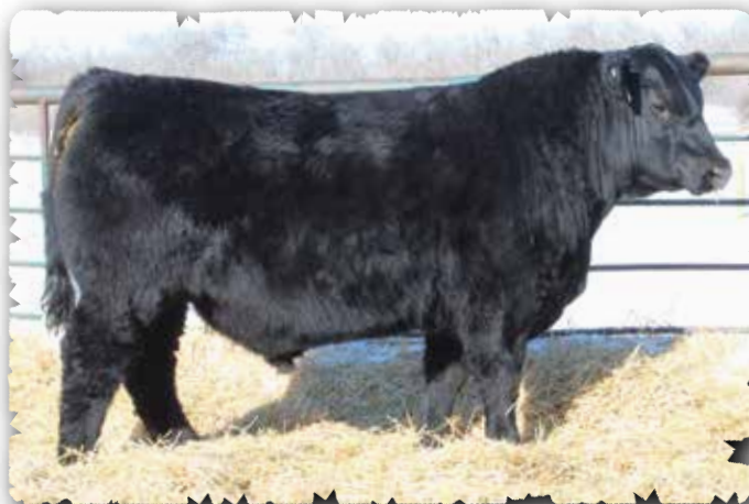
PEAK DOT FORE SURE 495K - LOT 189