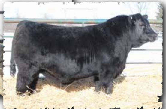
PEAK DOT ROUGHRIDER 3130K - LOT 72