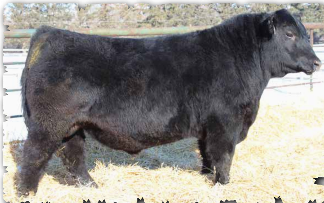
PEAK DOT NO DOUBT 37K - LOT 175

Peak Dot No Doubt 325D is a powerhouse and a big time performer. We decided to use him back in the herd for his length, muscle, superb feet and excellent fertility and scrotal development. His highly productive dam is listed as an Elite/Premier Dam with the CAA. She has an average weaning ratio of 107 on her last five calves. She is a SAV Eliminator daughter with a perfect udder and abundant milk.