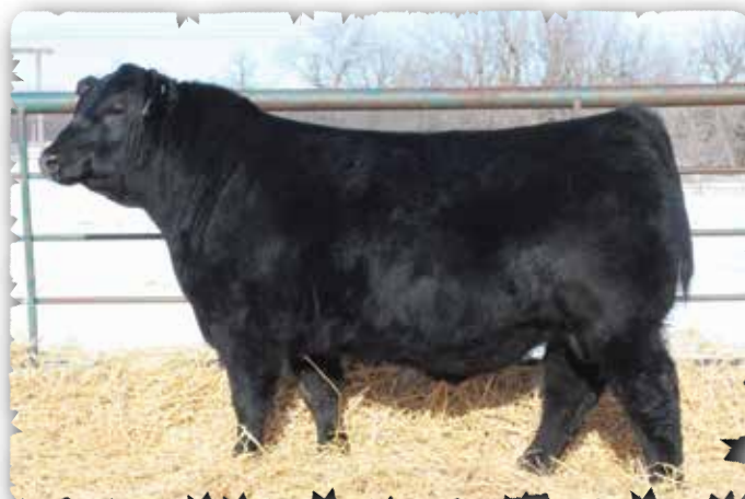
PEAK DOT BIG RIVER 438K - LOT 16