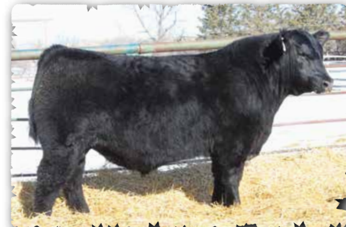
PEAK DOT COLOSSAL 510K - LOT 105

>Recommended for cows >Excellent performance. Top 1% for weaning and yearling EPD. Top 1% for REA. Top 10% for marbling. >Should sire sale topper calves with tremendous thickness and added length. >Grandam is a deep made easy fleshing donor with 11 progeny.