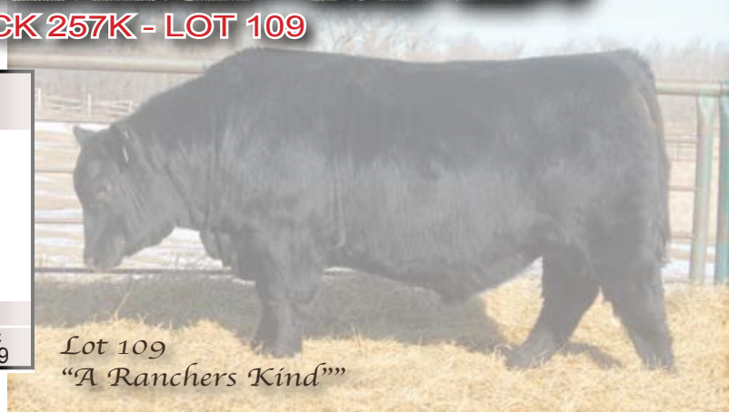
Lot 109 "A Ranchers Kind"