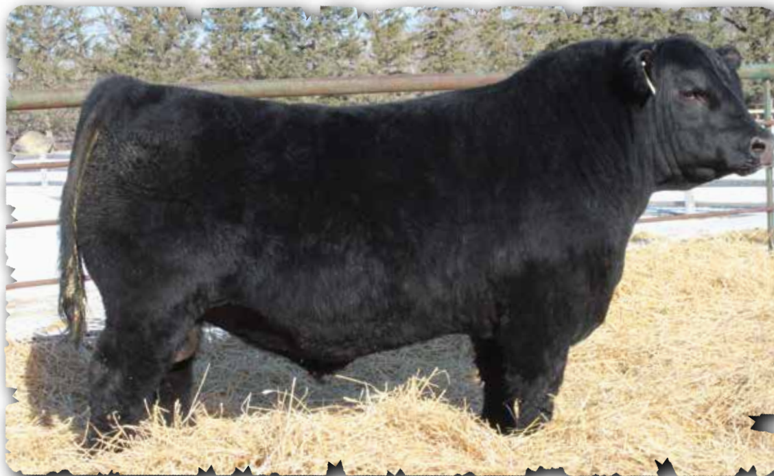
PEAK DOT LANCASTER 73K - LOT 62

Lancaster is a rugged built stock bull with true muscle definition, extra ribshape and real performance. He was the featured lot 2 bull in the Spring 2020 Bull Sale selling to Glasman Farms for $56,000. His progeny display a nice pattern with body depth, fleshing ability and real muscle shape. His dam is a very well made SAV Eliminator 9105 daughter that ranks near the top for milk and marbling. She is also the dam of the $25,000 Peak Dot and Hillcrest Enterprises herdsire Peak Dot Seedstock 38F. Her son Peak Dot Profound 110J sold in last years sale for $20,000 to Yarrow Creek. Her son sired by Three Rivers sells as lot 32.