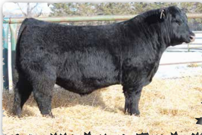
PEAK DOT BOOST 166K - LOT 112

>Recommended for heifers >A good looking bull smooth and athletic in his movement. Durable and built for ranch country. >Top 1% for weaning and yearling weight. Dam is moderate with an attractive front.