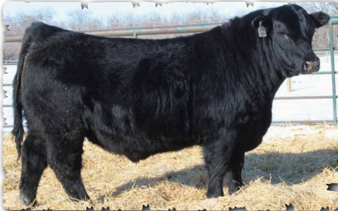
PEAK DOT EARNHARDT 471K - LOT 163