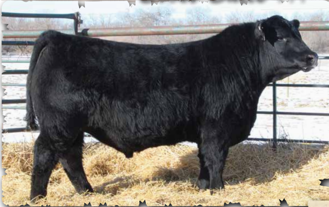
PEAK DOT BOOST 183K - LOT 120