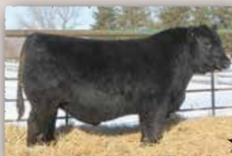
PEAK DOT MOSAIC 804G Purchased by SSS Angus for $60,000