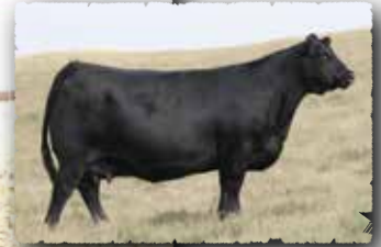
PEAK DOT PRIDE 13F The dam of lots 2,3,4