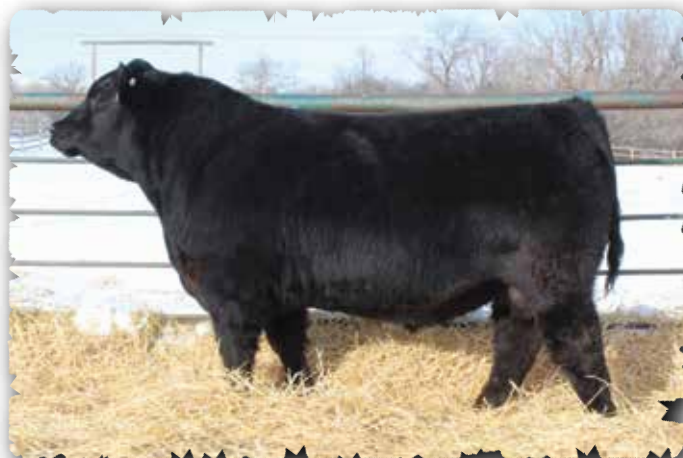
PEAK DOT THREE RIVERS 78K - LOT 26