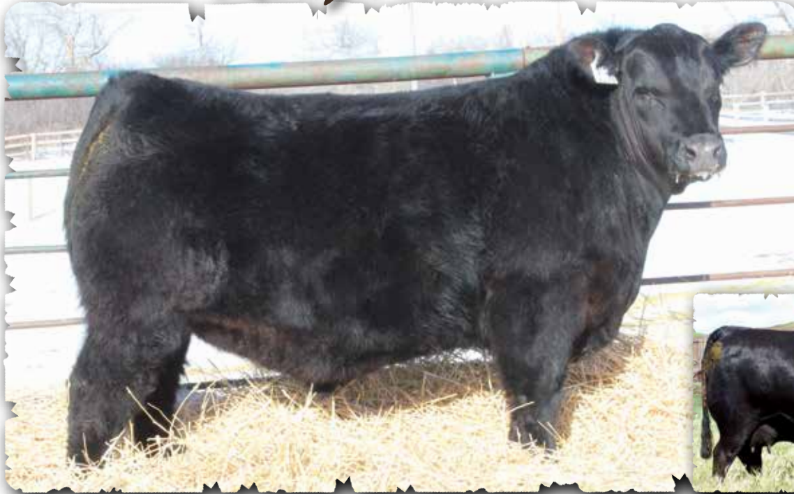
PEAK DOT ROUGHRIDER 3156K - LOT 78