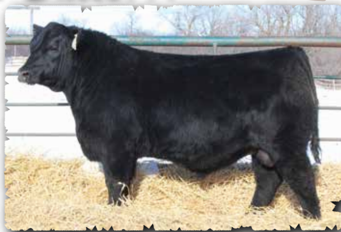
PEAK DOT BIG RIVER 193K - LOT 17

>Recommended for cows. >A powerful herd sire that covers all the basics. >Grandam is a embryo donor.