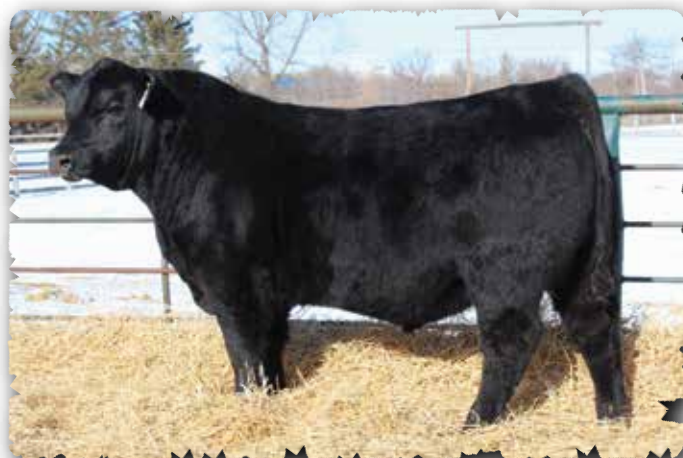
PEAK DOT THREE RIVERS 165K - LOT 27