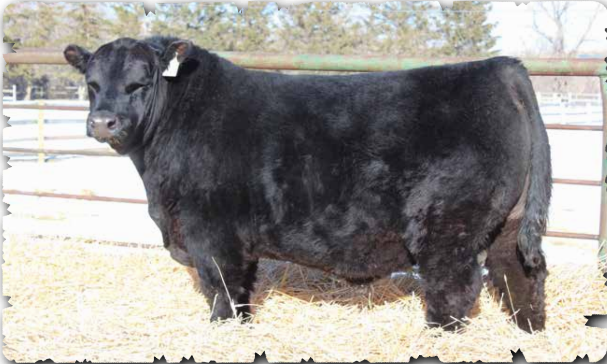
PEAK DOT TENDERLOIN 210K - LOT 149