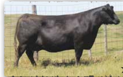
HEROINE OF PEAK DOT 225Z The dam of lot 170

>Recommended for heifers >A superior calving ease bull with bred in maternal value. >Top 10% for marbling. Weaning ratio 105. >Dam Peak Dot 225Z is a major contribution to the Peak Dot Herd with 54 progeny. She raised the top selling flush of bulls in last years sale and has several daughters in the herd.