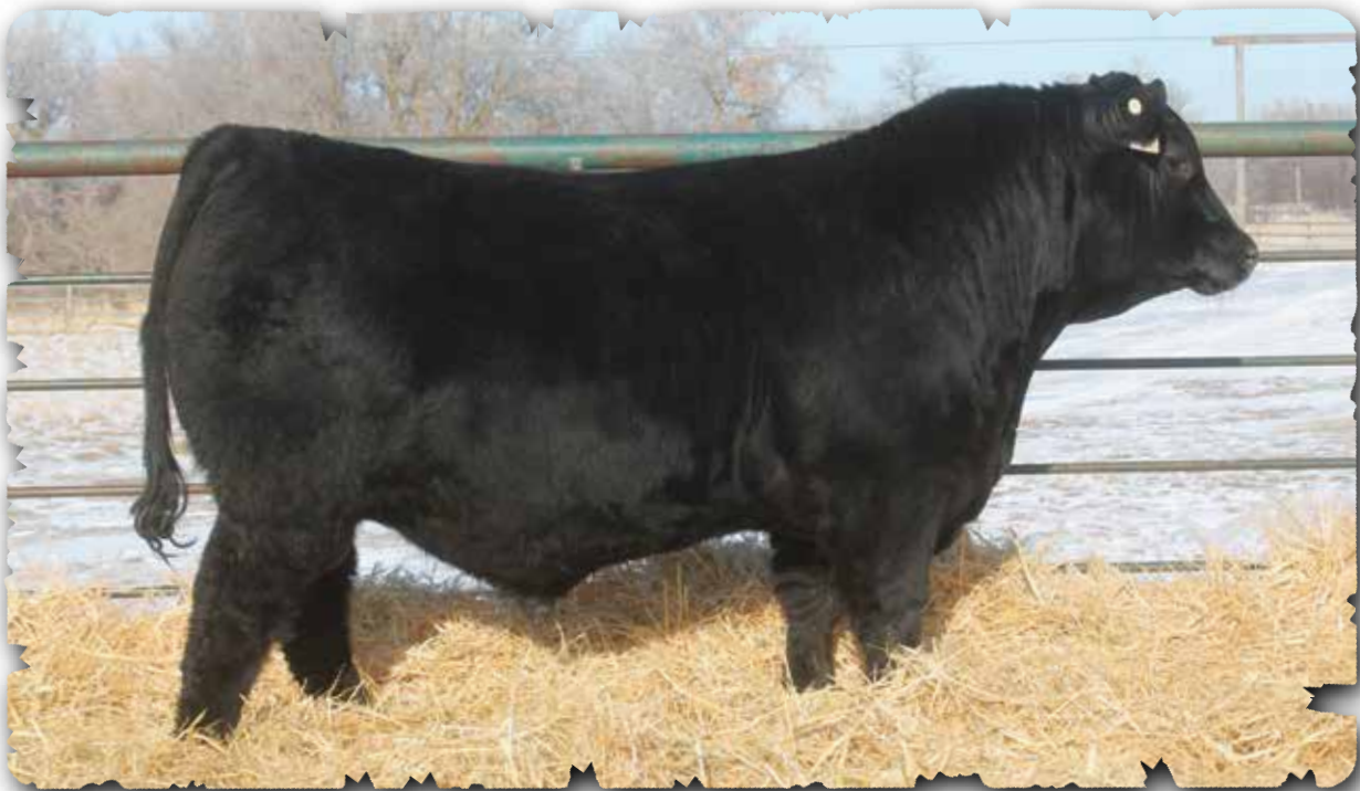
PEAK DOT COLOSSAL 81K - LOT 92

A highly respected, proven calving-ease sire. He has unmatched body mass and rib shape that is rarely seen in a top ranking calving ease sire reinforcing his strong CE number. Colossal sons can be used with confidence on virgin heifers without sacrificing thickness muscle and performance. Along with his exceptional calving-ease credentials he offers a magnificent maternal value. His maternal lineage has many generations of highly fertile, strong footed and great uddered females. Owned with Semex Beef.