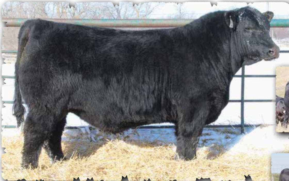
PEAK DOT EARNHARDT 174K - LOT 157