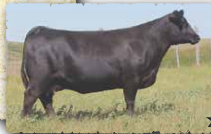
PEAK DOT HEATHER 541B The grandam of lots 93, 94, and 95