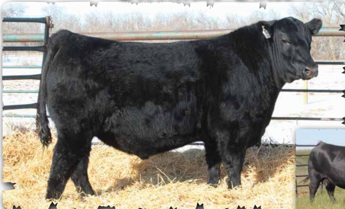
PEAK DOT BLOODLINE 805K - LOT 48