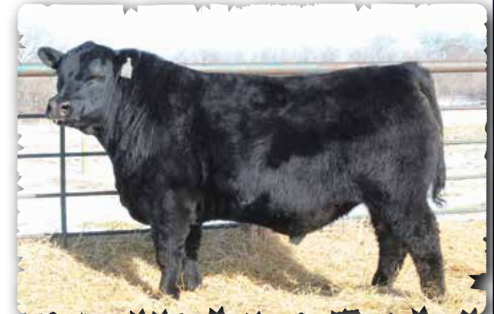
PEAK DOT EARNHARDT 485K - LOT 162

>Recommended for heifers >A stout made bull that moves around the pen with ease. Weaning ratio 105. >Ranks in the top 20% for marbling EPDs. and top 9% for milk EPD. >Dam is a well made No Doubt daughter with a quality udder.