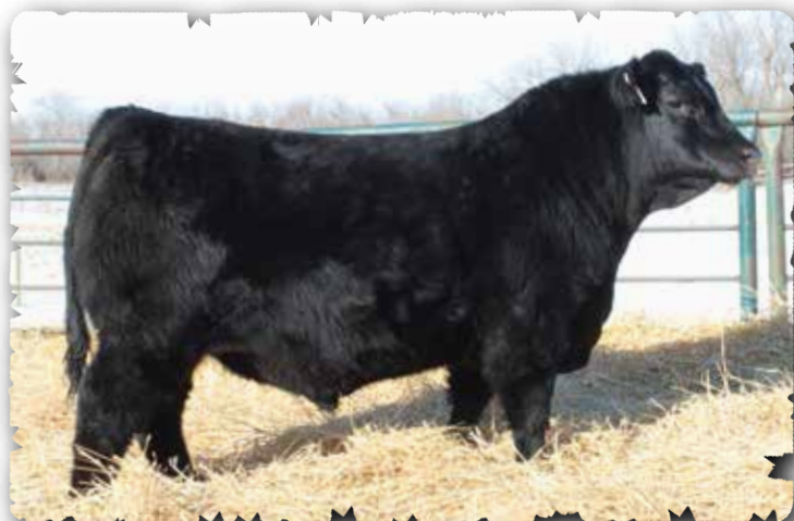
PEAK DOT TRUST 38K - LOT 56

>Recommended for heifers or cows >An eye-catching individual with explosive performance and stoutness. Top 6% for REA. >Weaning ratio 107 >Grandam is listed as an Elite Dam with the CAA.