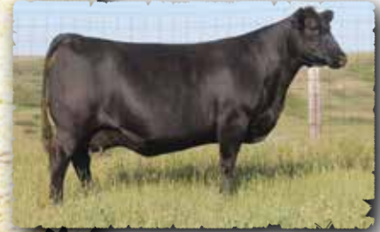
QUEEN OF PEAK DOT 936Y The grandam of lot 142