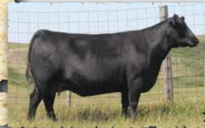
PEAK DOT DUCHESS 305B The grandam of lot 133