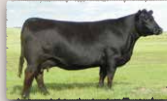
ERICA OF PEAK DOT 478U

CED +10 BW +1.1 WW +71 YW +129 MILK +25 CLAW +37 ANGLE +37 RE +.67 MARB +.56 $C +324