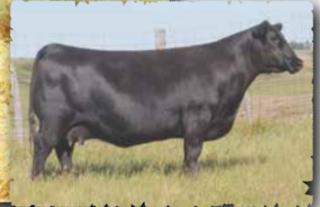
PEAK DOT PRISCILLA 239A The grandam of lot 122