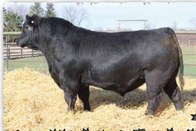
PEAK DOT BRUTUS 2020K - LOT 42

>Recommended for heifers >Plenty of body capacity and thickness in this good looking bull. Yearling ratio 119. >Dam has excellent production record. Raised several featured bulls in past sales.