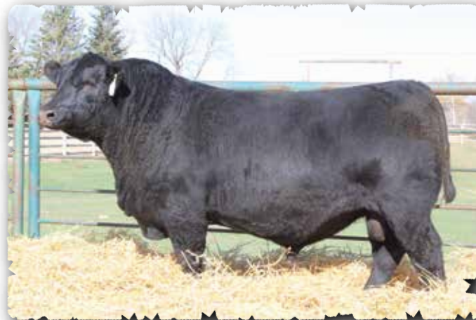
PEAK DOT COLOSSAL 2072K - LOT 6