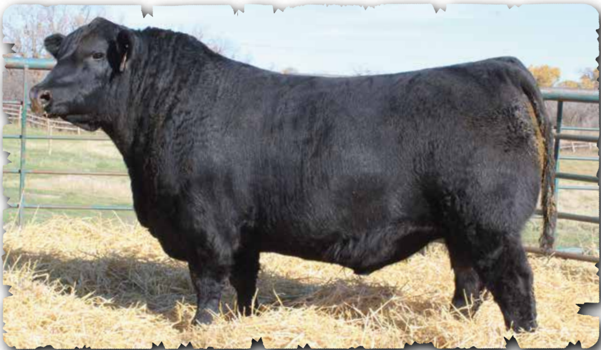
PEAK DOT COLOSSAL 2075K - LOT 1

A highly respected, proven calving-ease sire. He has unmatched body mass and rib shape that is rarely seen in a top ranking calving ease sire reinforcing his strong CE number. Colossal sons can be used with confidence on virgin heifers without sacrificing thickness muscle and performance. Along with his exceptional calving-ease credentials he offers a magnificent maternal value. His maternal lineage has many generations of highly fertile, strong footed and great uddered females. Owned with Semex Beef.