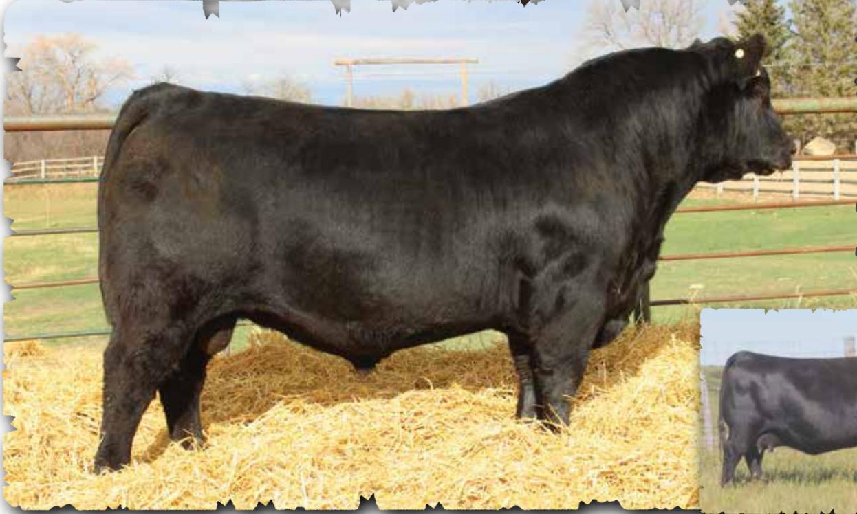
PEAK DOT EARNHARDT 430K - LOT 122