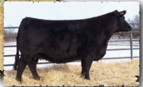
QUEEN OF PEAK DOT 652S The grandam of lot 118