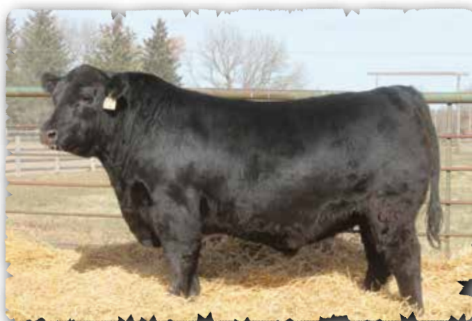
PEAK DOT BRUTUS 2113K - LOT 45

>EPDs rank him in the Top 1% for weaning weight and top 3% for yearling weight..