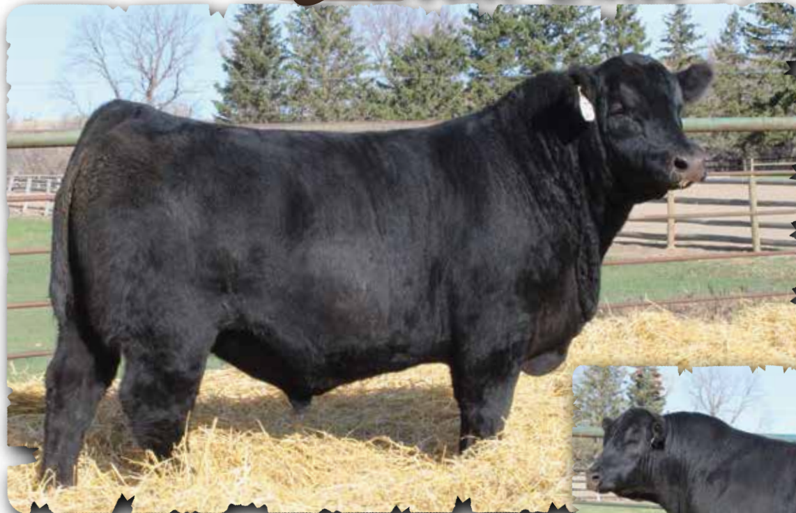
PEAK DOT COLOSSAL 2198K - LOT 22