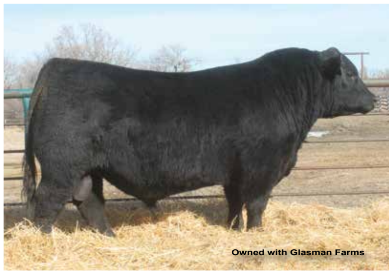
Owned with Glasman Farms

CONNEALY EARNAN 076E ELLINGSON ROUGHRIDER 4202 EA BLACKLASS 8914 PEAK DOT LANCASTER SAV ELIMINATOR 9105 PEAK DOT PRIDE 88B PRIDE OF PEAK DOT 11Y