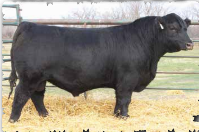
PEAK DOT ATTRACTIVE 574K - LOT 126