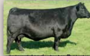
FROSTY ANSWER 3979 The dam of Attractive

One of the top selling bulls we purchased along with Semex from the 2016 Schiefelbein sale. Attractive is a calving-ease bull that will add growth and a good set of feet and legs. His dam is one of the best cows we have found in all our travels. She has produced over $200,000 and is one of the main anchors in the Schiefelbein embryo program. Attractive has a great disposition and so do his sons.