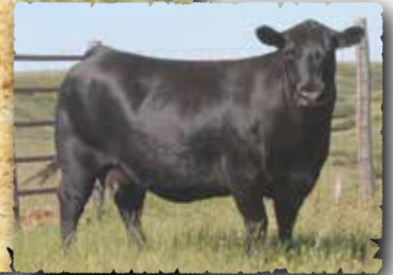
PEAK DOT MIA 247C The dam of lot 132