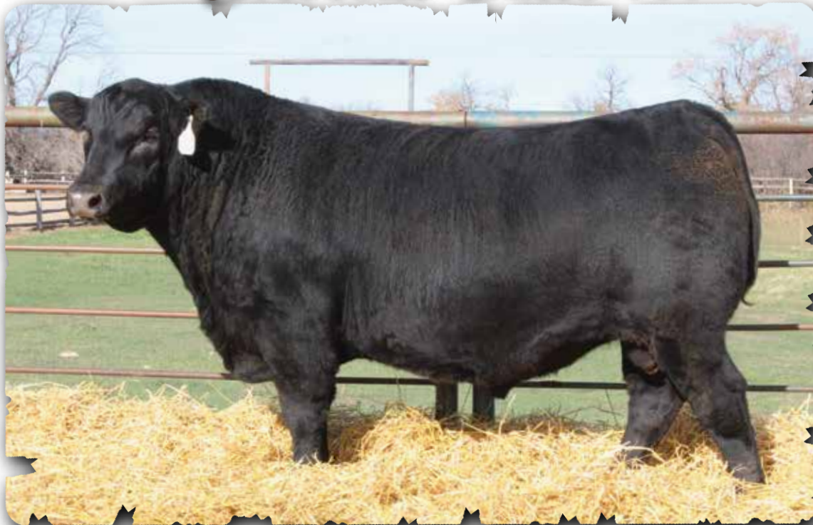
PEAK DOT COLOSSAL 2102K - LOT 16