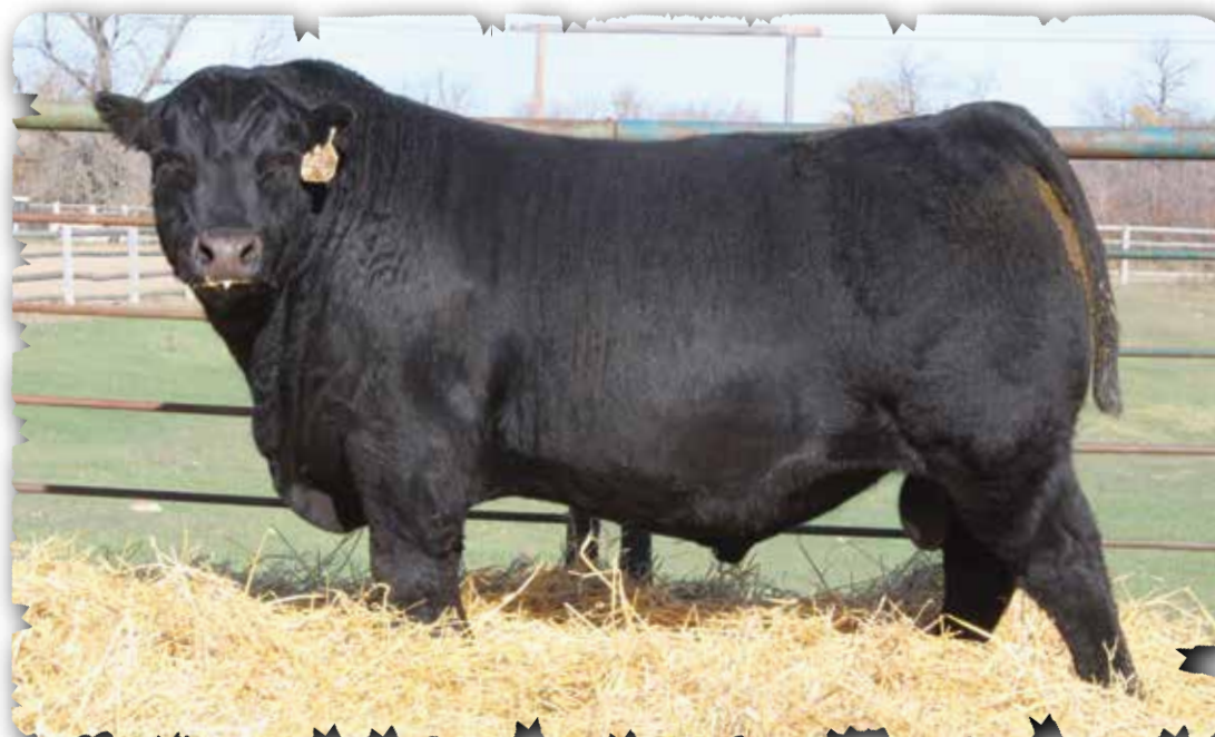
PEAK DOT COLOSSAL 2095K - LOT 7