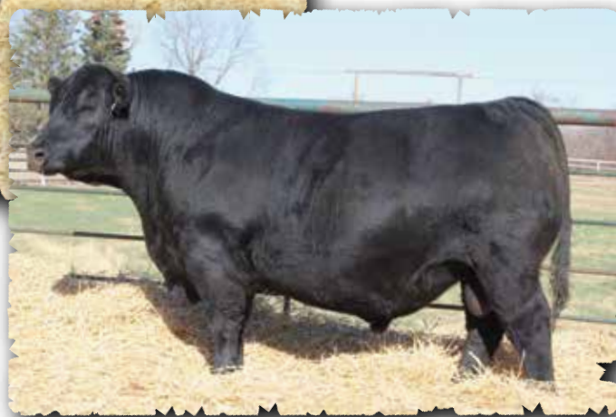
PEAK DOT COLOSSAL 114K - LOT 23

>Recommended for heifers >A stylish, well muscled low birth weight bull that will leave nice looking daughters. >Yearling ratio 107. Top 6 % for REA.