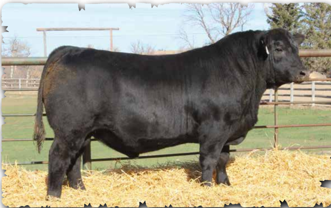
PEAK DOT PROFOUND 2312K - LOT 66

Ellingson Profound is the crowd favorite and top selling bull from the 2019 Ellingson Angus Sale. He is regarded as one of the greatest bulls to come out of the Ellingson program. He offers next-generation power genetics for those who make their living selling feeder calves. His sons are stand outs in terms of muscle shape, vast body depth, volume, outstanding thickness and superior foot quality. Profound first sons topped the sale last year here at Peak Dot and also at Ellingson Angus in 2022. His dam is a second generation donor that records a production birth ratio of 2/98, a nursing ratio of 2/106, a yearling ratio of 2/106, an IMF ratio of 3/103, and a ribeye ratio of 3/102 and has settled to first service A.I. every year of her production career. The Profound daughters are equally as impressive, attractive fronted, naturally thick, soft made and easy fleshing.