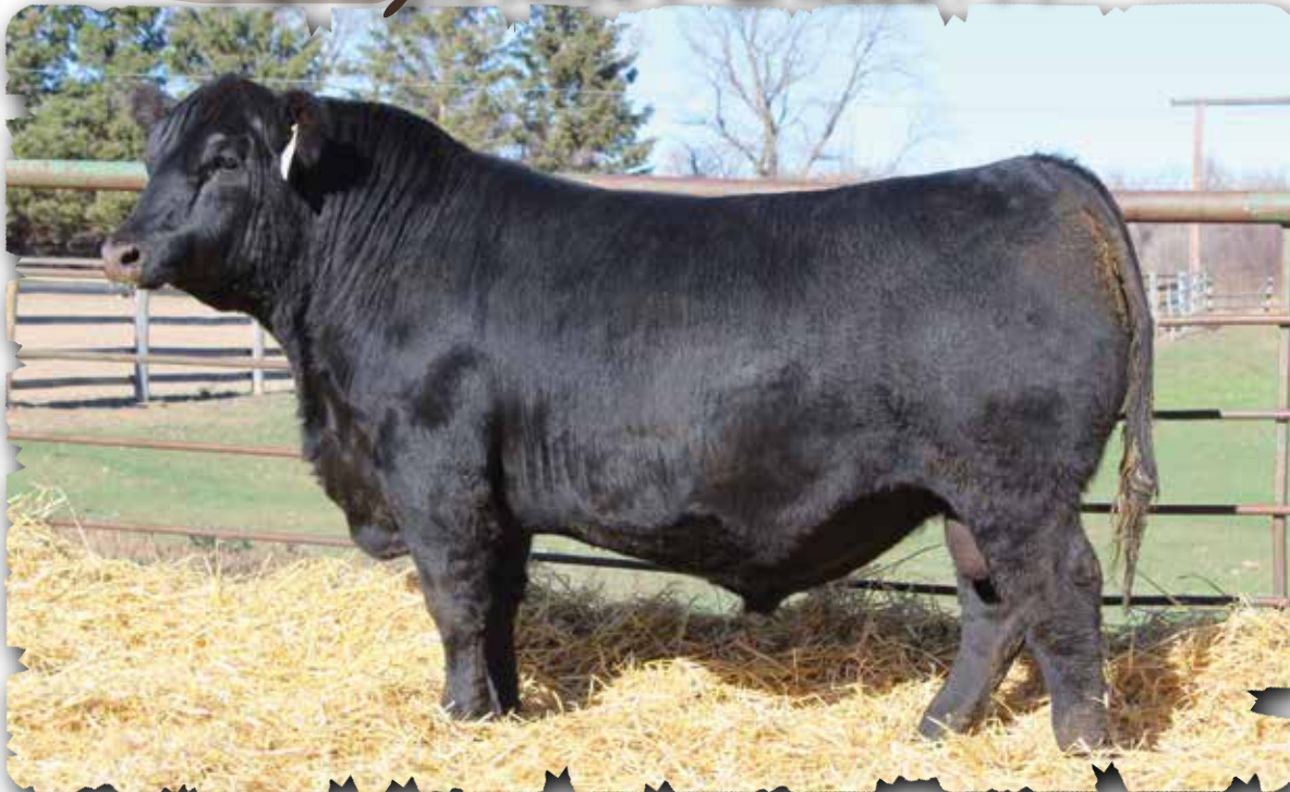
PEAK DOT ROUGHRIDER 2218K - LOT 75