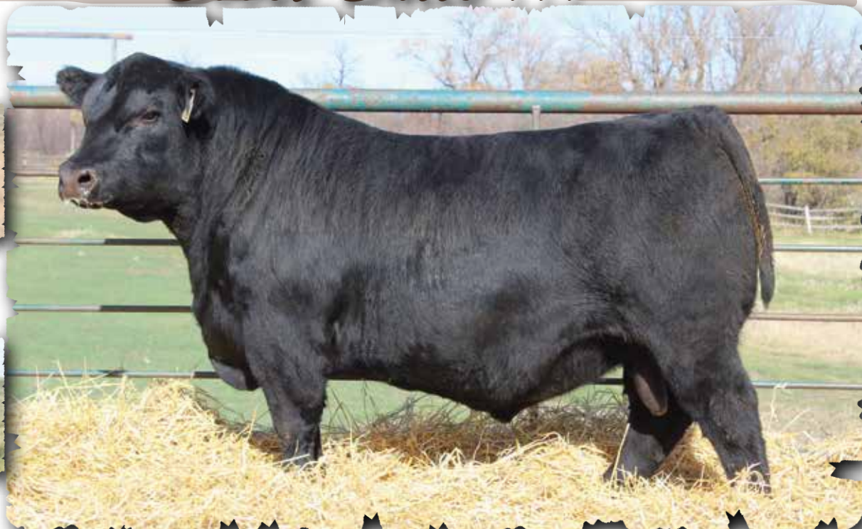
PEAK DOT BOOST 573K - LOT 31