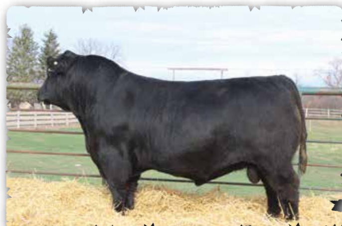
PEAK DOT NO DOUBT 25K - LOT 106