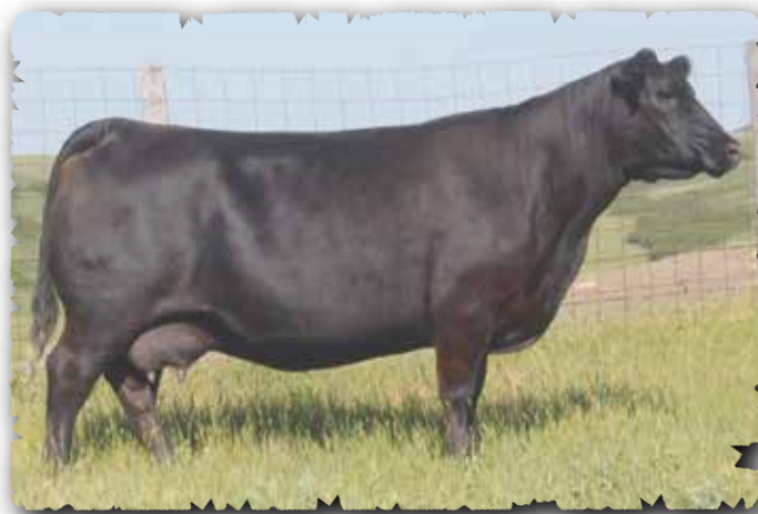
PEAK DOT LADY LAWN 551B The grandam of lot 97

>Recommended for cows or heifers >Extra power in this bull's pedigree. Will add some growth and stretch to his calves. >Ranks in the top 9% for Marbling. Weaning ratio 101. Yearling ratio 102.