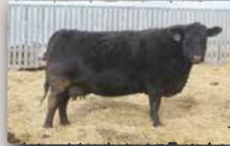
PEAK DOT BARBARA 133C The dam of Rider Nation 131G

CONNEALY EARNAN 076E BW +2.3 ELLINGSON ROUGHRIDER 4202 WW +62 EA BLACKCLASS 8914 YW +114 PEAK DOT RIDER NATION 131G MILK +23 JINDRA DOUBLE VISION RE +.43 PEAK DOT BARBARA 133C Marb +.58 BARBARA OF PEAK DOT 977X CW +43