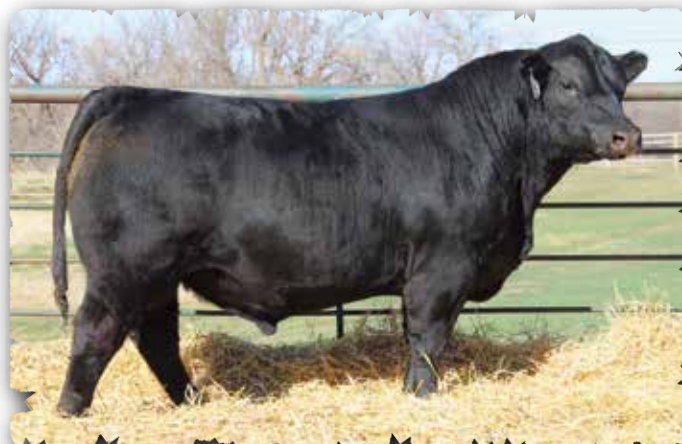
PEAK DOT BIG RIVER 2012K - LOT 54

>Recommended for cows >Exceptional power and performance. Very good maternal genetics. Weaning ratio of 107. >Top 2% for WW, YW. Top 8% for marbling. >Dam has an excellent udder with small tit size.