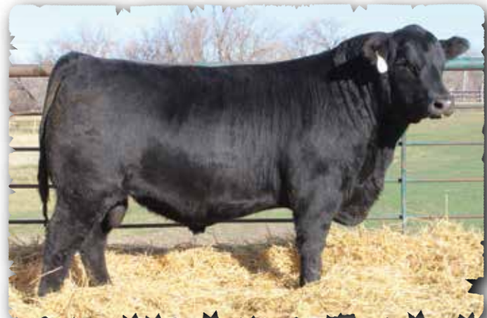
PEAK DOT ROUGHRIDER 2126K - LOT 84

>Grandam is listed as an Elite Dam with CAA.