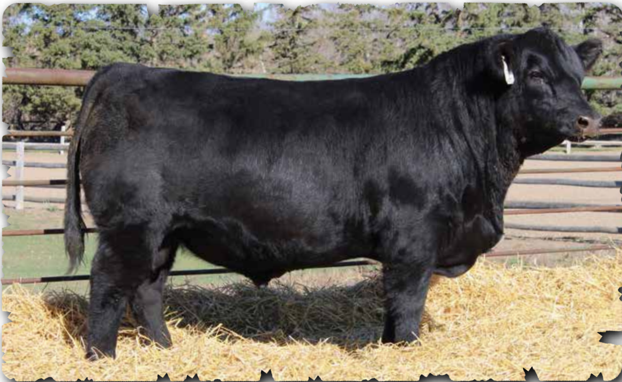
PEAK DOT NEWFOUND 2273K - LOT 74

The popular lot 1 $35,000 top selling Profound son in the 2021 Peak Dot Ranch Bull Sale. Newfound may be the most balanced individual ever raised at Peak Dot Ranch. He replicates the same unmistakable herd bull presence that his sire does. His eye catching phenotype and excellent feet have been appreciated by even the most astute cattle visitors. He weaned off just under 900lbs for a weaning ratio 117. His EPDs rank him in the top 1% for weaning weight, top 3% for yearling weight, and top 20% for marbling. His dam sired by Unanimous is as impressive as you will find. She has recently been successful flushed twice freezing 23 and 30 quality embryos per flush. Owned with Hillcrest Enterprises.