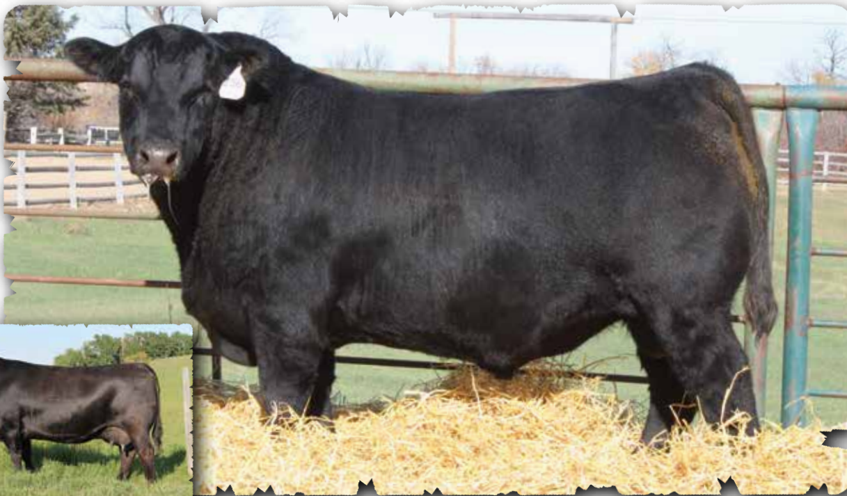
PEAK DOT COLOSSAL 2105K - LOT 3