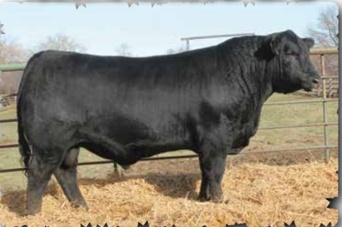
PEAK DOT ATTRACTIVE 2188K - LOT 127