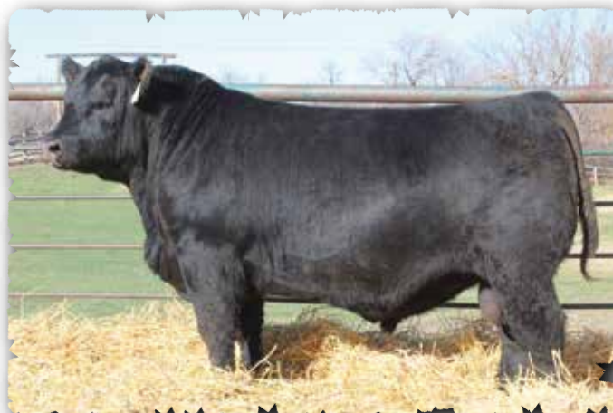
PEAK DOT ROUGHRIDER 2154K - LOT 76

>Recommended for heifers >He combines natural thickness, muscle and volume with superior structure and true Angus breed character. Dam is well made Eliminator daughter that is very hard to fault. >Weaning ratio 103. Yearling ratio 117