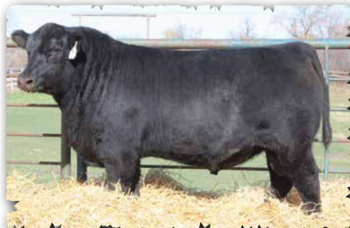
PEAK DOT COLOSSAL 2120K - LOT 12

>Recommended for heifers >Built very strong. Excellent feet and legs. Powerful hip and stifle. >Maternal brothers have sold to Fitzpatrick Ranch, Arlyn Jamieson and Jamie Keen.