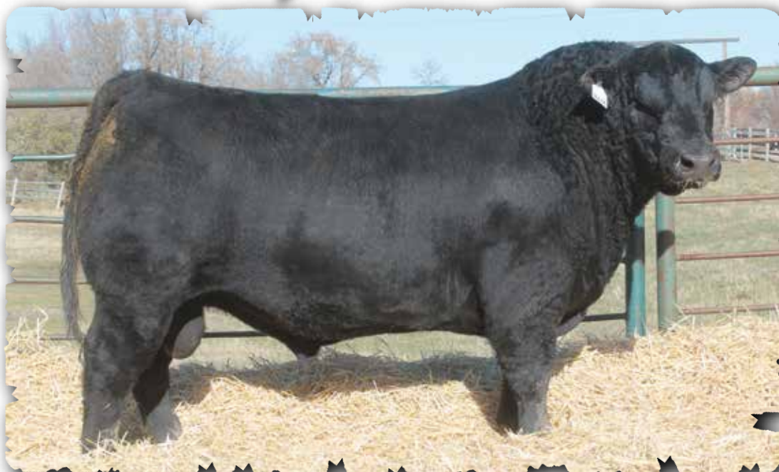
PEAK DOT BIG RIVER 2122K - LOT 52