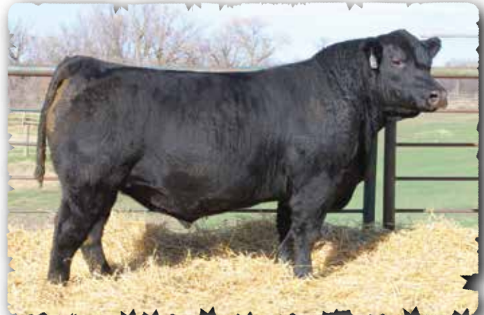
PEAK DOT BIG RIVER 2192K - LOT 56

>Recommended for heifers or cows. >Great performance, good topped and thick made. Yearling ratio 103. >Ranks in the top 5% for weaning weight EPDs. >Dam is a donor with several featured progeny in past sales..