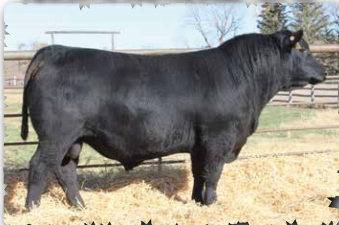
PEAK DOT ATTRACTIVE 334K - LOT 128