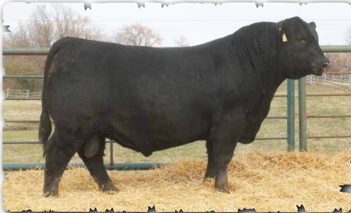
PEAK DOT ATTRACTIVE 575K - LOT 124

One of the top selling bulls we purchased along with Semex from the 2016 Schiefelbein sale. Attractive is a calving-ease bull that will add growth and a good set of feet and legs. His dam is one of the best cows we have found in all our travels. She has produced over $200,000 and is one of the main anchors in the Schiefelbein embryo program. Attractive has a great disposition and so do his sons.