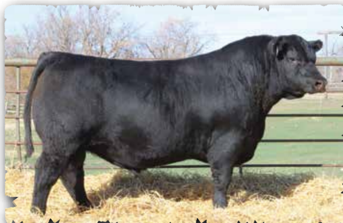
PEAK DOT BIG RIVER 120K - LOT 53

>Recommended for cows. >Great performance, good topped and thick made. Weaning ratio 113, Yearling ratio 112. >Good footed, backed up by his strong foot EPDs. Grandam is listed as Elite dam with CAA.