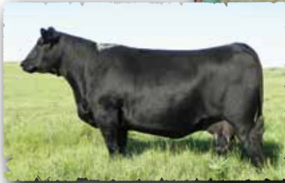
ANNIE K OF PEAK DOT 450U The maternal great grandam of lot 5