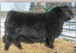
PEAK DOT TRUST 86G Purchased by SEMEX BEEF. for $65,000