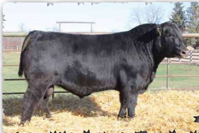
PEAK DOT ROUGHRIDER 470K - LOT 90

>Recommended for heifers or cows >A rugged built powerhouse growth bull that will catch your attention soon as you enter the pen. >Posted the heaviest weaning weight of the entire offering. Weaning ratio 121. Grandam is an Elite Dam. >Top 1% for weaning weight, yearling weight. Top 1% Carcass weight. Top 3% for REA..