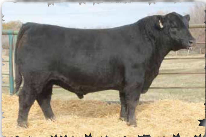
PEAK DOT ROUGHRIDER 502K - LOT 80