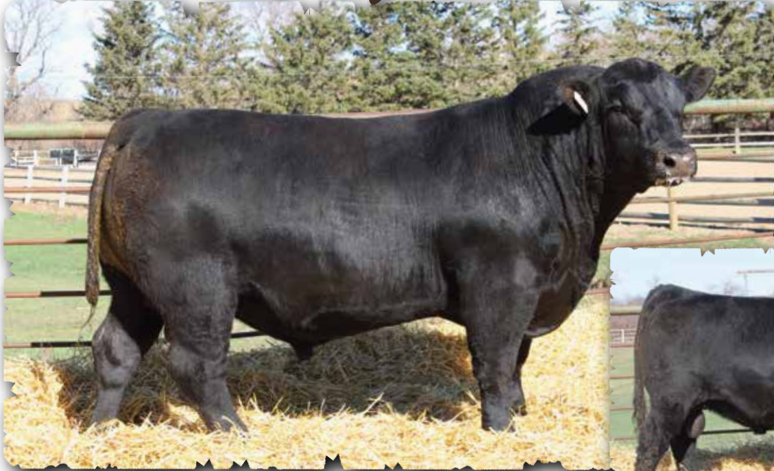
PEAK DOT PROFOUND 3111k - LOT 67