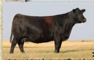
PEAK DOT HEROINE 2007D

The $19,500 maternal sister to the dam of lot 50