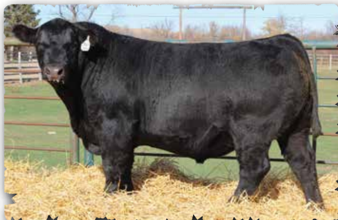
PEAK DOT COLOSSAL 2175K - LOT 11

>Recommended for heifers. >Very correct well made bull. Lots of spring in his ribs. Walks out with a nice long stride. >Weaning ratio 105. Yearling ratio 103. Top 2% for hoof claw and angle EPDs.