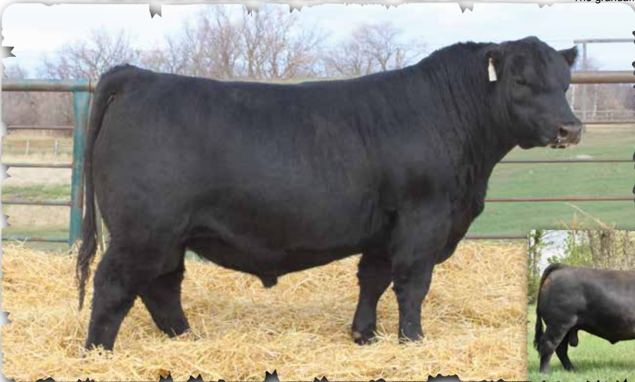
PEAK DOT GEDDES 293K - LOT 123