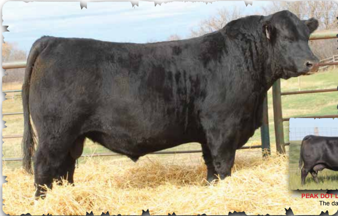
PEAK DOT BLOODLINE 807K - LOT 133