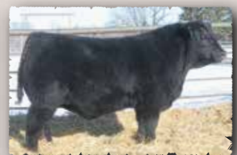
PEAK DOT RIDER NATION 131G Purchased by Hillcrest Enterprises for $32,500