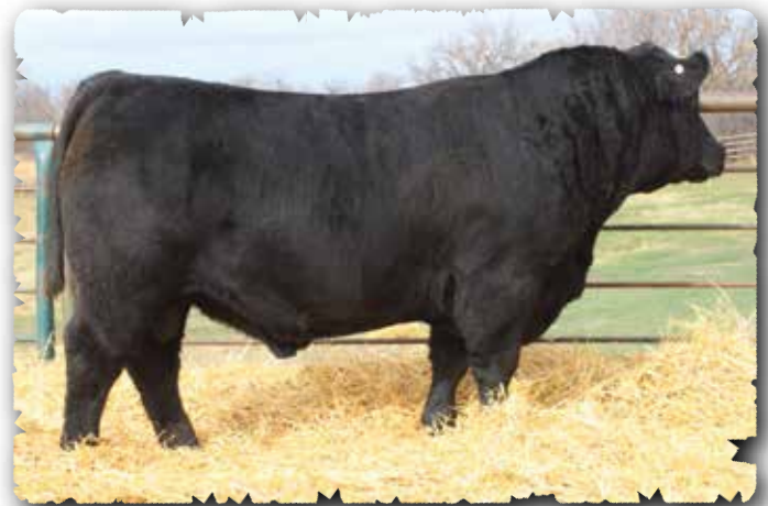
PEAK DOT FOR SURE 495K - LOT 118

>Recommended for heifers >Proud fronted, attractive bull with thickness, muscle volume and style. Weaning ratio 110. >Top 10% for marbling. Dam has a solid production record.