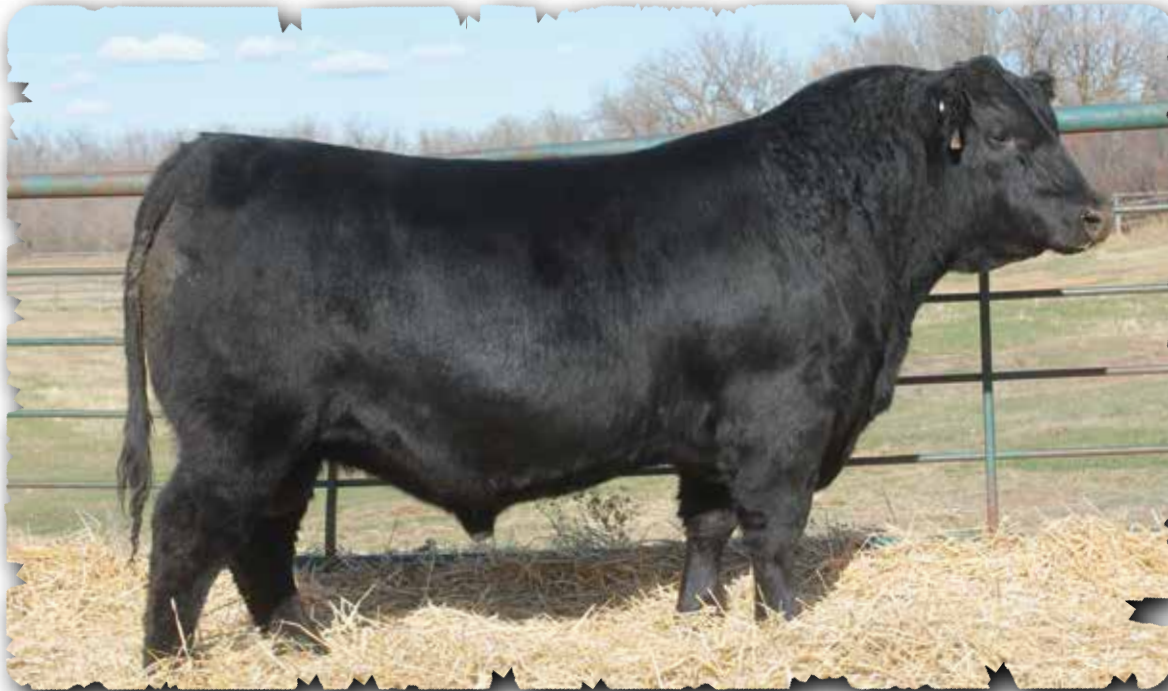
PEAK DOT PIONEER 433K - LOT 135