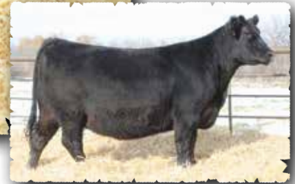
PEAK DOT ERICA 361H The dam of lot 85