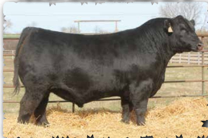
PEAK DOT ROUGHRIDER 490K - LOT 81