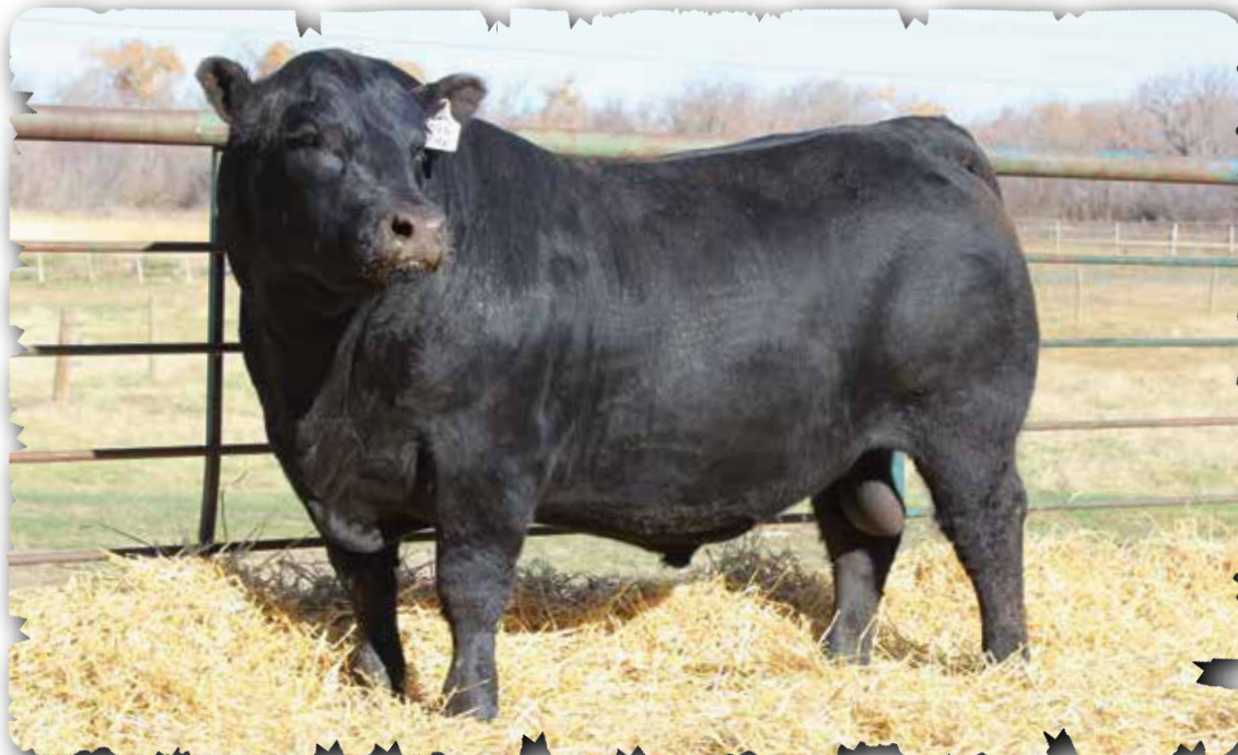
PEAK DOT LANCASTER 39K - LOT 102

Lancaster is a rugged built stock bull with true muscle definition, extra rib-shape and real performance. He was the featured lot 2 bull in the Spring 2020 Bull Sale selling to Glasman Farms for $56,000. His progeny display a nice pattern with body depth, fleshing ability and real muscle shape. His dam is a very well made SAV Eliminator 9105 daughter that ranks near the top for milk and marbling. She is also the dam of the $25,000 Peak Dot and Hillcrest Enterprises herdsire Peak Dot Seedstock 38F. Her son Peak Dot Profound 110J sold in the 2022 spring sale for $20,000 to Yarrow Creek.