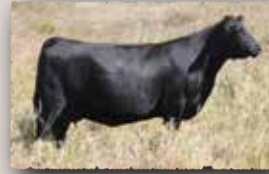
Peak Dot Pride 88B The dam of Lancaster

BW +2.5 WW +65 YW +119 MILK +32 MARB +37 REA +25 CW: +53