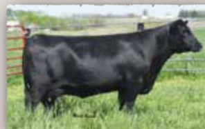
SAV MISS BOBBIE 2407

BW +3.3 WW +64 YW +101 MILK +20 MARB +65 REA +40 CW +39