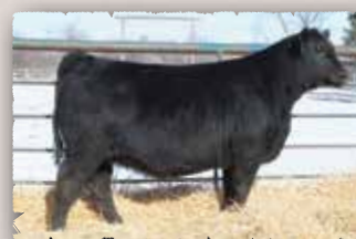
Ellingson Big River Daughter