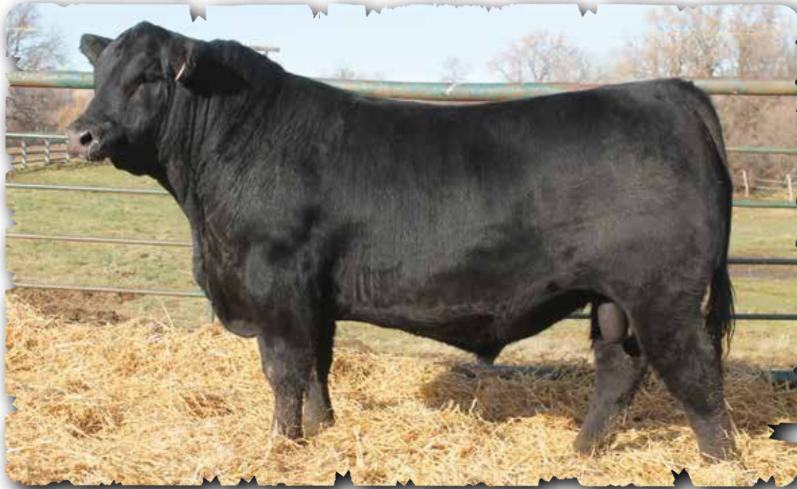
PEAK DOT NO DOUBT 2204K - LOT 108