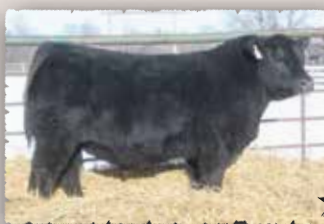
PEAK DOT LANCASTER 26G Purchased by Glasman Farms. for $56,000