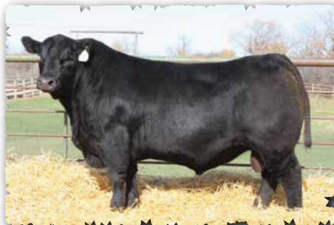
PEAK DOT COLOSSAL 2167K - LOT 20

>Recommended for heifers >A low birth weight calving ease bull with added length and substance. >Weaning ratio 104.