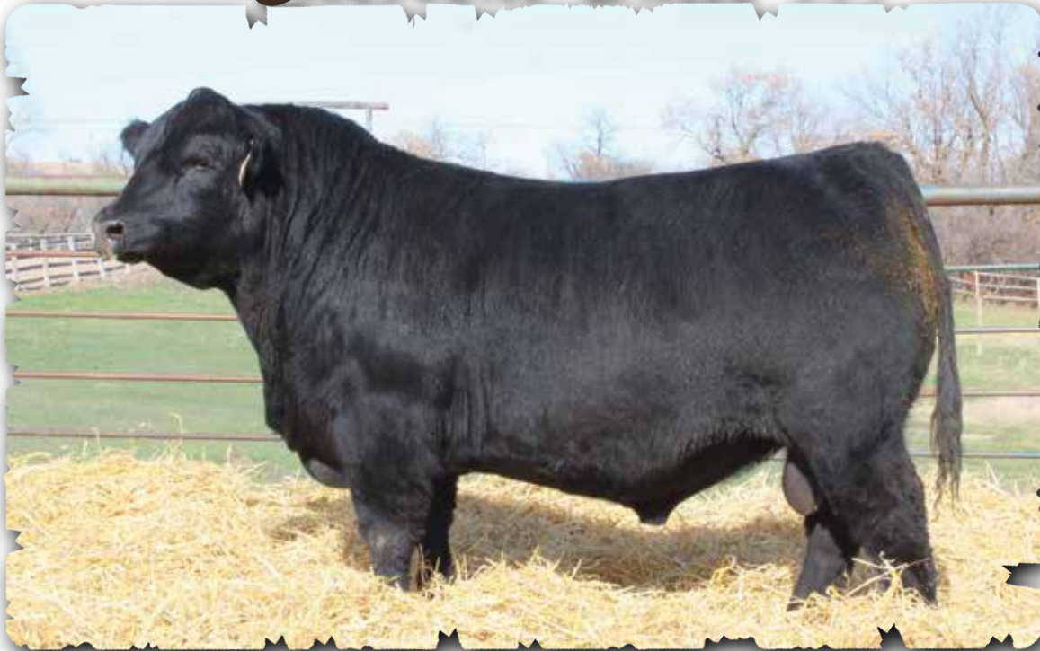
PEAK DOT COLOSSAL 2059K - LOT 13