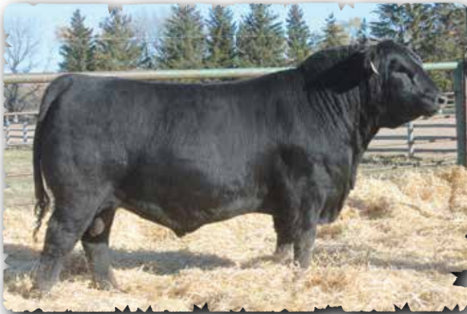
PEAK DOT BIG RIVER 2041K - LOT 64

>Recommended for heifers >A thick heavy bull with substance and power that will also calve easy.. >Weaning ratio 104. Top 4% yearling weight EPD. Top 2% scrotal EPD.. >Great grandam is a past donor.