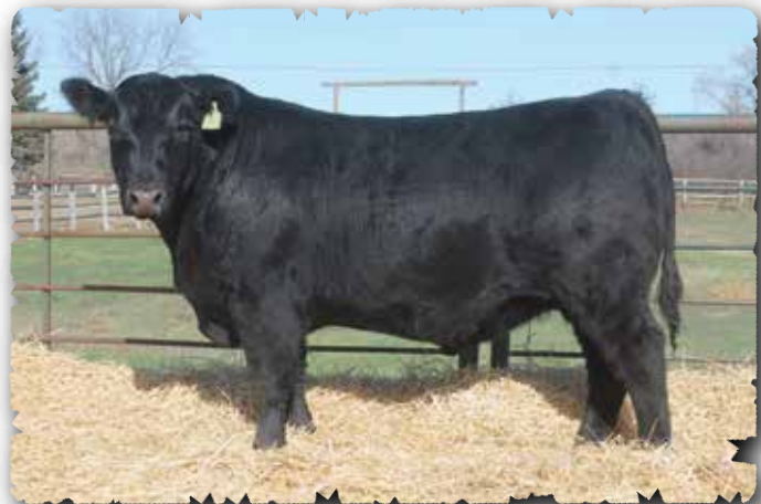
PEAK DOT NO DOUBT 417K - LOT 110

>Recommended for cows >A complete, well balanced bull with tremendous females in his make up. Weaning ratio 107. >Ranks in the top 2% for weaning and yearling weight EPDs. Top 7% for marbling EPD..