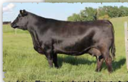
HEROINE OF PEAK DOT 958U The maternal grandam of lot 3