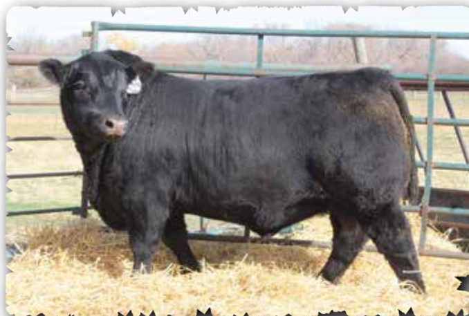
PEAK DOT BOOST 2168K - LOT 32

>Recommended for heifers >A good looking bull smooth and athletic in his movement. Durable and built for ranch country. >Top 2% for weaning and yearling weight. Backed by several generations of proven producers.