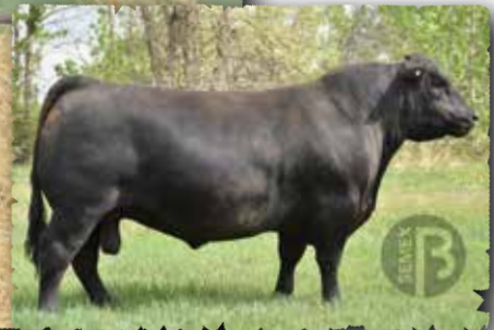
VARILEK GEDDES 7068 The sire of lot 123