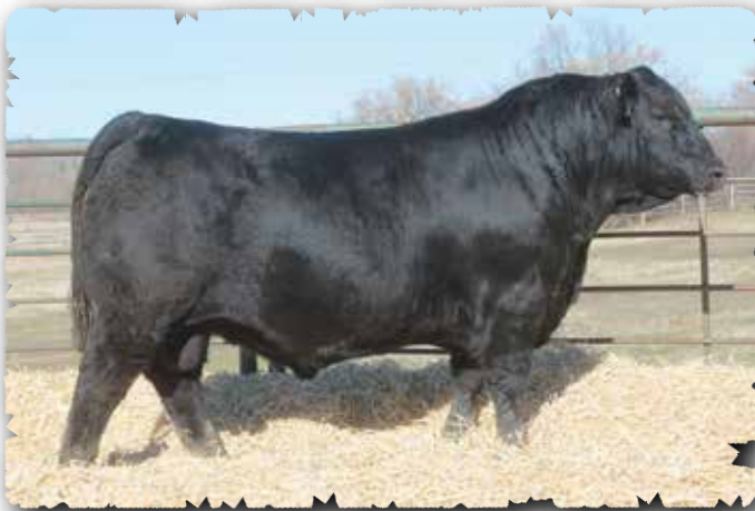
PEAK DOT BIG RIVER 2098K - LOT 63

>Recommended for heifers >A strong top, smooth shoulders and a nice head on this very stout fellow. >Top 1% for hoof angle EPD.