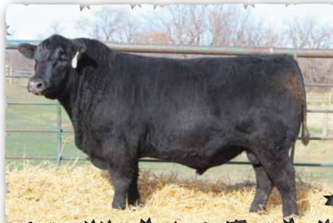
PEAK DOT COLOSSAL 2115K - LOT 21

>Recommended for heifers >A sure bet calving ease sire. With a nice look and ample body thickness. Weaning and yearling ratios 100 >Moderate easy fleshing dam is feminine and broody with a perfect udder.