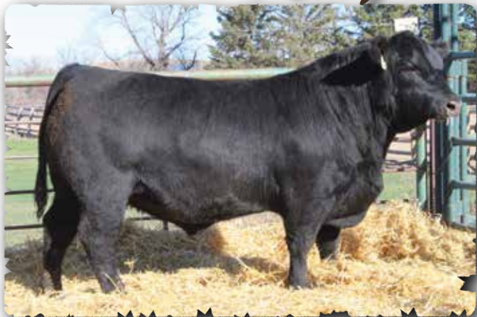
PEAK DOT ROUGHRIDER 2285K - LOT 78