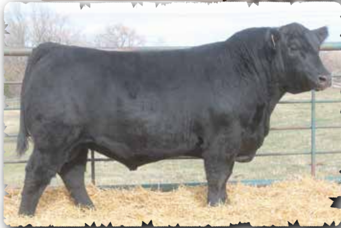
PEAK DOT ATTRACTIVE 2219K - LOT 125