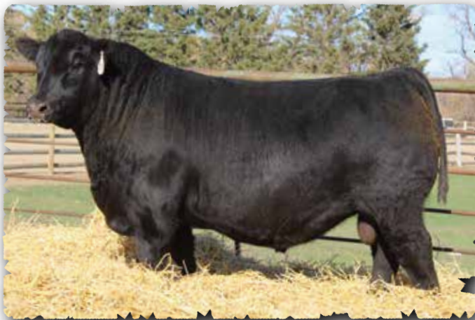
PEAK DOT COLOSSAL 2094K - LOT 5