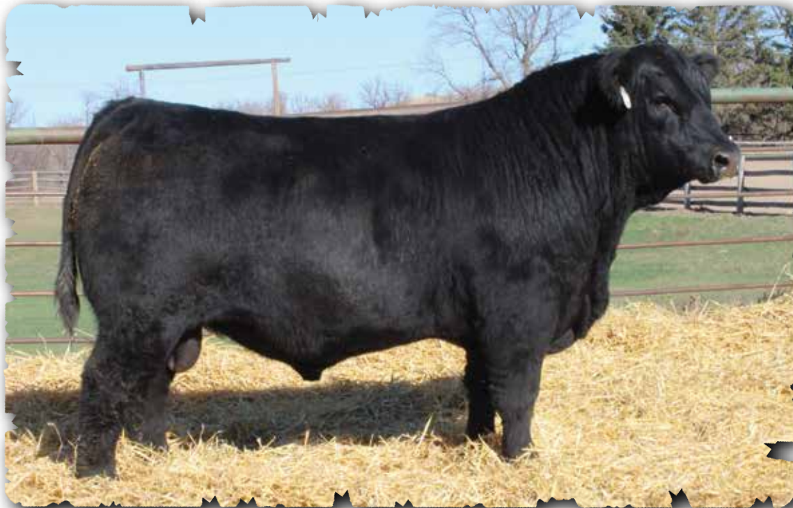
PEAK DOT RIDER NATION 2251K - LOT 100

A standout from the 2020 Spring Bull Sale. Where he exhibited as much mass and raw power as any bull in the offering that year. He was one of the top selling Roughrider sons selling for $32,500 to Hillcrest Enterprises. His dam is an exceptionally deep bodied, easy fleshing female with a proven track record.