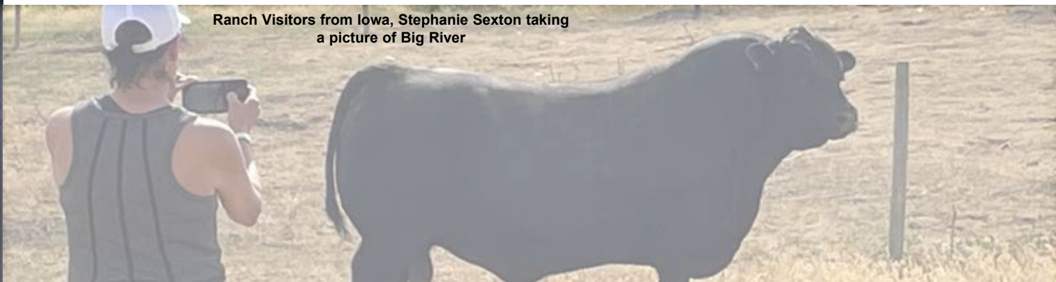
Ranch Visitors from Iowa, Stephanie Sexton taking a picture of Big River

>Recommended for cows >A performance bull with muscle, volume and natural fleshing-ability. Top ranking hoof EPDs. >EPDs rank him in the Top 3% for weaning weight, yearling weight