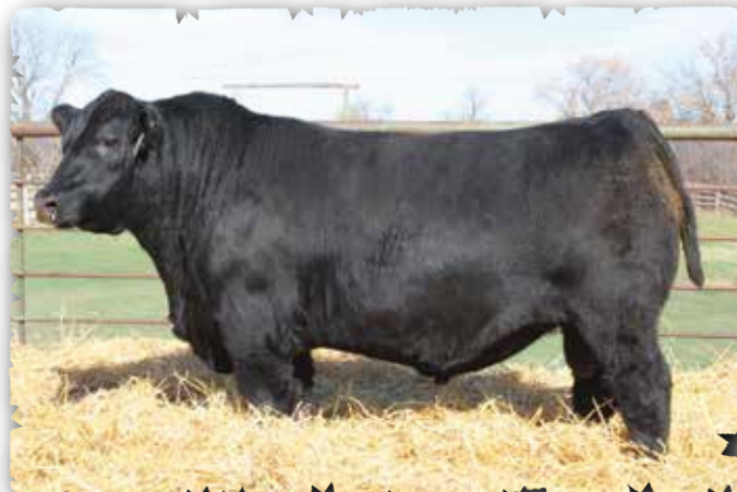
PEAK DOT COLOSSAL 2121K - LOT 9

>Recommended for heifers >A proud looking bull with robust thickness and length. Top 6% for marbling. >Dam is listed as an Elite Dam with CAA..