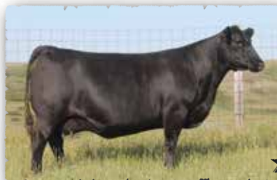
QUEEN OF PEAK DOT 936Y The grandam of lot 81

>Recommended for heifers. >A powerful herd sire prospect with volume, thickness and muscle shape. Yearling ratio 108. >Grandam is a donor with 56 progeny. Great grandam is listed as an Elite Dam with CAA..