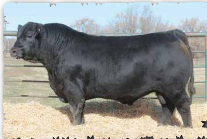
PEAK DOT BRUTUS 2013K - LOT 41

>Recommended for heifers or cows >A rugged built powerhouse growth bull that will catch your attention soon as you enter the pen. >Weaning ratio 109. Yearling ratio 130. >Top 1% for weaning weight, yearling weight and heifer pregnancy EPDs. Top 12% marbling.