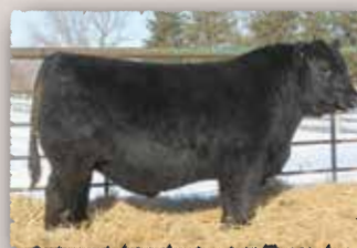
PEAK DOT MOSAIC 804G Purchased by SSS Angus for $60,000