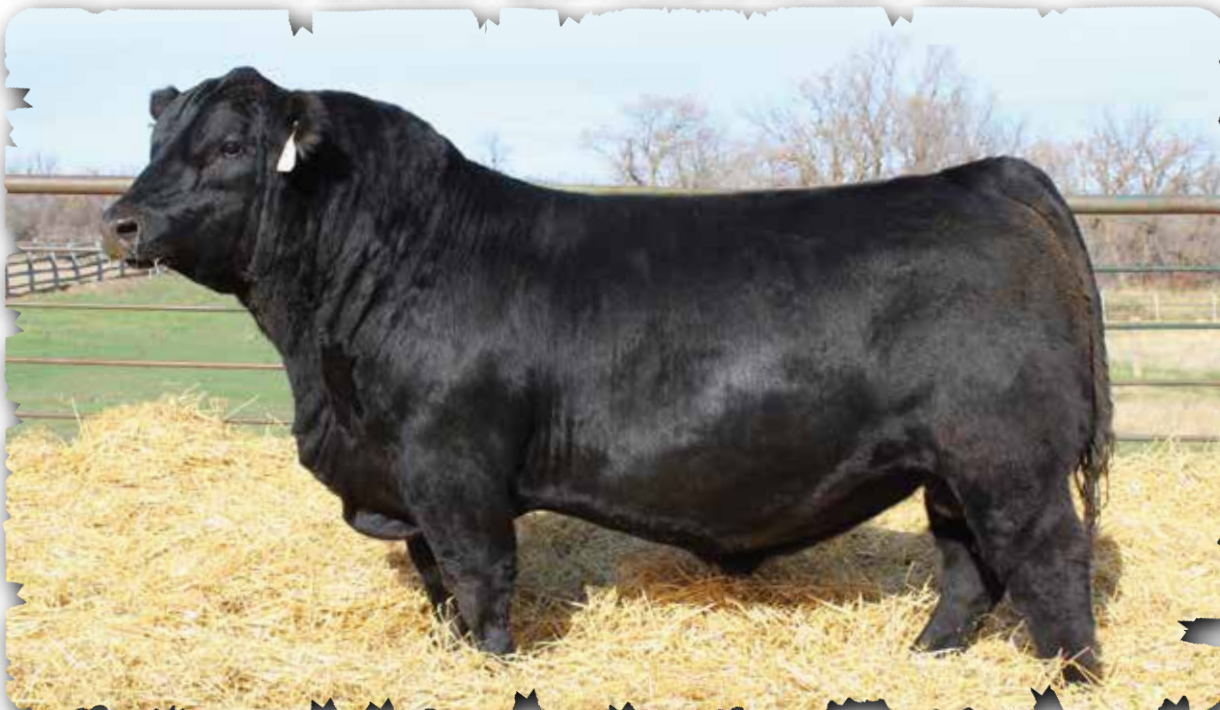
PEAK DOT BRUTUS 2011K - LOT 39