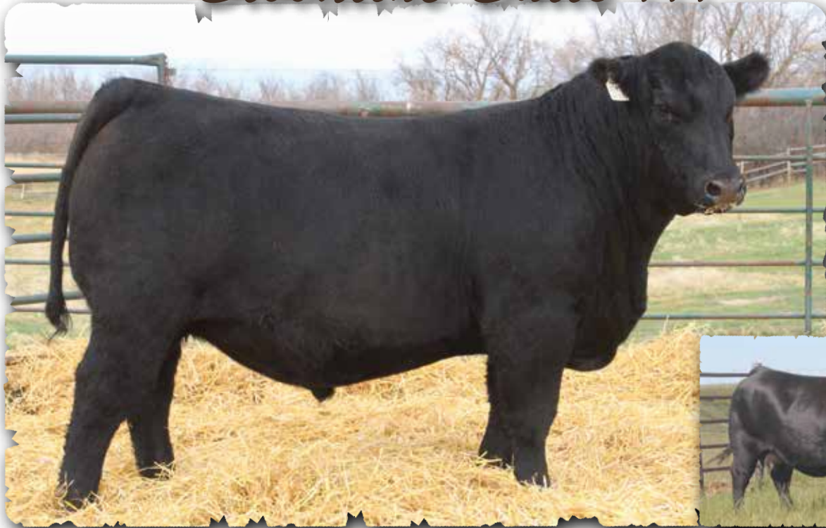
PEAK DOT BLOODLINE 801K - LOT 132