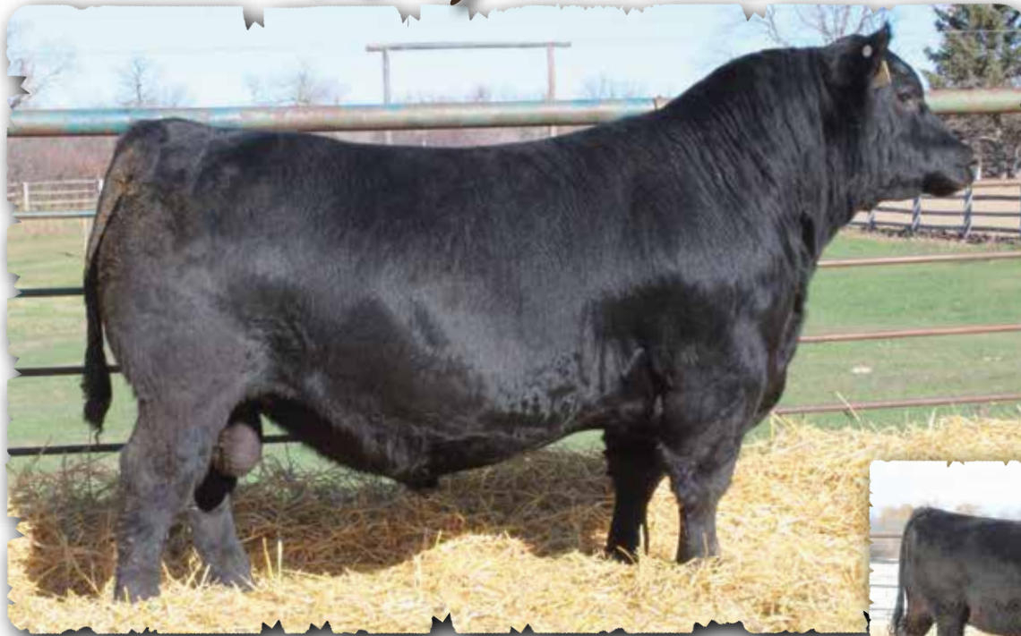
PEAK DOT ROUGHRIDER 414K - LOT 85