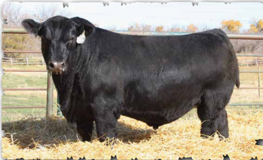
PEAK DOT COLOSSAL 2037K - LOT 10