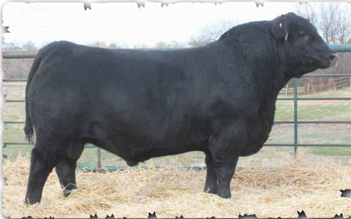
PEAK DOT ROUGHRIDER 411K - LOT 89