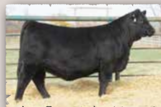
Ellingson Big River Daughter