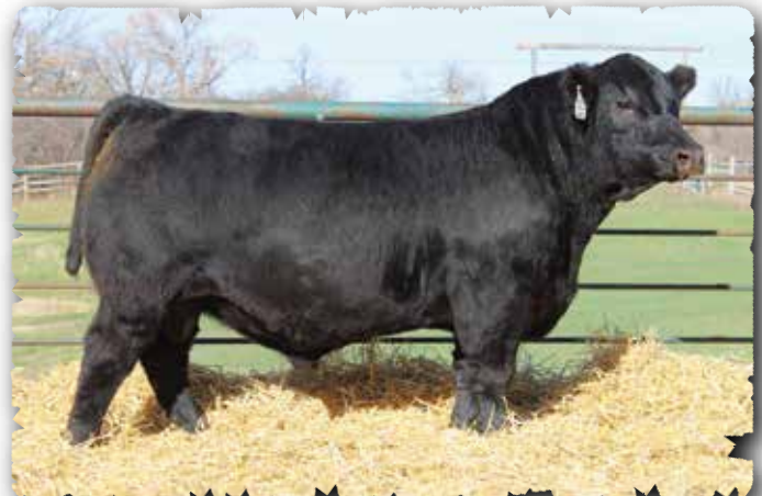
PEAK DOT BIG RIVER 2156K - LOT 57

>Recommended for heifers >A calving-ease bull with length and performance. Nice hair coat. Yearling ratio 105. >Top 2% for weaning and yearling weight EPDs. Top 9% for marbling.