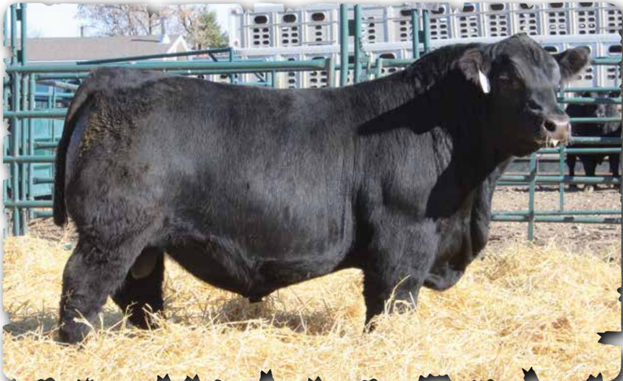
PEAK DOT BOOST 2134K - LOT 30

Incredible mass, volume, length and stoutness with abundant depth, thickness and excellent scrotal development. This bull is something special. He has a birth weight of 68lbs then went on to wean off at 934lbs and weighed just under 1700lbs at a year of age! He earned a weaning ratio of 124 and ranks in the very top 1% for weaning weight and yearling weight EPDs, top 10% for REA and top 3% for CED. His grandam Erica of Peak Dot 478U is the most influential cow at Peak Dot with 54 progeny.