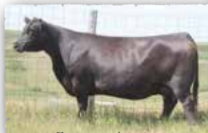
PEAK DOT BARDOLIA 1026Z Maternal great grandam of lot 31