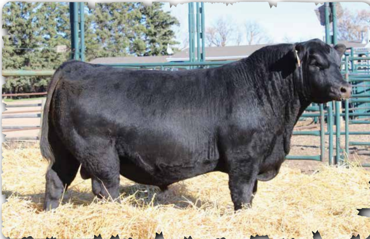
PEAK DOT FOR SURE 536K - LOT 116

Peak Dot For Sure 383F is a good footed deep made bull that is naturally thick and loaded with muscle. His son are wide based and come with added bone and excellent hair coats. They are dense made cattle that really pack the weight on.