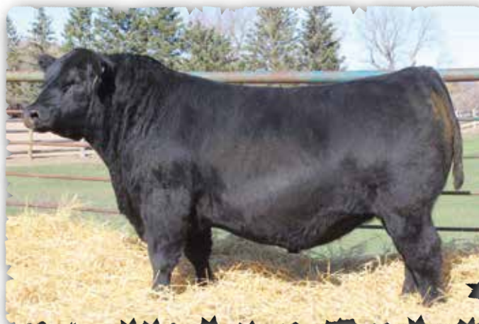
PEAK DOT COLOSSAL 2097K - LOT 8

>Recommended for heifers >Built like a brick. Shear thickness from front to back. >Yearling ratio 117 Ranks in the top 2% for REA..