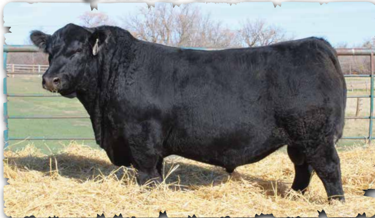
PEAK DOT COLOSSAL 2077K - LOT 2