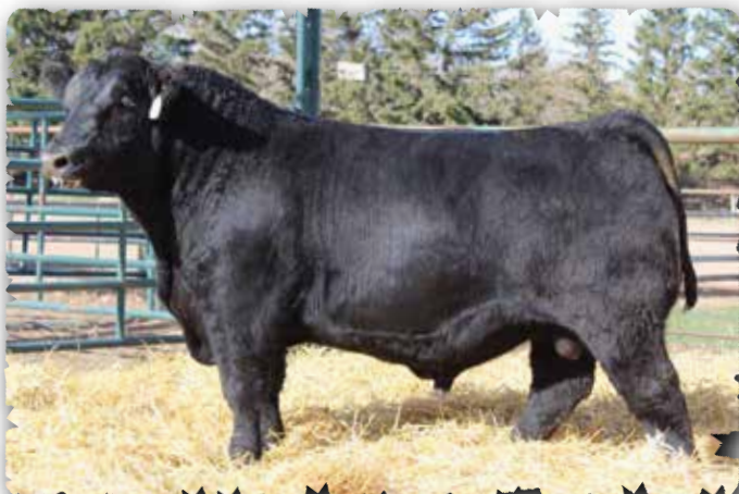
PEAK DOT COLOSSAL 2216K - LOT 17