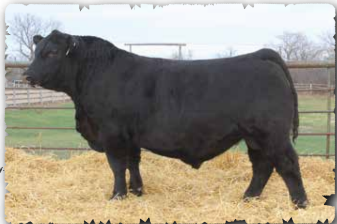
PEAK DOT NO DOUBT 2255K - LOT 109

>Recommended for cows >A fault free wide body bull that is very solid in his structure. Moves and travels around the pen effortlessly. >Weaning ratio 103. Yearling ratio 117