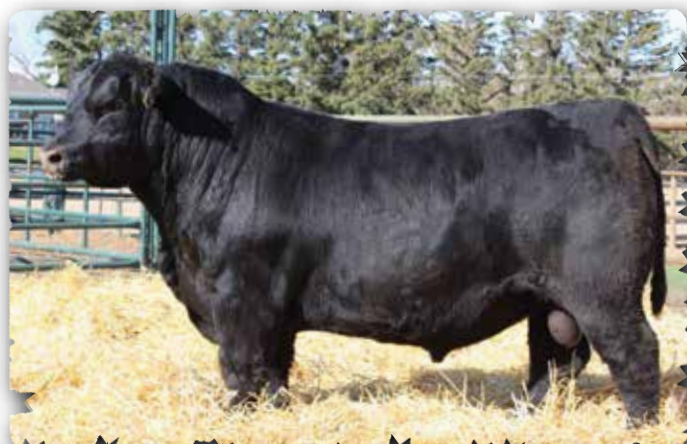
PEAK DOT COLOSSAL 281K - LOT 15

>Recommended for heifers >A smooth patterned bull with thickness and fleshing ability. >Reserved especially for the commercial cattleman, this good bull sell without registration paper..