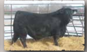
Peak Dot Profound 110J This maternal brother sold to Yarrow Creek..

Lancaster is a rugged built stock bull with true muscle definition, extra rib-shape and real performance. He was the featured lot 2 bull in the Spring 2020 Bull Sale selling to Glasman Farms for $56,000. His progeny display a nice pattern with body depth, fleshing ability and real muscle shape. His dam is a very well made SAV Eliminator 9105 daughter that ranks near the top for milk and marbling. She is also the dam of the $25,000 Peak Dot and Hillcrest Enterprises herdsire Peak Dot Seedstock 38F. Her son Peak Dot Profound 110J sold in the 2022 spring sale for $20,000 to Yarrow Creek.