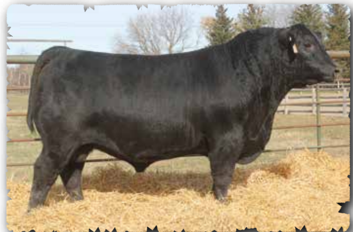
PEAK DOT ROUGHRIDER 392K - LOT 83