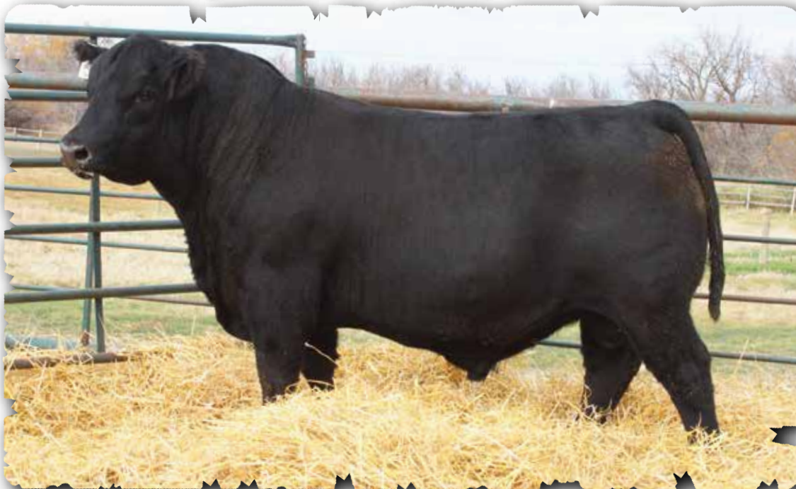
PEAK DOT NO DOUBT 28K - LOT 105