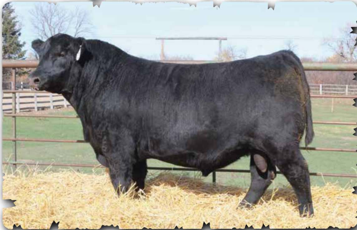
PEAK DOT COLOSSAL 2200K - LOT 26