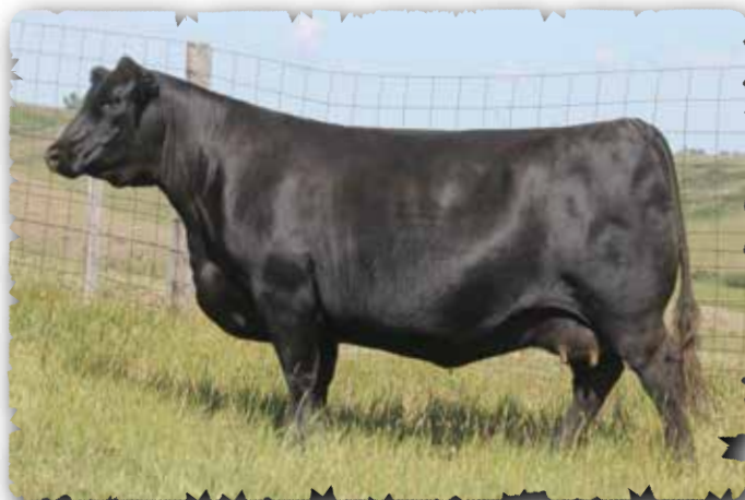
PEAK DOT LADY 780A Maternal grandam of lot 28

>Recommended for heifers >A stylish nice fronted calving ease bull with shape substance and style. Yearling ratio 107 >Maternal brother sold to Lochwood Farms