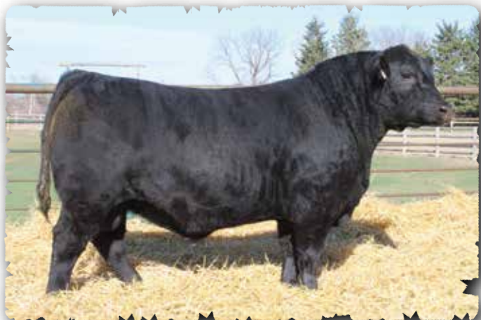
PEAK DOT BIG RIVER 597K - LOT 60

>Recommended for Heifers >Good bull, a bigger framed and very correct in his structure. Weaning ratio 115. Yearling ratio 112. >Ranks in the top 1% for milk EPD. >Dam is listed as an Elite Dam with the CAA.