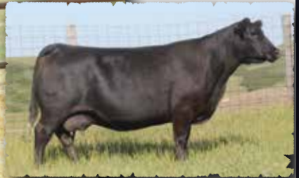
PEAK DOT LADY LAWN 551B The dam of lot 133