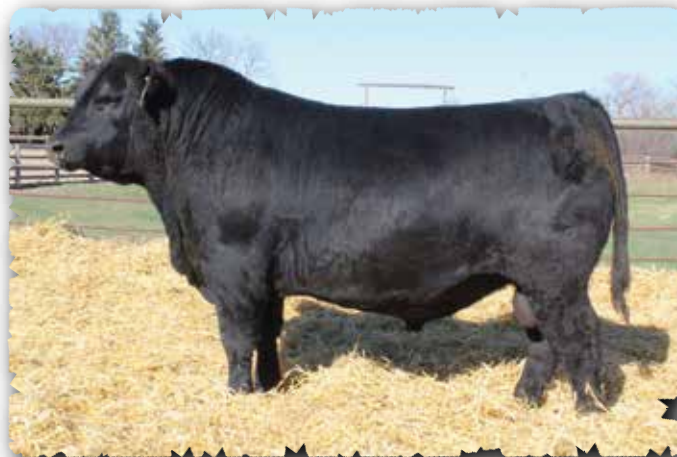
PEAK DOT ROUGHRIDER 2101K - LOT 77

>Recommended for heifers >Deep, soggy and naturally thick. Yearling ratio 106. >Grandam is listed as an Elite Dam with the CAA.