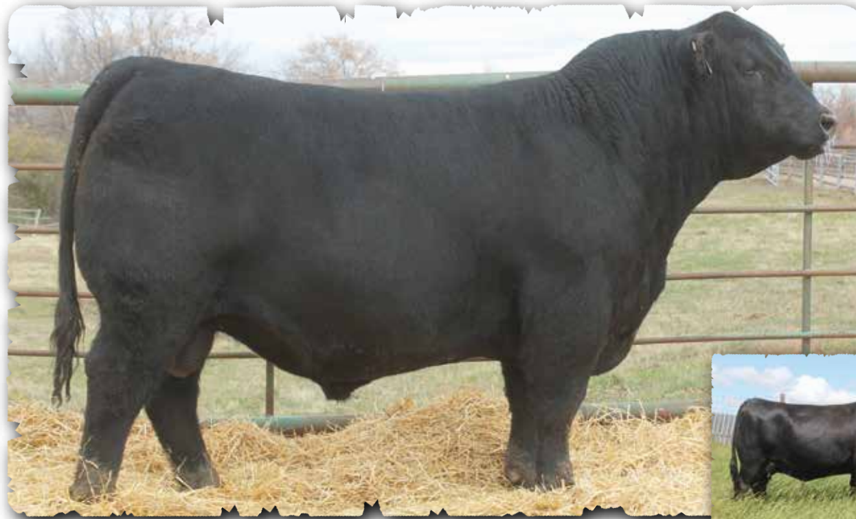
PEAK DOT TENDERLOIN 314K - LOT 48

Tenderloin was our top pick of the 2021 Poss bulls. He is an attractive, high marbling, thick made bull that combines calving-ease, performance, carcass and maternal traits along with a big scrotal and gentle disposition. His dam is one of Nolan Poss favorite cows in the Poss herd. He is bred very similar to the popular $900,000 Poss Deadwood with the combination of Poss Maverick and Poss Easy Impact 0119 in his pedigree make up. Owned with Semex Beef.