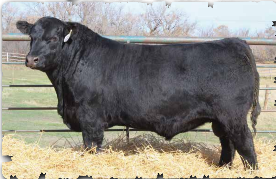
PEAK DOT COLOSSAL 2100K - LOT 19