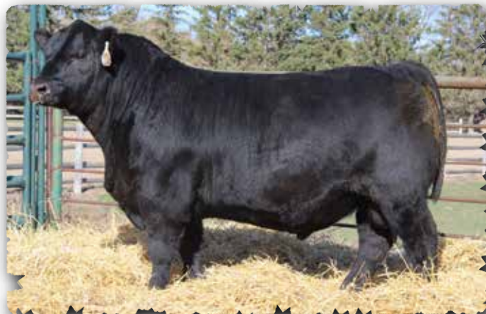
PEAK DOT COLOSSAL 2205K- LOT 14

>Recommended for heifers >Outstanding herd bull prospect. Dam is listed as an Elite dam with CAA. >Several maternal sisters retained - a brother sold to Darryl Crowley.