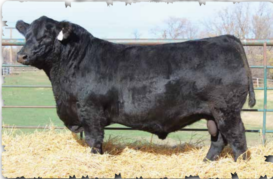
PEAK DOT BRUTUS 2023K - LOT 40