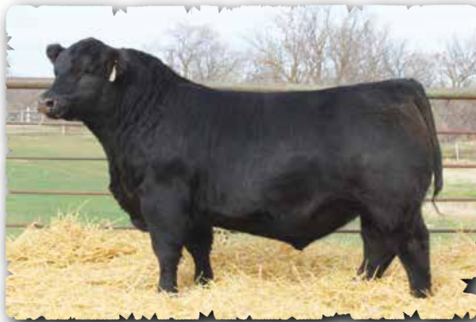
PEAK DOT BRUTUS 2172K - LOT 43