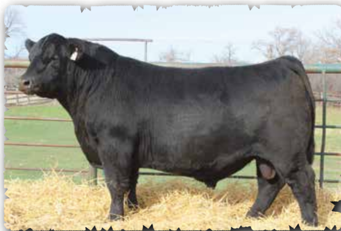
PEAK DOT BRUTUS 322K - LOT 44

>Dam has an excellent udder and ample milk.