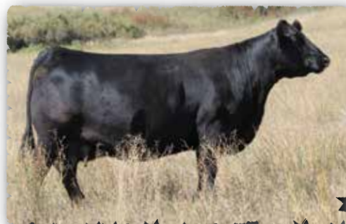
BARBARA OF PEAK DOT 79Y The great grandam of lot 104

>Recommended for cows >A special sale feature. A powerful herd sire prospect with volume, thickness and muscle shape. Yearling ratio 120. >Ranks in the top 4% for weaning weight, top 25% yearling weight, top 10% for marbling, Top 2% REA.