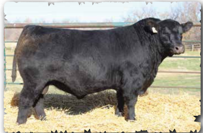
PEAK DOT ROUGHRIDER 512K - LOT 86

>Recommended for heifers >Deep and soggy, naturally thick and loaded with meat. Yearling ratio 116. >Stout made Colossal dam. Grandam is a donor with 40 progeny.