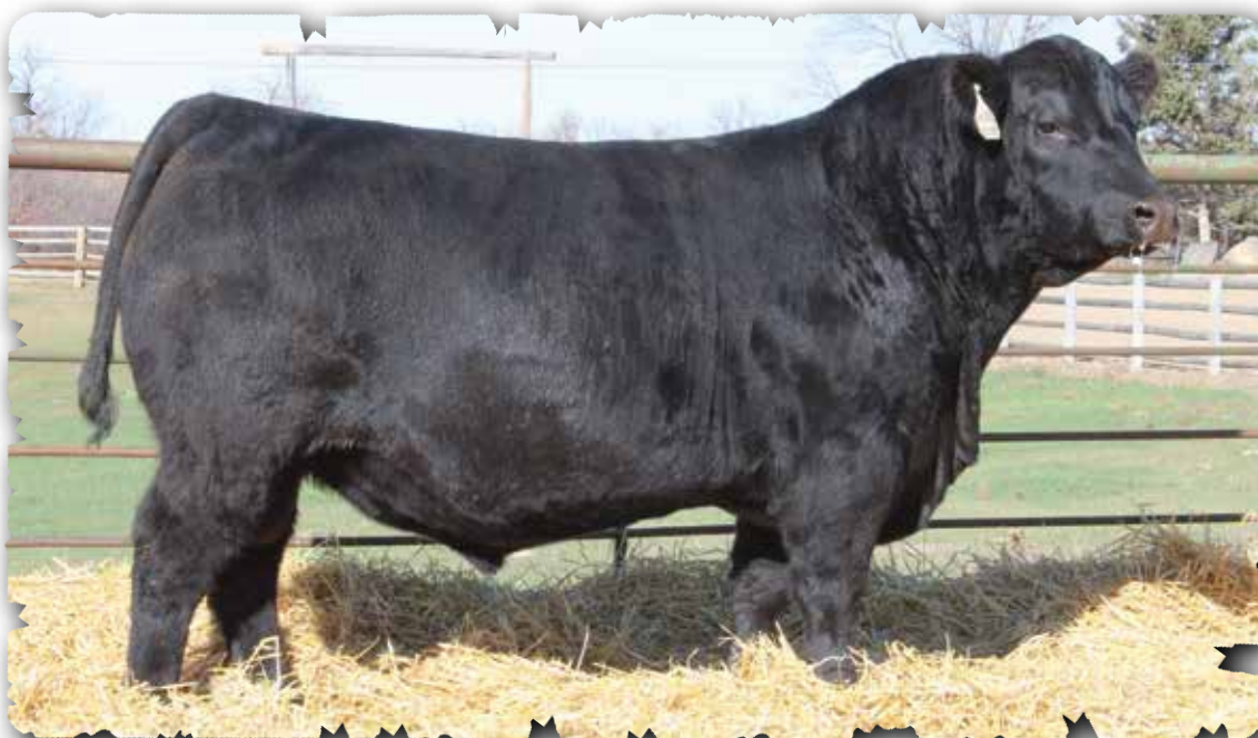
PEAK DOT BIG RIVER 2003K - LOT 51

The $19,500 maternal sister to the dam of lot 50