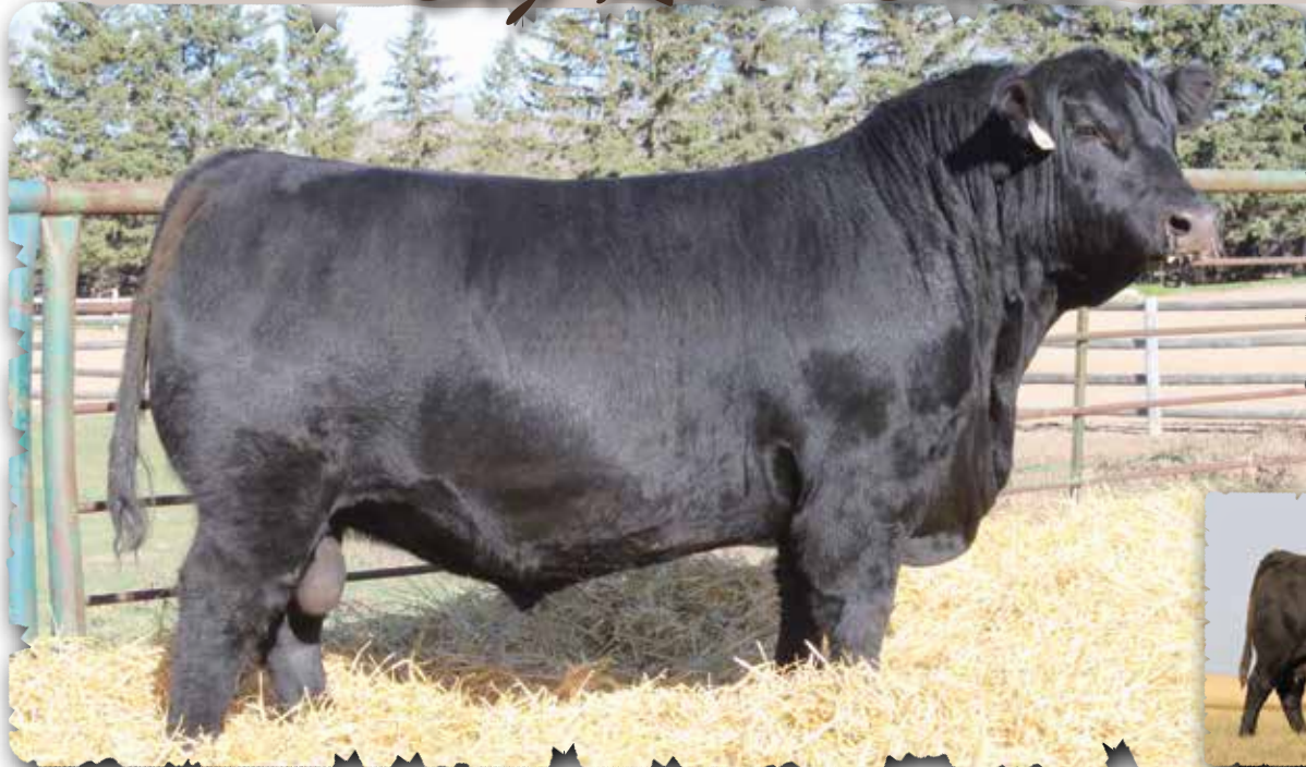
PEAK DOT BIG RIVER 2155K - LOT 50