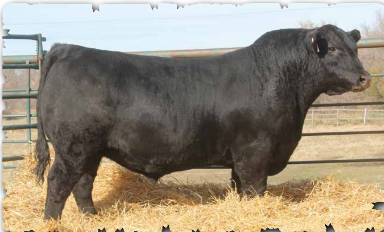
PEAK DOT EARNHARDT 485K - LOT 121

Earnhardt is a stout and powerful son of SAV Harvester 0338 out of the uniquely bred and perfectly built SAV Miss Bobbie 2407. He was the top weaning bull of his entire calf crop at Janssen Angus. He offers a moderate birth weight with a 205 day weight of 977 pounds along with a 365-day weight that broke the 1,400 pound yearling weight barrier. A large number of Earnhardt daughters have been retained by Peak Dot for replacements.