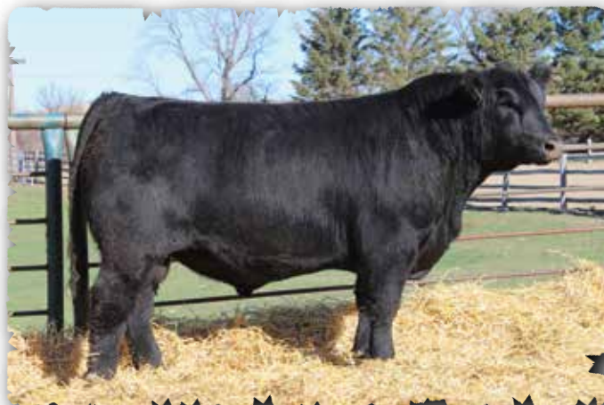
PEAK DOT ROUGHRIDER 317K - LOT 91

>Recommended for heifers >A stylish, well muscled bull with plenty of performance. >Dam comes from the popular Barbara cow family.