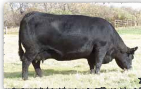
HYALITE OF PEAK DOT 831S The grandam of lot 66

>Recommended for heifers or cows. >Plenty of body capacity and thickness in this good bull. One of the heaviest weaning weight bulls in the sale.. >Weaning ratio 130. Top 2% weaning weight EPD. Top 2% hoof angle EPD. >Dam has several daughter retained in the herd.