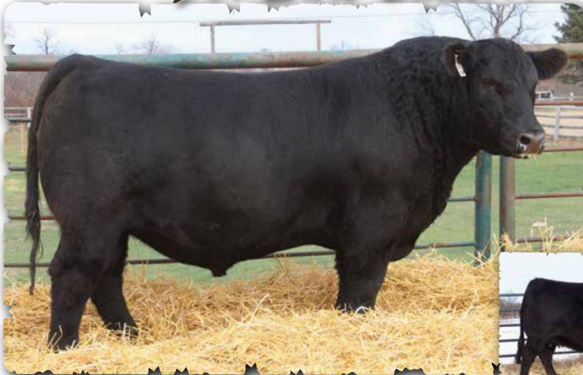
PEAK DOT FOR SURE 450K - LOT 117