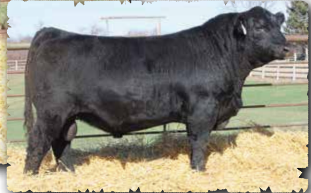
PEAK DOT PROFOUND 2235K - LOT 68