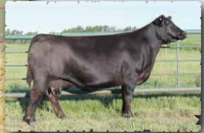
LADY OF PEAK DOT 612X The dam of lot 55