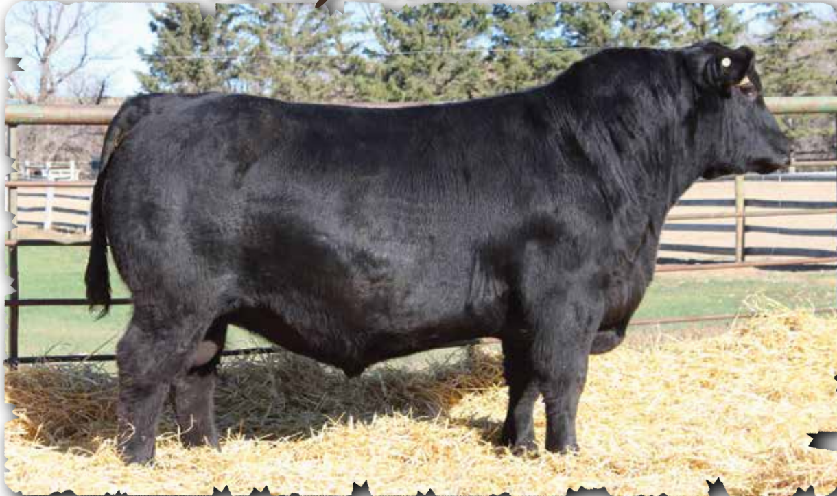
PEAK DOT ROUGHRIDER 332K - LOT 82