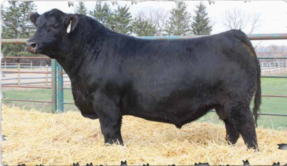
PEAK DOT BRUTUS 2108K - LOT 38