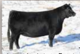
Peak Dot Lady 270G Purchased by Shawn Stadnyk for $10,000