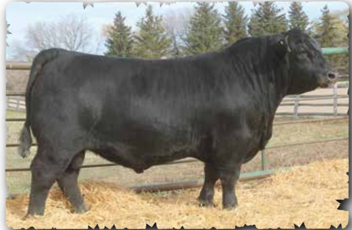
PEAK DOT PIONEER 530K - LOT 137

>Recommended for heifers or cows >An indestructible bull, wide topped and heavy and long as a train. >Yearling ratio 107. Dam has a solid production record.