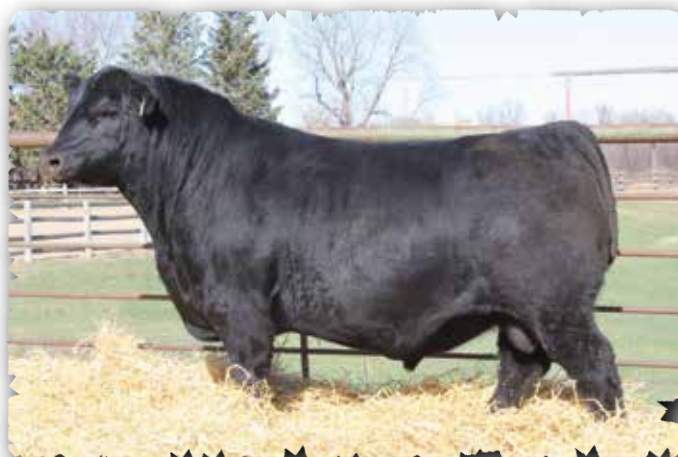
PEAK DOT BOOST 285K - LOT 33

>Recommended for heifers >Built very strong. Excellent feet and legs. Powerful hip and stifle. Yearling ratio 102. >Ranks in the top 7% for weaning and yearling EPDs..