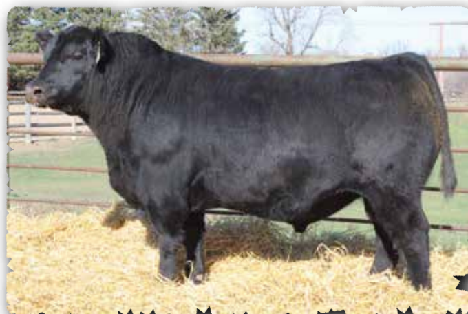
PEAK DOT COLOSSAL 2117K - LOT 25

>Recommended for heifers >A superior calving ease bull by Colossal with excellent performance. >Yearling ratio 107. Hoof claw EPD score in the top 2%.