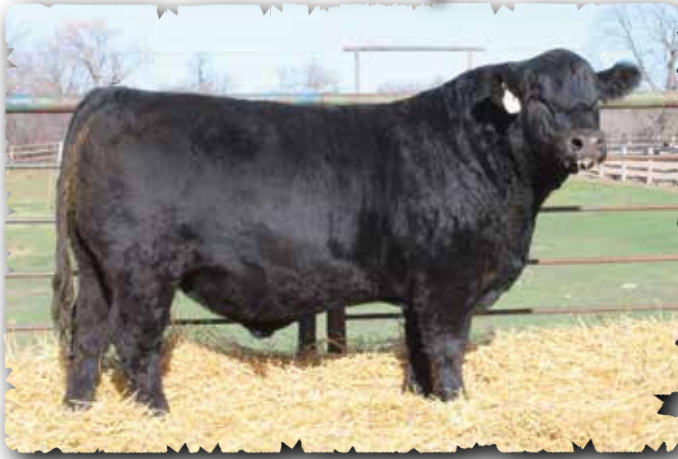
PEAK DOT BIG RIVER 2030K - LOT 62