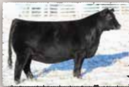
Peak Dot Queen 15G Purchased by KT Ranch for $24,000