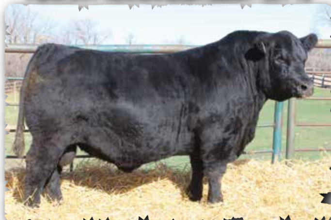
PEAK DOT ROUGHRIDER 3130K - LOT 79