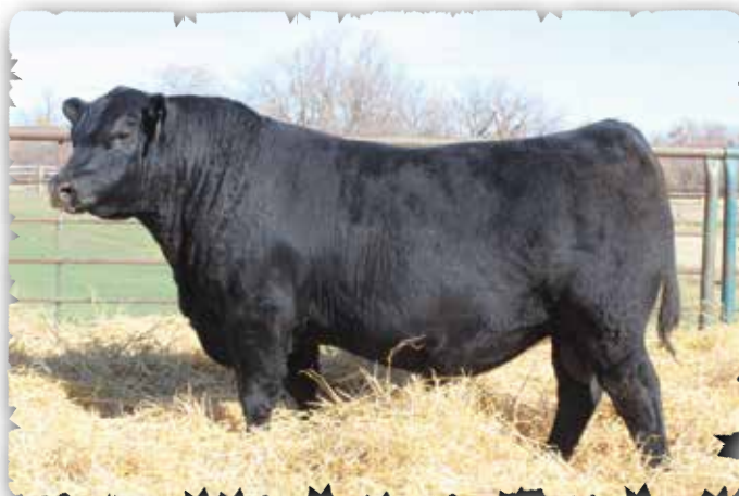
PEAK DOT COLOSSAL 2128K - LOT 18