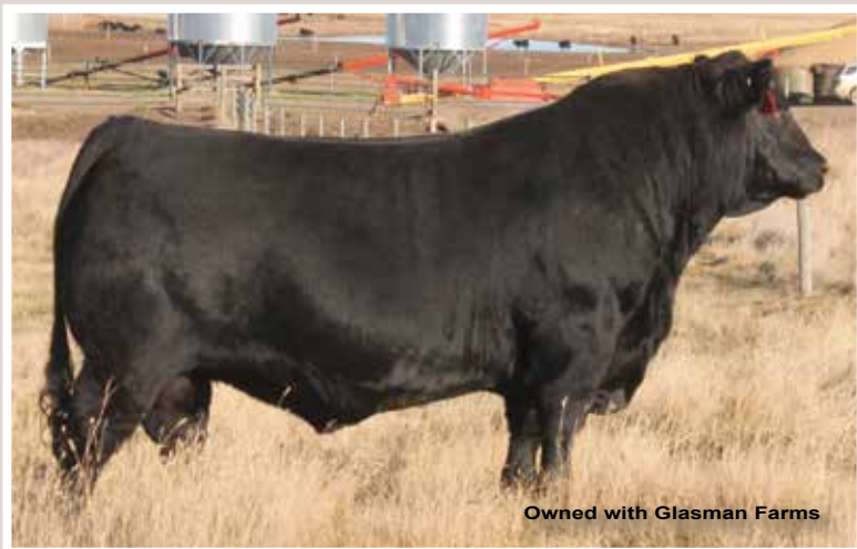
Owned with Glasman Farms

SAV HERITAGE 6295 SAV HARVESTOR 0338 SAV EMBLYNETE 7749 JANSSEN EARNHARDT 5003 SAV BRAND NAME 9115 SAV MISS BOBBIE 2407 SAV MISS BOBBIE 0045