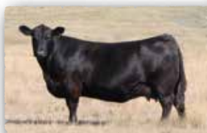
PEAK DOT BARDOLIA 19C Maternal grandam of lot 31