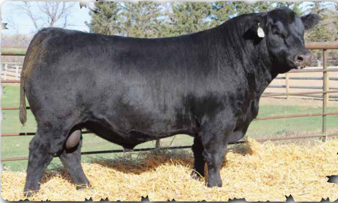
PEAK DOT BIG RIVER 2215K - LOT 58