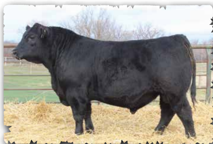
PEAK DOT NO DOUBT 544K - LOT 107