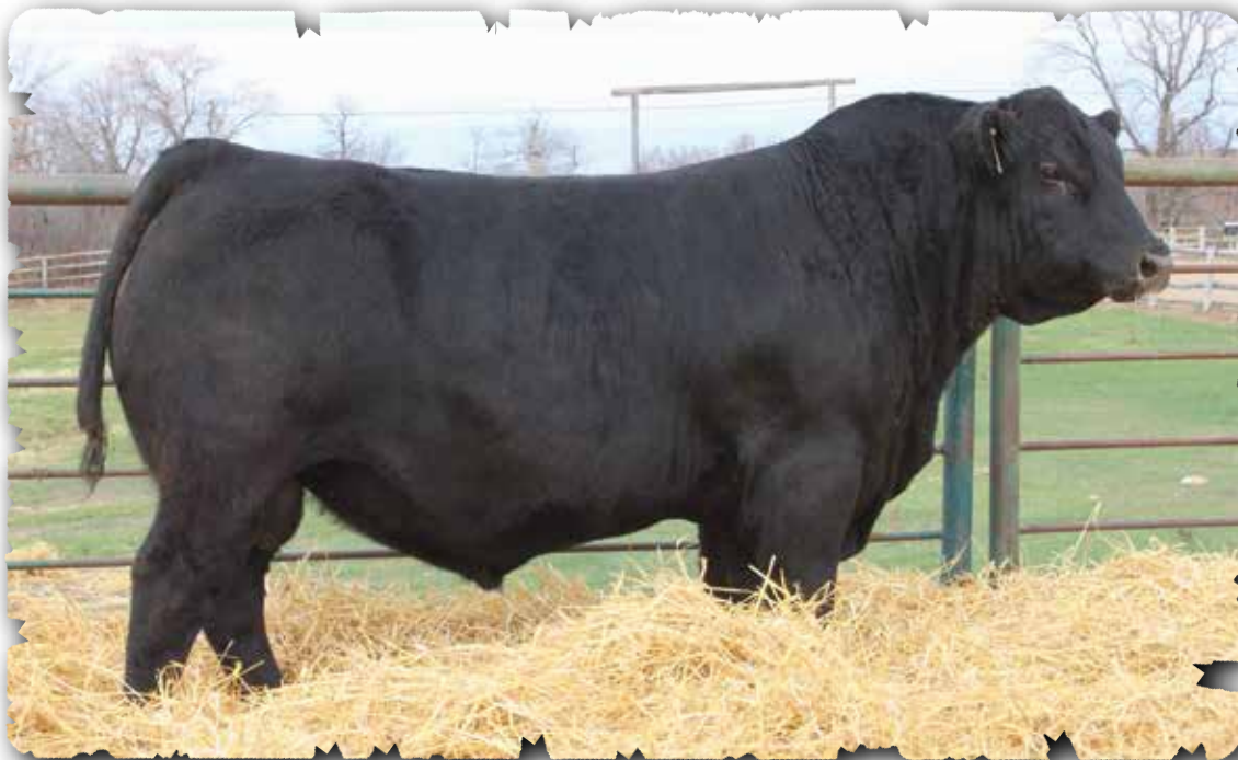
PEAK DOT NO DOUBT 511K - LOT 104

No Doubt was a hunk that turned in an adjusted 1540 pound yearling weight, ratio 113 to be the #1 adjusted yearling weight bull in the 2015 Hoover sale! He also scanned a 3.91 IMF, ratio 108, and tied as the top scanning ribeye bull (among 81 yearlings) with a 17.3" ribeye, ratio 114! No Doubt is a superb disposition bull that has the style and eye appeal everyone likes. He is exceptionally stout, and has definitely put meat and muscle in his calves. No Doubt sons are proven and have been very well received throughout the industry. No Doubt sons continue to top sales across North America.