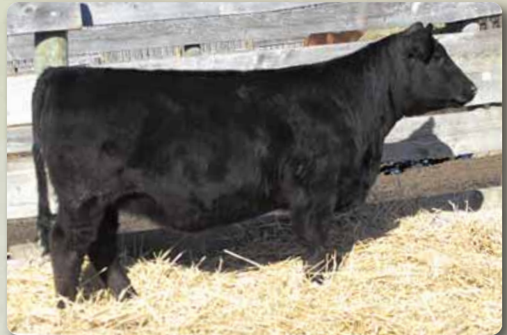
LOT 34 - FRL Patricia 837F

What a sweet heart of a heifer calf. Her mother has produced 2 sale bulls in a row and now this doll. She is awesome minded and has tons of rib shape. This heifer would make a nice junior project but most importantly will be a solid producing cow in the future.