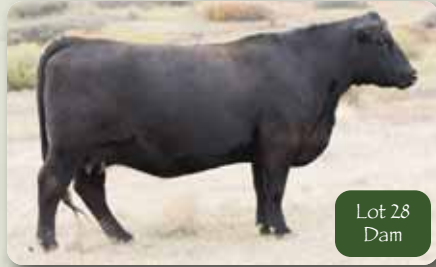
Lot 28 Dam