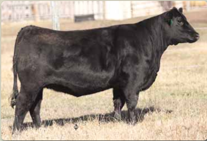
LOT 7 - Gold-Bar Lady Ann 530E