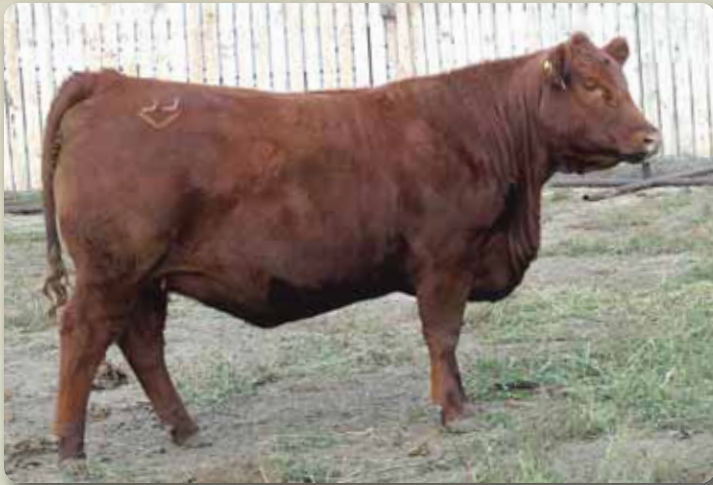
LOT 19 - Red Lines Roberta 21E