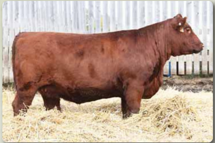
LOT 17 - Red U6 Alana 21E

We bought the Breakout sire for his all-out performance, but the quality of his daughters may be where he is really going to shine. Being an Alana female certainly adds a lot here- 42Y is a never miss female. The service sire is a fancy son off Coleman, one of our top heifer friendly herd sires ever. Cavalry should leave stylish, good footed calves, with super udders on his daughters. Bred to Red U6 Cavalry 28E on May 16th. Ultrasounded safe for Feb. 22nd due date.