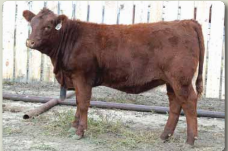
LOT 30 - Red Lines Bayberry 11F

11 F is it dark red Scoof 10D daughter that is hard to part with. Excellent feet, body depth and thickness plus a sweet disposition make her a good investment for the future. Her dam,35D came to us in Dam from the S- dispersal and did a bang up job on her first try at motherhood.