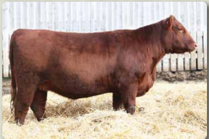
LOT 24 - Red U6 Polly 123E

Observed bred and vet checked safe to calve Jan. 21st to U6 Bamazon 36A, a red carrier and a full sibling to Red U6 Alana 13X who is a donor cow at Six Mile.