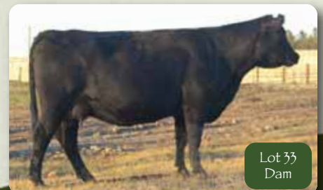
Lot 33 Dam