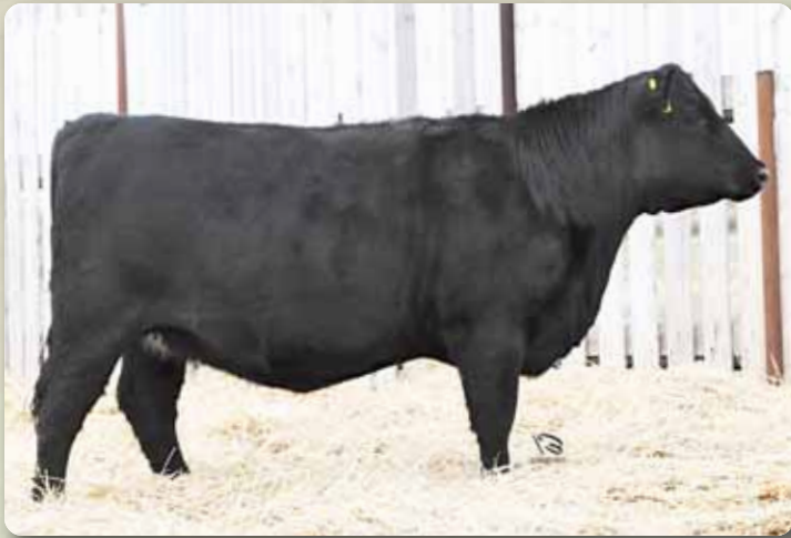
LOT 13 - Triple H Lady Pride Int 81E