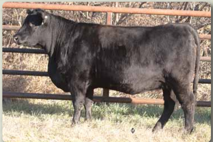
LOT 6 - Midnite Oil Grace 35E

Exposed to JL Final Answer 7059 May 10th-September 18th.