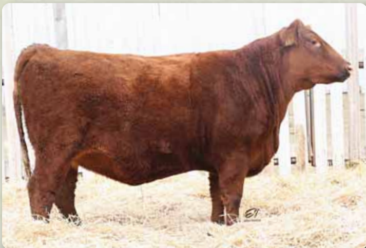
LOT 21 - Red Triple H Lulu 43E

AI bred to TWG Tommy Jack 166A May 5/18. Pasture exposed to Red Six Mile Rawhide 614D May 15/18. Preg checks favourable to AI service.