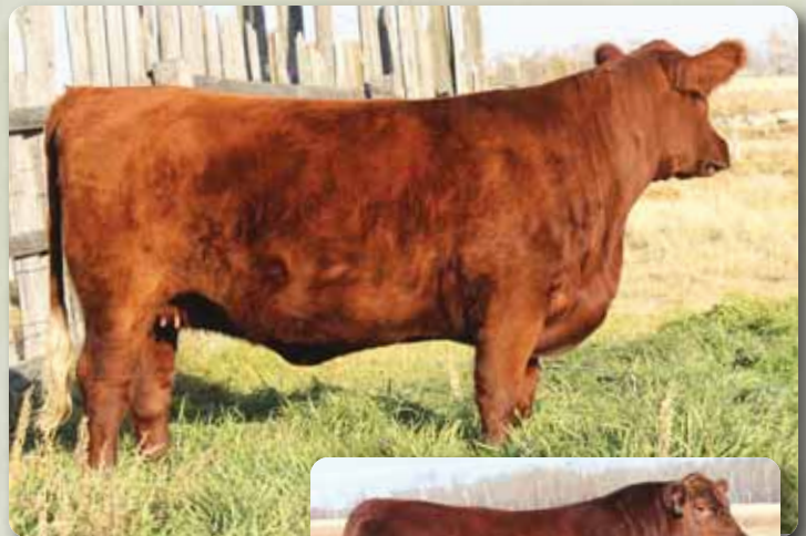
LOT 23 - Red T&S Miss Impact 53E

13E is a New Direction son we raised off one of our foundation cows 18W. He is dark red with tons of hind quarter, BW of 75 lbs. and extremely structurally correct. We showed him last year at Agribition and decided to keep him and use him ourselves. This year he took home Champion Jr. Angus Bull at Prince Albert, Champion Bull at Nipawin Fair and Champion Bull at Shand Fair. He will also be at Agribition this year. Exposed to Red T&S New Direction 13E until July 10, 2018. Observed bred on April 23 which would be January 30 to calve. Vet checked safe to this date.