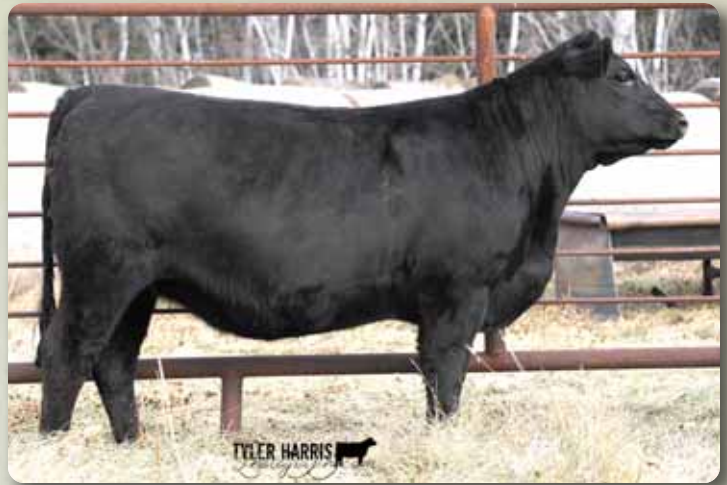
LOT 4 - Nesset Lake Erica 6E

Safe to AI service on April 10th, 2018 to SAV Final Answer 035. Due January 18th, 2019.