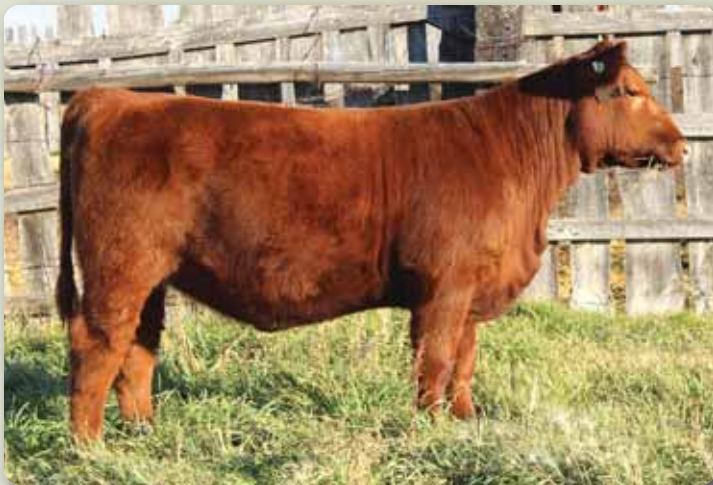
LOT 26 - Red T&S Patricia 90F