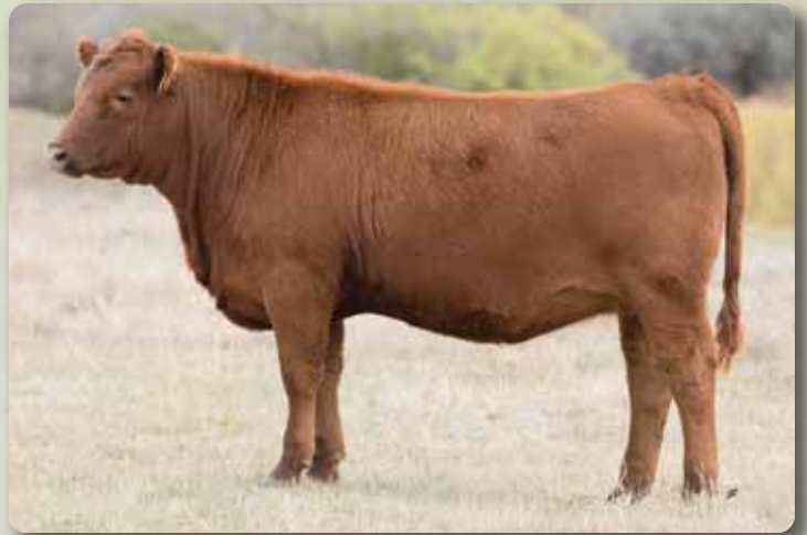
LOT 28 - Red Burdick Design 58F