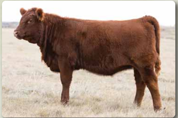
LOT 29 - Red Burdick Goldie 81F