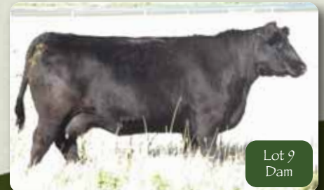
Lot 9 Dam

Exposed April 15th-June 4th to FRL Black Snake 33E. Due Mid February.