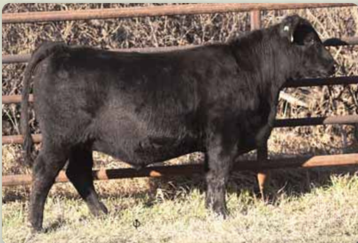
LOT 15 - Midnite Oil Queen 147E

Here's a powerful heifer with a twist on her pedigree on the top side tracing back to the Dutch bull who left tremendous females. I spoke earlier about the value of the Tomcat females, well here's one out of a first calver that rose through the ranks. Exposed to JL Final Answer 7059 May 10th-September 18th.