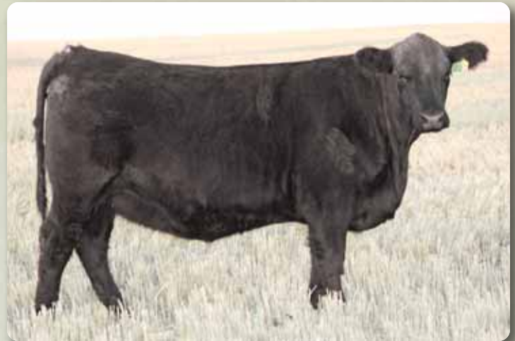
LOT 10 - Sunny Grove Camilla 35E

DLR 35E is a large framed, deep ribbed daughter of American Made and is a maternal sister to the dam of our 2017 high selling bull going to BJ Cattle Co. A.I. May 8 to HF Tiger 98X. Exposed May 20 Stevenson Legend 70237. Preg checked Aug. 27 at 85 days.