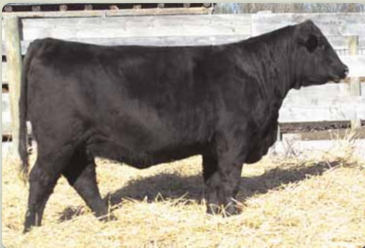
LOT 3 - FRL Countess 712E

DLR 15E is a long bodied feminine fronted heifer from the beautiful uddered Panic Switch dam 9A. Her sire is the powerful Gustov 3Z. A maternal sister sold last year to Darlene Scriber. A.I. April 27 to SAV Angus Valley. Exposed May 20 to Stevenson Legend 70237, a light birthweight son of Legend 3181. Preg checked Aug. 27, 120 days.