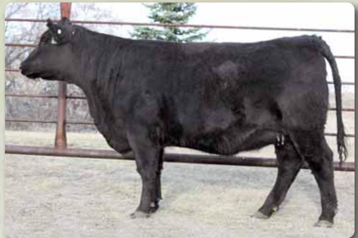
LOT 11 - Sunny Grove Ruby 41E