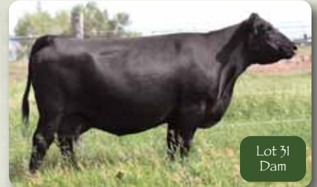
Lot 31 Dam

101F is a long made, well balanced female with a ton of potential. Her dam is bred back early and still going strong at the age of 12. Her sire Northern View Gustov was quietly leaving his mark on the industry until the great folks at Miller Wilson found him and we all know they only mess with the good ones, he is as impressive as they come. Take a look sale day, and if longevity is important then 101F will fit your program.