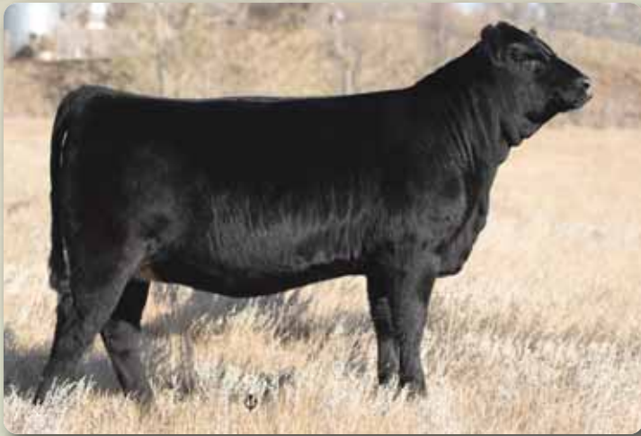
LOT 31 - Gold-Bar Pride 101F