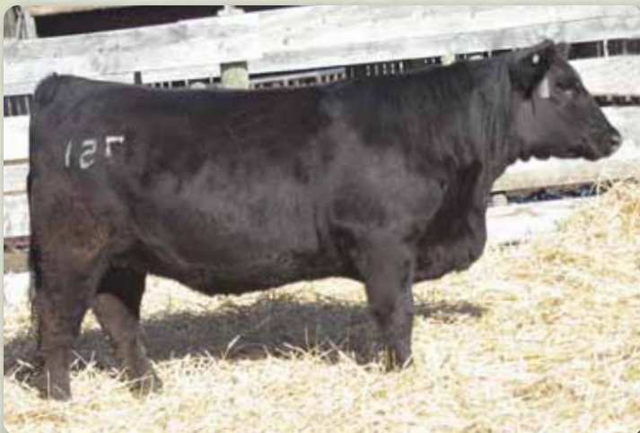
LOT 9 - FRL Annie K 751E

AI bred to Soo Line Motive May 5/18. Pasture exposed to Triple H Intuition 14B May 15/18. Preg checks favourable to AI service.