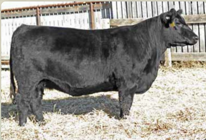
LOT 1 - WWF Seedstock Keepsake 88E