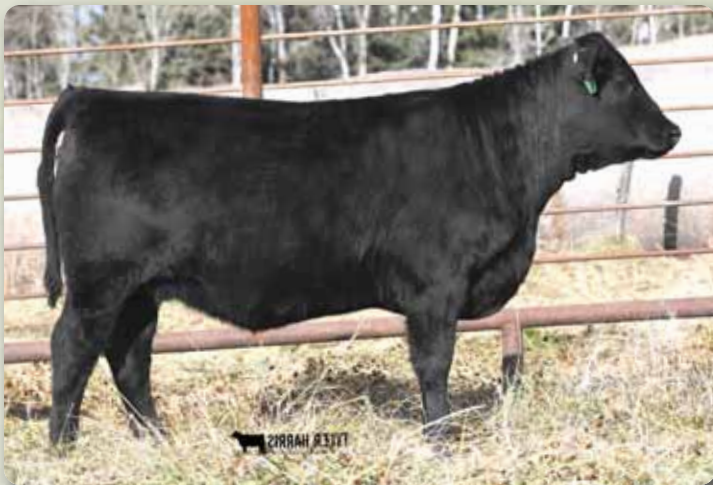
LOT 32 - Nesset Lake Erica 12F