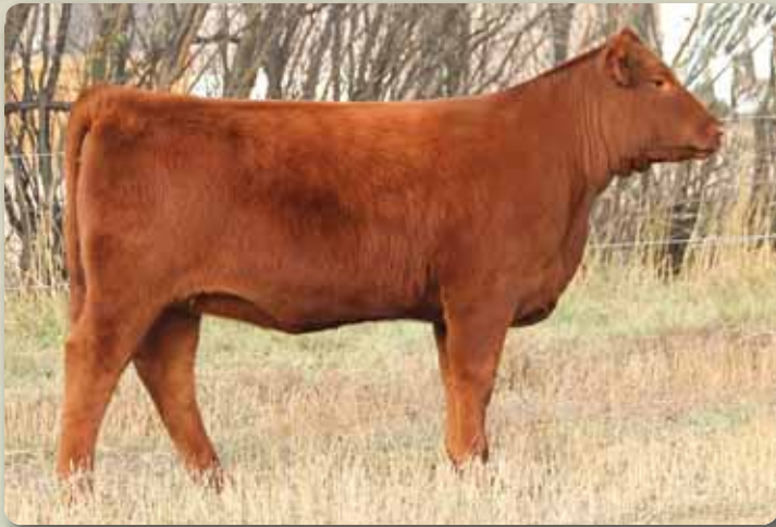
LOT 25 - Red Rock Point Rosaline 14F