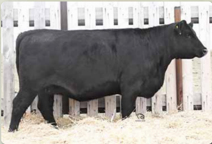
LOT 8 - Triple H Fortitude Heroine 15E