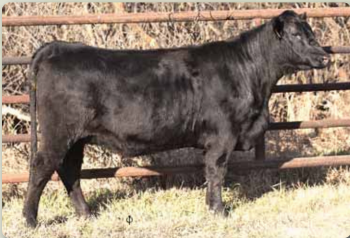
LOT 14 - Midnite Oil Quantum Lady 85E

AI bred to Soo Line Motive May 5/18. Pasture exposed to Triple H Fortitude 11E (a PA Fortitude 2500 son we feel has a bright future in our herd) May 15/18. Preg checks favourable to AI service.