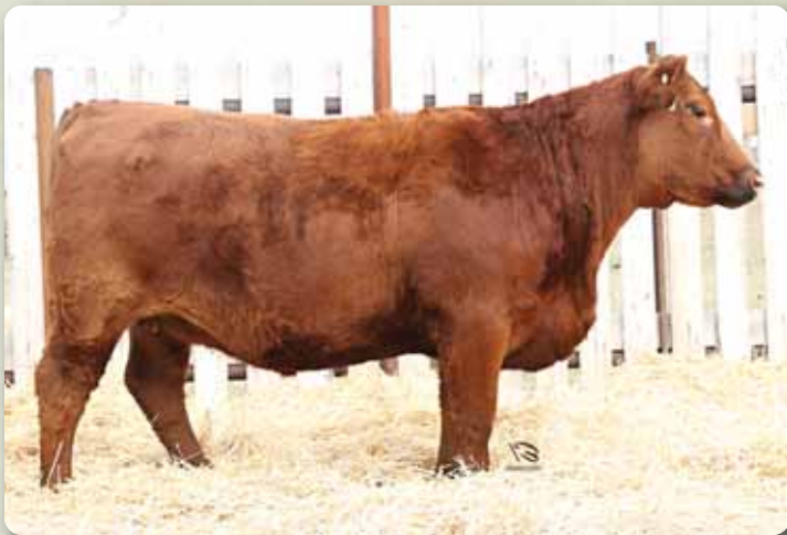
LOT 20 - Red Triple H Lana 65E