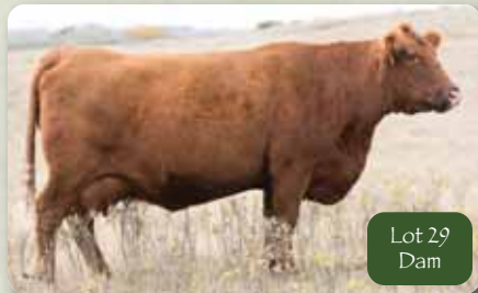
Lot 29 Dam