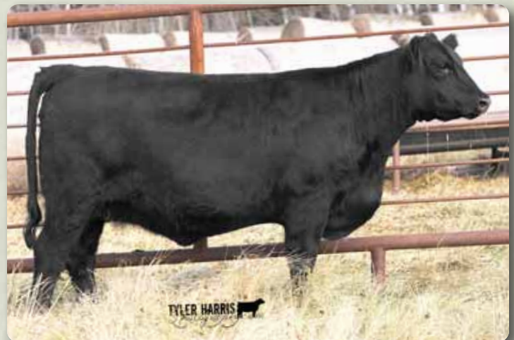
LOT 12 - Nesset Lake June 44E

A very powerful female, which is no surprise being out of Basin Payweight 107S. She is a very clean-fronted female with an extra rib. Our Payweight progeny have been in demand every year, the extra length of spine and pop catches everyone's eye. Her dam has been a very functional female out of Hilow Super Systems 12S. She is safe to AI service on April 10th, 2018 to our herd sire HF Sequal 40Y. The Sequal Payweight cross has worked very well for us. Due January 18th, 2019.