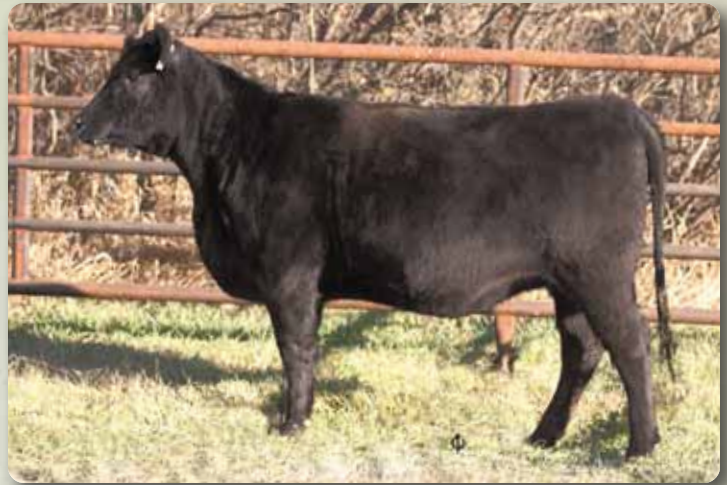
LOT 16 - Midnite Oil Erelite 32E

A power daughter of the Eliminator bull, who again has left a trail of awesome females for us. The Traveler bull left us many good females over the years as well and crossed with the Erelite cow family wraps the goodness into one total package. Exposed to JL Final Answer 7059 May 10th-September 18th.