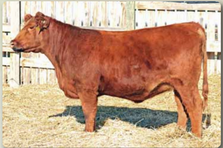
LOT 22 - Red WWF Prov Daisy 151E

Exposed May 7 to June 9 to Red Kenray Staunch 61D, the high selling bull in Kenray's 2017 sale. He is a calving ease sire with a strong maternal heritage whose first calves identify him as a great breeding bull. Preg tested Oct. 20 safe 150 days.