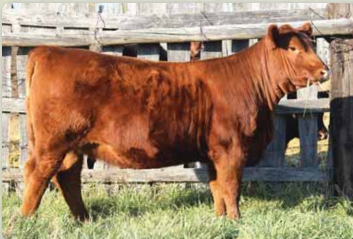
LOT 27 - Red T&S Rosa 4F