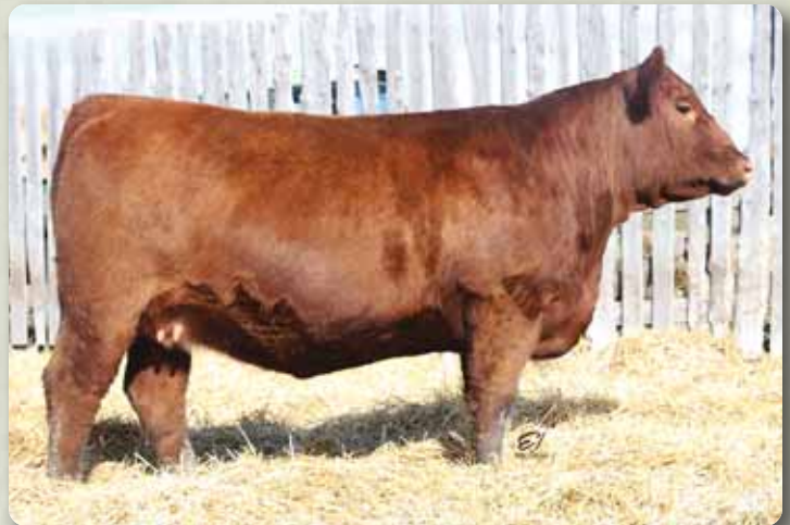
LOT 18 - Red U6 Cally 39E

The dam of this heifer is a top cow that is destined for the flush pen next time around. The service sire's dam is an ET daughter of the great Ruby 10T flush cow who was the chosen females from "The pick of the Mar Mac heifers" purchased from Red Roundup. 39E is a capacious, pretty, sound and complete package and the calf she's carrying has maternal donor quality females running down every branch of his or her family tree, important whether it's a bull or heifer. Bred April 26th to Red WRAZ Ozzie 129E. Ultrasounded safe for Feb 2nd due date.