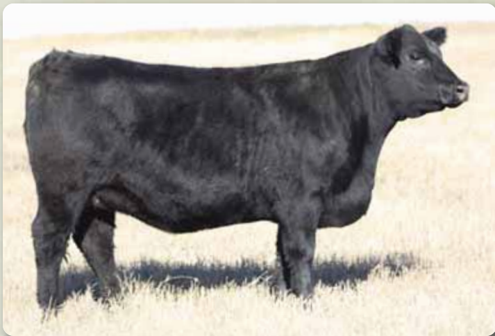
LOT 2 - Sunny Grove Erica 15E

This ultra feminine and smooth made brood cow prospect is right off the top of our replacement pen. Seedstock has done a fine job for us as a son in our Git 'R Done Bull Sale created a lot of interest and was our high selling bull. Keepsake 38W is an Elite Dam. What better evidence of her future producing ability! Observed bred June 5 to 66 Cedar Wind 299E, a young calving ease bull with extra muscle selected from the 66 Ranch Bull Sale where he was one of the features. He had a birth weight of 69 lbs., an adjusted weaning weight of 717 lbs. (1st out of 60) and an adjusted yearling weight of 1,289 lbs.