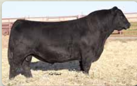
Stevenson Legend 3181 - Sire of Sunny Grove Service Sire

DLR 41E is an attractive grandaughter of Mich Annie's Angel 35U, the 2010 National Grand Champion Female and Agribition Champion. 41E's dam is a deep bodied daughter of Final Answer. A.I. May 2 to SAV Angus Valley. Exposed May 20 to Stevenson Legend 70237. Preg checked Aug. 27 at 105 days.