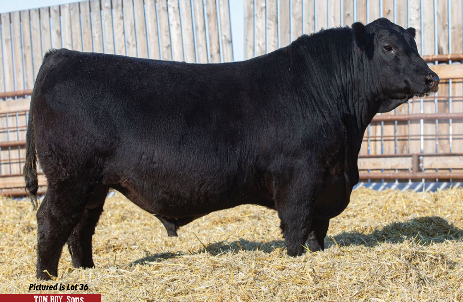
Pictured is Lot 36