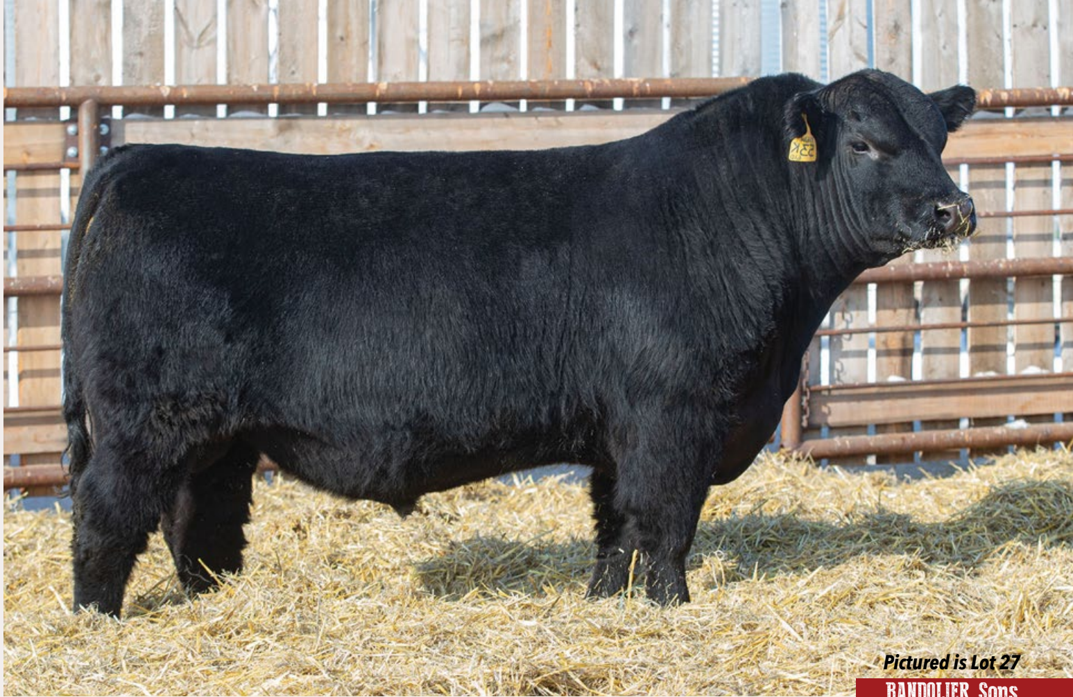
Pictured is Lot 27