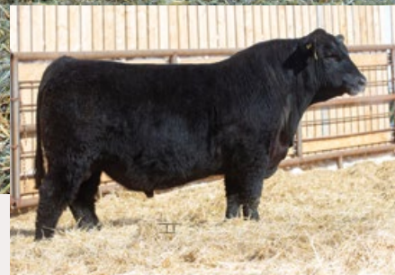
Blackman 24H Maternal Brother to FAR 123K