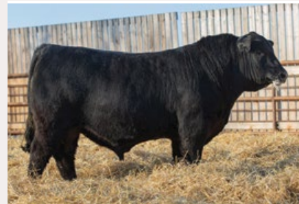
Winston 143J - Maternal Brother to FAR 123K