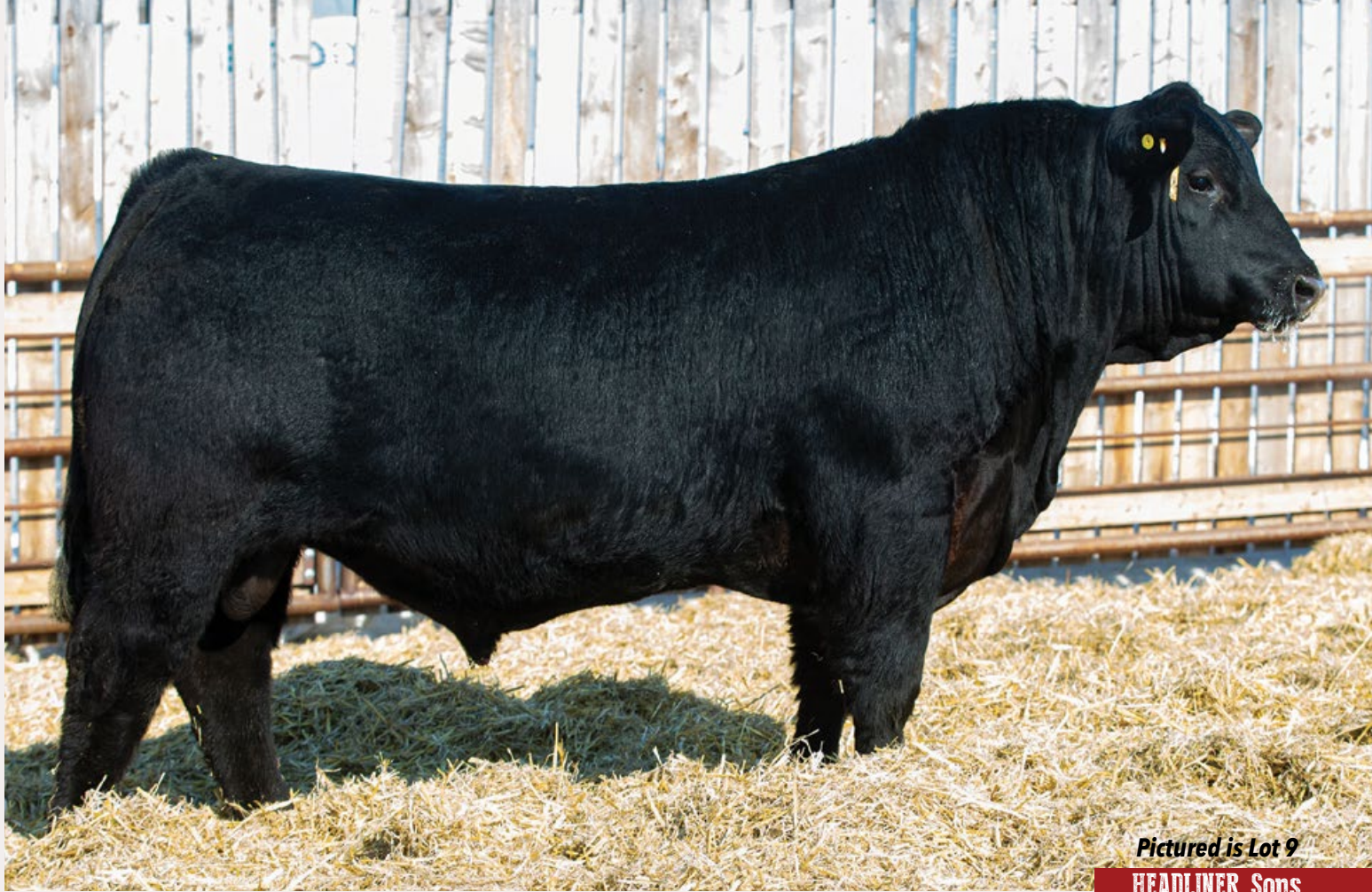
Pictured is Lot 9 HEADLINER Sons