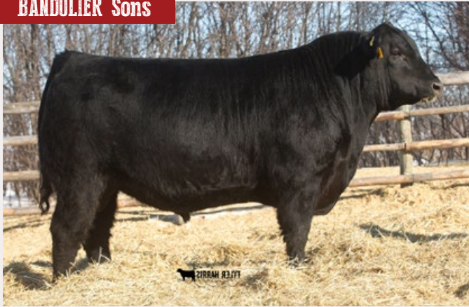
Northern 71E - Maternal Brother to FAR 143K