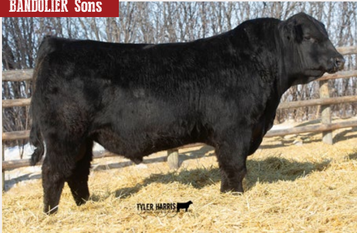
Winston 11F - Maternal Brother to FAR 34K