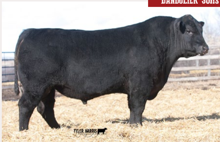
Eric 43C - Maternal Brother to FAR 167K