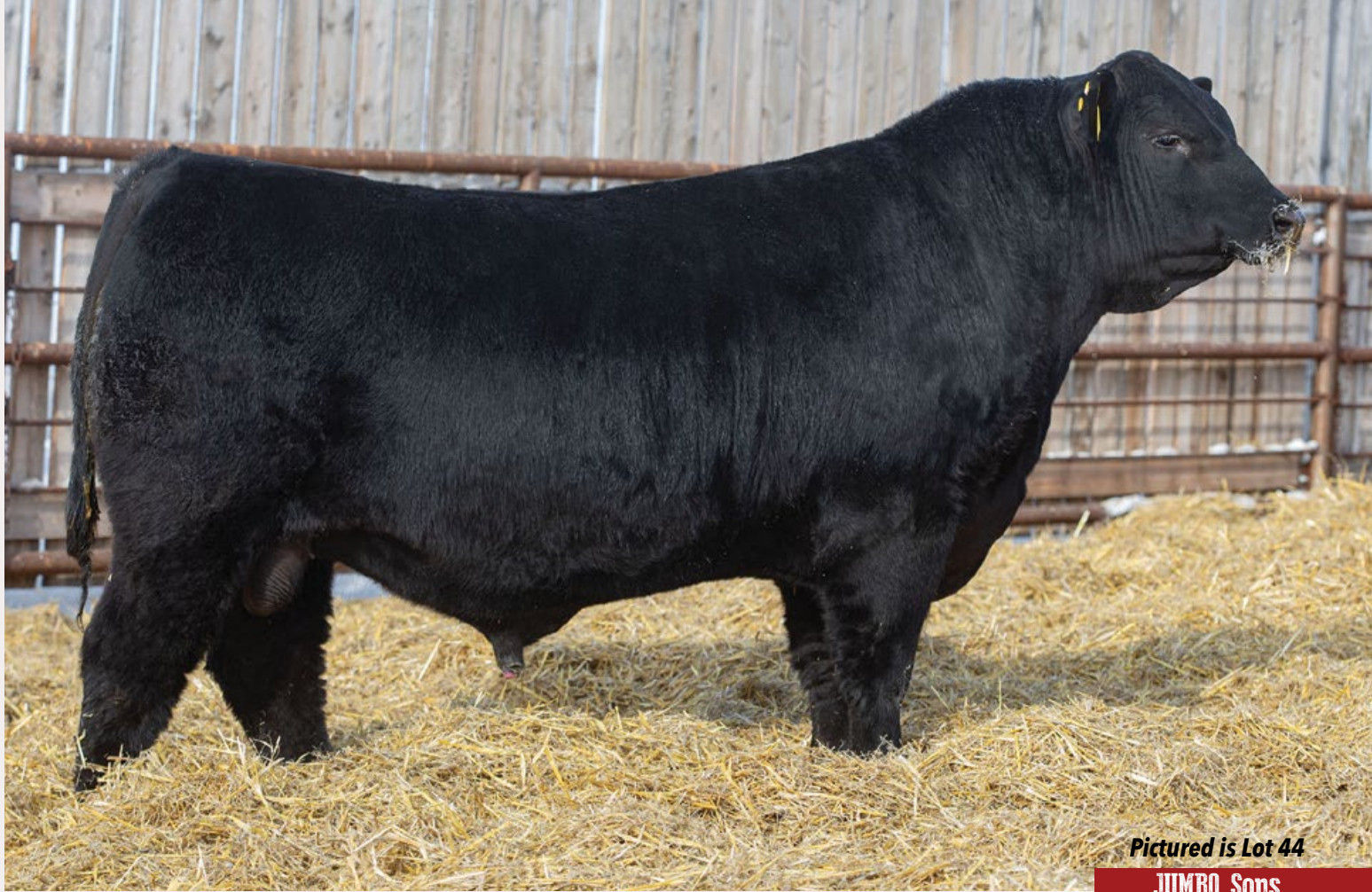
Pictured is Lot 44