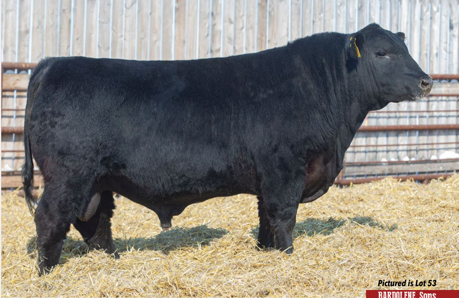
Pictured is Lot 53