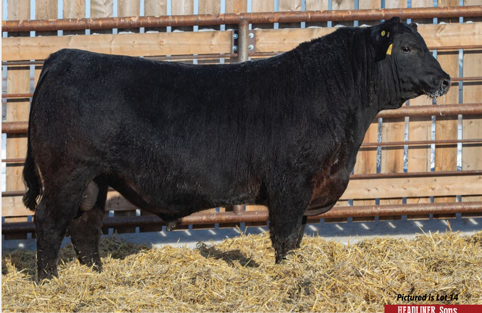
Pictured is Lot 14