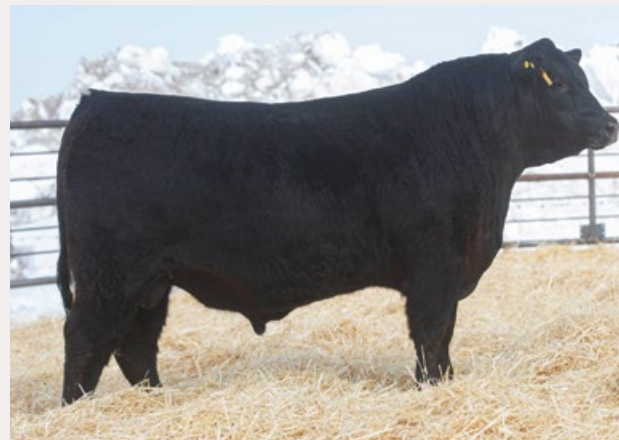
Blackman 91G - Maternal Brother to FAR 22K