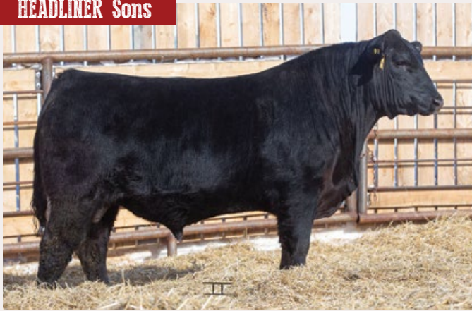
Tom Boy 68H - Maternal Brother to FAR 10K