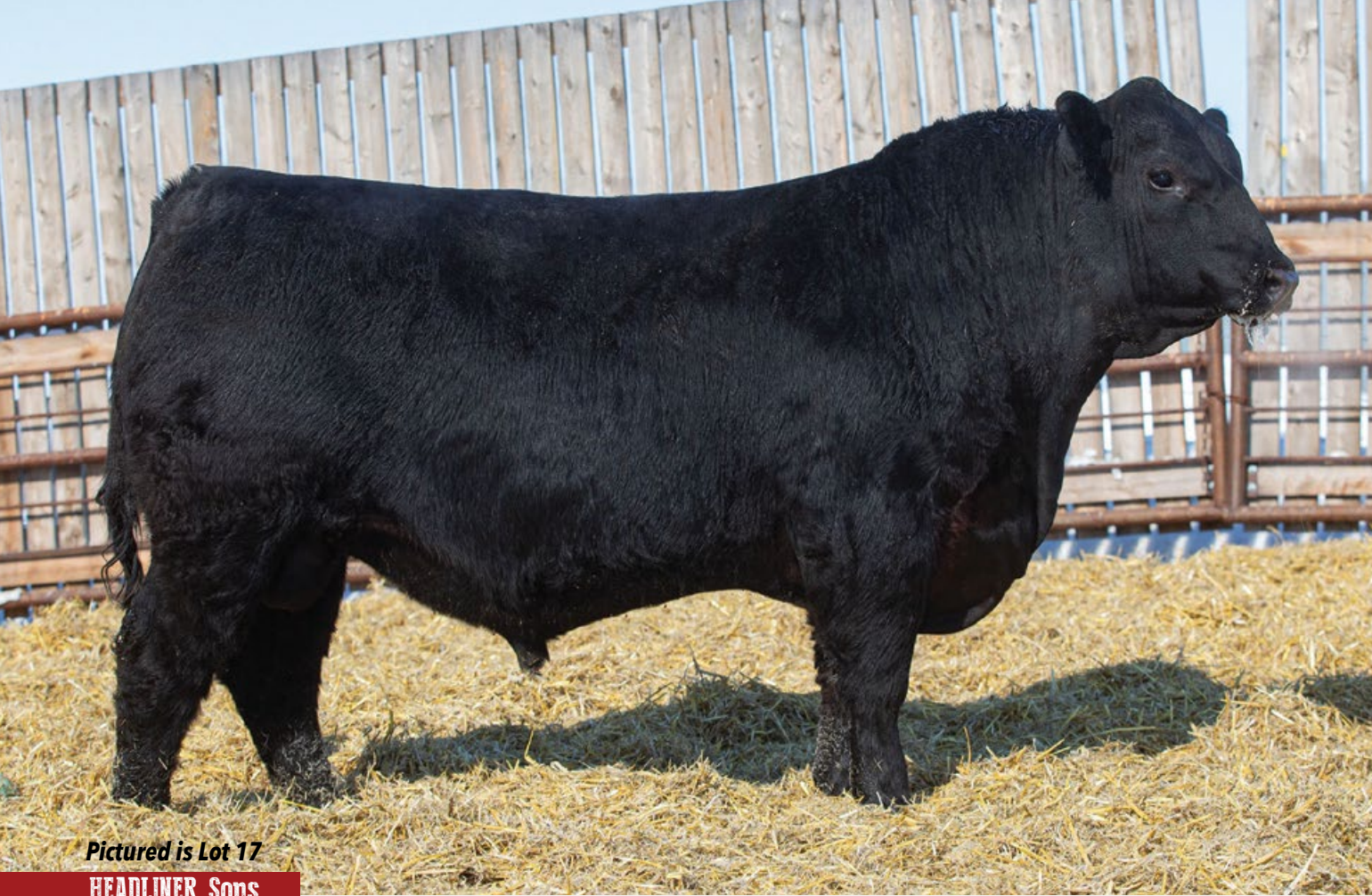
Pictured is Lot 17