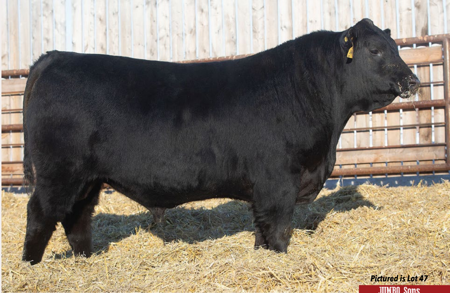
Pictured is Lot 47