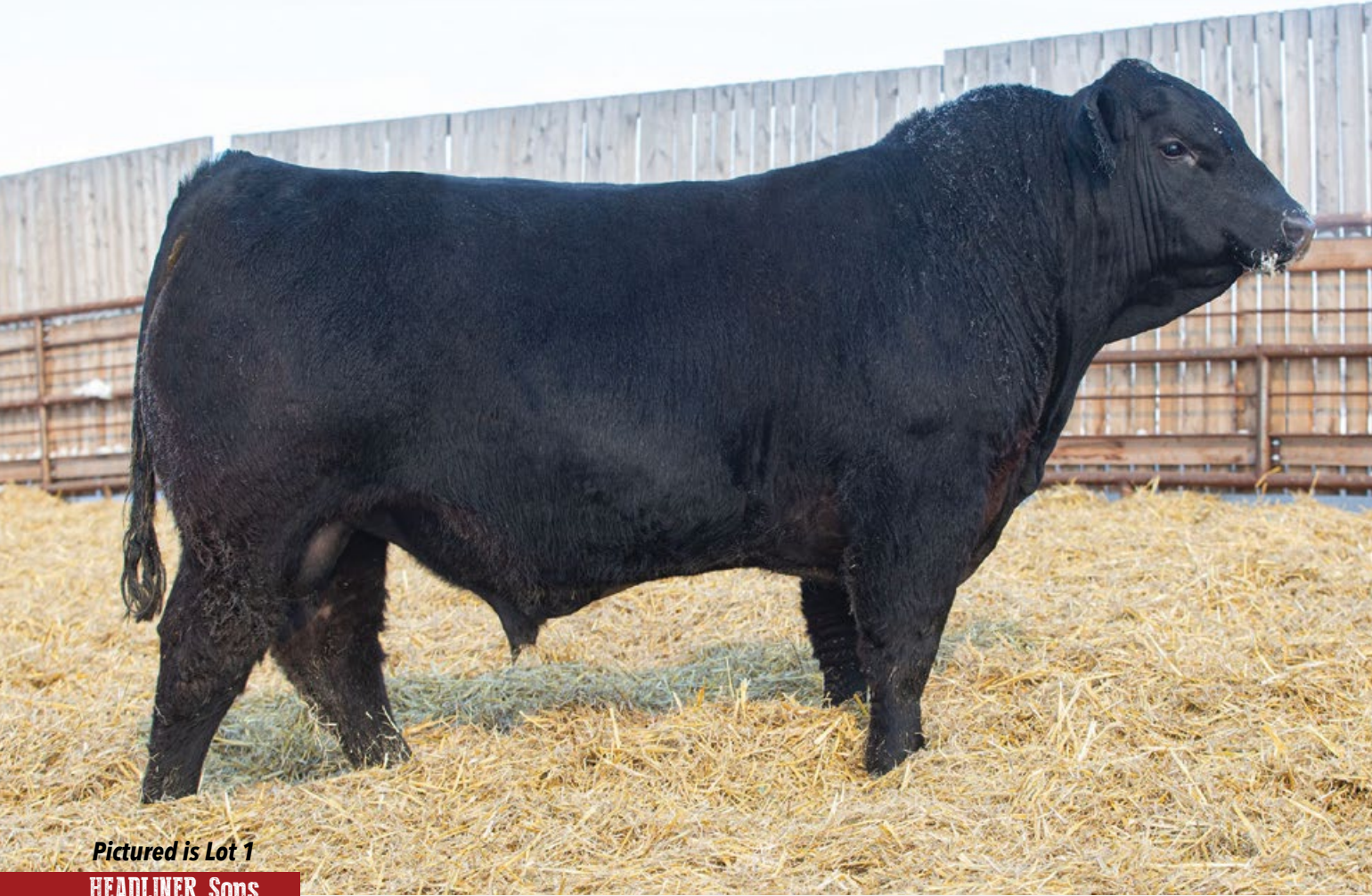
Pictured is Lot 1 HEADLINER Sons