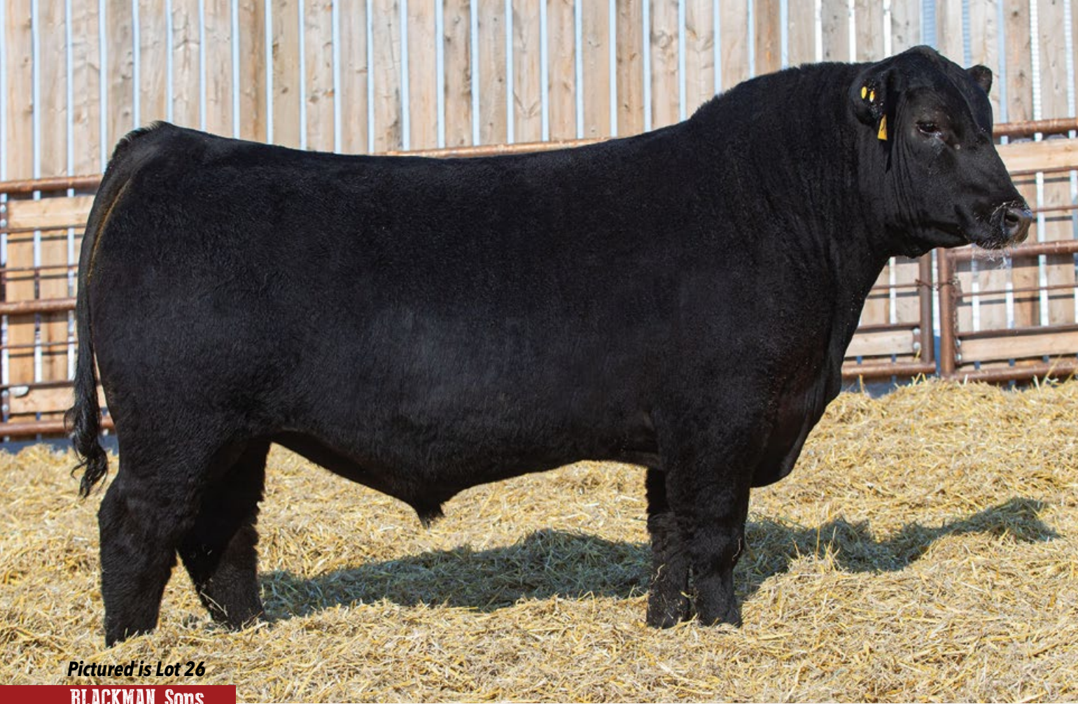
Pictured is Lot 26