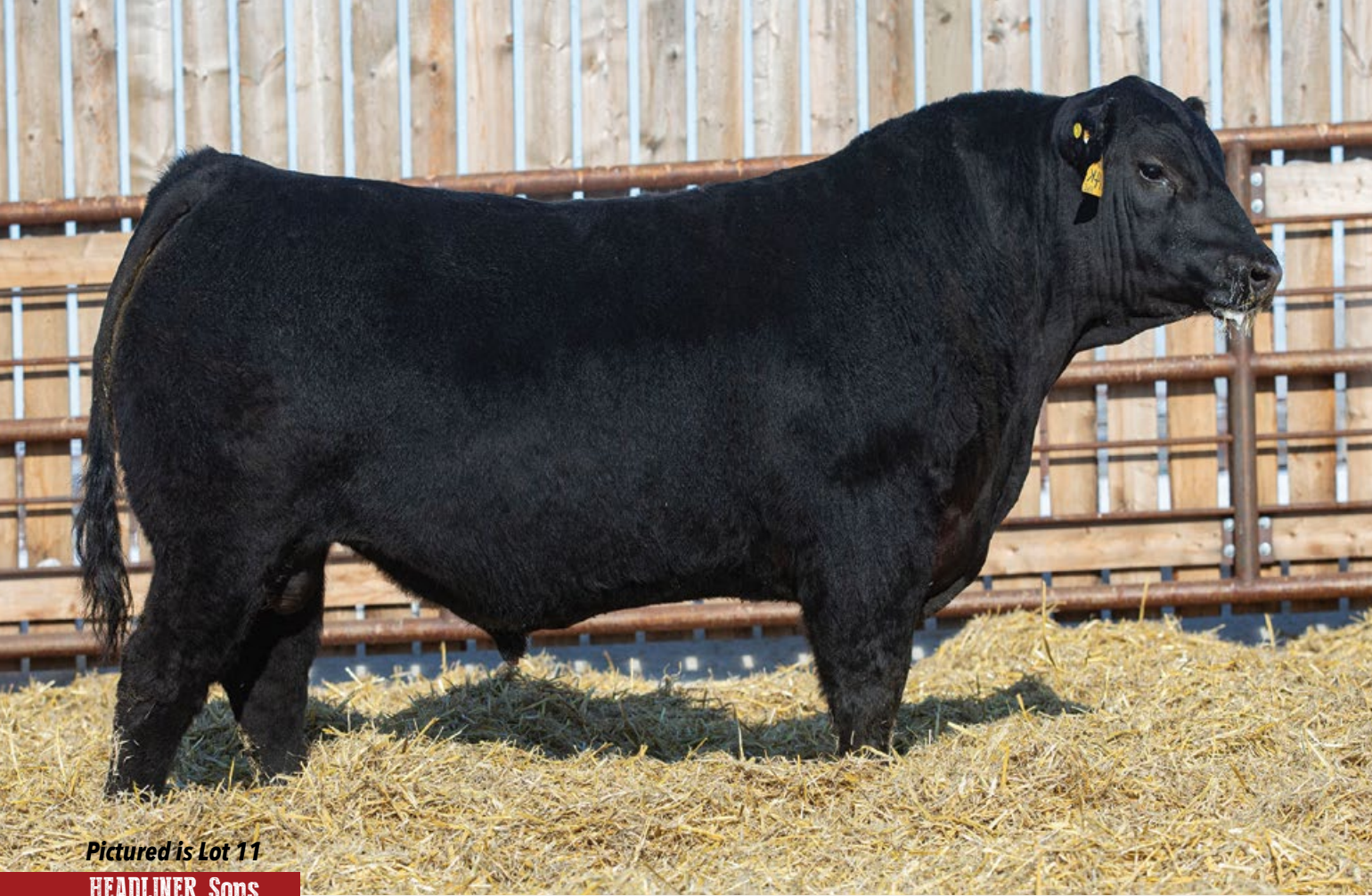
Pictured is Lot 11