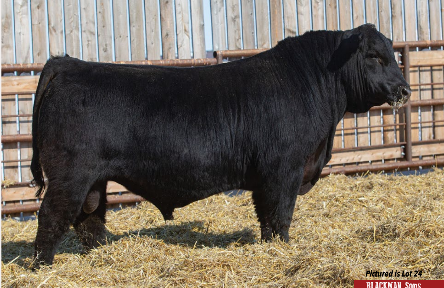
Pictured is Lot 24