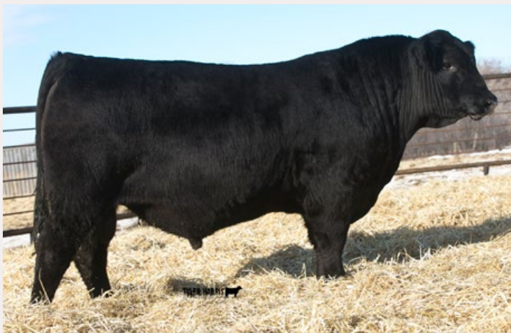
Bardolene 87D - Maternal Brother to FAR 167K