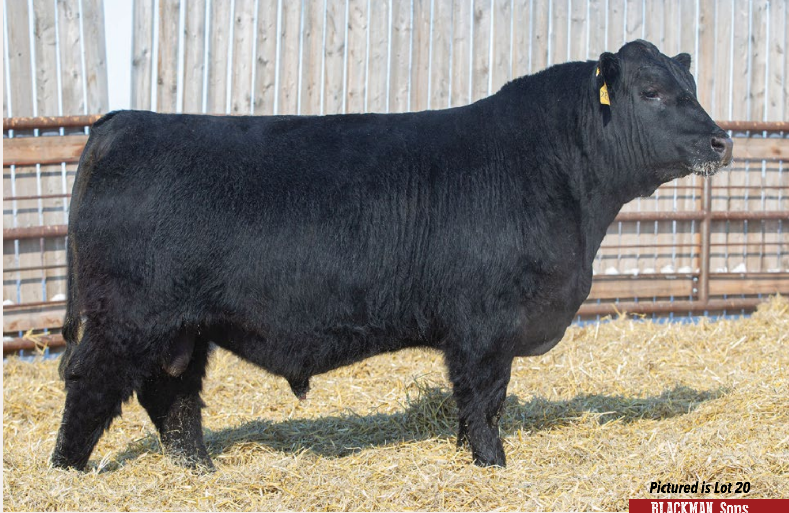
Pictured is Lot 20