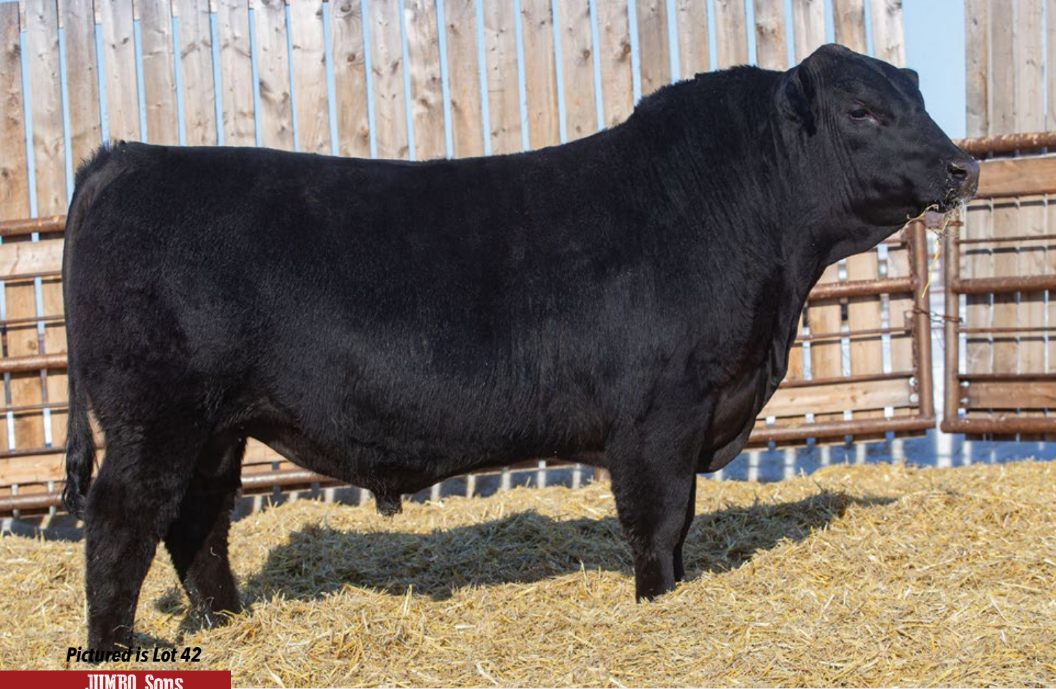
Pictured is Lot 42