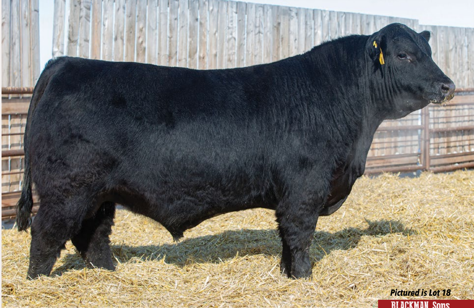
Pictured is Lot 18