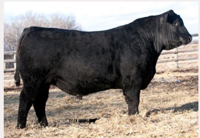
Tom Boy 71C - Maternal Brother to FAR 53K