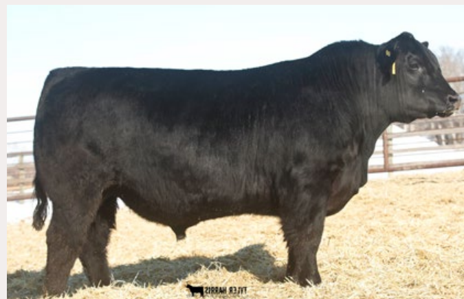
Northern 95E - Maternal Brother to FAR 142K