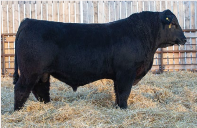
Headliner 131J - Full Brother to FAR 29K