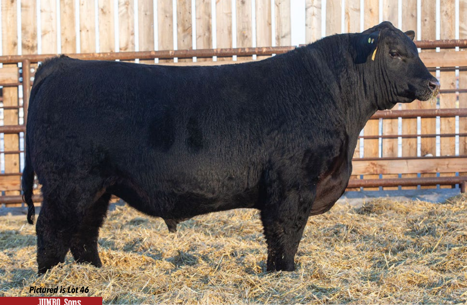
Pictured is Lot 46