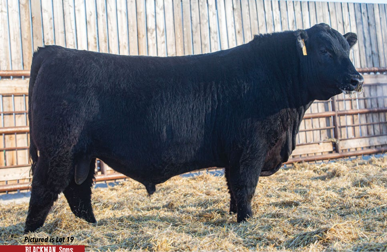
Pictured is Lot 19