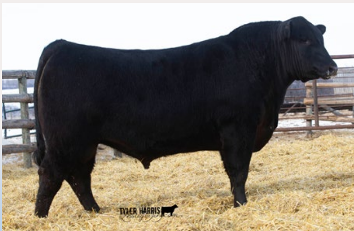
Tom Boy 72F - Maternal Brother to FAR 167K