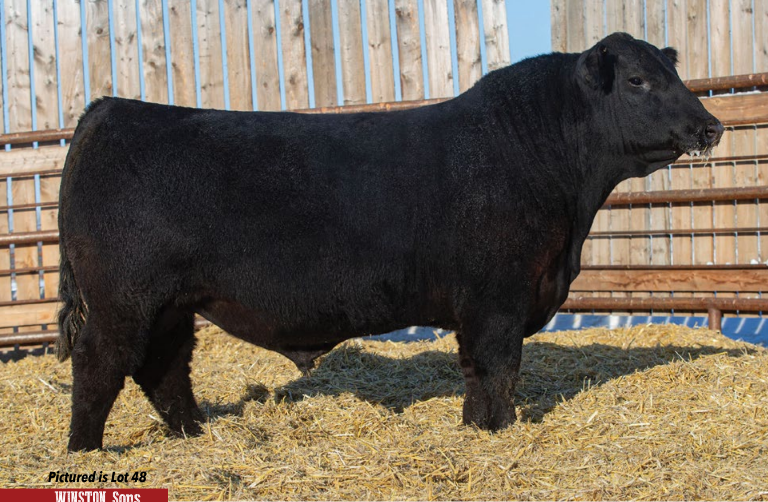
Pictured is Lot 48