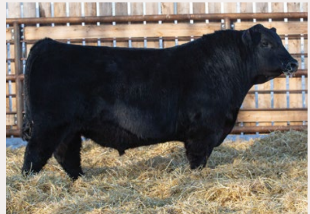
Bandolier 74J - Maternal Brother to FAR 129K