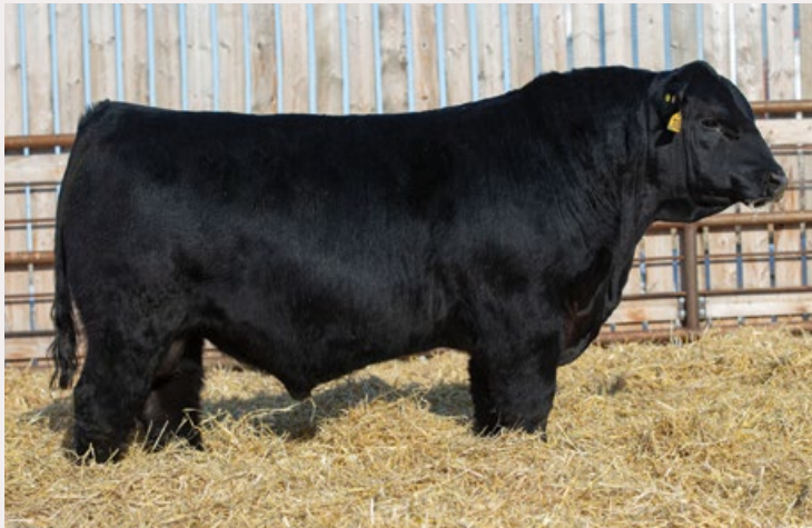
Headliner 51J - Maternal Brother to FAR 34K