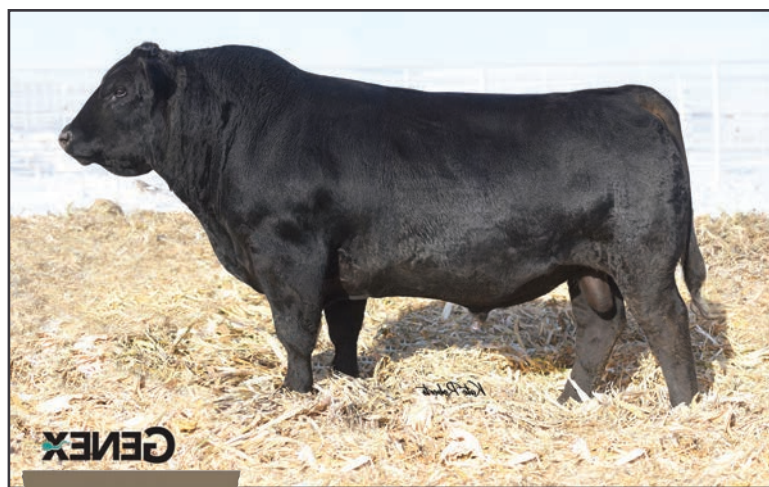
PA Fortitude 2500