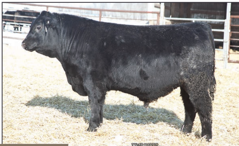
Early Sunset Augustine 168

Bred to: Early Sunset Augustine 168 Service: April 25th- July 1st Due: Mid March