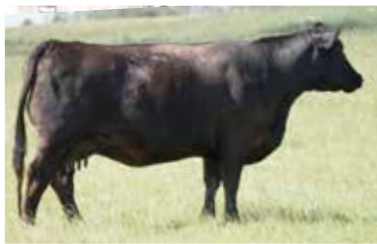
Dam Rivercrest Anne CSP 75A

Another No Doubt Herd Sire Prospect out of one of my top end cows. This thick, stylish No Doubt son walks on a very good foot and has a gentle disposition. Sold a full brother last year to Sandy Bar Angus. Dam 75A: 3 males Avg BW 86 lbs WW Ratio 102 3 females Avg BW 77 lbs WW Ratio 99