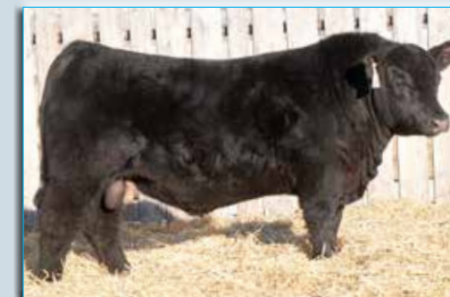
Rivercrest No Doubt 45H