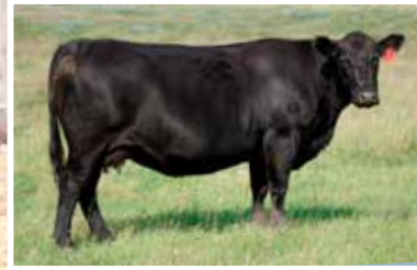
Dam Rivercrest Daisy 60C

Another March Dually daughter out of a super nice Eliminator dam. Sept 18 WW: 600 lbs