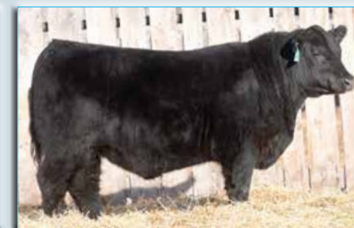
Rivercrest No Doubt JLLS 127H