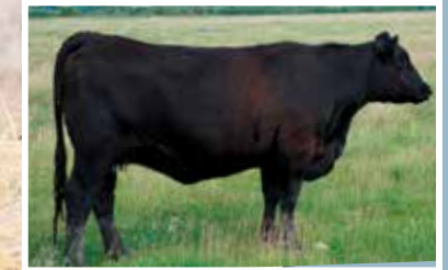
Dam Rivercrest Anne 31Y

A very nice Dually daughter with tow strong cow families on both sides. Sept 18 WW: 655 lbs