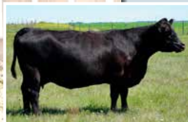
Dam Rivercrest Margaret 19Z