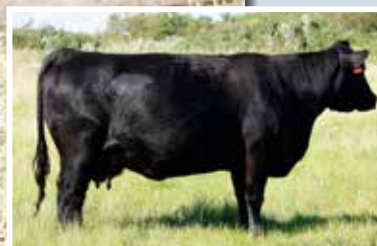
Dam Rivercrest Tiptop CSP 17A