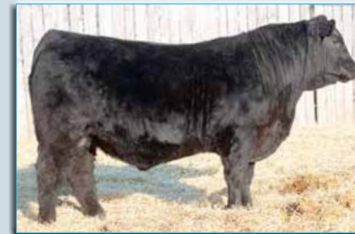
Rivercrest No Doubt CSP 12H