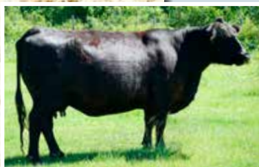
Dam Rivercrest Blossom 36Y