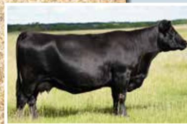
Dam Rivercrest Tibbie CSP 23B