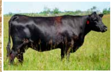
Dam Rivercrest Duchess CSP 13A

Feature Herd Sire Prospect that is structurally and possibly the best No Doubt son yet. Sound from the ground up. Just a powerhouse of a bull with a real good foot and super thick, with loads of eye appeal. The dam comes from our very stron Duchess cow family. Sept 18 WW: 780 lbs Dam 13A: 6 males Avg BW: 81 lbs WW Ratio 97 1 female Avg BW: 74 lbs WW Ratio 93