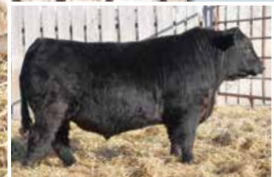
Full brother to 6J & 7J, River Valley Stunner 4G sold to Hamilton Farms in 2020.