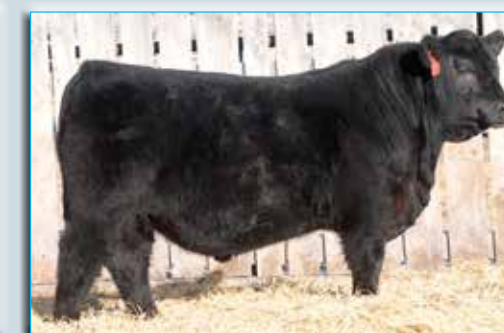
Rivercrest No Doubt CSP 109H