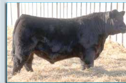
Rivercrest No Doubt CSP 85H