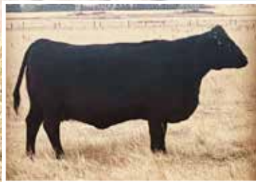
Dam River Valley Lady 11B