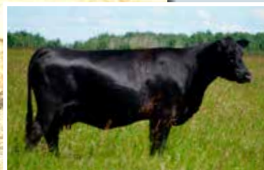
Dam Rivercrest Erica Kay CSP 5Z

Feature Herd Sire. This is a full brother to our high selling bull last year, purchased by Stauffer Ranches. This March calf is a stud. Calving ease bull with top end performance. He is the total package. Style and thickness to burn and strong maternal traits and walks with a solid foot. His dam is a front end cow that holds Elite Dam status. Sept 18 WW: 695 lbs Dam 5Z: 7 males Avg BW: 83 lbs WW Ratio 107 1 female Ave BW: 61 lbs WW Ratio 98