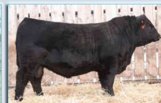
Rivercrest No Doubt CSP 17F