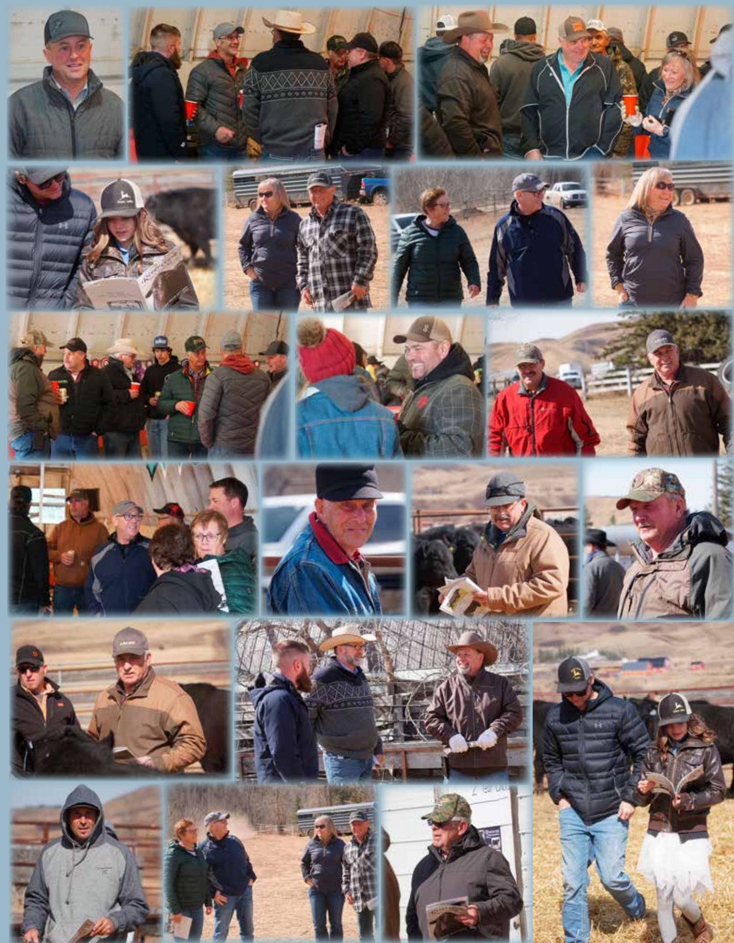
Thanks to all our Customers, Bidders and Buyers for your ongoing support!