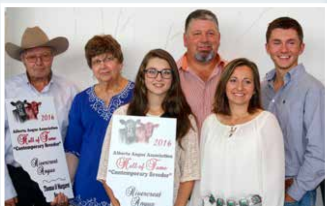
2016 Hall of Fame Contemporary Breeder Award