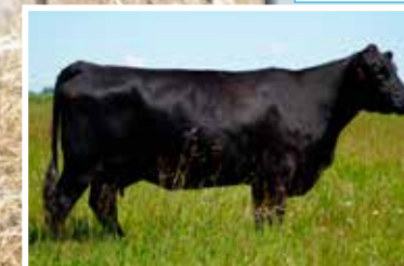
Dam Rivercrest Duchess CSP 6D