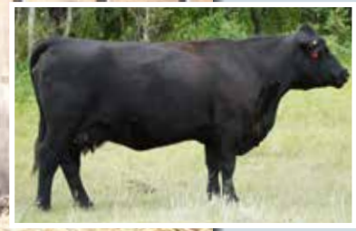
Dam Rivercrest Blackclass 41A