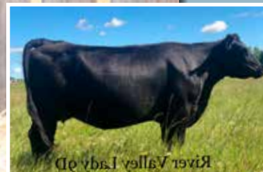
Dam River Valley Lady 9D

A fancy Legendary heifer that would work good in anyones herd. Her dam has an outstanding udder and great feet, she has also raised 3 sale bulls. Sept 11- 682lbs