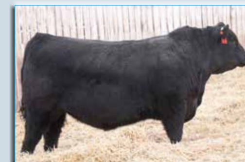
Rivercrest No Doubt CSP 16F