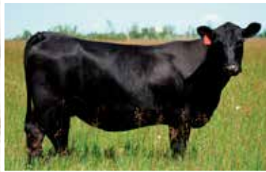
Dam Rivercrest Duchess CSP 69D

The youngest No Doubt son in the sale, but his is a good one. He should mature into a powerful herd sire. He comes from our good Duchess cow family. His great grandmother is the mother to Lot 52. Sept 18 WW: 640 lbs Dam 69D: 4 males Avg BW: 89 lbs WW Ratio 101