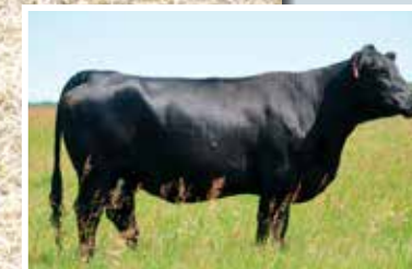
Dam Rivercrest Duchess CSP 64Z

Dam 64Z: 4 males Avg BW: 92 lbs WW Ratio 112 3 females Avg BW: 80 lbs WW Ratio 99