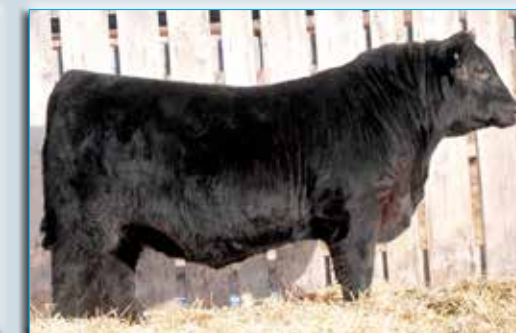
Rivercrest No Doubt 7H