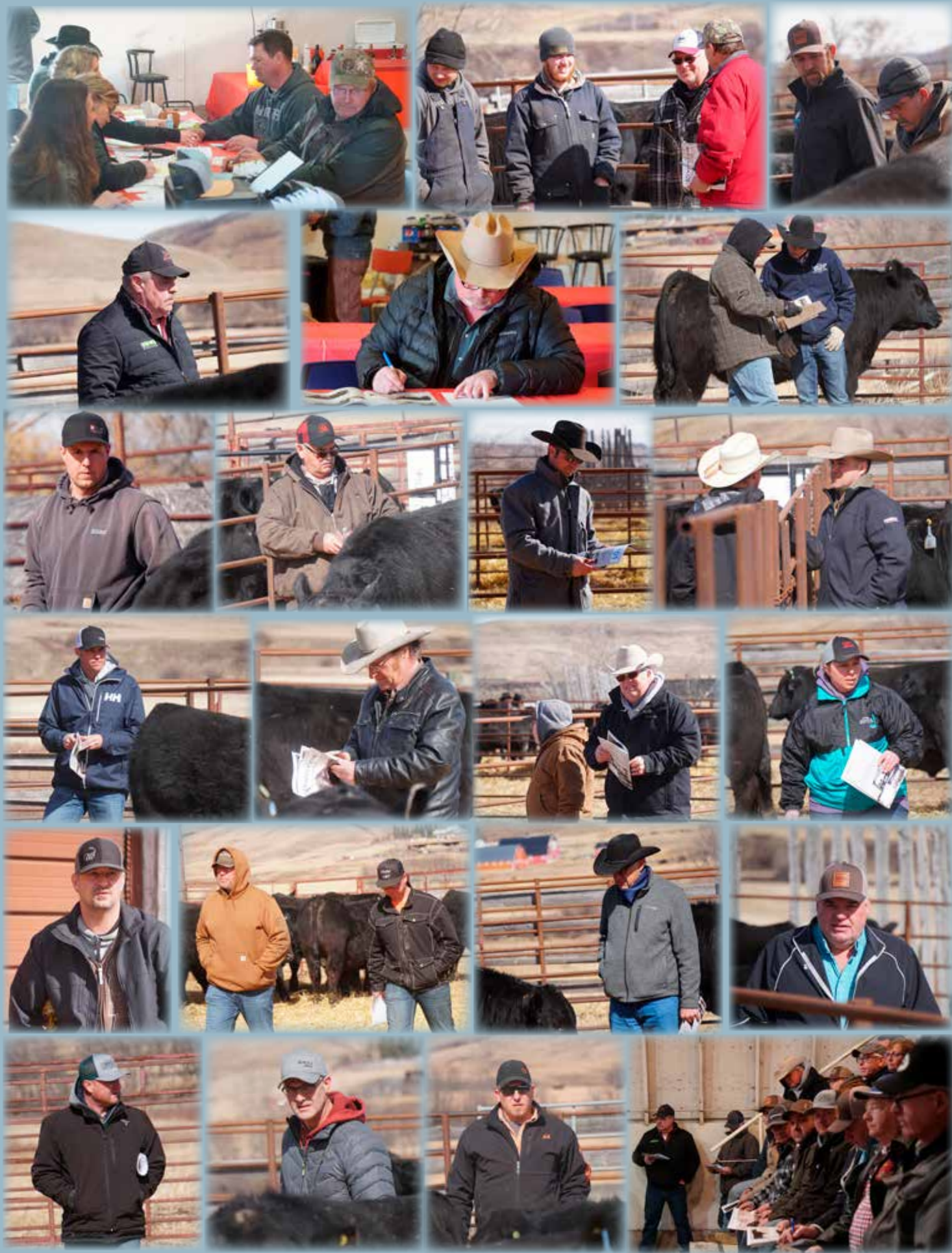
Thanks to all our Customers, Bidders and Buyers for your ongoing support!