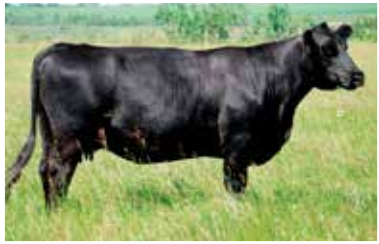
Dam Belvin Echo 153'13

A top end cow bull out of an outstanding mother, who has Elite Dam status. This guy is a stockman's bull. His calves will tip the scales in the fall. Sold a full brother in last year's sale to Bruce Armitage. Sept 18 WW: 735 lbs Dam 153A: 5 males Avg BW: 84 lbs WW Ratio 101 2 females Avg BW: 82 lbs WW Ratio 105