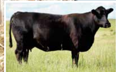
Dam Rivercrest Blackcap CSP 6Y

Dam 6Y: 4 males Avg BW: 78 lbs WW Ratio 93 3 females Avg BW: 81 lbs WW Ratio 98