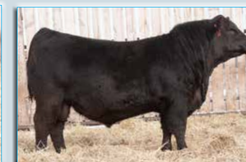
Rivercrest No Doubt CSP 9F