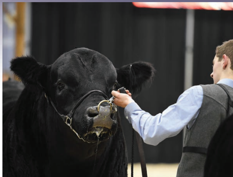
Sire of Lot 31F - Merit Shift 6094D

This bull has good feet and a great hair coat.