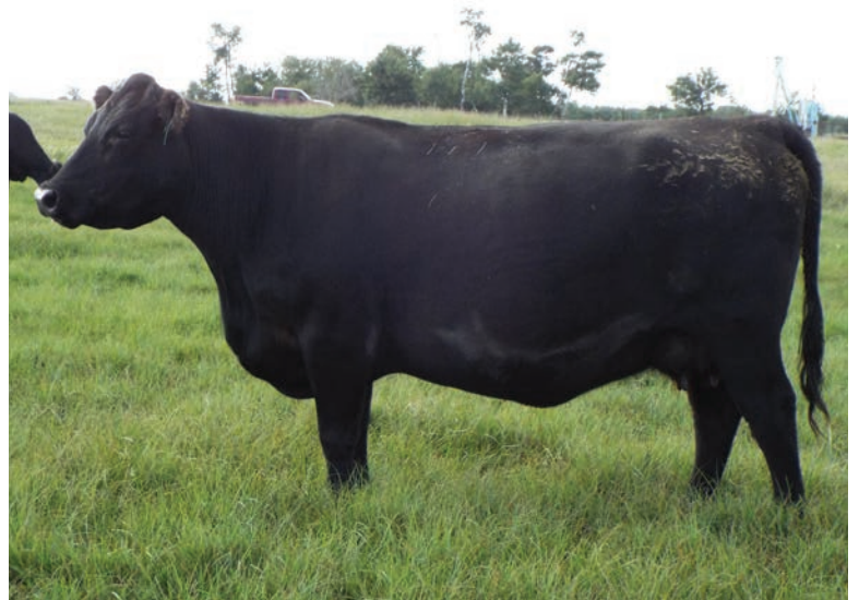
Great Grandam of Lot 15F - Royal Lucy DRCC 6002S

Another son from the Lucy cow family. Dam has a super udder.