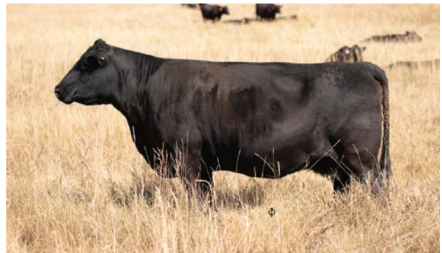
Granddam of Lot 27F - Merit Pride 3014