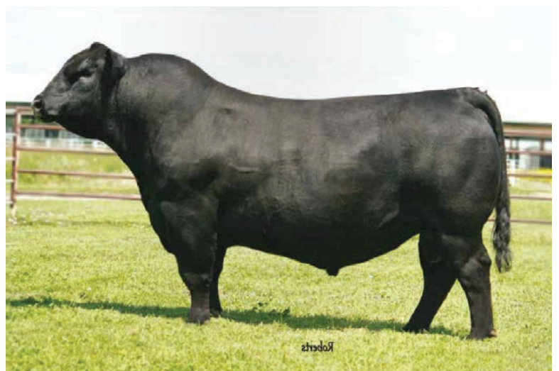
Grandsire of Lot 56F - Mar Innovation 251

Dam always nocks birthweight down, she has a solid foot with a nice udder. His ears are a little short, but I will guarantee calves to have ears if born in warm weather.