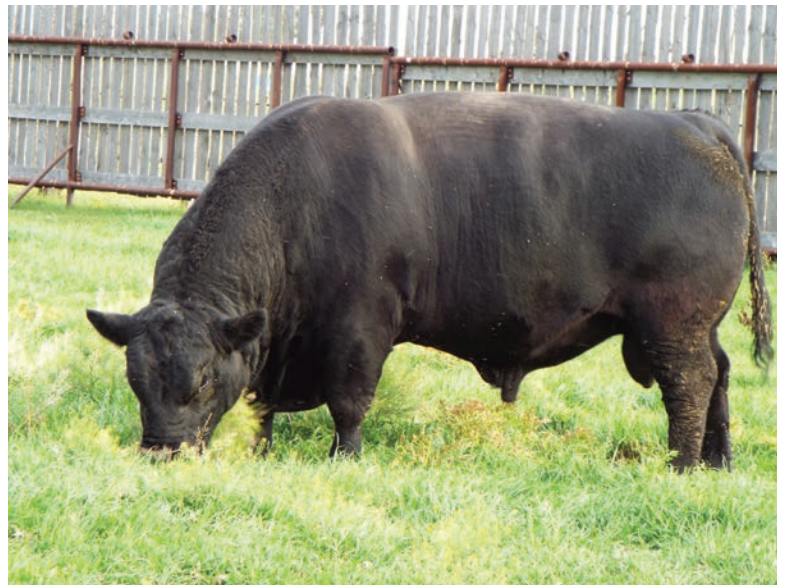
Grandsire of Lot 37F - Belvin Panic Switch 2'11

Low birthweight Out Front calf. Full sisters to his Panic Switch dam have been sold to Youngdale Angus and Belvin Angus.