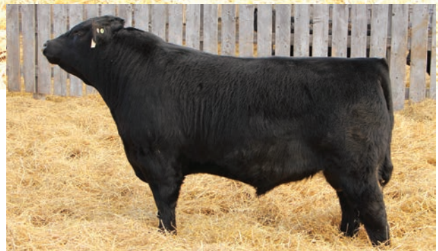
Sire of Lot 27F - Merit Out Front 6031D