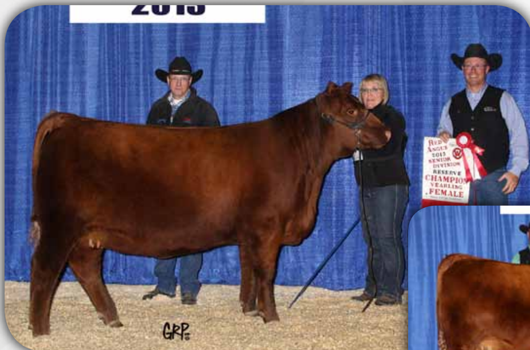
LADY TROOPER 114Z - 2013 ALL STAR RED ANGUS SHOW FEMALE OF THE YEAR