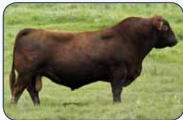
RIBEYE 346N Our Foundation herd sire. It will be hard to find a sire to replace Ribeye. Bulls or females he excels.