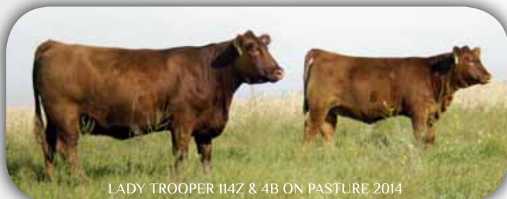
LADY TROOPER 114Z & 4B ON PASTURE 2014