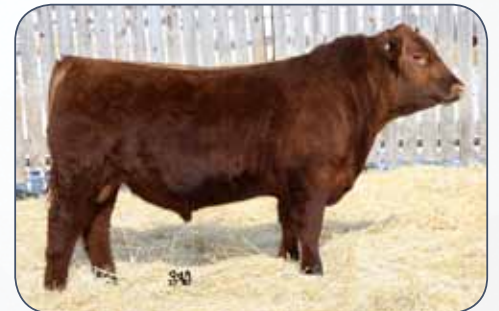
RED FLYING K NEPTUNE 28Z