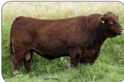
RED BLAIRS PROWLER