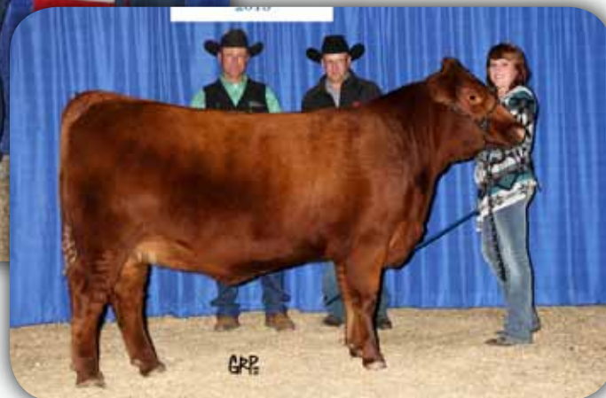
L TROOPER 4B - AS HIGH SELLING BRED HEIFER RED ROUND UP 2015 SELLING TO BULLIS CREEK RANCH, NEBRASKA