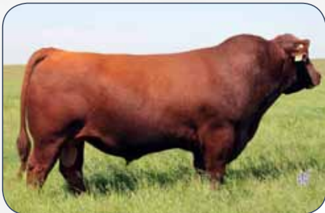
RED MAR MAC SPARTAN Outcrossed Blackberry son we raised