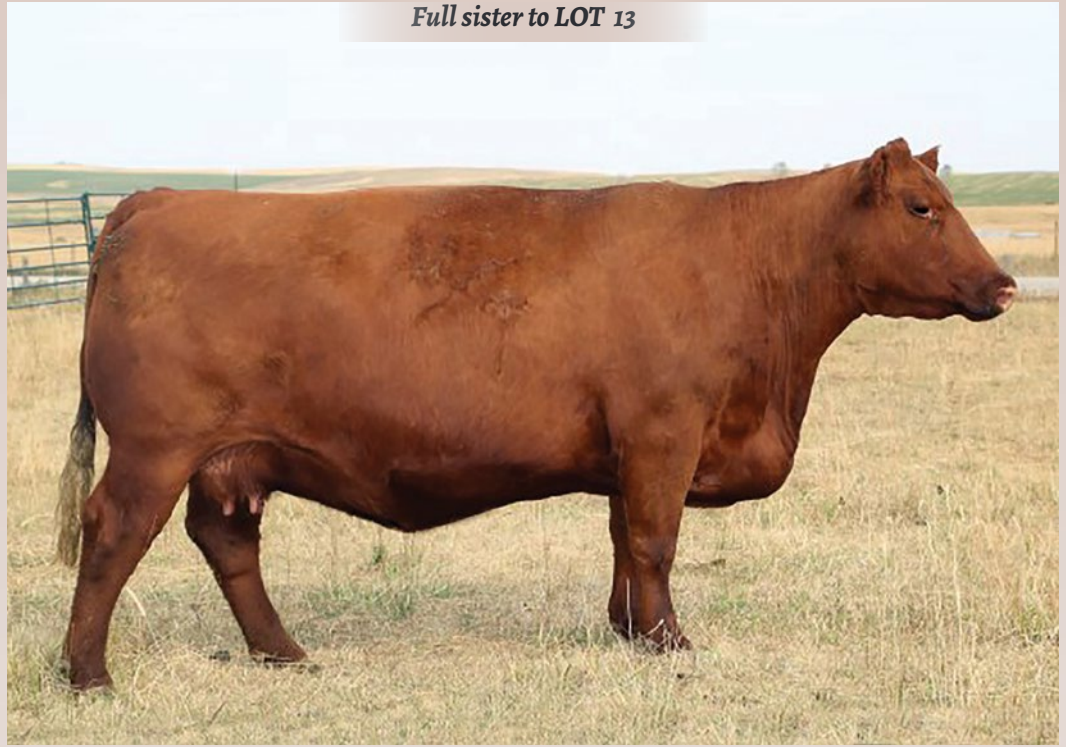
Full sister to LOT 13

Future Flush Lot. Guarantee 6 viable/ freezable embryos Buyer pays flush costs at DRI Brylor will split embryos after 8. Mutually agreed upon sire.