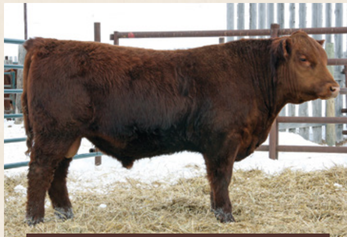
LOT 42: KASPERSKY 3B