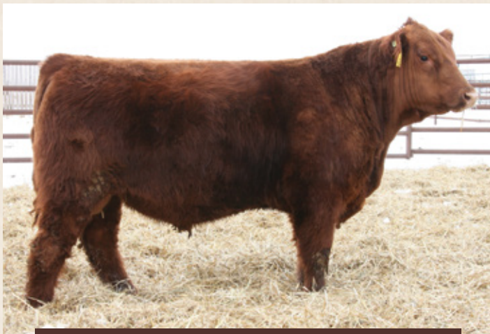
LOT 28: TEAGUE 22B