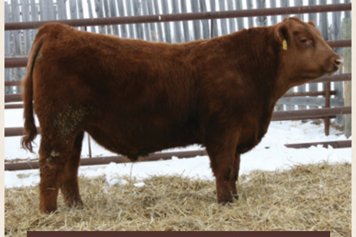
LOT 17: WHIPLASH 142B