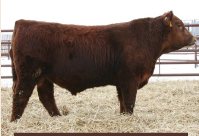
LOT 1: PICTOU 44B