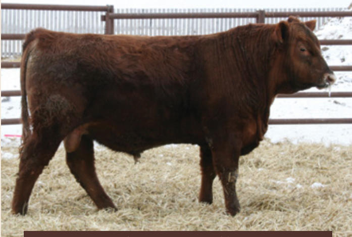
LOT 6: WILLMAR 80B