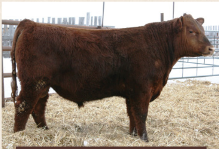
LOT 4: SACHE 89B