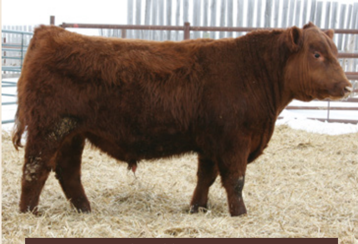
LOT 7: SCEPTRE 57B