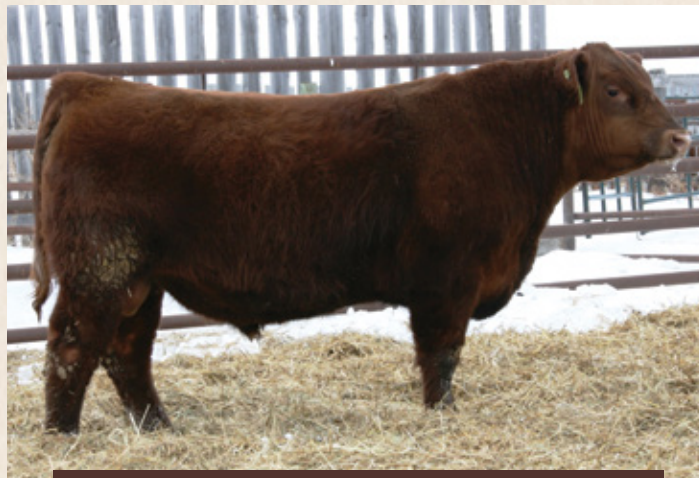
LOT 5: RANIER 104B