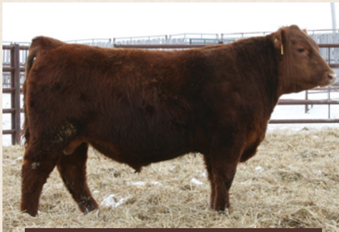
LOT 39: CODY 102B