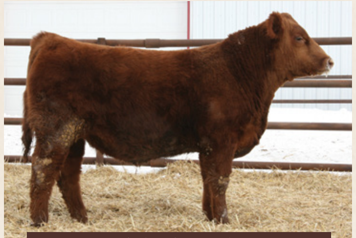
LOT 35: PORTAL 140B