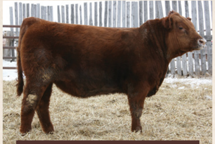
LOT 20: VANDE 62B