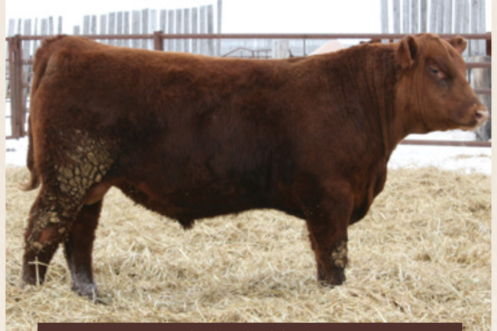
LOT 8: BODOG 40B