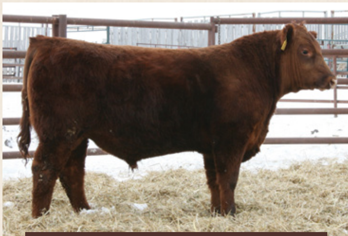
LOT 36: DANSON 128B