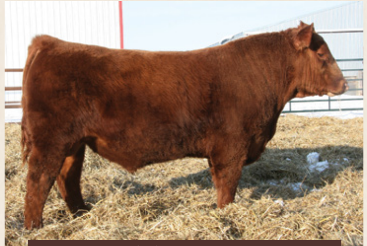
LOT 26: XAVIER 71B