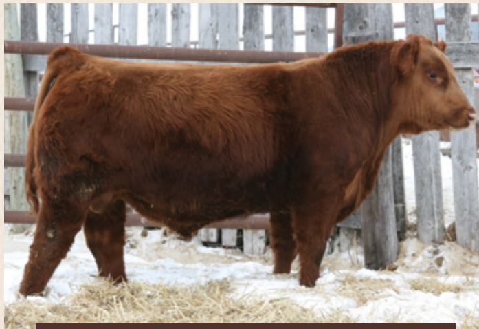
LOT 31: TONY 79B