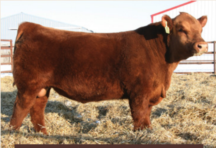
LOT 25: WESTON 23B