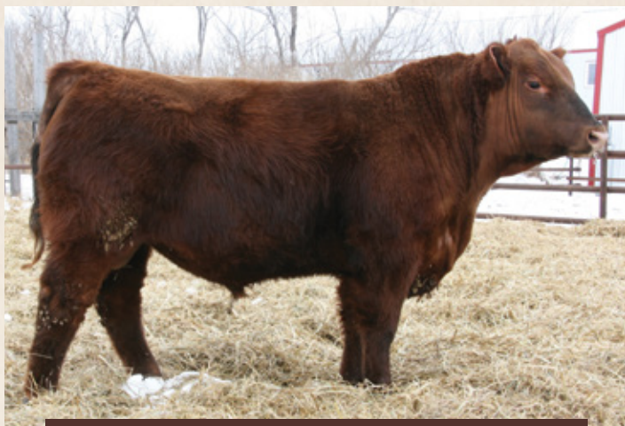
LOT 15: TEMPO 31B