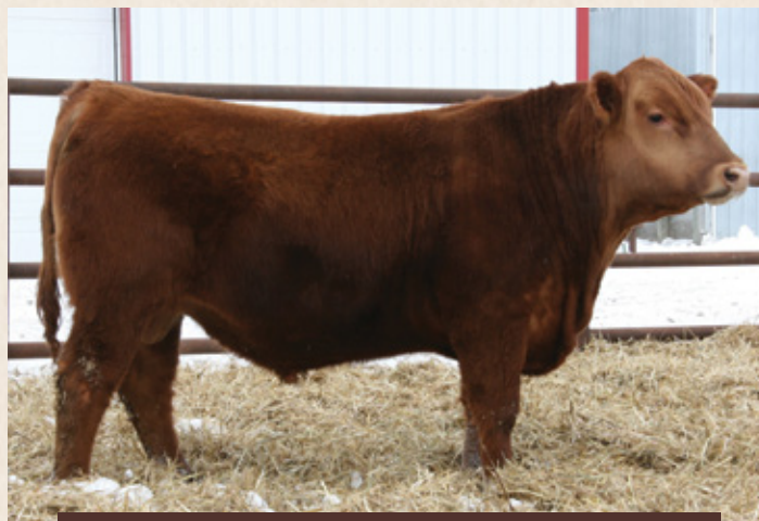
LOT 16: BLUENOSE 43B