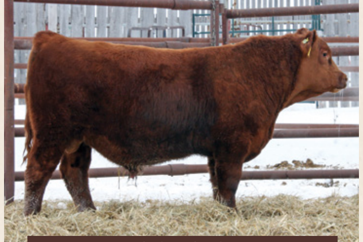
LOT 3: NUGE 78B