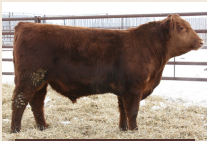
LOT 41: VISION 7B