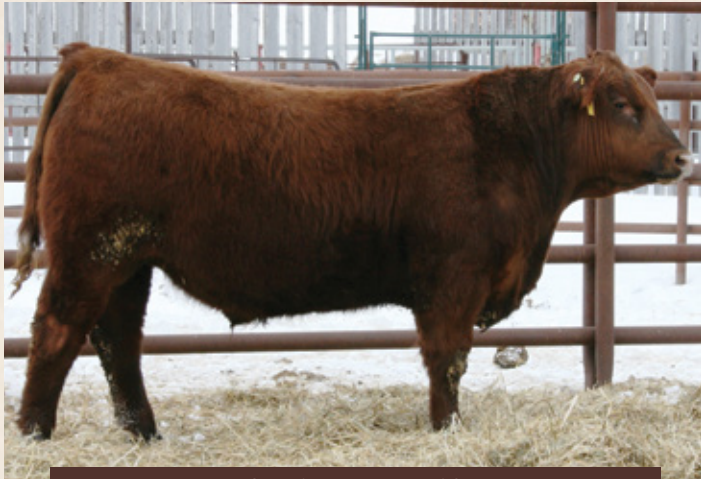
LOT 19: VIBANK 108B