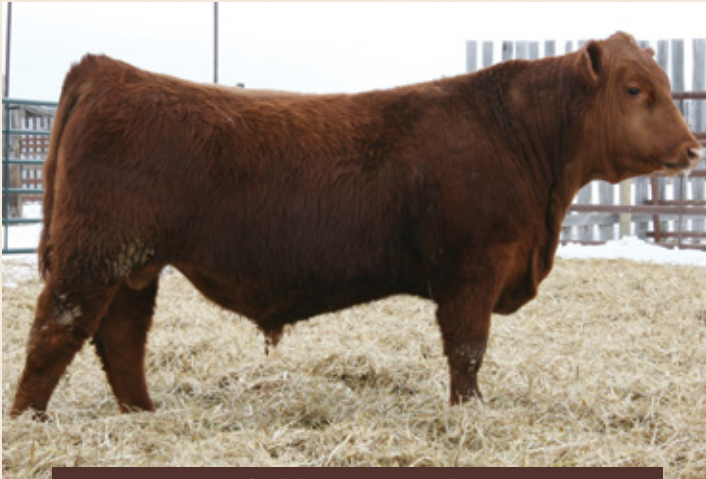
LOT 33: PANTHER 36B