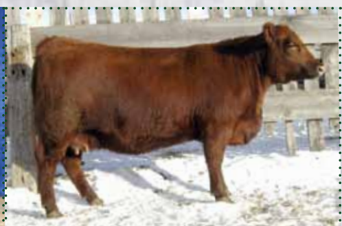
Red Mar Mac Ruby 60Z & 24y - Full sisters to lots 1 & 2