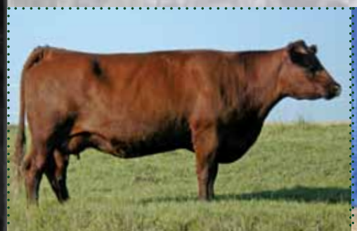
Red McRae's Ruby 10T - Dam of lots 1 & 2

We would like to keep an interest in both of these bulls as we feel they have lots of potential in the future. Terms announced sale day.