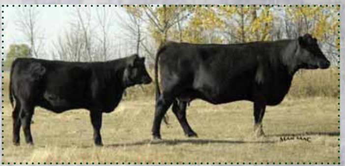
McRae's Bridget 125T - Dam of Blackberry