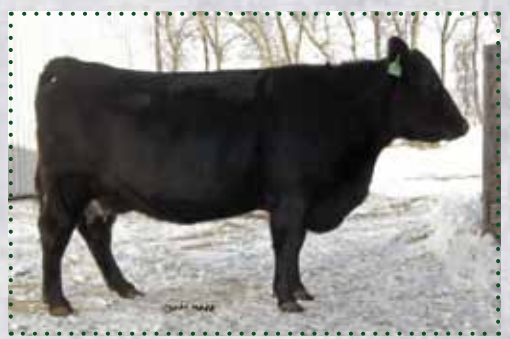
McRae's Bridget 33U - Dam of lot 30