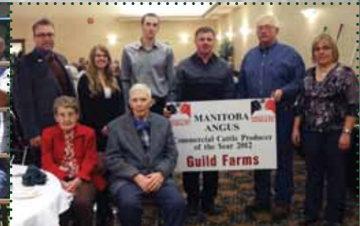
Guild Farms - 2013 MB Commercial Producer