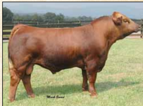
Ankonian Colossal S064 - Reference Sire