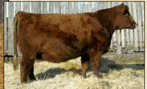
Red McRae's Velvet - Full sister to Lot 9

Lot 8 Purebred Red Mar Mac Complete 92Y KOF 92Y • February 13, 2011 • 1616823