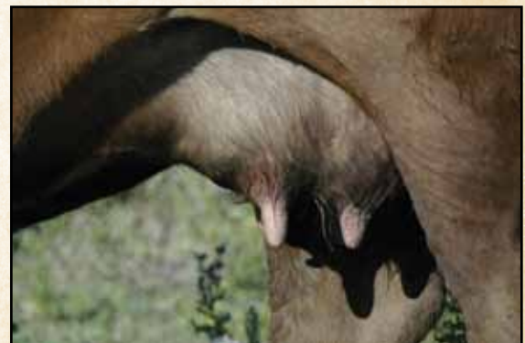
Our bulls weaning weights are taken on their mothers milk only, NOT creep feed!

Suggested Heifer Bull Roughrider was used in our program for some outcross genetics and calving ease. This bull will work good on a group of heifers with his smooth body type yet lots of volume.