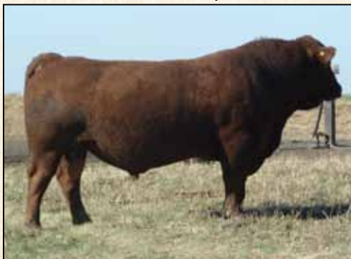
CDI/PLCC Dr. Phil 145U - ReferenceSire