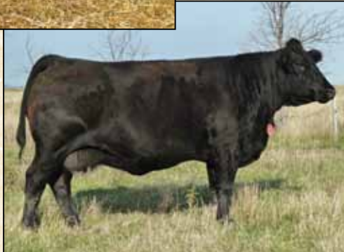
WFL Miss 21F Doll 20P - Dam of lots 77, 78, 79