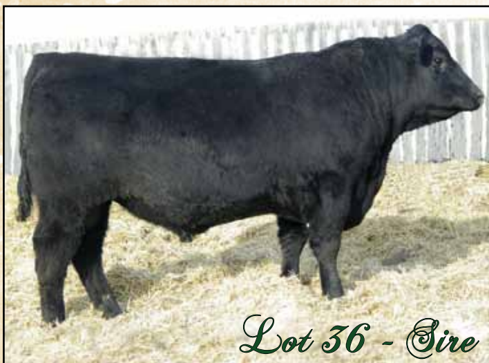
Lot 36 - Sire

162Y's sire sold in last year sale to Wytinck Farms. These two sons Lot 35 and 36 are cow bulls that will add some performance to your calf crop.