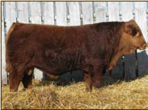
KOP Crosby - Sire of lots 77, 78, 79