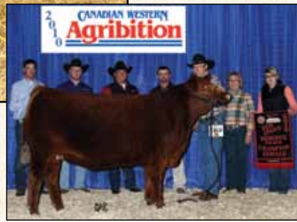
Red McRae's Reba Lee 121W

Suggested Heifer Bull Top Dog's dam is the granddam of Red McRae's Reba 121W who was Reserve Grand Champion Female at Agribition 2010. A very smooth long bodied Red Angus bull that has lots of maternal strength in his pedigree.