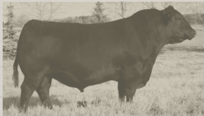
HF El Tigre 28U, Sire of Ring Creek Brutus 18Z