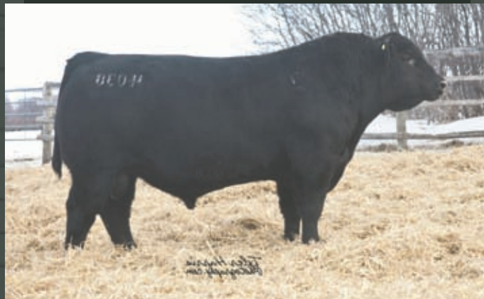
Fleury Pacesetter 38B, a feature Pacesetter 258M son that sells as Lot 34

Lookout Pacesetter 258M is a well-known bull who has contributed many tremendous females to various programs. In 2012 we selected LSF 258M semen to use on all of our replacement females and a few select top cows in our breeding program. This bull's offspring are moderately framed and extremely easy fleshing. Our 2013 heifer calves were bred to LSF 258M because we were impressed with the cross on our 2012 heifer pen. In 2014 we took Fleury Pacesetter 9A and Fleury Pacesetter 36A and exposed these two Lookout Pacesetter 258M sons on our heifers. Lookout Pacesetter 258M calves will add that moderate, easy fleshing ability to your program and are recommended on larger framed cattle.