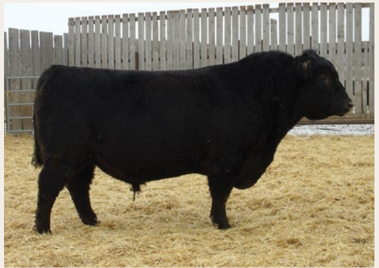
Sankeys Laramie 114, Sire of lots 20 - 32