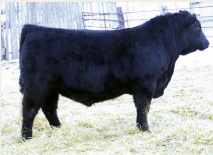
Eastondale Really Windy 06'13, Sire of lots 9, 10