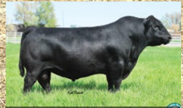
M A R Innovation 251 Sire of lots 1 - 5