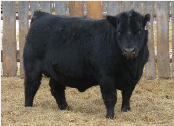
Minburn Active Duty 72C, Sire of lots 33 - 39