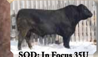
SOD: In Focus 35U