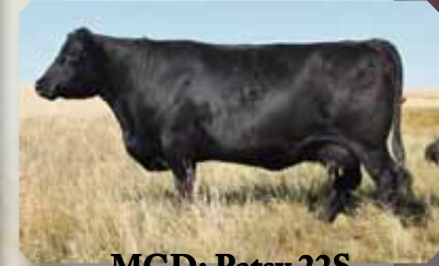
MGD: Patsy 22S