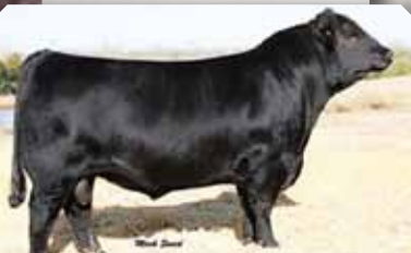
SOD: Bob 7003