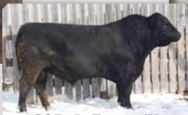
SOD: In Focus 35U