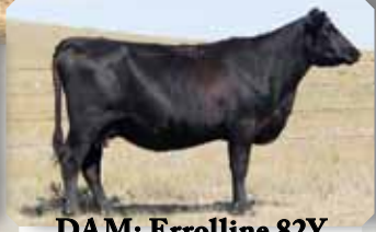
DAM: Errolline 82Y