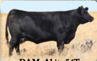
DAM: Akita 54T