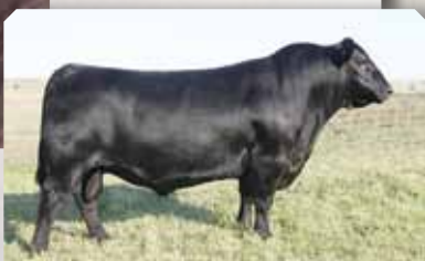
SOD: Density 4336