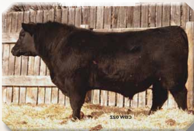
Two Year Old

One of my favourite's as a calf, this bull comes from a moderate-framed density cow and posted an actual weight of 700 lbs at weaning.