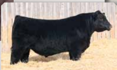
49R Son: 48Y