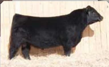
82S Son: 69Z