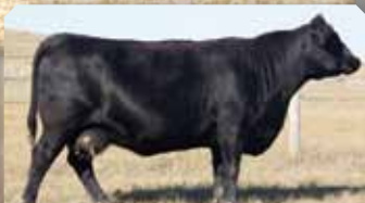
DAM: Akita 32P