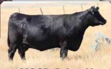
MGGD: Ruby 12N