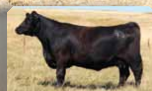
51N Daughter: 934