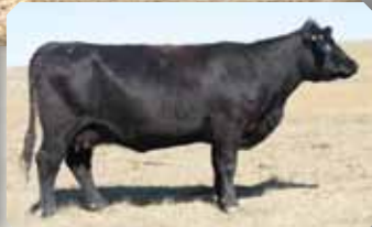
DAM: Akita 76X