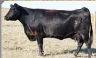
DAM: Eileen 20R