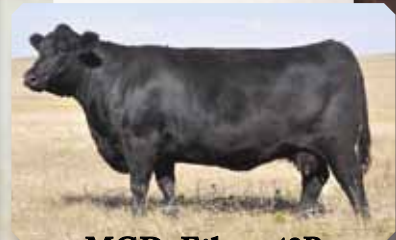
MGD: Eileen 42P