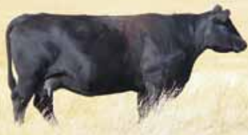
DAM: Errolline 22R