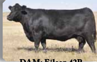
DAM: Eileen 42P