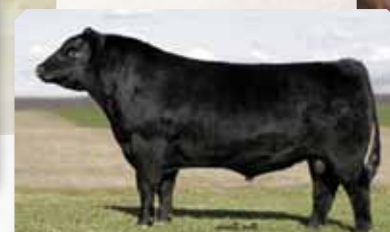
SOD: New Frontier