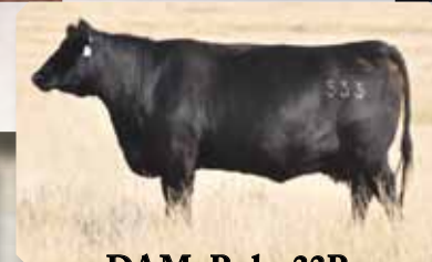
DAM: Ruby 33R