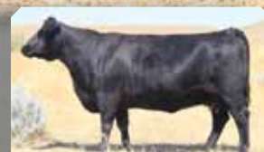
12N Daughter: 20S