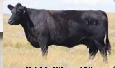
DAM: Eileen 10S