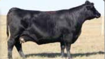
DAM: Errolline 814U