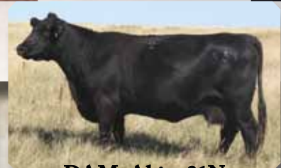
DAM: Akita 31N