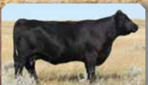
MGGD: Errolline 42N

EPDs in the top: 5% BW, 15% WW, 9% YW, 1% Milk, 1% TM, 15% CE/MCE