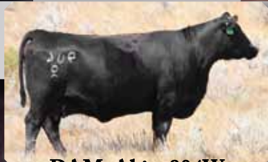
DAM: Akita 904W