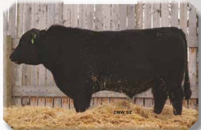
Two Year Old

Much like 75Z, this bull is put together correctly with meat, correct leg structure, and length of spine. Mother is a red-gene carrier and I will have results on this bull to whether he carries the gene by sale day.