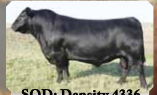
SOD: Density 4336