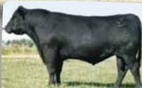
SIRE: GDAR Traveler 71