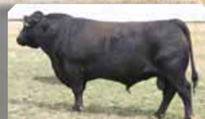
5G Son: Dateline 18P