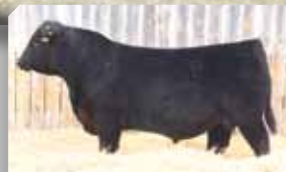
2011 Son: 47Y