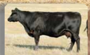
MGD: Diamond 9J