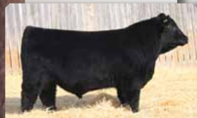
10T Son: 88Y