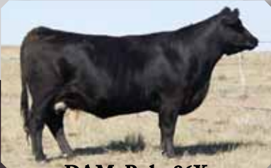
DAM: Ruby 86X