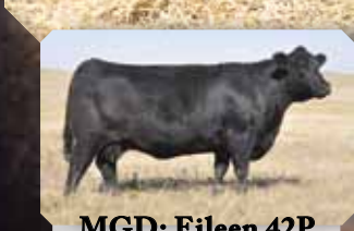
MGD: Eileen 42P