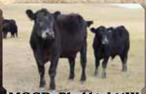
MGGD: Blackbird 11W

EPDs in the top: 10% BW, 15% CE, 10% MCE