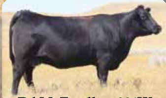
DAM: Errolline 921W