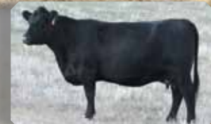
MGD: Dyna 295