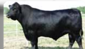
SSAP Eileen 42P