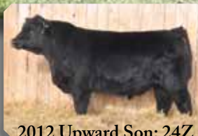
2012 Upward Son: 24Z