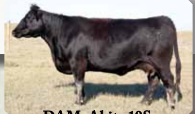
DAM: Akita 19S