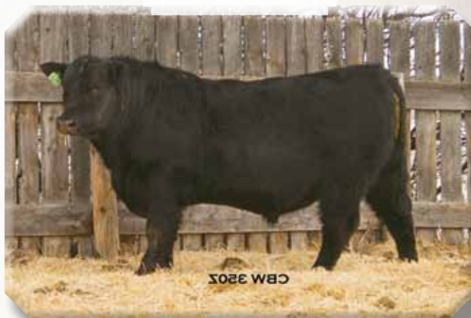
Two Year Old

A moderate, very well put together 26T son. I think this bull will go out and produce gorgeous females.