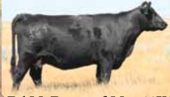
DAM: Diamond Mist 29X