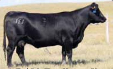
DAM: Errolline 31Y