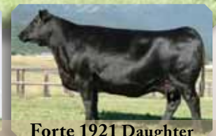
Forte 1921 Daughter