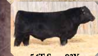
54T Son: 83Y