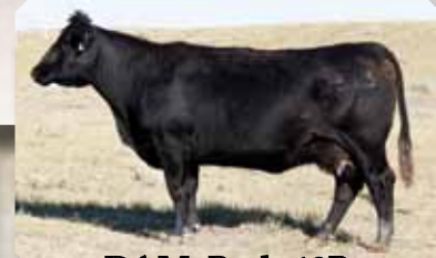
DAM: Pride 13R