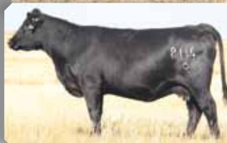
DAM: Dyna 114U