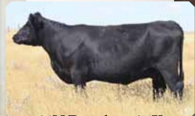
31N Daughter: 76X