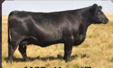
MGD: Akita 69T