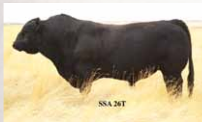
SSA 4336 DENSITY 26T