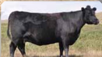
DAM: Pride 32T