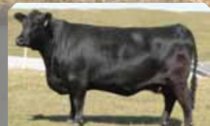
DAM: Blackcap 942W