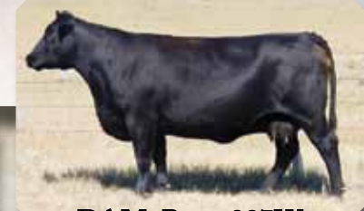
DAM: Patsy 987W