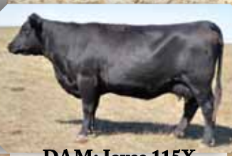
DAM: Joyce 115X