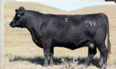
13R Daughter: 99X