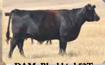
DAM: Blackbird 52T