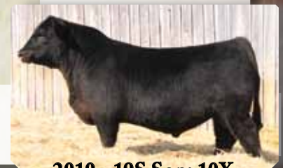
2010 - 19S Son: 10X