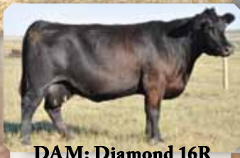
DAM: Diamond 16R