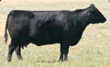
MGD: Errolline 7L