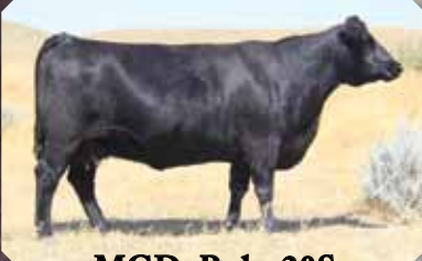
MGD: Ruby 20S