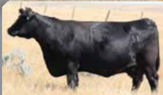
DAM: Ruby 12N