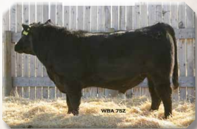
Two Year Old

Study the 26T's well. They offer unparalleled consistency, performance, and functionality; and this bull is no exception with a tidy head, lots of length and thickness.