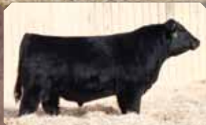
76X Son: 98Z