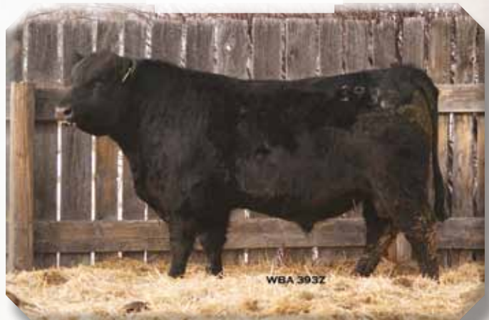
Two Year Old

A well built Consensus son. Eye-appealing with lots of growth.