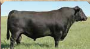
SOD: Bennett Total