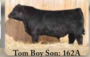
Tom Boy Son: 162A