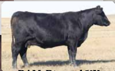
DAM: Diamond 53Y