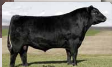
SOD: New Frontier