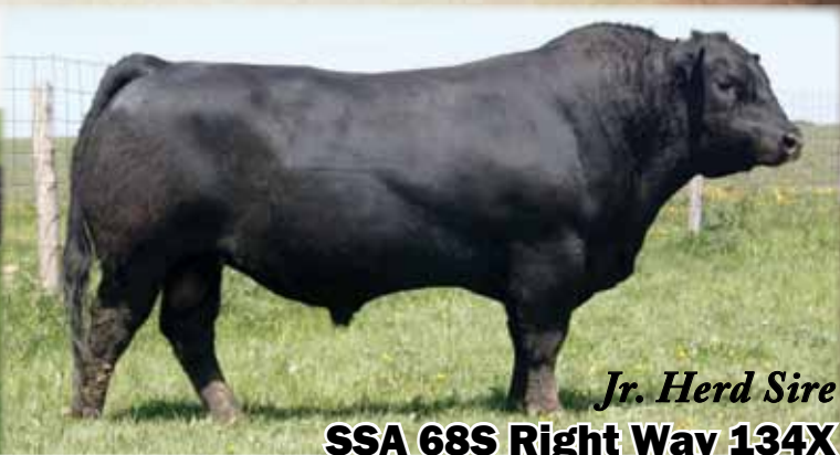
Jr. Herd Sire SSA 68S Right Way 134X