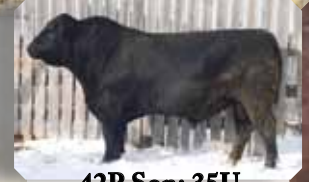
42P Son: 35U