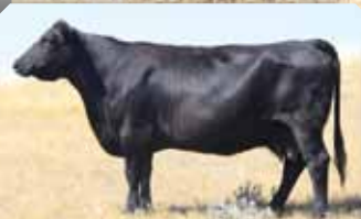
DAM: Diamond 51N