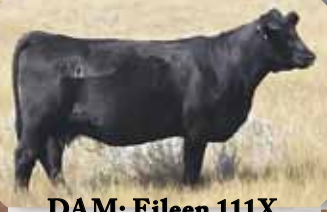
DAM: Eileen 111X