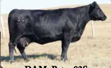
DAM: Patsy 82S