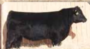
2012 32T Son: 24Z