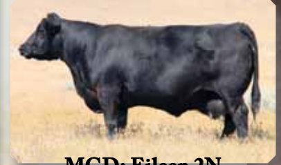
MGD: Eileen 2N