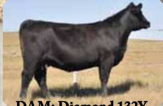
DAM: Diamond 132Y