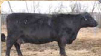
DAM: Akita 944W