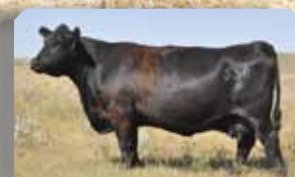
MGD: Eileen 30N