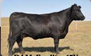
DAM: Errolline 17Y