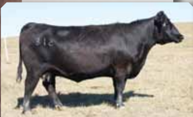
41M Daughter: 18R