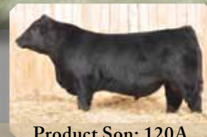
Product Son: 120A