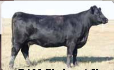
DAM: Blackcap 64Y