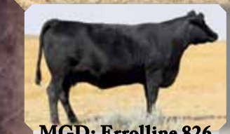
MGD: Errolline 826