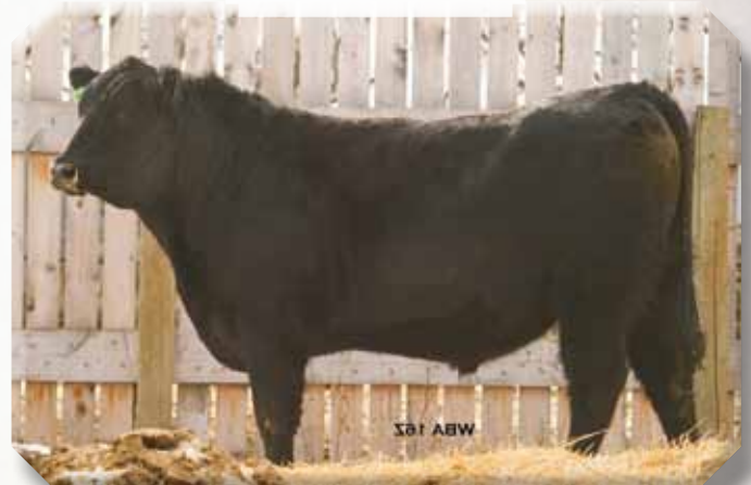
Two Year Old

Lots of growth and performance, this bull is correct and eye-appealing.