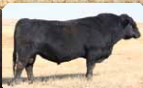
18R Son: 73W

EPDs in the top: 25% BW, 9% WW, 10% YW, 8% MILK, 5% TM, 25% CE, 10% MCE