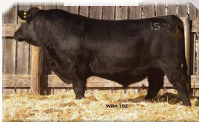
Two Year Old

Another Tank of a bull from a beautiful 26T daughter from our 96P cow. I can't say enough good things about this cow family.