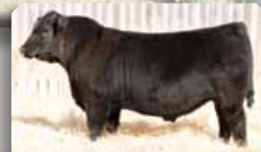
2008 Focus Son: 8U