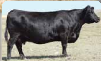
DAM: Ruby 63L