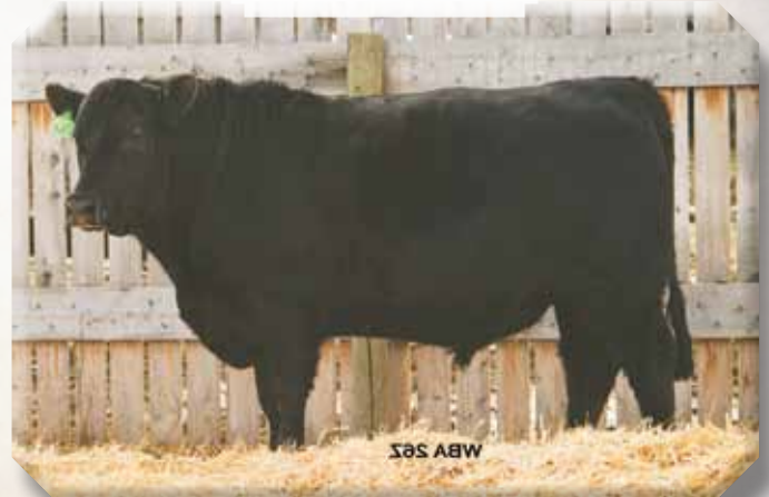
Two Year Old

Powerful, with more performance and length, this bull has several full sisters working in our herd that are beautiful cows. Mother is a red-gene carrier and I will have results by sale day.