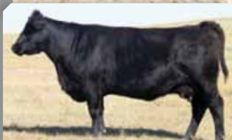
DAM: Eileen 932W