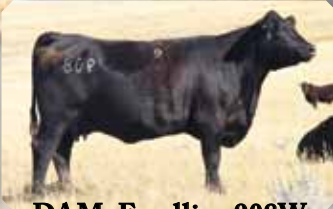
DAM: Errolline 908W