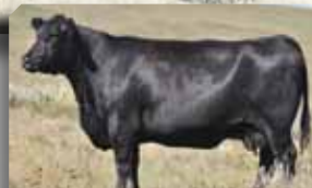
Focus Daughter: 879U