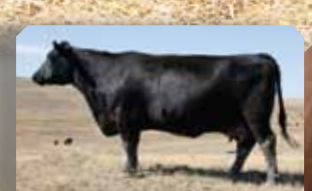
MGD: Eileen 5G