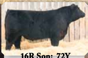
16R Son: 72Y

EPDs in the top: 7% BW, 8% Milk, 10% TM, 15% CE, 10% MCE