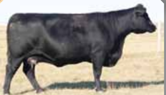
DAM: Errolline 848U