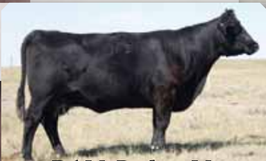
DAM: Pride 41M