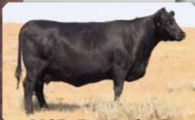
MGD: Diamond 47S