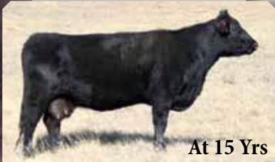
At 15 Yrs