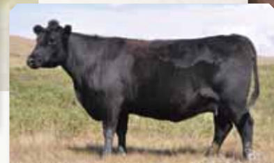
13R Daughter: 32T