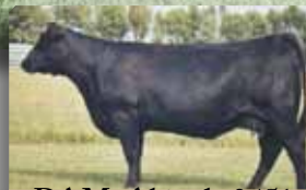
DAM: Abigale 0451