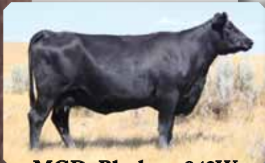
MGD: Blackcap 942W