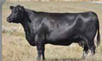
DAM: Eileen 879U