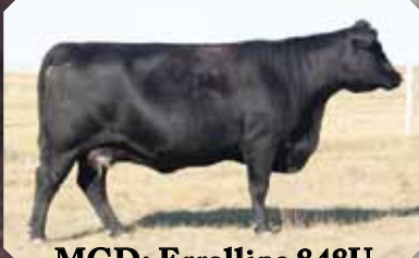
MGD: Errolline 848U