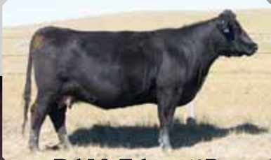
DAM: Eileen 49R