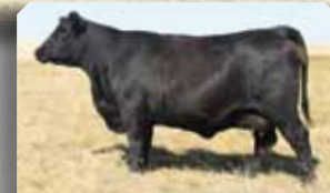
0035 Daughter: DLD 904