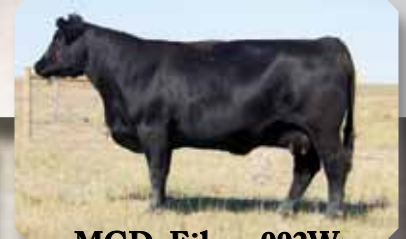
MGD: Eileen 992W