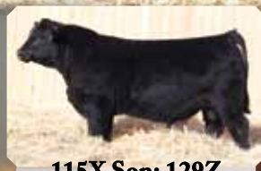
115X Son: 129Z