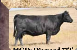
MGD: Diamond 73T