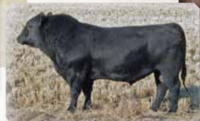
SOD: Rain Man 2M