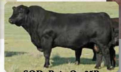
SOD: Rain On 35R