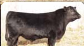
2010 32P Son: 9X