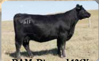
DAM: Diamond 126Y