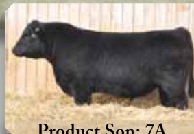
Product Son: 7A