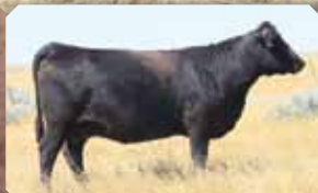
63L Daughter: 97X