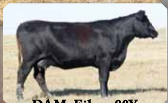
DAM: Eileen 80Y