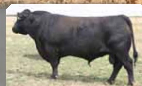
SOD: Dateline 18P