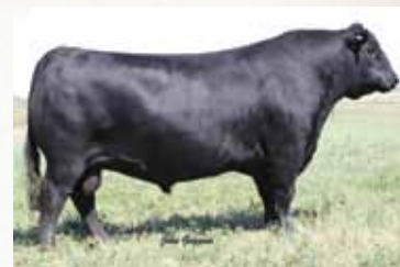
CONNELY CONSENSUS 7229

Purchased from Johnson Livestock, 96X has since crippled himself, but was an amazing breeder when sound. Johnson's have probably sold more Carbon Copy bulls then any other progeny and 96X has produced good, high-performing cattle for us.