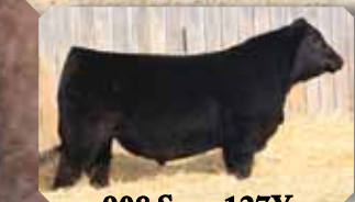
908 Son: 127Y

EPDs in the top: 9% WW, 3% YW, 1% Milk, 1% TM