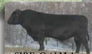
SIRE: Grid Maker