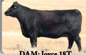
DAM: Joyce 18T