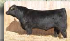
Two Consensus sons offered: 112A & 88A