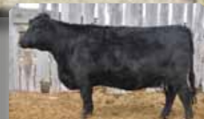
2012 Daughter: 7Z