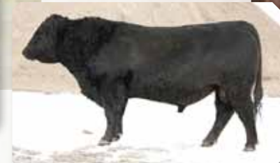
SOD: Right Way 68S

Herd Bull Look! Loads of character, Lots of muscle. 10A is a real soggy, good boned, big footed, big scrotal bull with a 365 day Index of 129. Out of a very productive, great footed, beautiful uddered, Right Way 68S daughter. 68S left us very easy-doing females with great tidy udders. Grandam is a direct daughter of Masterplan 3 that we sold to Everblack Angus as a 5 yr. old. 10A is a 3/4 brother to 90A (page 9).