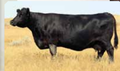
MGD: Ruby 63L