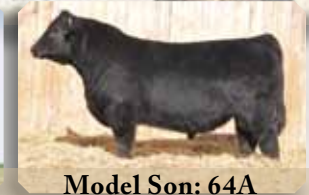
Model Son: 64A