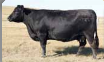
DAM: Diamond 44T