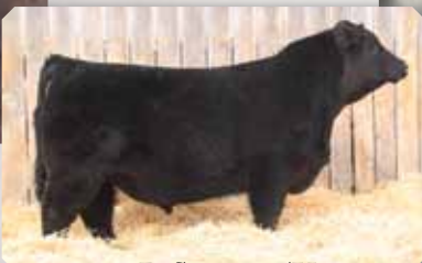
22R Son: 165Y