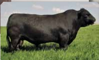
SOD: Pine Drive 10K