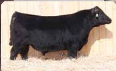
30X Son: 143Z