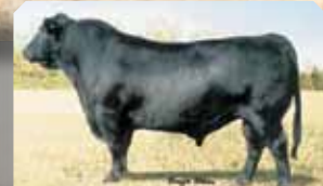
SSA Akita 21L