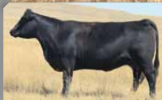
DAM: Errolline 75T