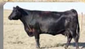
DAM: Eileen 986W