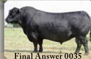
Final Answer 0035