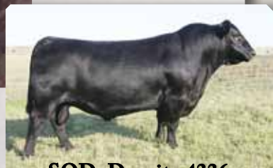
SOD: Density 4336