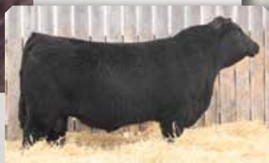
904W Son: DLD 12Y