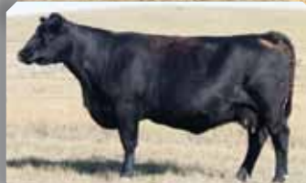
DAM: Diamond 909W