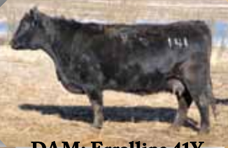
DAM: Errolline 41Y