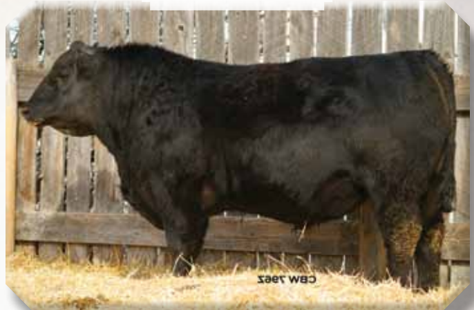
Two Year Old

One of the thickest Consensus sons you'll find. He's a good-footed, powerful bull, who is also a twin.