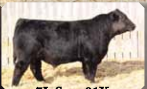
7L Son: 91X