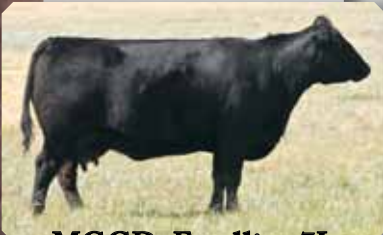
MGGD: Errolline 7L