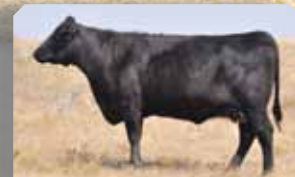
DAM: Diamond Mist 951W