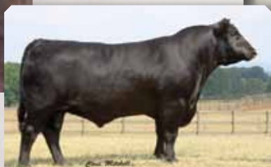
SOD: Wild Fire 96