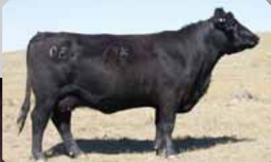
DAM: Eileen 30X