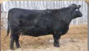
814U Daughter: 52Z

EPDs in the top: 3% BW, 15% WW, 10% YW, 1% Milk, 3% TM, 7% CE/MCE