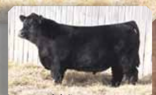
44T Son: 77X