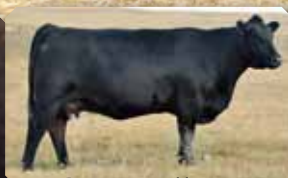
MGD: Errolline 1R

EPDs in the top: 10% BW, 9% WW, 2% YW, 4% Milk, 3% TM, 7% CE/MCE