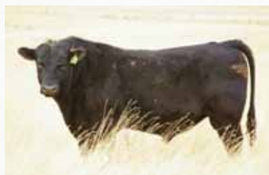
JL MULTIPLE COPY 0096