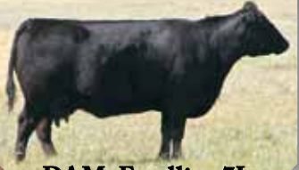
DAM: Errolline 7L