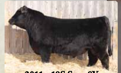
2011 - 19S Son: 8Y