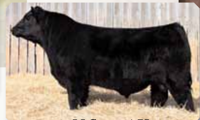
31N Son: 27Y

Very quiet, deep bodied, with a big hip, wide top, good hair and a good big foot. His dam is also quiet, and all her daughters have excellent udders. With New Trend and Dynasty on the bottom side of his pedigree, he should be a no miss maternal bull, with good growth. Maternal Grandam is an Elite Female.