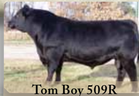
Tom Boy 509R