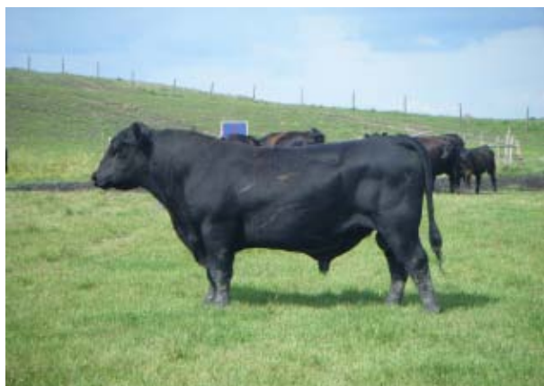
Early Sunset Stout 37T maternal grandsire