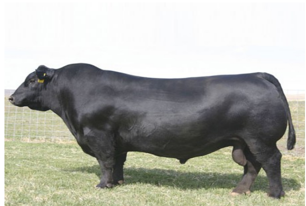
SAV Net Worth 4200