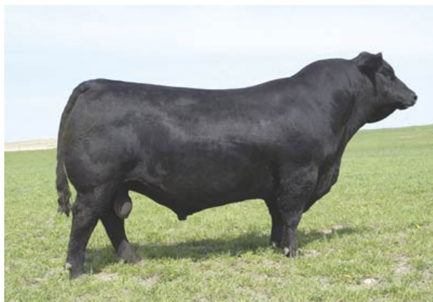
SAV 004 Predominant 4438 grandsire to 2Z