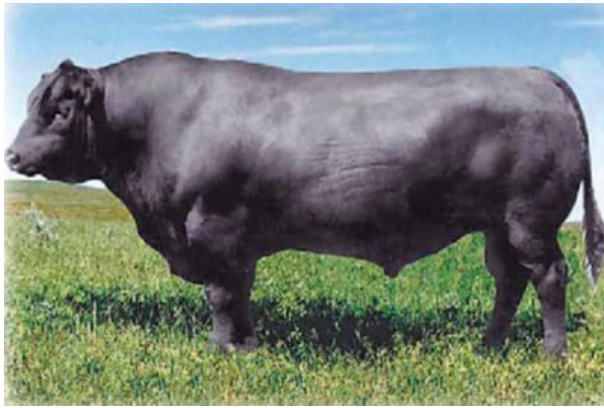
TC Stockman 2164 paternal great grand sire