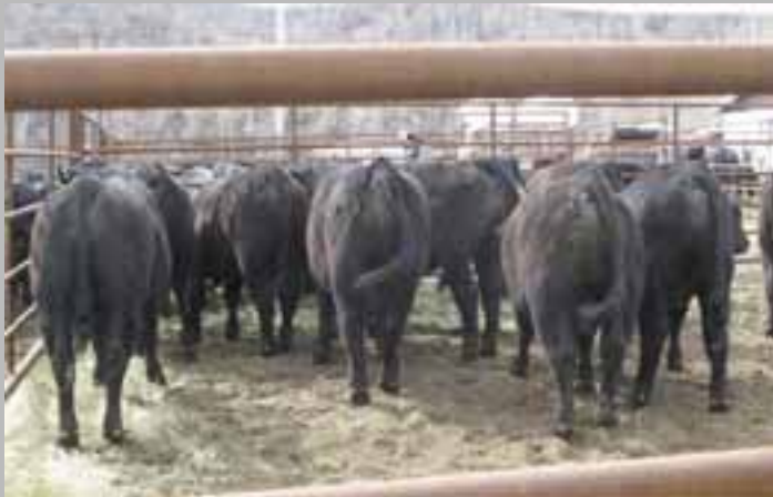
2009 Group of Sale Bulls

BW: 76 lbs Actual Weaning Weight: 750 lbs (6-Oct-2007) BW: -1.4 WW: +34 YW: +57 MILK: +15 MAT: +32 SCROTAL: +0.08 YG: +23 CED: +10