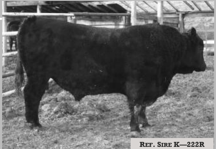
REF. SIRE K—222R

Equator was purchased from Sandy Bar Ranches in Aneroid Sask. He was used successfully on heifers and sires easy fleshing cattle with a lot of capacity. His calves do very well on feed. His 1st daughters calved out last spring and are feminine cows with good udders. They are built to last. He has crossed exceptionally well with our Prime Cut daughters.