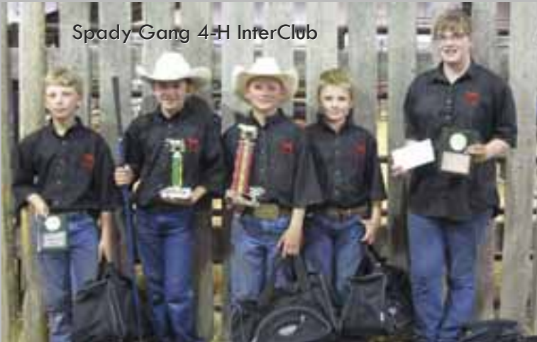
Spady Gang 4-H InterClub

This also will be the last Grid 15S calf for sale, as he is deceased. This is a very smooth, correct calf. Born mid-April he has an incredible Adj 205 of 810 lbs. You will like the look of this bull.