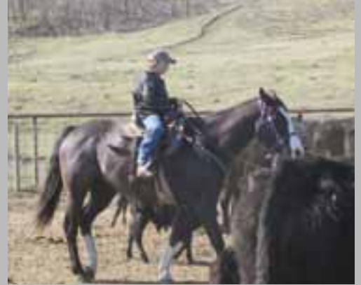
Ty & Jingle—Jingles sold in the 2008 sale