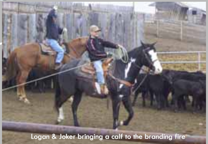
Logan & Joker bringing a calf to the branding fire

Actual BW: 105lbs. Actual WW: 820 lbs (14-Nov)