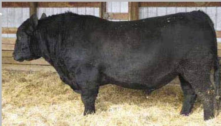
REF. SIRE A—RIVERCREST GRID MAKER 29P

Grid 29P —29P is one of those sires that throws little babies who turn into big, thick bulls. They seem to have lots of style and hair. His daughters are excellent mothers and good milkers.