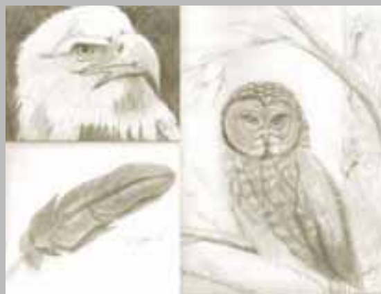
Cayden's Art work