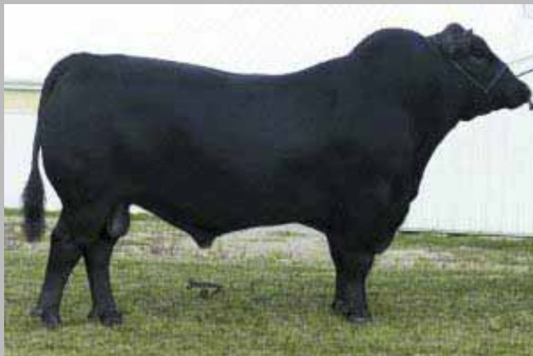
G A R GRID MAKER—GRANDSIRE OF RIVERCREST GRID IRON 15S