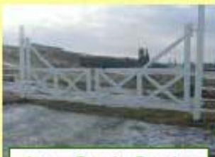
Gates, Panels, Fencing