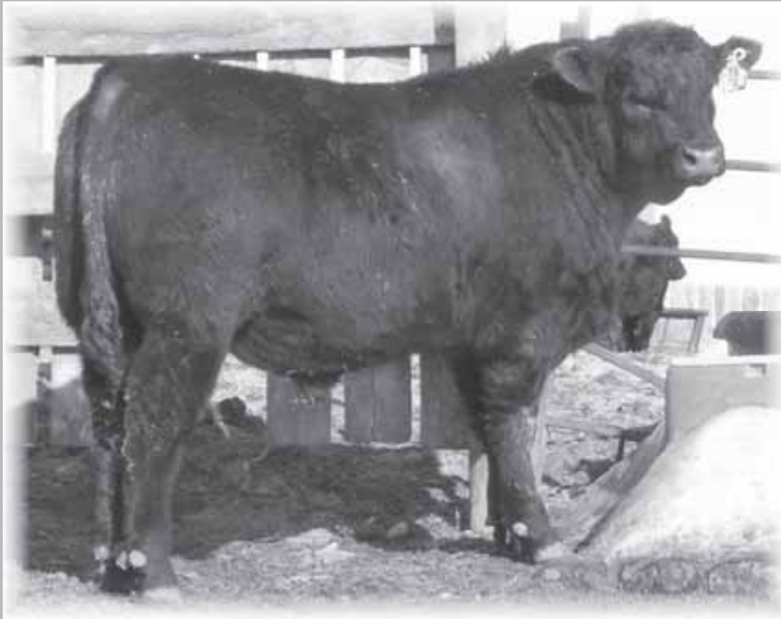
LOT 38— TTTS 13W