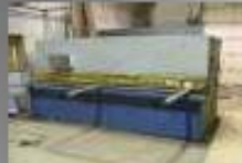
10' - 1/2" Hydraulic Shear

Call 403-884-2233 for your free estimate TODAY!