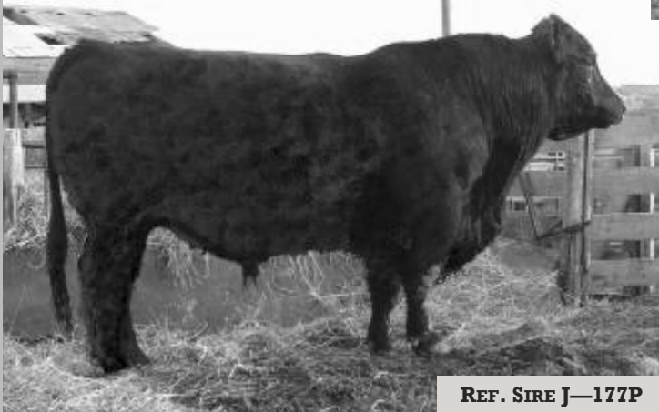
REF. SIRE J—177P

BW: 84 lbs. Adj. 205D: 779 lbs Adj. 365D: 1225 lbs. BW: +5.0 WW: +46 YW: +74