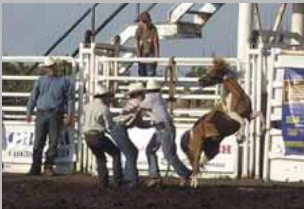
It's a Wild One