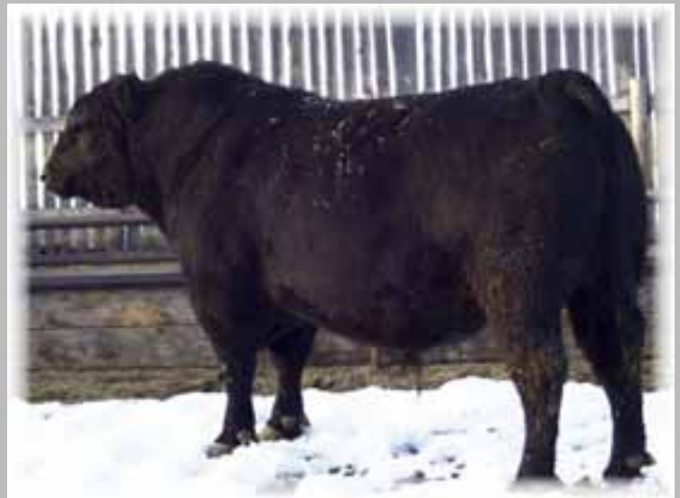
REF. SIRE G-27S