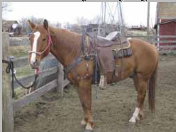
6 yr old Ranch Gelding with chrome. Keen eye for cattle.