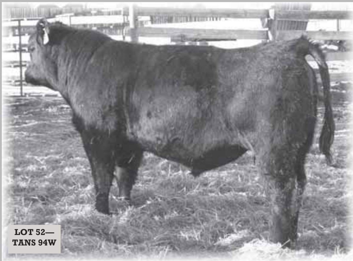
LOT 52— TANS 94W