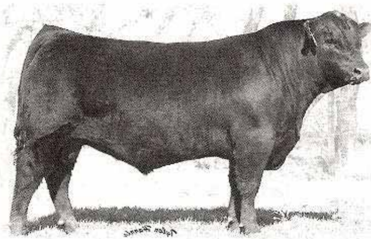
REF. SIRE C—MGA DATELINE 4P