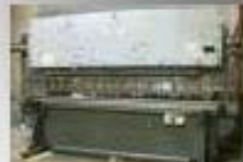
13' - 185 Ton Hydraulic Brake for custom forming