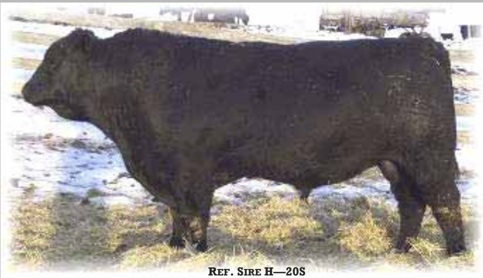
REF. SIRE H—20S