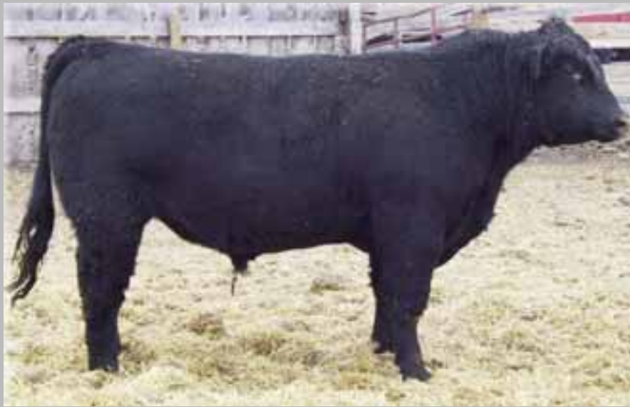
REF. SIRE F-31T