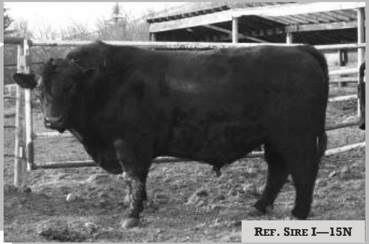
REF. SIRE I—15N