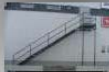
Stairways & Safety Rails