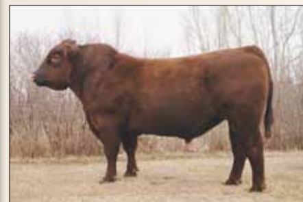
Red Lazy MC Blazin Through 888G - Maternal Grand Sire

RED LAZY MC STOUT 30S RED LAZY MC COWBOY CUT 26U RED LAZY MC STAR 185M