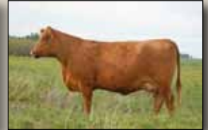
Dam of Lot 40