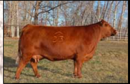
Patty 701T - Dam of Honky Tonk