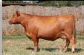
Dam of Lot 32