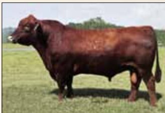
'Direct Design' - Maternal Grand Sire

* Selling 1/2 interest and full possession *