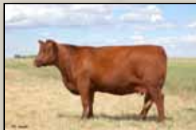
Dam of Lot 46