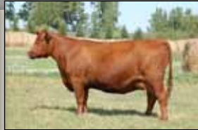
Dam of Lot 18