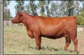
Dam of Lot 21