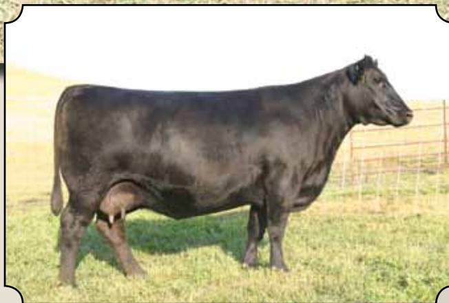
Dam - SAV Barbara 7281

SAV 8180 TRAVELER 004 SAV BARBARA 7281 SAV BARBARA 4217