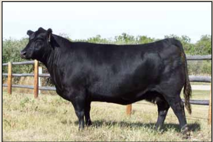
Dam - Bardolia Of Peak Dot 963H

If you're looking for style and muscle shape in a moderate package here are your bulls - 3 uniform full brothers. Their dam is a high selling donor cow from Peak Dot Ranch. A very powerful, great uddered and beautifully profiled female. She is definitely the bull making type, and she is proving it here.