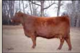
Dam of Lots 33, 34, 35