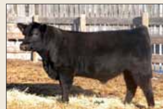
'Boom 44R' - Paternal Grand Sire