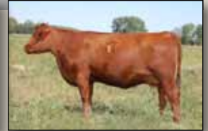
Dam of Lot 30