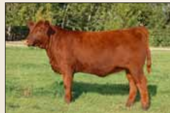
'Red Lazy MC Miss Dyn 32X' - Maternal Sister Sold to Lautenschlager & Sons, WA - Full sister to lots 1 & 5