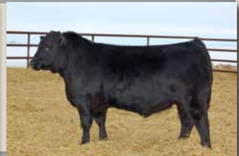
Bandura ZWT Encore 42X