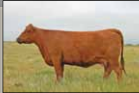
Dam of Lot 20