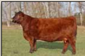
Dam of Lot 52