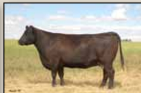
Dam of Lots 48, 51, 57