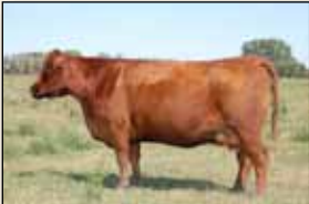
Dam of Lot 31