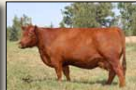
Dam of Lots 47, 54