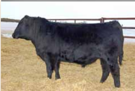
Bandura ZWT Encore 32X