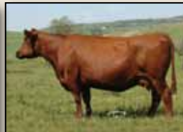
Dam of Lots 49, 50