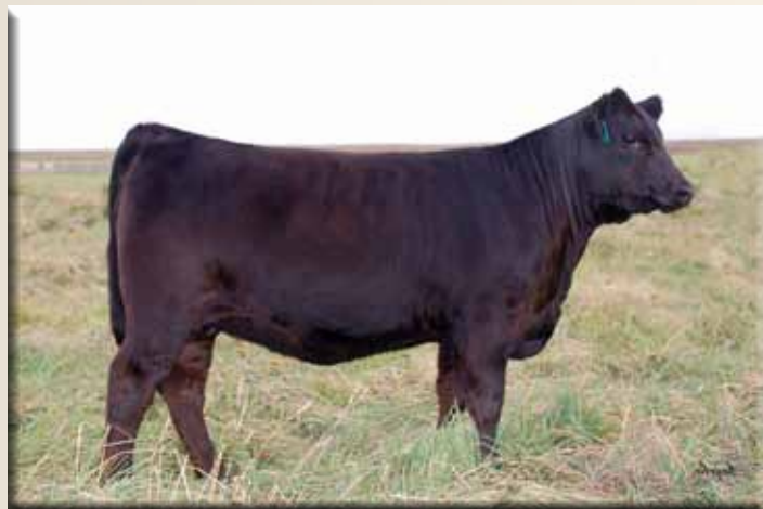
Masterpiece Daughter - BAN 17X Purchased by Express Ranches - Oklahoma