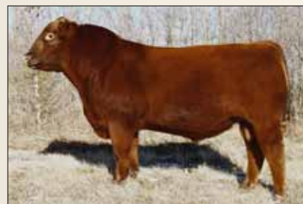
Pathfinder 5L - Maternal Grand Sire

RED 5L NORSEMAN KING 2291 RED RMJ REDMAN 1T CROWFOOT KURUBA 4033P