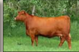
Dam of Lot 36