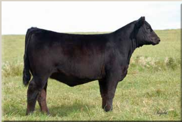
Masterpiece Daughter - BAN 22X Purchased by Champion Hill - Ohio