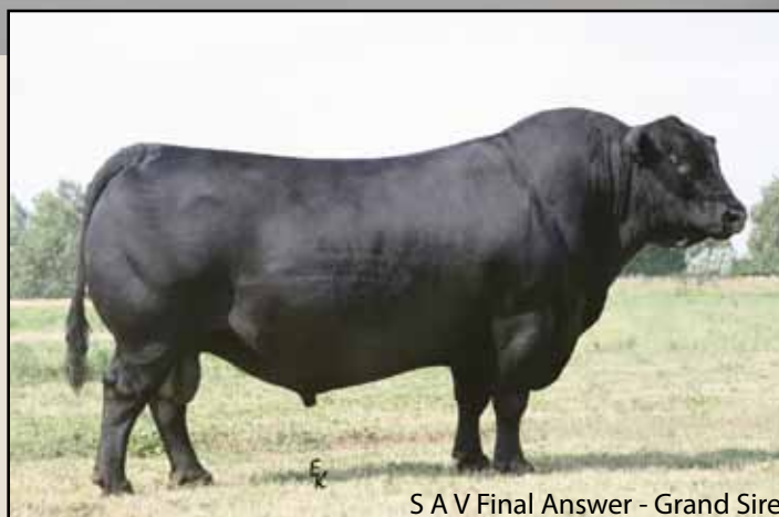
S A V Final Answer - Grand Sire

BW 1.9 WW 55 YW 95 Milk 19 TM 47 CE 5.0 MCE 7.0