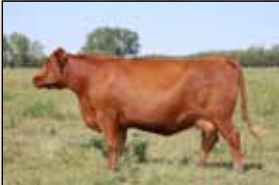
Dam of Lots 1, 5, 37, 38