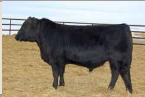
Bandura ZWT Encore 39X