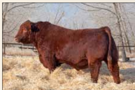
Smash 41N - Maternal Grand Sire

Our top performing bull on test - dam is a top donor cow and full sister to Bess 12S, our 'Supreme Champion' - 17S has genetics working for Welsh Prairie Red Angus, WI; Ralph & Kyle Geinger, AB and Lautenshlager & Sons Red Angus, WA - if you want soggy, easy fleshing and mature siring, take a look at this guy!