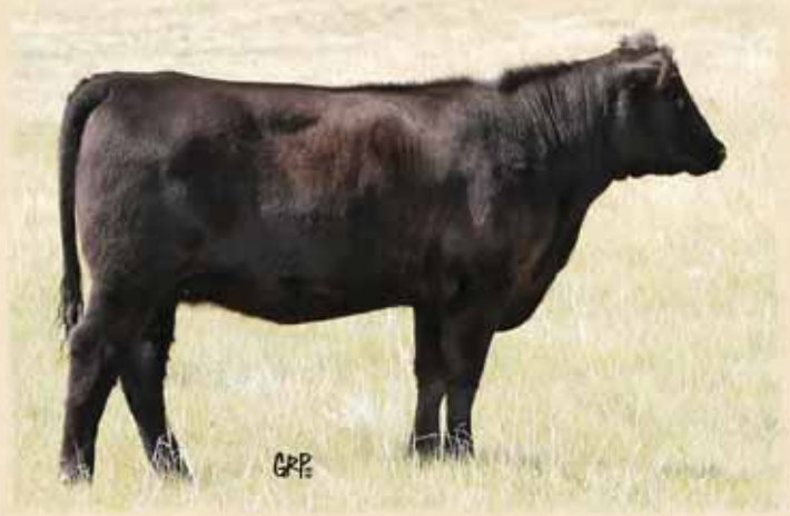
Lot 224 - Ranchers Choice princess 160C

BW: 90 LBS. | Adj. 205D: 744 LBS. EPDs: BW +4.0 | WW +43 | YW +66 | MILK +10 | TM +32 Exposed: May 10 to July 10, 2016 to Sheidaghan Thunder 82B -1790677-