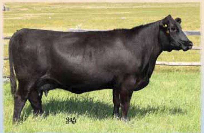
Lot 66 - Ranchers Choice Eula 153Z

FEMALE BTR 154D 1901246 FEBRUARY 21, 2016 BW: 89 SIRE: MCC OLD POST 1Y