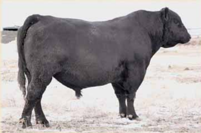
Ranchers Choice Bardolier 109X