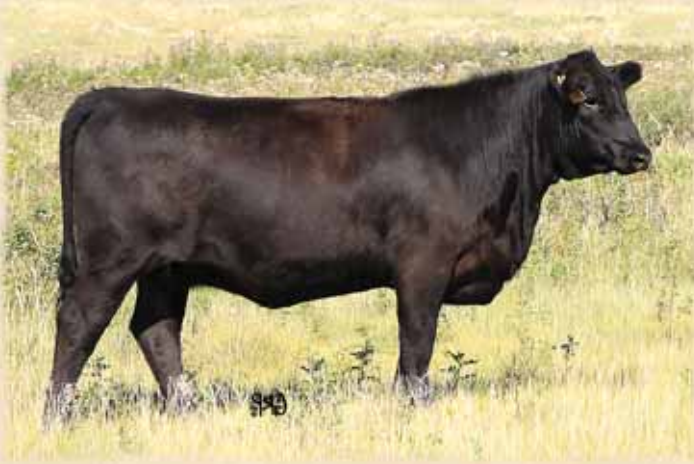
Lot 223 - Ranchers Choice Blackbird 157C