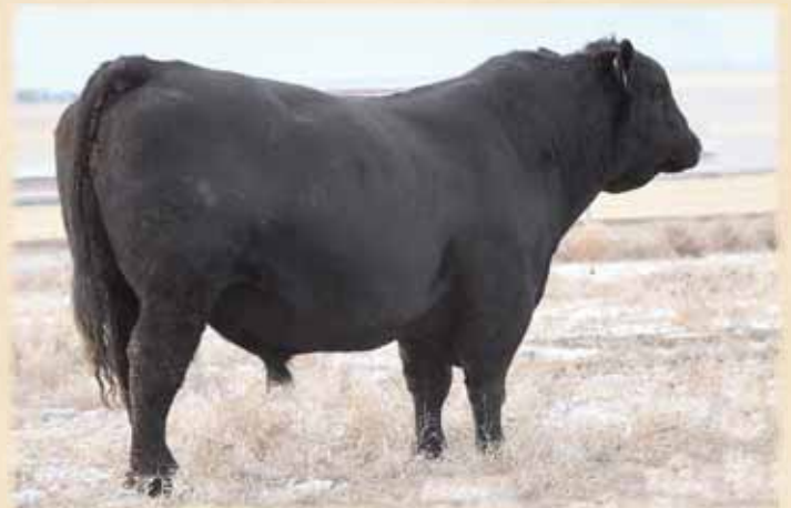
Double AA Bandolier 45Z