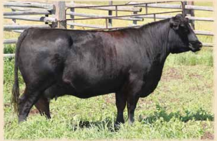
Lot 34 - Ranchers Choice Blackbird 89A

MALE BTR 166D 1901331 MARCH 17, 2015 BW: 84 SIRE: DOUBLE AA BARDOLENE 48Y