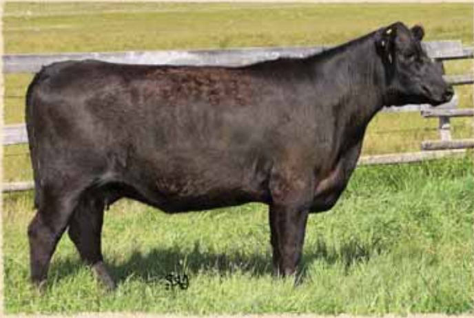
Lot 1 - Ranchers Choice Keepsake 31B