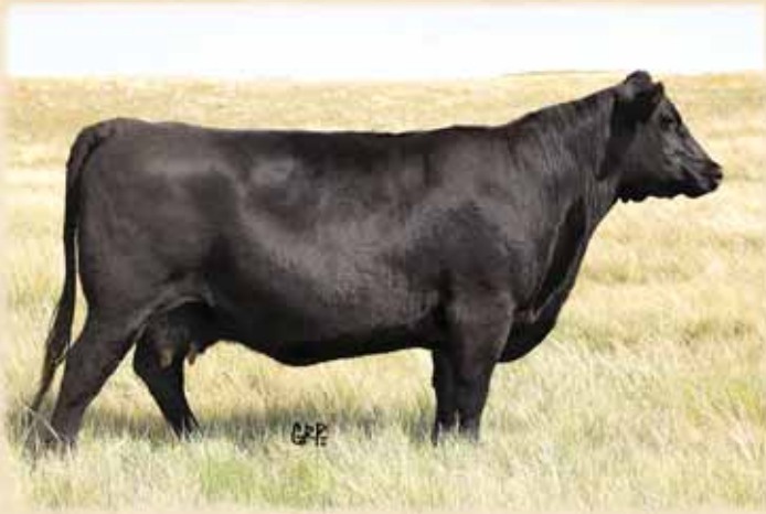
Lot 132 - Saskalta Erica 468U