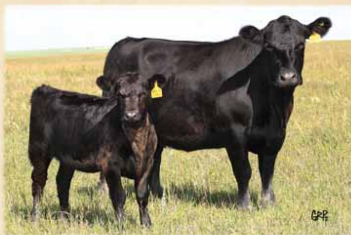
Lots 61 & 161A - Ranchers Choice Blackbird 123Z & Blackbird 149D