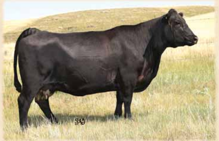
Lot 122 - Saskalta Kathlene 64U