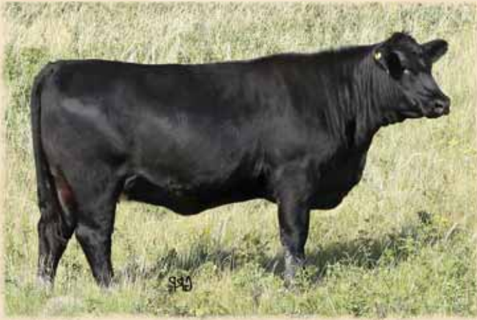
Lot 206 - Ranchers Choice Tradition 183C