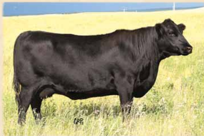
Lot 149 - Saskalta Blackbird 538T

FEMALE BTR 65D 1901311 MARCH 8, 2016 BW: 95 SIRE: MCC OLD POST 1Y