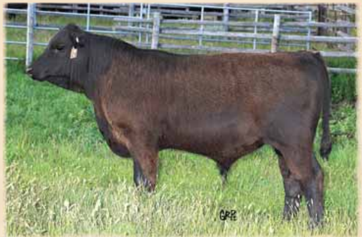
Lot 104B - Ranchers Choice Bandolier 110D

FEMALE BTR 107D 1901274 FEBRUARY 27, 2016 BW: 84 SIRE: RANCHERS CHOICE BARDOLIER 109X