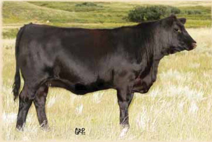
Lot 214 - Ranchers Choice Duchess 68C