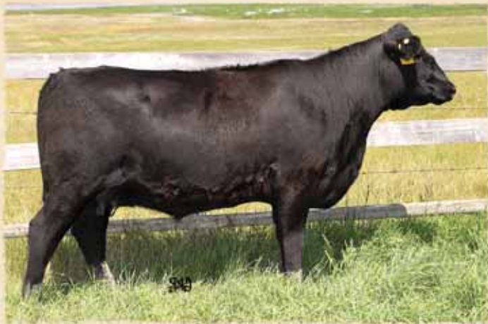
Lot 17 - Ranchers Choice Annie K 205B