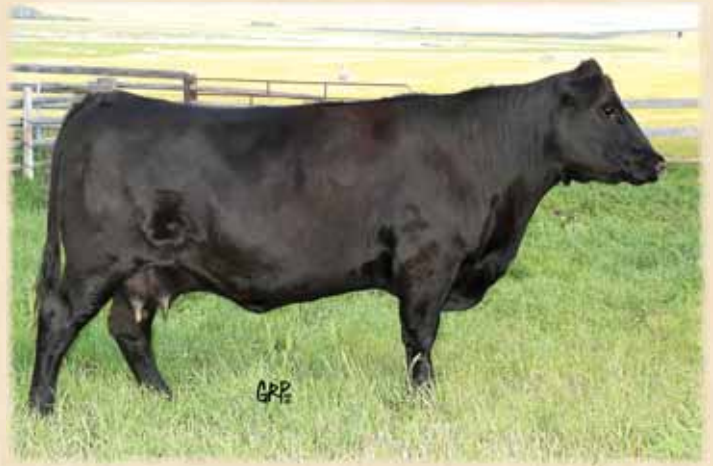
Lot 75 - Ranchers Choice Uruguay 853Z