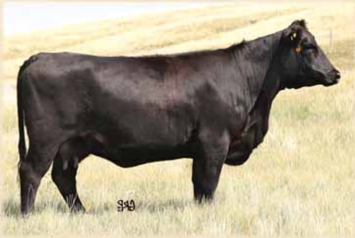
Lot 29 - Ranchers Choice Annie K 6A