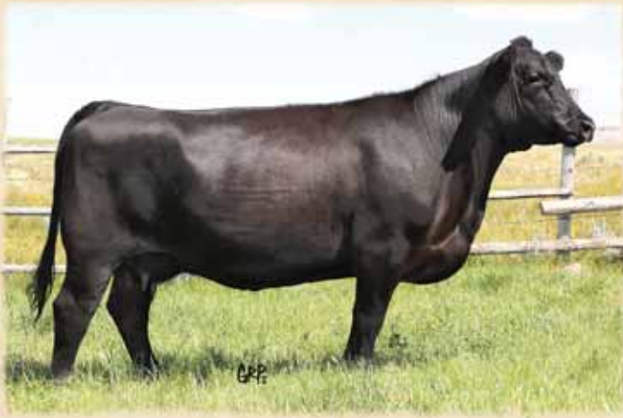
Lot 96 - Ranchers Choice Duchess 132X