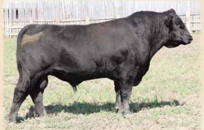
Ranchers Choice Tommy 182B