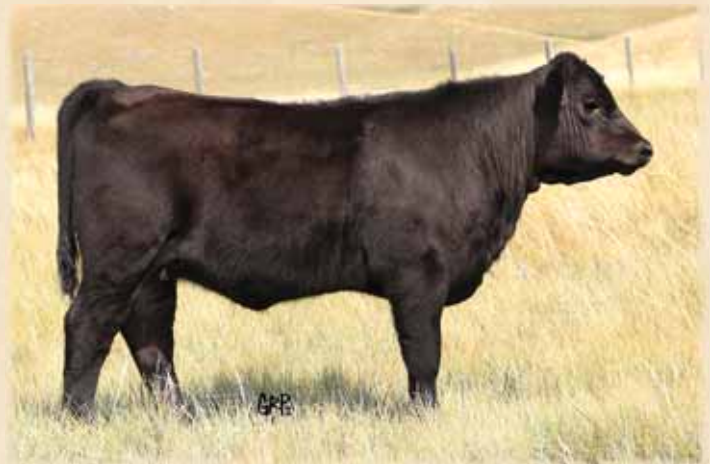
Lot 101A - Ranchers choice Erica 107D