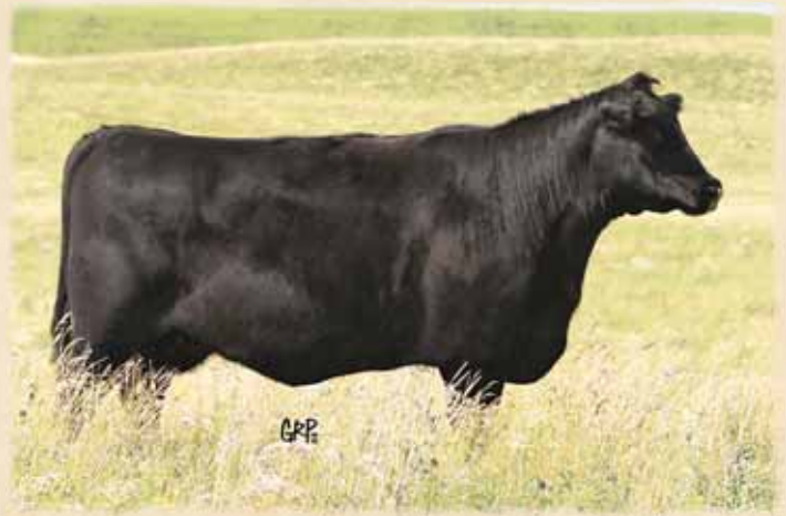
Lot 134 - Saskalta Princess 506U