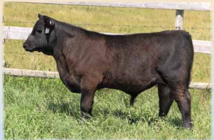
Lot 81B - Ranchers Choice Bardolene 126D

MALE BTR 126D 1901279 MARCH 1, 2016 BW: 86 SIRE: DOUBLE AA BARDOLENE 48Y