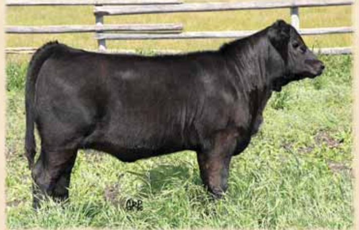
Lot 75A - Ranchers Choice Uruguay 163D