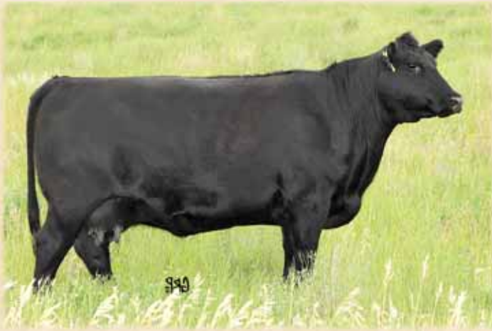
Lot 89 - Ranchers choice Annie K 0203Y