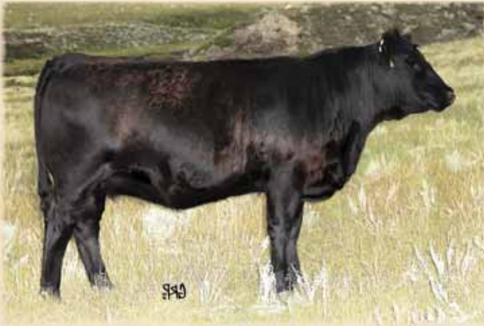
Lot 242 - Ranchers Choice Heroine 200C