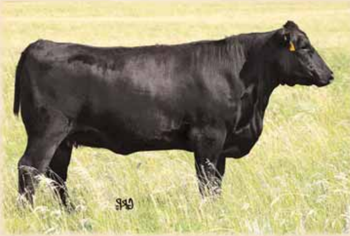
Lot 24 - Ranchers Choice Burgess 240B