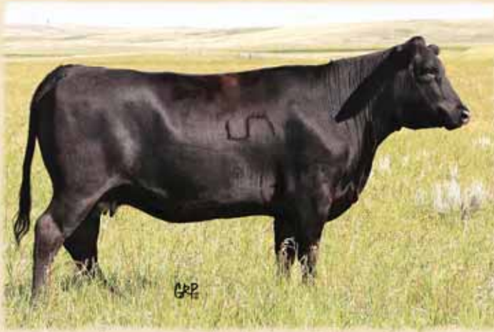
Lot 77 - Sealin Creek Rosebud 20Y