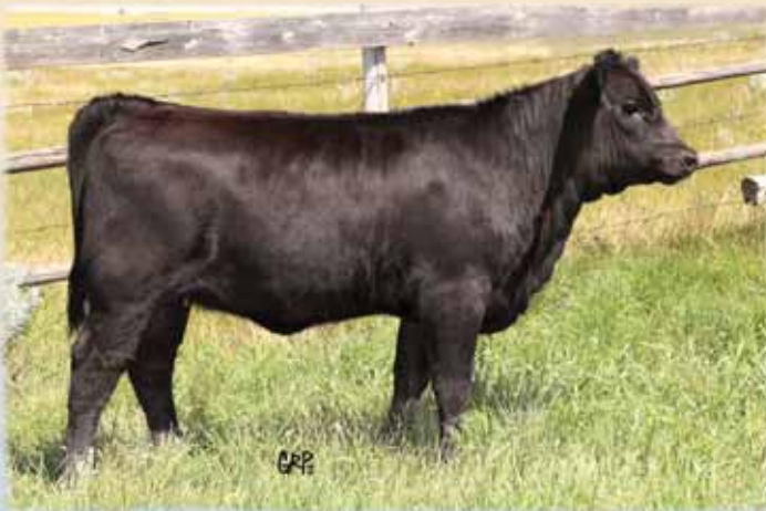
Lot 118A - Ranchers Choice Elnora 95D