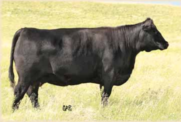
Lot 121 - Saskalta Erica 35U