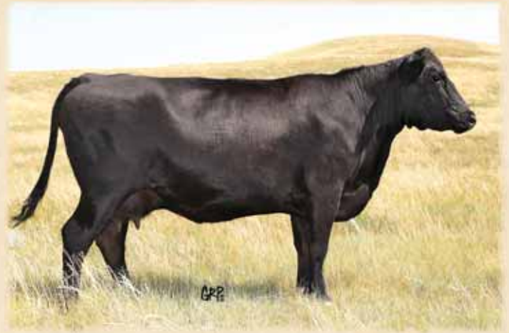
Lot 116 - Lookout Countess 86W