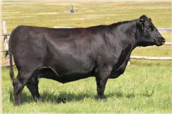
Lot 68 - Ranchers Choice Heroine 175Z