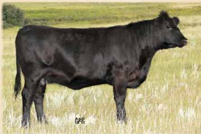
Lot 200 - Ranchers choice Heroine 57C