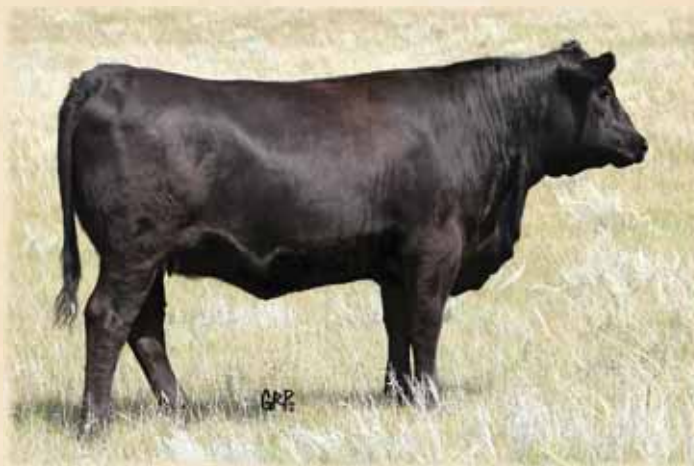
Lot 248 - Ranchers Choice Princess 100C

Exposed: May 10 to July 10, 2016 to Ranchers Choice Bardolier 864A -1764263-