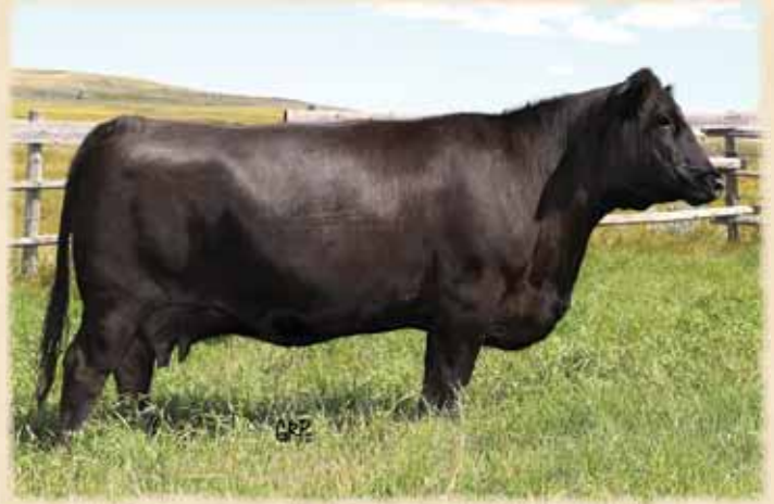
Lot 53 - Ranchers Choice Kathlene 26Z