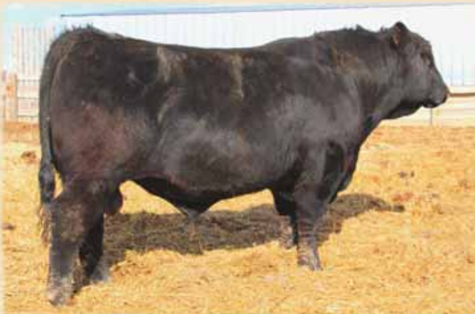
Double AA Bardolene 48Y

BW: 88 LBS. | Adj. 205D: 744 LBS. | Adj. 365D: 1236 LBS. EPDs: BW +2.2 | WW +38 | YW +63 | MILK +11 | TM +30