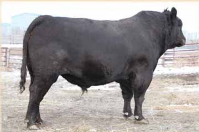
Fleury Winston 10Z

BW: 91 LBS. EPDs: BW +3.4 | WW +36 | YW +66 | MILK +10 | TM +28