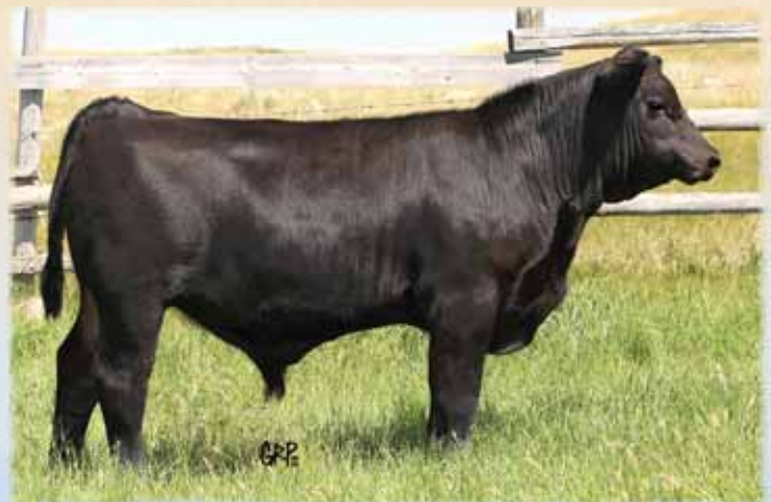
Lot 69B - Ranchers Choice Bardolene 157D