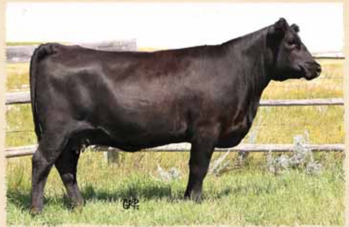
Lot 11 - Ranchers Choice Princess 162B