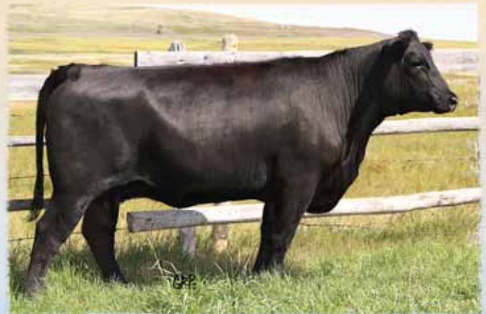
Lot 23 - Ranchers Choice Blackbird 233B

FEMALE BTR 217D 1901290 MARCH 4, 2016 BW: 76 SIRE: FLEURY WINSTON 10Z