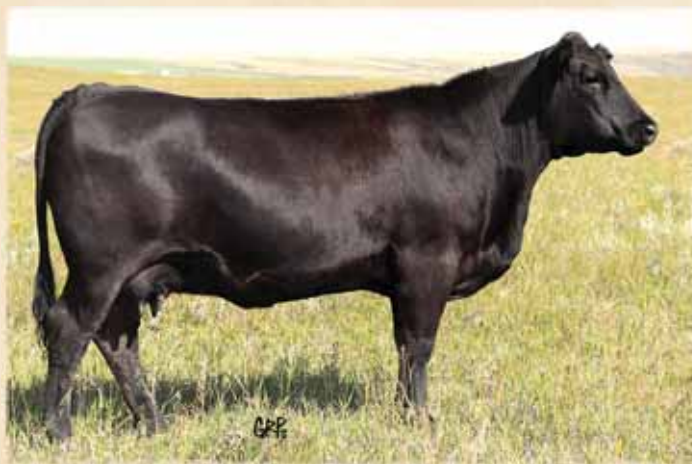
Lot 36 - Ranchers Choice Annie K 121A

FEMALE BTR 173D 1901314 MARCH 9, 2016 BW: 83 SIRE: SEALIN CREEK ERIC 17Y