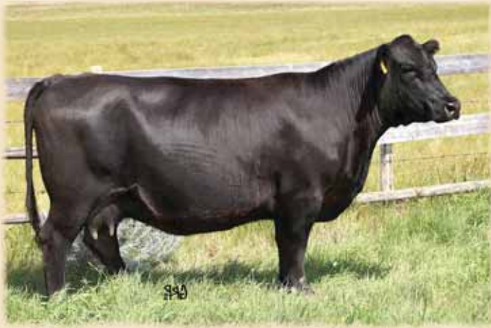
Lot 115 - Saskalta Heroine 84W