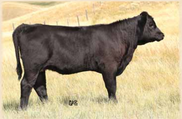
Lot 122A - Ranchers Choice Kathlene 74D