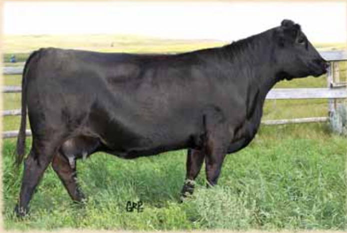
Lot 72 - Ranchers Choice Atlanta 303Z