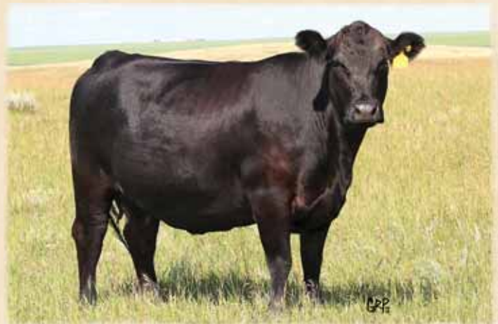
Lot 69 - Ranchers Choice Atlanta 202Z

MALE BTR 159D 1901232 FEBRUARY 16, 2016 BW: 93 SIRE: RANCHERS CHOICE BARDOLIER 109X