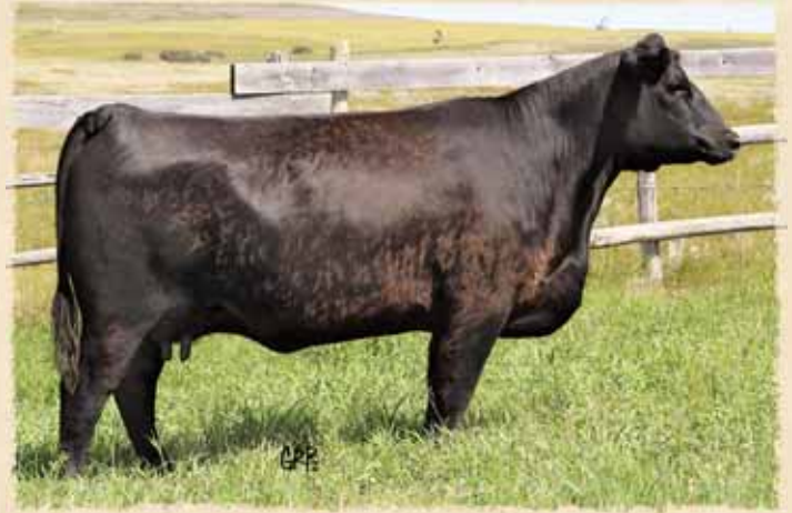
Lot 3 - Ranchers Choice Annie 78B

MALE BTR 193D 1901335 MARCH 18, 2016 BW: 80 SIRE: FLEURY WINSTON 10Z