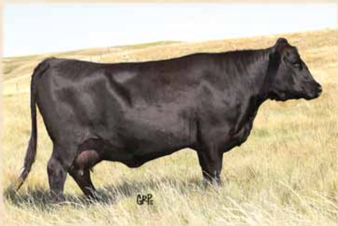
Lot 101 - Ranchers Choice Erica 439X