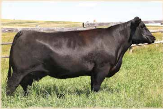
Lot 107 - Ranchers choice Susie 519X