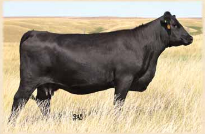
Lot 25 - Ranchers Choice Morrison 247B