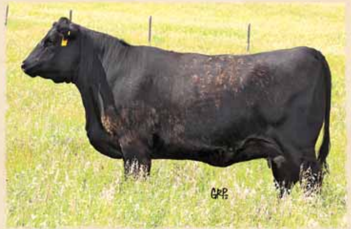
Lot 21 - Ranchers Choice Doll 225B

FEMALE BTR 216D 1901257 FEBRUARY 24, 2016 ADJ. BW: 84 SIRE: FLEURY WINSTON 10Z