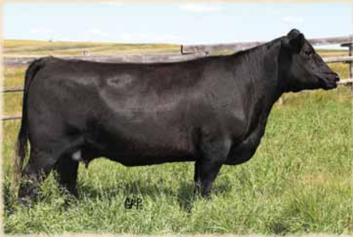
Lot 62 - Sandy Bar Annie 123Z