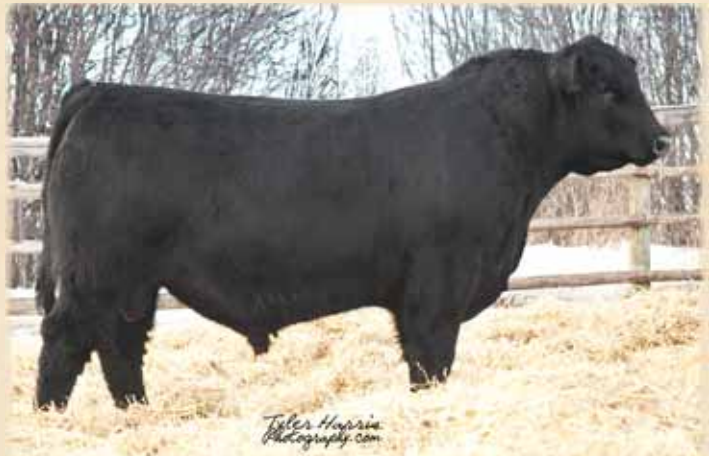
Fleury Bardolier 87B