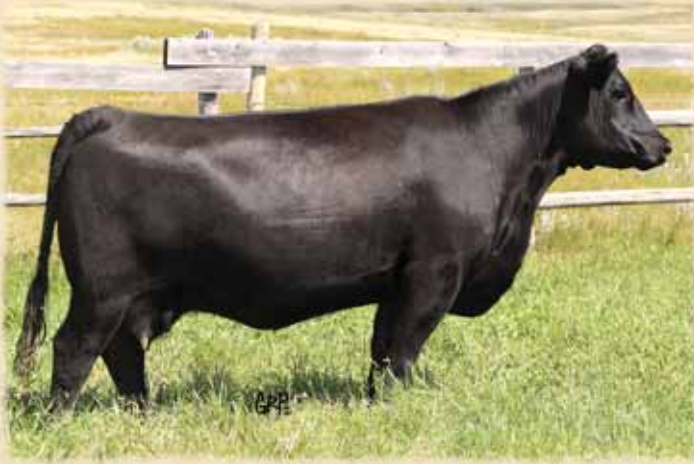
Lot 49 - Ranchers Choice Annie K 292A