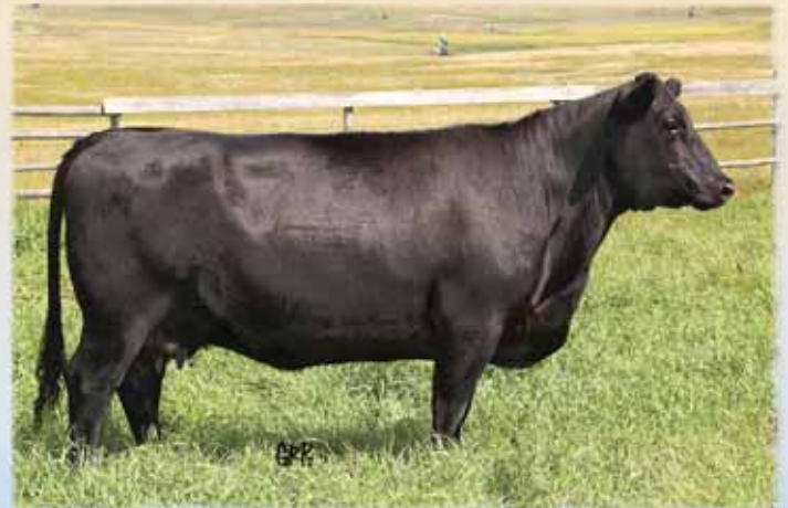
Lot 91 - Remington Ella Allegra 524Y