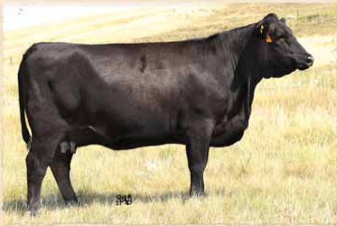
Lot 20 - Ranchers Choice Duchess 223B