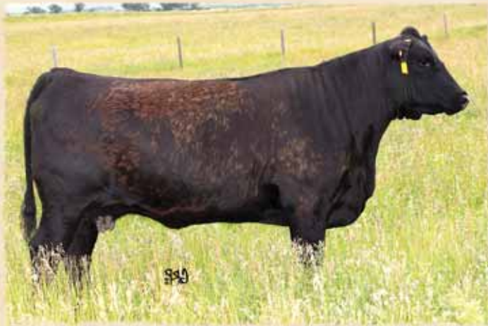
Lot 8 - Ranchers Choice Annie K 145B