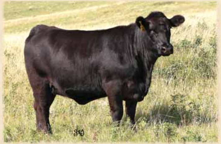
Lot 212 - Double AA Rosebud 902C