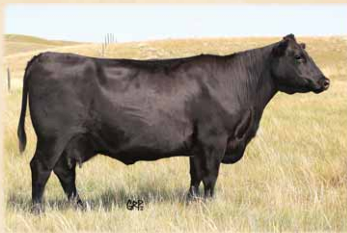
Lot 128 - Saskalta Annie K 308U