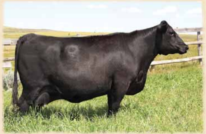
Lot 136 - Saskalta Queenette 29T