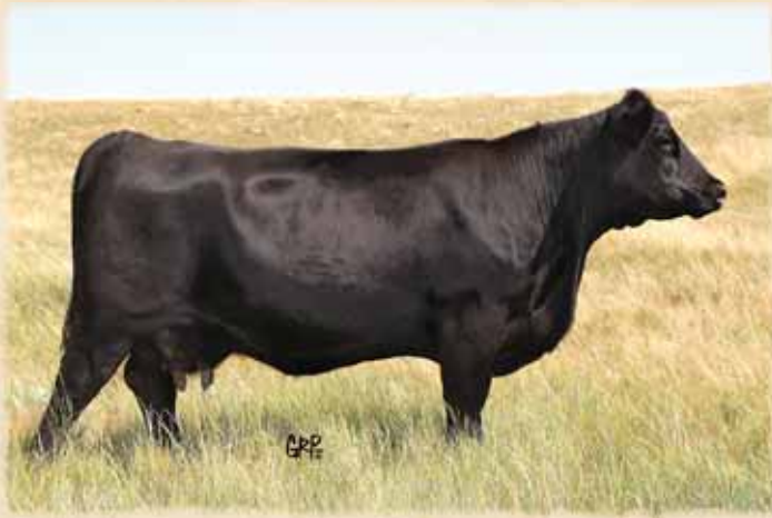
Lot 83 - Ranchers Choice Annie K 99Y