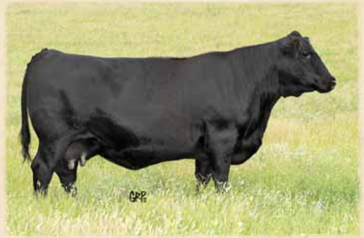
Lot 80 - Ranchers Choice Blackbird 86Y

MALE RCE 902D REG NO? MARCH 18, 2016 BW: 90 SIRE: MCC OLD POST 1Y