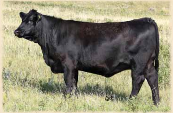
Lot 216 - Ranchers Choice Annie K 114C