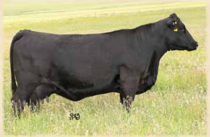
Lot 65 - Ranchers Choice Annie K 144Z

MALE BTR 152D 1916920 MARCH 9, 2016 BW: 92 SIRE: RANCHERS CHOICE TOMMY 182B