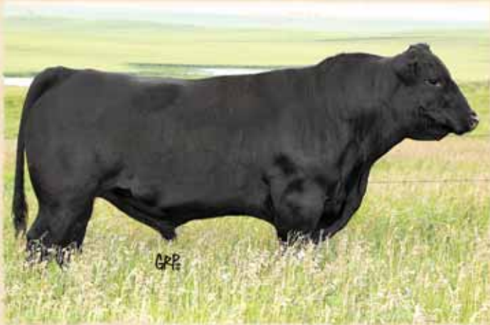
MCC Old Post 1Y