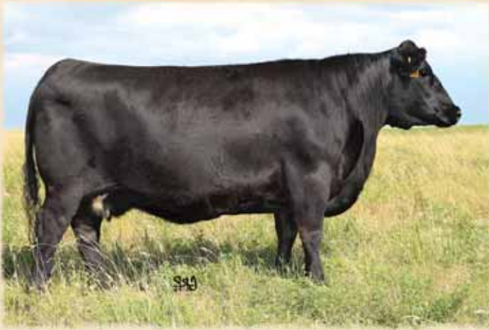
Lot 135 - Saskalta Lady 25T