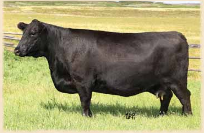
Lot 90 - Remington Pride 506Y

FEMALE BTR 136D 1901233 FEBRUARY 17, 2016 BW: 90 SIRE: DOUBLE AA BANDOLIER 45Z