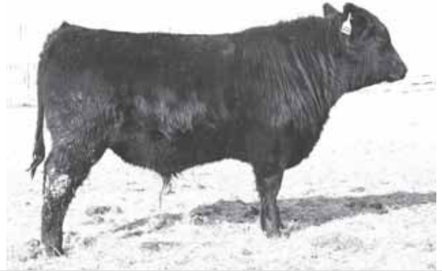
LOT 78 - RANCHERS CHOICE BARDOLENE 227A

EPDs: BW: +3.1 WW: +32 YW: +48 MILK: +7 TM: +23