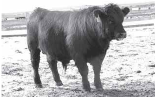
LOT 15 - RANCHERS CHOICE WINSTON 819A

EPDs: BW: +3.4 WW: +40 YW: +59 MILK: +15 TM: +35