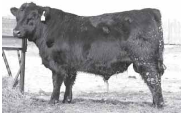
LOT 41 - RANCHERS CHOICE BARDOLIER 65A

BW: 91 LBS. OCT. 15/13: 735 LBS. AOD: 8 EPDs: BW: +3.9 WW: +27 YW: +47 MILK: +12 TM: +26