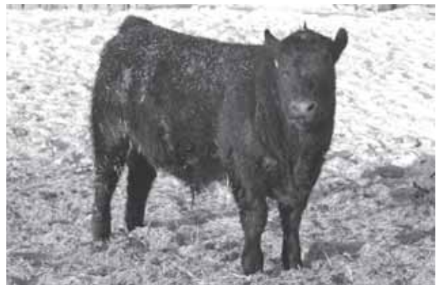
LOT 86 - RANCHERS CHOICE BARDOLIER 230A

BW: 84 LBS. OCT. 15/13: 645 LBS. AOD: 4 EPDs: BW: +1.9 WW: +30 YW: +55 MILK: +11 TM: +26