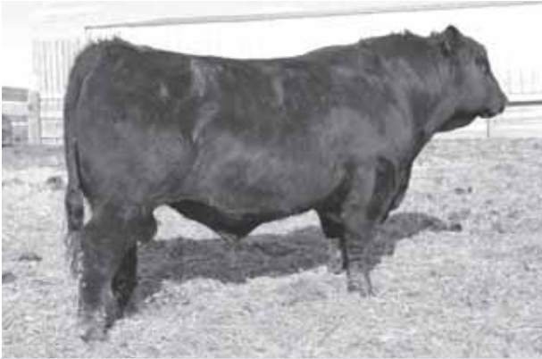
DOUBLE AA BARDOLENE 48Y