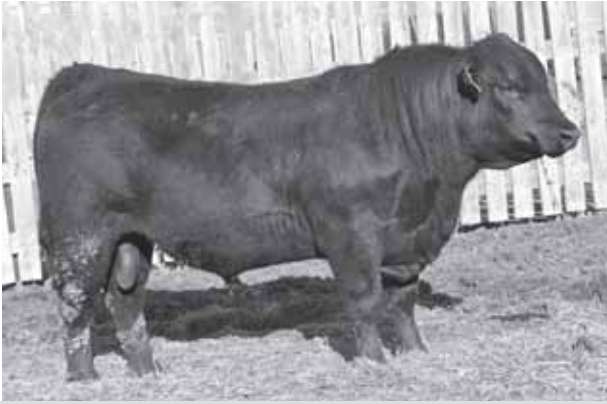
SASKALTA ESTON 134W