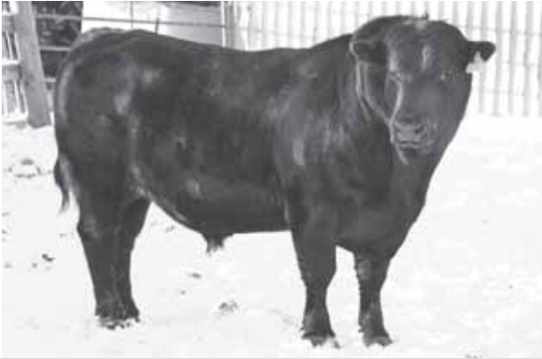
DOUBLE AA BARDOLIER 207W