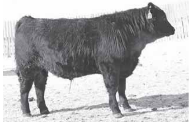
LOT 62 - RANCHERS CHOICE BLACKMAN 141A