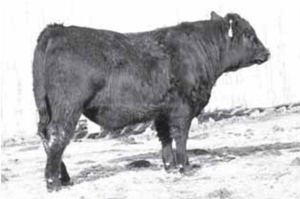
LOT 85 - RANCHERS CHOICE BARDOLIER 211A

BW: 85 LBS. ADJ. 205D: LBS. ADJ. 365D: LBS. EPDs: BW: +1.5 WW: +30 YW: +60 MILK: +18 TM: +33