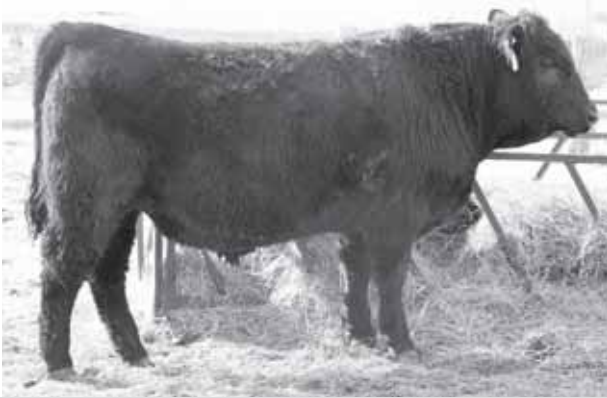
LOT 8 - RANCHERS CHOICE MARSHALL 207A