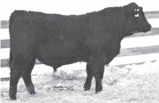
LOT 85 - RANCHERS CHOICE BANDY 166Z