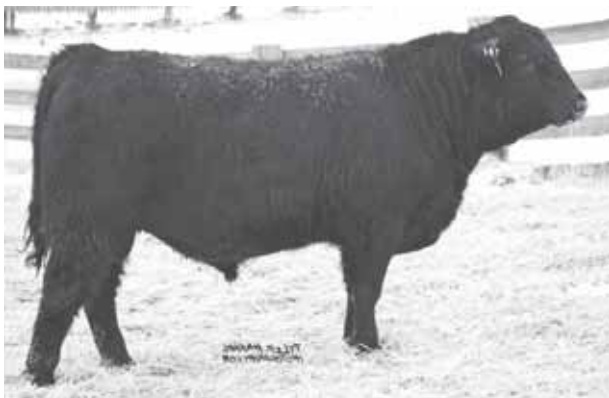
LOT 36 - RANCHERS CHOICE BARDOLENE 183Z