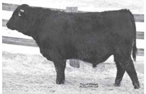
LOT 96 - RANCHERS CHOICE RITO 838Z