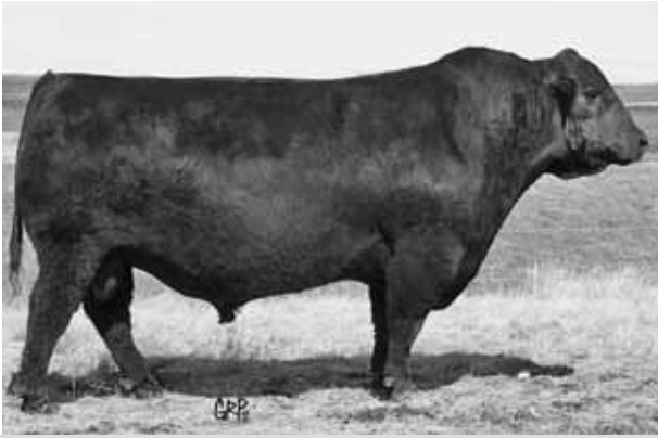
DOUBLE AA BARDOLIER 610'06