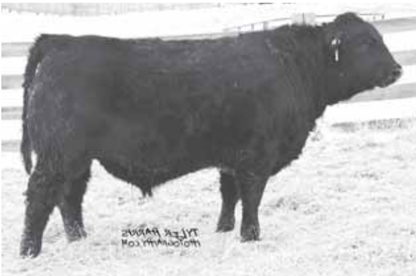
LOT 21 - RANCHERS CHOICE BARDOLIER 30Z