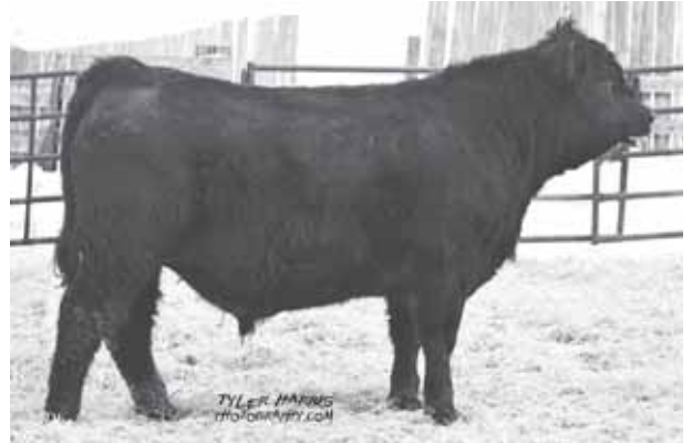
LOT 48 - RANCHERS CHOICE MARSHALL 110Z