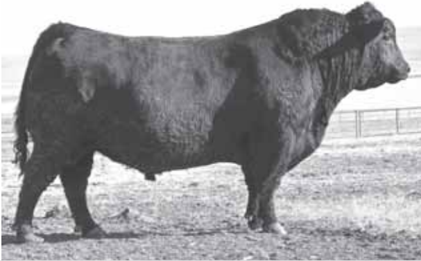
F V 308M KING 445T