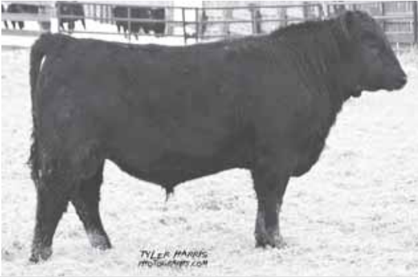
LOT 42 - RANCHERS CHOICE BARDOLENE 250Z