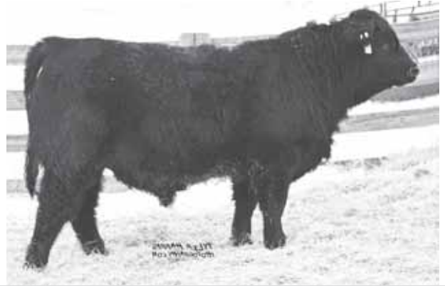
LOT 24 - RANCHERS CHOICE BARDOLIER 167Z