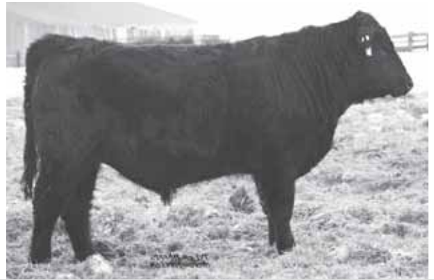
LOT 45 - RANCHERS CHOICE MARSHALL 44Z