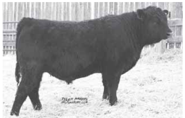
LOT 47 - RANCHERS CHOICE MARSHALL 62Z