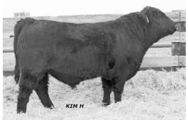
SASKALTA BARDOLENE 97T