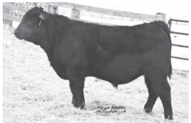
LOT 55 - RANCHERS CHOICE MARSHALL 206Z