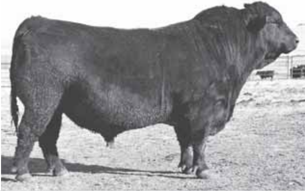
DOUBLE AA BARDOLIER 217'06