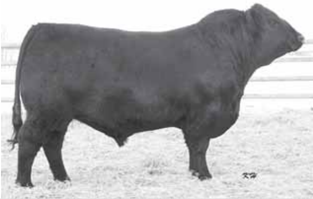
SASKALTA BANDOLIER 40W