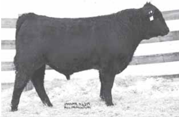
LOT 34 - RANCHERS CHOICE BARDOLENE 156Z