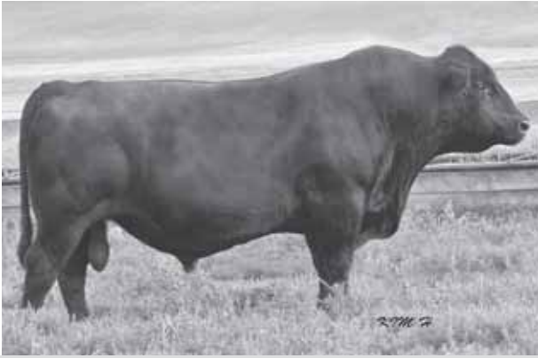
SASKALTA BANDY 98N