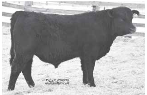
LOT 90 - RANCHERS CHOICE RITO 815Z