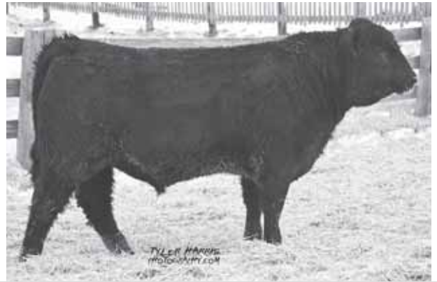
LOT 37 - RANCHERS CHOICE BARDOLENE 205Z