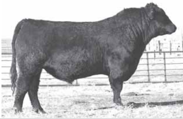
FLEURY BLACKMAN 76W