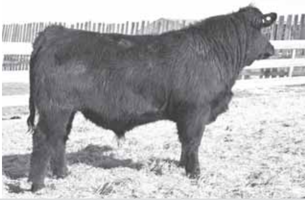
LOT 7 - RANCHERS CHOICE BARDOLIER 119Y