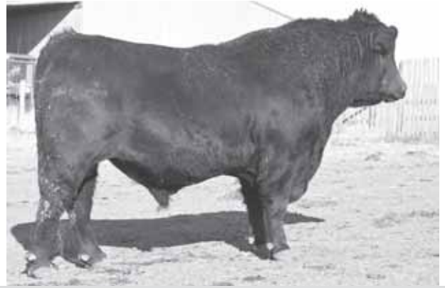
SASKALTA ESTON 105W