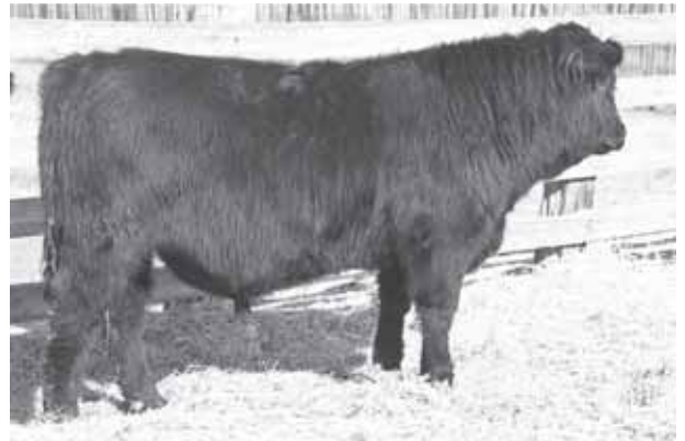
LOT 76 - RANCHERS CHOICE FAME 832Y