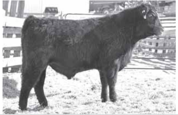
LOT 63 - RANCHERS CHOICE BANDY 195Y