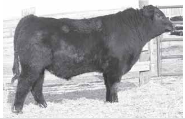
LOT 23 - RANCHERS CHOICE BARDOLENE 154Y