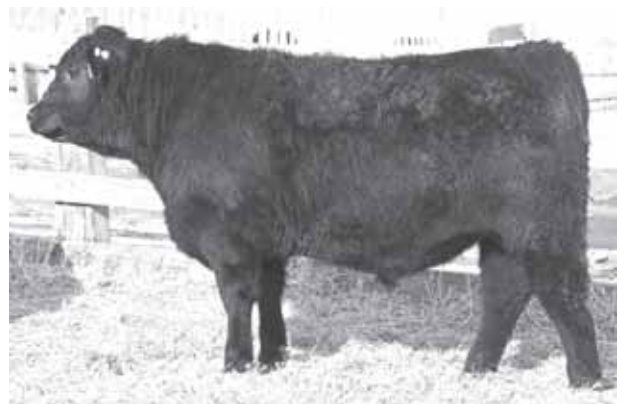
LOT 78 - RANCHERS CHOICE 811Y