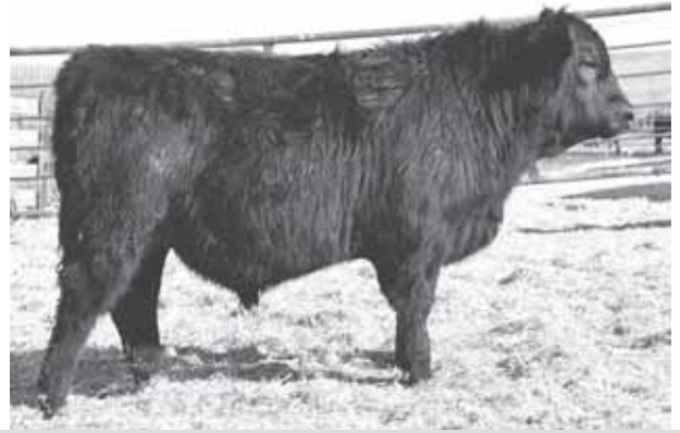
LOT 2 - RANCHERS CHOICE BARDOLIER 27Y