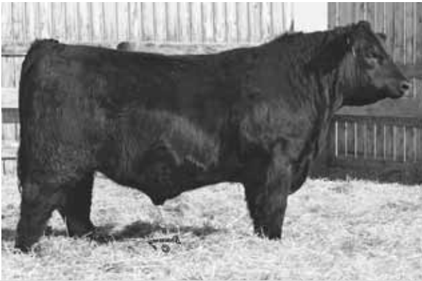
CCL RACHIS 48U