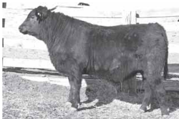
LOT 39 - RANCHERS CHOICE BARDOLENE 168Y