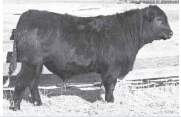
LOT 46 - RANCHERS CHOICE MARSHAL 71Y