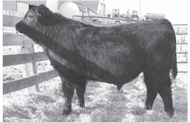
LOT 12 - RANCHERS CHOICE BARDOLIER 206Y