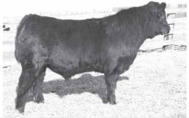
LOT 53 - RANCHERS CHOICE BLACKMAN 205Y