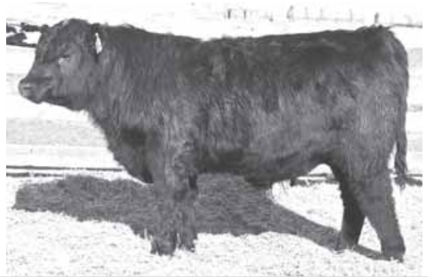
LOT 77 - RANCHERS CHOICE RACHIS 804Y