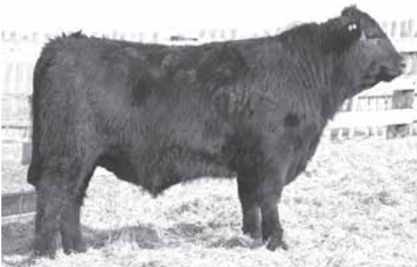
LOT 56 - RANCHERS CHOICE BLACKMAN 820Y