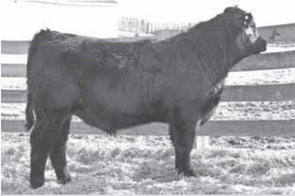
LOT 54 - RANCHERS CHOICE BLACKMAN 207Y