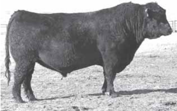
DOUBLE AA BARDOLENE 54'06