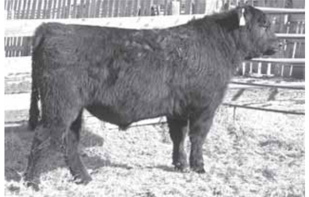
LOT 44 - RANCHERS CHOICE BARDOLENE 96Y

EPDs: BW: +2.6 WW: +28 YW: +50 MILK: +4 TM: +18