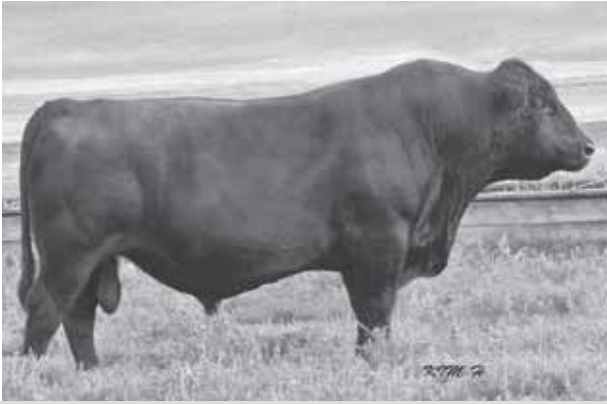
SASKALTA BANDY 98N