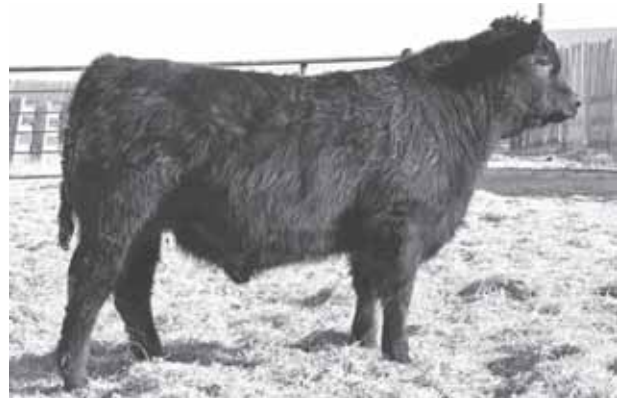
LOT 5 - RANCHERS CHOICE BARDOLIER 58Y