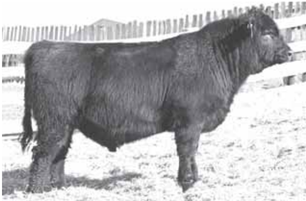
LOT 75 - RANCHERS CHOICE FAME 802Y