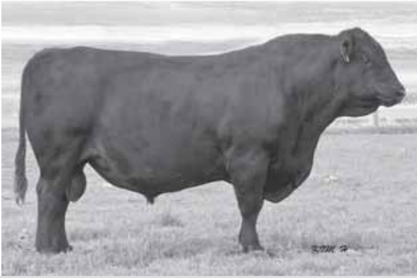
SASKALTA FAME 369P