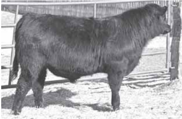
LOT 82 - RANCHERS CHOICE BARDOLIER 208Y