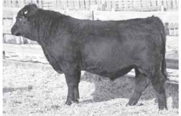
LOT 31 - RANCHERS CHOICE BARDOLENE 733Y