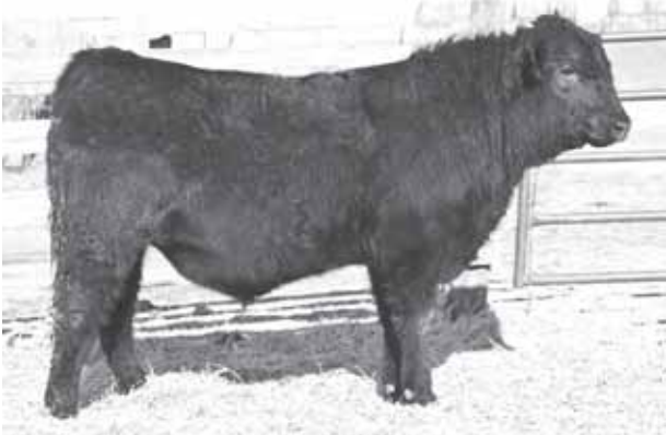
LOT 40 - RANCHERS CHOICE BARDOLENE 801Y