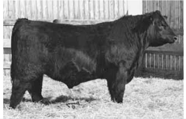
CCL RACHIS 48U