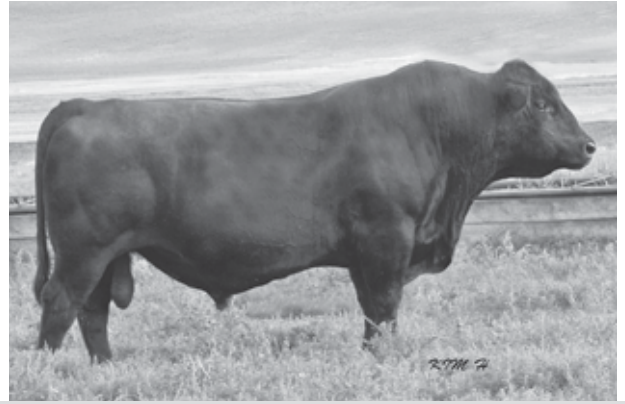
SASKALTA BANDY 98N