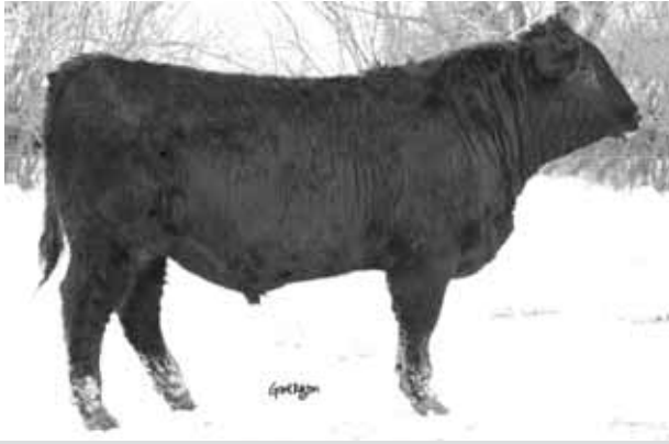
FV 308M KING 445T