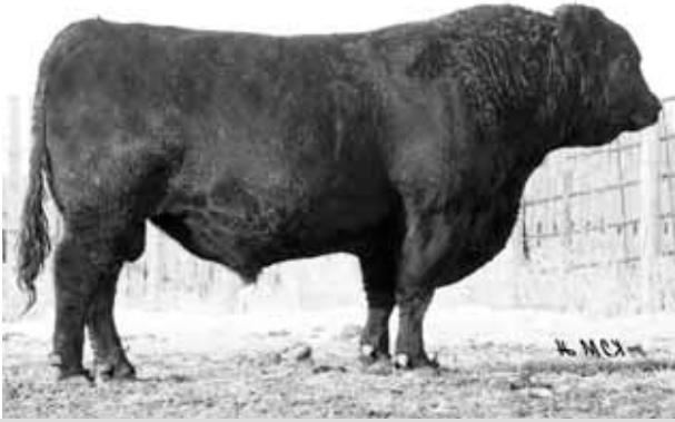
DOUBLE AA BARDOLIER 314'03