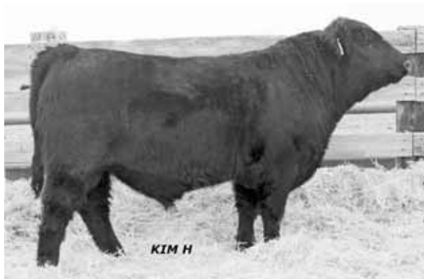
SASKALTA BARDOLENE 97T