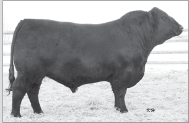
AS A 2 YEAR OLD THIS IS HOW THE RANCHER'S CHOICE BULLS TURN OUT