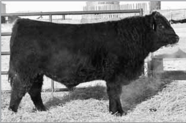
AS A YEARLING AT THE 2010 RANCHER'S CHOICE SALE SASKALTA RETAINED A 1/3 INTEREST