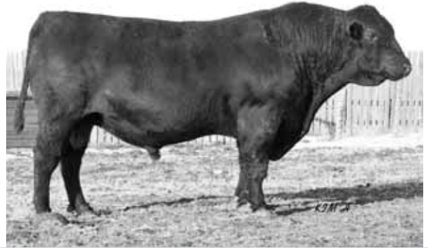
SASKALTA WINSTON 283N