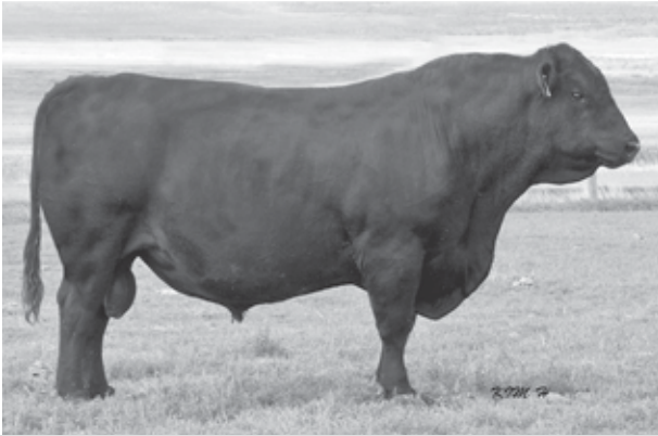
SASKALTA FAME 369P