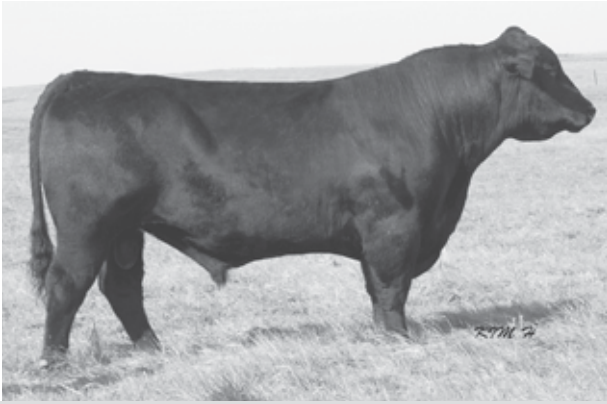
DOUBLE AA BARDOIER 47'06