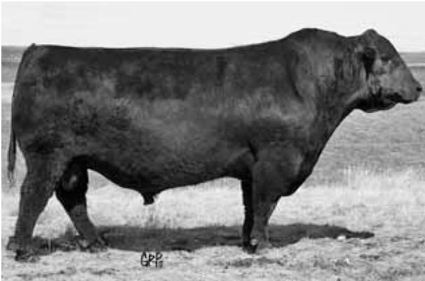
DOUBLE AA BARDOIER 610'06