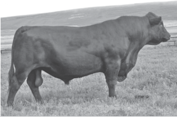
DOUBLE AA BARDOLENE 223'05