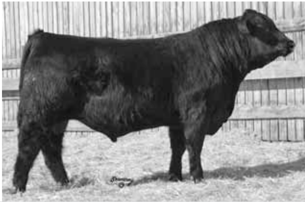
HJD POWERLINE 74U - SIRE OF LOT 123