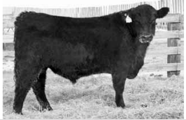
LOT 98 - SASKALTA FAME 167W