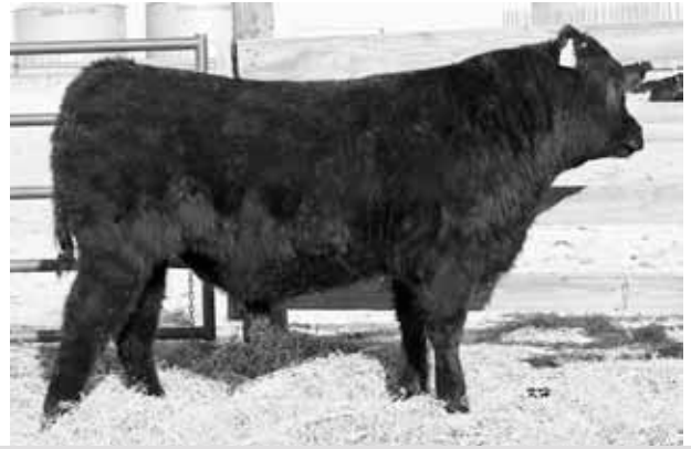
LOT 74 - DOUBLE AA BARDOLIER 36'09