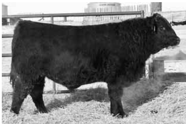
LOT 48 - SASKALTA BANDOLIER 40W