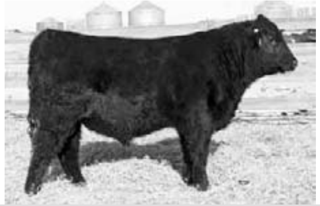
LOT 1 - SASKALTA BARDOLENE 435W