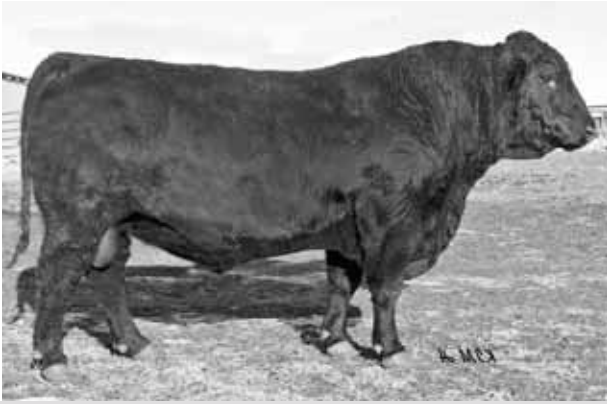
DOUBLE AA BARDOLENE 422'03