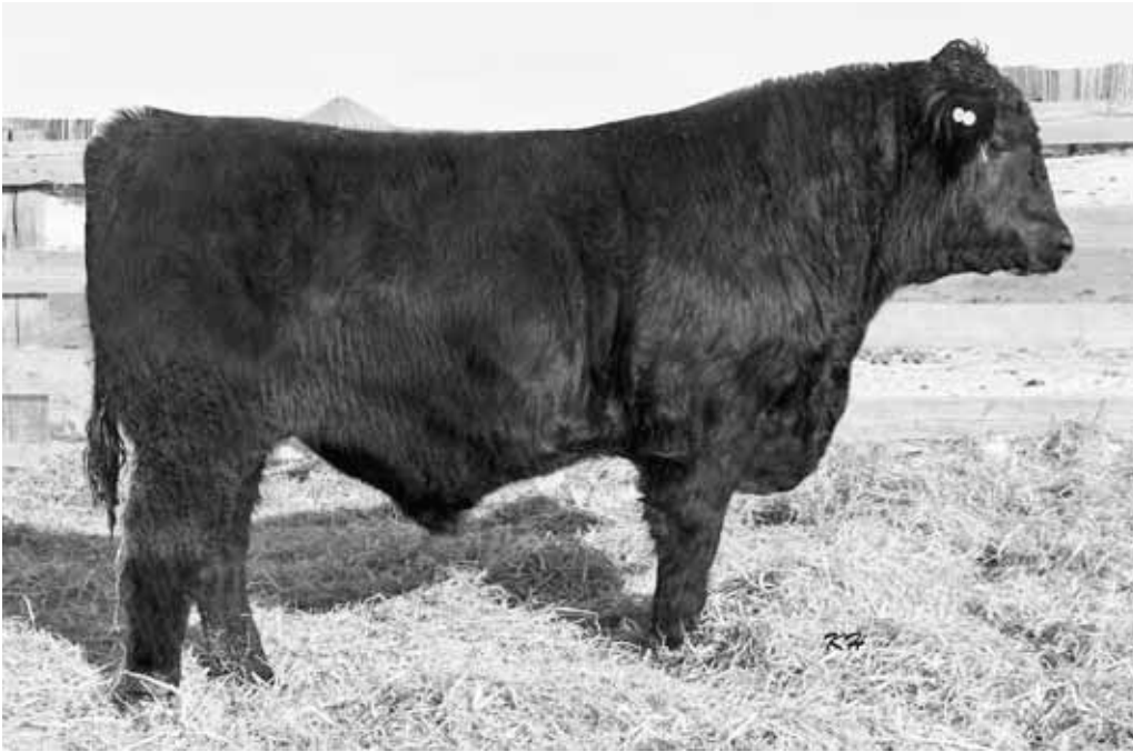
LOT 52 SASKALTA ESTON 105W