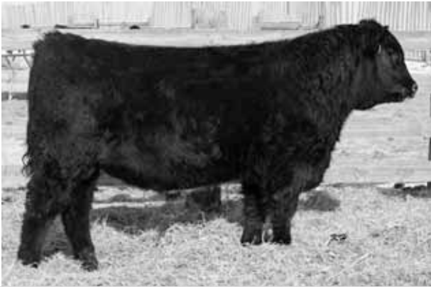
LOT 113 - SASKALTA FAME 108W