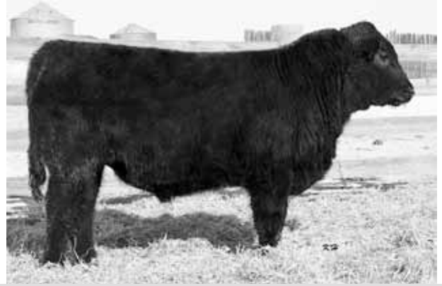
LOT 68 - DOUBLE AA REMINGTON 47'09

MATERNAL BROTHER TO REFERENCE SIRE M & A NUMBER OF DOUBLE AA HERDSIRES