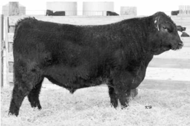
LOT 104 - SASKALTA FAME 57W