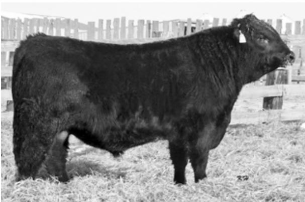
LOT 103 - SASKALTA FAME 44W