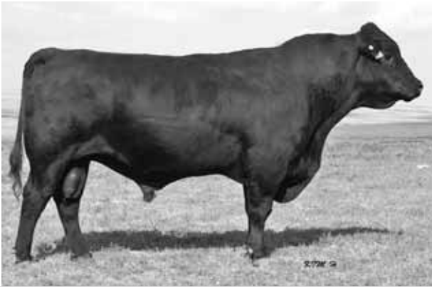
SASKALTA BARDOLIER 136R