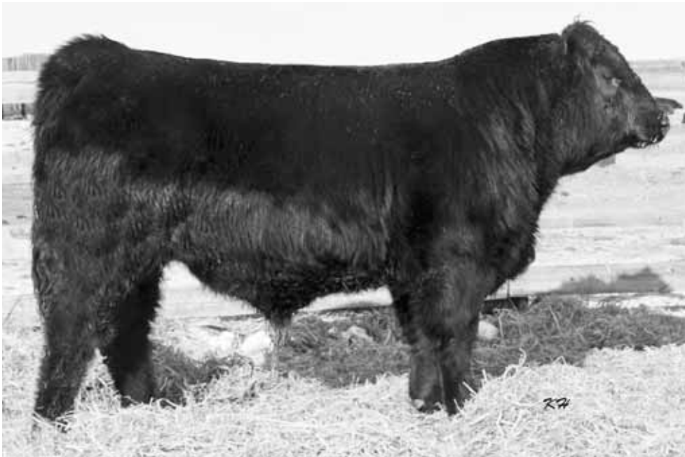
LOT 89 DOUBLE AA HICK HOP 156'09