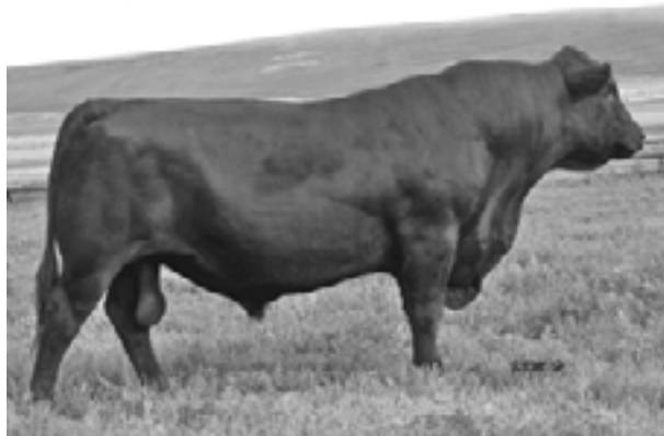
DOUBLE AA BARDOLENE 223'05

EPDs: BW: +5.5 WW: +24 YW: +37 MILK: +14 TM: +26 YG: +12