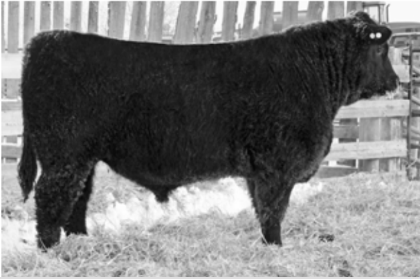
LOT 94 - SASKALTA FAME 140W