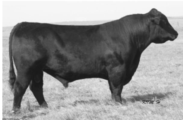
DOUBLE AA HICK HOP 47'07 SON OF REFERENCE SIRE N BLACK WHEEL HICK HOP 49R