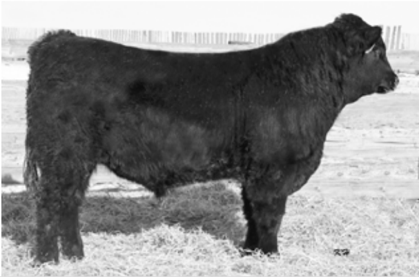
LOT 105 - SASKALTA FAME 59W