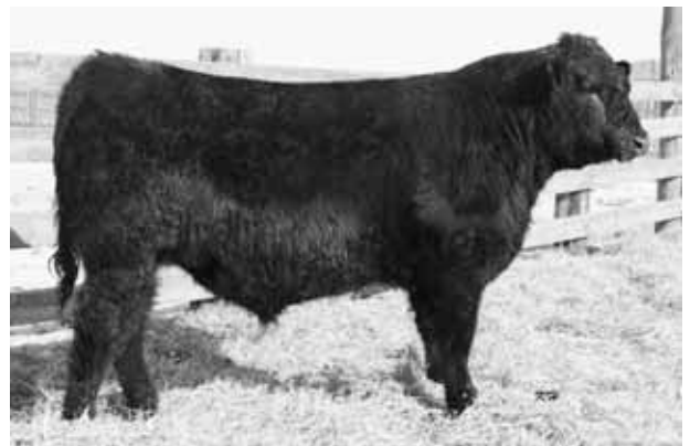
LOT 77 - DOUBLE AA BARDOLIER 152'09