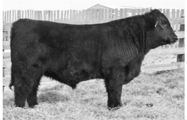
LOT 106 - SASKALTA FAME 64W