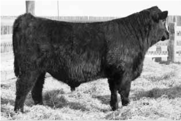
LOT 73 - DOUBLE AA BARDOLIER 32'09