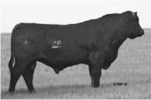
REMINGTON BANDY 236S