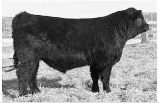
LOT 119 - SASKALTA BARDOLIER 491W