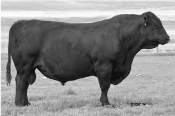
SASKALTA FAME 369P