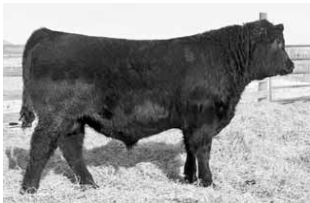
LOT 28 - DOUBLE AA BARDOLENE 58'09