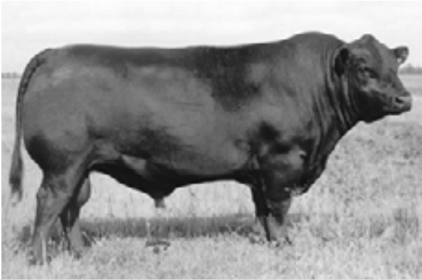
BARDOLENE OF OLD POST 5 - FOUNDATION SIRE