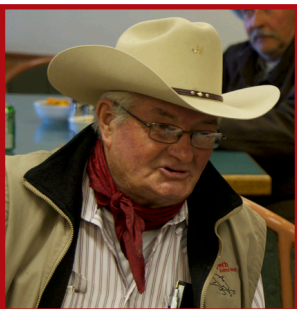
Archie Sabin Hargrave Ranches