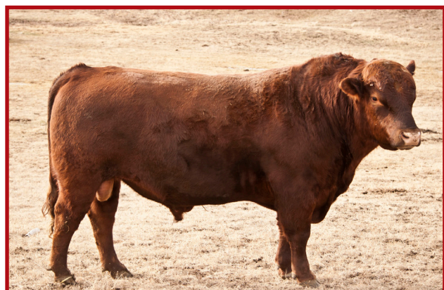
Red Benchmark Copper Rob 5'12 (#1671933) BW 71 lbs