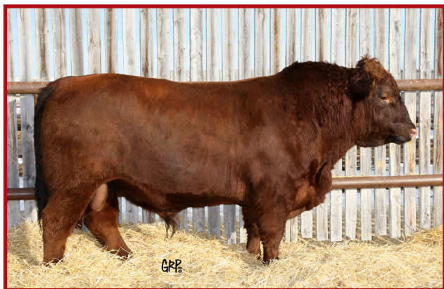
Red Ringstead Windup 5W (#1586059) BW: 78 lbs