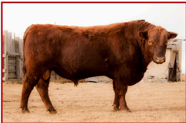
Red MEM Packer 203Y (#1619846) BW 80 lbs