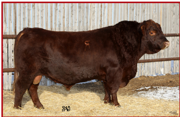
Red CR Riser 30T (1421299) BW: 75 lbs