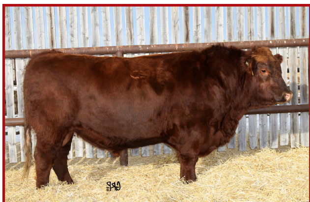
Red Flying K Nebula 179X (#1563680) BW 85 lbs