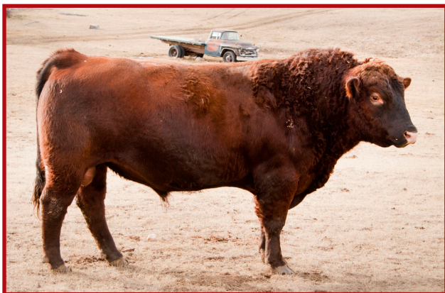
Red Rod Press 108Y (#1623794) BW 76 lbs