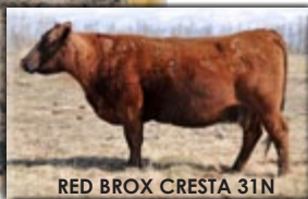
RED BROX CRESTA 31N

RED BLAZE V415 RED KENRAY MISS DAWN 114F RED YY 408D TOP GUN 614F RED YY BELLE 742G RED BRYLOR NEW TREND 22D RED BASIN ROSE F521 RED GET-A-LONG LINE BACKER 109 RED BROX CRESTA 2B