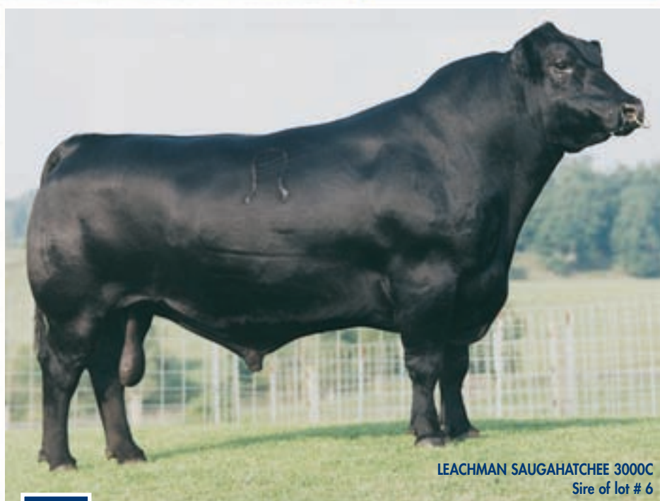
LEACHMAN SAUGAHATCHEE 3000C Sire of lot # 6