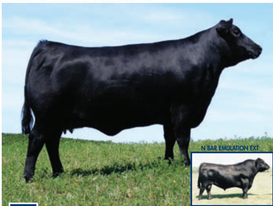
N BAR EMULATION EXT