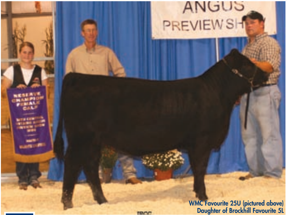
WMC Favourite 25U (pictured above) Daughter of Brockhill Favourite 5L