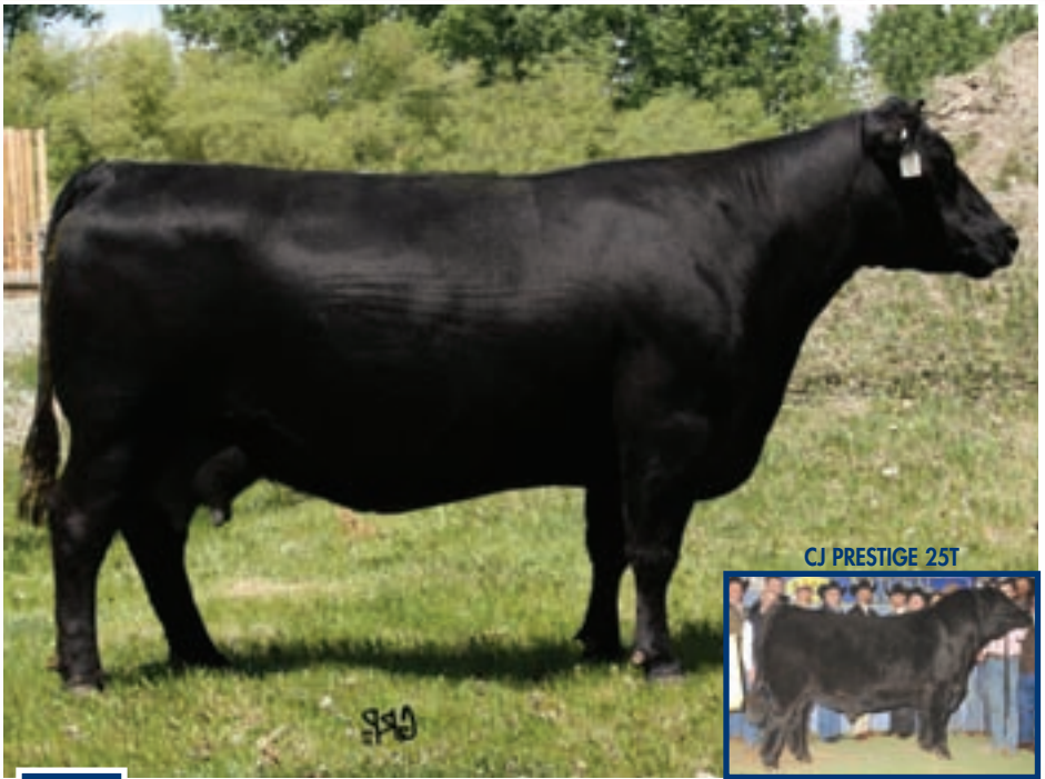
CJ PRESTIGE 25T