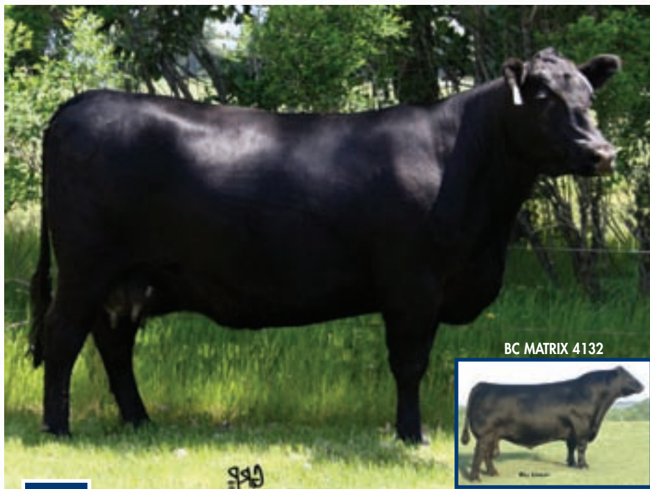
BC MATRIX 4132