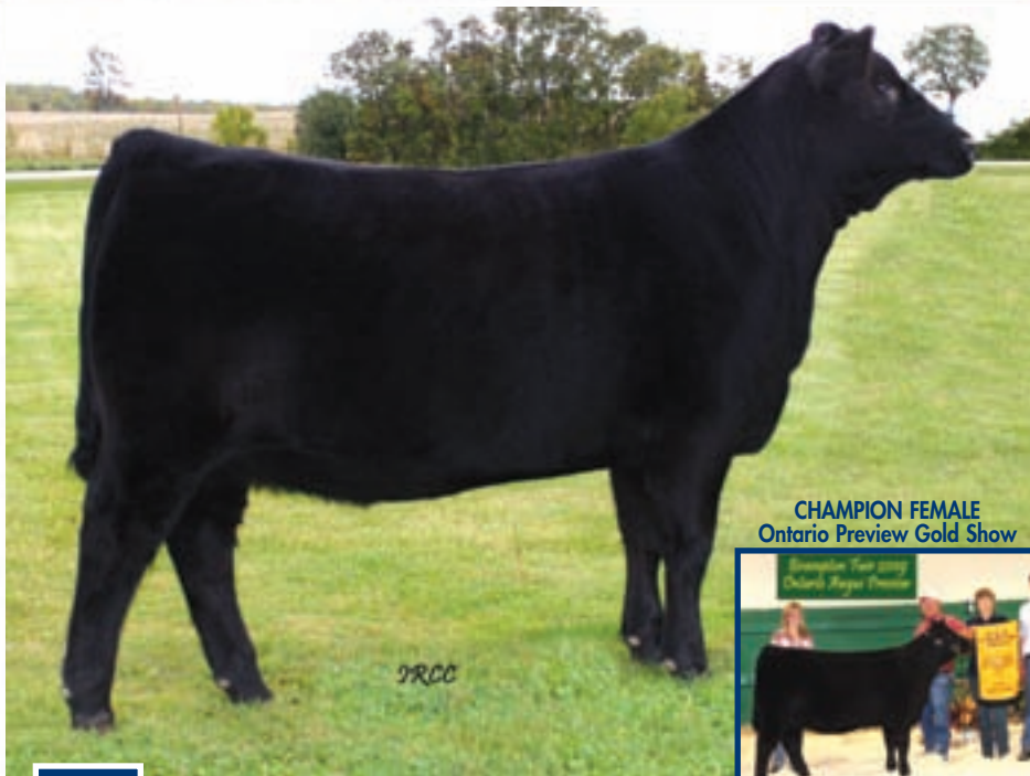
CHAMPION FEMALE Ontario Preview Gold Show