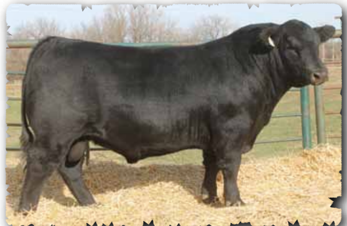
PEAK DOT PRIME 474D - LOT 86

>Recommended for heifers >A stylish very correct individual rich in maternal value >Dam has produced good ones in the past including Peak Dot Predominant 1052A to Battle Creek Angus