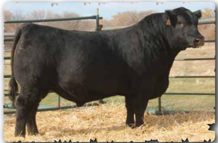
PEAK DOT TOPSOIL 2079D - LOT 22

>Recommended for heifers or cows >A genetic powerhouse with muscle and style and a soft look. >Yearling ratio of 105.