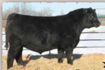
PEAK DOT LIBERTY 117C Purchased by Alta Genetics .