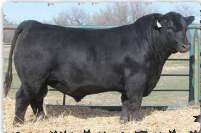
PEAK DOT RADIANCE 461D - LOT 52

>Recommended for heifers or cows >A standout Radiance loaded with shape and raw thickness. Yearling ratio of 126. >Grandam and great grandam served as embryo donors.