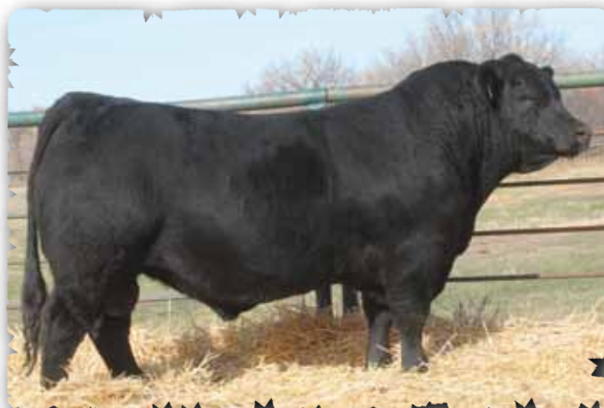
PEAK DOT WIND CHILL 411D - LOT 19

>Recommended for heifers >Smooth made bull with extra muscle expression and a low 68 lbs birth weight. Yearling ratio of 105. >A maternal brother sold to Don Junkin.