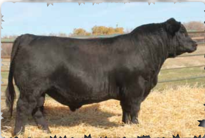
PEAK DOT CASH FLOW 459D - LOT 32

>Recommended for heifers or cows >A bull with added length, thickness and superior structure >Dam is a broody Stevenson Bruno 6371 daughter.