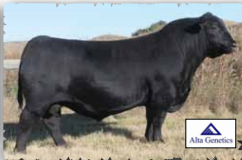
PEAK DOT COUNTRY 604B Contact Alta Genetics for semen