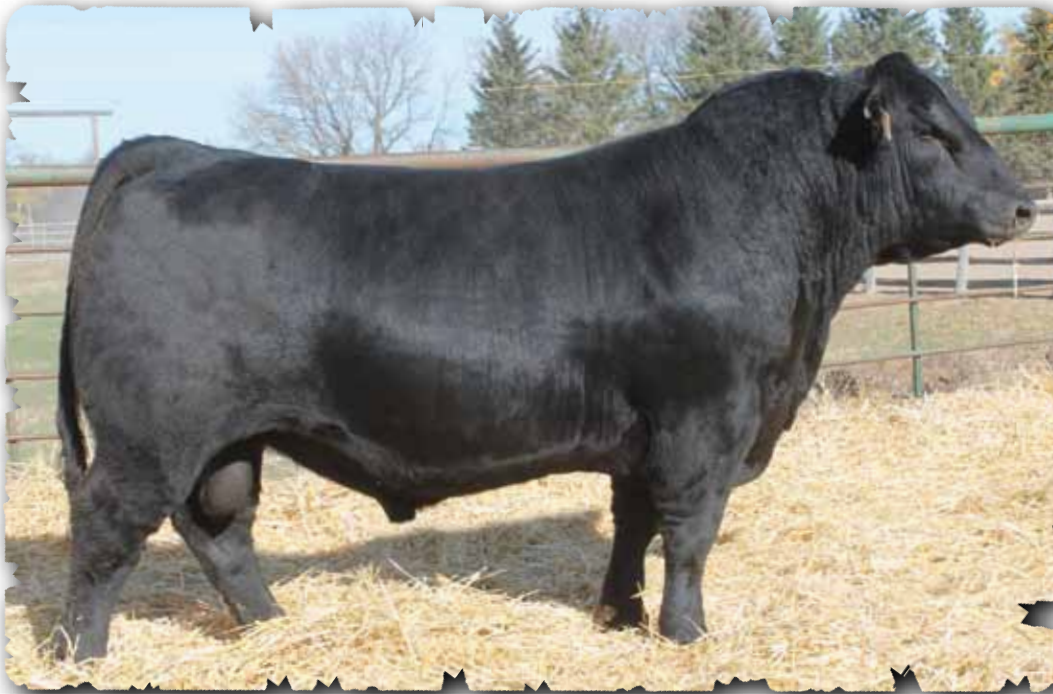
PEAK DOT CASH FLOW 2040D - LOT 28

Cash Flow was the lead bull from the 2014 NWSS Reserve Champion pen. He went on to become the high selling Barstow Cash son in the spring of 2014. We purchased this bull along with Semex for his extended length of body, wide pin setting and exceptional overall thickness. His ET dam is backed by a Pathfinder grandam. His first progeny are thick made cattle with muscle expression and volume throughout.