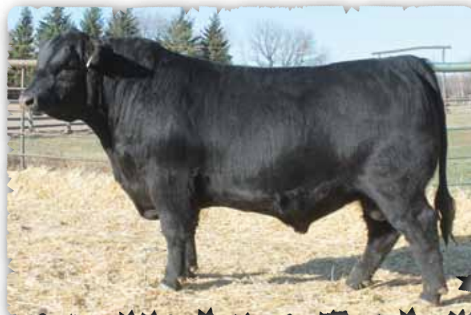
PEAK DOT UNANIMOUS 357D - LOT 74

>Maternal brothers sold to Lost River Ranching and James Heffner.