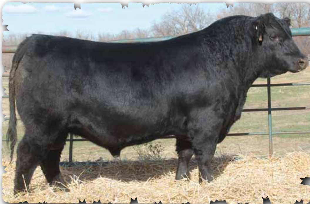
PEAK DOT PIONEER 2229D - LOT 110