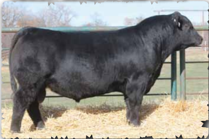
PEAK DOT UNANIMOUS 2244D - LOT 77