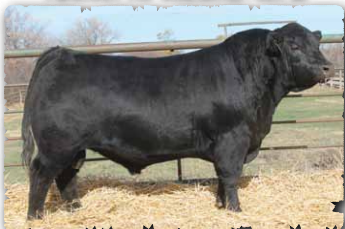
PEAK DOT TOP SOIL 234D - LOT 27