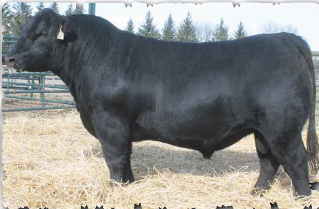
PEAK DOT ELEMENT 2321D - LOT 46