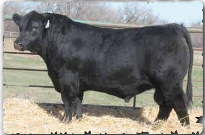
PEAK DOT ELIMINATOR 614D - LOT 136

>Recommended for cows or heifers >An Eliminator with plenty of length and thickness. Weaning ratio of 103. Yearling ratio of 102. >Dam is moderate, deep ribbed with a sharp front end and excellent udder.