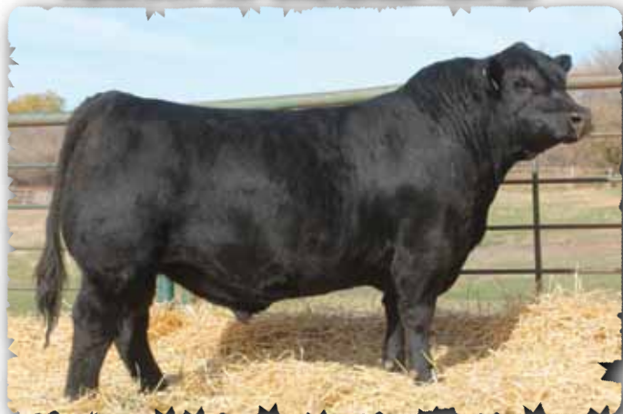
PEAK DOT TOP SOIL 453D - LOT 25