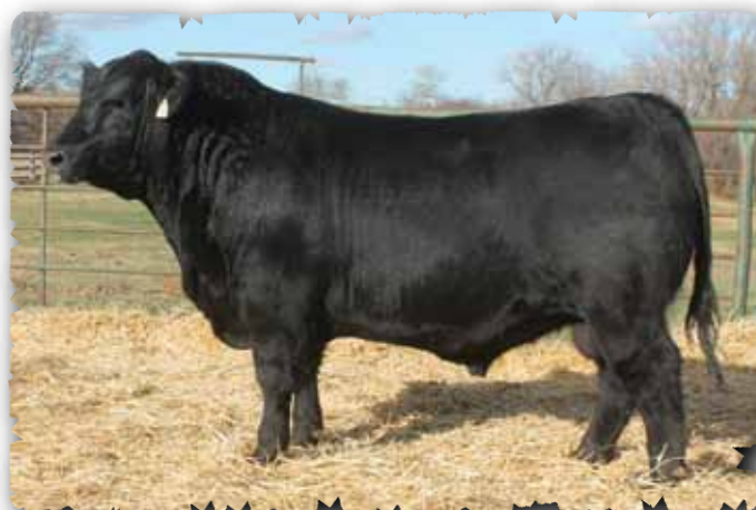
PEAK DOT ELIMINATOR 2204D - LOT 123

>Recommended for heifers or cows >Plenty of body capacity and thickness in this tank. Weaning ratio of 102. Yearling ratio of 101. >Dam is a no miss producer.