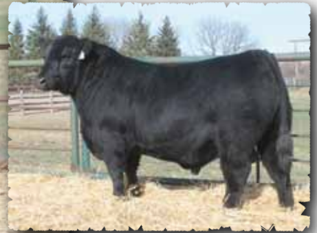
PEAK DOT GAME CHANGER 2100D - LOT 34