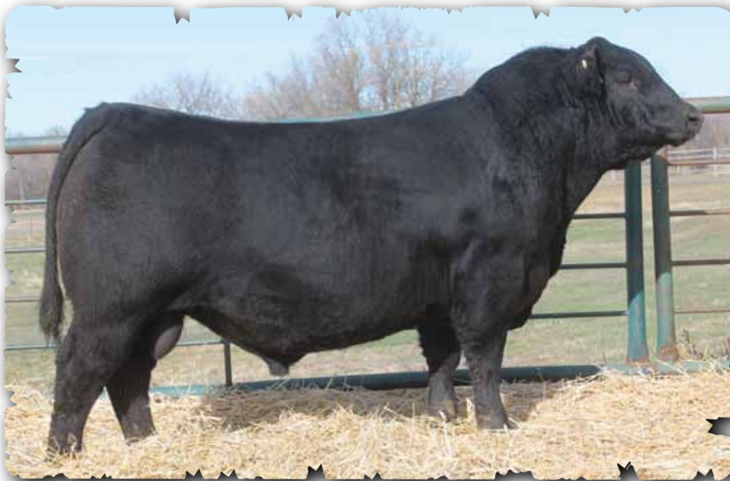
PEAK DOT RADIANCE 404D - LOT 50

SAV Radiance 0801 was the high selling SAV Brilliance 8077 son from the record breaking 2012 SAV Sale to Peak Dot Ranch. SAV Radiance has excelled at nearly every measure. He combines a herd improving EPD profile and impeccable pedigree with powerful phenotype - massive and deep with tons of muscle. His perfect uddered dam by Net Worth is a daughter of the # 1 milk EPD and high-income-producing cow in SAV history. Radiance has proven himself as a calving-ease sire and his sons come highly recommend for heifers.