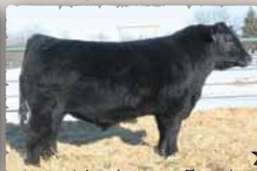
PEAK DOT JUMP START 142C Purchased by Semex .