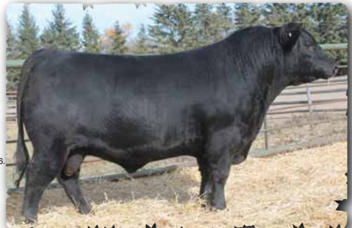
PEAK DOT GAME CHANGER 2120D - LOT 35

>Recommended for heifers. >Negative birth weight calving ease bull. An attractive bull with a strong hip. >Eliminator dam stems back to some outcross Canadian breeding.