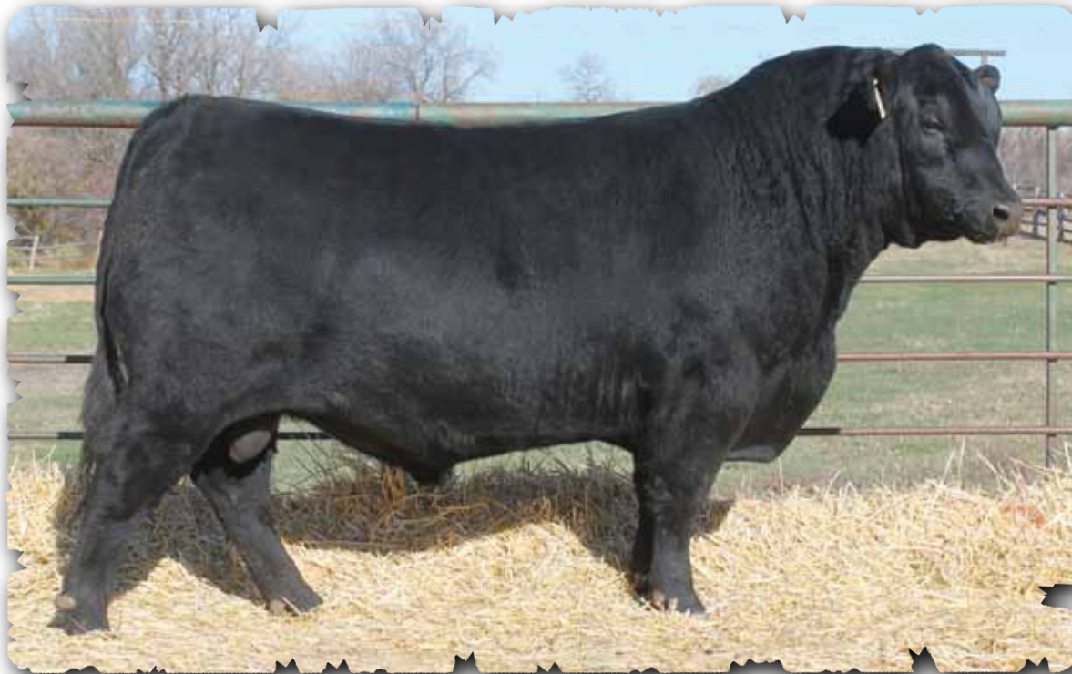
PEAK DOT UNANIMOUS 57D - LOT 60