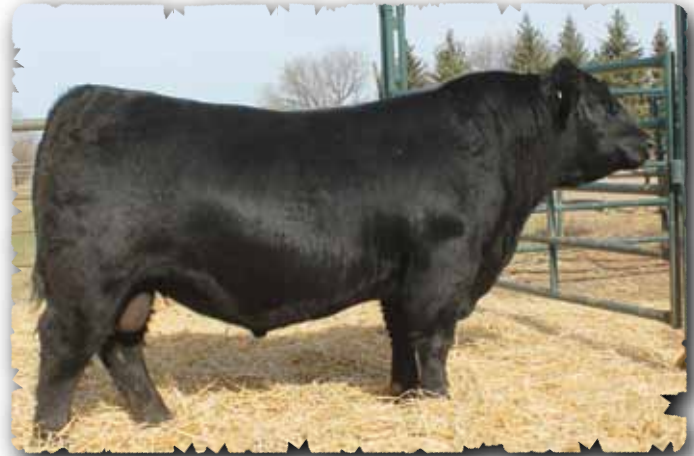
PEAK DOT UNANIMOUS 2237D - LOT 81

>Recommended for heifers or cows >Balanced numbers everywhere you look. Yearling index of 101. >Dam sons have sold to JLB Ranch, and Malcom Sterling.