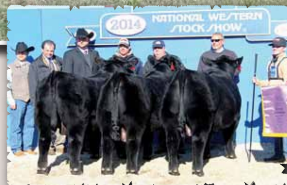
2014 National Western Stock Show Champion Pen Easy Decision was the lead bull in the 2014 Champion Pen of bulls

Easy Decision a big time performance bull that is rapidly becoming one of the most popular new bulls in the Angus breed. His first two calf crops have exceeded all expectations and have proven him as a low birth weight sire that consistently breeds added pounds at weaning and structural soundness. Easy Decision is backed by four consecutive generations of Pathfinder dams. Easy Decision was the lead bull of the 2014 National Western Stock Show Champion pen of 3 bulls. Easy Decision first calf crop was the feature attraction of the 2016 Peak Dot bull sale with the top 5 sons averaging $35,500.