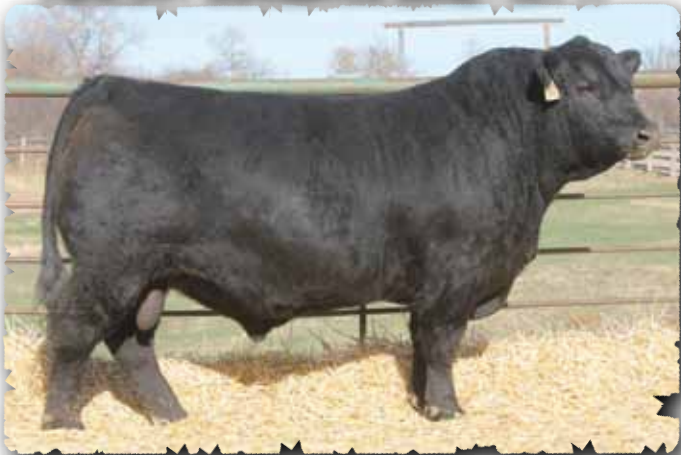
PEAK DOT UNANIMOUS 2186D - LOT 78