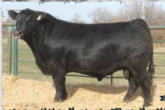
PEAK DOT UNANIMOUS 345D - LOT 91