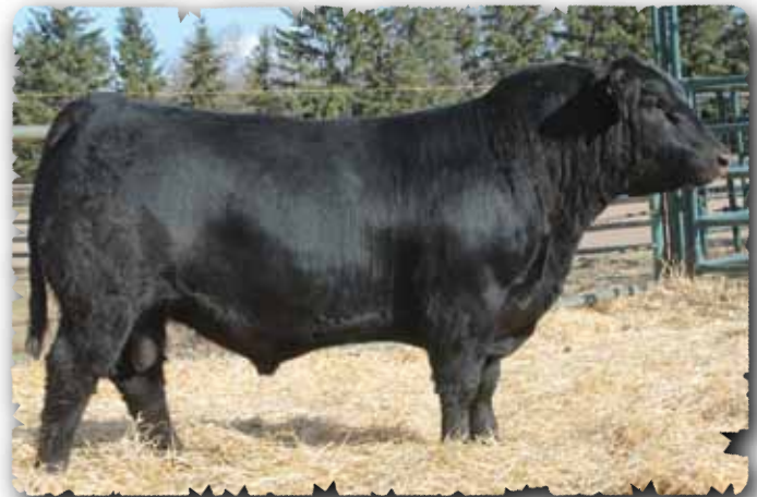
PEAK DOT PIONEER 2149D - LOT 115

>Recommended for heifers or cows >Performance bull. Long hipped deep and full of meat. Yearling ratio of 113. >Grandam is a embryo donor.