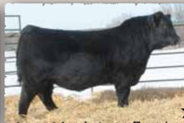
PEAK DOT OUTCOME 5D Purchased by Alta Genetics .