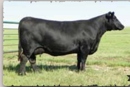
LADY OF PEAK DOT 416U The dam of Peak Dot Unanimous 402B

VISIONTOPLINE ROYAL STOCKMAN BW +3.7 VISION UNANIMOUS 1418 WW +55 VISION EDELLA 665 YW +99 PEAK DOT UNANIMOUS 402B MILK +20 SAV 004 PREDOMINANT 4438 LADY OF PEAK DOT 416U LADY OF PEAK DOT 634K