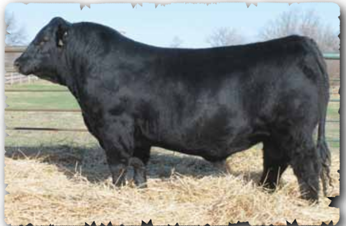
PEAK DOT ELIMINATOR 2224D - LOT 121