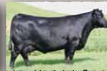
SAV ELBA 1094 The maternal grandam of Radiance