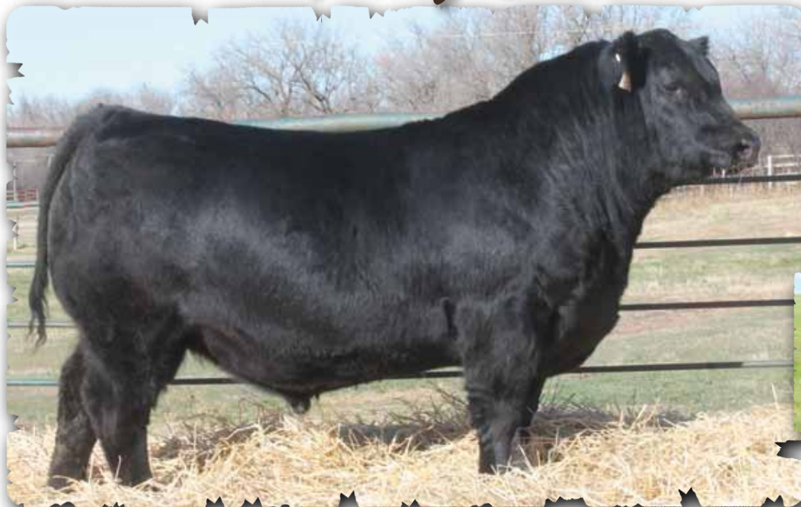
PEAK DOT PROOF 2341D - LOT 106