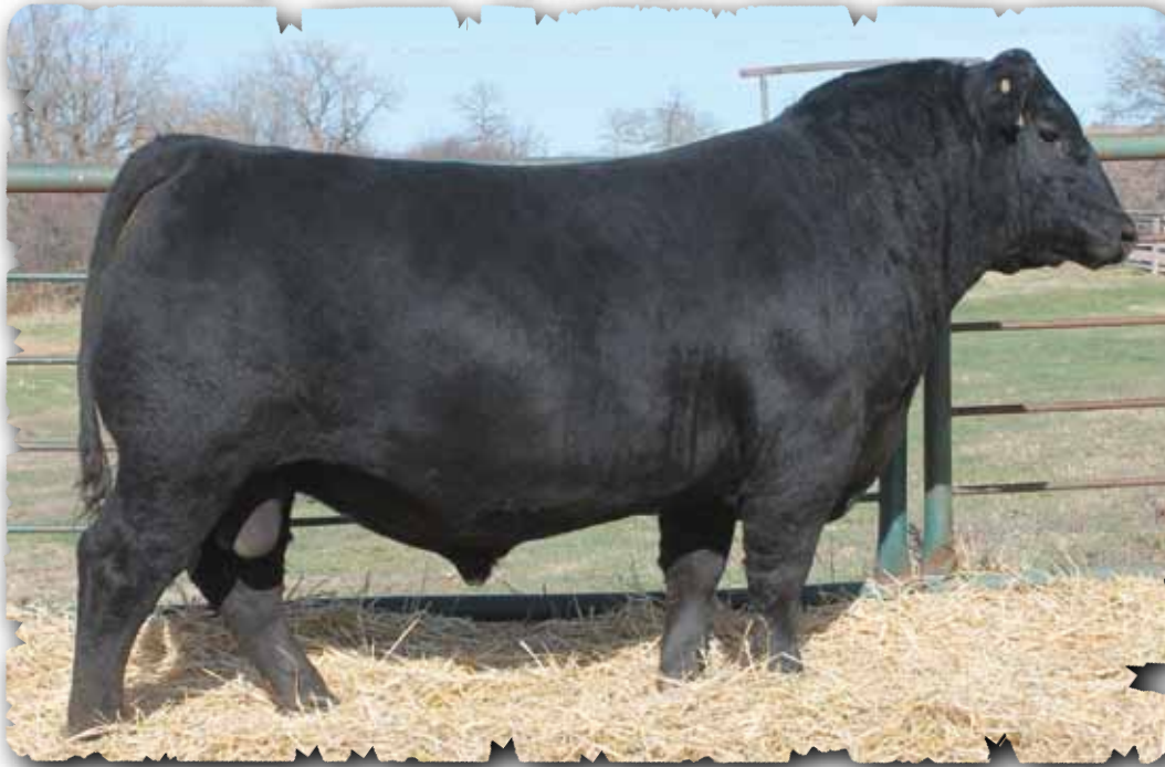
PEAK DOT RADIANCE 397D - LOT 51