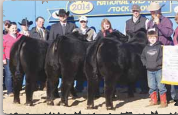
2014 National Western Stock Show Reserve Champion Pen Cash Flow pictured on the right was the lead bull in the 2014 National Western Stock Show Reserve Champion Pen of bulls

Cash Flow was the lead bull from the 2014 NWSS Reserve Champion pen. He went on to become the high selling Barstow Cash son in the spring of 2014. We purchased this bull along with Semex for his extended length of body, wide pin setting and exceptional overall thickness. His ET dam is backed by a Pathfinder grandam. His first progeny are thick made cattle with muscle expression and volume throughout.