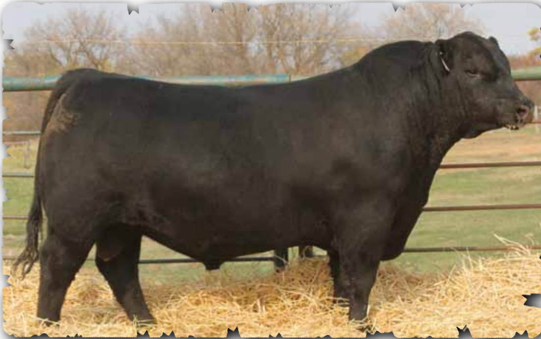
PEAK DOT NO DOUBT 173D - LOT 6