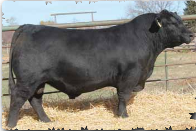
PEAK DOT EASY DECISION 419D - LOT 14