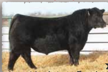
PEAK DOT EASY DECISION 34D Purchased by Northway Cattle co..