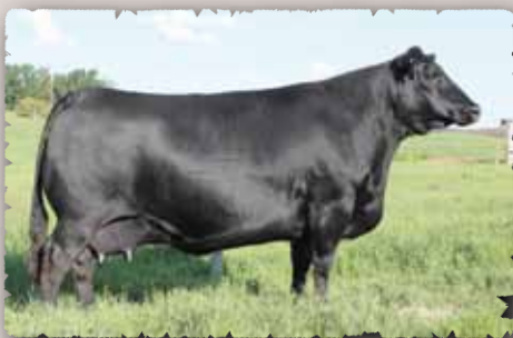
HEROINE OF PEAK DOT 434U The maternal grandam of Universal

Peak Dot Universal was the top selling $54,000 bull from the 2014 Spring Bull Sale. He is owned by Hillcrest Enterprises, Semex Beef and Peak Dot. Universal is a sire whose popularity continues to grow. He is one of the most consistent bulls we have ever used for breeding deep bodied cattle that always stay in good flesh. His sons are deep middled thick made calving ease bulls that should sire highly productive females.