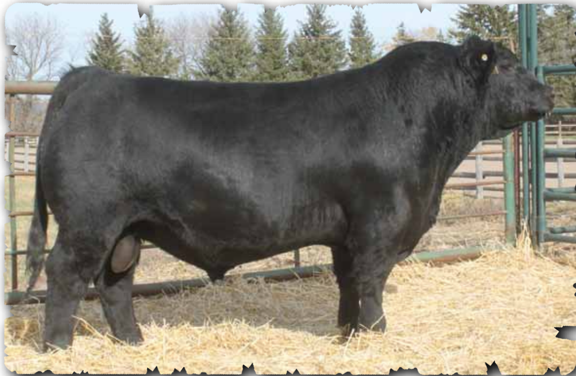
PEAK DOT UNANIMOUS 389D - LOT 57

57 PEAK DOT UNANIMOUS 389D Male PDAR 389D 1944903 March 06 2016 VISIONTOPLINE ROYAL STOCKMAN GAMBLES ROYAL FLUSH VISION UNANIMOUS 1418 LAGRAN PRIDE 7140 VISION EDELLA 665 BOYD ON TARGET 1083 PEAK DOT BOLD 204U MOHNEN DYNAMITE 1356 BAMBI OF PEAK DOT 255Y QUEEN OF PEAK DOT 652S BAMBI OF PEAK DOT 498U S A V 004 PREDOMINANT 4438 BAMB I OF PEAK DOT 366J BW: 83lbs. Adj 205 day Wt: 705 lbs. Adj 365 day Wt: 1445 lbs. BW:+4.1 WW: +56 YW: +109 Milk: +15