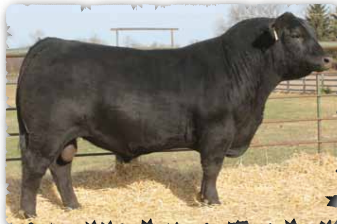
PEAK DOT UNANIMOUS 408D - LOT 65

>Recommended for heifers or cows >A bull with size, length and muscle. Yearling ratio of 113. >Dam has stood the test of time and has a long production record.