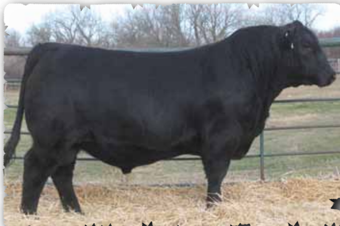
PEAK DOT PIONEER 2127D - LOT 111