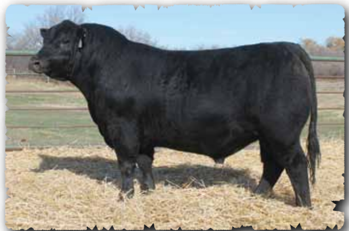
PEAK DOT ELEMENT 2046D - LOT 43

>Recommended for heifers >A sure bet calving ease bull with added performance.