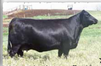
Lady of Peak Dot 818S The dam of lot 54