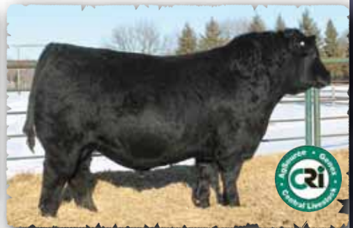
PEAK DOT FOOTHILLS 1012B Contact Genex for semen