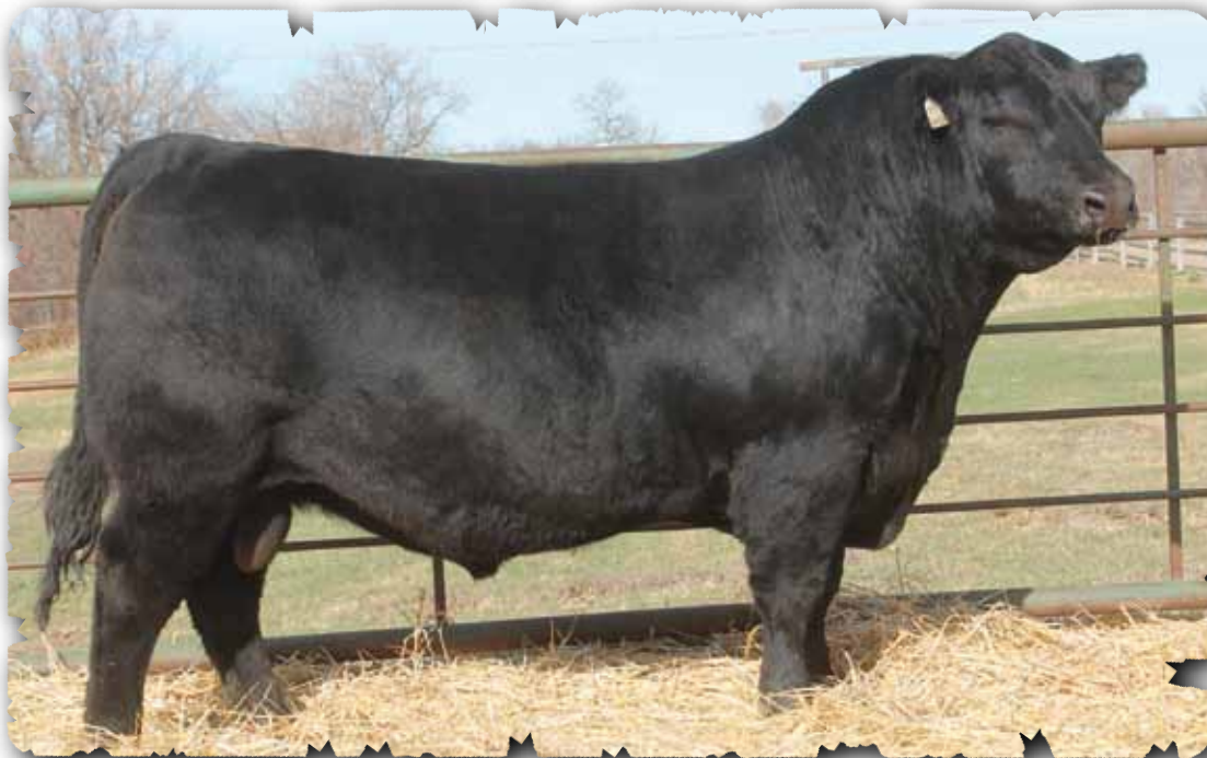
PEAK DOT GAME CHANGER 2034D - LOT 33

Gaffney Game Changer, the all-time record-selling bull in Gaffney Family Cattle history at $295,000 to Herbster Angus. His dam is the all-time record selling $175,000 female at the National Western Stock Show foundation Female Sale also going to Herbster Angus. She is a full sister to RB Acitive Duty and a maternal sister to the popular RB Tour of Duty. The first calves are on the ground now and they come light and grow as fast as some of the true poundmaker calf groups. Game Changer will be a "go to" calving ease sire in the Angus breed.