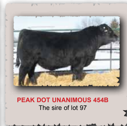
PEAK DOT UNANIMOUS 454B The sire of lot 97