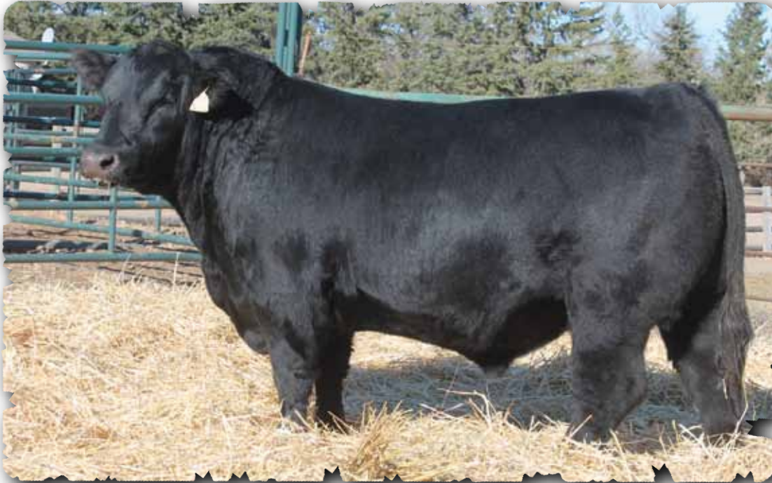
PEAK DOT ELIMINATOR 2235D - LOT 128