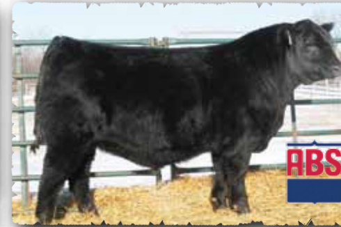
PEAK DOT UNANIMOUS 603A Contact Origen or ABS for semen