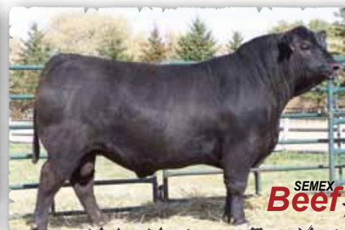
PEAK DOT IRON MOUNTAIN 654X Contact Semex for semen