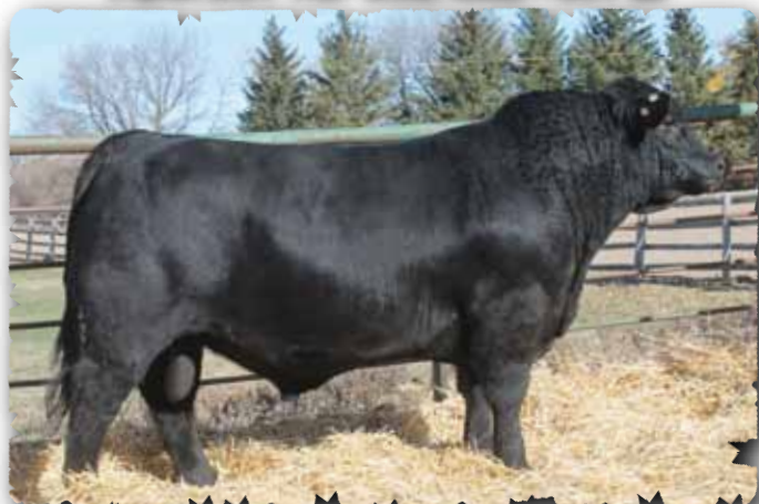
PEAK DOT TOP SOIL 2070D - LOT 26