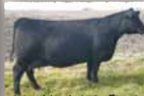
SAV ELBA 801 The dam of Radiance