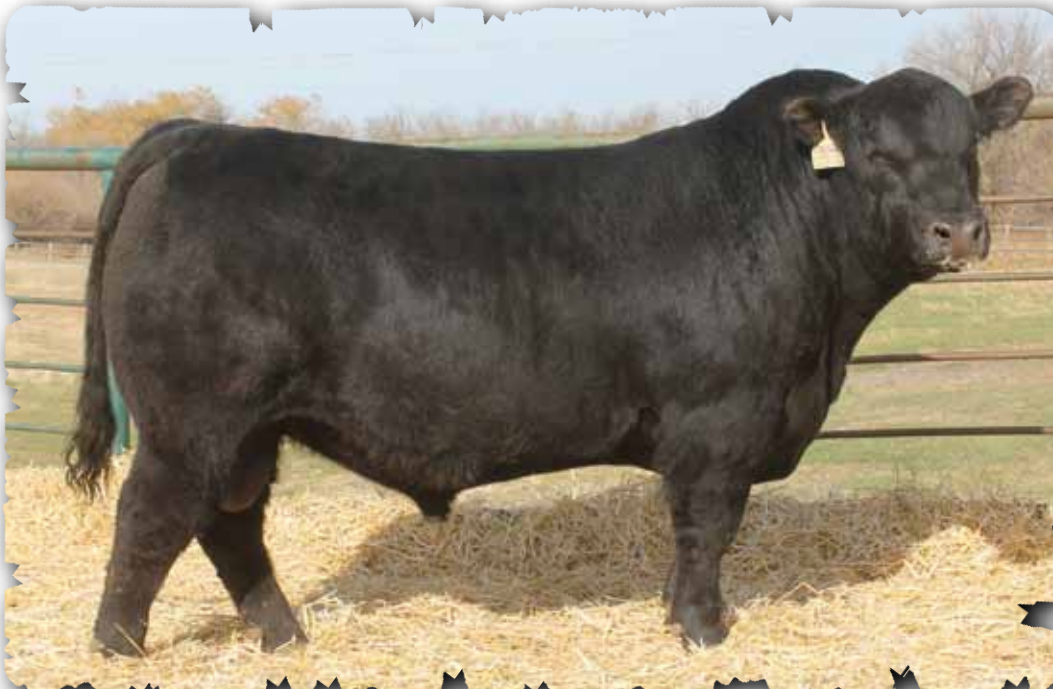
PEAK DOT UNANIMOUS 2220D - LOT 97

>Recommended for heifers or cows >A long bodied bull with a great hair coat and a ton of performance. Weaning ratio of 121. >Beautiful young Eliminator dam ranks in the top 1% for yearling EPD.