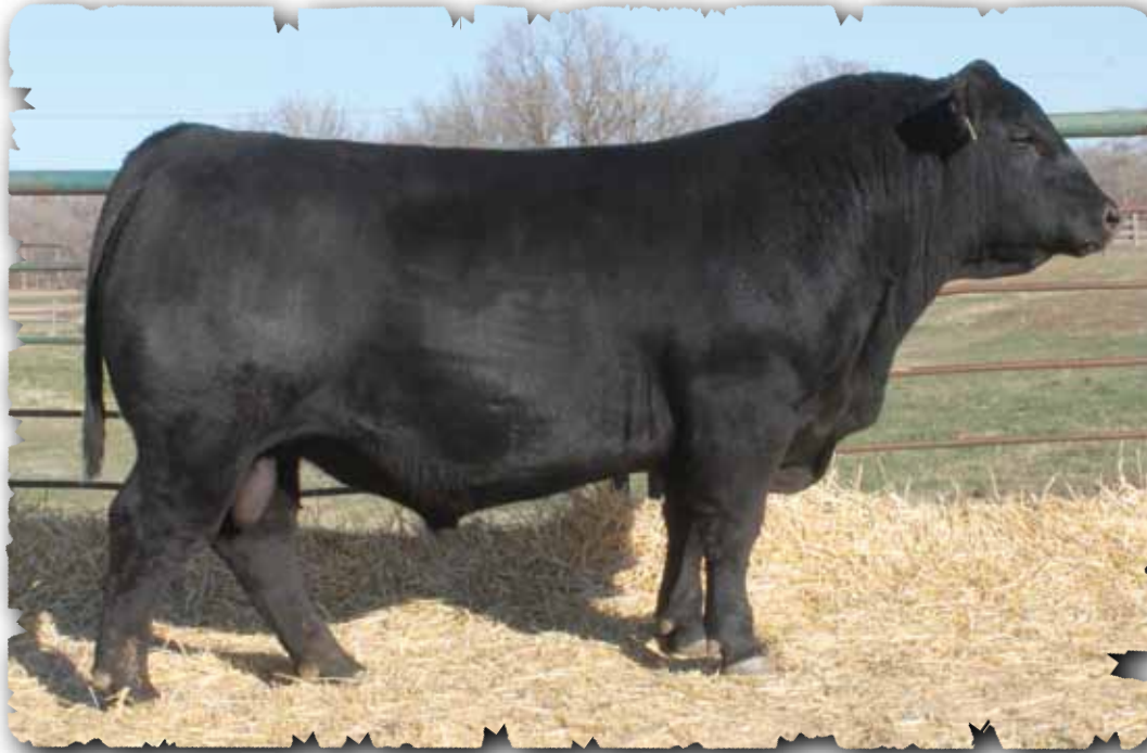
PEAK DOT COUNTRY 473D - LOT 88