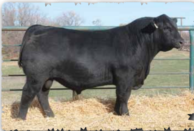
PEAK DOT EASY DECISION 420D - LOT 13