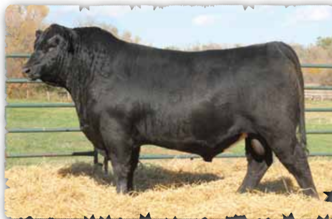
PEAK DOT EASY DECISION 162D - LOT 9

>Recommended for heifers or cows >A calving-ease sensation with eye-catching style. Ranks in the top 2% for weaning and yearling EPD. >Nice fronted beautiful dam by Pioneer 9X.