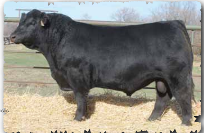
PEAK DOT ELIMINATOR 2147D - LOT 120

>Productive Predominant dam has a production record that reads like a book.