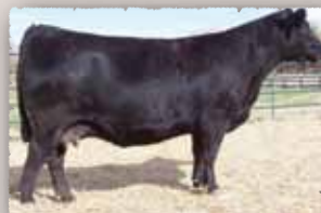
Barbara of Peak Dot 314T The dam of Peak Dot Proof 1066X

SAV FINAL ANSWER 0035 BW +3.3 SAV PIONEER 7301 WW +44 SAV BLACKBIRD 5297 YW +79 PEAK DOT PROOF 1009X MILK +14 HF POWER UP 72N BARBARA OF PEAK DOT 314T BARBARA OF PEAK DOT 519K