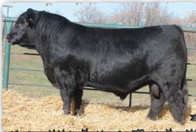
PEAK DOT UNIVERSAL 2173D - LOT 68

>Recommended for heifers >A bull with bred in calving ease. One of the larger framed Universal sons in the pen. >Dam has a history of raising good bulls.