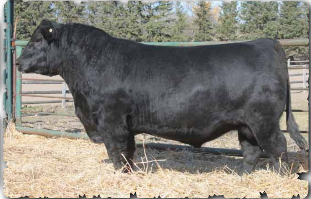
PEAK DOT ELEMENT 246D - LOT 39