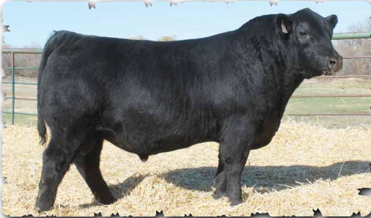
PEAK DOT UNANIMOUS 2256D - LOT 80