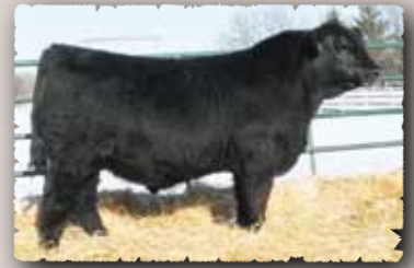
PEAK DOT UNANIMOUS 339B The sire of lots 99, 100 and 101