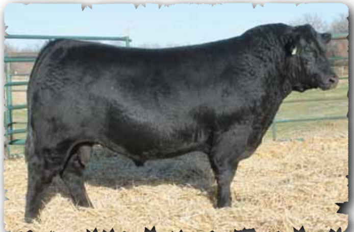
PEAK DOT PROOF 2329D - LOT 105

>Recommended for heifers or cows >A bull with length, thickness and superior structure. Weaning ratio of 108. >Dam is a embryo donor with 17 progeny.