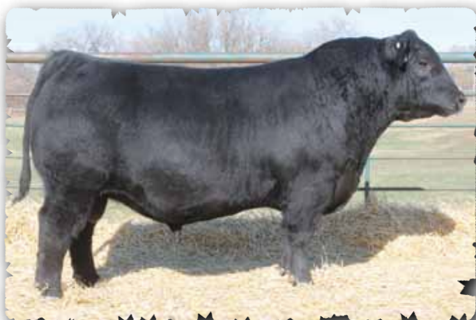
PEAK DOT UNANIMOUS 336D - LOT 62