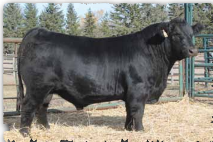
PEAK DOT RADIANCE 498D - LOT 56

>This good bull sells with out registration papers