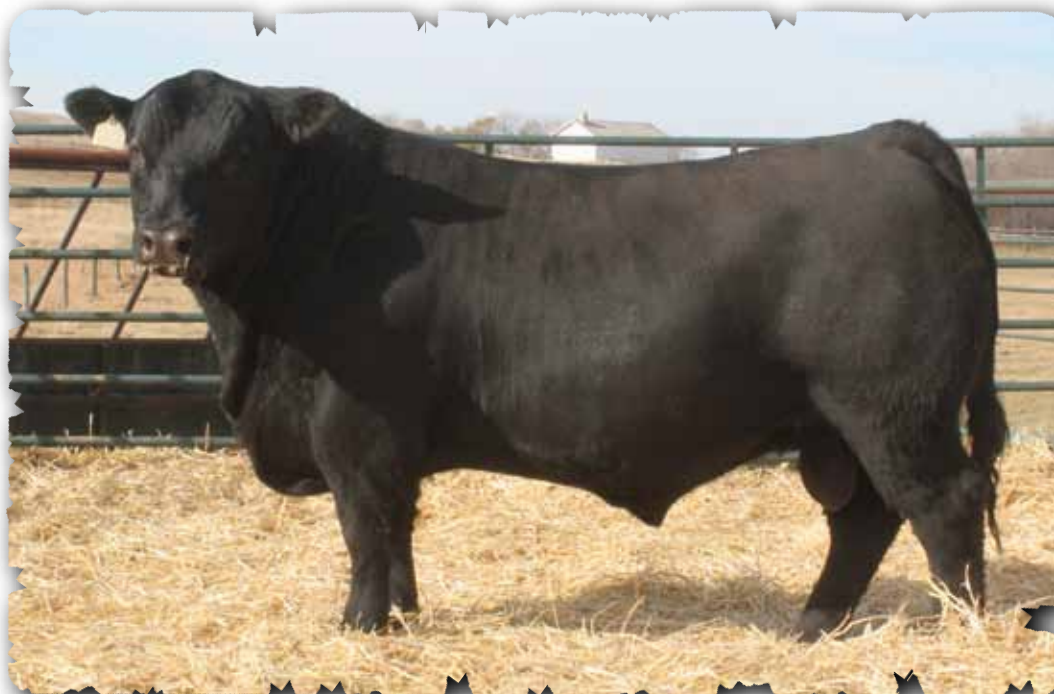
PEAK DOT UNANIMOUS 2128D - LOT 72

Peak Dot Unanimous 409B is another addition to our line up of Unanimous sons. His stoutness and overall power was unmatched in the 2015 bull season and he's passed all that down on to his first set of bulls. His sons are impressive. They are calving ease bulls with extra muscle, substance of bone, adequate performance. Owned by Hillcrest Enterprises.