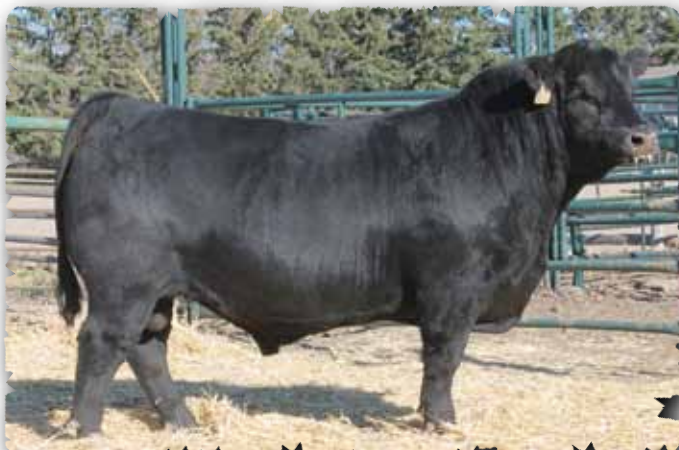
PEAK DOT ELIMINATOR 2232D - LOT 126