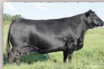
HEROINE OF PEAK DOT 434U

VISIONTOPLINE ROYAL STOCKMAN BW +1.0 VISION UNANIMOUS 1418 VISION EDELLA 665 WW +49 PEAK DOT UNANIMOUS 409B YW +99 SAV 004IRON MOUNTAIN 8066 MILK +27 HEROINE OF PEAK DOT 434U HEROINE OF PEAK DOT 464S