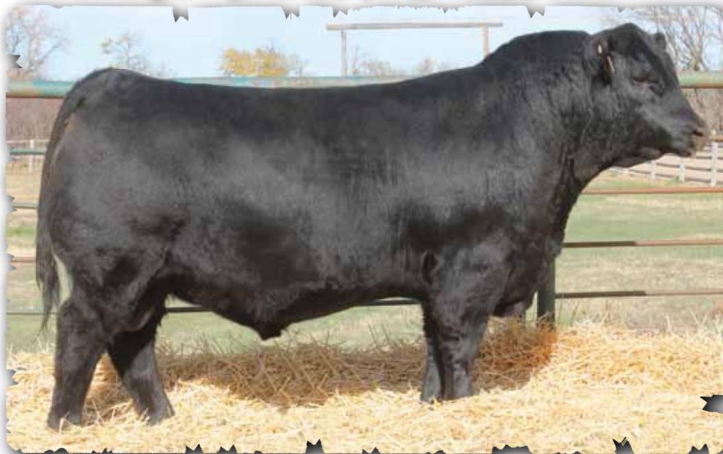
PEAK DOT NO DOUBT 240D - LOT 3