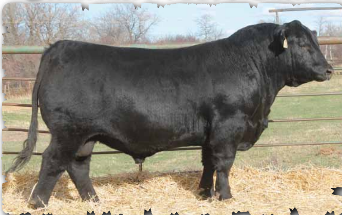
PEAK DOT ELIMINATOR 2172D - LOT 125