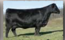
SAV ELBA 7099 The maternal great grandam of Radiance

SAV Radiance 0801 was the high selling SAV Brilliance 8077 son from the record breaking 2012 SAV Sale to Peak Dot Ranch. SAV Radiance has excelled at nearly every measure. He combines a herd improving EPD profile and impeccable pedigree with powerful phenotype - massive and deep with tons of muscle. His perfect uddered dam by Net Worth is a daughter of the # 1 milk EPD and high-income-producing cow in SAV history. Radiance has proven himself as a calving-ease sire and his sons come highly recommend for heifers.