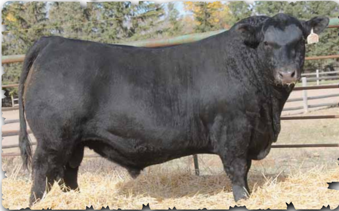
PEAK DOT TOPSOIL 2036D - LOT 21