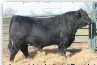
Peak Dot Universal 378C The maternal brother to lot 102 purchased by Tom Skelton from the 2016 Fall Bull Sale.

>Recommended for heifers or cows >A favorite, this young bull is naturally thick with a good top in him. Yearling ratio of 105 >Dam has raised progeny which have sold to Tom Skelton, RL7 Ranch and Hillcrest Enterprises.