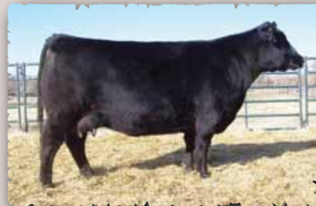
MIA OF PEAK DOT 406R The dam of Peak Dot Eliminator 825A