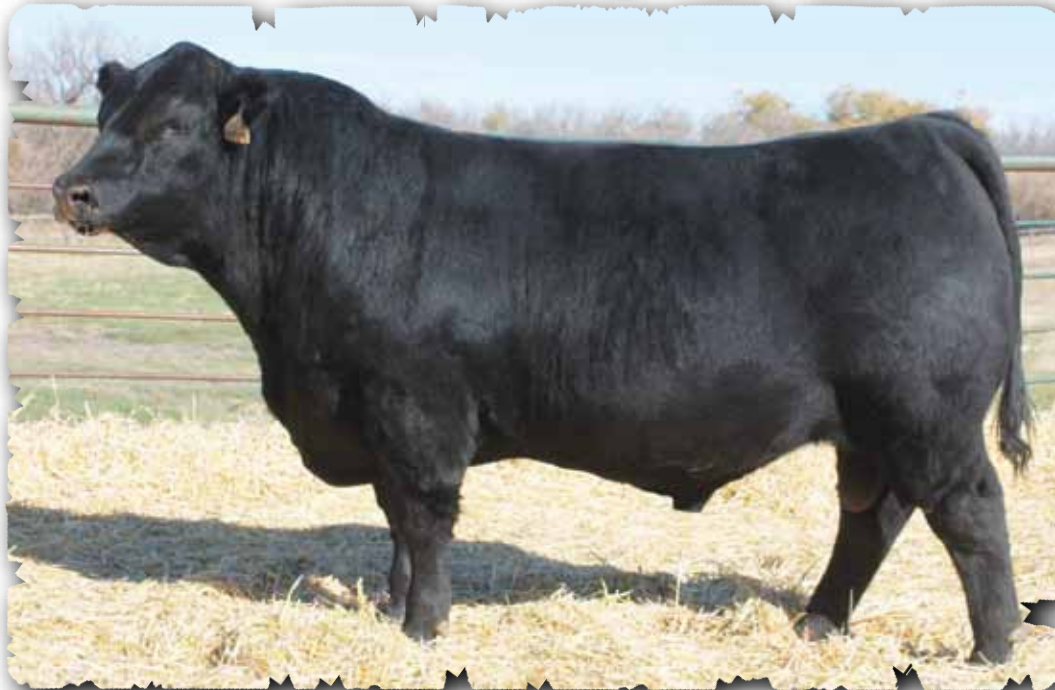
PEAK DOT UNANIMOUS 2125D - LOT 73