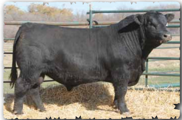
PEAK DOT UNANIMOUS 2157D - LOT 96

>Recommended for heifers or cows >A thick made and heavy set. >Grandam is a embryo donor. Maternal brother sold to Scott Mclean.