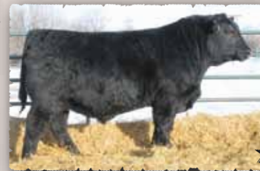
PEAK DOT PIONEER 1130A The sire of lots 116 and 117