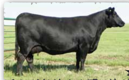
LADY OF PEAK DOT 416U

BW: 80lbs. Adj 205 day Wt: 787 lbs. Adj 365 day Wt: 1454 lbs. BW:+1.6 WW: +49 YW: +87 Milk: +28