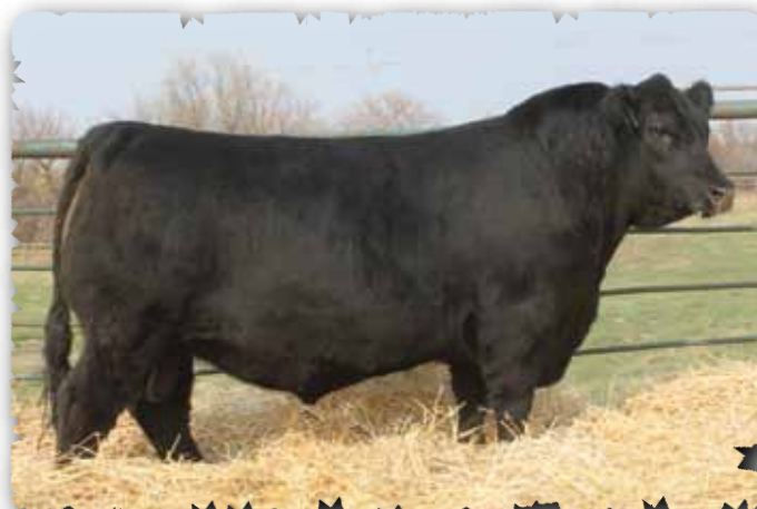
PEAK DOT NO DOUBT 296D - LOT 4

>His deep, broody Duff Encore dam comes with udder quality and abundant milk.