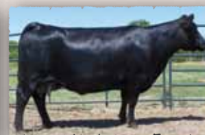
Barbara of Peak Dot 519K The grandam of Peak Dot Proof 1066X