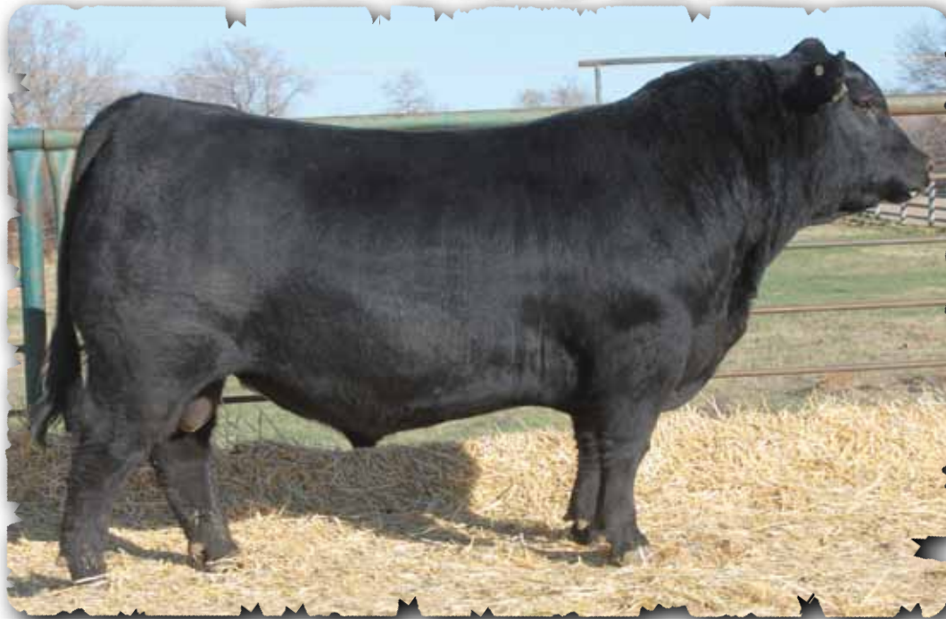
PEAK DOT UNANIMOUS 481D - LOT 63

63 PEAK DOT UNANIMOUS 481D Male PDAR 481D 1945420 April 02 2016 VISIONTOPLINE ROYAL STOCKMAN GAMBLES ROYAL FLUSH VISION UNANIMOUS 1418 LAGRAND PRIDE 7140 VISION EDELLA 665 BOYD ON TARGET 1083 VISION EDELLA 337 DUFF ENCORE 702 D H D TRAVELER 6807 QUEEN OF PEAK DOT 349X O C C DIXIE ERICA 814G QUEEN OF PEAK DOT 587K MERIT 6105 CEDAR CREEK QUEEN 29B BW: 86lbs. Adj 205 day Wt: 771 lbs. Adj 365 day Wt: 1349 lbs. BW:+4.4 WW: +55 YW: +94 Milk: +16