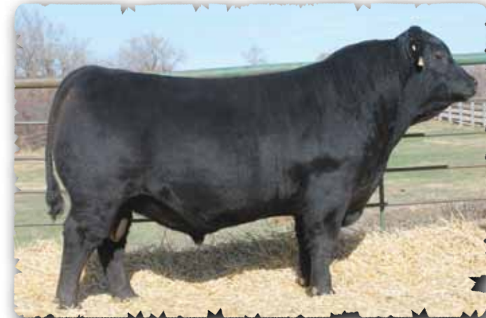
PEAK DOT UNANIMOUS 2236D - LOT 82

>Recommended for heifers or cows >A well muscled smooth shoulder bull. Compliments of Unanimous and Iron Mountain. >A maternal brother sold to Hillcrest Enterprises and a maternal sister sold to Klessens.