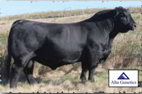
PEAK DOT PRIME 733B Contact Alta Genetics for semen