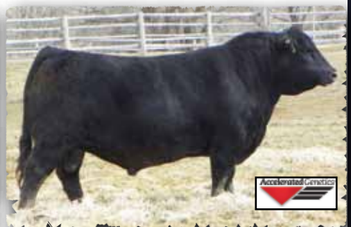
PEAK DOT ENCORE 502W Contact Accelerated Genetics for semen