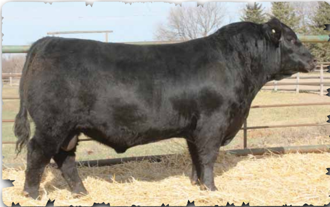
PEAK DOT UNANIMOUS 2238D - LOT 90