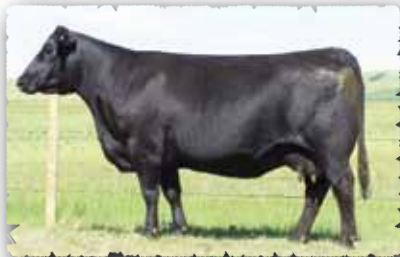
Pansy of Peak Dot 910U The dam of lot 47