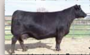
Duchess of Peak Dot 654N