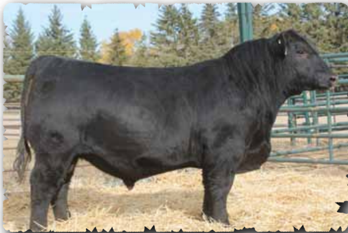
PEAK DOT EASY DECISION 116D - LOT 15