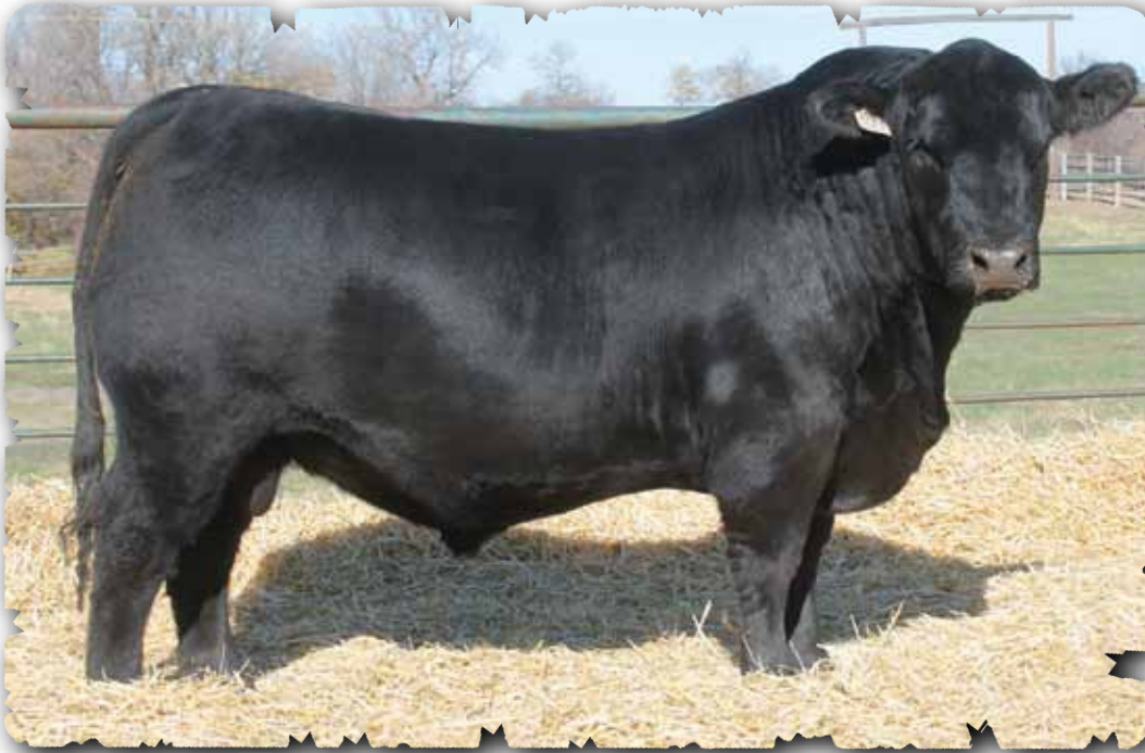
PEAK DOT UNANIMOUS 2130D - LOT 99