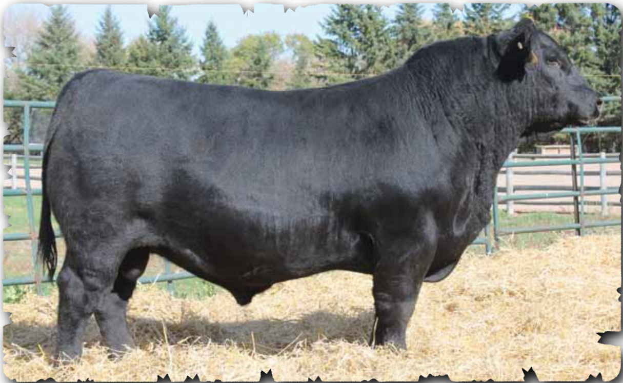
PEAK DOT PRIME 465D - LOT 83

Prime is a powerfully built with tremendous length, volume and body depth, muscle and pounds. He offers a bit more bone and stands on a very sturdy frame. He was selected by Alta genetics from the 2015 Spring bull sale and added to their sire roster. His gorgeous dam has been a very consistent embryo producer resulting in high caliber progeny no matter who she has been mated to. She is one of the most influential cows at Peak Dot and along with several of her daughters will lead the way as we continue to stack our cowherd with fertility, longevity and maternal value.