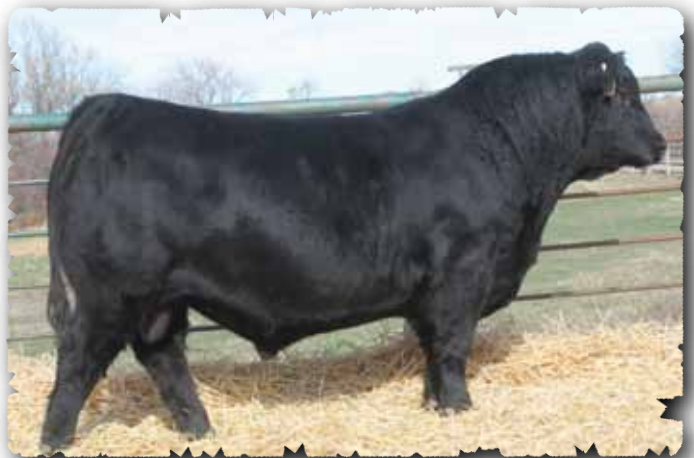
PEAK DOT TOPSOIL 2305D - LOT 23