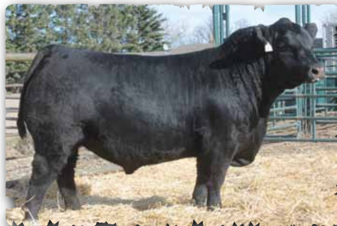
PEAK DOT RADIANCE 2343D - LOT 55

>Out of a square made SAV 004 Predominant 4438 daughter that is a embryo donor.