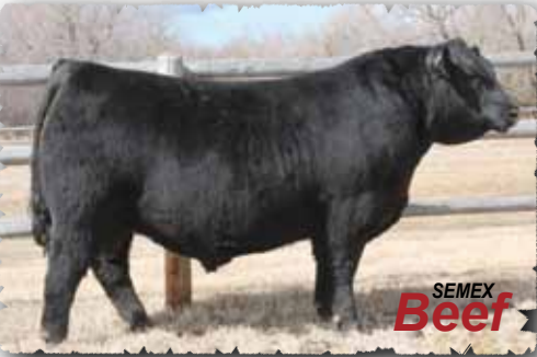
PEAK DOT UNIVERSAL 551A Contact Semex for semen