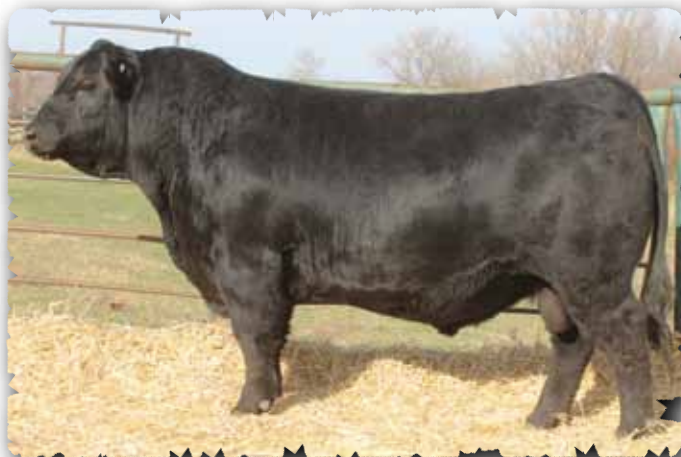
PEAK DOT UNIVERSAL 2150D - LOT 67