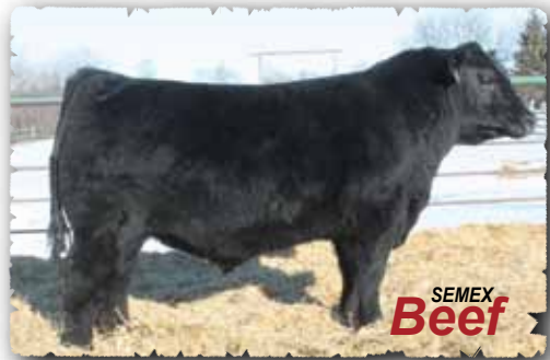
PEAK DOT JUMP START 142C Maternal brother to lot 30

>Recommended for heifers or cows >A correct well made bull with added length. >A maternal brother sold to Big Rose Colony.