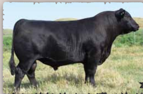
PEAK DOT RESOLUTE 37W Maternal brother to Peak Dot Eliminator 825A