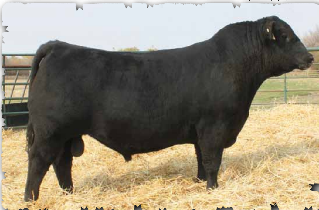
PEAK DOT PHANTOM 402D - LOT 16