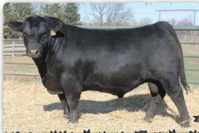
PEAK DOT UNANIMOUS 2182D - LOT 75