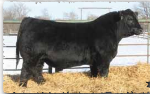
PEAK DOT CASH FLOW 36D

The $105,000 top selling Cash flow son from the 2017 spring bull sale to Northway Cattle Co. Lot 28 comes from the same cow family.