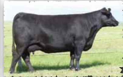
LADY OF PEAK DOT 402U The maternal grandam of lot 1