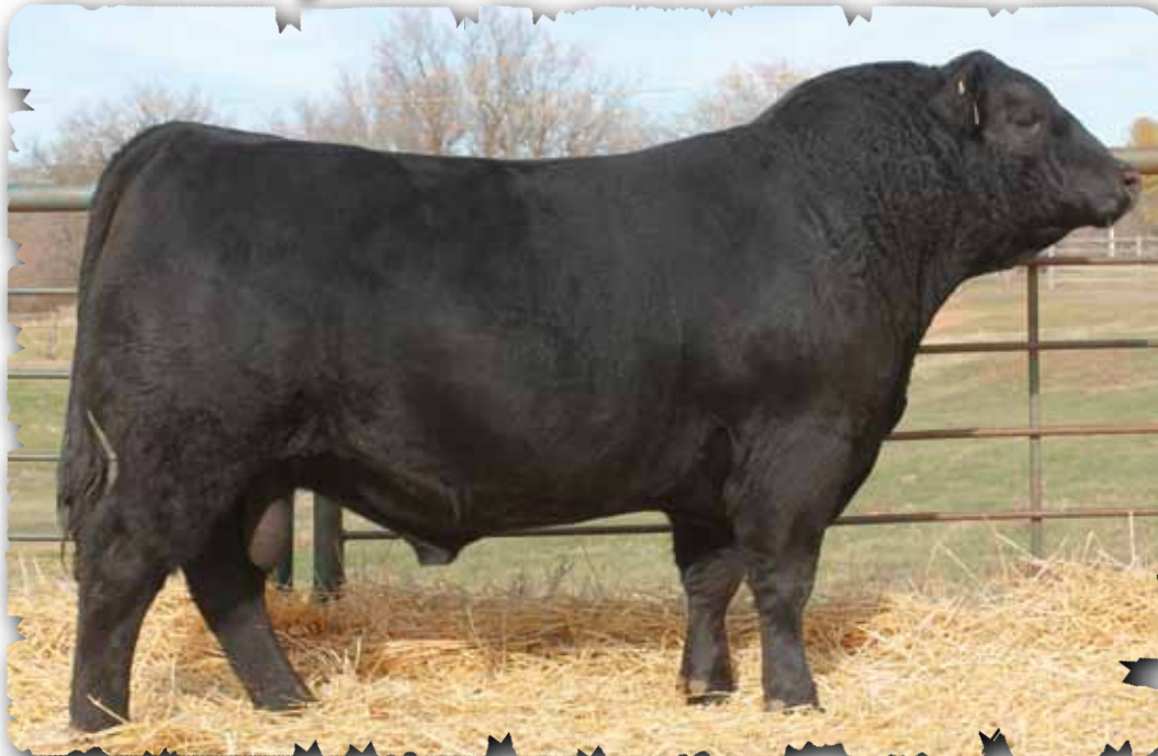
PEAK DOT EASY DECISION 160D - LOT 11