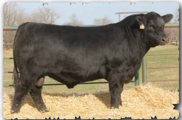
PEAK DOT UNANIMOUS 2346D - LOT 95

>Recommended for heifers >A nice fronted, smooth made, low birth bull by Unanimous 402B. >Grandam is a embryo donor.