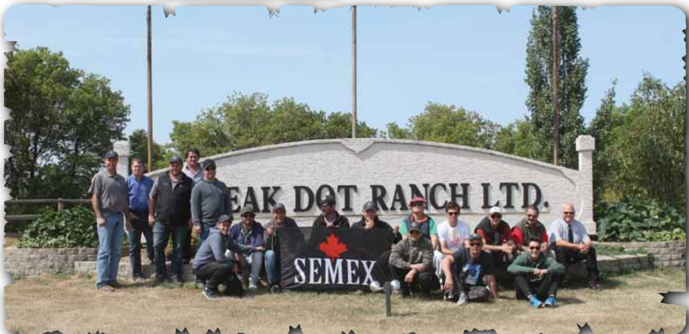
2017 Semex Argentina Tour

>Recommended for heifers or cows >A well built bull with some size and power. >Heifers first calf.