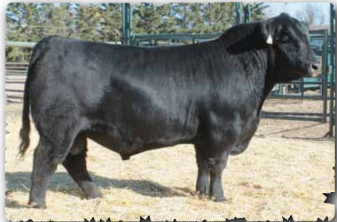
PEAK DOT UNANIMOUS 2183D - LOT 100

>Recommended for heifers or cows >Plenty of body capacity and thickness in this fleshy bull. Yearling ratio of 108. >Grandam is a embryo donor.