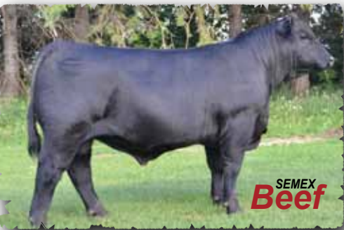
PEAK DOT OUTLOOK 271C Contact Semex for semen