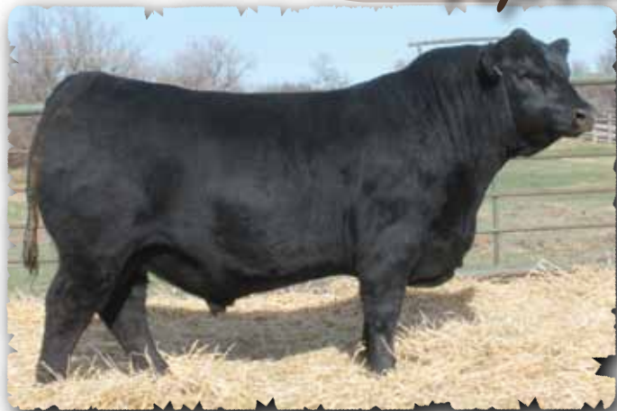
PEAK DOT TOP SOIL 2049D - LOT 24