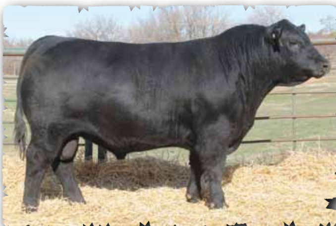
PEAK DOT EASY DECISION 432D - LOT 12