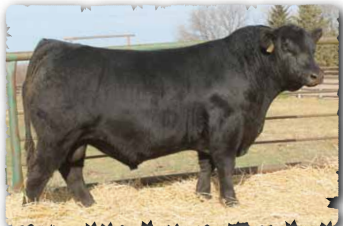
PEAK DOT GAME CHANGER 2085D - LOT 36