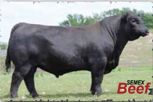
PEAK DOT GLADIATOR 800Y Contact Semex for semen