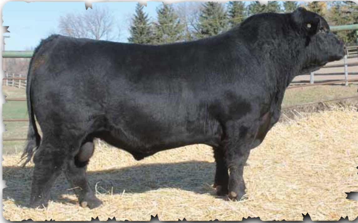
PEAK DOT PRIME 458D - LOT 84