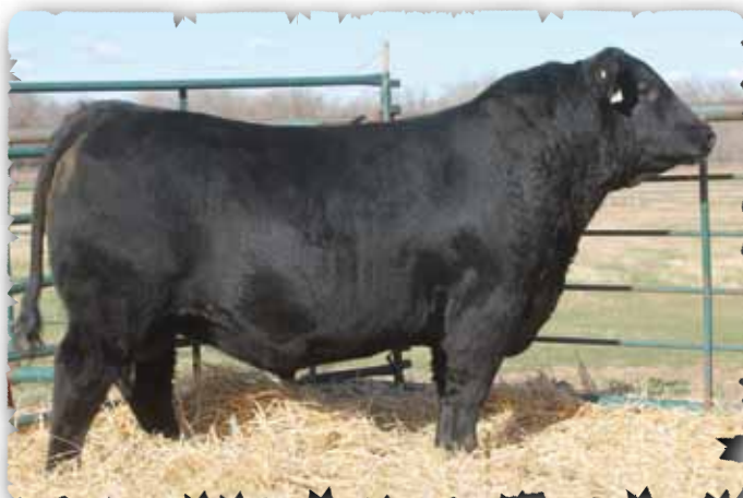
PEAK DOT PROOF 2331D - LOT 107

The maternal grandam of lots 106 and 107