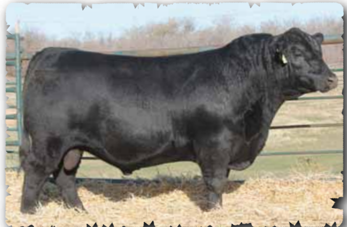
PEAK DOT PIONEER 2166D - LOT 114

>Recommended for heifers >Tremendous eye appeal from a great cow family. > Weaning ratio of 109.