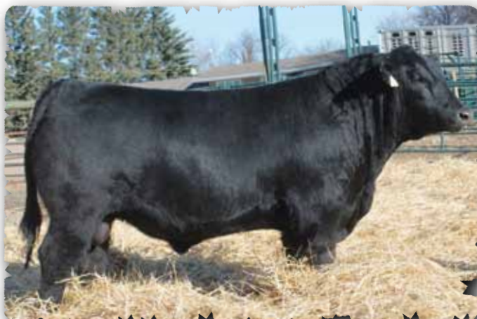
PEAK DOT ELIMINATOR 2233D - LOT 127