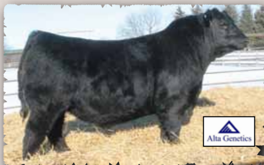
PEAK DOT FOR SURE 101D