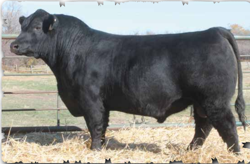
PEAK DOT ELEMENT 2111D - LOT 42