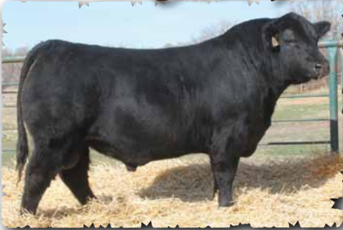
PEAK DOT CASH FLOW 2300D - LOT 29

29 PEAK DOT CASHFLOW 2300D Male PDAR 2300D 1922114 March 08 2016 BARSTOW CASH SITZ DASH 10277 KR CASH FLOW BARSTOW QUEEN W16 WK LASS 1591 WK RETURN MOHNEN DYNAMITE 1356 VERMILION LASS 0029 DUCHESS OF PEAK DOT 615U BALDRIDGE KABOOM K243 DUCHESS OF PEAK DOT 486S BASIN PRIME CUT 354K DUCHESS OF PEAK DOT 755G BW: 85lbs. Adj 205 day Wt: 773 lbs. Adj 365 day Wt: 1417 lbs. BW:+3.8 WW: +52 YW: +87 Milk: +18