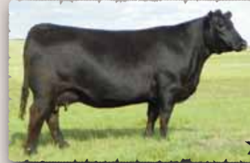
ERICA OF PEAK DOT 478U The dam of Prime

VISIONTOPLINE ROYAL STOCKMAN BW +3.7 VISION UNANIMOUS 1418 VISION EDELLA 665 WW +55 PEAK DOT PRIME 733B SAV 004 PREDOMINANT 4438 YW +99 ERICA OF PEAK DOT 478U MILK +20 ERICA OF PEAK DOT 326R