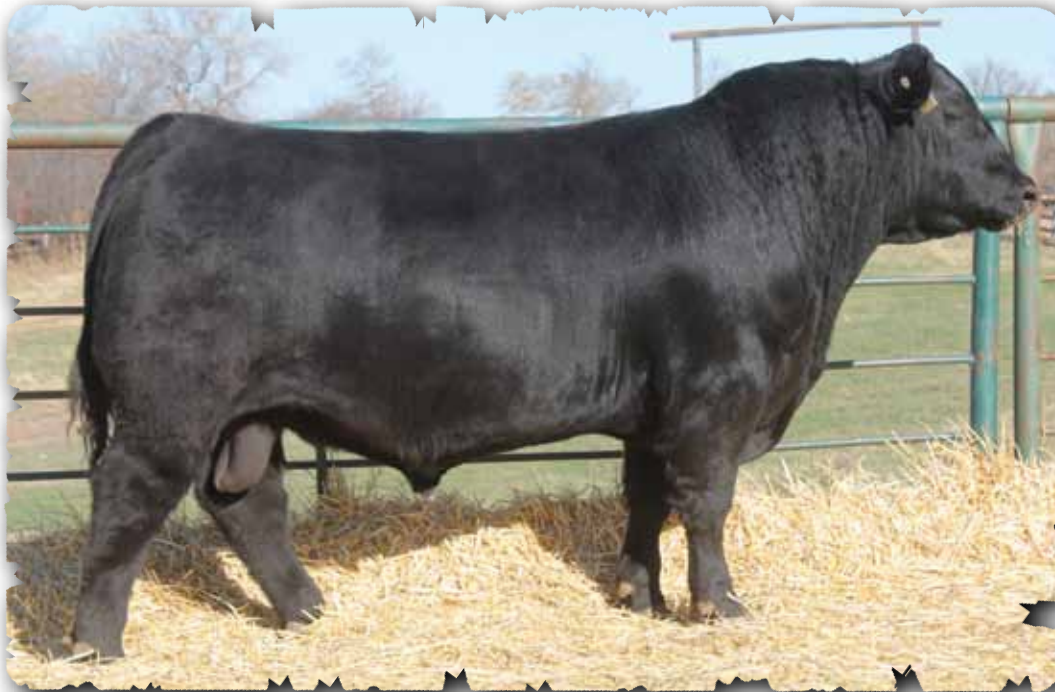
PEAK DOT COUNTRY 505D - LOT 89

88 PEAK DOT COUNTRY 473D Male PDAR 473D 1945417 March 29 2016 VISION UNANIMOUS 1418 VISIONTOPLINE ROYAL STOCKMAN PEAK DOT COUNTRY 604B VISION EDELLA 665 ERICA OF PEAK DOT 668X S A V IRON MOUNTAIN 8066 ERICA OF PEAK DOT 478U S A V ELIMINATOR 9105 RITO 707 OF IDEAL 3407 7075 LADY OF PEAK DOT 792Y S A V ABIGALE 5646 LADY OF PEAK DOT 971U S A V 004 PREDOMINANT 4438 LADY OF PEAK DOT 782L BW: 82lbs. Adj 205 day Wt: 900 lbs. Adj 365 day Wt: 1488 lbs. BW:+3.7 WW: +68 YW: +106 Milk: +21