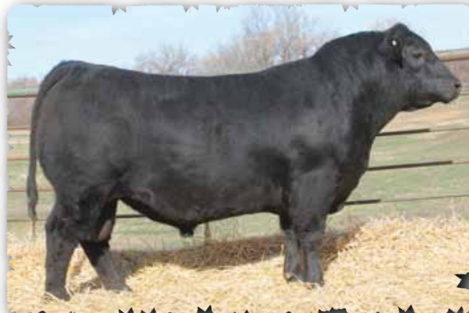
PEAK DOT NO DOUBT 63D - LOT 5

>Dam is a moderate framed Iron Mountain daughter with several sisters in the herd.