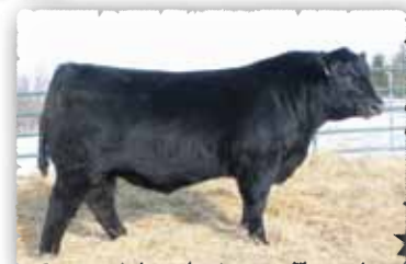
Peak Dot Unanimous 11B The maternal brother to lot 83 purchased by Scott Angus Ranch

>Recommended for cows >A genetic powerhouse with muscle and style. >Weaning ratio of 102