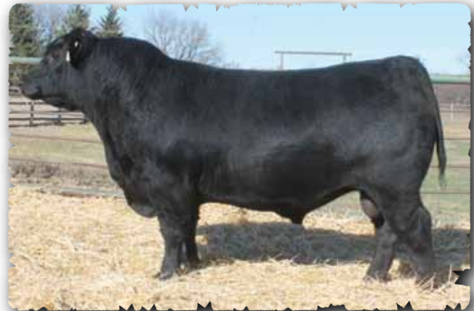
PEAK DOT ELEMENT 2054D - LOT 40

>Dam is a embryo donor and the mother of Semex sire Peak Dot Outlook 271C