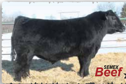
PEAK DOT JUMP START 142C Contact Semex for semen