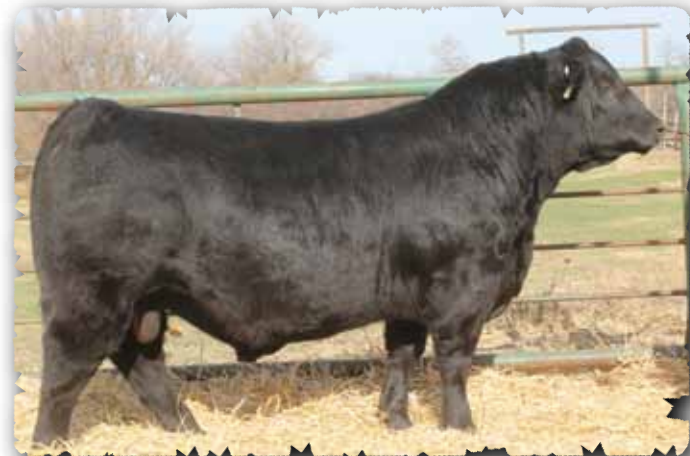
PEAK DOT UNANIMOUS 2344D - LOT 101

>Recommended for cows >This bull is moderate, very thick and has the look of a herd bull.. >Dam is deep and impressive. Ranks in the top 4% for weaning EPD. Top 3% for yearling EPD.