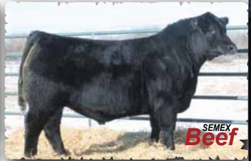
PEAK DOT ENFORCER 8A Contact Semex for semen