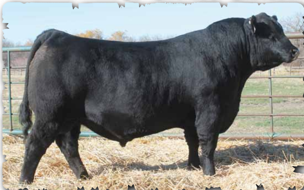
PEAK DOT NO DOUBT 81D - LOT 1