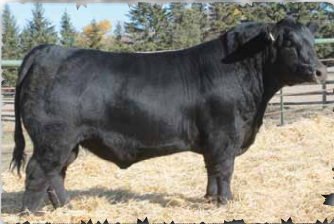
PEAK DOT CASH FLOW 492D - LOT 30

>Recommended for heifers or cows >A stylish, well muscled bull that will leave nice looking daughters. >Maternal siblings have sold to Hillcrest Enterprises, Cal Von Bargaen, Kim Watts and Benjamin Kaiser.