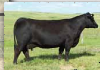
PANSY OF PEAK DOT 904U

The maternal grandam of lots 106 and 107