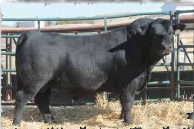
PEAK DOT UNANIMOUS 384D - LOT 79