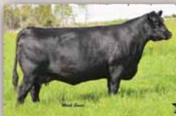
VISION EDELLA 665

We purchased Unanimous as the lot 1 top selling bull in the 2012 Vision Angus Bull sale. Unanimous sons have been well received topping several sales around the country. They are a true testament to him displaying impressive three-dimensional pounds, mass and body on a moderate frame. His sons are solid on their feet, very stout built and gentle to handle while his daughters are extremely feminine and broody. Unanimous has generated much excitement within the Angus breed and will continue to be a major contributor to the future of the beef cattle industry.