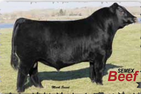
PEAK DOT MOUNTAIN TOP 940X Contact Semex for semen