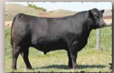
QLC PHANTOM W063