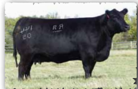
REMMINGTON LADY LAWN 144R

This Canadian bred embryo donor is the maternal grandam of lot 20.