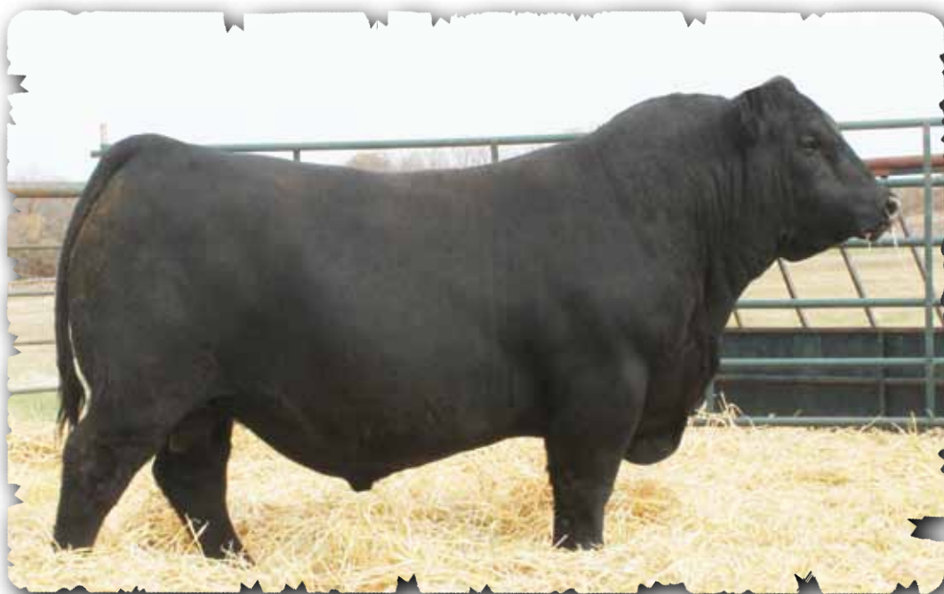
PEAK DOT NO DOUBT 258D - LOT 2