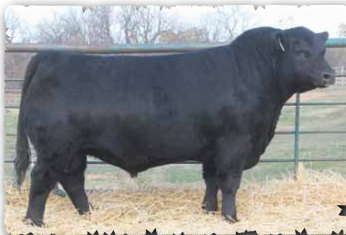
PEAK DOT WIND CHILL 452D - LOT 18

>Recommended for heifers and cows. >A stylish, well muscled calving-ease bull that will leave nice looking daughters. >Ranks in the top 5% for weaning and top 4% yearling EPD. Yearling ratio of 108. >Dam is a heavy milking Hobson daughter.