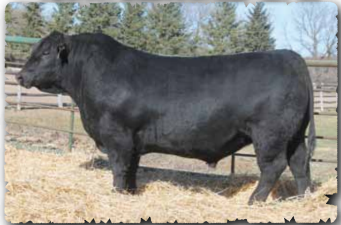
PEAK DOT ELIMINATOR 619D - LOT 135

>Recommended for heifers. >A well built calving ease bull with solid performance. >Weaning ratio of 113. Yearling ratio of 106.