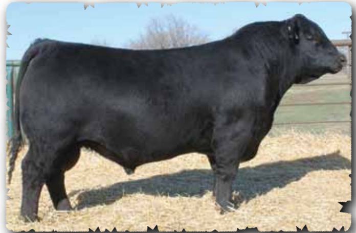
PEAK DOT PRIME 343D - LOT 85

>Recommended for heifers or cows >He will add bone structure and muscle shape to every calf he sires. >Weaning index of 106.