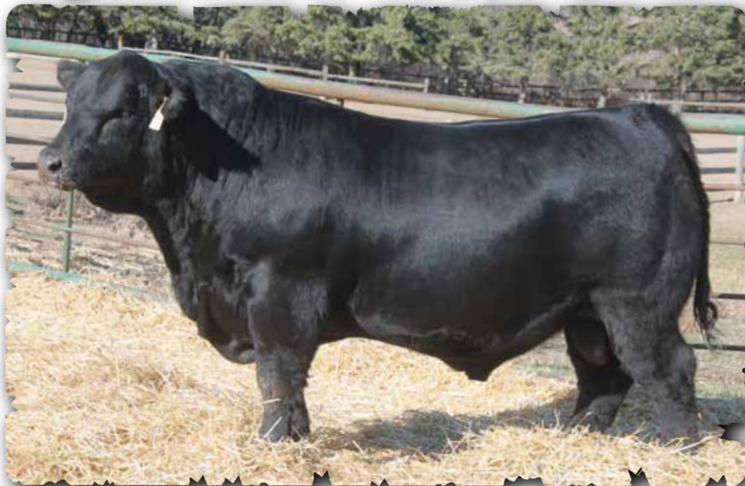
PEAK DOT ELIMINATOR 2223D - LOT 122