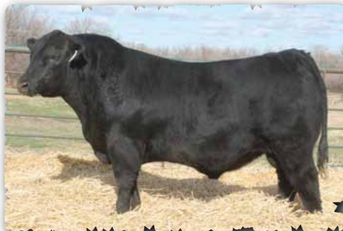
PEAK DOT ELIMINATOR 2212D - LOT 124

>Recommended for heifers or cows >An attractive bull with a powerful rump. Weaning index of 102. >Dam has produced bull that have sold to Murry Nielsen and Kelly Dueck.