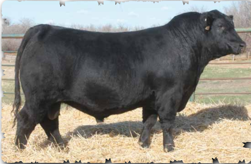
PEAK DOT PIONEER 2123D - LOT 113