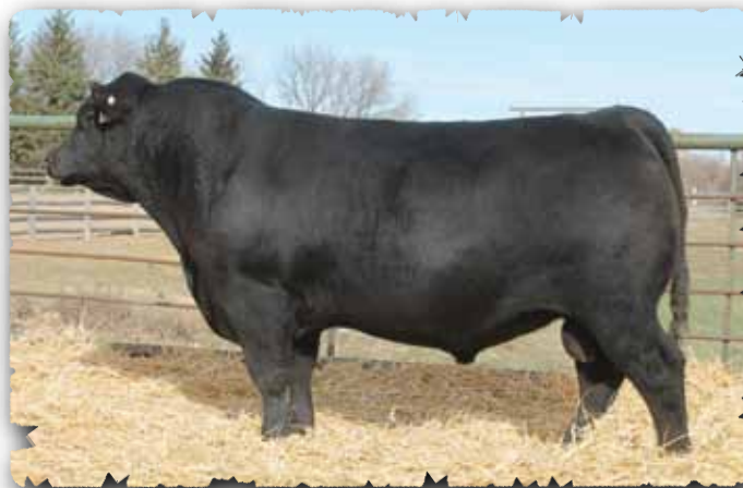
PEAK DOT EASY DECISION 144D - LOT 10

>Recommended for heifers or cows >A powerhouse with a excellent set of numbers. >SAV Eliminator dam has an excellent udder. Grandam and great grandam are past embryo donors.