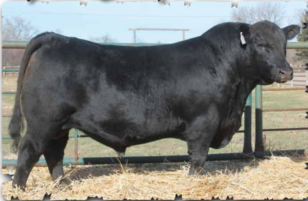
PEAK DOT GAME CHANGER 2015D - LOT 37