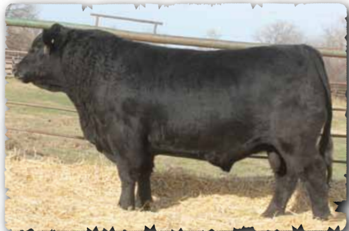
PEAK DOT UNIVERSAL 2154D - LOT 70