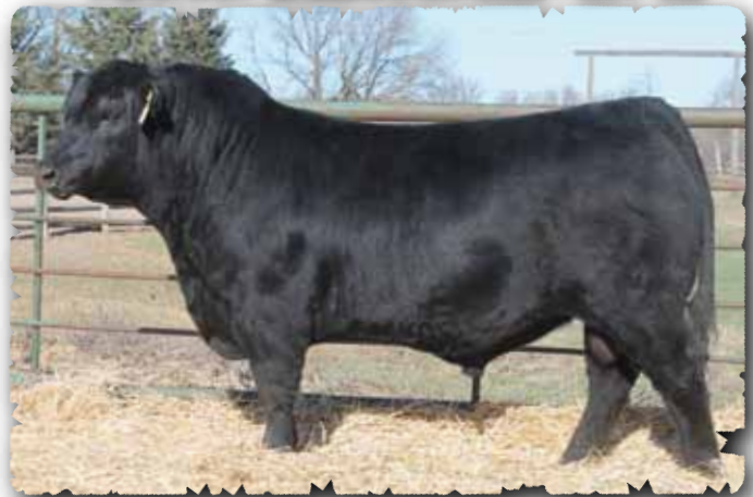
PEAK DOT ELIMINATOR 608D - LOT 134

>Recommended for cows >Tremendous style and muscle. Yearling ratio of 108. >Proven Predominant daughter with a great look.