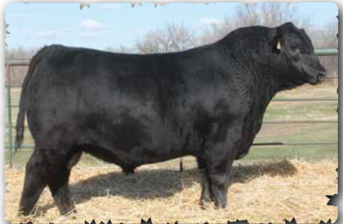
PEAK DOT PROOF 2348D - LOT 104

>Recommended for heifers or cows >A good one. This bull is moderate framed, very thick, and has the look. Very strong from hooks to pins >Weaning ratio of 111. Dam has long solid production record.