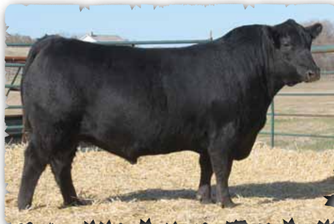
PEAK DOT UNANIMOUS 200D - LOT 59

>Recommended for heifers or cows >A bull with size, length and muscle. Yearling ratio of 110. >Dam is a very well made Iron Mountain daughter with a soft look.