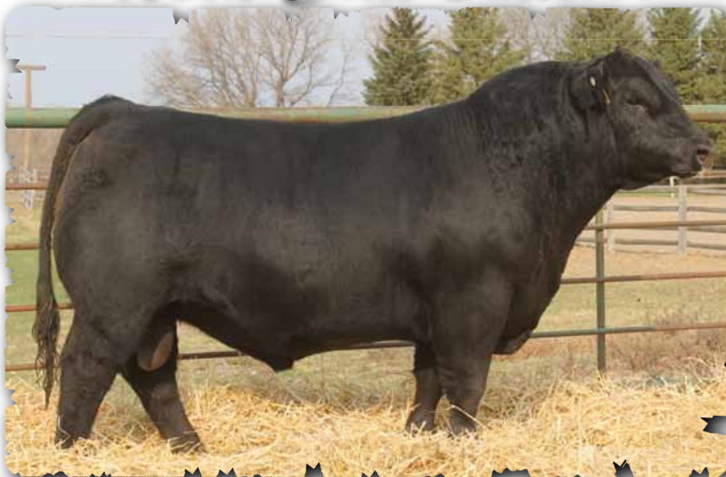
PEAK DOT WIND CHILL 438D - LOT 17