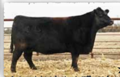
4M BLACKBIRD 2004 The dam 4M Element 405