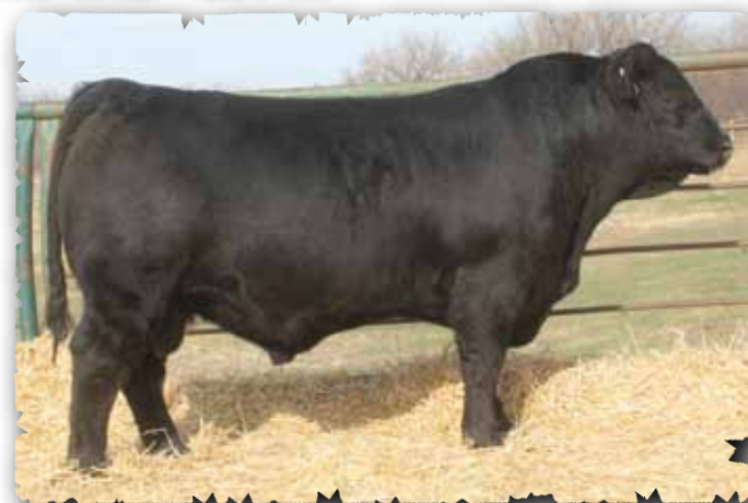
PEAK DOT UNANIMOUS 430D - LOT 64

>Recommended for cows >A moderate framed thick made bull with a soft look. Weaning ratio of 101. >Duff Encore dam is listed as an Elite dam with the CAA.