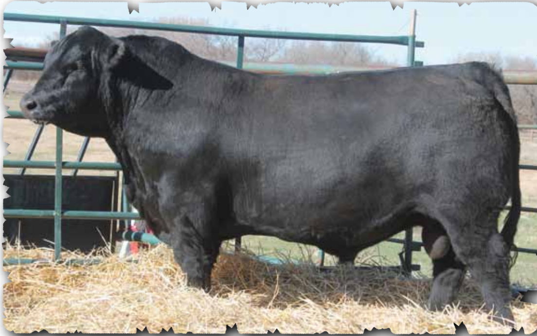
PEAK DOT ELIMINATOR 2174D - LOT 119