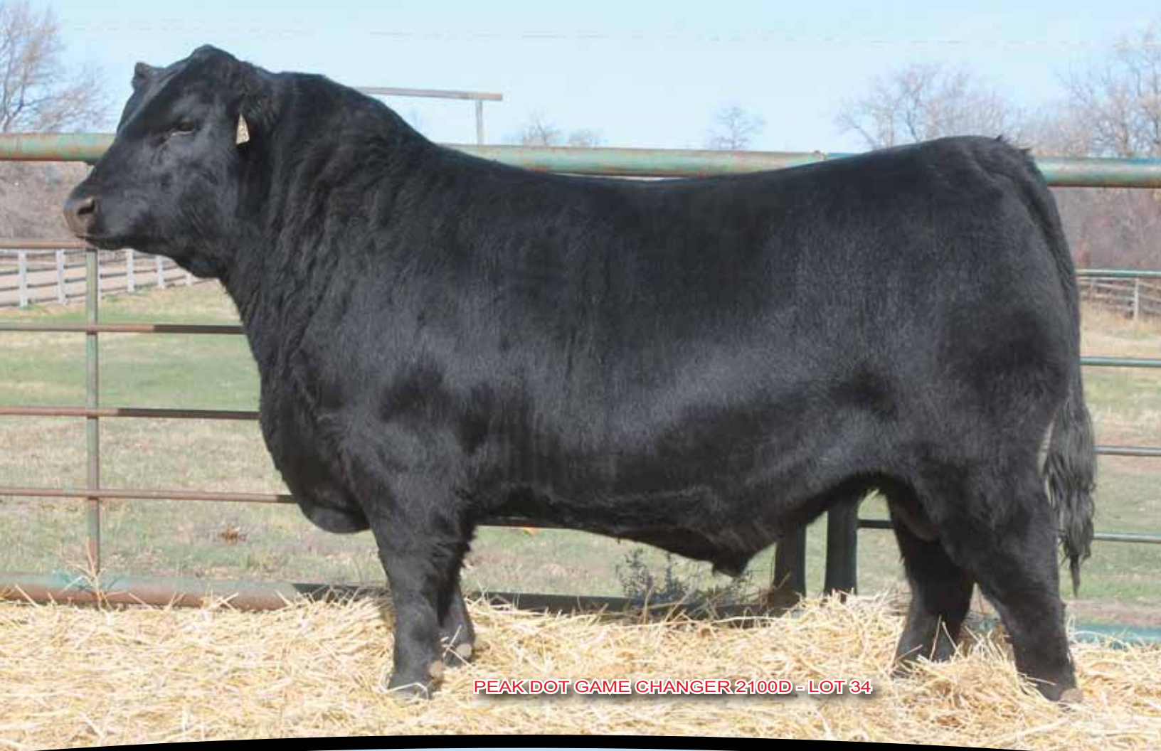
PEAK DOT GAME CHANGER 2100D - LOT 34