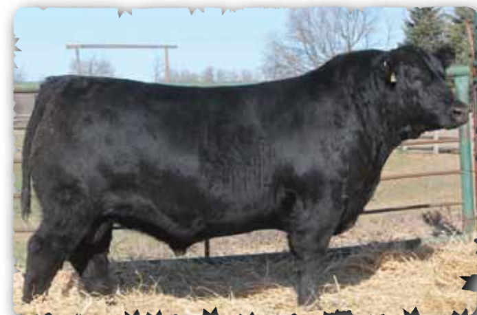
PEAK DOT PROOF 2176D - LOT 108