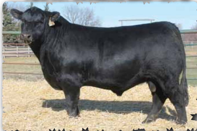
PEAK DOT UNANIMOUS 2188D - LOT 93

>Dam is an attractive Iron Mountain daughter.