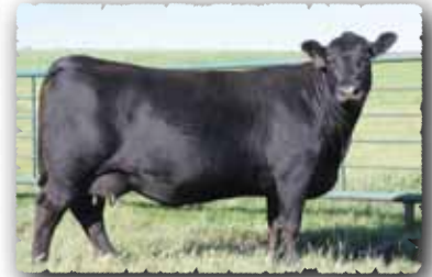
LADY OF PEAK DOT 459U The maternal grandam of lot 101