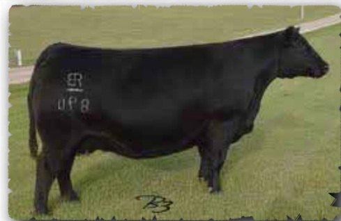
RB LADY STANDARD 305-890

The $175,000 dam of Gaffney Game Changer 371