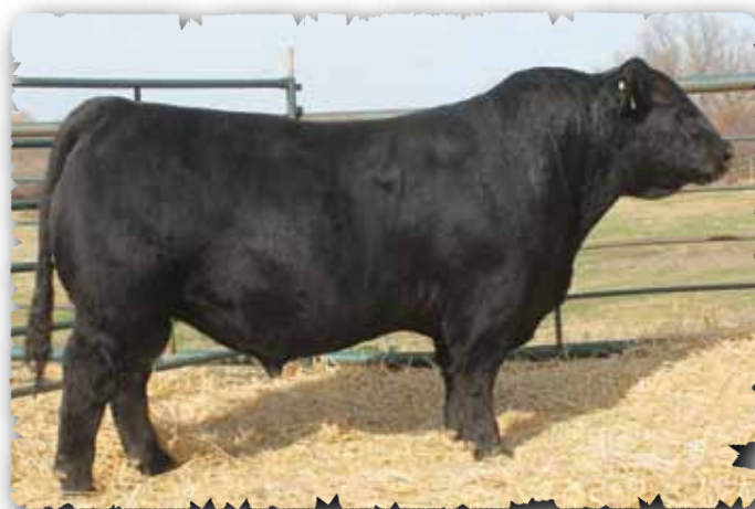
PEAK DOT UNANIMOUS 335D - LOT 61