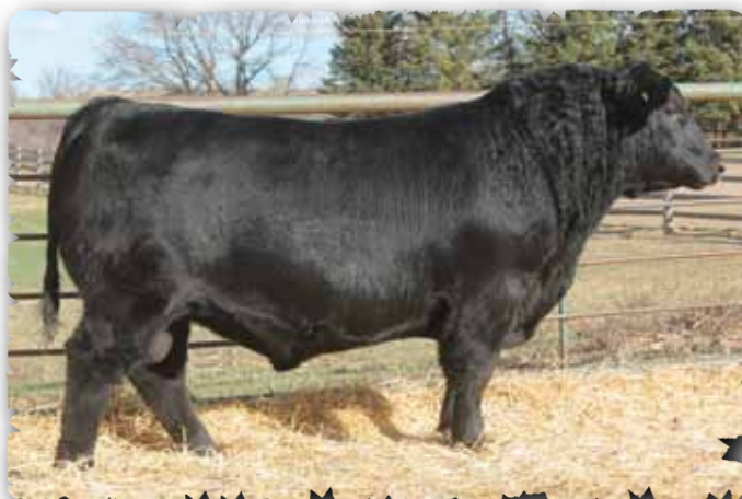
PEAK DOT PIONEER 2171D - LOT 112