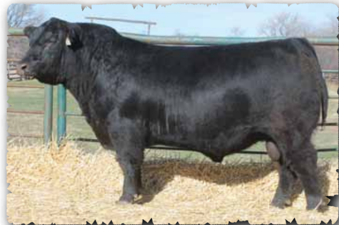
PEAK DOT UNIVERSAL 2190D - LOT 71

>Maternal sisters sold to RL7 Ranch and Hillcrest Enterprises.