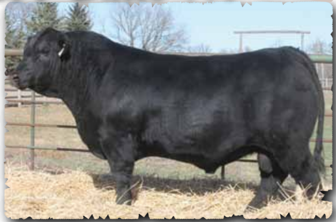
PEAK DOT ELIMINATOR 605D - LOT 133

>Recommended for cows >A good hip and deep flank. Travels very well. Weaning index of 102. >Outstanding Hobson dam.