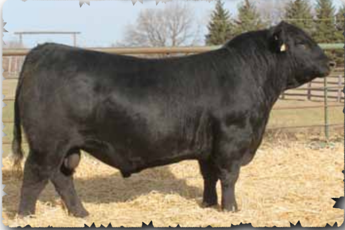
PEAK DOT UNANIMOUS 2258D - LOT 76