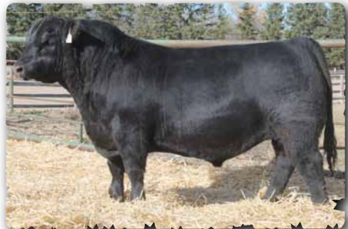
PEAK DOT ELEMENT 2029D - LOT 41