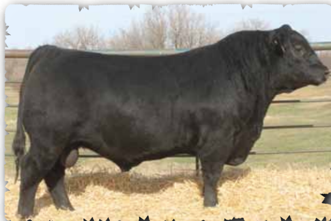
PEAK DOT UNANIMOUS 164D - LOT 58

>Recommended for heifers or cows >A personal favorite, moderate framed thick made bull with sheer thickness. Yearling ratio of 124. >Perfect uddered Bold dam. A maternal brother sold to Someday Ranch.