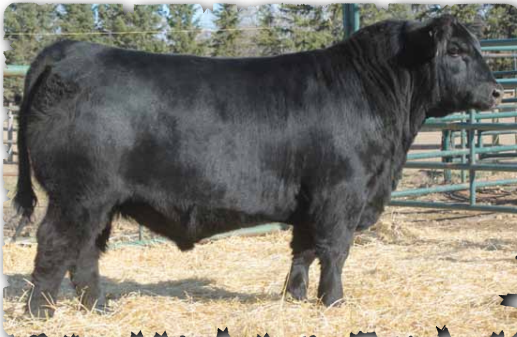
PEAK DOT PIONEER 2216D - LOT 117