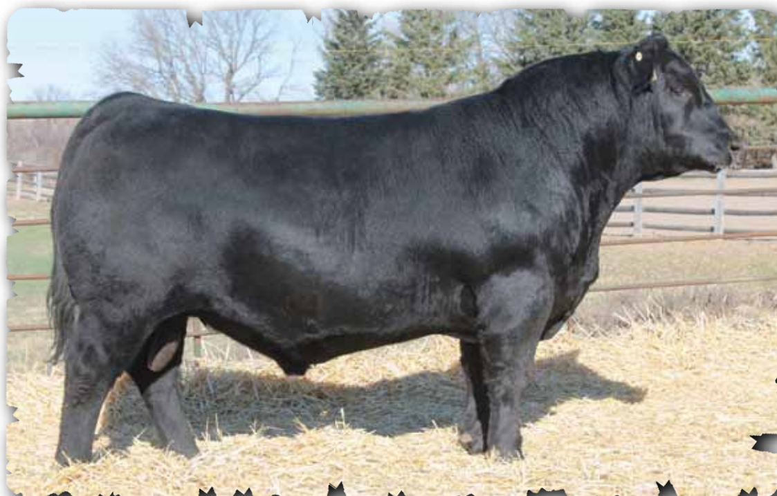
PEAK DOT COUNTRY 403D - LOT 87

Country is a deep-bodied individual that offers an abundance of width and fleshing ability. He was the top performing bull from the 2013 calf crop earning a 205 day weaning weight of 1056 lbs for a weaning ratio of 146. His Iron Mountain dam has the look. His grandam is the most popular cow on the place and her influence can be seen throughout this offering.