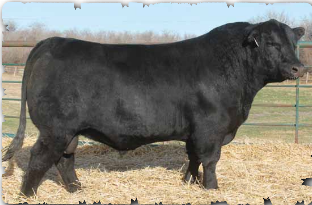
PEAK DOT PIONEER 2141D - LOT 116