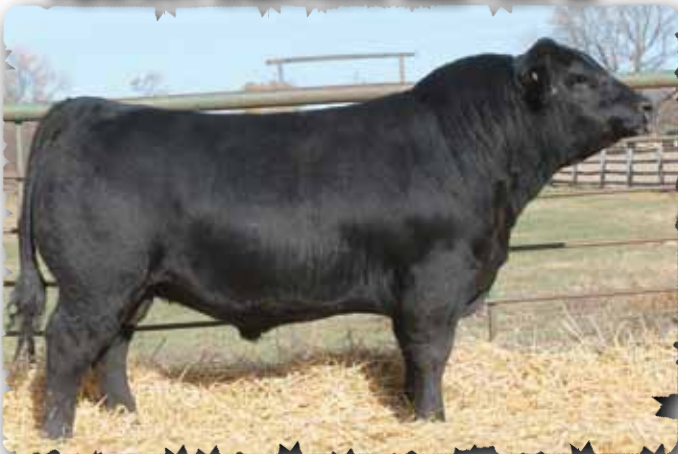
PEAK DOT CASH FLOW 489D - LOT 31

>Recommended for heifers >A low birth weight bull with plenty of muscle, masculinity and performance. >Dam is also the mother of Peak Dot Jump Start the $50,000 high selling bull from the 2016 spring sale to Semex Beef.