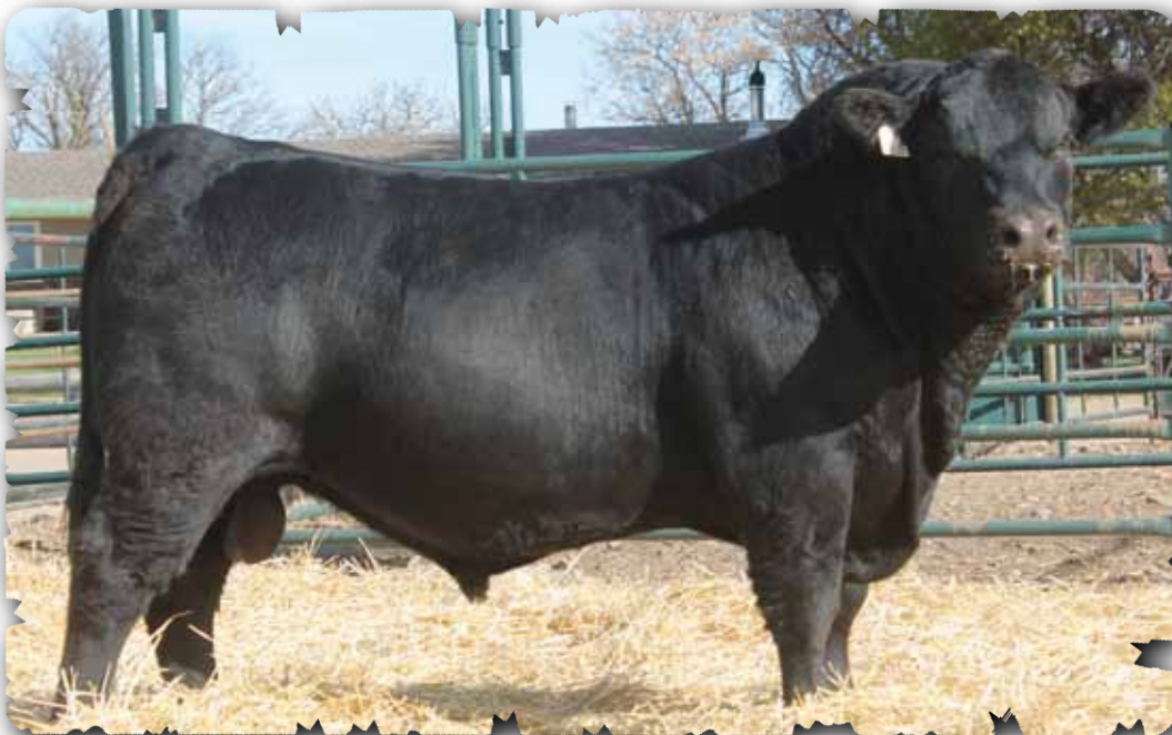
PEAK DOT NO DOUBT 1111D - LOT 7