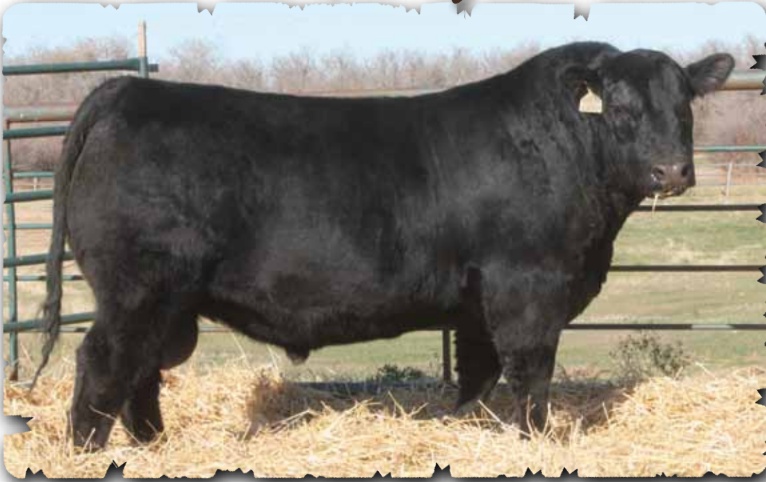
PEAK DOT PROOF 2330D - LOT 103