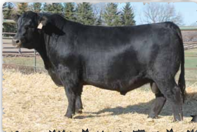
PEAK DOT UNANIMOUS 2187D - LOT 94