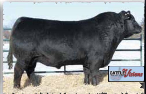
PEAK DOT BOLD 204U Contact Cattle Visions or Peak Dot for semen