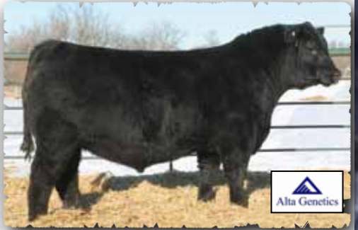
PEAK DOT LIBERTY 117C Contact Alta Genetics for semen