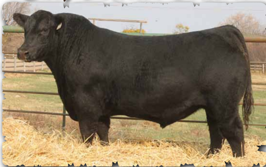
PEAK DOT EASY DECISION 121D - LOT 8