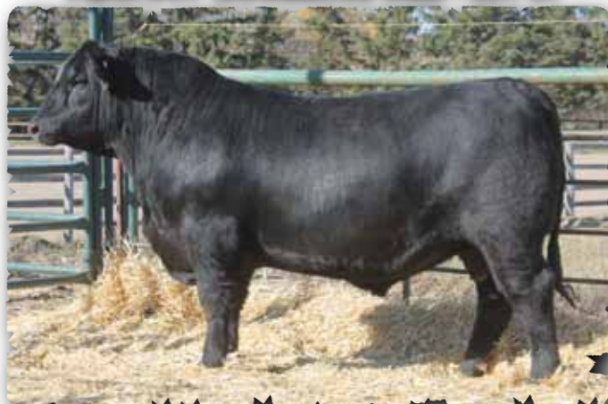
PEAK DOT UNANIMOUS 2243D - LOT 92

>Dam has sons which have sold to JLB Ranch and Colven Cattle Co.