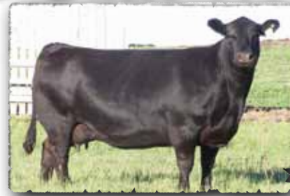
ROSE OF PEAK DOT 643T The maternal grandam of lot 76