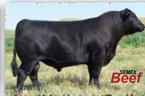
PEAK DOT RESOLUTE 37W Contact Semex for semen