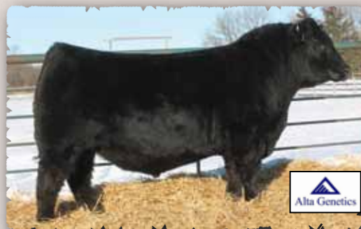
PEAK DOT YOU GOT IT 60D

The top selling No Doubt son from the 2017 spring bull sale to Alta Genetics.