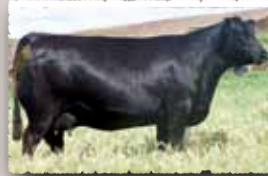
Duchess of Peak Dot 610T