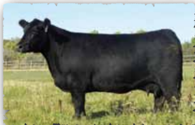
Lady of Peak Dot 476S The dam of lot 48