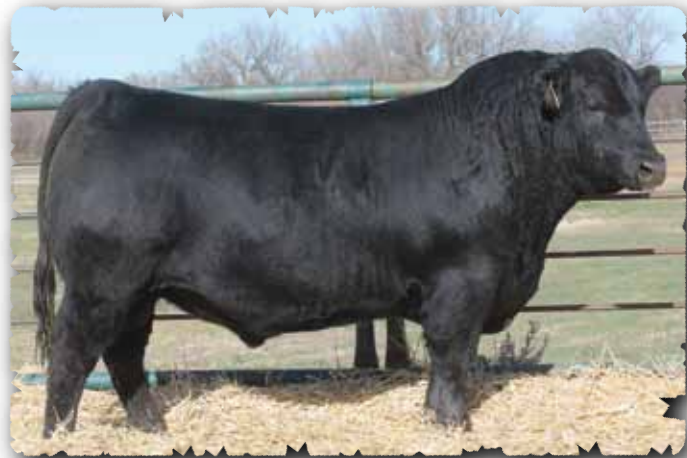
PEAK DOT RADIANCE 383D - LOT 53

>Recommended for heifers or cows >This bull will add size, pounds and power to every calf he sires. >Yearling ratio of 115.