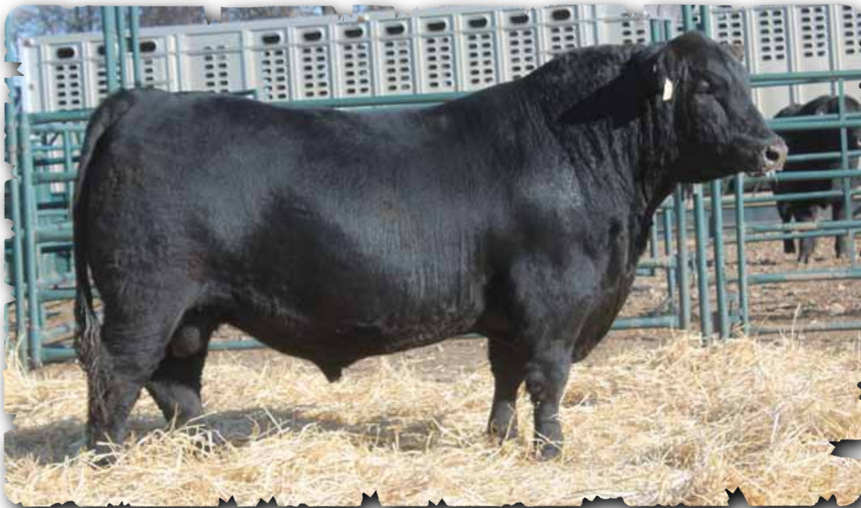
PEAK DOT PIONEER 2143D - LOT 109

Peak Dot Pioneer 9X was a feature of the April 2010 sale. He has proven himself to be an easy calving sire with exceptional performance and cow family strength that goes back for generations. His progeny are long, deep and correct, they are among some of the top performing individuals in this sale.