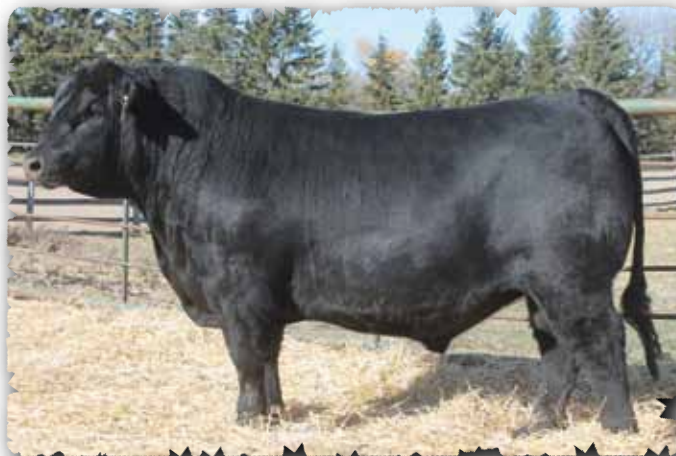
PEAK DOT ELEMENT 2266D - LOT 49

>Recommended for heifers or cows >A good looking bull smooth and athletic in his movement. Durable and built for ranch country. >Three generations of embryo donors in this bulls pedigree. Dam has 46 progeny recorded with CAA.