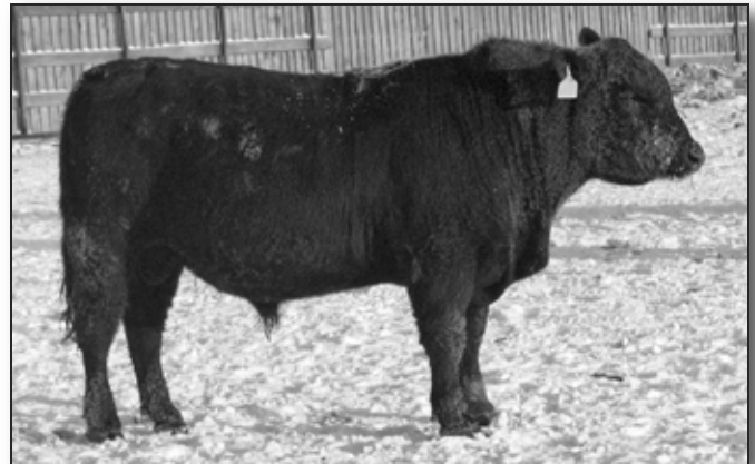
Lot 30 - Ole Emblazon 321Y

This is our first set of sons of the bull we call E3I. It turns out that they were well worth the wait. 321Y is deep bodied, wide based and just how we like them here. Expect to see many more sons like this great rascal over the years. We are expecting great things from his sire.