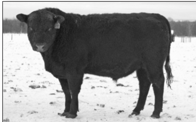
Lot 97 - Red Ole Illuminator 717Y

Calving Ease ★★★ Possibly the best son of a breed legend. Son of the one time leading bull in the Canadian Angus Association Ole Oscar. 717Y is long spined and made right. With Rambler 1000 and Right Time in the pedigree look for this blood red herd bull to raise sons who will gain and daughters you will love to own. Don't miss your chance on a real herd bull.