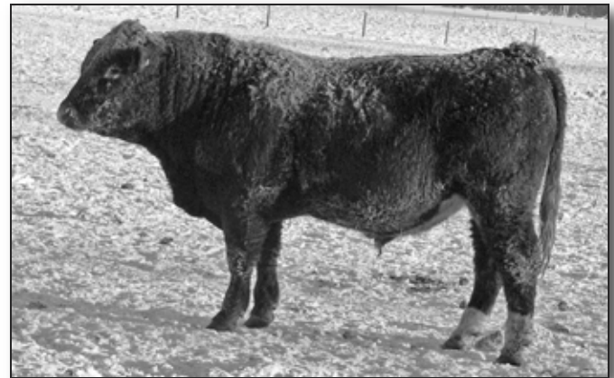
Lot 150 - Commercial Cross Bull

BW: 95 lbs. RED EPDs: BW: -0.7 34% WW: +56 30% YW: +79 29% Milk: +23 24% TM: +51 Stay: +10 6% HP: +9 P CE: +1.0 22% MCE: +12.0 21% CARCASS: REA: -0.12 11% Marb: +0.04 15% Fat: +0.000 17% Yield: +0.07 14% CW: +15 25% Calving Ease ★★