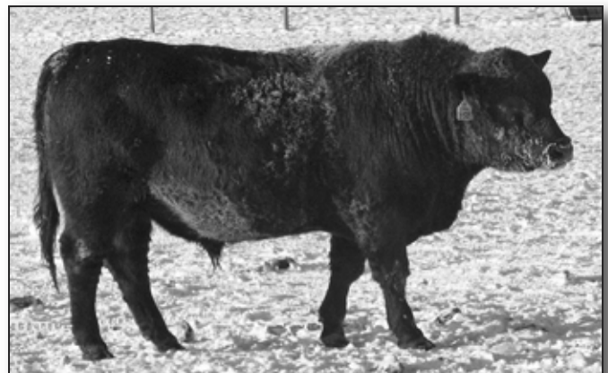
Lot 32 - Ole Emblazon 352Y