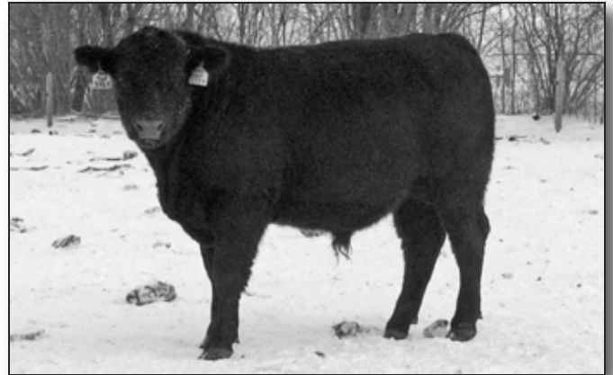
Lot 108 - Ole 4197 372Y

This bull really should be named "Deep Body". 41/97 is a bull that breeds capacity into his offspring. That, combined with 6595 twice, and you have all the capacity one could want!