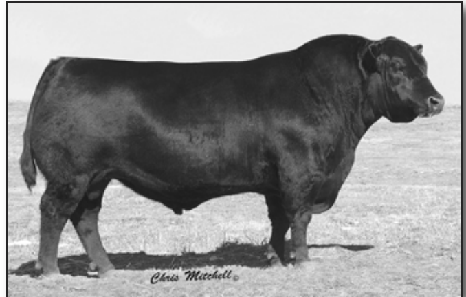
Sinclair Rito Legacy 3R9 - Sire of Lots 76 & 77