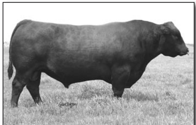
Red Crowfoot Ole's Oscar 2042M

Ole's Oscar is the foundation bull of our Red Angus program! No other bull has left a larger imprint at Ole farms than Oscar! Oscar is one of very few bulls in the breed where the calves are born light at birth, wean off heavy and have above average muscle shape! Oscar daughters are extremely feminine cows with good feet and picture perfect udders! Ole's Oscar has been the #1 sire in Canada for registrations and is currently ABS's (largest semen company in the world!) #1 selling Red Angus bull in 2009, 2010 and 2011! There is very little semen available in the Canadian marketplace so come and find a son, grandson or great grandson!