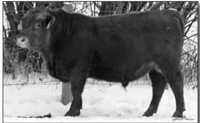
Lot 50 - Red Ole Crossbow 111Y

A very special opportunity here at Ole Farms. An opportunity to buy a Jumbo 1B son. We purchased these 3 Jumbo sons at Remington's dispersal as calves. 522 is a special calf with added middle and power, out of a straight Canadian pedigree. Outcross and Good!