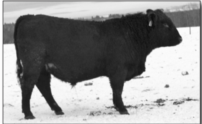
Lot 78 - Red Ole Blazin Mill 188Y

A powerful young Blazin Mill son out of one of our most promising young dams. 188Y is extremely deep bodied!