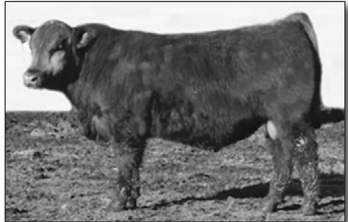
Red 5L Crossbow 1173-44V - Sire of Lots 50-66

BW: 82 lbs. RED EPDs: BW: -2.0 33% WW: +40 28% YW: +56 27% Milk: +26 21% TM: +46 Stay: +14 0% HP: +10 P CE: +4.0 16% MCE: +6.0 16% CARCASS: REA: +0.23 6% Marb: +0.40 7% Fat: -0.010 9% Yield: -0.13 10% CW: +0 23% Calving Ease ★★★