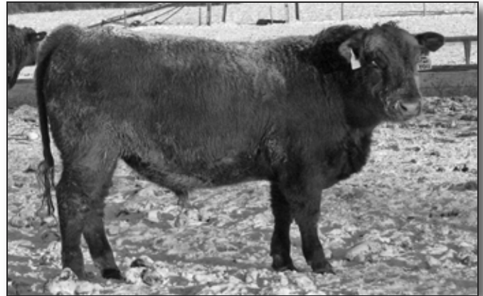
Lot 117 - Red Ole Sakic 110Y