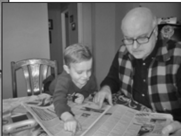
Buy that one Grandpa!