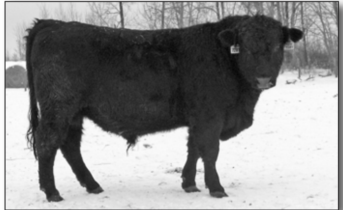
Lot 45 - Ole Payoff 728Y