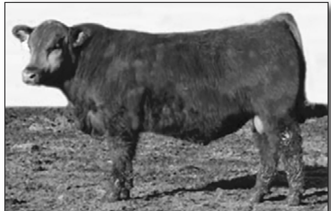
Red 5L Crossbow 1173-44V

Crossbow has been a real treat to own. Heavy muscle and capacity have been translated into his sons. Crossbow has been a prolific breeder with a great temperament. We lost Crossbow this past spring and he will be missed.