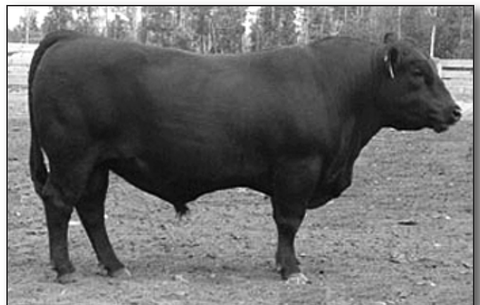
Ole Alliance 138T

138T has another impressive set of sons in this year's sale. 138T is out of a matriarch here at Ole Farms. We consider his dam 3542N, to be our best cow with a weaning index of 119 and is very moderate and sound. 138T is thick and deep and translates it into his sons.