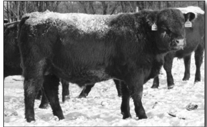
Lot 19 - Red Ole High Noon 108Y