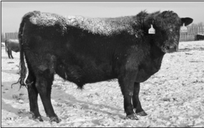
Lot 133 - Ole Genuine 601Y