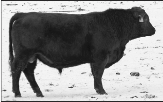
Lot 17 - Red Ole High Noon 133Y