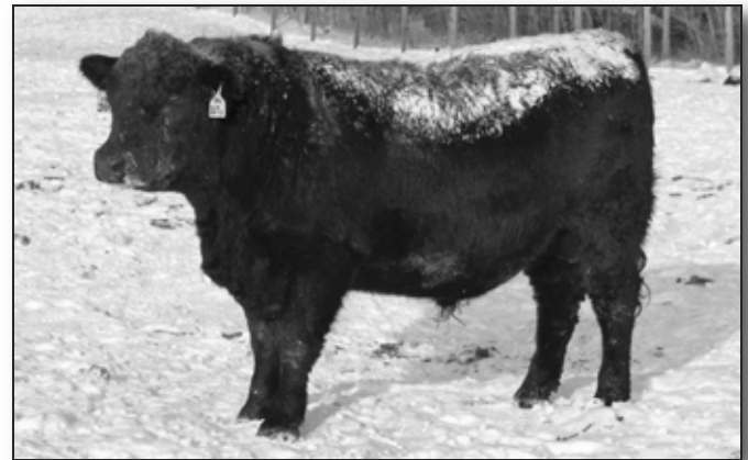
Lot 67 - Ole Everlast 307Y