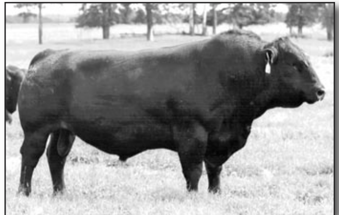
Sinclair Everlast 6R107

Everlast was purchased in 2007 to address our need for more moderate cattle. Everlast is used both as a walking bull and now through AI. He delivers a very consistently heavy muscled and moderate package! Rito 707, Everlast's sire was born in 1967 and is in the lineage of almost every black bull in this year's sale.