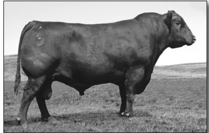
Sitz Alliance 6595 - Sire of Lots 1 to 13