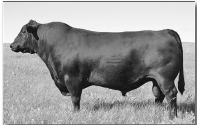
Bennett Total - Sire of Lots 14 -16

Ole Farms will keep the bulls until delivery, starting March 15th, at no cost