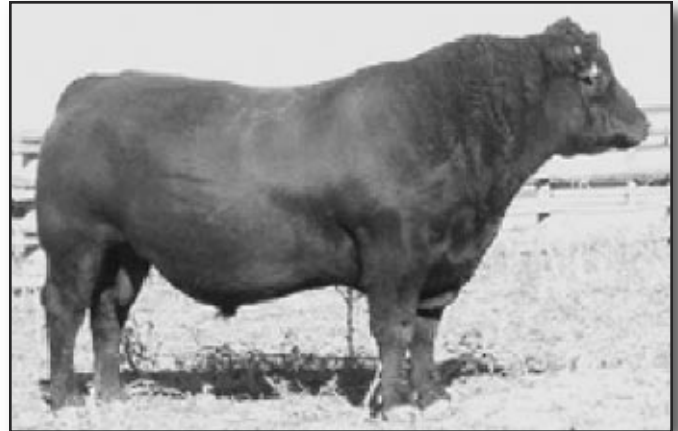
MH Magua 27

Magua is a real moderator in our herd. Magua will add muscle and fleshing ability and will reduce frame. Magua daughters are favorites among visitors because of their ability to flesh, their picture perfect udders and their incredible hair.