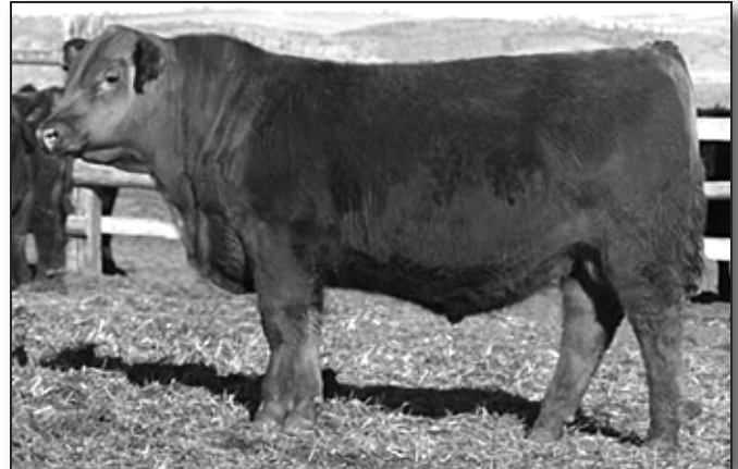
Red Larson High Noon 881

High Noon has yet another fantastic set of sons. Outstanding growth and carcass with a great phenotype, look for High Noon sons to be real herd changers. High Noon will add muscle depth and performance.