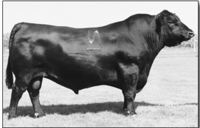
N Bar Emulation EXT - Sire of Lots 92 -96