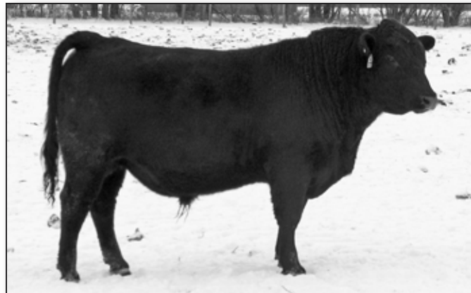
Lot 2 - Ole Alliance 377Y

Starting off this year's offering is a growthy, performance 6595 son. His dam 263S has produced top end full brothers sold to Lyon's and McCutcheon's. 263S is a model cow with great feet, sound udder and width of base.