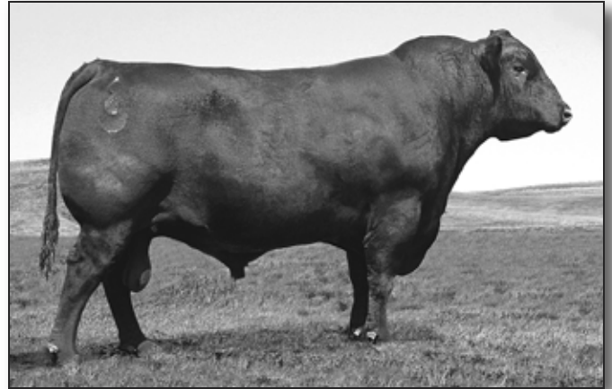
Sitz Alliance 6595

We started using Alliance in 2001 and in the past 11 years have used 615 straws of semen. Sitz Alliance is one of the few bulls in the history of the breed that balances two antagonistic traits so well – productivity and fertility. There are so few bulls that combine the growth attributes of Alliance, have daughters that bring in the heaviest calves and yet rebreed. Take this opportunity to purchase a son as we have very little semen left on this pathfinder sire.