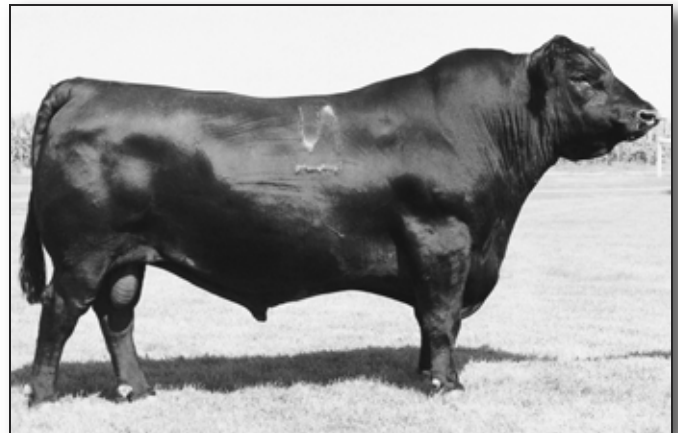
N Bar Emulation EXT

A breed legend for leaving the most productive, sound daughters anyone could hope for. EXT will improve feet and udder quality and simply put, builds great cow herds. Semen is very limited so don't miss your chance to improve your cow herd with an EXT son.