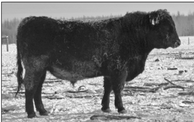
Lot 31 - Ole Emblazon 309Y