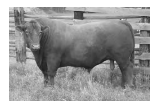
Service sire: Red Nine Mile Molson 1145 Exsposed starting May 15, 2010

Box 612 Vanderhoof, BC V0J 3A0 Ph. 250-567-4429