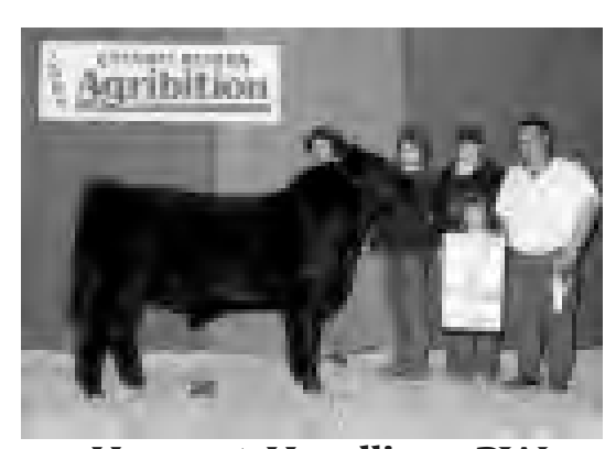
Harvest Headliner 2W Echo 101N X Hemi Brother to Embryos

4174 Cowart Rd Prince George, BC Ph. 250-960-0022