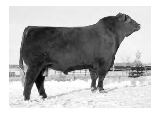
Red SVR Gangster 14S Grandsire of Bred Heifer Service sire Red Northline Dillinger 17W

10114 Snell Rd Vanderhoof, BC V0J 3A2 Ph. 250-567-9762