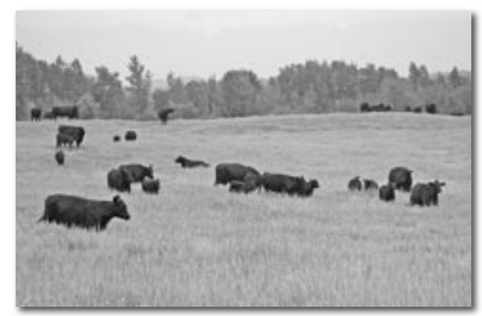
N.B.A. in the spring