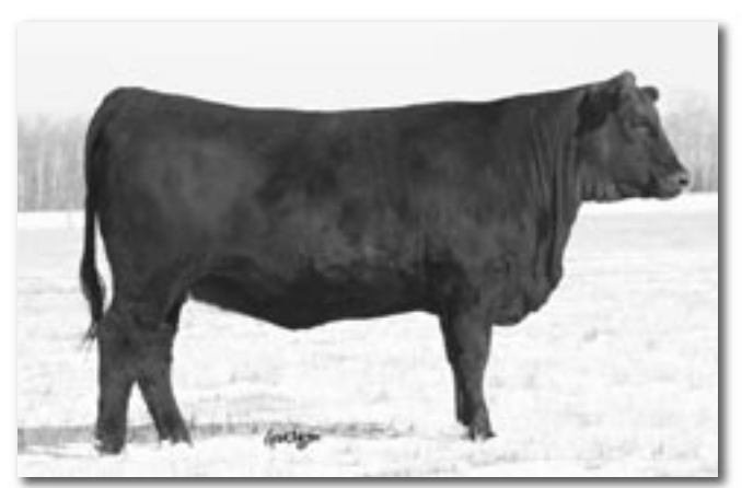
Lot 213 - MVF Tibbie 81R

EPDs: BW: I + 3.6 5% WW: I + 47 5% YW: I + 77 5% Milk: I + 20 5% TM: I + 43 YG: I + 31 5%