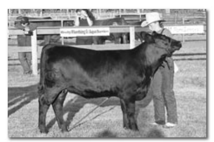
Lot 219 - N.B.A. Hi Lite 9T