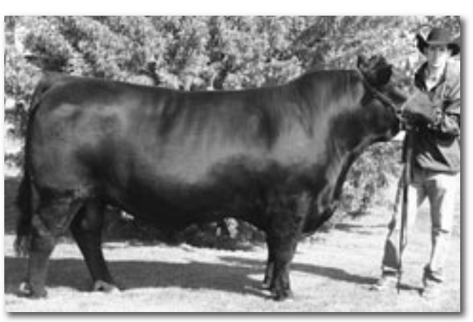
N.B.A. Colmeg Bando 57T