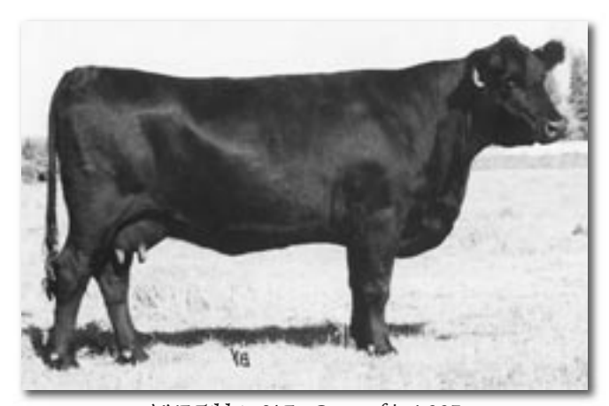
MVF Tibbie 84E - Dam of Lot 227