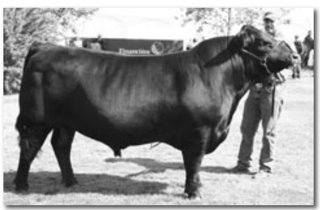
N.B.A. Colmeg Bando 57T - Service Sire to the bred yearlings Grand Champion Bull 2009 Bulkley Valley Exhibition.