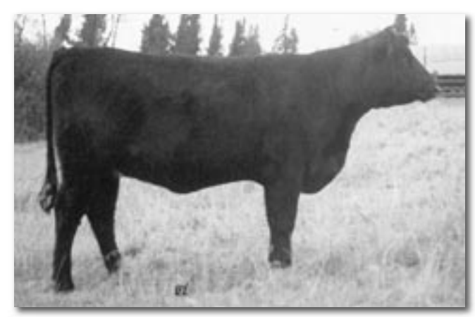
MVF Tibbie 105H - Dam of Lot 230