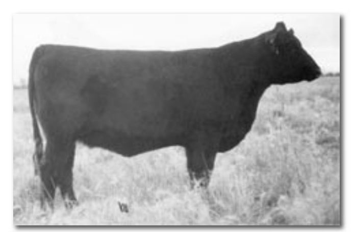
MVRB Tibbie 63H - Dam of Lots 254, 255 & 256