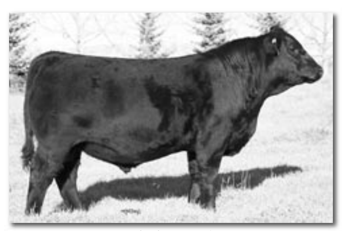
HF Hemi 151T