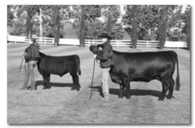
Lot 202 - N.B. A. Tibbie 14T