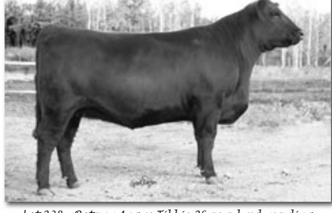
Lot 238 - Botany Angus Tibbie 25 as a bred yearling