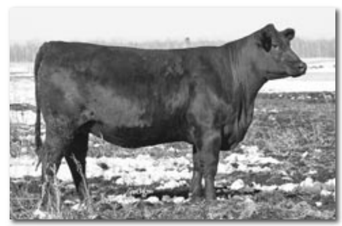
Lot 246 - MVF Burgess 93R as a bred heifer