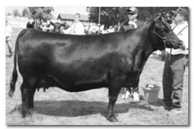
Lot 201 - SCC 726G Tibbie 52F 17P