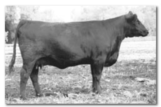
Greenbush Tibbie 5H - Dam of Lot 245