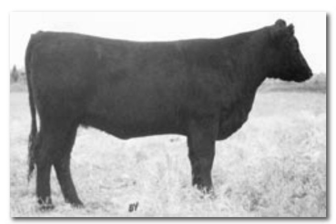
MVF Tibbie 143H - Dam of Lot 205