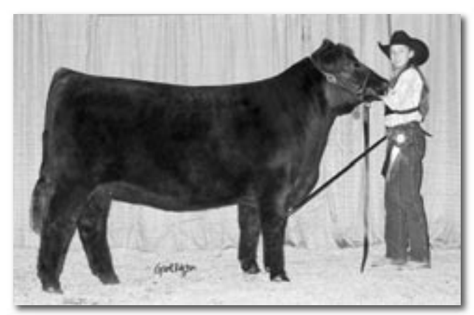
NBA 23S at Farmfair 2007 in Edmonton