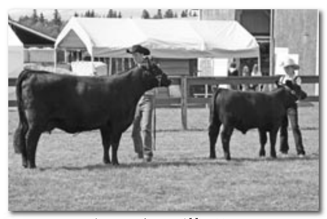
Lot 203 - N.B.A. Tibbie 44R

SIRE: HF HEMI 151T 1402681 BW: 88 lbs. EPDs: BW: I +4.7 5% WW: I +54 5% YW: I +91 5% Milk: I +24 5% TM: I +51 YG: I +38 5%