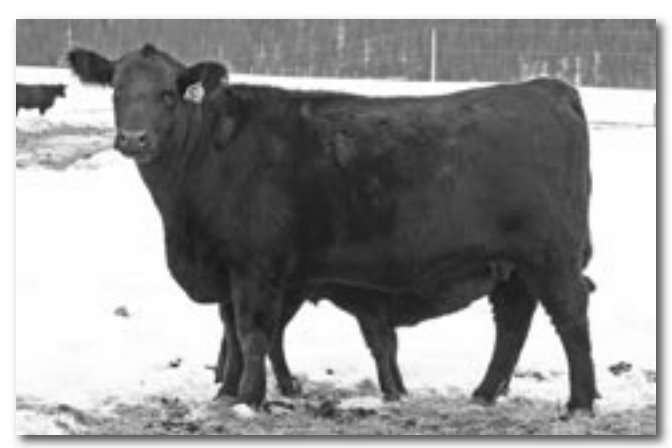
Lot 239 - Botany Angus Ellen 5S