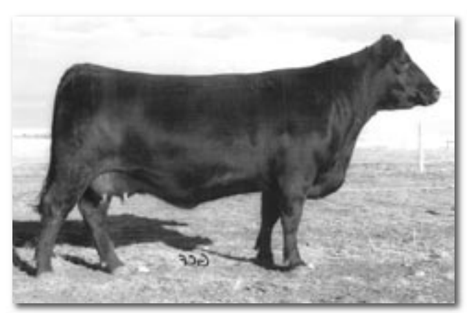
MVF Tibbie 52F - Dam of Lot 258