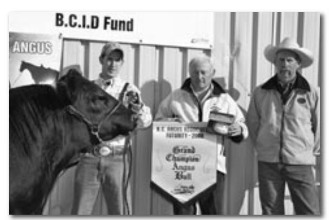
N.B.A. Colmeg Bando 57T winning Champion Bull at the 2008 WAF Futurity show in BC