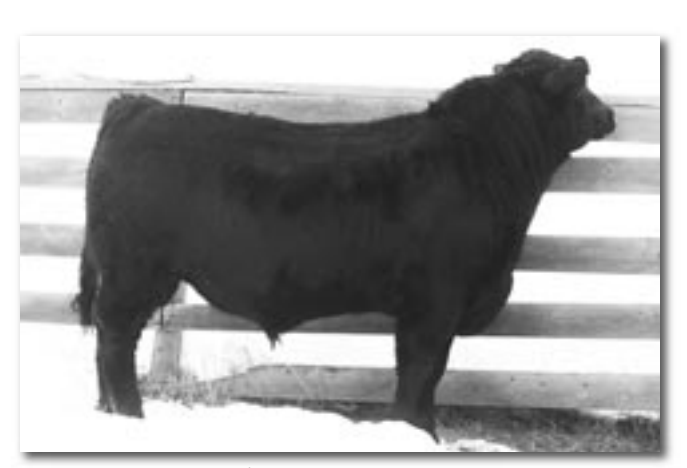
N.B.A. Oscar 711S