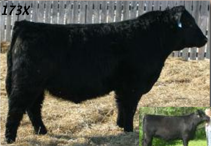
Inset - Maternal sister to 173X