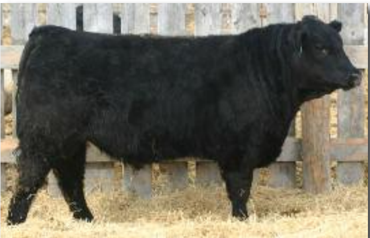
Merit 8539 - Maternal Brother to 38X