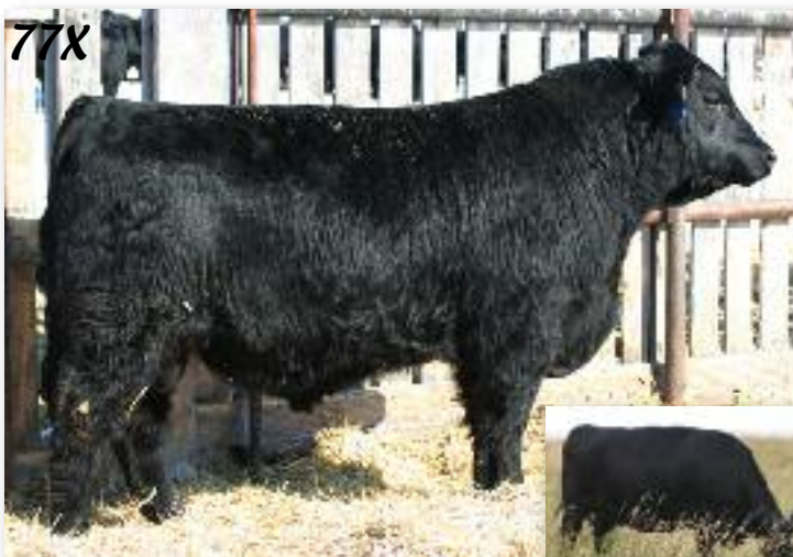
Inset - Merit Socialite 5084 - Dam of 77X