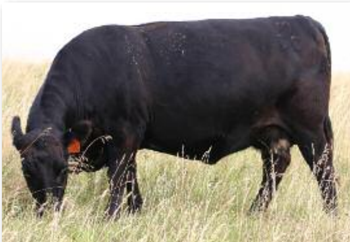
Merit Blacklass 3132 - Dam of 45X