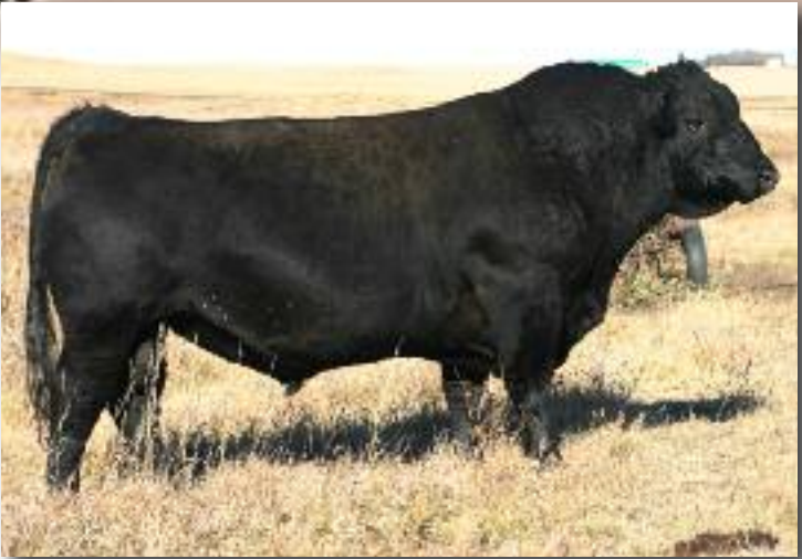
Merit Matador 4190 - Sire of 52X