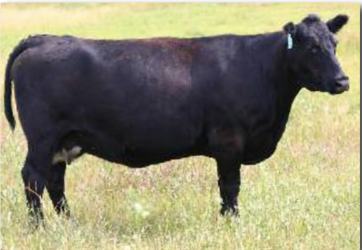
Merit Pride 1004 - Dam of 175X

Each spring we are always anxious to see what 4154 has. She is one impressive bovine, with tons of capacity, a big hip and a perfect udder. She is the dam of Macy's 2010 4-H project. The McHenry cow family also produced Merit Diesel. 173X just keeps getting better with age and is deserving a second look on Sale Day!