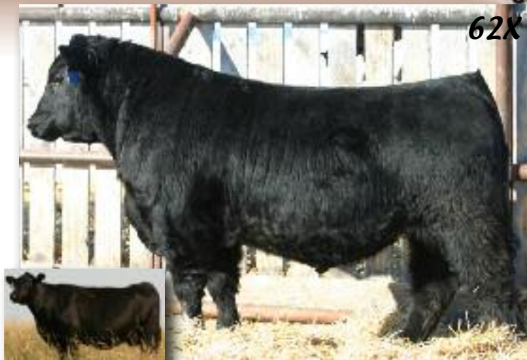
Inset - Merit Pride 4149 - Dam of 62X