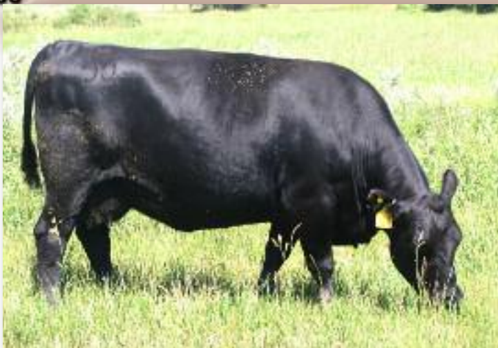
Merit Blackclass 1165 - Dam of 190X