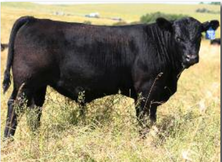
Insight Son - 78X - Summer of 2010

Insight progeny have good hair and dispositions and are structurally sound functional cattle. The sons are wide based, hard muscled and athletic. His sons and daughters have his stamp, and will have a positive impact on the industry for years