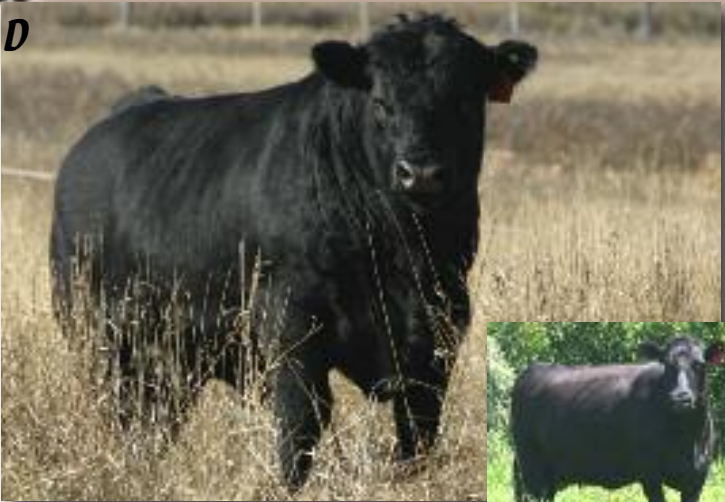
Inset - Merit Socialite 4195 - Dam of Merit 8711