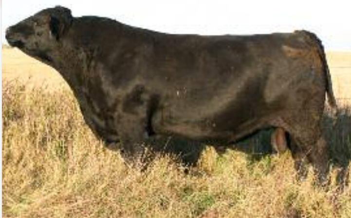
GDAR Insight 7201 - Sire of 201X and Major Ref. Sire of the Sale