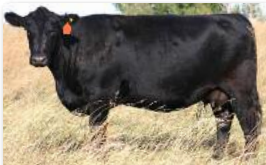
Merit Jilt 5060 - Dam of 78X

To top it all off, 78X has a fabulous disposition. There are many essentials for the beef business wrapped up in this herdbull candidate.