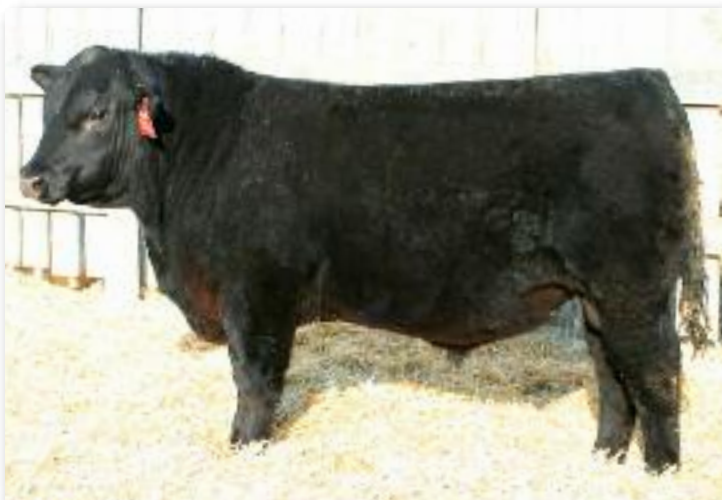
Merit Capone 7056 - Sire of 25X & 26X (Twins)