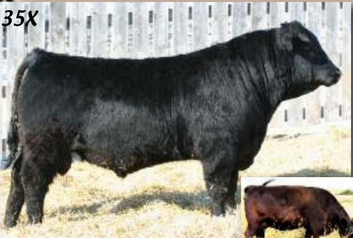
Inset - M'Brook Lass 6055 - Dam of 35X