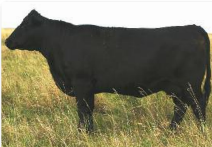
Merit Countess 6087 - Paternal Grandam of 16X