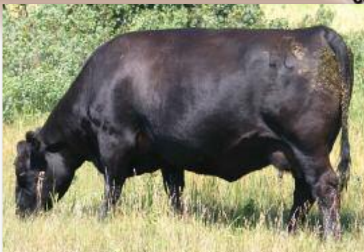
Merit Socialite 2156 - "Elite Dam" of 25X & 26X (Twins)