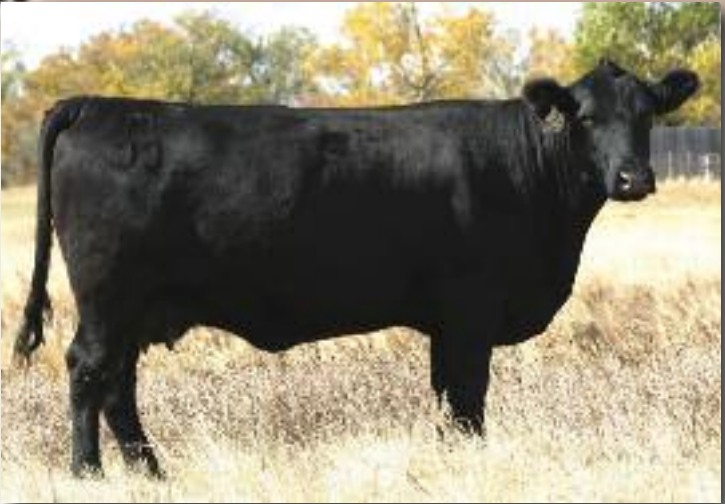
Merit Pride 2074 - Maternal Great-Grandam to 6X