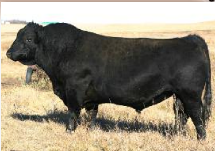
Merit Matador 4190 - Sire of 176X