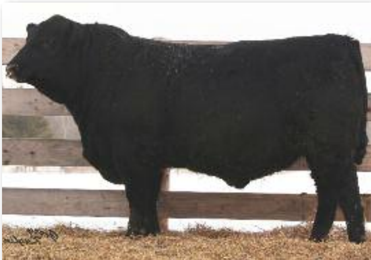
Royal Forte DRCC 5138R - Maternal Grandsire to 4X