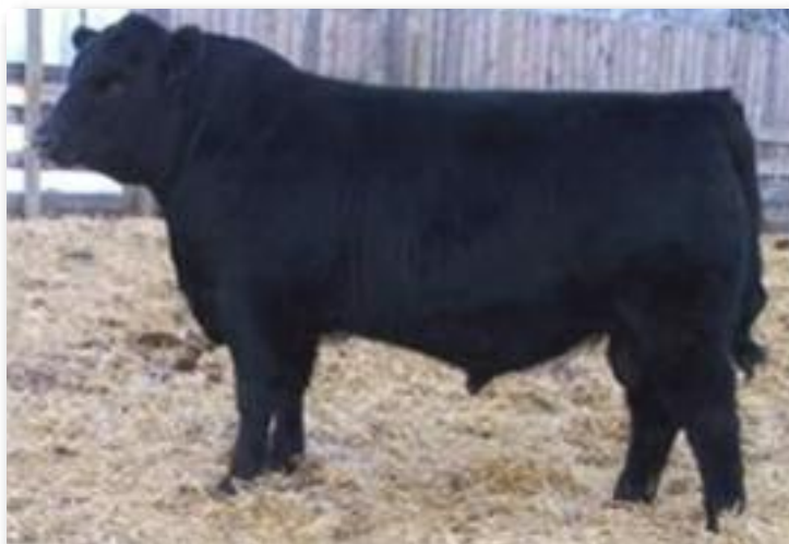
Dwajo Dutch 65P - Maternal Grandsire of 171X