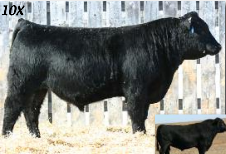
Inset - Windy 43'05 - Maternal Grandsire to 10X