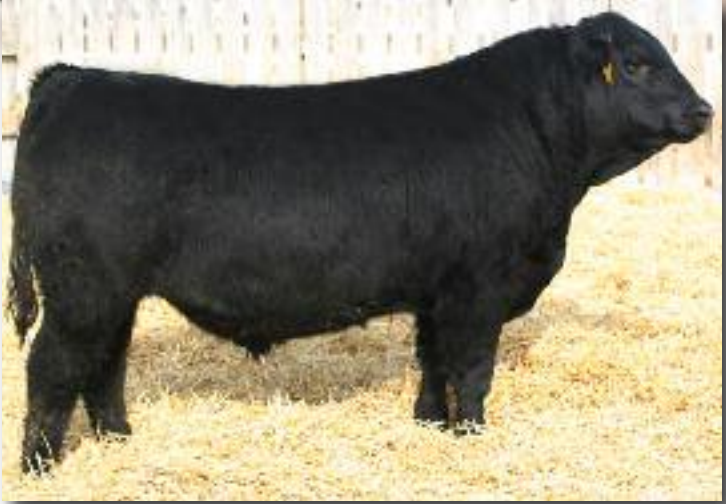
Merit 9624 - Maternal Brother to 148X