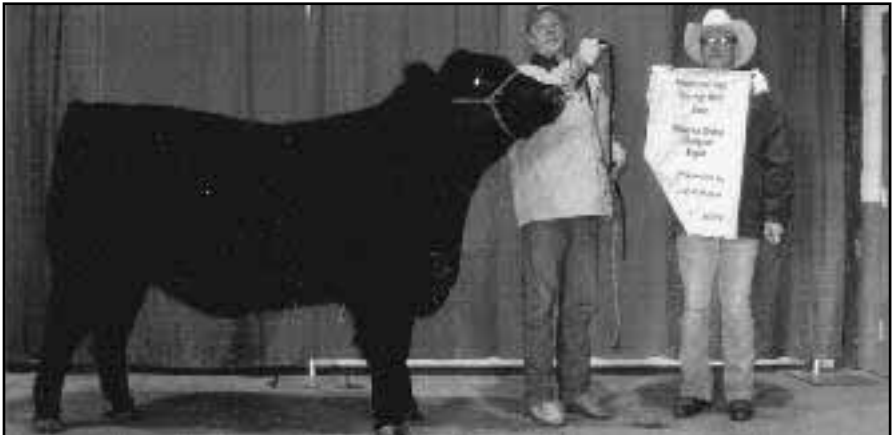
2009 Reserve Champion Angus - C&N NETWORTH 7U