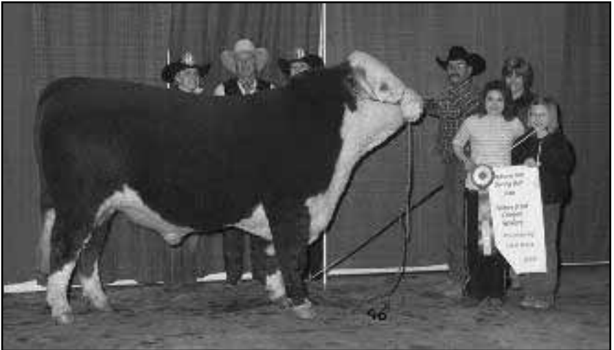
2009 Reserve Champion Hereford - BBSF 46P TURIN 219T Owned by: Brost Land & Cattle Co Sold To: Misty Valley Farms, Maidstone SK for $8,250.00