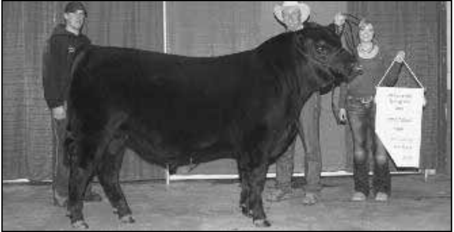
2009 Grand Champion Angus - REID ANGUS ADVANTAGE 11U Owned by: Reid Angus

Sold to: Dennis Gabinet, Calgary for $11,700.00