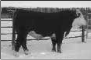
BBSF 68R ULTRASOUND 5U