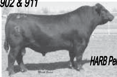
HARB Pendleton 765 JH