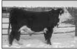
BBSF 218S UNUSUAL 293U