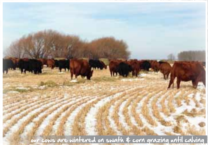
our cows are wintered on swath & corn grazing until calving

Black Ridge was the choice lot in our 2015 bull sale, Blair's. Ag selected Blueprint and we kept Black Ridge. We are extremely impressed with his calving ease and yet marketable performance in his offspring. 8D has some outcross genetics with Commander Bond the Scottish influence. Calving ease specialist.