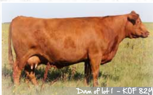
Dam of lot 1 - KOF 82Y

Every year, you have a bull that just stands out when you go to the pastures. Here is; Top Secret has a stout profile, wide based, eye appeal and is a soft made individual. Top Secret's dam is a picture perfect Ribeye female whose dam is making a mark at Mar Mac and will join our Donor female team. The Ribeye females are very hard to beat with loads of depth of rib, volume, and milking ability. When Mar Mac goes to buy a herd bull, the dam is also evaluated. I am sure if you check out this pair there will be no doubt in your mind of the genetic potential here. A herd sire prospect that puts it all together. You will drive the wheels off your truck looking for a herd sire prospect like Top Secret, he is the cowboy kind.