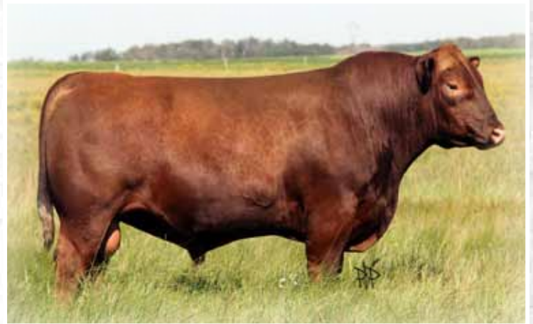
Red Cockburn ref RIBEYE 346U 1481970 CWJ 346U FEB/12/08