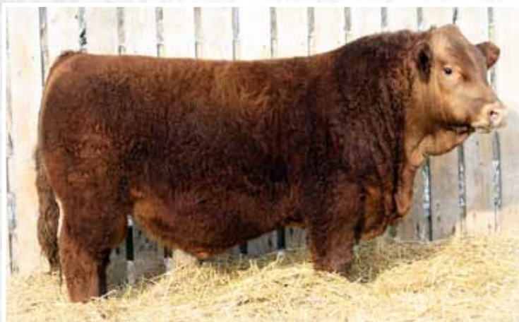
ref IPU MARKSMAN 54A PG791487 IPU 54A JAN/24/13