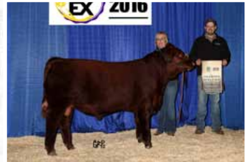
Lot 5 Zeppelin son - Bull Calf Champion