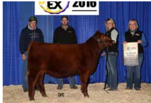
Capacity daughter - Heifer Calf Champion