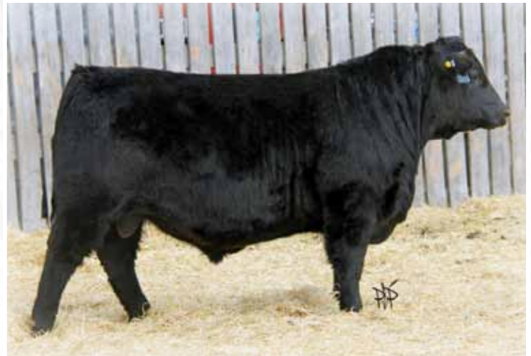
ref Corner Glen INSIGHT 50C 1892122 DWJ 50C MAR/16/15

This is the first set of calves out of Black Ridge and boy are we happy with his calving ease, and yet a strong end product. A Cedar Ridge son out of our donor female McRae's Bridget 125T.