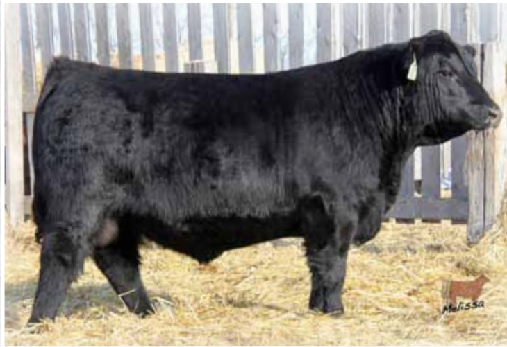
ref Mar Mac BLACK RIDGE 15B 1814565 KOF 15B JAN/25/14