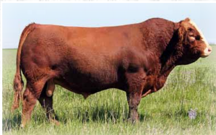
ref Mar Mac JOHNNY CASH 102A PG782483 KOB 102A FEB/14/13

Tombstone is not with us any more but we still have a reserve of semen that we will continue to use. Many of the feature daughters in our New Generation Female sale were Tombstone daughters and reports are excellent.