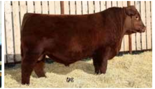
Flying K Red Angus high selling bull was out of a Mar Mac bred female.