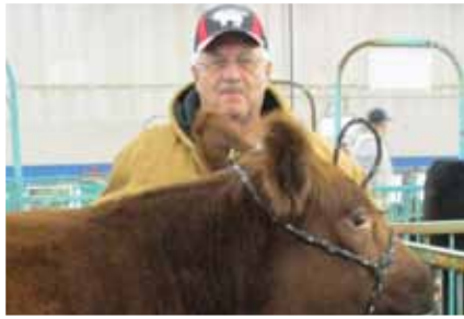
Ravenbrook Angus selected the high selling Red bred at Keystone Classic Sale