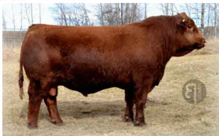
ref MRL PREDESTINED 63B PG846266 MRL 63B JAN/13/14

In our search for some new genetics, we came across Marksman. A strong maternal dam, and going back to the Trademark son of Kopp Farms. His first 2 calf crops have left thick made, meaty progeny that are working well in our program.