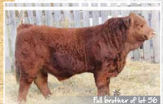
Fall brother of lot 56