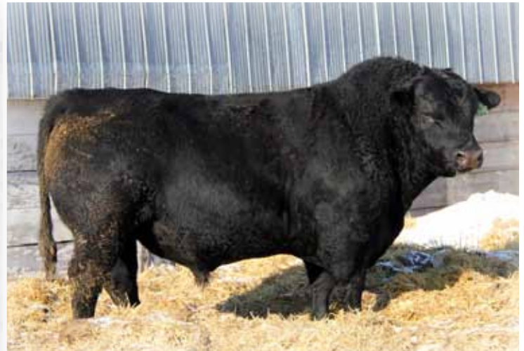
ref Mar Mac TIGER 170A 1734623 KOF 170B MAR/16/13