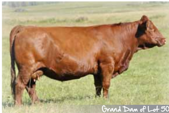
Grand Dam of Lot 50