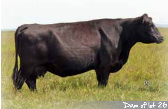
Dam of lot 26