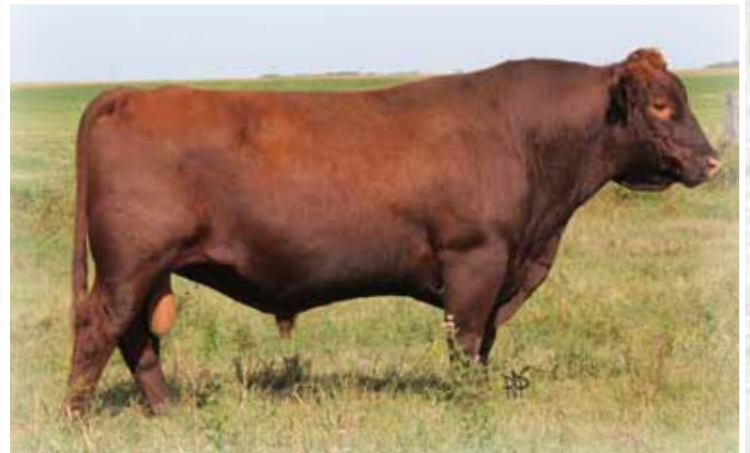
Red Mar Mac ref SPARTAN 81A 1734586 KOF 81A FEB/09/13