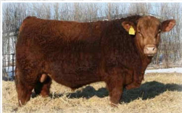
ref Swan Lake TOMBSTONE PG742340 JVB 40Y FEB/02/11