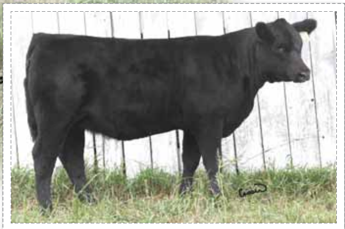
10A ~ MCC Lady Lawn 74A