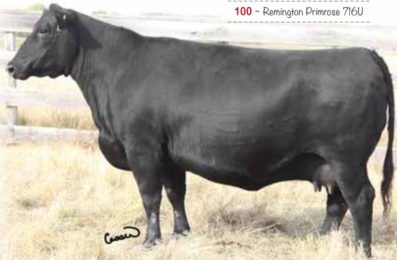
100 ~ Remington Primrose 716U

Ebon Hill Blackcap 509'03 was selected from the Ebon Hill Dispersal as one of the top Matrix daughters. Bull calf March 22/13, BW 89 lbs. and not in the sale.