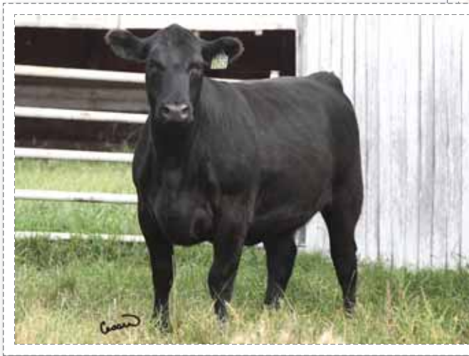
88 ~ MCC Victoria 126Z