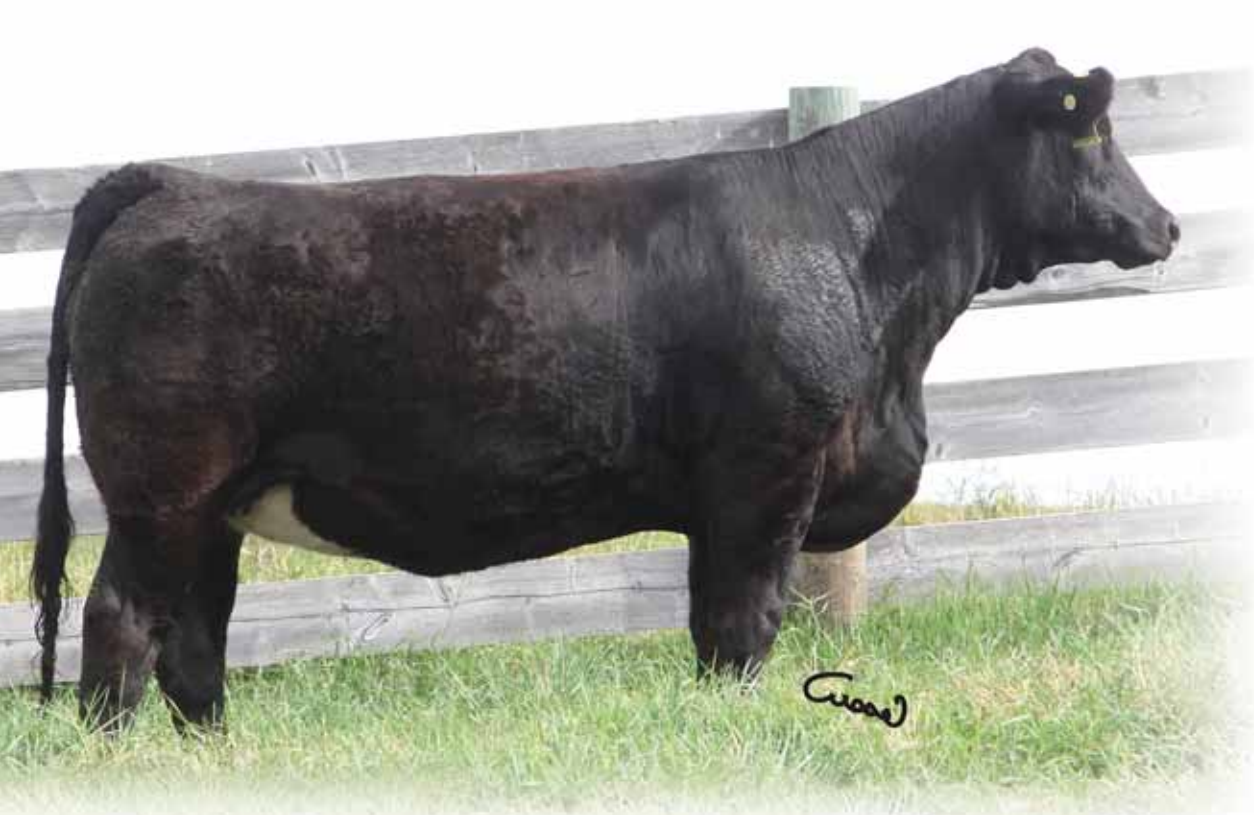
155 ~ Majestic Miss Candace 6Z