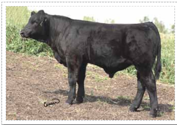
154 ~ Majestic Red Label 116A