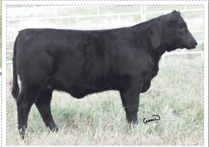
52A - MCC Andee 24A