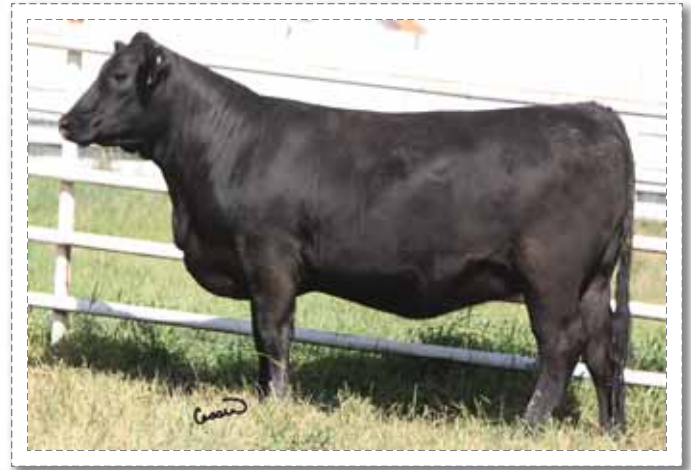
77 - MCC Pride Lady 1172