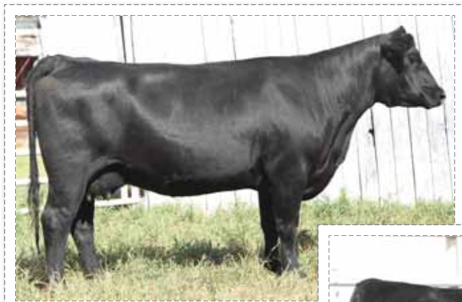
36 ~ KFC 7S Britta 9826W

Female JJJH 18A March 16/13 Pending BW: 83 lbs. Sire: Remital Prowler 821U -1435373-