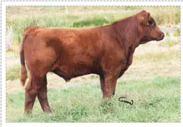
159A ~ Majestic Specialist 91A

Polled Red PB Male JJH 91A March 31/13 BW: 88 lbs. Sire: IPU Red Specialist 70T