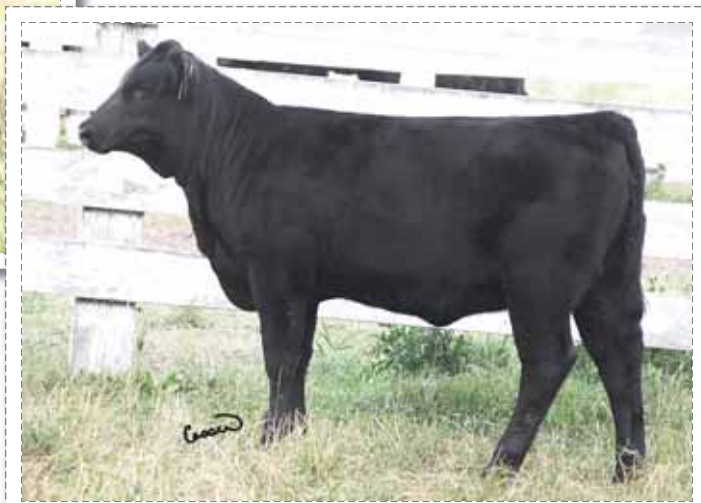
44A ~ MCC Miss Rainmaker 49A