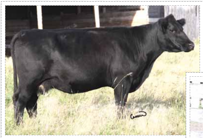
44 - KFC 6135 Miss Rainmaker