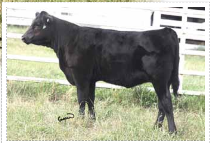
7A - MCC Lady Lawn 29A