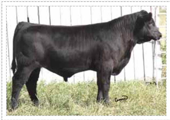
112A ~ MCC Casey 14A