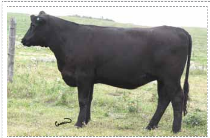
195 ~ Majestic 407D 214Z