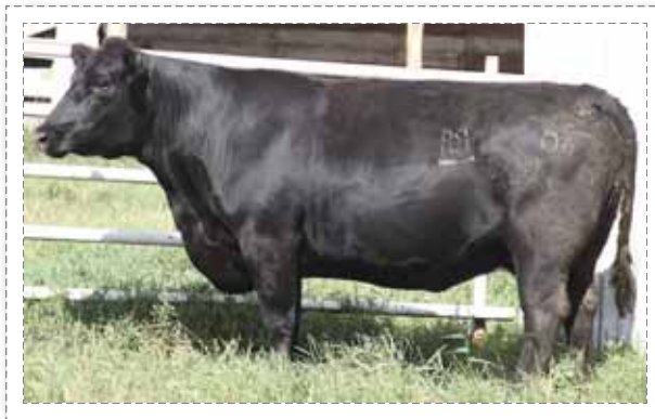
116 ~ Remington Lassie 196S

Sire: Remington Predestined 7S -1315610-