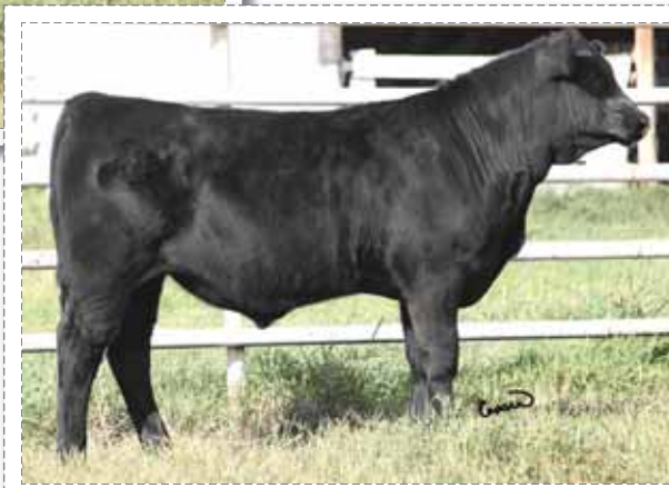
36A ~ MCC Casey 80A

Male JJJH 41A March 26/13 Pending BW: 83 lbs. Sire: Remital Prowler 821U -1435373-