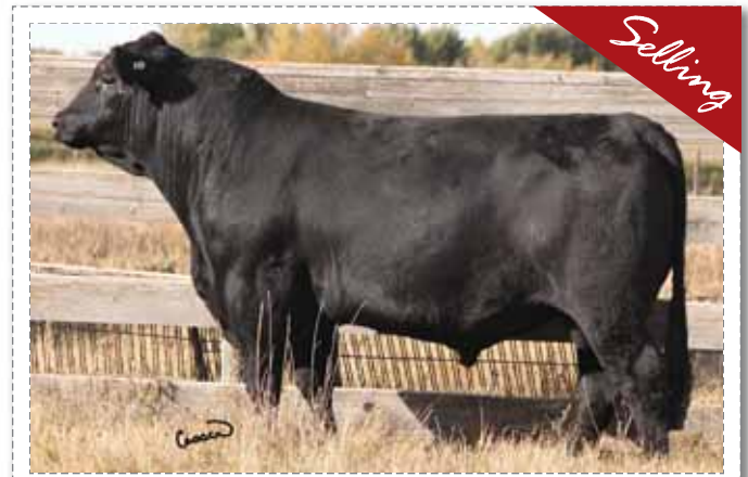
F ~ Sheidaghan Right Time 472

Rosebud 115F's progeny dominated at the World Angus Forum making her the World Angus Forum Premier Dam. Crescent Creek Rosebud 115F was the lowest birth weight of the 2060 daughters and passed this trait on to her progeny. Service sire to all the yearling heifers.