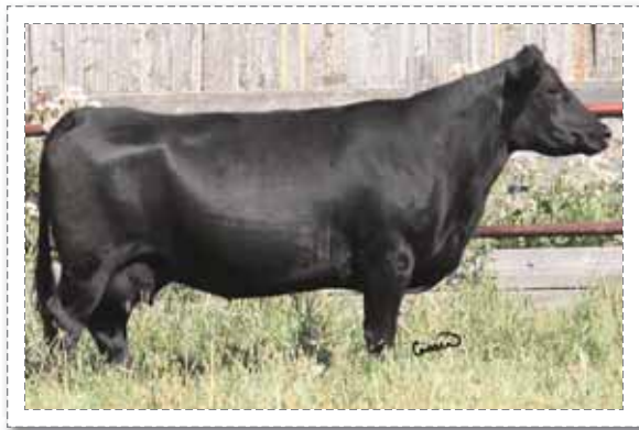
119 ~ Crowfoot Rose Lee 5705R