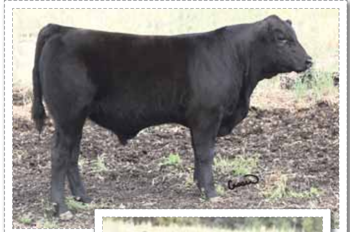
5 ~ MCC Density 89A