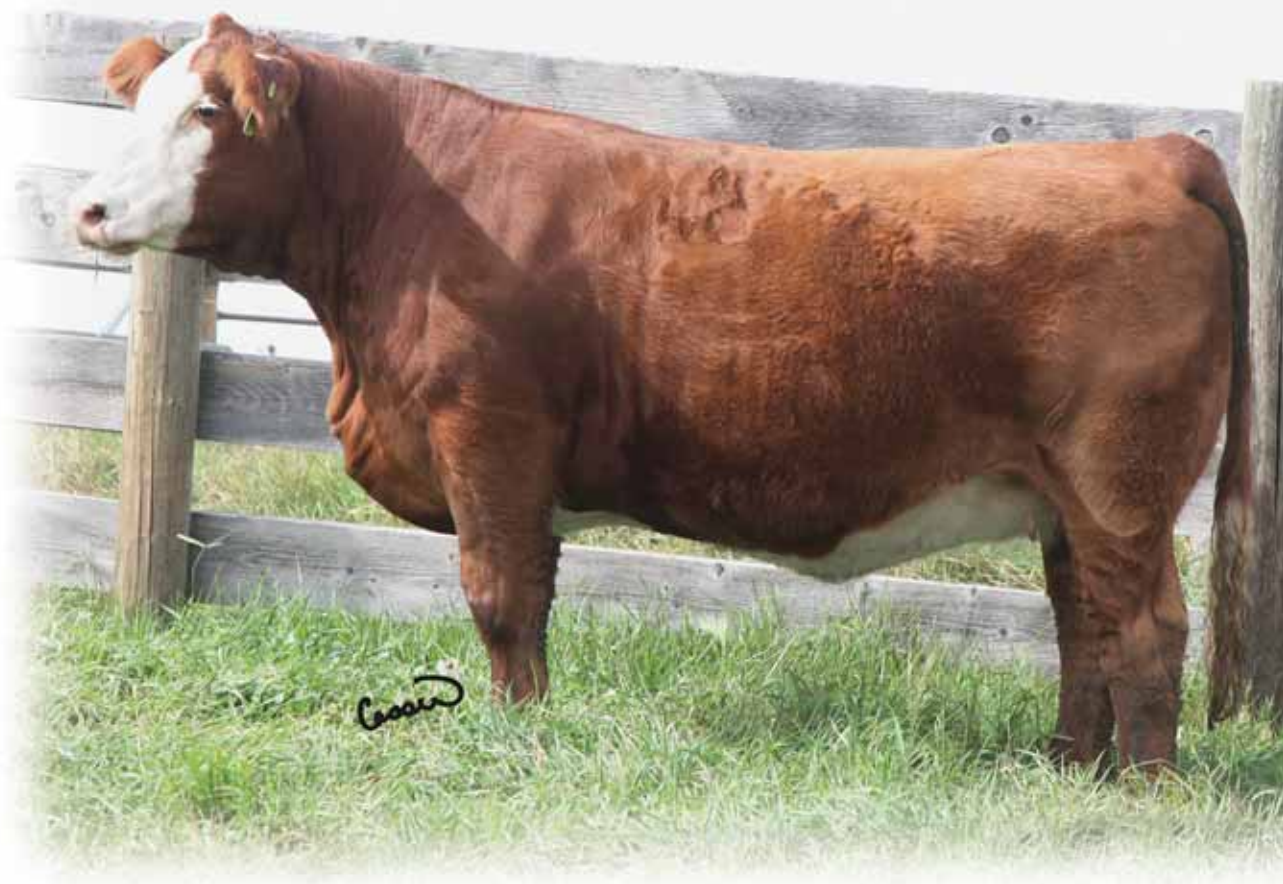
152 ~ MCC Miss Candace 10Z