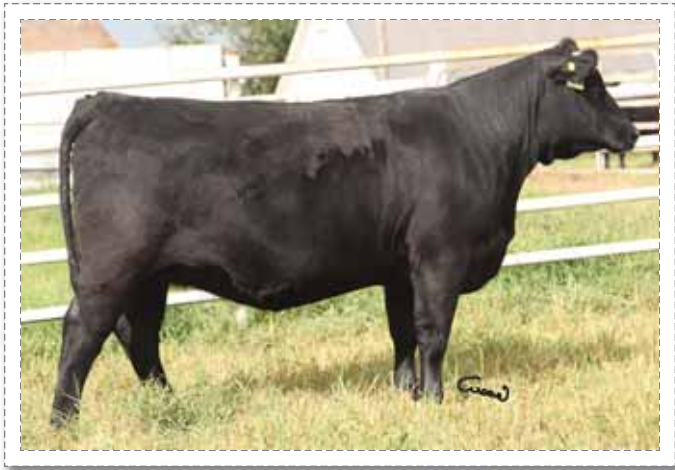
79 ~ MCC Burgess 1362