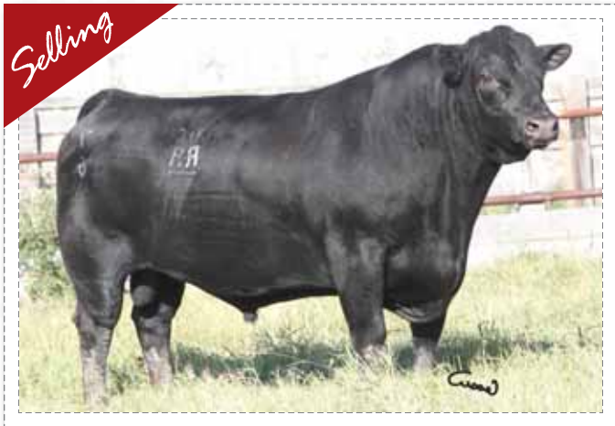
B ~ Remington Predestined 7S

Check out the outstanding yearling daughters of Casey 075 in this dispersal.