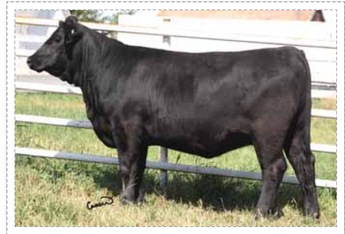
89 ~ MCC Bandolier 152Z

Exposed: May 31 to Aug. 14/13 to Sheidaghan Right Time 47Z - 1673709-. 199 days on Sept. 25/13.