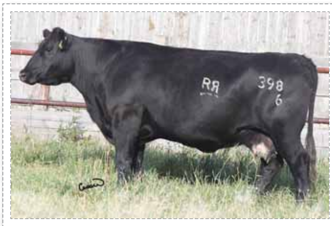
115 ~ Remington Ideal 398S