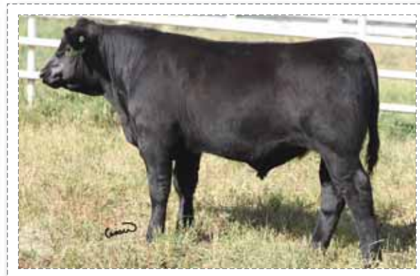
116A ~ MCC Predestined 93A