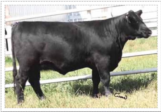
80 ~ MCC Andee 3Z

Exposed: May 31 to Aug. 14/13 to Sheidaghan Right Time 47Z - 1673709- 110 days on Sept. 25/13.