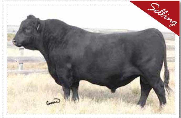
E ~ SAV Worldwide 9088

SAV Abigale 5650 is a great daughter of 004, one of the best at SAV in Kelly Schaffs opinion and the grandam, SAV Abigale 0451 is SAV Bismarck's mother. SAV Worldwide is a massive deep easy fleshing bull from a great cow family.