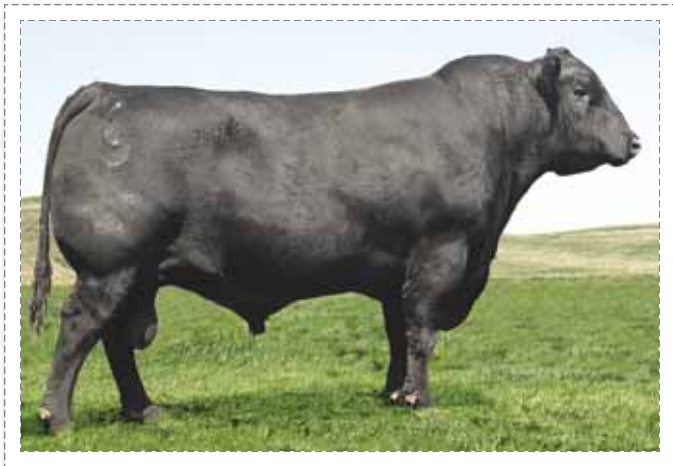
Sitz Alliance 6595 ~ Grandsire of Remitall Prowler 821U