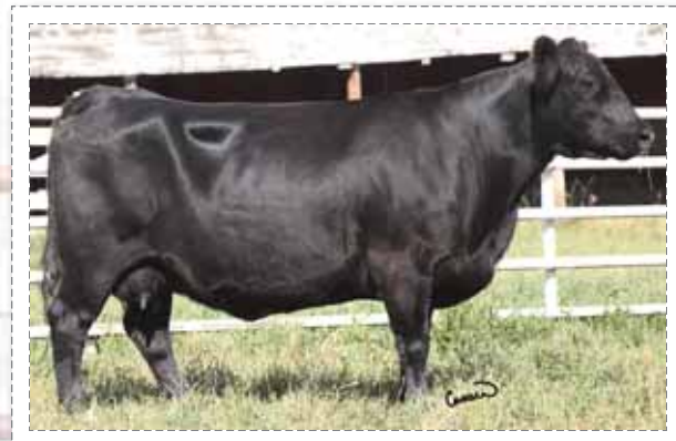
129 ~ Barnett Dana 43M