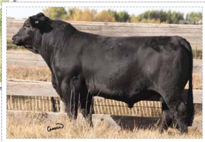
Sheidaghan Right Time 472 ~ Yearling heifer service sire