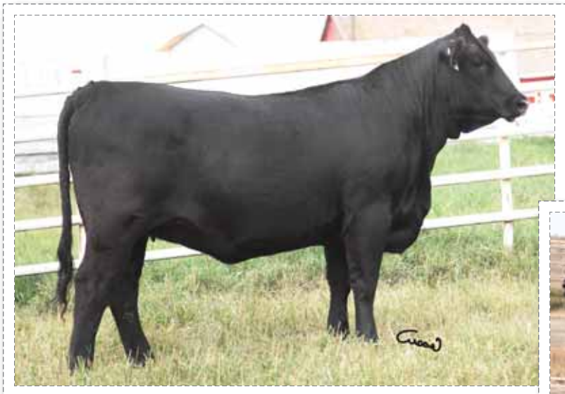
72 ~ MCC Errolline 612