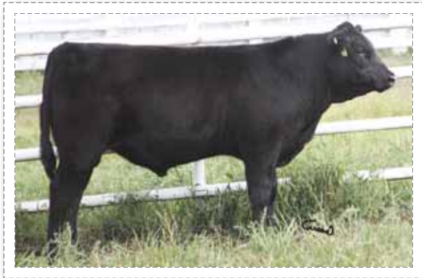
131A ~ MCC Prowler 20A