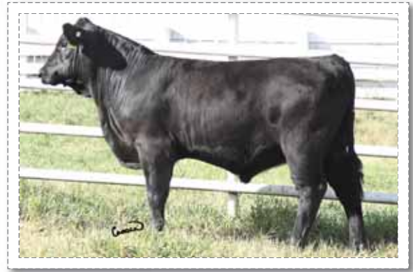
105A ~ MCC Prowler 51A