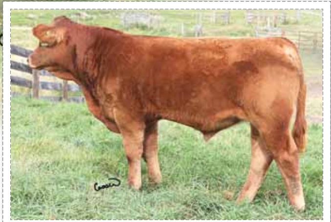
150A ~ Majestic Specialist 27A

Polled Red PB Male JJJH 27A March 20/13 BW: 100 lbs. Sire: IPU Red Specialist 70T