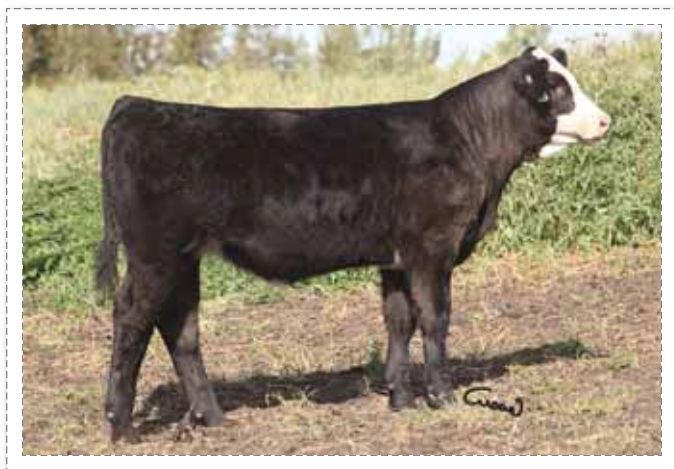
177 ~ Majestic Miss Knight 66A

1/2 Angus Female Sept. 20/13 BW: 98 lbs. Sells with dam Sire: Worldwide