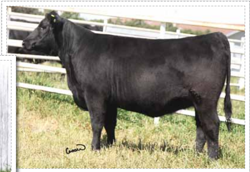
90 ~ MCC Minnie 155Z