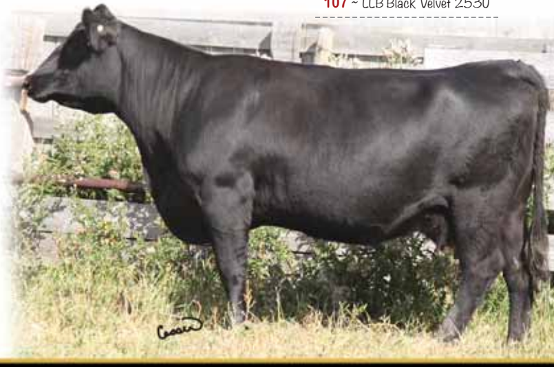
107 ~ LLB Black Velvet 253U