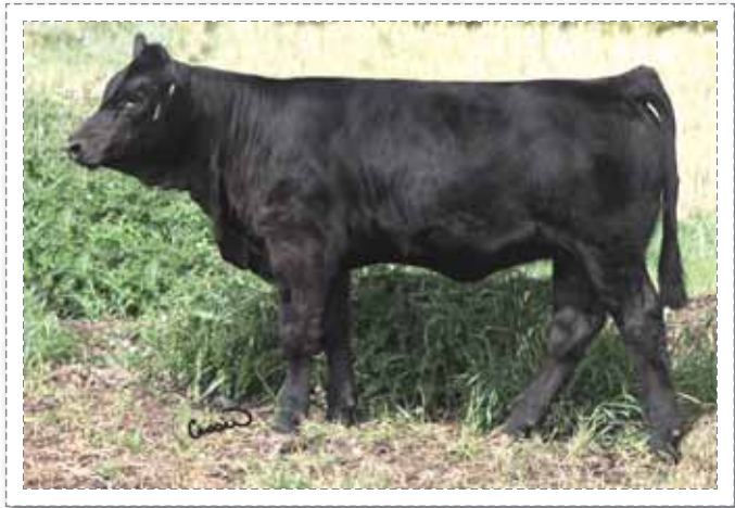
178 ~ Majestic Miss Knight 72A