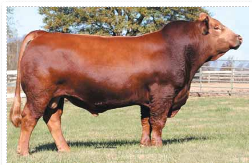
Ankonian Red Caesar

A calving ease bull, that adds performance and muscle, daughters are high quality uddered females. 70T has been used in a couple of big commercial A.I. heifer programs. Specialist 70T was selected from the 2008 Labatte Bull Sale. He is a sleep easy calving herd sire that has been extremely consistent. Specialist does the complete job calving easy performance and stylish daughters with absolutely perfect udders. His progeny tell the whole story. Here is an opportunity to buy a leading herd sire.