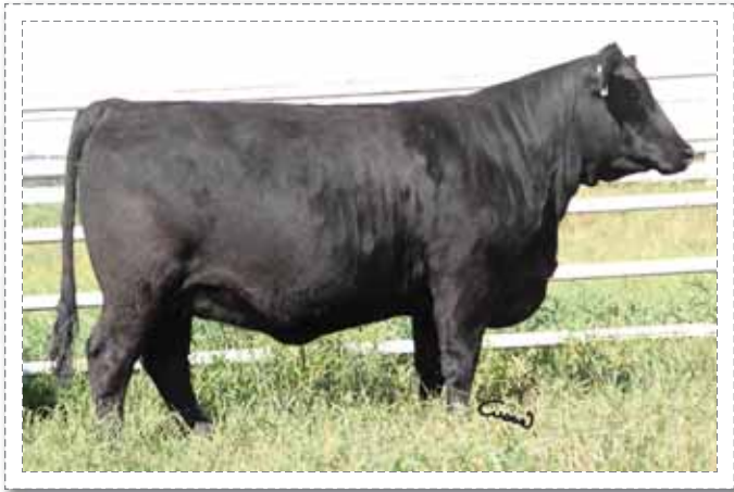
19 ~ MCC Blackbird 44X