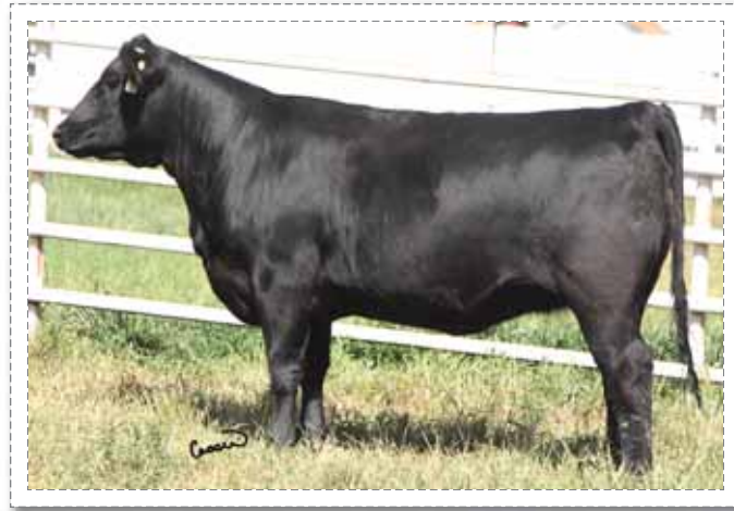
81 ~ MCC Erica 222

Exposed: May 31 to Aug. 14/13 to Sheidaghan Right Time 47Z - 1673709- 110 days on Sept. 25/13.