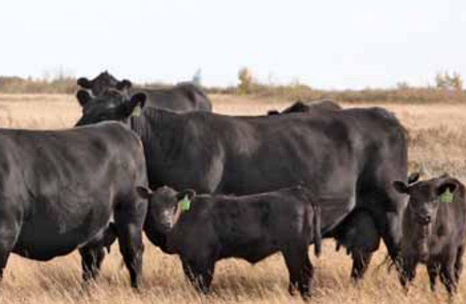
144~ MCC Spartan 15Z