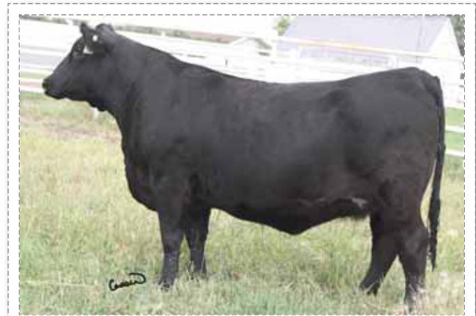
2 ~ MCC Keepsake 42

Exposed: May 31 to Aug. 14/13 to Sheidaghan Right Time 47Z - 1673709- 90 days on Sept. 25/13