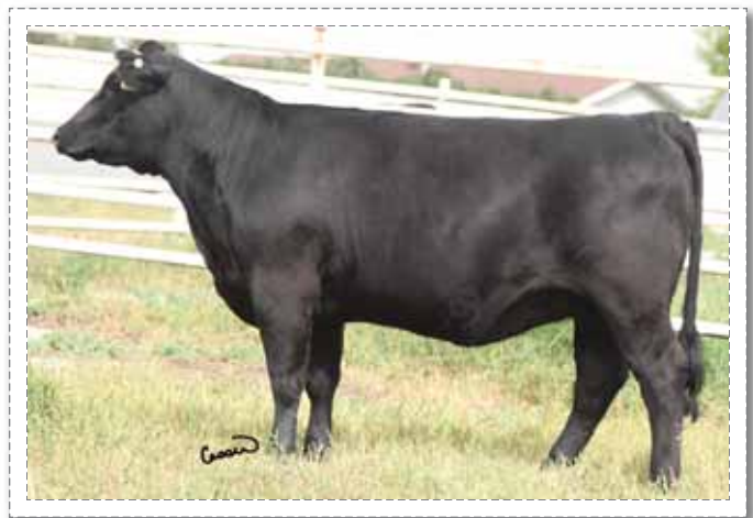
87 ~ Majestic Old Post 13Z