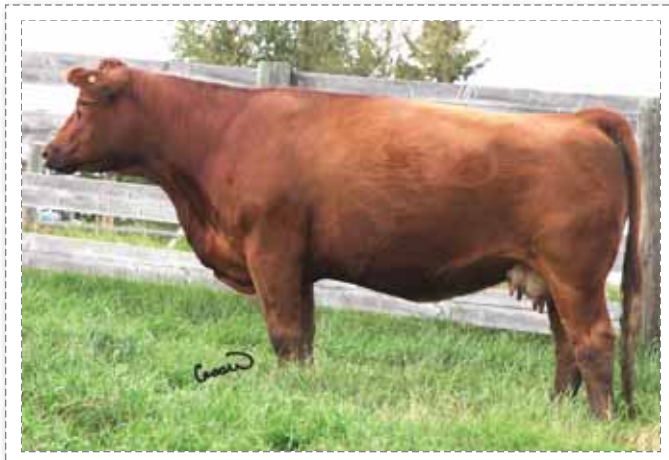
187 ~ Remington WIS GM2 503X

1Z, is a solid black polled bull with an 80 lb. birth weight and is recommended for heifers.