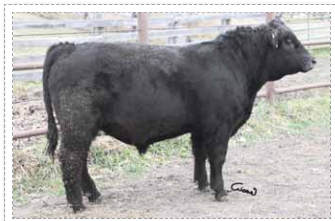
142~ MCC Repetition 206Z