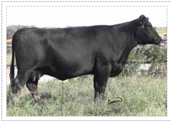
110 ~ Remington Eugenie 9T