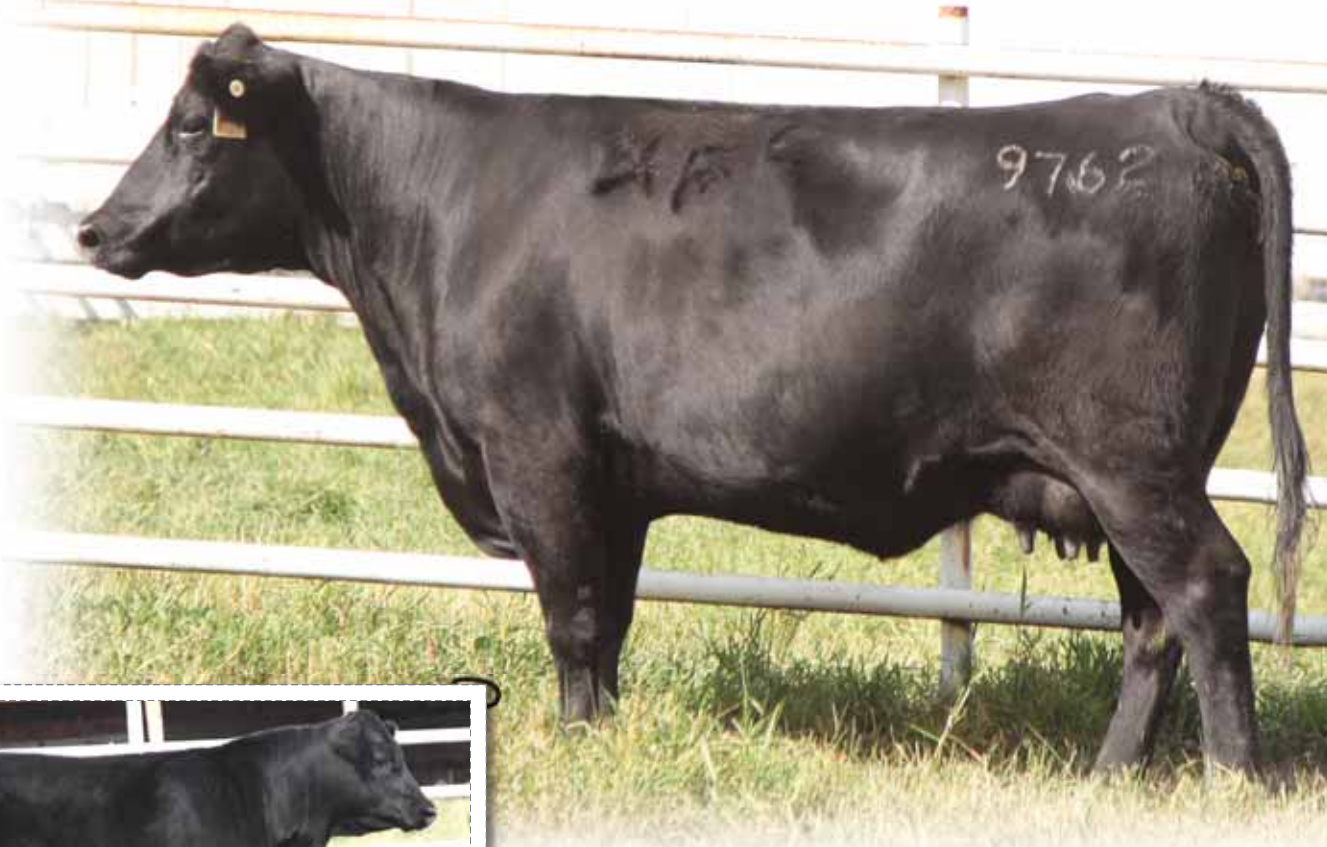
28 - KFC 5899 Dana 9762W