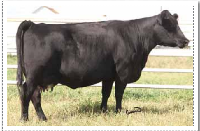
30 - KFC 6595 Blackcap 9777W

Male JJJH 36A March 21/13 Pending BW: 83 lbs. Sire: Remitall Prowler 821U -1435373-