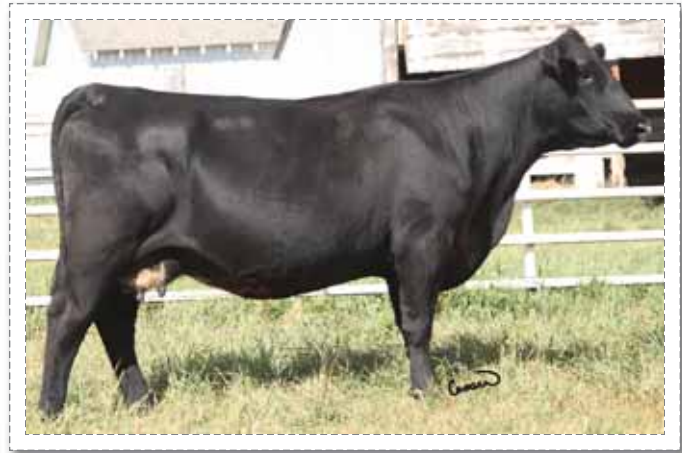
39 ~ KFC 5899 Errolline 9765W

Male JJJH 44A March 22/13 Pending BW: 95 lbs. Sire: Benchmark Casey 075 -1576478-