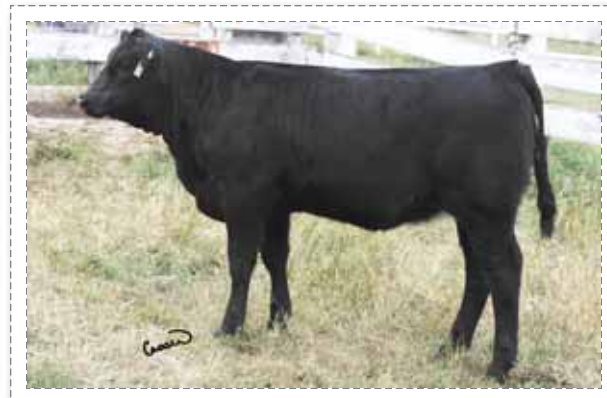
122A ~ MCC Pearl 131A