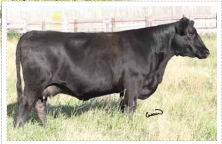
1 ~ MCC Keepsake 27X