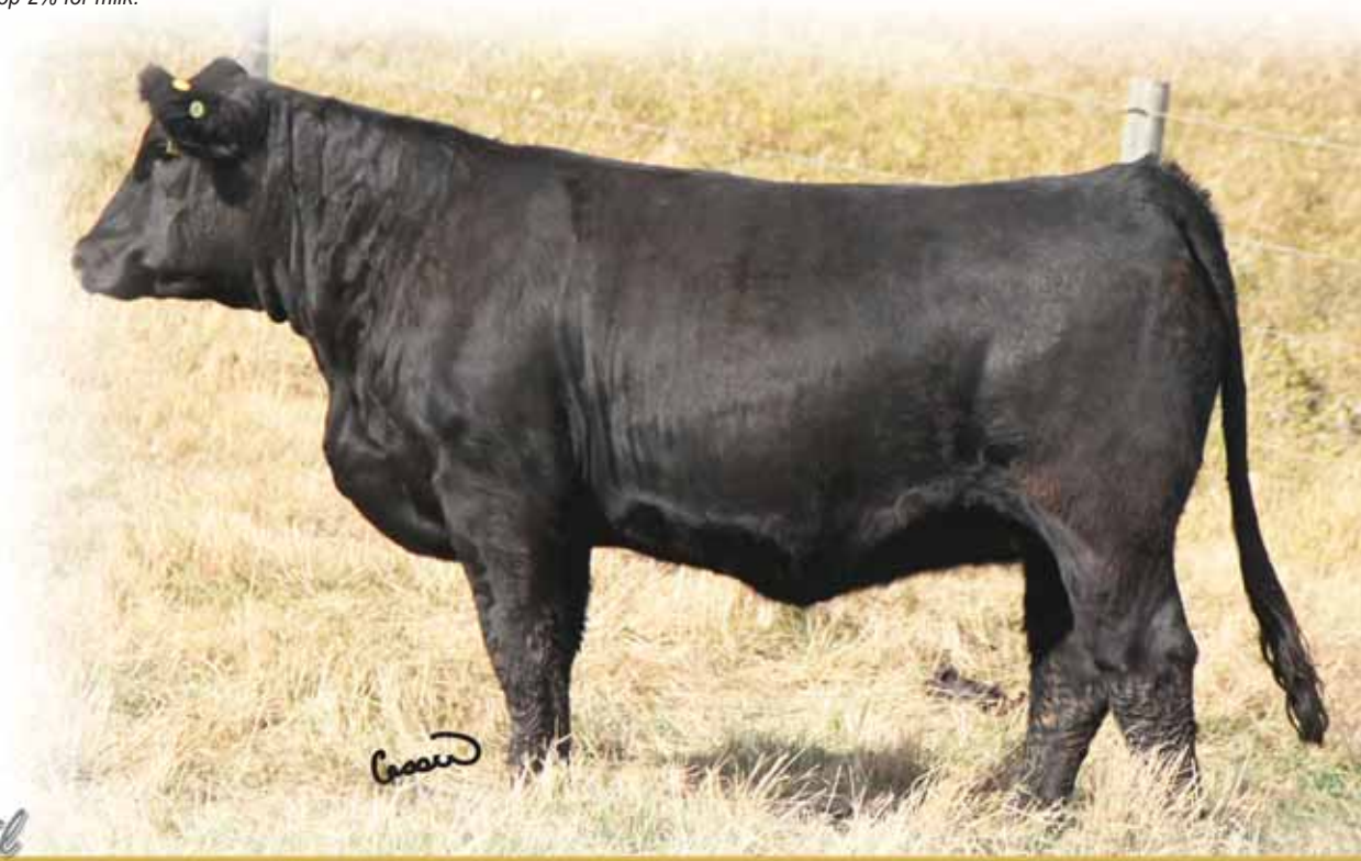
156 ~ Majestic Miss Candace 47Z