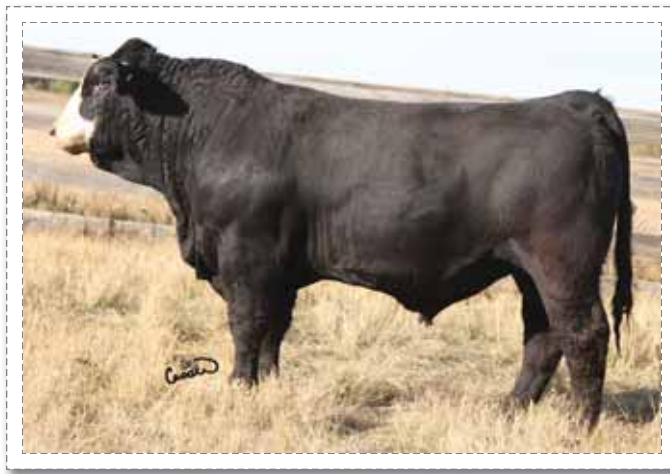
153 ~ Majestic Milestone 81Z