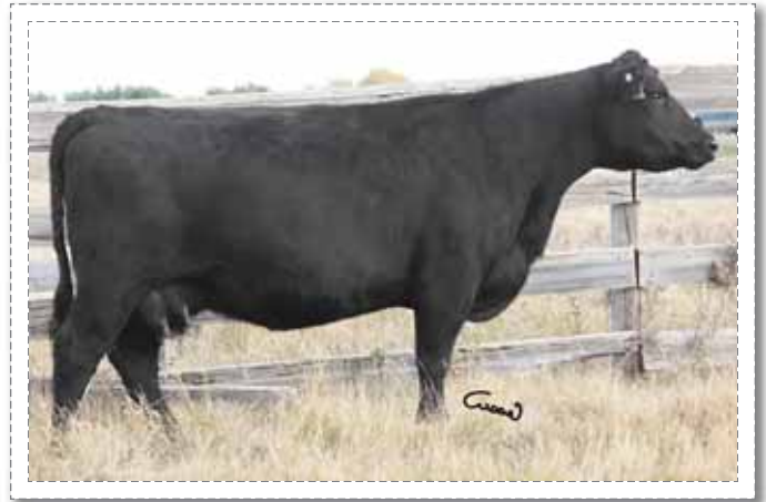
21 ~ Remitall Blackbird 642U