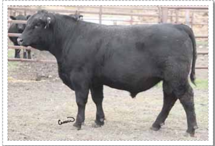
137 - MCC Repetition 1932