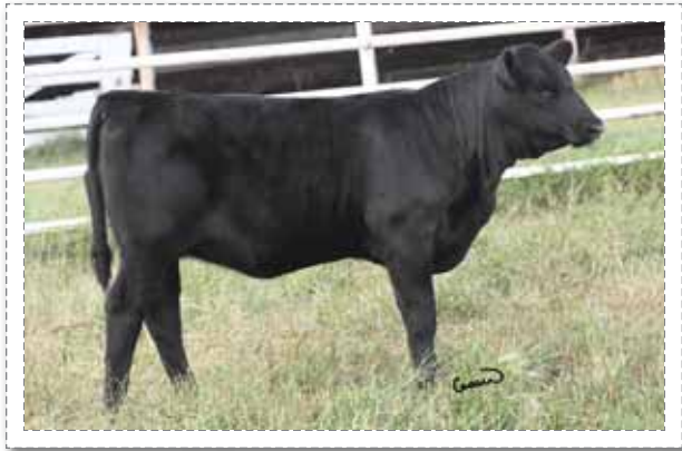
99A ~ MCC Pride Lady 132A