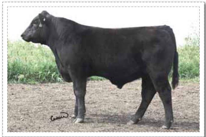
6 ~ MCC Density 117A