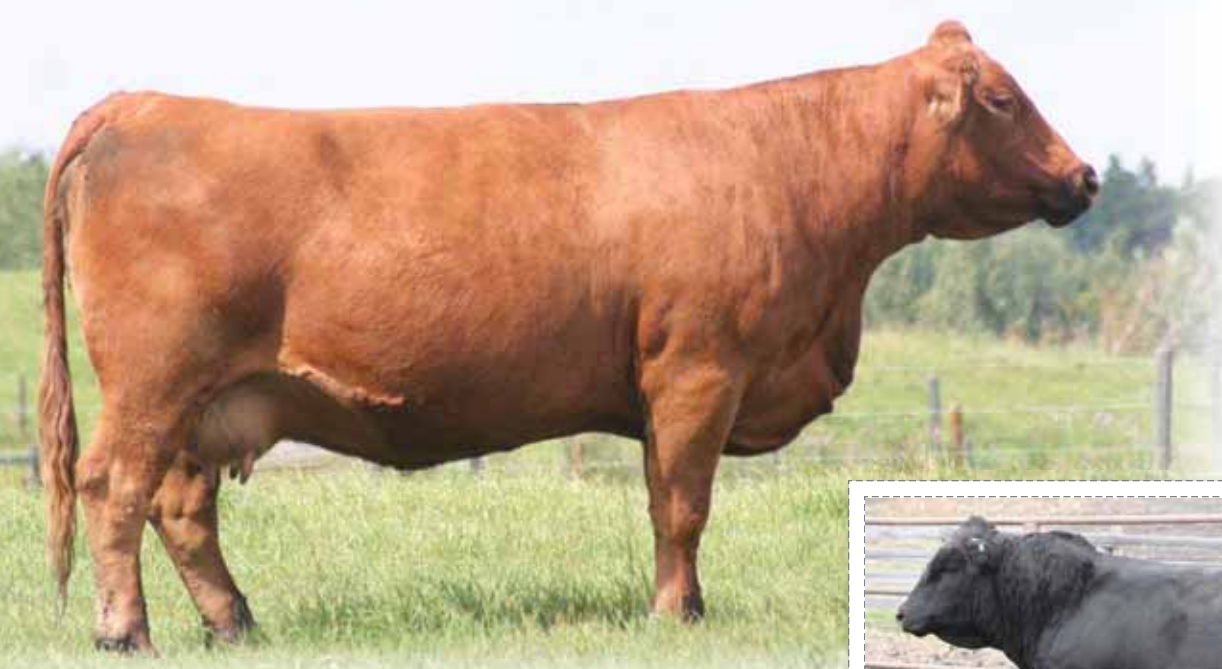
171 ~ Ankony Ms Jacquelyn R132