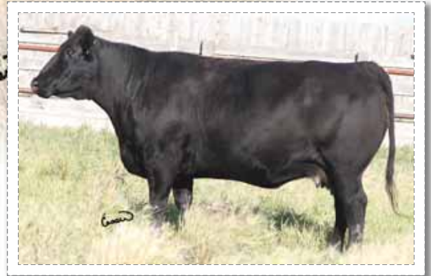
126 ~ SLC 235P