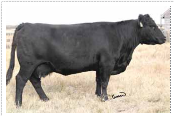
8 ~ Remington Lady Lawn 396W

Lady Lawn 235W, a sensational straight Canadian female whose sire is the immortal Double AA Old Post Bandolier. Her dam is the ideal Angus cow Remington Lady Lawn 144R, who was the top selling female out of the 2009 Remington Spring Sale to Peak Dot Ranch, when a half interest sold for $16,000. 144R was the feature female in the Remington Dispersal and is now an elite donor cow in the French River program in Ontario.