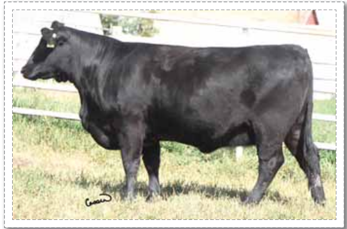
3 ~ MCC Keepsake 452

Exposed: May 31 to Aug. 14/13 to Sheidaghan Right Time 47Z - 1673709-. 90 days on Sept. 25/13.