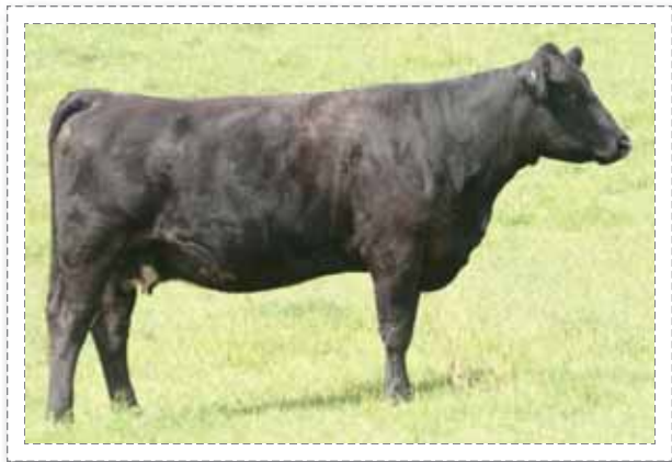
159 ~ Majestic Miss Candace 18Y