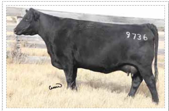
43 ~ KFC Tittania 9736W

Female JJJH 201A Aug. 30/13 Pending BW: 77 lbs. Sells With Dam Sire: S A V Worldwide 9088 -1656009-