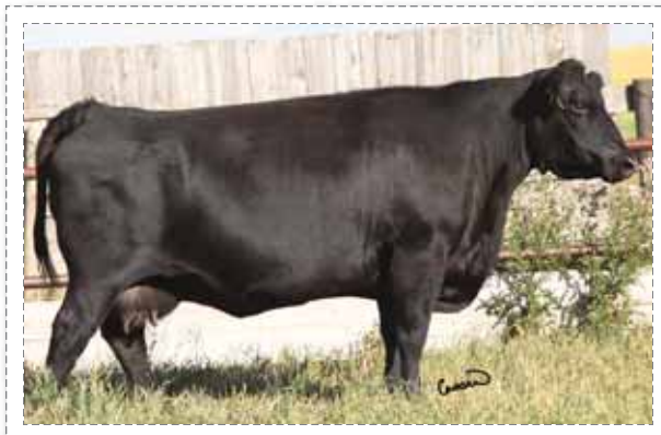
122 ~ Remitall Pearl 185P

Male JJJH 47A March 22/13 Pending BW: 81 lbs. Sire: Remitall Prowler 821U -1435373-