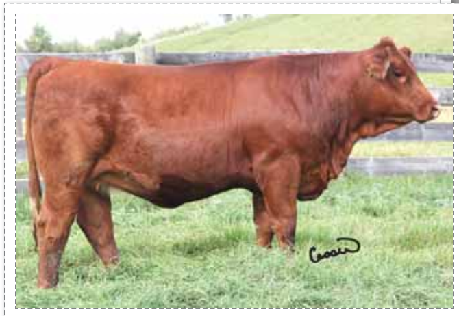
190 ~ Majestic Ms Red Cloud 168Z