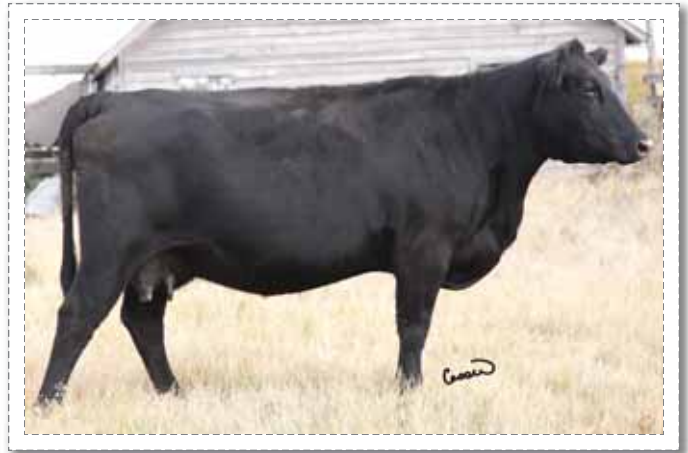
24 ~ Remington Tibbie 313U