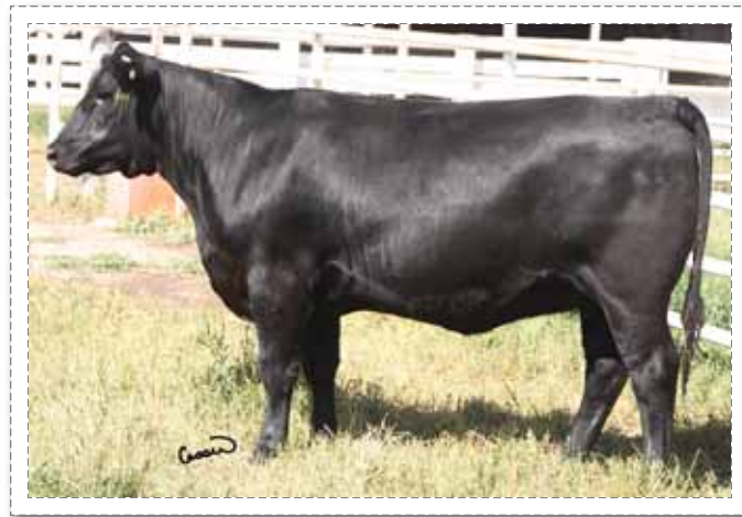
82 ~ MCC Erica 23Z