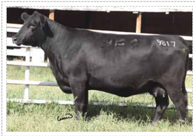
47 ~ KFC 4129 Neora 9817W

Male JJJH 10A March 13/13 Pending BW: 100 lbs. Sire: Remitall Prowler 821U -1435373-