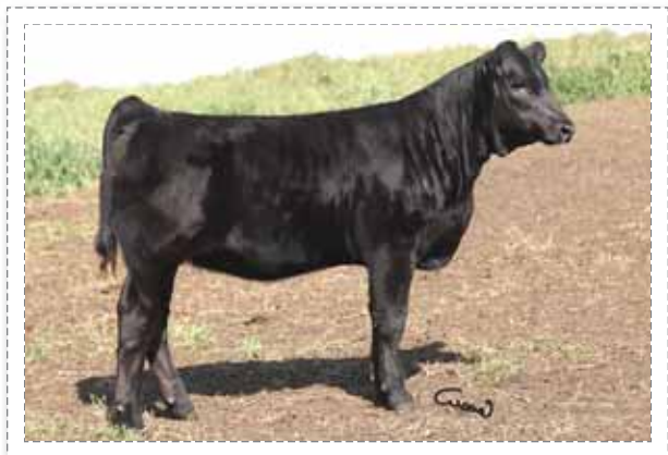
161 ~ Majestic Candace 6A

Polled Red PB Female JJH 22A March 17/13 BW: 72 lbs. Sire: IPU Red Specialist 70T