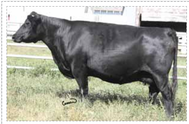
123 ~ Crowfoot Princene 4712P