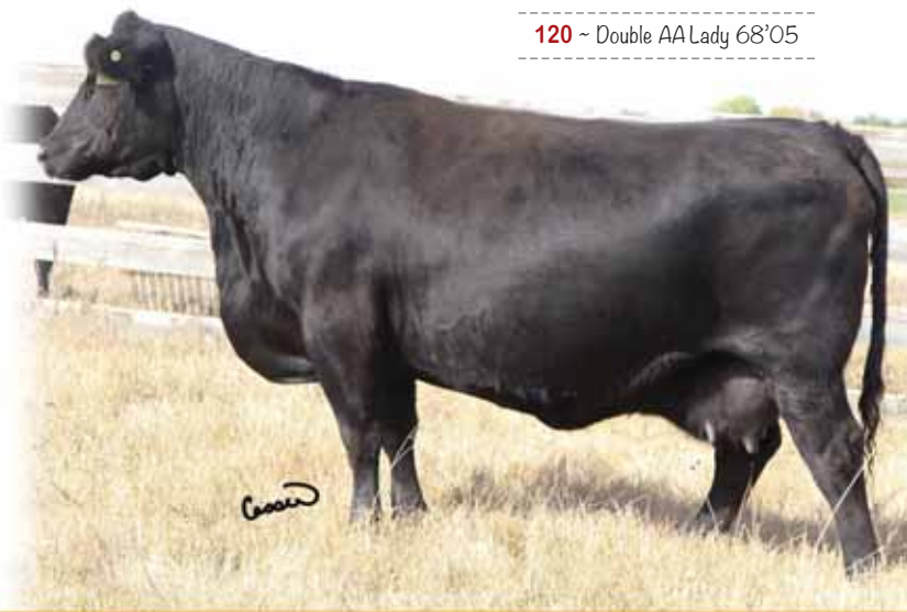
120 ~ Double AA Lady 68'05

A good cow with loads of thickness and a granddaughter of 110E, who has a number of descendants in this sale Due to calve fall of 2013 to S A V Worldwide 9088.