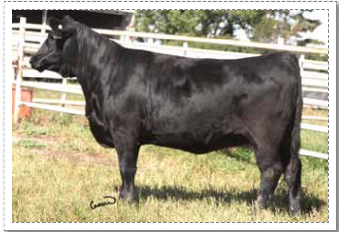
86 ~ MCC Pride Lady 20Z

Exposed: May 31 to Aug. 14/13 to Sheidaghan Right Time 47Z - 1673709-. 115 days on Sept. 25/13.