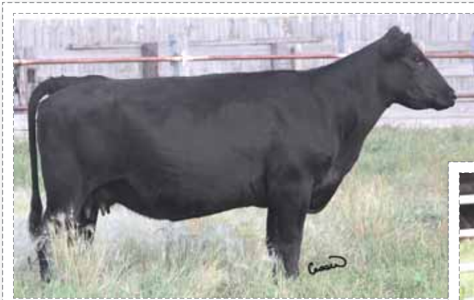
61 ~ MCC Victoria 120X