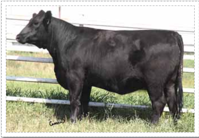
75 - MCC Katinka 762