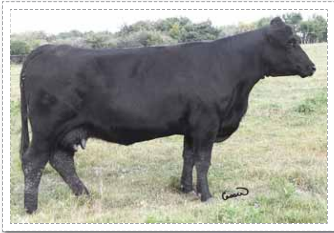
157 ~ Majestic Miss Candace