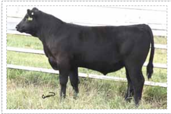
104A ~ MCC Predestined 45A