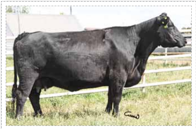
22 ~ N.B.A. Tibbie 17P 12U

Exposed: May 31 to Aug. 14/13 to Sheidaghan Right Time 47Z - 1673709- 110 days on Sept. 25/13.