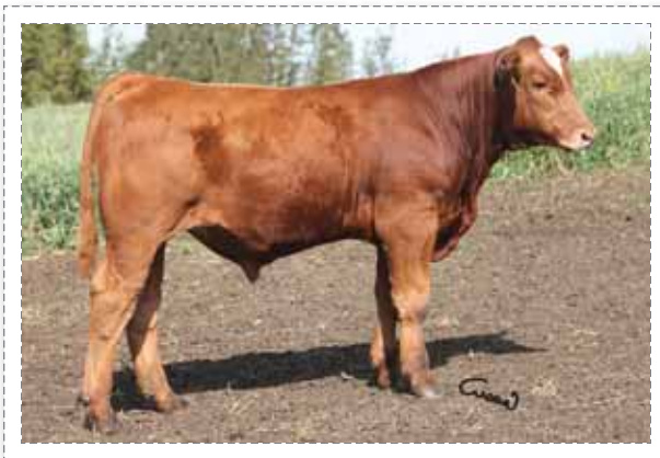
162 ~ Majestic Milestone 50A

Full sib to 18Y and 37Y. Probability of having a great udder is high because her full sister has an excellent udder, also a full sister to the bull 37Y. The Milestones have performance and still are maternal cattle.