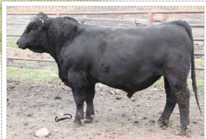
173 ~ Majestic Ranch Hand 220Z

An exceptional herd sire prospect and full brother to 218Z. Solid black polled, everything is right.