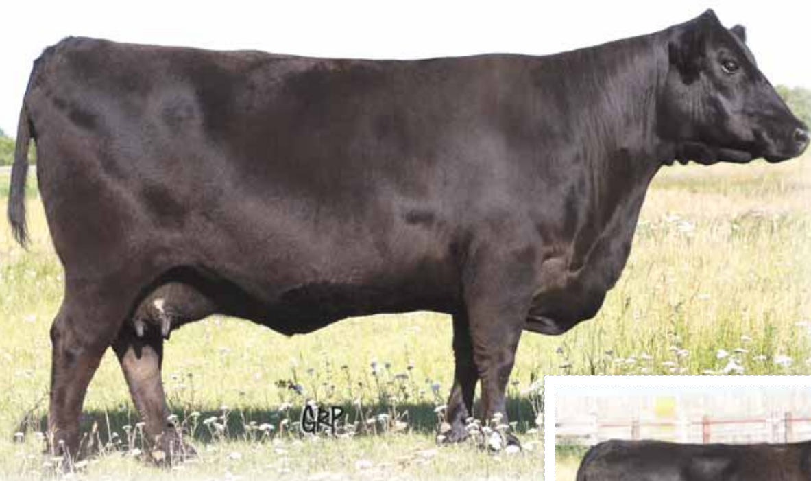
Remitall Keepsake 143L Dam of Lots 1 to 6