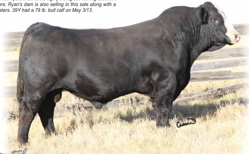
166 ~ Majestic Milestone 37Y

A black blaze faced two year old full brother to 18Y and 6A. A June ET calf with explosive growth.