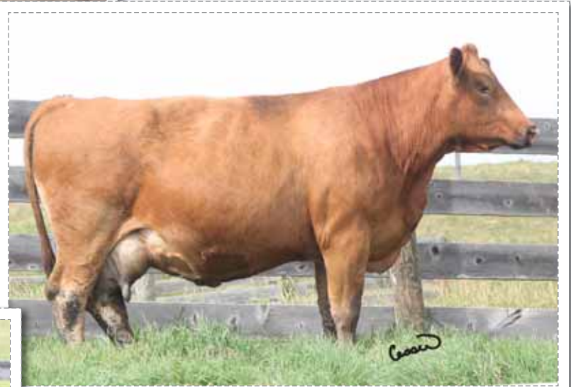
191 ~ Kimlake Monolisa 838U