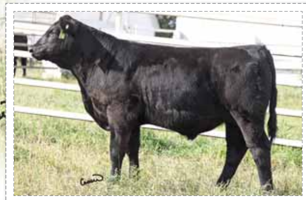
129A ~ MCC Predestined 53A