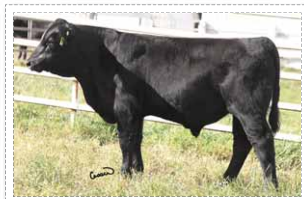
123A ~ MCC Prowler 47A