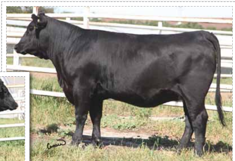
73 ~ MCC Miss Legacy 68Z

Exposed: May 31 to Aug. 14/13 to Sheidaghan Right Time 47Z - 1673709- 50 days on Sept. 25/13.