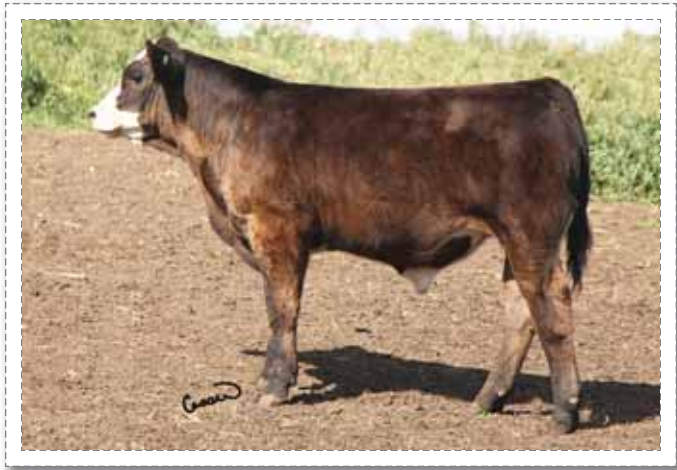
179 ~ Majestic Throttle 115A