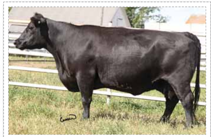
135 ~ MCC Errolline 188S

Calved March 22/13 87 lb. bull calf - commercial calf.