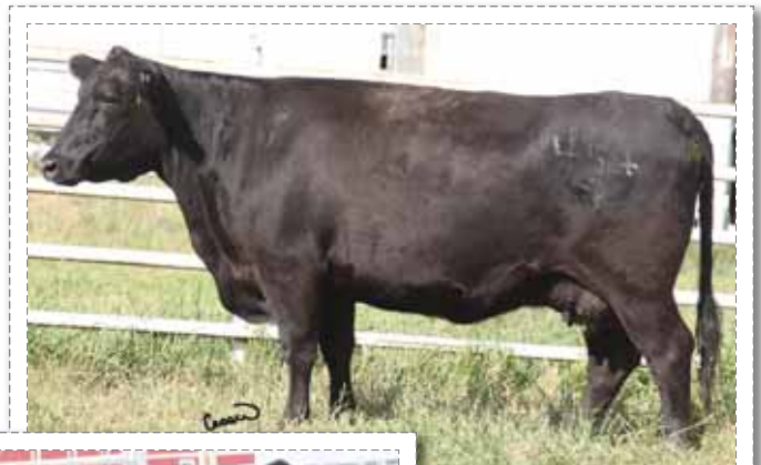
33 ~ Remington Eileen 454W

Male JJJH 77A March 29/13 Pending BW: 83 lbs. Sire: Benchmark Casey 075 -1576478-