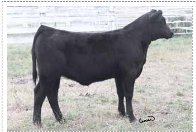
1A ~ MCC Keepsake 71A

Female JJJH 71A March 28/13 Pending BW: 70 lbs. Sire: Benchmark Casey 75X