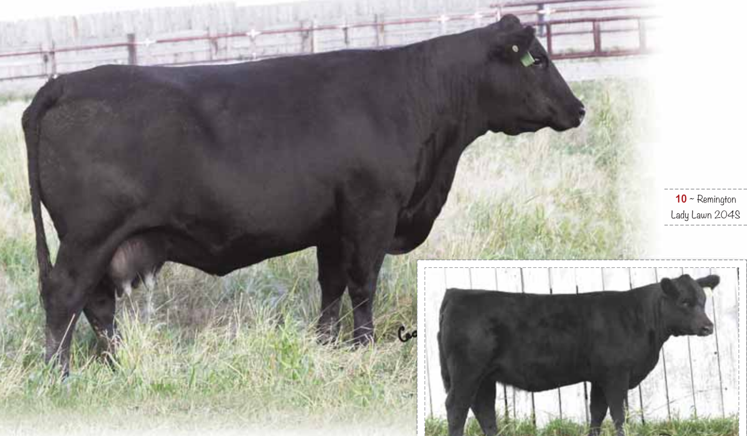
10 ~ Remington Lady Lawn 204S