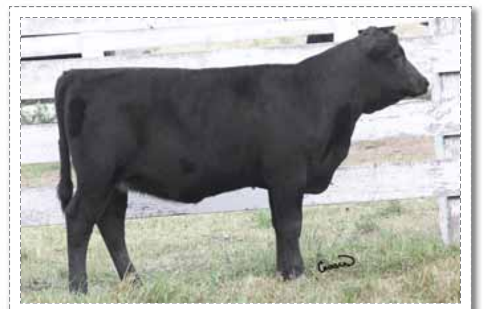
29A ~ MCC Princene 86A