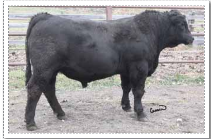
198 ~ Majestic Repetition 1922