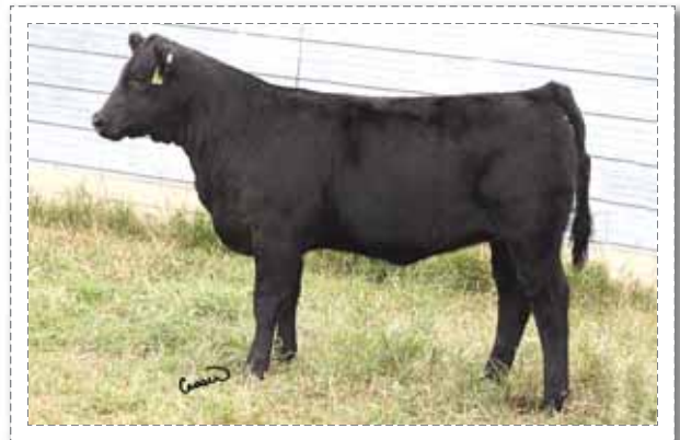
126A ~ MCC ERROLLINE I33A