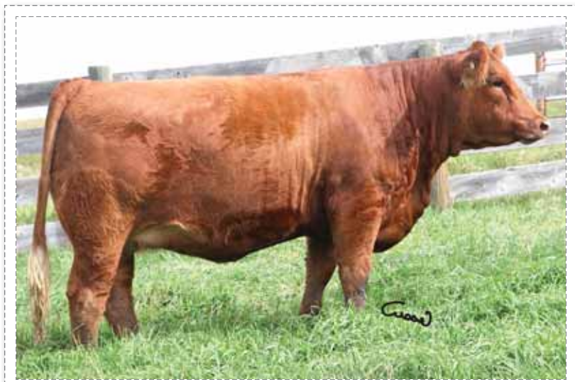
151 ~ MCC Miss Candace 52