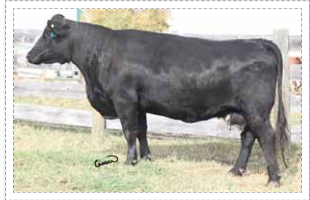
164 ~ Ankony Miss Candace S108

1/2 Angus Male Sept. 11/13 BW: 100 lbs. Sells with Dam Sells With Dam Sire: Worldwide