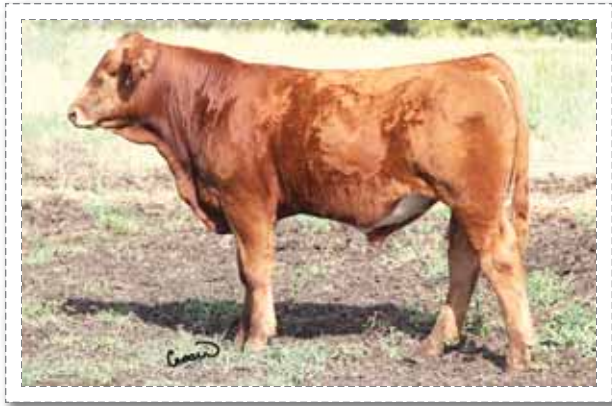
163 ~ Majestic Milestone 59A

A powerful high growth herd sire prospect.