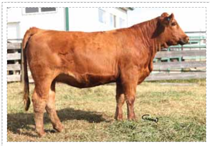
169 ~ Majestic Candace 209Z