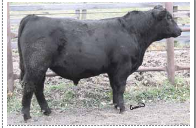
139 - MCC Repetition 1972