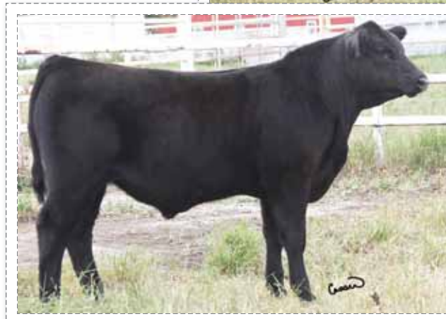
33A ~ MCC Casey 77A