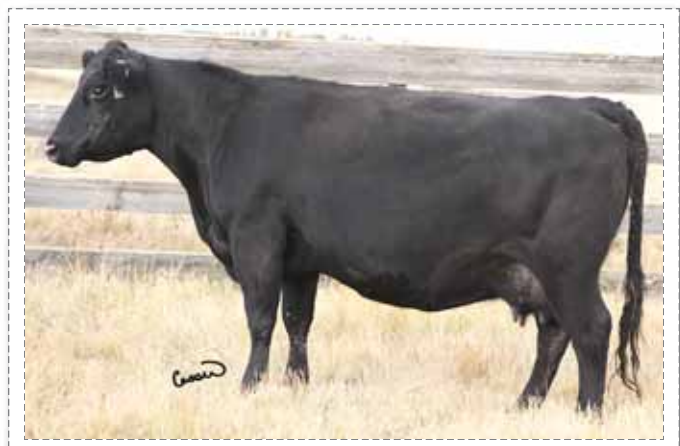
18 ~ OLSN Blackbird IIP

Male JJJH 171A July 20/13 Pending BW: 98 lbs. Sells With Dam Sire: Royal Repetition DRCC 9097W -1534550-