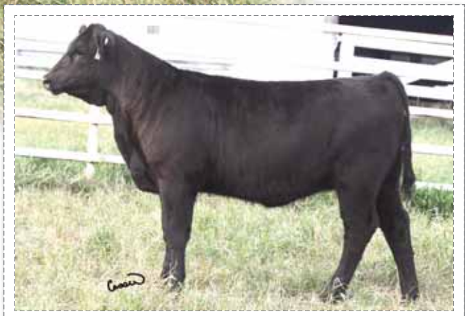
13A ~ MCC McHenry Lass I25A

Female JJJH 125A April 9/13 Pending BW: 85 lbs. Sire: Benchmark Casey 075 -1576478-