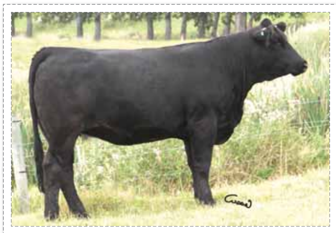
170 ~ Majestic Candace 212Z