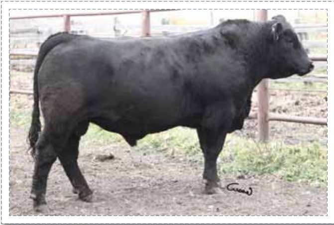
197 ~ Majestic Ryan 522