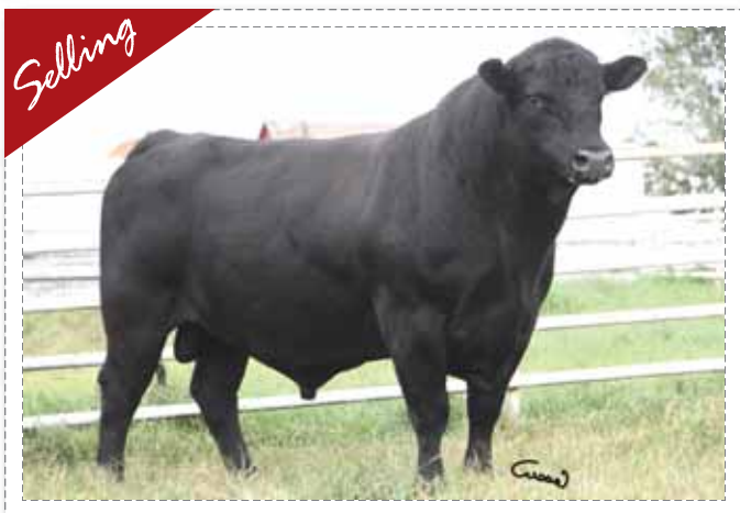
C ~ Benchmark Casey 075