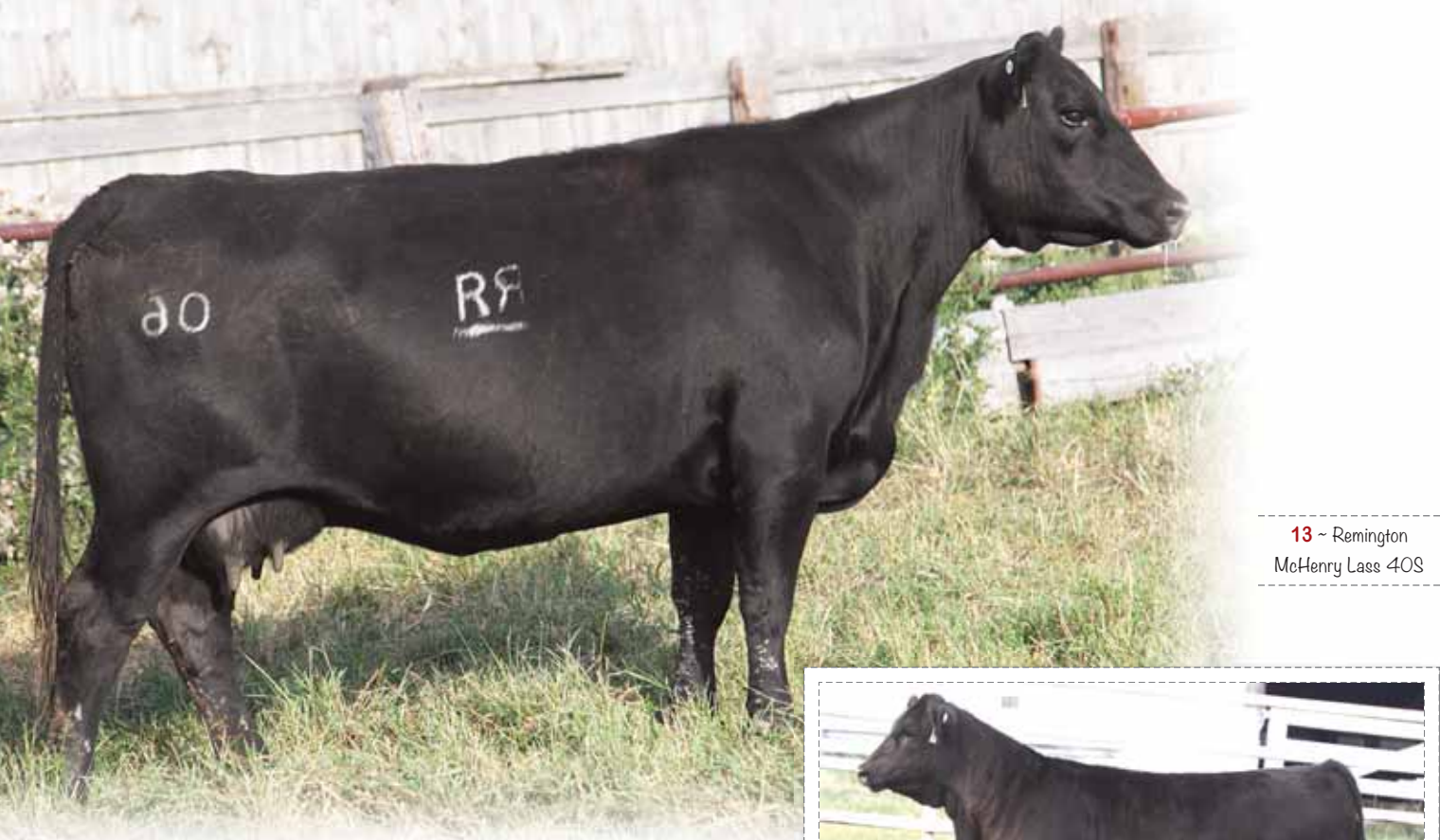
13 ~ Remington McHenry Lass 40S