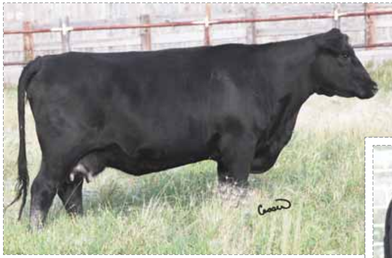
52 - KFC 5899 Andee 0172X