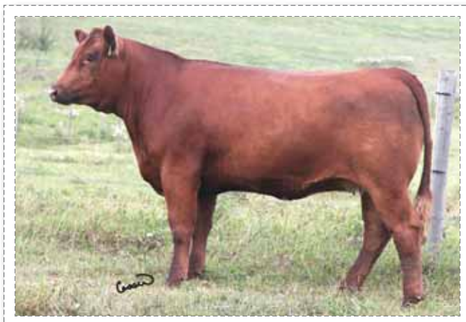
188 ~ Majestic WIS GM2 133Z

Exposed: May 31 to Nov. 1/13 to IPU Red Specialist 70T -PG682864- 40 days on Oct. 7/13