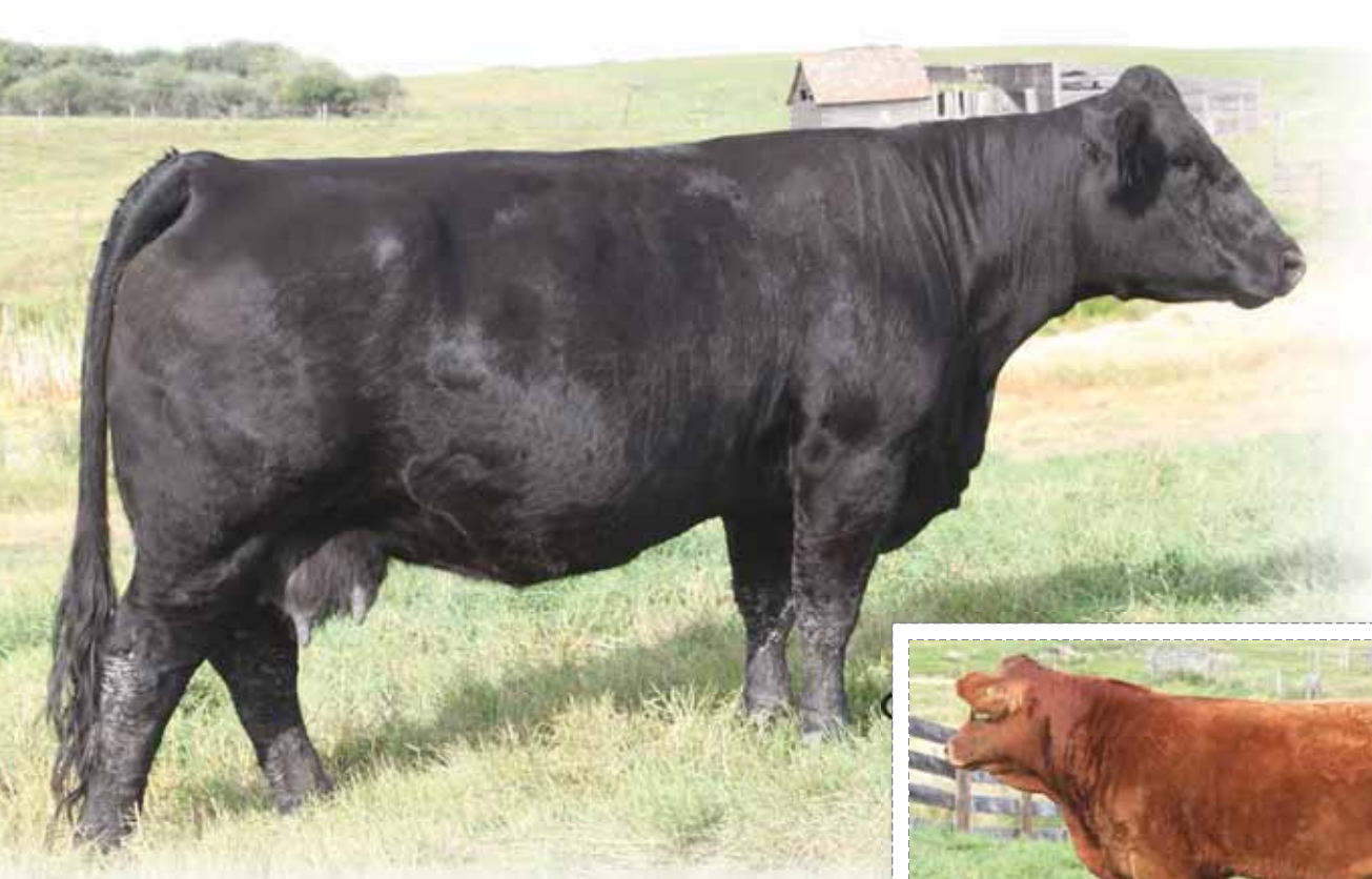
150 ~ Ankony Miss Candace U056