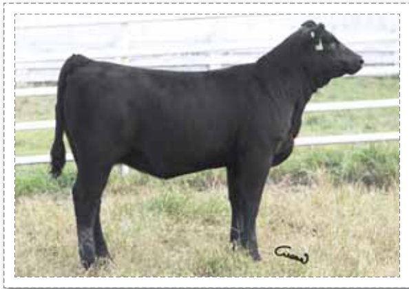
110A ~ MCC Eugenie 28A