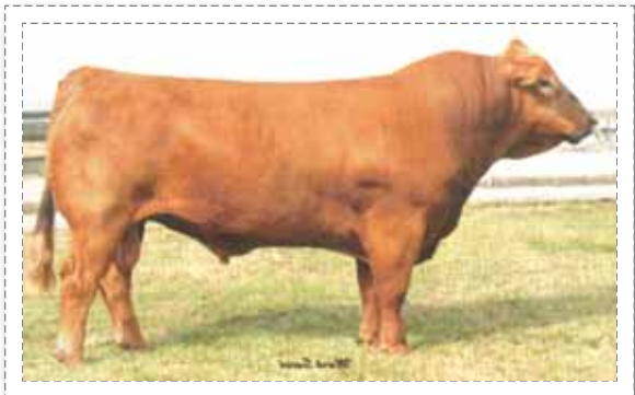
Ankonian Ryan ~ son of Lot 181 & maternal brother to Lot 182

A Red Canadian daughter of Miss Levi K76. Note BOZ Redcoat is the sire of P6, Jacquelyn and Caesar.