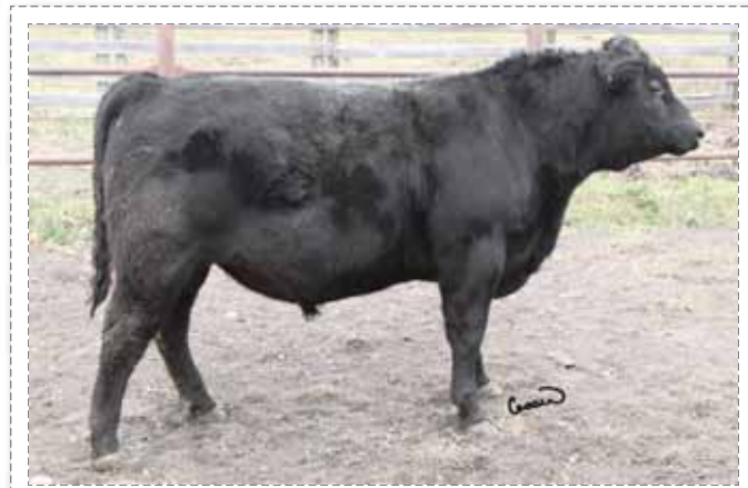
141~ MCC Repetition 2022