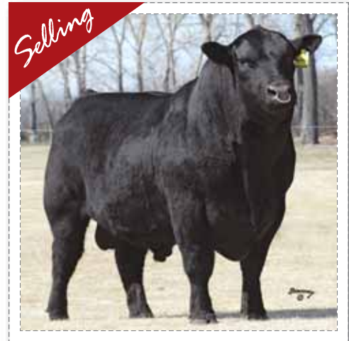
D ~ Royal Repetition DRCC 9097W

Royal Repetition possesses a very maternal pedigree, double bred Papa Forte and Predestined. Repetition moderates frame and adds muscle. There are 10 fall born yearling bulls, 10 fall born yearling heifers and 10 fall born calves selling with their dams.