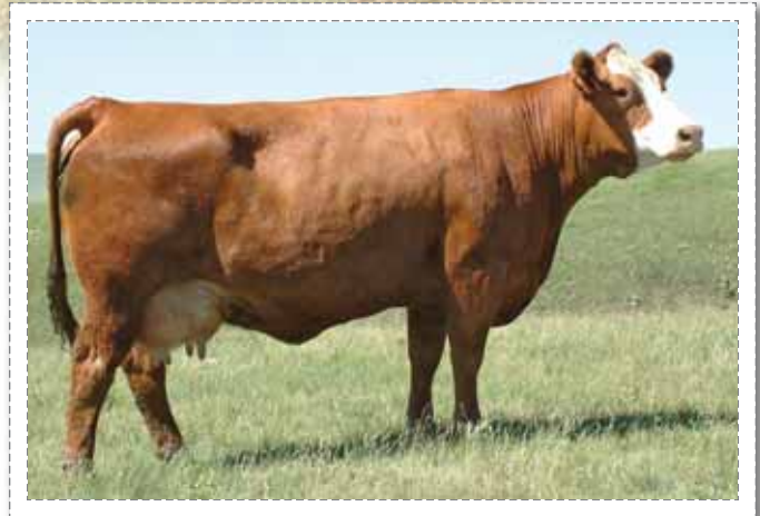
Bar 15 Miss Knight 78E-51G ~ Dam of Lots 177 - 180