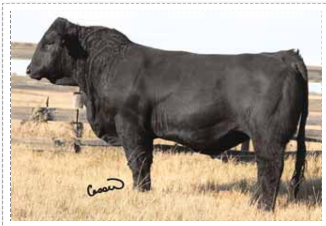
186 ~ Majestic Voyager 1Z

Polled Red Male JJH 4A March 8/13 BW: 94 lbs. Sire: IPU Red Specialist 70T