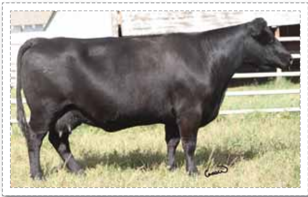
131 ~ Crowfoot Princene 262IM