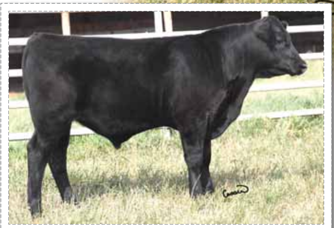
28A - MCC Casey 76A