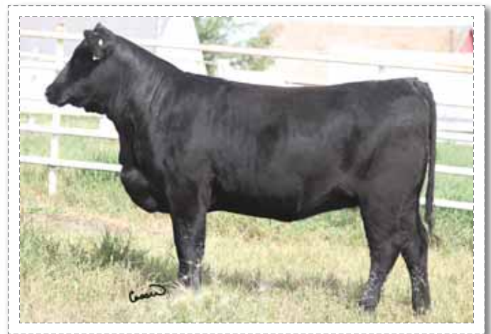
78 - MCC Rosalynn 1282