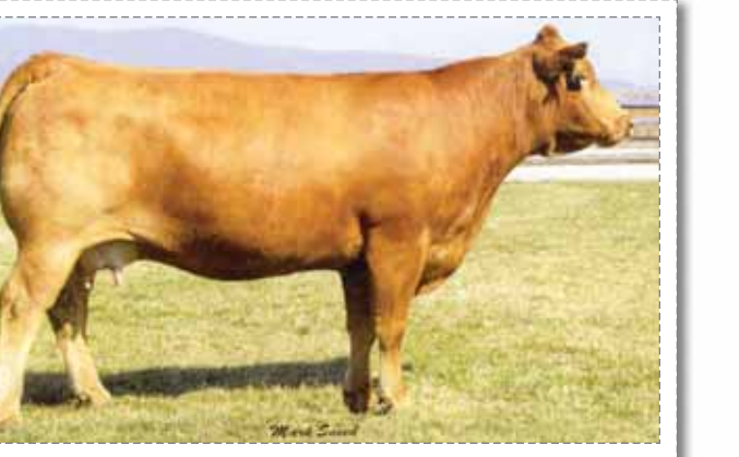
181 ~ BBS Miss Levi K76