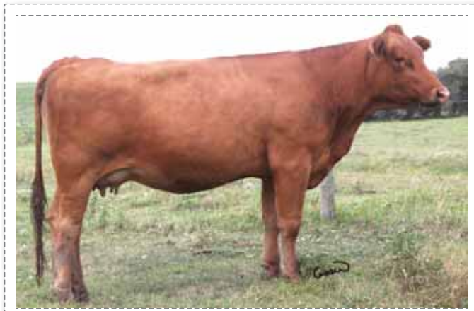
193 ~ Majestic Monolisa 76X