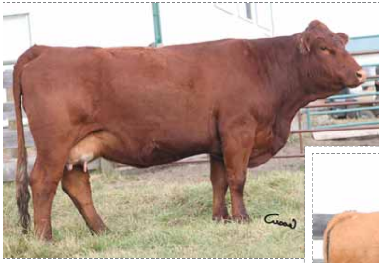
189 ~ Remington MS Red Cloud