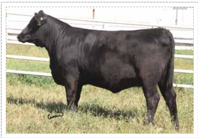
76 - MCC Blackcap 1092

Exposed: May 31 to Aug. 14/13 to Sheidaghan Right Time 47Z - 1673709- 110 days on Sept. 25/13.