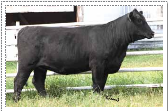
15 ~ MCC McHenry Lass I27Z

Exposed: May 31 to Aug. 14/13 to Sheidaghan Right Time 47Z - 1673709- 80 days on Sept. 25/13.