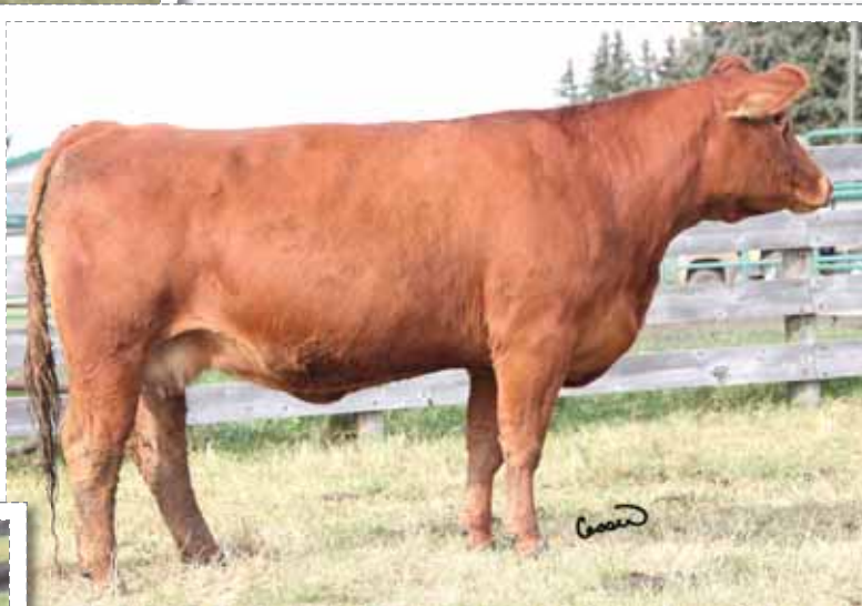
183 ~ Majestic Miss Levi 201W