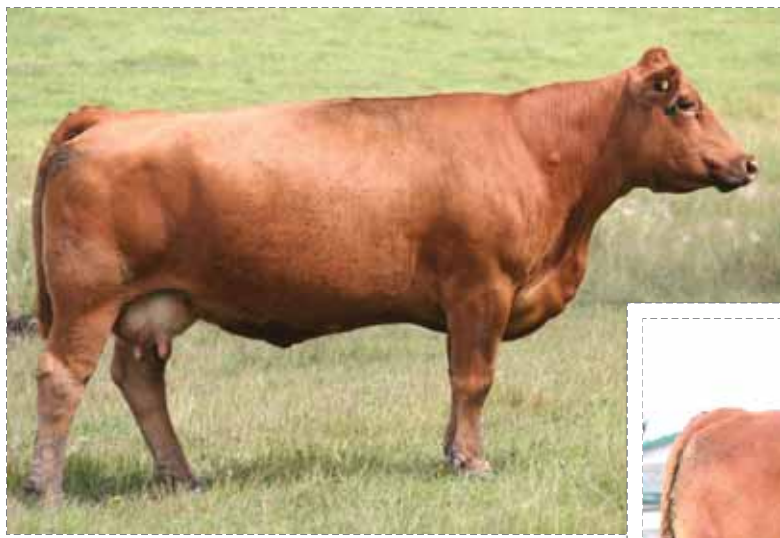
182 ~ Ankony Miss Levi S112