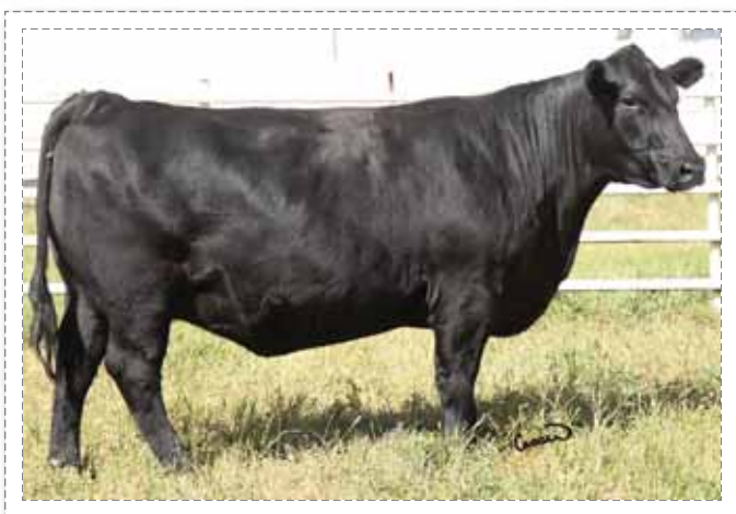
45 ~ KFC 9796W

Male JJJH 81A March 29/13 Pending BW: 94 lbs. Sire: Benchmark Casey 075 -1576478-