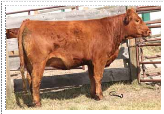
168 ~ Majestic Candace 208Z

207Z, 208Z and 209Z are daughters of Ankony Miss Candace P6 and Red Label. These flush sisters are like peas in a pod, all three are strong donor prospects.