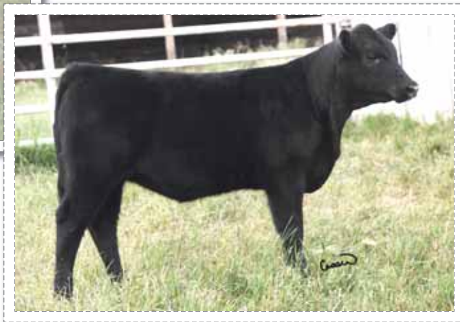
61A ~ MCC Victoria 142A