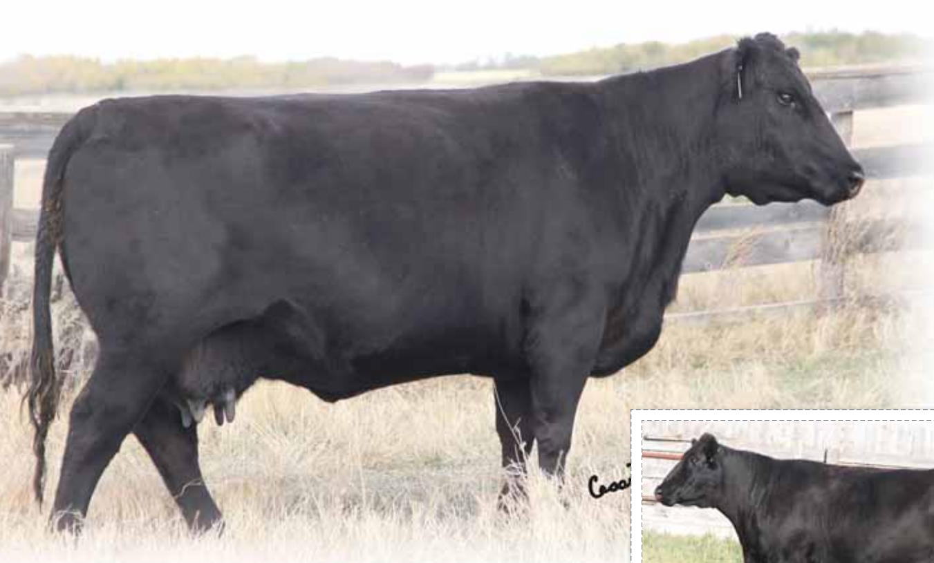
125 ~ Angus Acres Annie K 35P