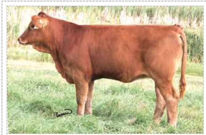
192A ~ Majestic Mona Lisa 82A