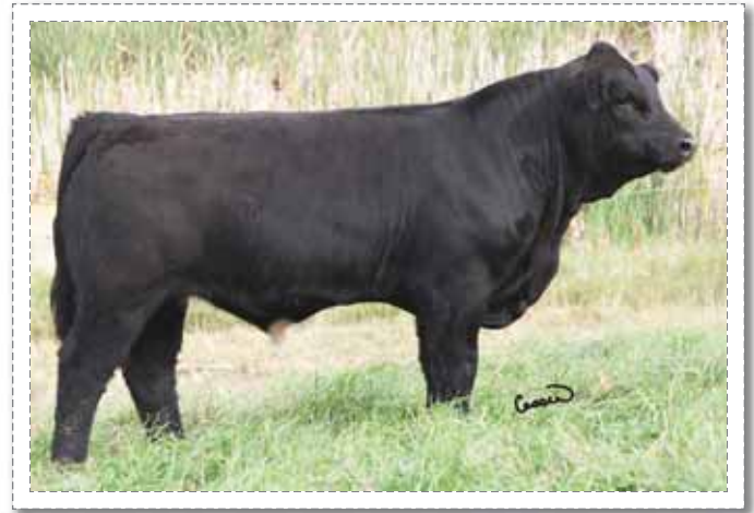
157A ~ Majestic Specialist 2A