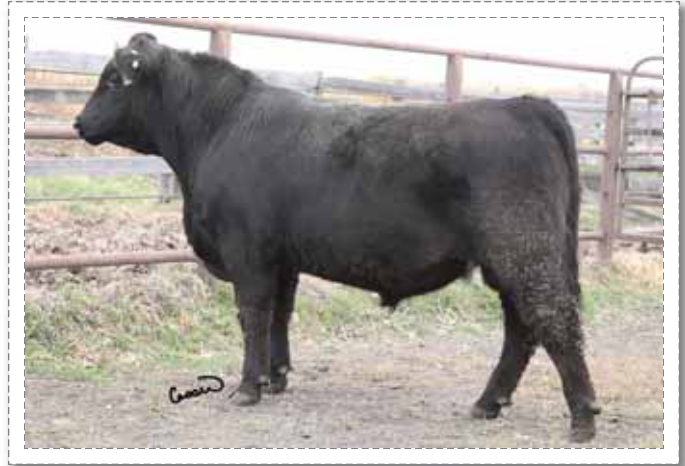
136 - MCC Repetition 1902