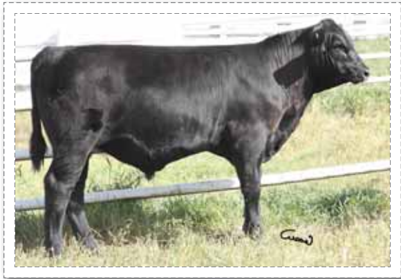
119A ~ MCC Prowler 26A

Male JJJH 26A March 19/13 Pending BW: 85 lbs. Sire: Remital Prowler 821U -1435373-