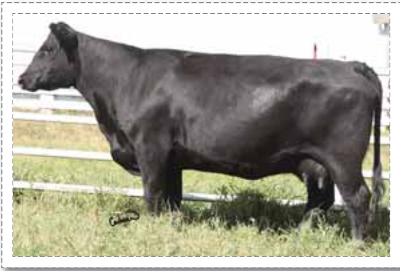
104 ~ Remitall Idelette 787U