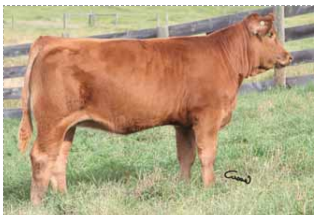
182A ~ Majestic Miss Levi 16A