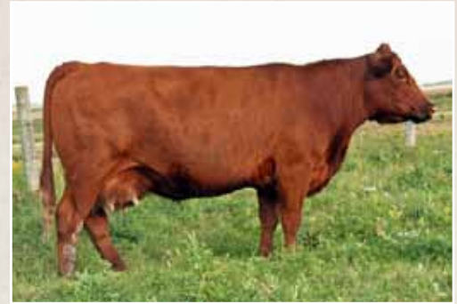
Red Mar Mac Frado 32Y