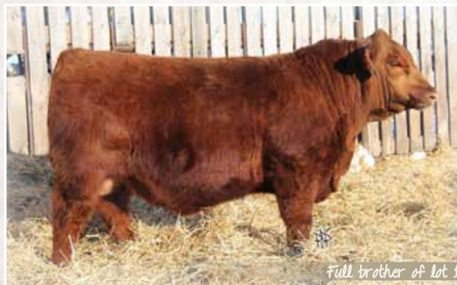
Full brother of lot 1

2018 RED ANGUS BREED AVERAGE EPDS -- BW -0.6 WW 51 YW 78 MILK 16 TM 42 CE 3.6