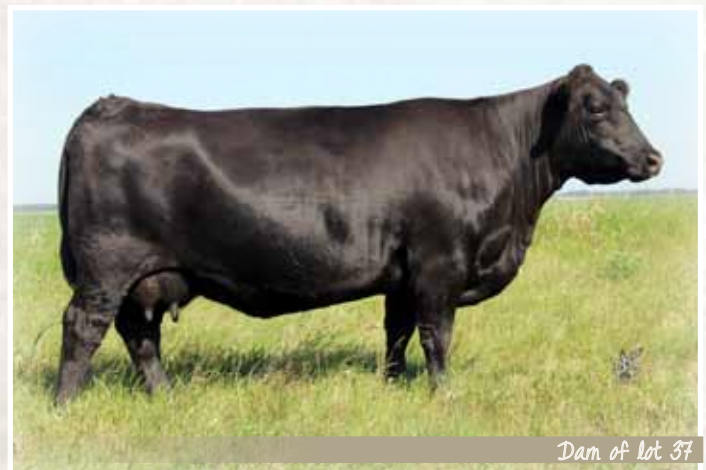
Dam of lot 37

A calving ease sire out of our Commander Bond female that always brings in a heavy calf in the fall.