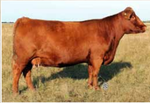
Red Mar Mac Lady Trooper 114Z