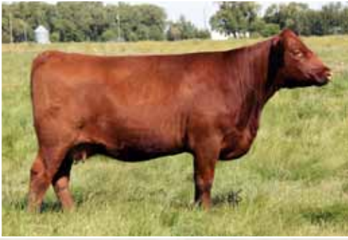
Red Mar Mac Frado 109B