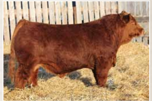
Mar Mac Dallas 110D