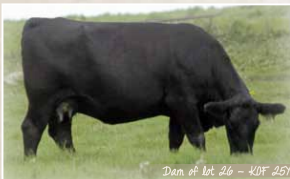
Dam of lot 26 - KOF 25Y