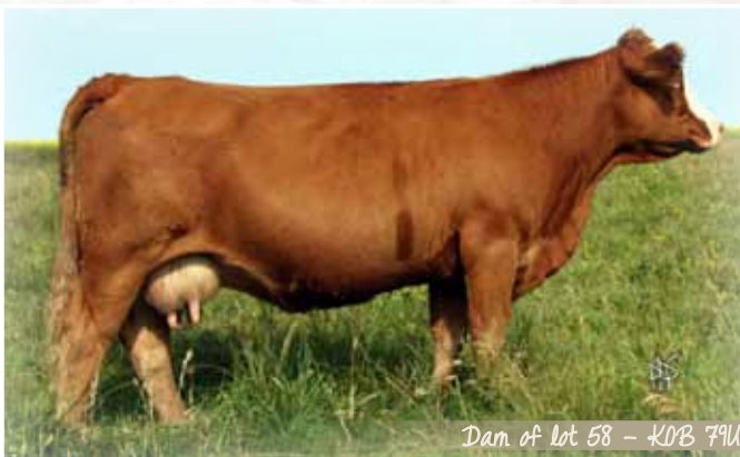
Dam of lot 58 - KOB 79U

SELLING A 2/3 SEMEN INTEREST & FULL POSSESSION, MAR MAC WILL RETAIN A 1/3 SEMEN INTEREST, AS WE FEEL HE IS LOADED WITH POTENTIAL