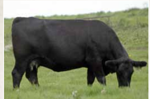
McRae's Bridget 25Y