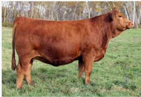
Mar Mac Miss Rockfort 130B