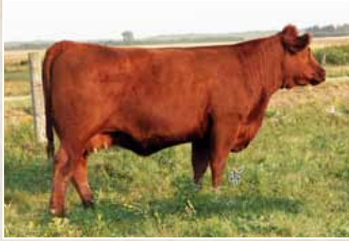
Red Mar Mac Bonita 51B