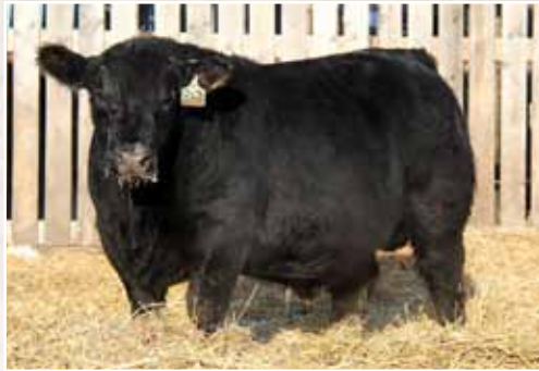
Mar Mac Ten Speed 86D