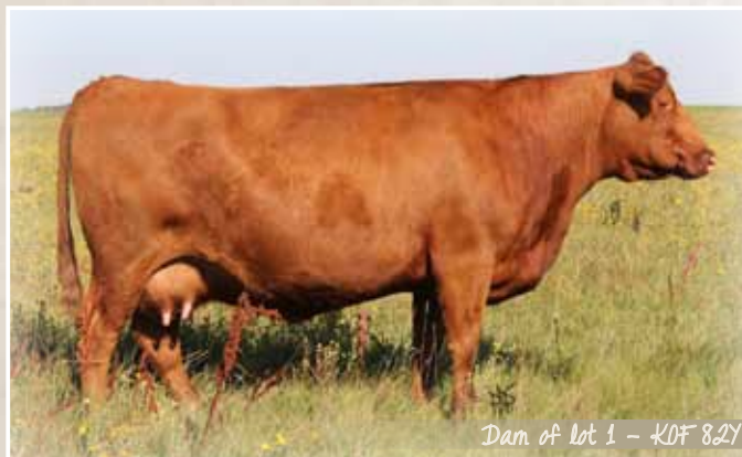
Dam of lot 1 - KOF 82Y