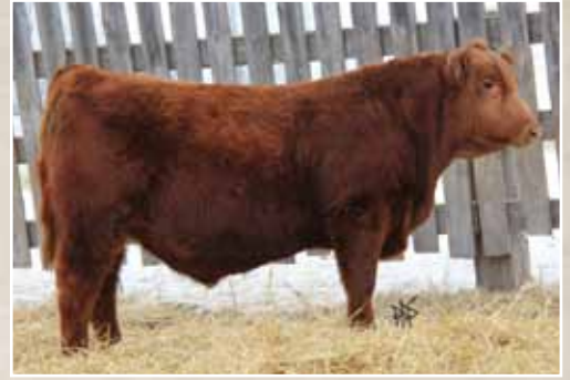
Red Mar Mac Cinch 34C