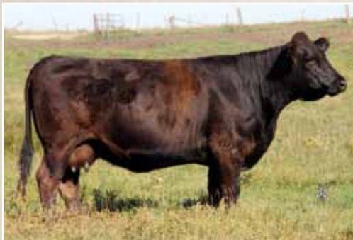
Mar Mac Carli 86X