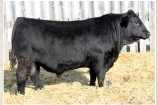
Mar Mac Diversity 27D