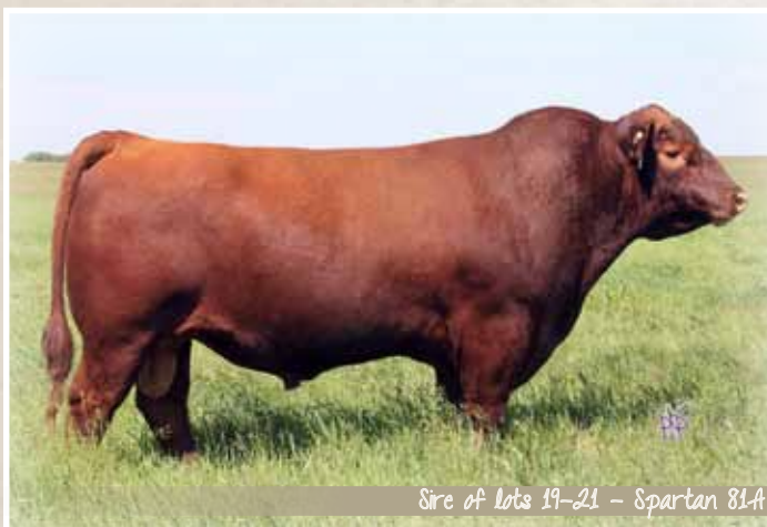
Sire of lots 19-21 - Spartan 81A

Need to add some performance and frame to your calf crop, 54E will do just that along with strong maternal from DMM Creed. We really like the mothering ability, femininity in the Creed females that go on to produce top bulls. Look at his actual weaning weight of 855.