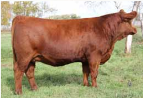
Mar Mac Sorority Girl 133B