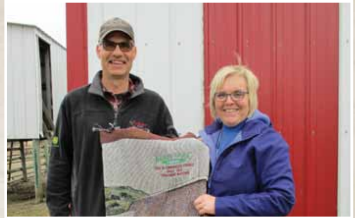
Pederson Farms Ltd.

A Black Ridge son with more birth weight but out of an extremely long bodied cow a daughter of 9T. A bull to add length and pounds to your calf crop. With Aberdeen, Cedar Ridge and Final Answer in his pedigree he is smooth made but so long.