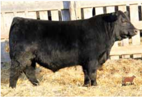
Mar Mac Blueprint 56B