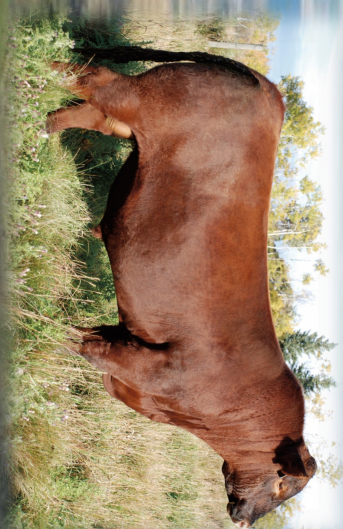
Red SSS Contender 121B