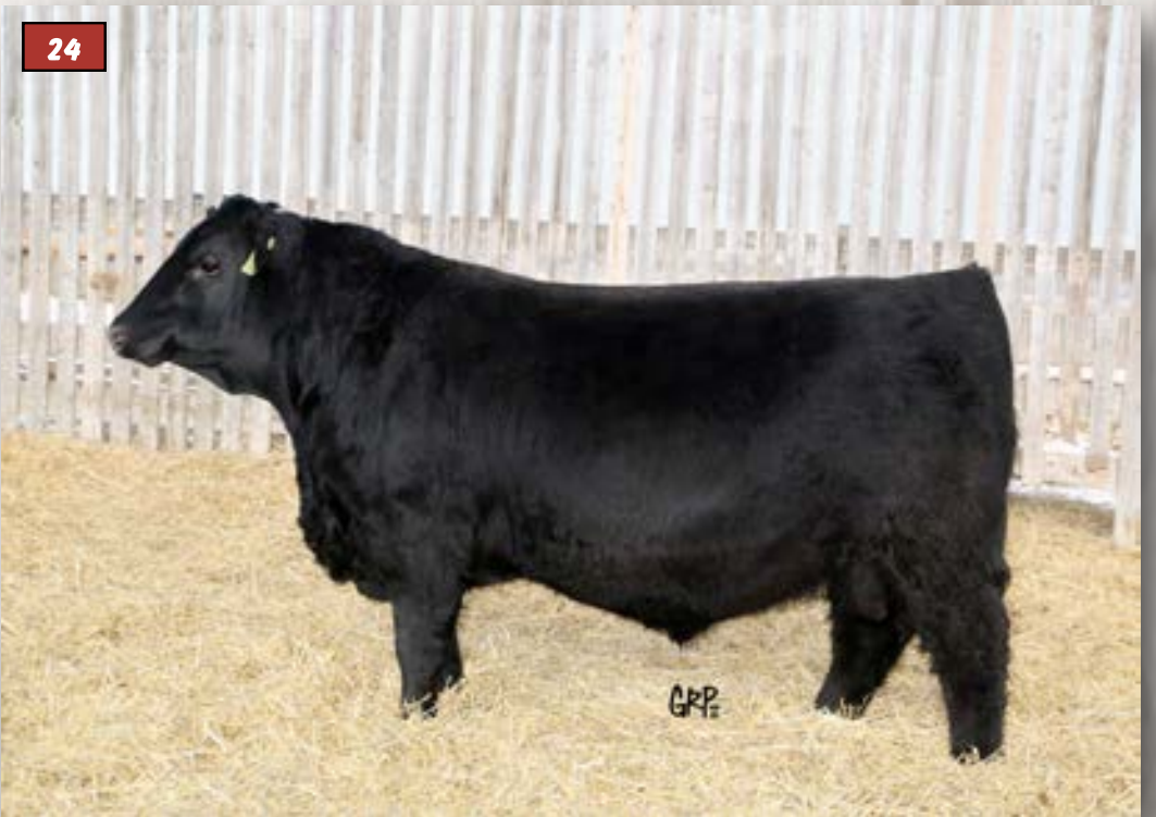
Ted Network 14X