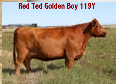
Red Ted Golden Boy 119Y

60D This 95B son is superb in his structure with a powerful rump and great length and muscle. A moderate well uddered dam in 119Y who always weans a high percentage of her body weight. Last year she sold a SAV Harvester grandson to Hengerer Farms. WI: 104 YI: 110