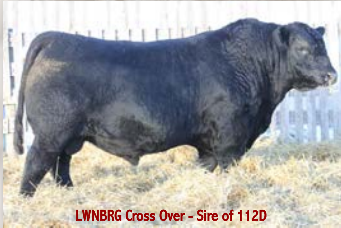
LWNBRG Cross Over - Sire of 112D

109D Calving ease bull with a versatile pedigree that includes great black bulls Mytty In Focus and Network 4200