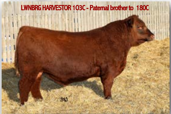
LWNBRG HARVESTOR 103C - Paternal brother to 180C