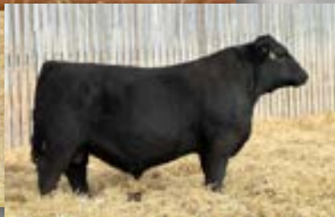
LWNBORG Powershot 15B maternal brother sold to Martin & Sheila Hilmar in 2015