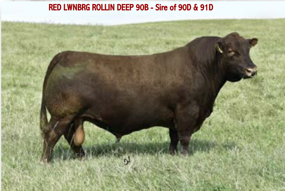
RED LWNBRG ROLLIN DEEP 90B - Sire of 90D & 91D