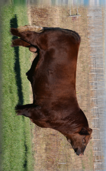
Red Six Mile High Caliber 177C