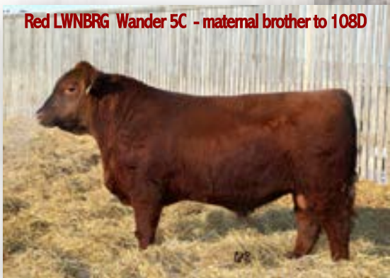
Red LWNBRG Wander 5C - maternal brother to 108D