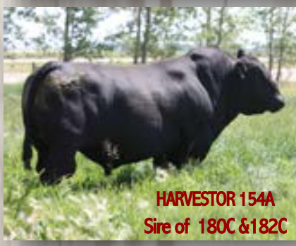
HARVESTOR 154A Sire of 180C & 182C