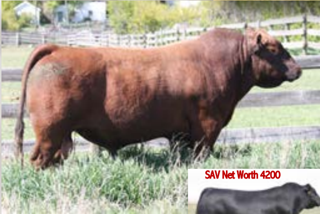
SAV Net Worth 4200