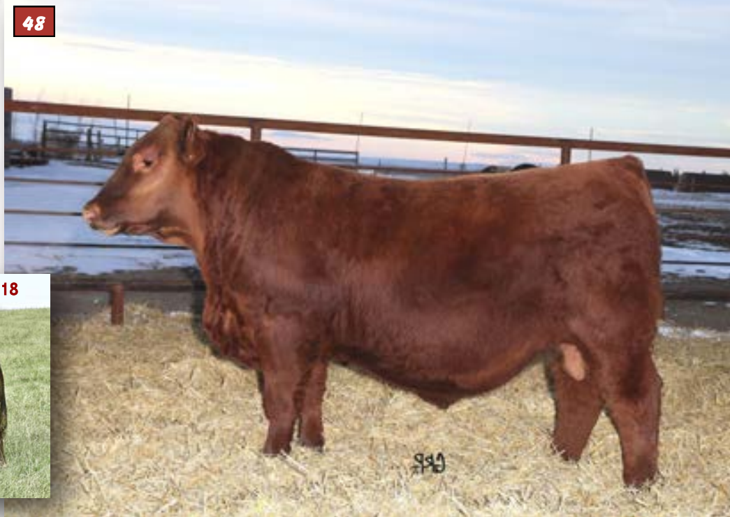
Maternal Grand sire - Rollin Deep Y118