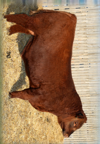
Red LWNBRG Harvester 103C