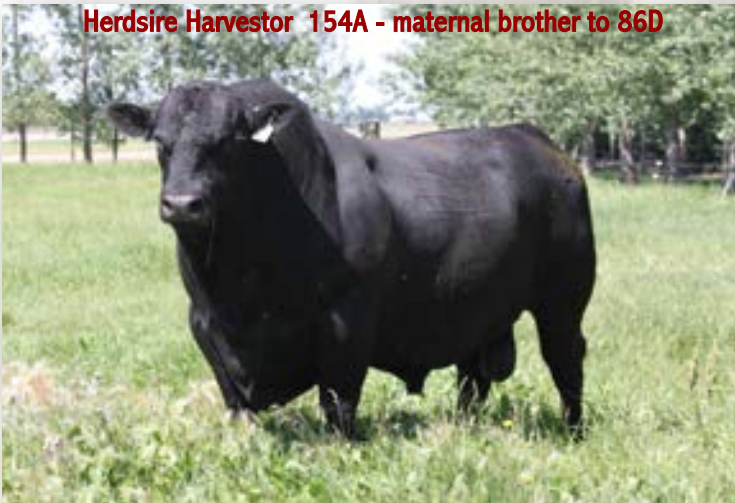
Herdsire Harvestor 154A - maternal brother to 86D

86D Aniston 137S is a solid, easy keeping cow that has done nothing but raise powerful ranch bulls. She is also the maternal grand-dam to Red LWNBRG Harvestor 103C