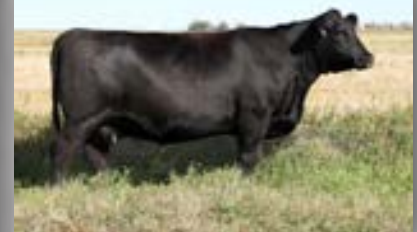
Ted Networth 14X - grandam of 149D