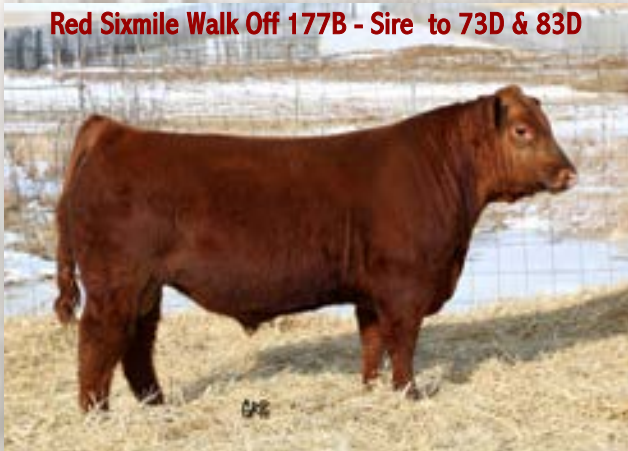
Red Sixmile Walk Off 177B - Sire to 73D & 83D