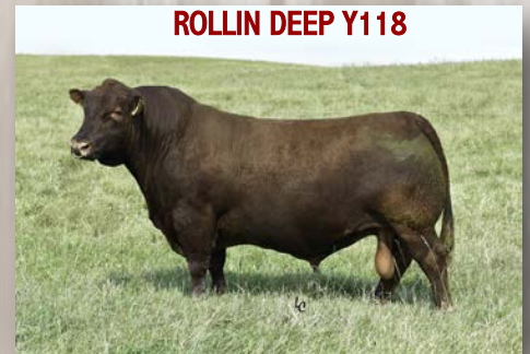
ROLLIN DEEP Y118