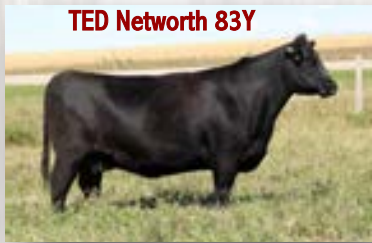
TED Network 83Y

36D These Tour of Duty sons are as long in the spine as I've ever seen. Explosive growth and gain ability. Elite dam in 83Y who is the model ranch cow. Efficient, fertile and consistent. She has an earned ratio of 105 on 4 calves.