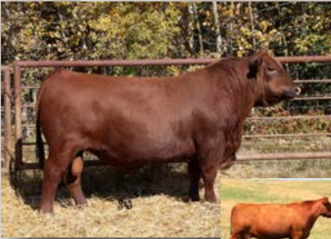
Red Red Chateau 6U