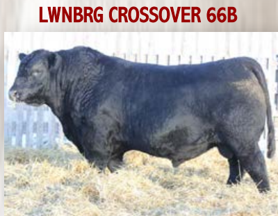
LWNBRG CROSSOVER 66B