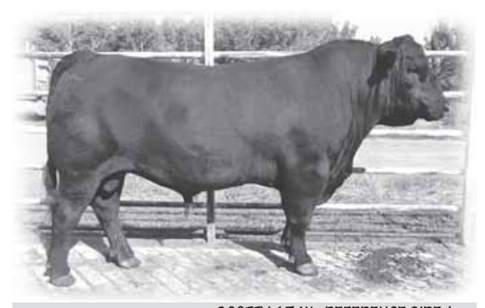
SCOTTY 174X - REFERENCE SIRE A