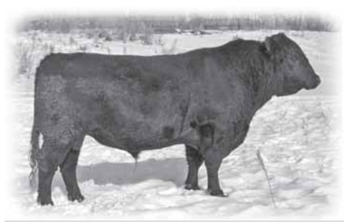
FAME 64W - REFERENCE SIRE D

Maternally, one of the strongest pedigrees you can find. He is very good in feet and legs, quiet and easy to work with. A very strong breeder.