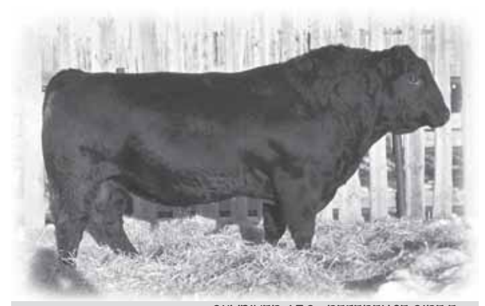
SKYDIVER 435 - REFERENCE SIRE E