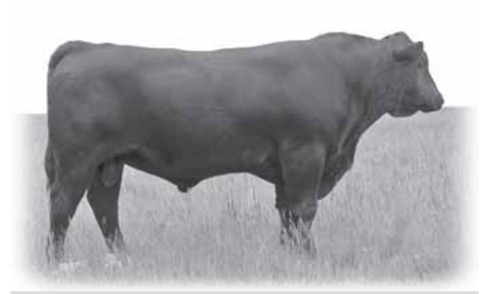
BANDO 253U - REFERENCE SIRE C