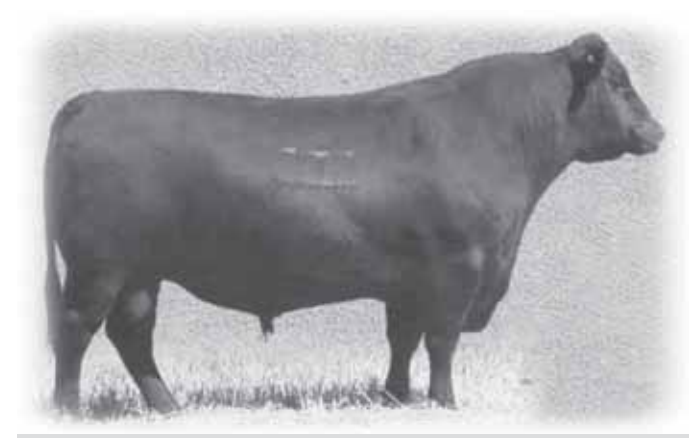
EXPEDITION 859K - REFERENCE SIRE G