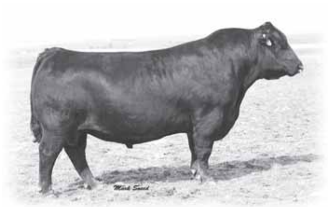
UPGRADE J59 - REFERENCE SIRE H

Stevenson Expedition 859K, proven calving ease with exceptional carcass genetics, one of the very top sons of the great carcass sire, Gardens Expedition.