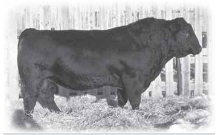
BAR-E-L SKYDIVER 439