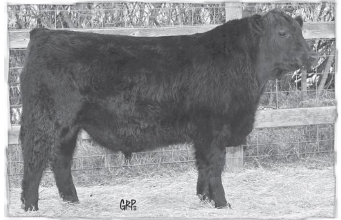
LOT 222 - F V 127W FINAL ANSWER 677Y