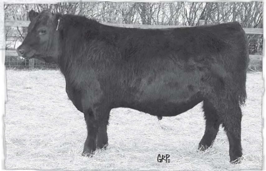
LOT 250 JOHNSTON MANDATE 125Y