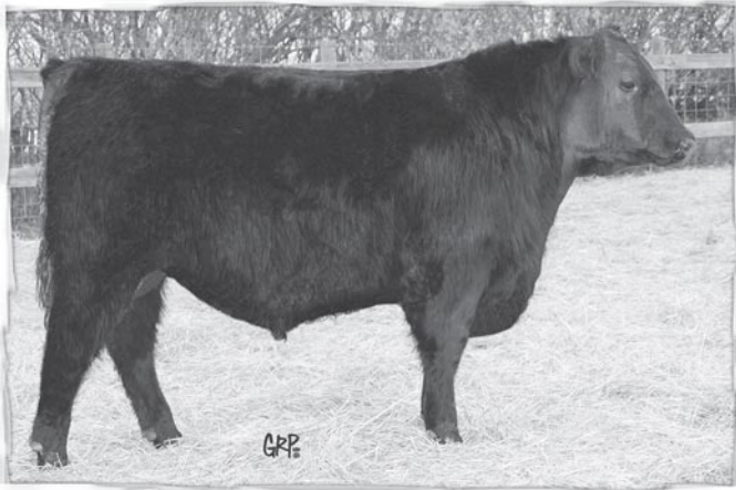
LOT 257 - JOHNSTON MANDATE 150Y