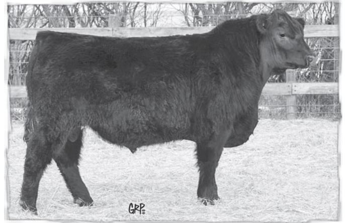
LOT 254 - JOHNSTON MANDATE 133Y