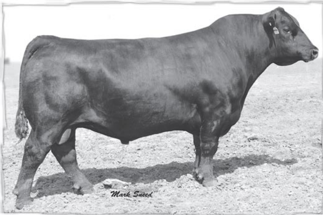
SYDGEN MANDATE 6079 17 SONS SELL

Mandate for performance, excellent calving ease, growth and marbling genetics.