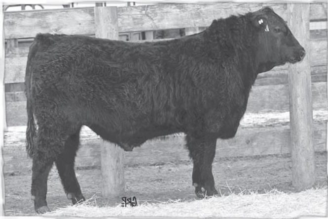
LOT 251 - FV MANDATE MAN 1Y