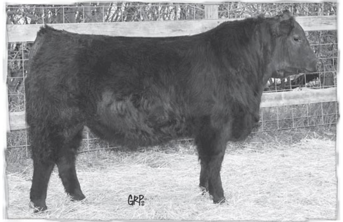
LOT 293 - JOHNSTON BANDOLIER 167Y

BW: 88 lbs. Adj. 205D: 675 lbs. EPDs: BW: +4.4 P+ WW: +34 P+ YW: +55 P+ Milk: +4 P SC: +0.19 P