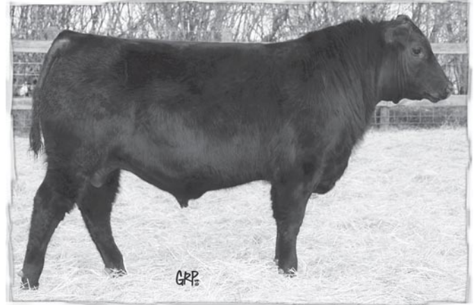
LOT 271 - F V HOOVER DAM 162Y

Hoover Dam, King and 12U are close in his pedigree so his sons should be good and his daughters will be superb.