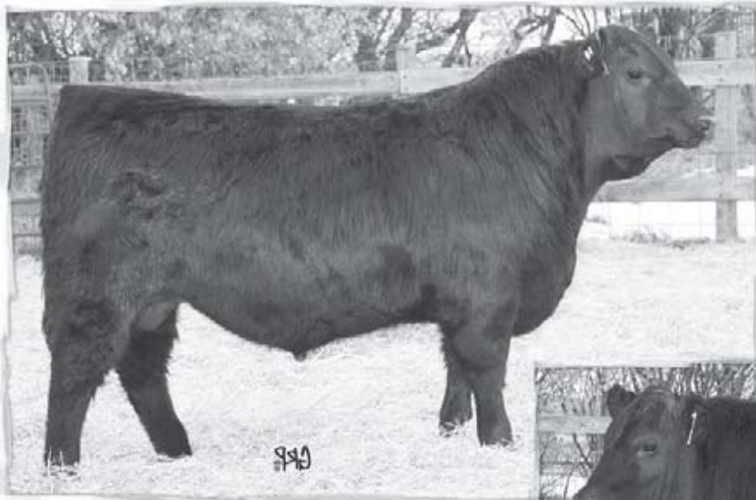
LOT 249 F V MANDATE MAN 146Y