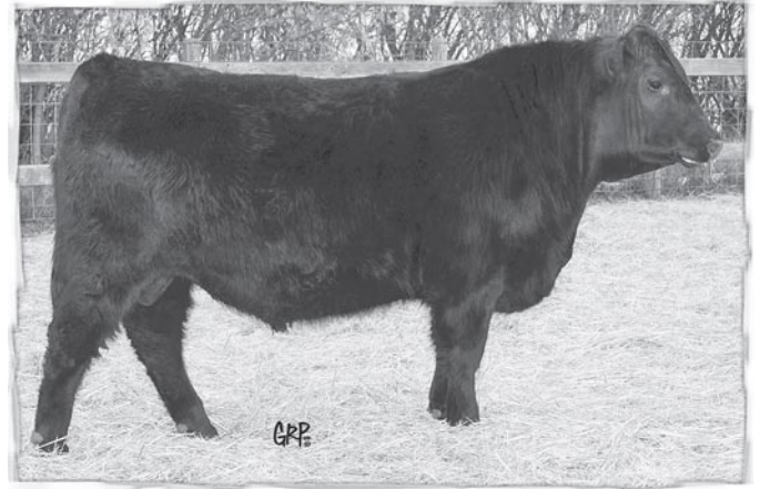
LOT 208 - F V FINAL ANSWER 411Y

EPDs: BW: +4.0 P+ WW: +60 P+ YW: +101 P+ Milk: +25 P SC: +0.56 P