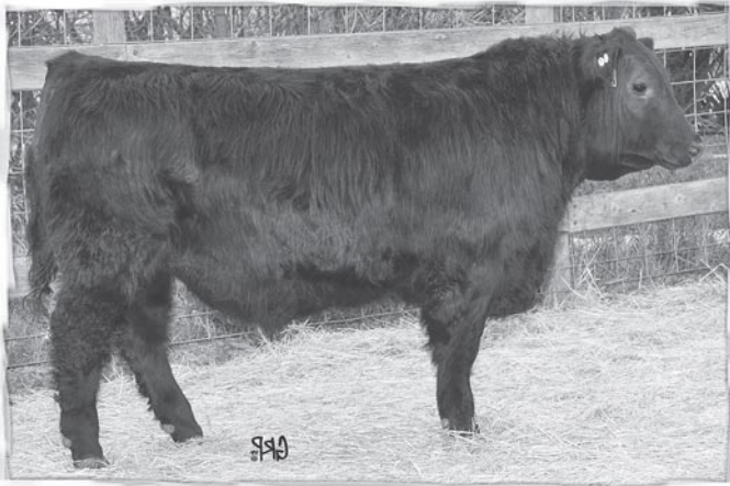
LOT 219 - F V 127W FINAL ANSWER 214Y