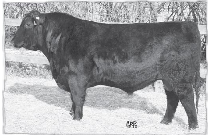
LOT 295 - F V PIONEER 168X

168X ran clean-u[ with a 125 heifers last summer. A very attractive Pioneer son with excellent numbers and a modest birth weight. His dam and the dam of our high selling bull last year are maternal sisters. Good uddered, top producing cows that always wean some of our best calves.