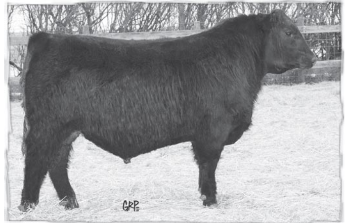
LOT 266 - F V IMAGE MAKER 241Y