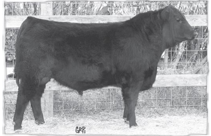
LOT 247 - F V FINAL FOCUS 256Y

BW: 84 lbs. Adj. 205D: 697 lbs. EPDs: BW: +3.0 P+ WW: +44 P+ YW: +73 P+ Milk: +22 P