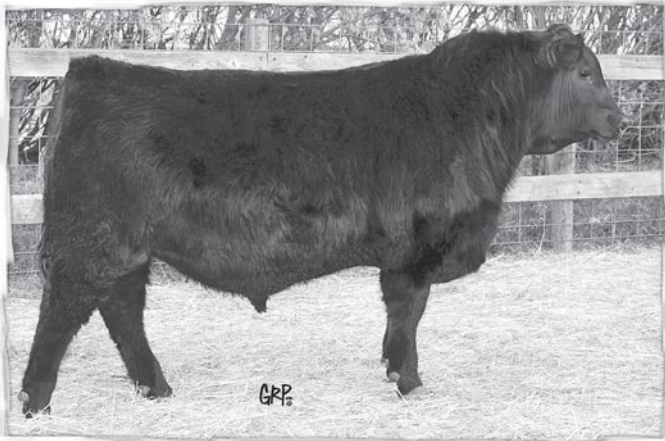
LOT 264 - F V MANDATE MAN 184Y