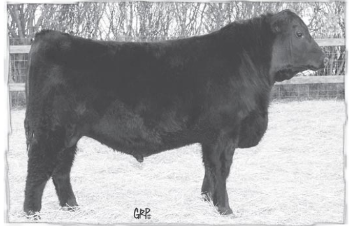
LOT 240 - F V 57U GLANWORTH 592Y

Another top 57U son. His grandma was purchased from the One Four Research Station.