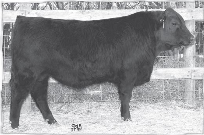
LOT 230 - F V 57U GLANWORTH 114Y