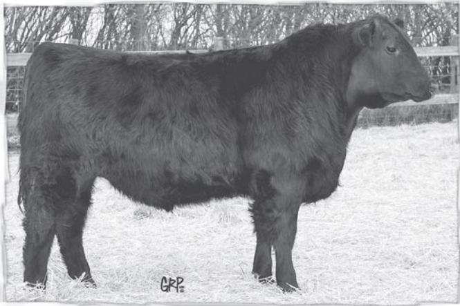
LOT 225 - F V 127W FINAL ANSWER 14Y