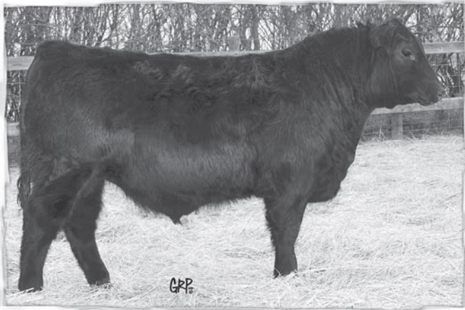
LOT 278 - F V 308M KING 746Y