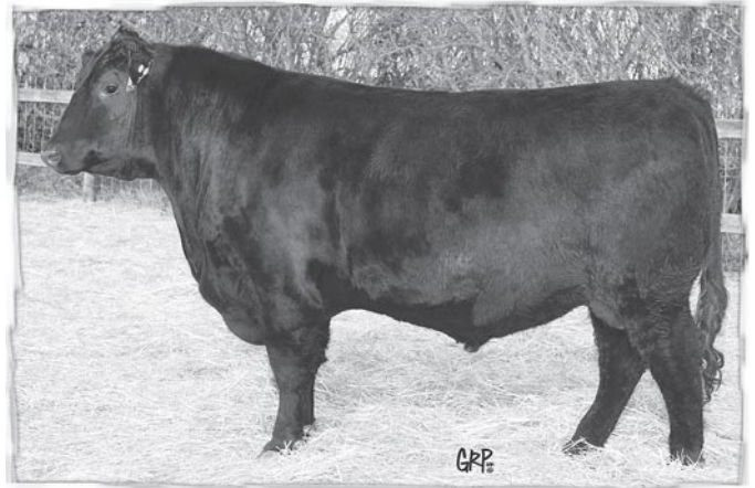
LOT 294 - F V 6595 ALLIANCE 102X

BW: 86 lbs. Adj. 205D: 640 lbs. EPDs: BW: +2.2 P+ WW: +38 P+ YW: +63 P+ Milk: +9 P SC: +0.19 P