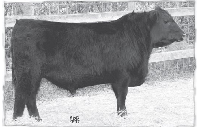
LOT 233 - F V 57U GLANWORTH 118Y