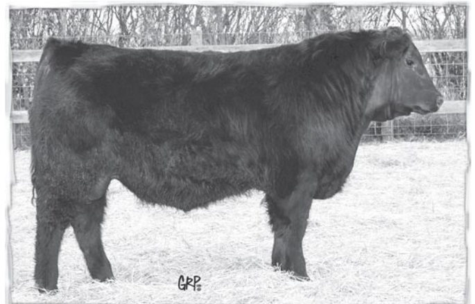
LOT 248 - F V 6595 ALLIANCE 19Y

BW: 86 lbs. Adj. 205D: 644 lbs. EPDs: BW: +2.8 P+ WW: +41 P+ YW: +72 P+ Milk: +21 P SC: +0.90 P