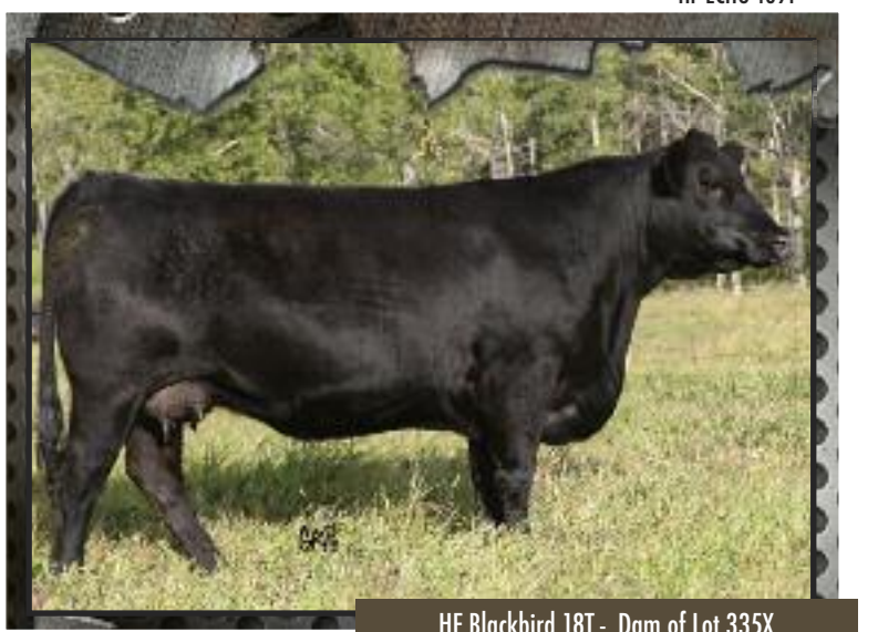
HF Blackbird 18T - Dam of Lot 335X

SOUTHLAND FREE RIDE 68R SOUTHLAND EXCLUSIVE 62U SOUTHLAND SUSAN 58L HF KODIAK 5R HF BLACKBIRD 18T HF BLACKBIRD 114K TC FREEDOM 104 AMF NHF SOUTHLAND ERROLINE 44L RONAN R BANDOLIERMERE 108H RONAN SUSAN 36J SANDY BAR ADVANTAGE 43M WILBAR RUBY 955N NORTHERN IMPROVEMENT 4480 HF BLACKBIRD 99G BW 98 Sep 23 WT 737 ADJ 205 WT 742 SALE DAY WT WPDA 3.41 AGE OF DAM 3 BW 4.4 WW 45 YW 79 MILK 17 TM 40 SC CE -3.0 MCE -1.0