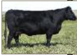
HF ECHO 7S

S A V 004 PREDOMINANT 4438 S A V 8180 TRAVELER 004 HF HEMI 151T S A V EMBLYNETTE 1182 HF TIBBIE 100M REMITALL ICEMAN 10K HF TIBBIE 86K SANDY BAR ADVANTAGE 43M TC ADVANTAGE HF ECHO 7S SANDY BAR JEMINA 44K HF ECHO 97K GREENS PREMIUM 7578 DURALTA 14C ECHO 32E