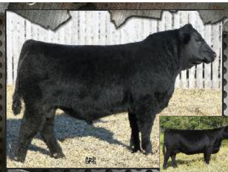
HF ERICA 339T

BW 74 Sep 23 WT 823 ADJ 205 WT 765 SALE DAY WT WPDA 3.5 AGE OF DAM 3 BW -0.2 WW 57 YW 95 MILK 20 TM 49 SC 0.13 CE 9.0 MCE 9.0