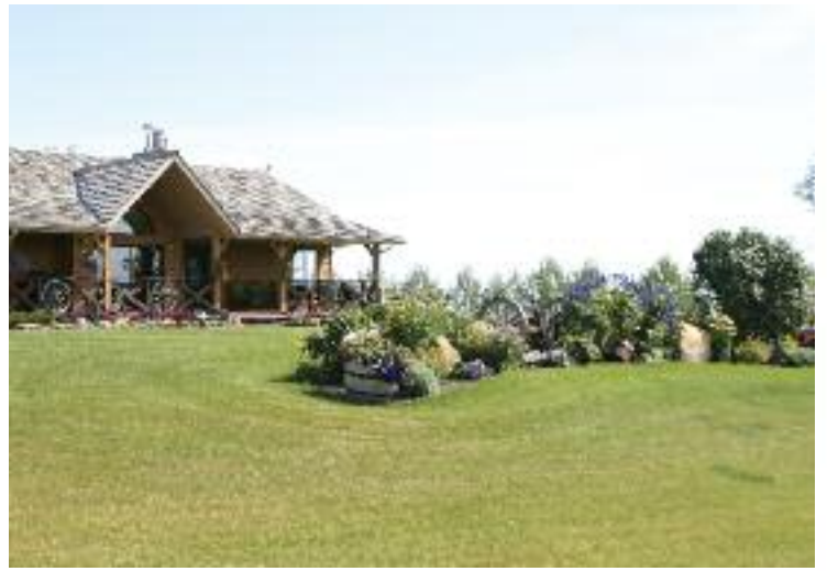
Gail's pride and joy

BW 84 Sep 23 WT 775 ADJ 205 WT 677 SALE DAY WT _____ WPDA 3.24 AGE OF DAM 5 BW 1.3 WW 50 YW 90 MILK 20 TM 45 SC 0.04 CE 7.0 MCE 8.0