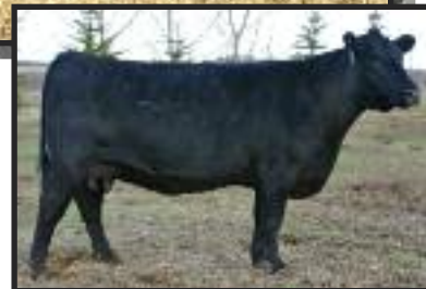
HF Echo 84R (pictured as a 2 year old) - Dam