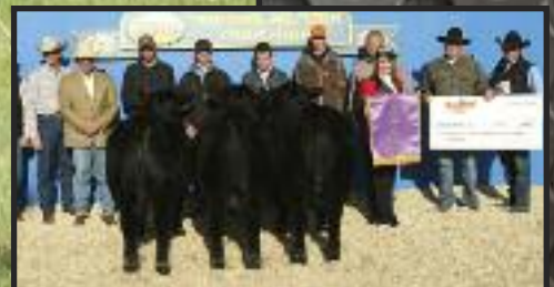
GRAND CHAMPION PEN OF BULLS AT THE 2010 NATIONAL WESTERN STOCK SHOW, DENVER, CO WAS Sired BY HF KODIAK 5R