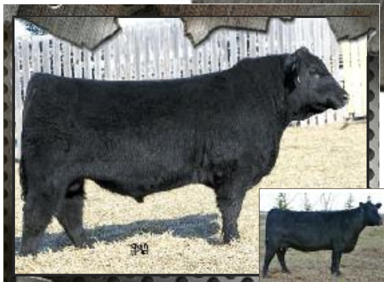
HF ECHO 84R

BW 98 Sep 23 WT 973 ADJ 205 WT 839 SALE DAY WT WPDA 4.02 AGE OF DAM Recipient Dam BW 1.1 WW 53 YW 93 MILK 21 TM 48 SC 0.72 CE 8.0 MCE 7.5