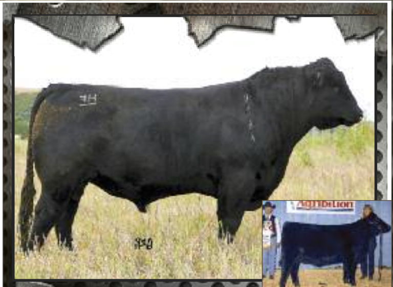
HF ERICA 187R

Calving ease specialist and highly maternal.