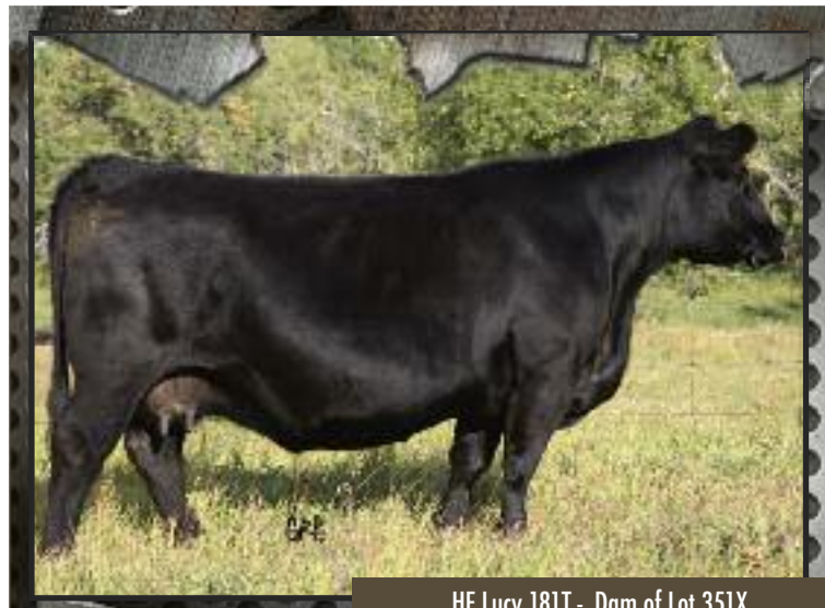
HF Lucy 181T - Dam of Lot 351X

BW 85 Sep 23 WT 737 ADJ 205 WT 753 SALE DAY WT WPDA 3.48 AGE OF DAM 3 BW 1.8 WW 51 YW 93 MILK 20 TM 46 SC 0.18 CE 5.0 MCE 3.0