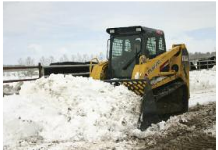
Hoping for a better April in 2011

BW 83 Sep 23 WT 646 ADJ 205 WT 701 SALE DAY WT WPDA 3.05 AGE OF DAM 2 BW 3.3 WW 37 YW 69 MILK 16 TM 35 SC CE 1.0 MCE 3.0