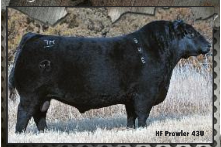
HF Prowler 43U

HF Prowler 43U ...Purchased by Handhills Colony in Hamilton Farms Bull and Select Female Sale 2008. Recently purchased by Boss Premier Cattle, Chappell, NE • A son of HF Kodiak 5R and maternal brother to Lot 98X