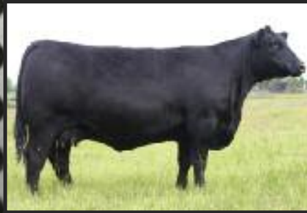
HF ERICA 26T - DAUGHTER OF HF KODIAK 5R HIGH SELLING HEIFER CALF IN THE 2007 HAMILTON SALE. $22,000.00 LOT 1 IN HAMILTON FARMS FEATURE FEMALES 2010