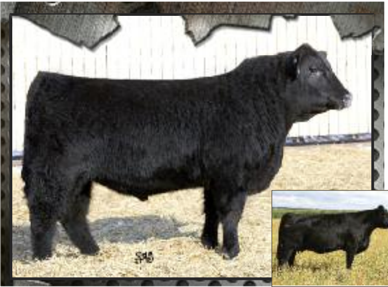
HF TIBBIE 230T

BW 80 Sep 23 WT 725 ADJ 205 WT 719 SALE DAY WT WPDA 3.3 AGE OF DAM 3 BW 2.2 WW 45 YW 77 MILK 17 TM 40 SC CE 2.0 MCE 3.0