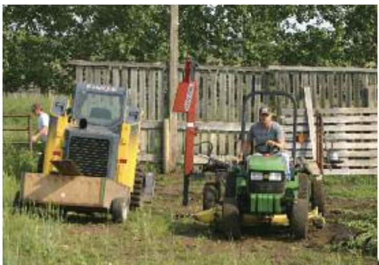
Corral improvements, July 2010

BW 82 Sep 23 WT 800 ADJ 205 WT 685 SALE DAY WT WPDA 3.28 AGE OF DAM 9 BW 1.6 WW 41 YW 74 MILK 17 TM 38 SC 0.30 CE 4.0 MCE 4.0