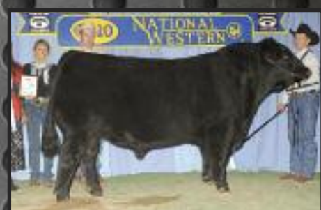
HF TIGER 5T RES. SR CHAMPION BULL, NATIONAL WESTERN STOCK SHOW 2010 2009 SUPREME CHAMPION BULL, FARMFAIR INTERNATIONAL & 2009 SUPREME CHAMPION BULL, CANADIAN WESTERN AGRIBITION