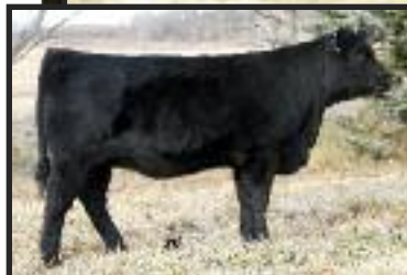
HF Lucy 105X, $6500.00 heifer calf to Chalco Angus, Innisfail, AB