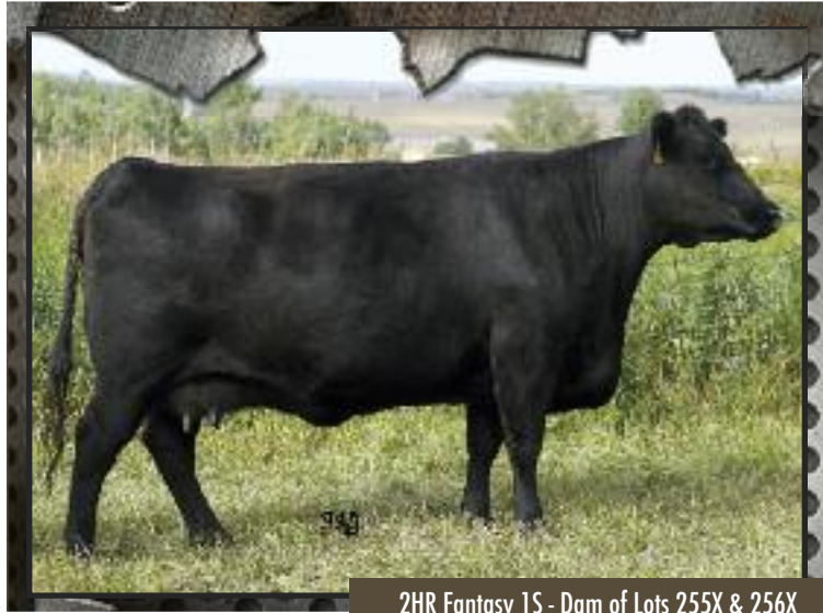
2HR Fantasy 1S - Dam of Lots 255X & 256X

SANDY BAR ADVANTAGE 43M HF KODIAK 5R WILBAR RUBY 955N BT TOUCHDOWN 14N 2HR FANTASY 1S 2HR FANTASY 56P TC ADVANTAGE SANDY BAR JEMINA 44K VERMILION YELLOWSTONE WILBAR RUBY 161J TWIN VALLEY PRECISION E161 BT EVERELDA ENTENSE 65J HF POWER STROKE 59M E HF FANTASY 158L BW 77 Sep 23 WT 753 ADJ 205 WT 688 SALE DAY WT WPDA 3.23 AGE OF DAM 4 BW 1.9 WW 48 YW 82 MILK 18 TM 42 SC CE 4.5 MCE 4.5