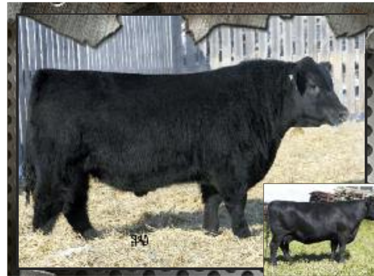
HF EVENING TINGE 93T

HF KODIAK 5R SANDY BAR ADVANTAGE 43M HF TIGER 5T WILBAR RUBY 955N HF ECHO 84R TC FREEDOM 104 HFDF ECHO 6N RIVERBEND POWERLINE 0050 CONNEALY FRONTLINE HF EVENING TINGE 93T LEACHMAN BLACKBIRD 8060 HF EVENING TINGE 48K GREENS PREMIUM 7578 R F EVENING TINGE 108C BW 83 Sep 23 WT 740 ADJ 205 WT 745 SALE DAY WT _____ WPDA 3.43 AGE OF DAM 3 BW 2.1 WW 56 YW 98 MILK 18 TM 46 SC _____ CE 6.0 MCE 8.0