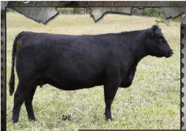
HF Evening Tinge 19T - Dam of Lot 395X

TC FREEDOM 104 2HR FREESTYLE 15R 2HR ERICA 34N BT TOUCHDOWN 14N HF EVENING TINGE 19T 2HR EVENING TINGE 45R C CONNEALY FOREFRONT T C RUBY 9095 HF PROGRESS 20K HF ERICA 44L TWIN VALLEY PRECISION E161 BT EVERELDA ENTENSE 65J HF POWER STROKE 59M HF EVENING TINGE 188M BW 78 Sep 23 WT 668 ADJ 205 WT 736 SALE DAY WT _____ WPDA 3.43 AGE OF DAM 3 BW 2.6 VV 39 YW 71 MILK 22 TM 42 SC _____ CE 4.0 MCE 7.0