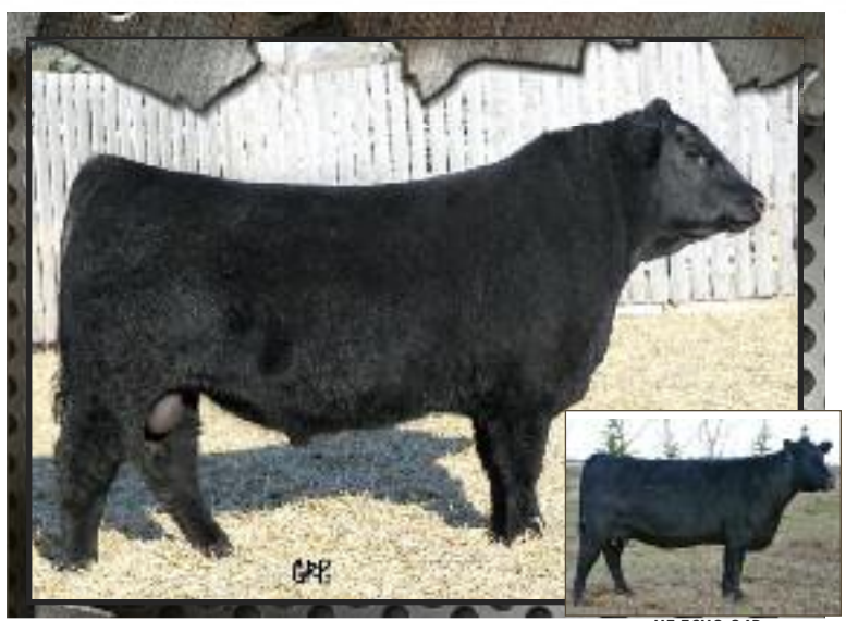
HF ECHO 84R

BW 98 Sep 23 WT 940 ADJ 205 WT 814 SALE DAY WT WPDA 3.9 AGE OF DAM Recipient Dam BW 1.1 WW 53 YW 93 MILK 21 TM 48 SC 0.72 CE 8.0 MCE 7.5