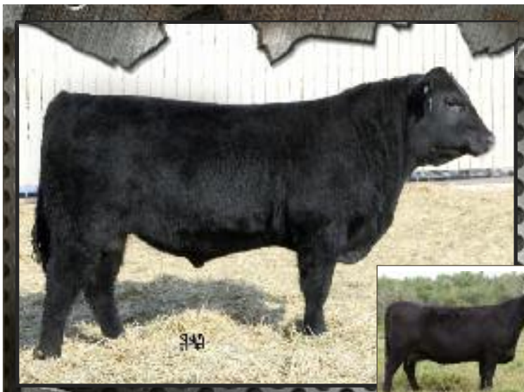
HF ECHO 17T

BW 78 Sep 23 WT 770 ADJ 205 WT 712 SALE DAY WT WPDA 3.24 AGE OF DAM 3 BW 0.5 WW 42 YW 81 MILK 20 TM 41 SC CE 8.0 MCE 8.0