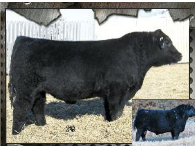
HF PROWLER 43U - MATERNAL BROTHER

BW 70 Sep 23 WT 815 ADJ 205 WT 683 SALE DAY WT WPDA 3.27 AGE OF DAM 6 BW 0.8 WW 51 YW 93 MILK 17 TM 43 SC 0.36 CE 11.0 MCE 11.0