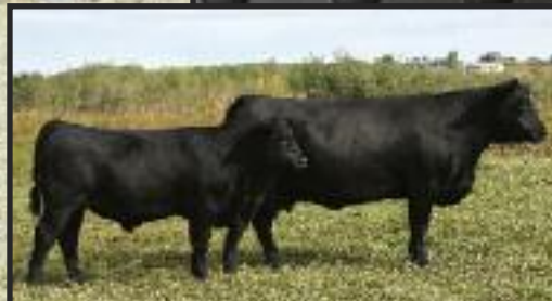
2HR BLACKCAP 21S

Find out more about HAMI or Hamilton's Alternative Marketing Initiative see page 5 for details!