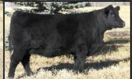
HF EVENING TINGE T38W - DAUGHTER OF HF TIGER WHO SOLD IN HAMILTON FARMS FEATURE FEMALE SALE FOR $11,000.00 TO ISLA BANK AND LOCK FARMS

Tiger daughters have now calved and look outstanding!