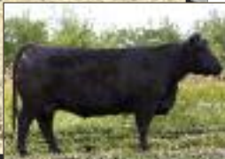
HF QUEEN 107S