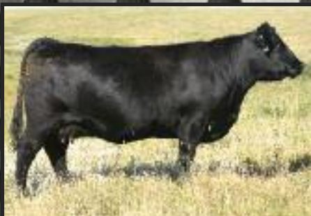
WILBAR RUBY 955N - DAM OF HF KODIAK 5R