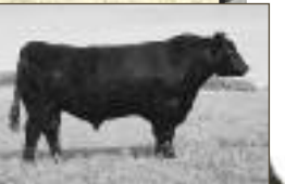
HF PROGRESS 20K