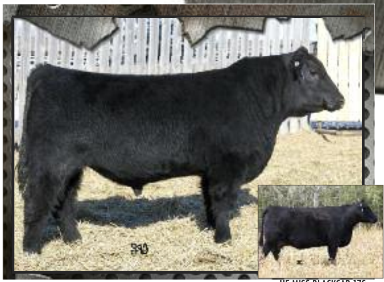
HF MISS BLACKCAP 17S

SOUTHLAND FREE RIDE 68R SOUTHLAND EXCLUSIVE 62U SOUTHLAND SUSAN 58L CHICO NEBRASKA 13N HF MISS BLACKCAP 17S HF MISS BLACKCAP 163L TC FREEDOM 104 AMF NHF SOUTHLAND ERROLINE 44L RONAN R BANDOLIERMERE 108H RONAN SUSAN 36J MILLCREEK DIVERSITY CHICO BEAUTY LASS 46F GREENS PREMIUM 7578 HF MISS BLACKCAP 12C BW 92 Sep 23 WT 840 ADJ 205 WT 763 SALE DAY WT _____ WPDA 3.59 AGE OF DAM 4 BW 4.5 WW 50 YW 86 MILK 17 TM 42 SC CE -4.0 MCE -1.0