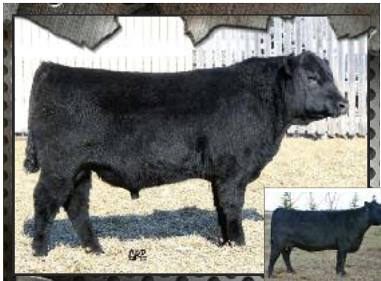
HF ECHO 84R

BW 88 Sep 23 WT 805 ADJ 205 WT 677 SALE DAY WT _____ WPDA 3.37 AGE OF DAM Recipient Dam BW 1.1 WW 53 YW 93 MILK 21 TM 48 SC 0.72 CE 8.0 MCE 7.5