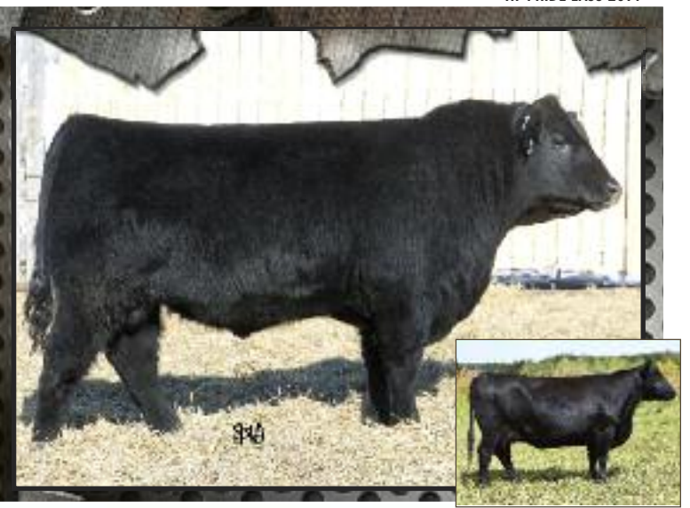
HF BLACKBIRD 153S

HF KODIAK 5R HF TIGER 5T HF ECHO 84R RIVERBEND POWERLINE 0050 HF BLACKBIRD 153S HF BLACKBIRD 97M SANDY BAR ADVANTAGE 43M WILBAR RUBY 955N TC FREEDOM 104 HFDF ECHO 6N CONNEALY FRONTLINE LEACHMAN BLACKBIRD 8060 F CONNEALY KINCAID HF BLACKBIRD 99G BW 79 Sep 23 WT 741 ADJ 205 WT 677 SALE DAY WT _____ WPDA 3.18 AGE OF DAM 4 BW 1.3 WW 52 YW 98 MILK 18 TM 44 SC CE 9.0 MCE 9.0