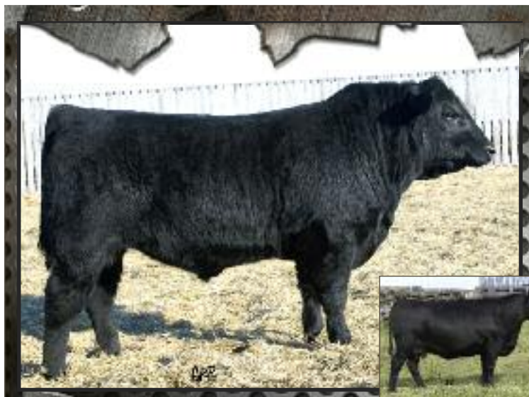
2HR TIBBIE 8S

BW 88 Sep 23 WT 970 ADJ 205 WT 810 SALE DAY WT WPDA 3.79 AGE OF DAM 4 BW 2.1 WW 55 YW 90 MILK 17 TM 45 SC 0.74 CE 5.0 MCE 7.0