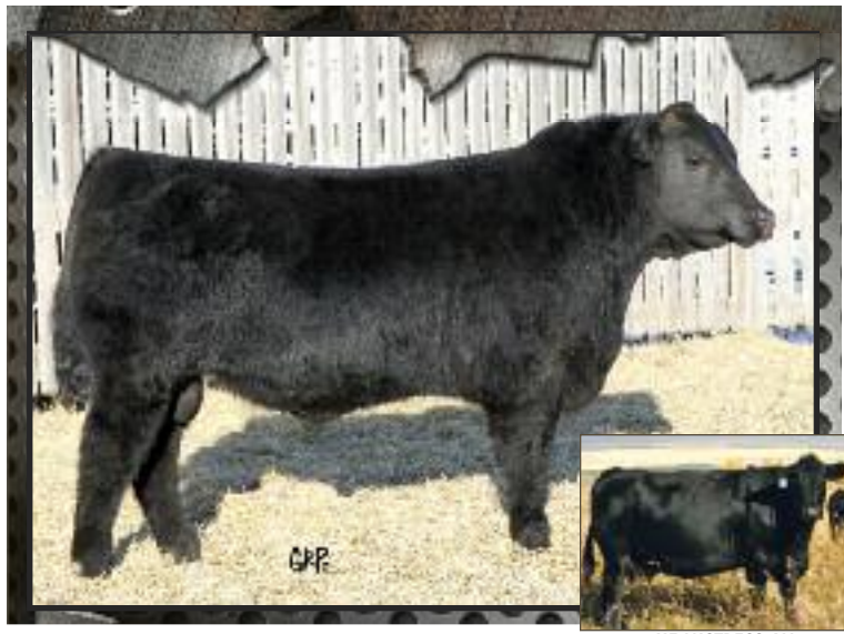
HF MISTRESS 6M

BW 92 Sep 23 WT 915 ADJ 205 WT 770 SALE DAY WT _____ WPDA 3.67 AGE OF DAM 8 BW 3.2 WW 56 YW 93 MILK 16 TM 44 SC 0.75 CE 1.0 MCE 5.0