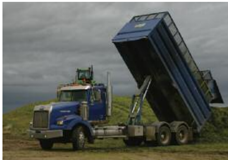
Trying to beat the storm

SANDY BAR ADVANTAGE 43M HF KODIAK 5R WILBAR RUBY 955N EXAR RITO 5072 HF BETTY 115G BIG BEAR BETTY 5W TC ADVANTAGE SANDY BAR JEMINA 44K VERMILION YELLOWSTONE WILBAR RUBY 161J RITO 3W3 OF OJ2 RITO 9FB3 SUMMITCREST ELSIE 0802 LLB PROPHET 1745 BIG BEAR BETTY 18R BW 74 Sep 23 WT 770 ADJ 205 WT 686 SALE DAY WT WPDA 3.16 AGE OF DAM 13 BW-0.1 WW 37 YW 64 MILK 14 TM 33 SC CE 7.0 MCE 5.0