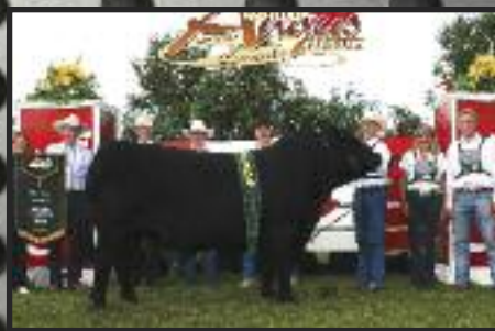
HF TIGER 5T 2009 WORLD ANGUS FORUM GRAND CHAMPION BULL