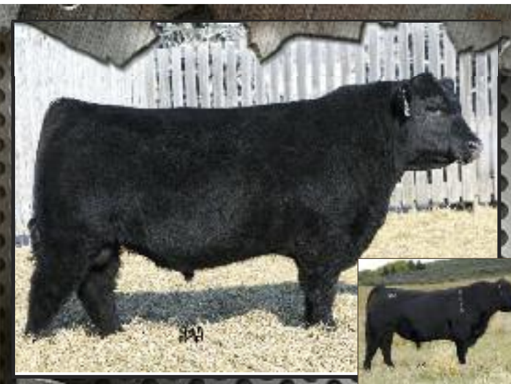
HF KODIAK 250U - MATERNAL BROTHER

BW 68 Sep 23 WT 918 ADJ 205 WT 797 SALE DAY WT WPDA 3.84 AGE OF DAM 5 BW-2.0 WW 50 YW 88 MILK 22 TM 47 SC 0.39 CE 12.0 MCE 11.0