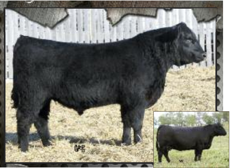
HF PRIDE LASS 209T

SOUTHLAND FREE RIDE 68R SOUTHLAND EXCLUSIVE 62U SOUTHLAND SUSAN 58L HF KODIAK 5R HF PRIDE LASS 209T HF PRIDE LASS 13L TC FREEDOM 104 AMF NHF SOUTHLAND ERROLINE 44L RONAN R BANDOLIERMERE 108H RONAN SUSAN 36J SANDY BAR ADVANTAGE 43M WILBAR RUBY 955N HF MOST WANTED 46H HF PRIDE LASS 53J BW 89 Sep 23 WT 760 ADJ 205 WT 717 SALE DAY WT _____ WPDA 3.26 AGE OF DAM 3 BW 4.4 WW 48 YW 80 MILK 16 TM 40 SC CE -4.0 MCE -2.0