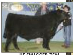
HF SWAGGER 75W

HF KODIAK 5R SANDY BAR ADVANTAGE 43M HF TIGER 5T WILBAR RUBY 955N HF ECHO 84R TC FREEDOM 104 HFDF ECHO 6N TC FREEDOM 104 CONNELLY FOREFRONT HF MISS BLACKCAP 27R T C RUBY 9095 HF MISS BLACKCAP 50N RIVERBEND POWERLINE 0050 HF MISS BLACKCAP 8G