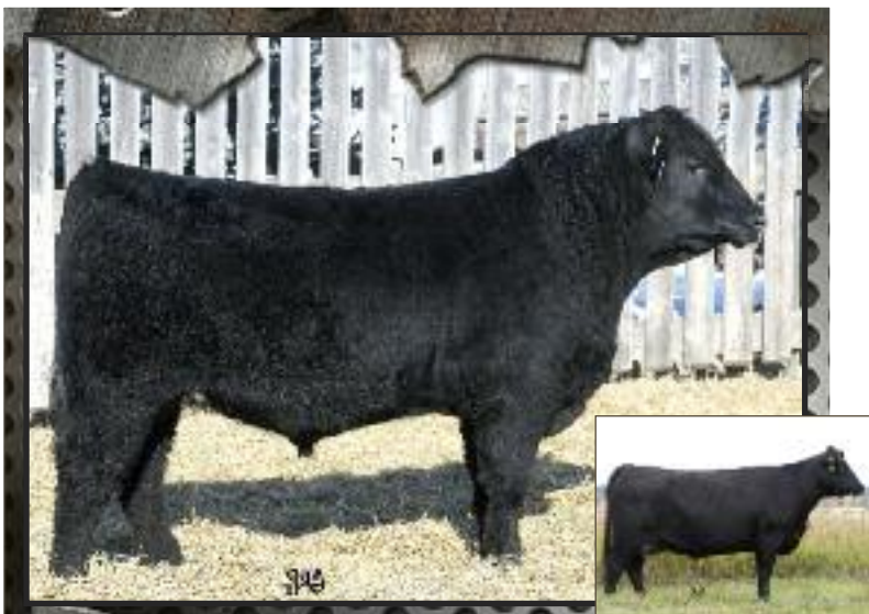
HF MISS MARION 130T

HF KODIAK 5R HF TIGER 5T HF ECHO 84R S A V 004 TRAVELER 4147 HF MISS MARION 130T HF MISS MARION 134L SANDY BAR ADVANTAGE 43M WILBAR RUBY 955N TC FREEDOM 104 HFDF ECHO 6N S A V 8180 TRAVELER 004 S A V EMBLYNETTE 1181 PEAK DOT WONDER 13J ALLENCROFT MISS MARION 09 64J BW 95 Sep 23 WT 955 ADJ 205 WT 824 SALE DAY WT WPDA 3.75 AGE OF DAM 3 BW 4.0 WW 62 YW 108 MILK 25 TM 56 SC CE 1.0 MCE 2.0