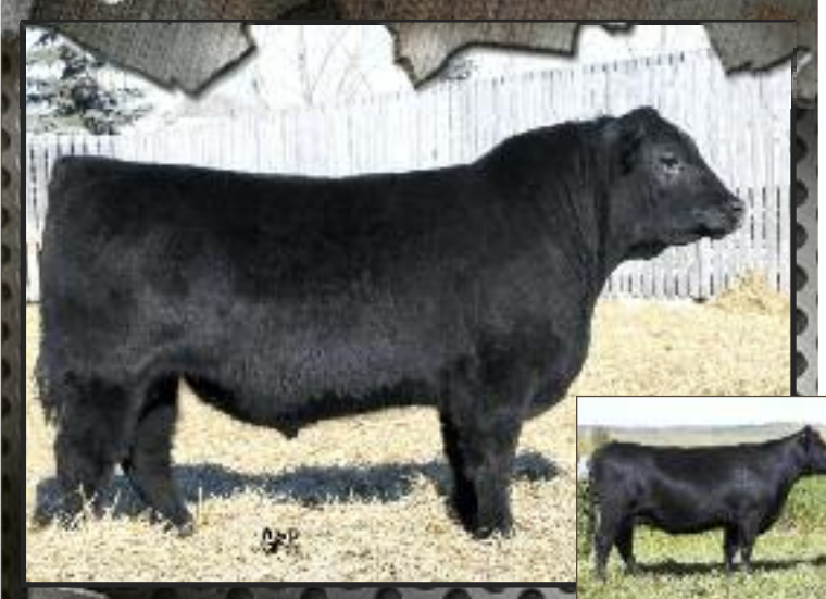
HF TIBBIE 41T

SANDY BAR ADVANTAGE 43M HF KODIAK 5R WILBAR RUBY 955N RITO 2V1 OF 2536 1407 HF TIBBIE 41T HF TIBBIE 74L TC ADVANTAGE SANDY BAR JEMINA 44K VERMILION YELLOWSTONE WILBAR RUBY 161J BON VIEW NEW DESIGN 1407 G A R PRECISION 2536 PEAK DOT WONDER 13J HF TIBBIE 127J BW 90 Sep 23 WT 790 ADJ 205 WT 702 SALE DAY WT WPDA 3.16 AGE OF DAM 3 BW 3.3 WW 47 YW 87 MILK 17 TM 41 SC 1.05 CE 2.0 MCE 3.0