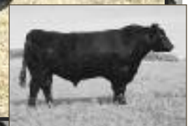
HF PROGRESS 20K