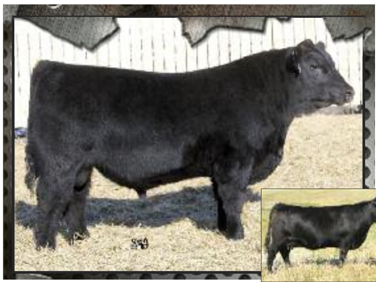
WILBAR RUBY 955N

BW 98 Sep 23 WT 807 ADJ 205 WT 696 SALE DAY WT _____ WPDA 3.32 AGE OF DAM 7 BW 4.7 WW 46 YW 81 MILK 21 TM 44 SC CE -6.0 MCE -1.0