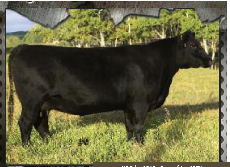
HF Echo 106S - Dam of Lot 197X

BW 85 Sep 23 WT 770 ADJ 205 WT 689 SALE DAY WT _____ WPDA 3.22 AGE OF DAM 4 BW 3.3 WW 39 YW 70 MILK 19 TM 39 SC _____ CE -2.0 MCE 2.0