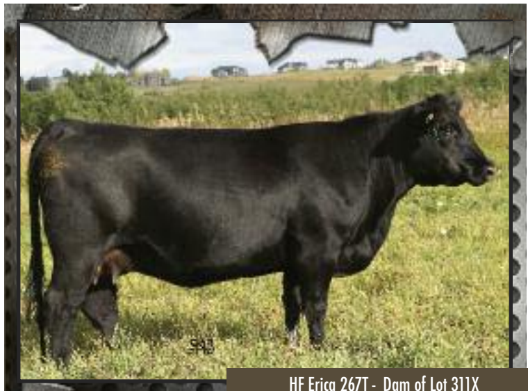
HF Erica 267T - Dam of Lot 311X

BW 97 Sep 23 WT 753 ADJ 205 WT 746 SALE DAY WT WPDA 3.42 AGE OF DAM 3 BW 4.2 WW 46 YW 75 MILK 13 TM 36 SC CE -5.0 MCE -2.0