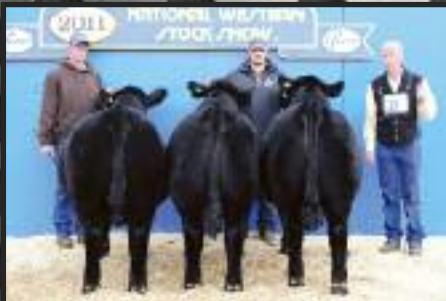
CLASS WINNING PEN OF 3 BULLS Sired BY HF TIGER 5T AND EXHIBITED BY MOUNTAIN VIEW FARMS