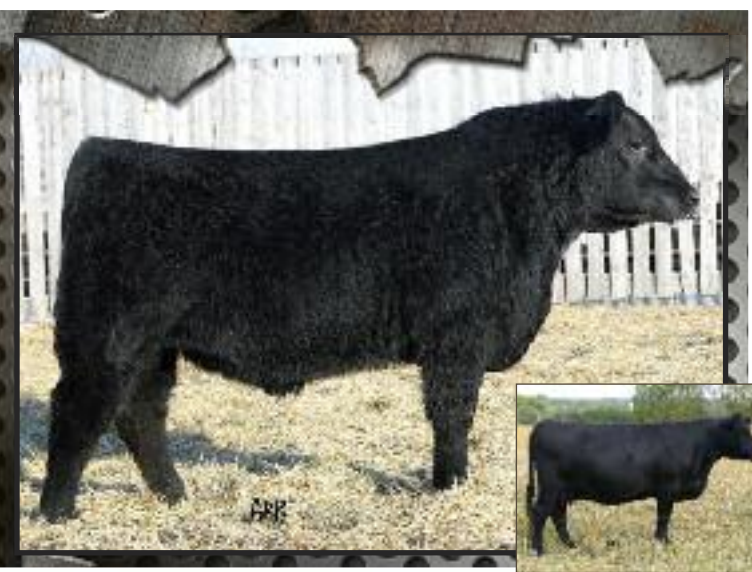
HF PRIDE 269T

BW 86 Sep 23 WT 740 ADJ 205 WT 739 SALE DAY WT WPDA 3.39 AGE OF DAM 3 BW 2.2 WW 42 YW 73 MILK 12 TM 33 SC CE 2.0 MCE 2.0