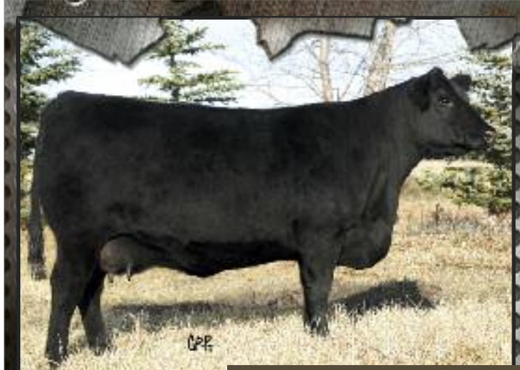
HF Tibbie 193U - Maternal sister to Lot 306X

BW 82 Sep 23 WT 741 ADJ 205 WT 693 SALE DAY WT _____ WPDA 3.35 AGE OF DAM 5 BW 1.7 WW 44 YW 80 MILK 18 TM 40 SC 0.53 CE 7.0 MCE 7.0