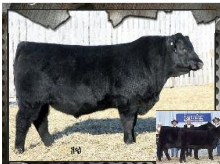
HF BLACKBIRD 99G

BW 90 Sep 23 WT 905 ADJ 205 WT 761 SALE DAY WT WPDA 3.63 AGE OF DAM 8 BW 2.1 WW 56 YW 103 MILK 17 TM 45 SC 0.24 CE 5.0 MCE 4.0