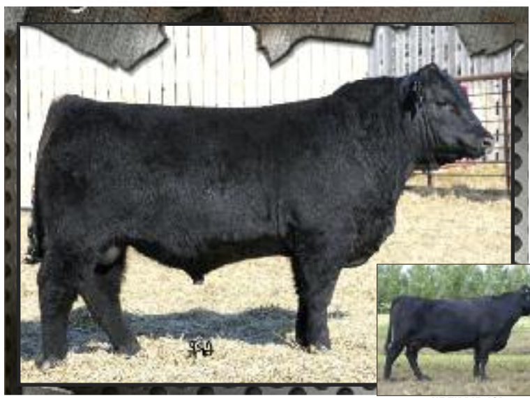
HF TIBBIE 43R

BW 89 Sep 23 WT 923 ADJ 205 WT 776 SALE DAY WT _____ WPDA 3.71 AGE OF DAM 5 BW 3.5 WW 49 YW 85 MILK 22 TM 47 SC CE -1.0 MCE 2.0