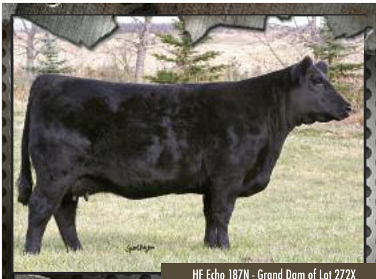
HF Echo 187N - Grand Dam of Lot 272X

BW 95 Sep 23 WT 740 ADJ 205 WT 708 SALE DAY WT WPDA 3.22 AGE OF DAM 3 BW 5.3 WW 38 YW 71 MILK 19 TM 38 SC CE -3.0 MCE -3.0