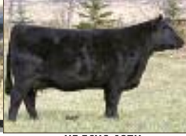
HF ECHO 187N