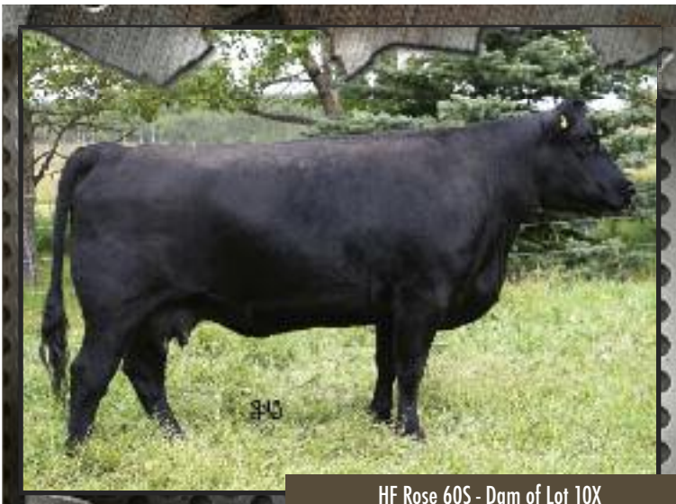
HF Rose 60S - Dam of Lot 10X

BW 76 Sep 23 WT 805 ADJ 205 WT 665 SALE DAY WT _____ WPDA 3.08 AGE OF DAM 4 BW -0.4 WW 38 YW 72 MILK 18 TM 37 SC _____ CE 9.0 MCE 6.0