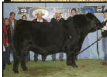
Reserve Senior Champion Bull, National Western Stock Show 2011