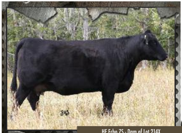
HF Echo 7S - Dam of Lot 214X

BW 95 Sep 23 WT 810 ADJ 205 WT 729 SALE DAY WT _____ WPDA 3.42 AGE OF DAM 4 BW 5.7 WW 47 YW 81 MILK 15 TM 39 SC CE -7.0 MCE -2.0