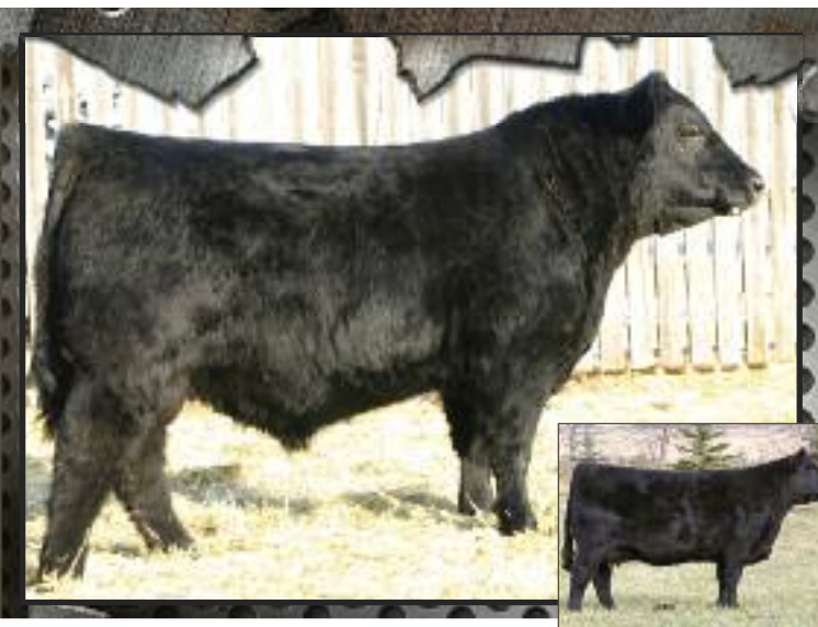
HF ECHO 187N

BW 4.8 WW 43 YW 74 MILK 18 TM 39 SC CE -4.5 MCE 0.0