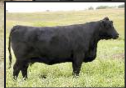
HF Tibbie 86K - Dam