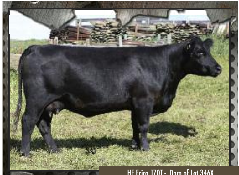
HF Erica 170T - Dam of Lot 346X

BW 86 Sep 23 WT 707 ADJ 205 WT 722 SALE DAY WT WPDA 3.32 AGE OF DAM 3 BW 4.1 WW 47 YW 72 MILK 16 TM 40 SC CE -3.0 MCE 2.0