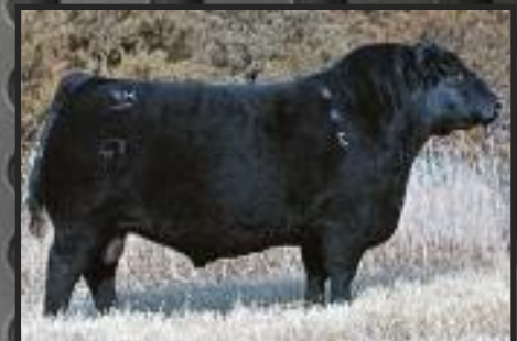
HF PROWLER 43U (OWNED BY HANDHILLS COLONY AND RECENTLY PURCHASED BY BOSS PREMIER CATTLE, NEBRASKA)