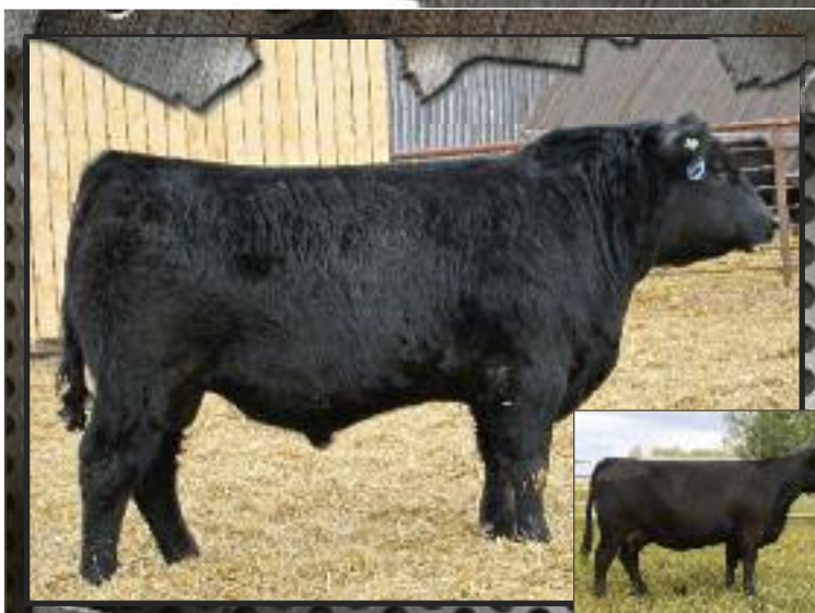
HF BLACKBIRD 197S

BW 83 Sep 23 WT 690 ADJ 205 WT 680 SALE DAY WT WPDA 2.9 AGE OF DAM 2 BW 2.6 WW 40 YW 76 MILK 16 TM 36 SC CE 2.0 MCE 2.0