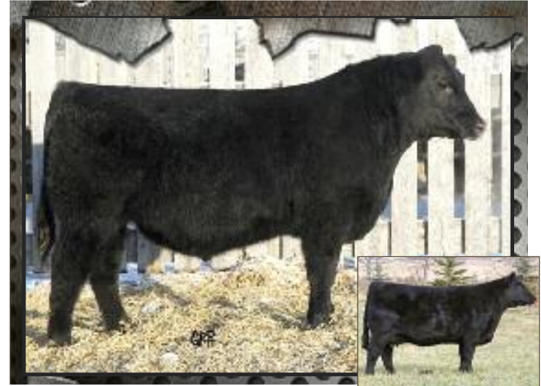
HF ECHO 187N

BW 95 Sep 23 WT 672 ADJ 205 WT 625 SALE DAY WT _____ WPDA 3.01 AGE OF DAM Recipient Dam BW 3.9 WW 39 YW 67 MILK 17 TM 36 SC -0.39 CE 1.5 MCE 3.0