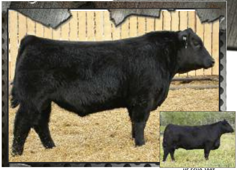
HF ECHO 189T

SOUTHLAND FREE RIDE 68R SOUTHLAND EXCLUSIVE 62U SOUTHLAND SUSAN 58L HF KODIAK 5R HF ECHO 189T HF ECHO 187N TC FREEDOM 104 AMF NHF SOUTHLAND ERROLINE 44L RONAN R BANDOLIERMERE 108H RONAN SUSAN 36J SANDY BAR ADVANTAGE 43M WILBAR RUBY 955N TC FREEDOM 104 DURALTA 14C ECHO 32E BW 97 Sep 23 WT 657 ADJ 205 WT 666 SALE DAY WT WPDA 3.04 AGE OF DAM 3 BW 5.2 WW 42 YW 75 MILK 13 TM 34 SC CE -6.0 MCE -1.0