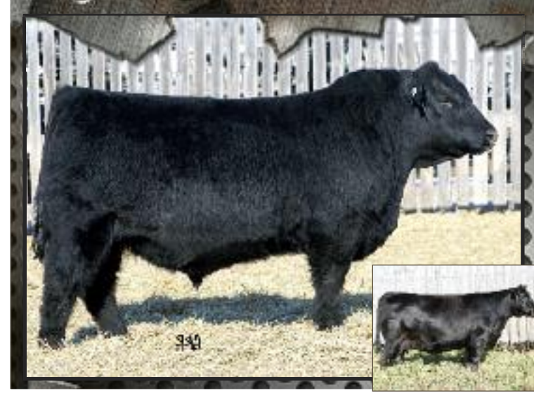
HF TIBBIE 100M

HF KODIAK 5R SANDY BAR ADVANTAGE 43M HF TIGER 5T WILBAR RUBY 955N HF ECHO 84R TC FREEDOM 104 HFDF ECHO 6N REMITALL ICEMAN 10K DURALTA 111A CHANCE 11H HF TIBBIE 100M LLB KEEPSAKE 94H HF TIBBIE 86K GREENS PREMIUM 7578 HF TIBBIE 2D BW 93 Sep 23 WT 913 ADJ 205 WT 868 SALE DAY WT _____ WPDA 4.21 AGE OF DAM 8 BW 4.2 WW 67 YW 112 MILK 25 TM 59 SC 0.41 CE -2.0 MCE 1.0