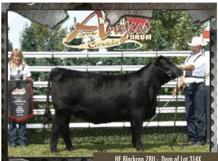
HF Blackcap 78U - Dam of Lot 314X

BW 90 Sep 23 WT 723 ADJ 205 WT 754 SALE DAY WT WPDA 3.29 AGE OF DAM 2 BW 3.4 WW 41 YW 67 MILK 19 TM 40 SC CE 0.0 MCE 3.0