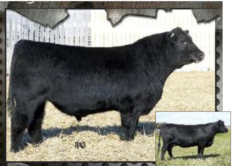
HF BLACKBIRD 154S

BW 85 Sep 23 WT 813 ADJ 205 WT 767 SALE DAY WT _____ WPDA 3.63 AGE OF DAM 4 BW 1.6 WW 43 YW 79 MILK 22 TM 44 SC _____ CE 4.0 MCE 2.0