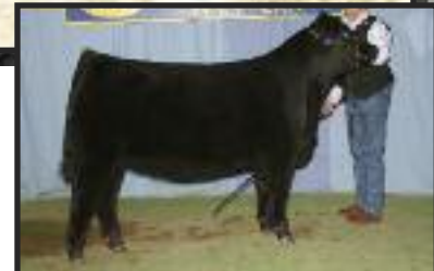
HF ERICA 20X the $15,500.00 Lot 1A in Hamilton Farms Feature Female Sale to Continental Angus, Leduc, Ab.