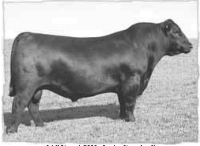
S A V Bismark 5682 - Service Sire to Lot 41