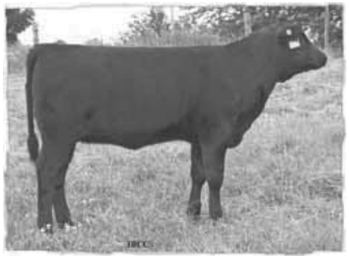
Lot 25 - Glen Islay Pride 44W