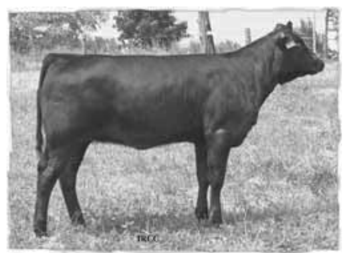
Lot 24 - Glen Islay Maggie 32W