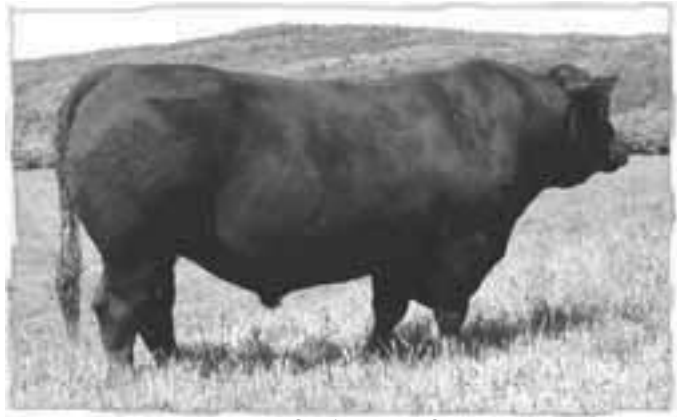
Norben Garnish Monty 18M