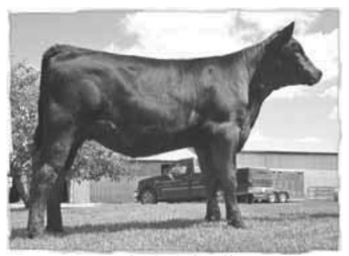
Lot 53A - First Line Queen 28W