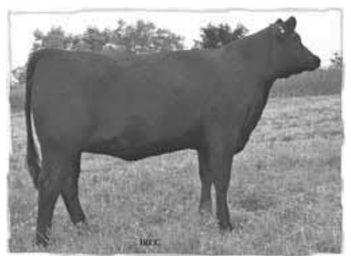
Lot 30 - Glen Islay Erica 51U