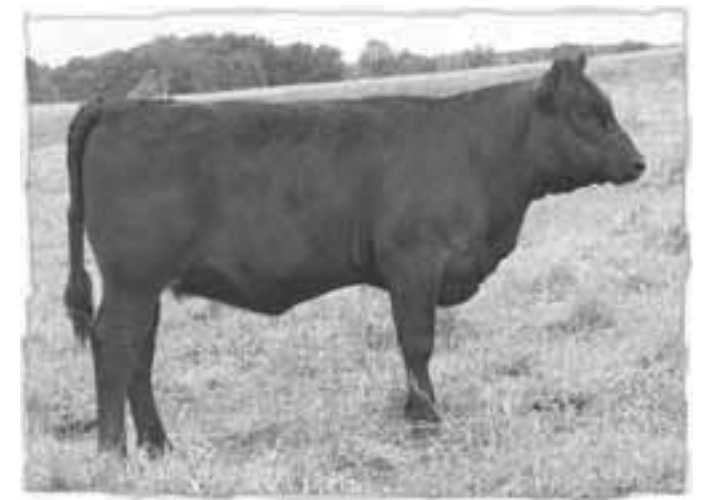
Lot 1 - Harprey Lassie IW

Lots of potential here, sired by Prime Time Krugerrand 548R, the herd bull we purchased as high seller in Prime Time's annual bull sale. Lassie 1W is really deep with great eye appeal. Hard to sell this heifer calf with her whole future ahead, but her dam is young so hopefully she can raise another one. One of the neighbours is showing 1W in 4-H and we would like to maintain possession until after the Royal if possible.