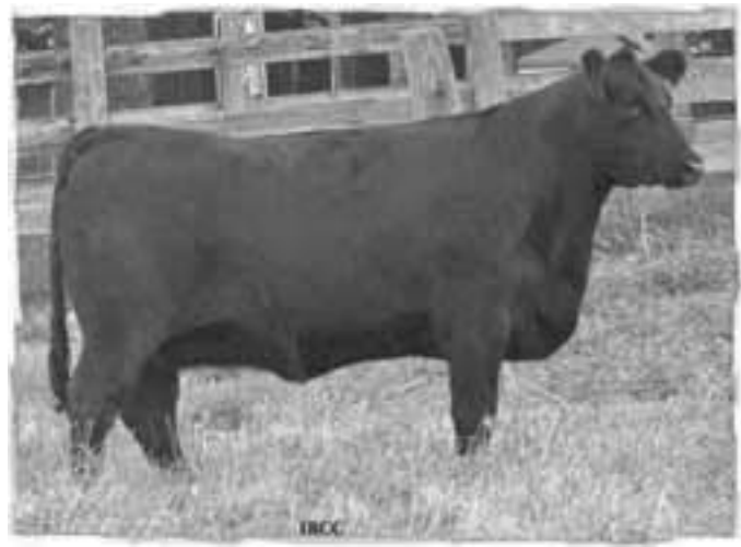
Lot 28 - Glen Islay Mayflower 31U