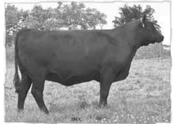
Lot 27 - Glen Islay Pride 4U

Bred: May 8, 2009 to Double AA Bardolier 119'08 -1464905-. Examined safe in calf.