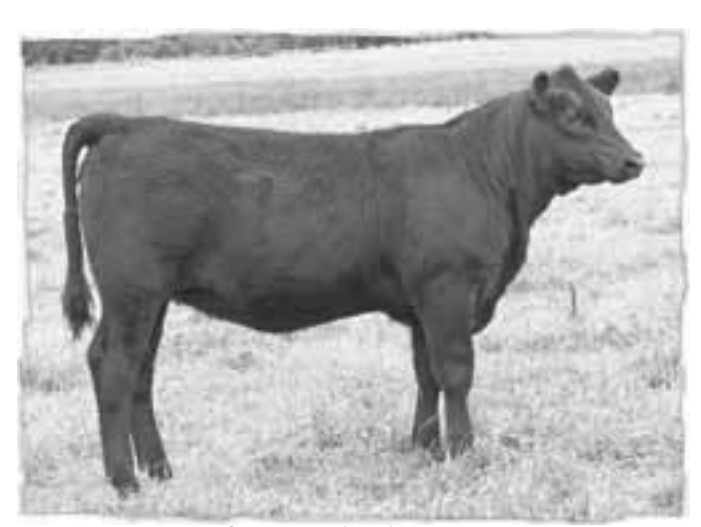
Lot 3 - Harprey Miss Middlebrook 7W

HARPREY MISS MIDDLEBROOK 7W Female PSH 7W 1499041 January 14 2009