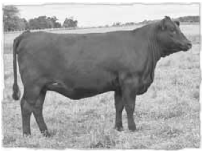
Lot II - Harprey Mayflower 84U