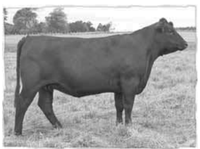
Lot 19 - Harprey Annie 51U

Harprey Annie 51U is a moderate framed, easy keeping heifer sired by Harron Hamilton 15S. Her dam is an easy keeping cow that came from Prime Time. Maternal sister sold in last year sale to Oak Ridges Moraine Cattle Company. Bred: July 25, 2009 to Haprey Slugger 11U -1433399-