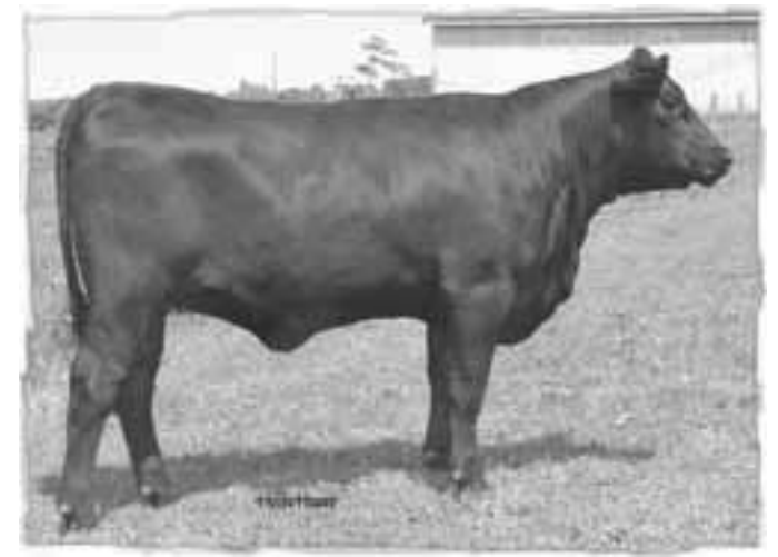
Lot 43 - Allencroft Beauty 06 193U

Exposed: April 26 to July 1, 2009 to J P D Ultimo 19U -1430371-