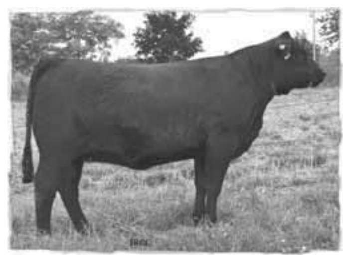
Lot 29 - Glen Islay Barbara 60U