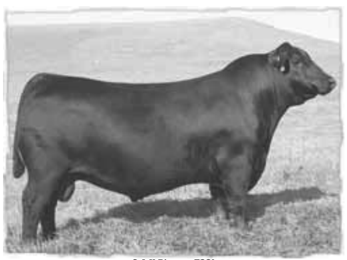
S A V Pioneer 7301

We are very happy to still be associated with G_{\mathcal{A}}\mathcal{P} . Sale and we look forward to seeing you at the new sale location at Harprey Farms, Proton Station, Ontario.