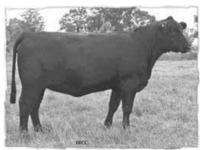
Lot 32 - Glen Islay Jennifer 76U