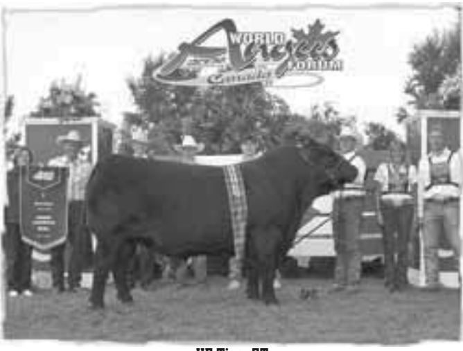
HF Tiger 5T