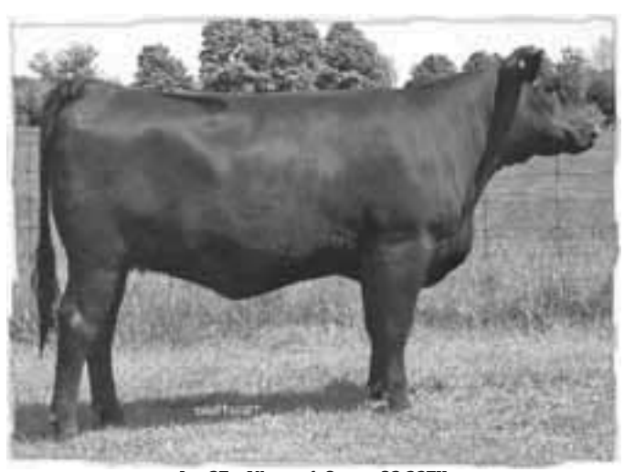
Lot 37 - Allencroft Queen 03 227U