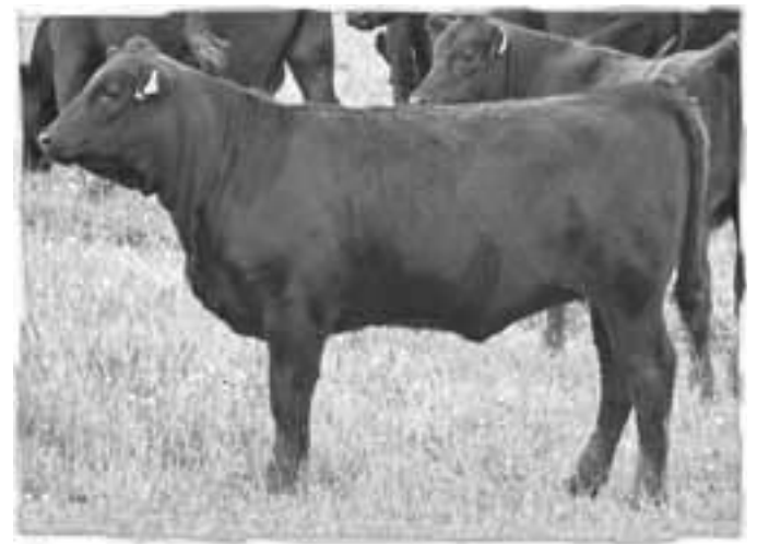
Lot 46 - TREV Blackcap Matarix I3W

Nice January heifer sired by the popular SAV Peacemaker. She is long, deep and clean fronted. Her dam JPD Blackcap 11J is a powerful cow that we bought in the 2001 from JPD Farms. She is a hard working female that has given us many outstanding progeny.