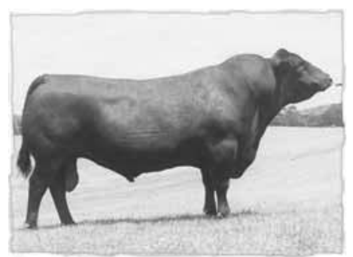
Three Trees Prime Cut 0145 - Service Sire to Lots 12, 13 & 17

Bred: July 13, 2009 to Haprey Slugger 11U -1433399-