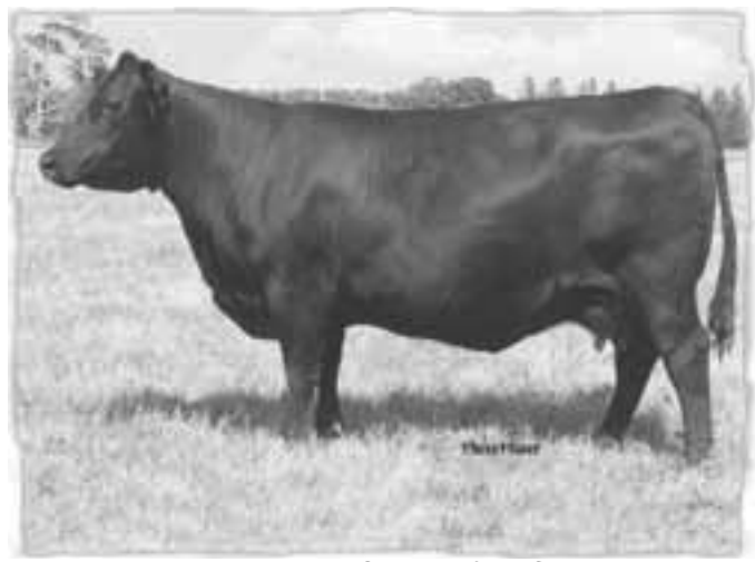
JPD Blackcap IOM - Dam of Lot 46