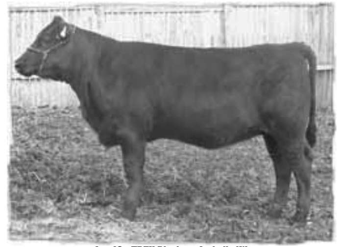
Lot 48 - TREV Blackcap Isabelle IW