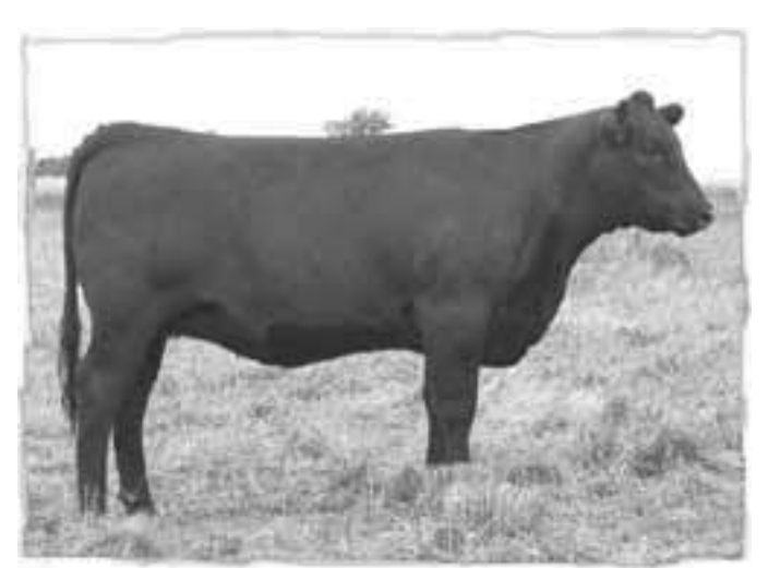
Lot 6 - Harprey Flora 44U