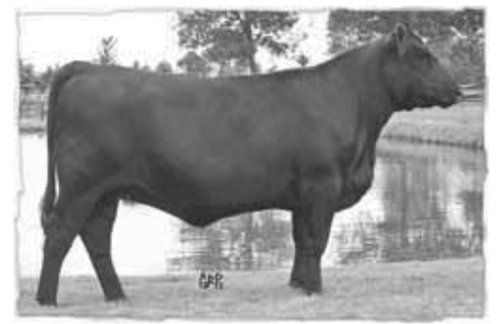
Lot 62 - Heatherlea Barbara 70

HOLDING AND SHIPMENTS: Approximately one week is required for export trans-