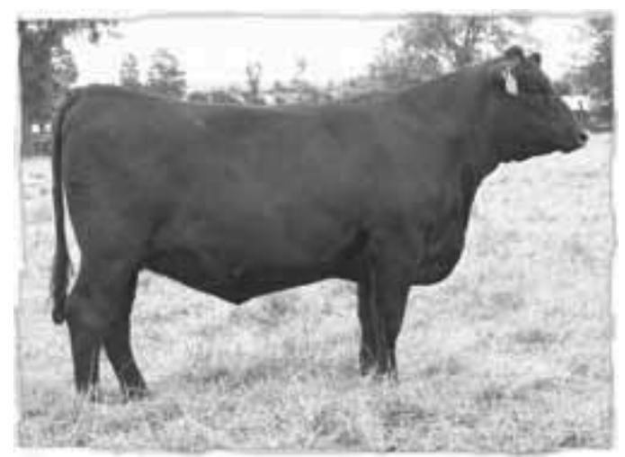
Lot 4 - Harprey Roxy 330