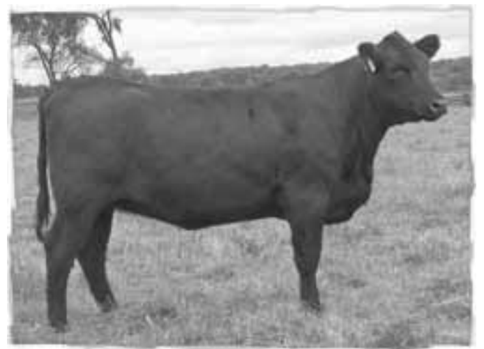
Lot 7 - Harprey Queen IU

TC STOCKMAN TC PRIDE 0014 B A F EXCELL LAD 2600 PREMIER BLACKBIRD 2183T WANDERING CRK DYNASTY JRM 2F DMM MISS ESSENCE 22B BANNER SUN 23C LOMA LANES QUEEN 55C