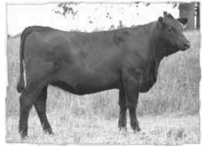
Lot 18 - Harprey Pride 860

Bred: April 18, 2009 to Three Trees Primecut 0145 -1202388-