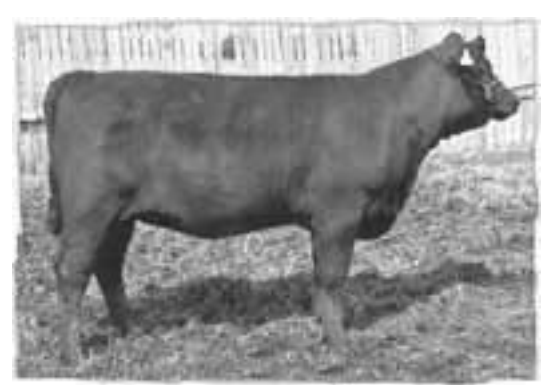
Lot 44 TREV Wild Fire Bessie 8W

We look forward to seeing you at the sale.