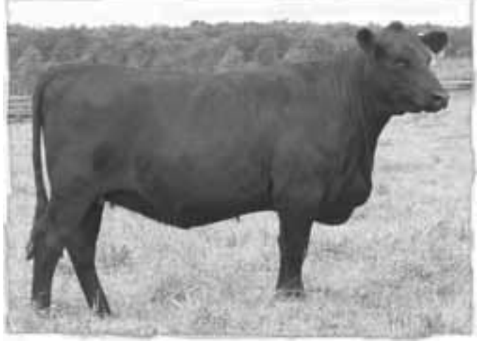
Lot 8 - Harprey Barbara McHenry 410

Exposed: May 25 to July 12, 2009 to Harprey Rockstar 12U -1433400-. Observed bred on May 25, 2009.