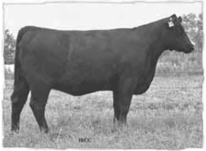
Lot 31 - Glen Islay Maggie 49U