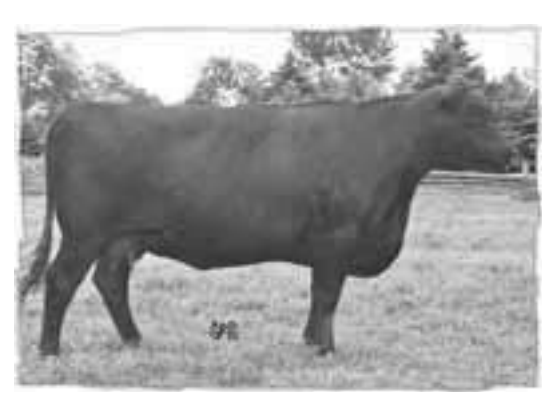
Lot 58 Heatherlea Maggie 12N

2007: Senior Bull Calf Champion, Regina Agribition