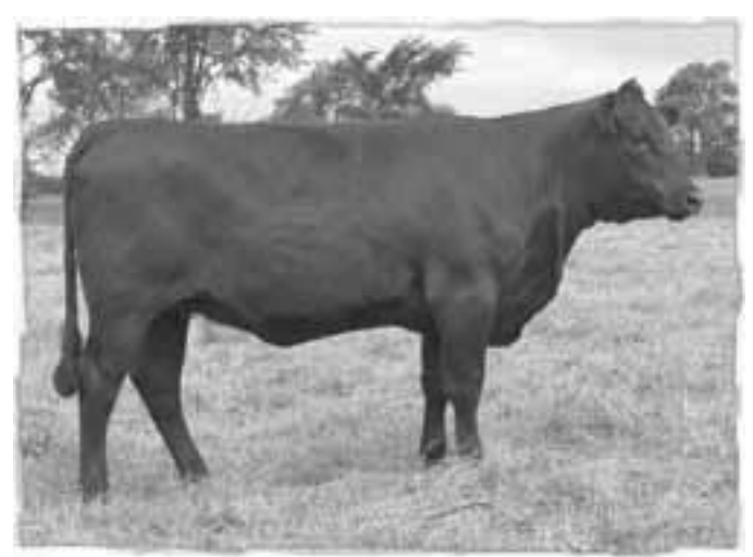
Lot 10 - Harprey Barbar 470