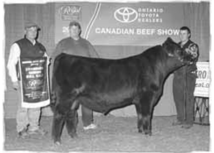
Harprey Slugger IIU

Intermediate Bull Calf Champion at the 2008 National Angus Show Royal Winter Fair. A maternal brother was 2007 Reserve Senior Bull Calf at the Royal. Rockstar 12U is a very well muscled son of previous Royal Champion Just-Rock Solid. The Miss MIddlebrook's have been a very productive cow family here at Harprey.