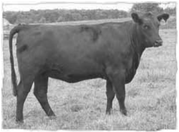
Lot 17 - Harprey Betty 78U