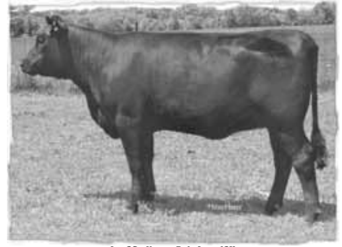
Lot 36 - Young Dale Lass 120

Exposed: April 26 to July 1, 2009 to J P D Ultimo 19U -1430371-