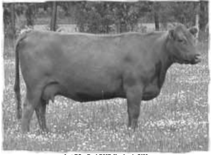
Lot 50 - Red RMR Kashmir 21M