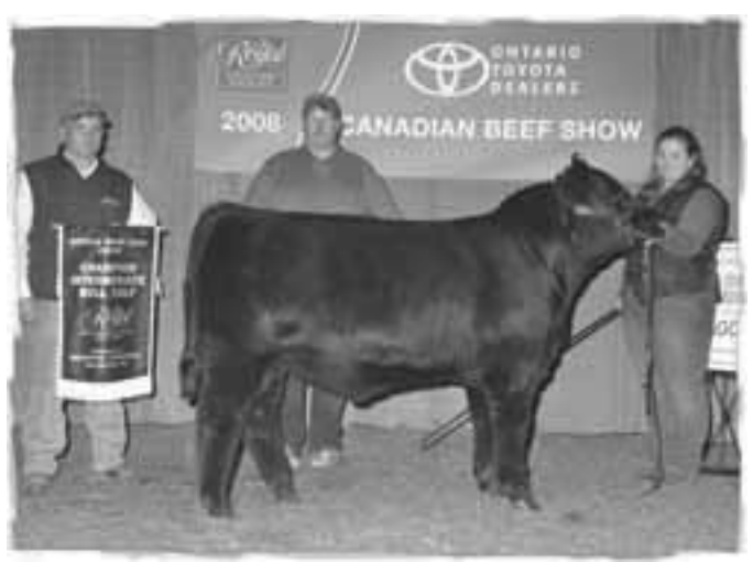
Harprey Rockstar 12U