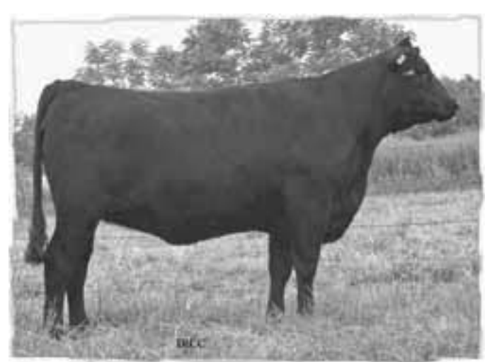
Lot 26 - Glen Islay Pride 2U