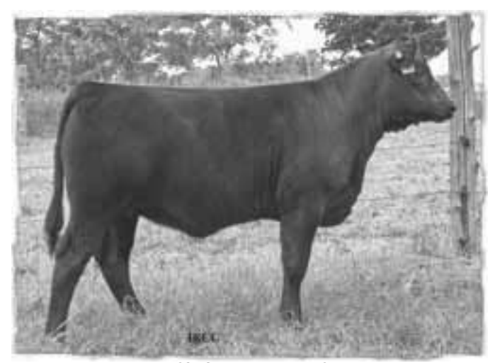
Lot 23 - Glen Islay Bar Doll 21W