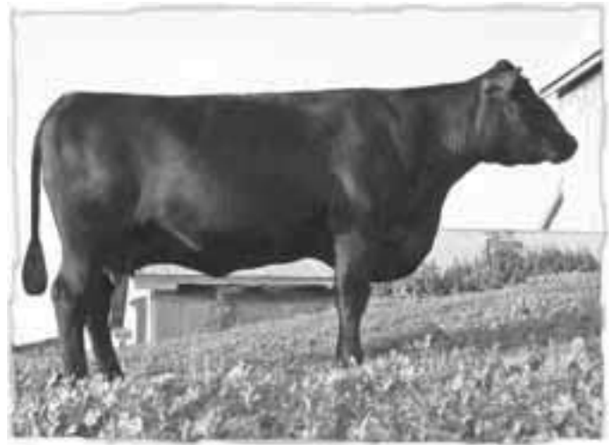
Lot 52 - First Line Countess I3R