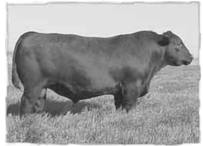
Bushs Grand Design - Sire of Lot 34

Bred A.I.: March 27, 2009 to S A V Bismarck 5682 – 1369591-Exposed: April 26 to July 1, 2009 to J P D Ultimo 19U -1430371-