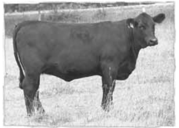
Lot 12 - Harprey Betty 5U

HARPREY BETTY 5U Female PSH 5U 1433391 January 02 2008