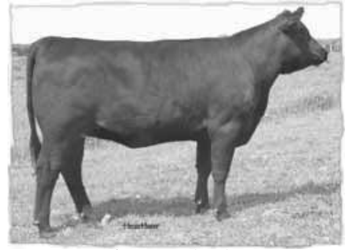
Lot 35 - Young Dale Miss Marion 5U

Exposed: April 26 to July 1, 2009 to J P D Ultimo 19U -1430371-