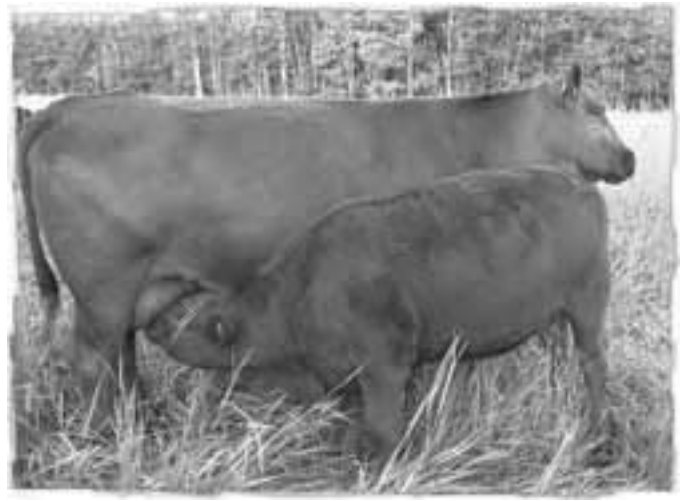
Lot 49 - Red Manasan Sapphire 128L & Lot 49A