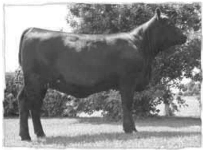
Lot 52A - First Line Countess 4W