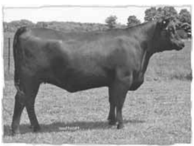
Lot 41 - Allencroft Annie K 07 176U