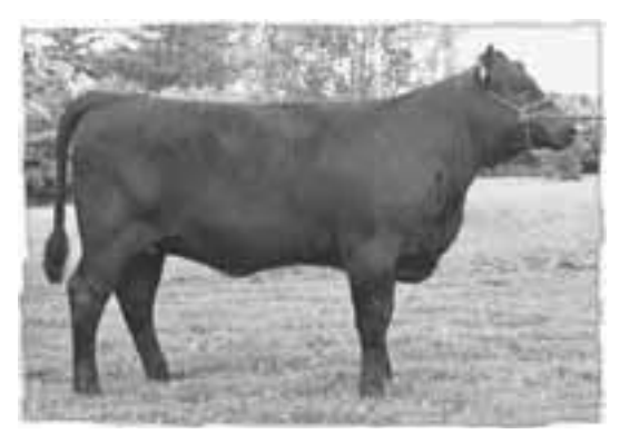
Lot 45 TREV Cinderella 9W