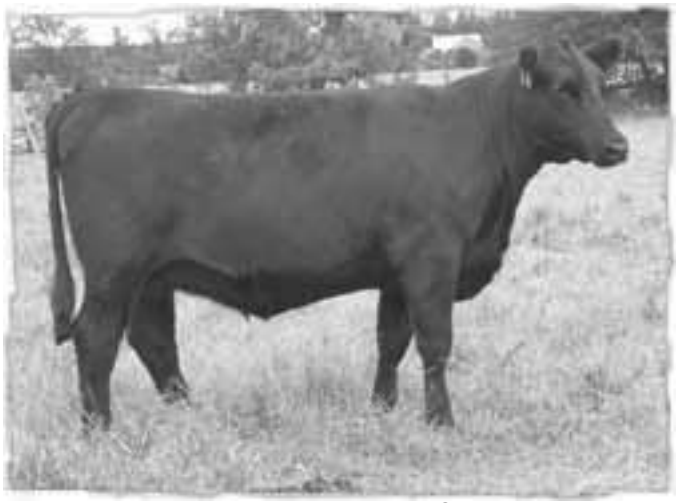
Lot 13 - Harprey Pride 20U

Another daughter of Harron Hamilton 15S, 66U's dam is very popular with visitors. She is a deep sided cow with an excellent udder. This heifer is a bit younger but lots of potential. She should make a good brood cow in the future. Bred: May 14, 2009 to Three Trees Prime Cut 0145 -1202388-