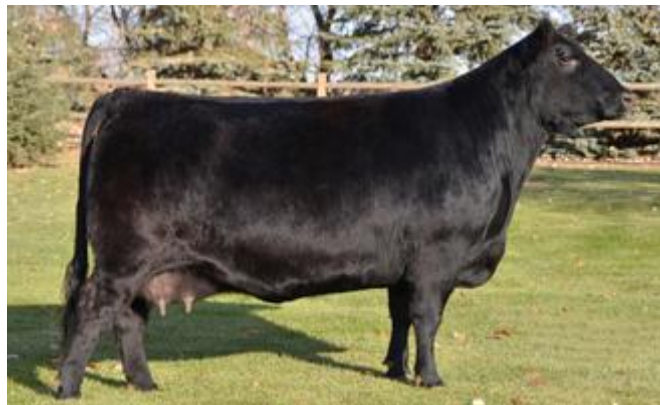
Dam of Lot 81 GF UNFORGETTABLE MERCEDES 2U

Here's a really nice heifer that will make a super cow. Her Saugahatchee dam is a strong maternal cow.