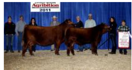
Maternal Sister RED SIX MILE GLORIA 746W

Gloria is a female to build a program around. 195B's dam is the dominant donor, 361T owned with Sunberry Valley Farm, AB. A maternal brother is a $13,000 herd sire for Triple X Red Angus, AB. A maternal sister, Gloria 746W, was the 2011 National Grand Champion Female with the bull calf, Smokin Gun at foot. He alone went on to be the 2012 U.S. National Reserve Grand Champion Bull at Denver.