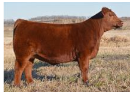
Sells a Lot 106 OUT OF A REDWOOD DAM