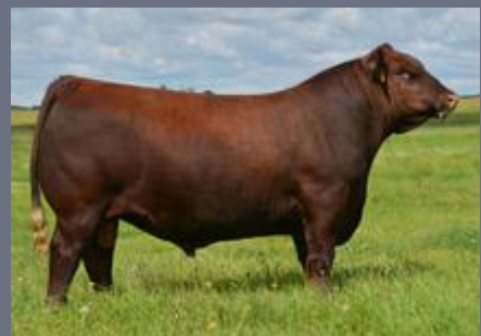
As a yearling RED SIX MILE SIGNATURE 295B

Semen Will Be Exportable To Most Countries