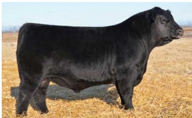
Sire of Lots 75 to 77 BNC GAME CHANGER 1Y

A nice made female that will calve early to LocoMotive.