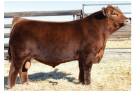
Sire RED WRIGHT'S 832S IRON HIDE 4Z

Check out this impressive Iron Hide March heifer calf. She's really come on and has developed into one of the favorites in the pen. She goes back to 88T that was added to the Rust Mountain View donor program. Iron Hide semen is off the market for eternity so your only opportunity to own Iron Hide genetics is through live cattle or embryo's.