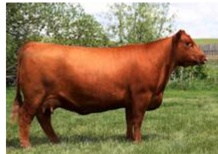
As a 2 Year Old RED SIX MILE FAVORITE 890S