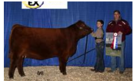
Full sister RED BLAIR'S BONITA 3B