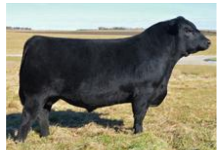
Sire REMITALL F ODYSSEY 67X

This heifer has found herself at the top of a lot of lists. This Odyssey daughter is perfectly balanced, extremely correct and ranks as one of the best in the sale.