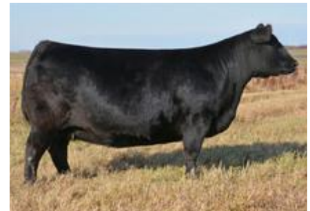
Daughter BLAIRS UPTOWN GIRL 105X