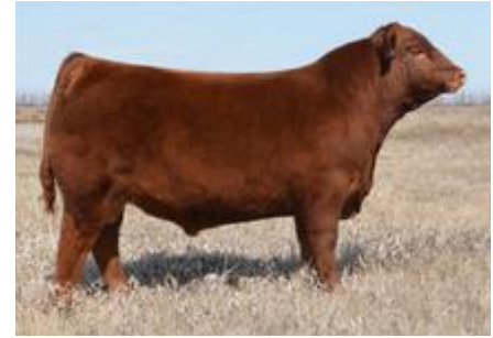
Full Sibling to Lot 29 & 30 RED BLAIR'S BINGO 581B

Here are two extraordinary Kargo daughters out of the Yankee 12W donor, making them full sibs to the lead-off and high selling Blairs.Ag bull, Bingo. He commanded $55,000 for one-half interest to the distinguished Power+Plus program in Oklahoma.