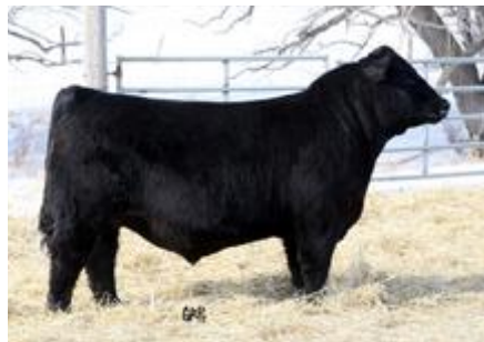
Sire SIX MILE TRADEMARK 9X