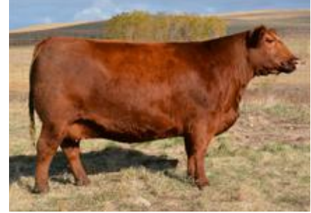
Dam RED SIX MILE LAKOTO 35W

A unique combination of femininity, muscle capacity and sheer style. Although it is her phenotype that may catch your attention, her maternal pedigree is even more intriguing. Her dam is our dynamic donor female, 35W, who is also the dam of the $65,000 half interest sire, Game Face and a $26,000 sire at Red Rock Red Angus, AB.