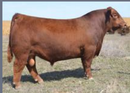
Lot 55B Sire PIE ONE OF A KIND 352

We are excited to introduce you to Copper Lady 8T, a fantastic donor originating in the Towaw herd. This leading lady is ultra-complete and flawless in her design, plus she features an ideal size and deep red color. Either sire should blend extremely well with 8T.