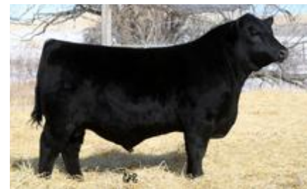
Maternal brother SIX MILE THUNDERSTRUCK 162Y