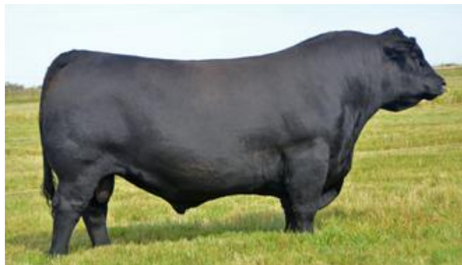
Service Sire to Lot 78 SOO LINE LOCOMOTIVE 1403

This girl certainly has some rib and capacity. Her mother was a top Annie K female in the Remington dispersion.