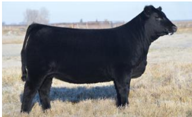
Maternal sister to Lot 85 BLAIRS MAYFLOWER

A full ET sister to Lot 84. She's nice and correct too.