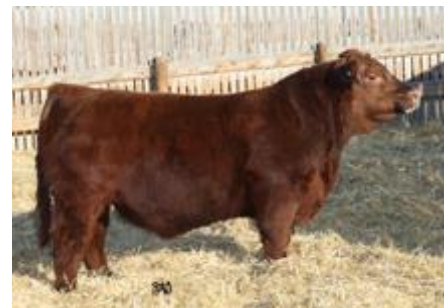
Lot 59 Sire RED U-2 RECKONING 149A

152C is a heifer's first calf. The Countess cow family has a long standing tradition in the Six Mile herd of producing top end progeny. Junior members take note – Countess is super easy to get along with and would make a great show project.