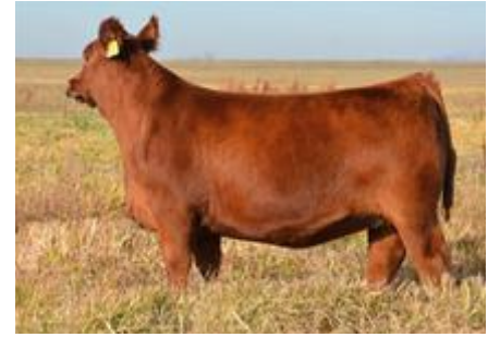
RED BLAIR'S MONIQUE 516C

This fantastic Monique heifer deserves an entire page of footnotes. This is definitely one to consider if you're looking for the next show prospect that will go on and make a breed leading donor. Impeccable pattern & design.