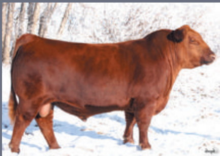
Lot 55A Sire RED WPRA LEGACY A-314