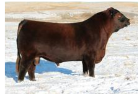
Service Sire RED SIX MILE & CO JAGGER 780A

Flower is a deep red, extremely attractive daughter of our 2009 high selling bull, Wild West. Her very exciting EPD tabulation allows for many mating choices. She is bred to the $120,000 valued, 2014 Agribition Reserve Grand Champion bull, Jagger.