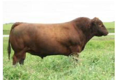
Sire RED RINGSTEAD KARGO 215U

The Kargo females are just so complete in every way. You can show them competitively and they'll go on and make incredible brood cows. Fanny puts together dimension and profile in a neat package.