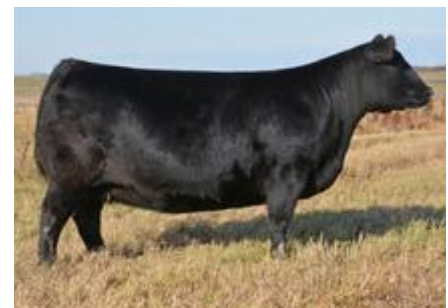
Maternal sister BLAIRS UPTOWN GIRL 105X

Another incredible Uptown Girl in the making. She's a maternal sister to Lot 1 and the great donor, Fatal Attraction. This heifer has a lot of star quality herself. Fantastic brood cow and potential donor.