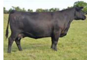
Dam SOO LINE MISS BIRDIE 197P

Here's a super smooth Cutting Edge daughter out of a black Soo Line female that was purchased by Brylor in last year's sale. Maternal power here.