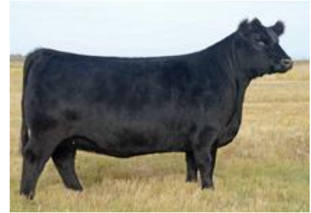
Maternal sister BLAIR'S DELLA 309A

The Della daughters are exquisite! They're perfect sized, high volumed with tons of eye appeal and balance. This New Generation daughter is big time!