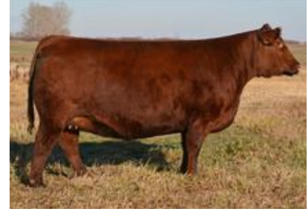
Dam RED BLAIR'S FAITH 74Y