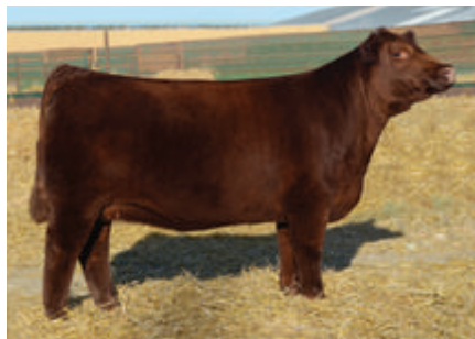
Paternal Sister RED BLAIRS PRISCILLA 44Z