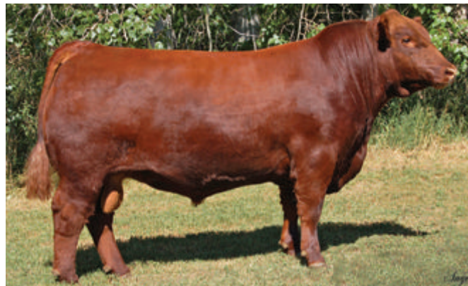
Service Sire RED LAZY MC DETOUR 2W

EXPOSED Red Blair's Iron Hide 630B › June 20 to 28; Red Rust North Dakota 27B › June 28 to July 22