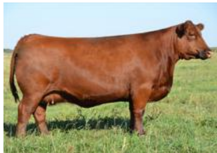
RED JCC ROXIE 20S

Roxie 20S is a standout cow that maintains herself so well and looks good ever day of the year. She's big, bold, feminine, easy fleshing and very sound structured. She's been a solid producer for Blairs. Ag and has 22 calves to her credit. A daughter sells as Lot 45. This terrific Mambo daughter calved a little late this year after flushing so we decided not to run her with a bull in order to hold her open for immediate embryo production. Sells open and Ready to Flush. Terms to be announced sale week.