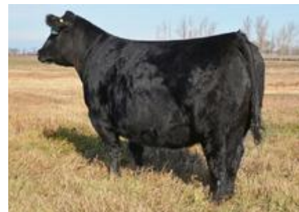
OK BELLE POWER 69X