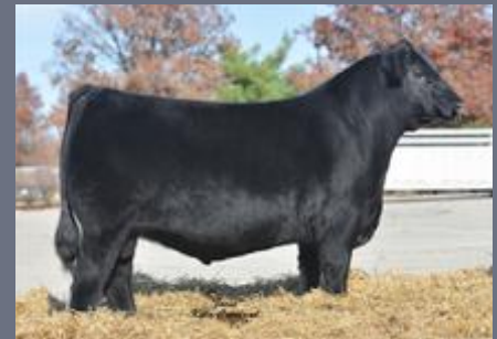
Lot 62 Sire SILVEIRAS S SIS GQ 2353