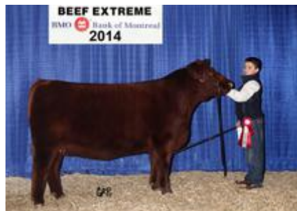
Granddaughter BLAIR'S LARKABA 42A