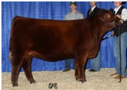
As a Bred RESERVE GRAND CHAMPION, '12 CWA

BRED Red MRLA Venture 26B ECD Late March EXPOSED Red MRLA Venture 26B › May 15 to June 30