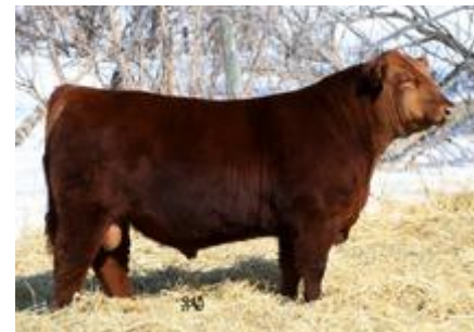
Sire RED SIX MILE RUGER 221X