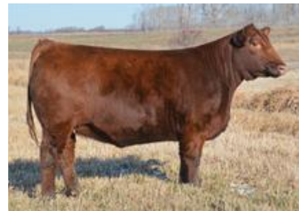
Daughter sells as Lot 26 RED BLAIRS FAITH 519C