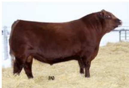
Sire RED SIX MILE TUFF ENUF 111Z