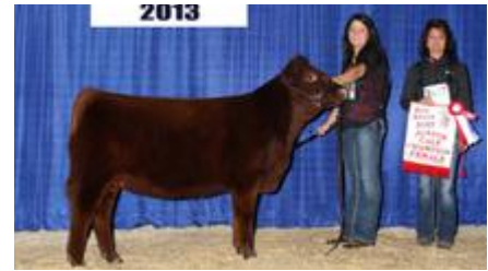
Maternal sister RED SIX MILE CRESTA 715A

A very special individual. Her maternal sister was 2013 Jr. Heifer Calf Champion and is now a donor female for Josh Tolbert, OK. Their dam, 35U, is a show stopping female with incredible production ability making her a CAA ELITE dam. We expect great things from these Reckoning daughters as their dam is one of the best uddered cows in the U2 herd. Whether you want a little fun in the show ring or a female to anchor a program - look no further.