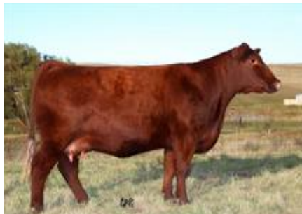
Full Sister RED SIX MILE ALANA 778A