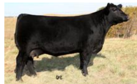
Paternal sister SIX MILE LADY OF SIX 735A