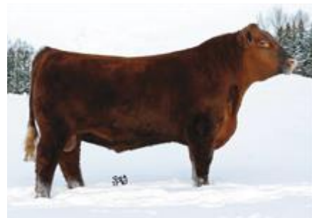
Maternal Brother DIAMOND T HIPS STOUT