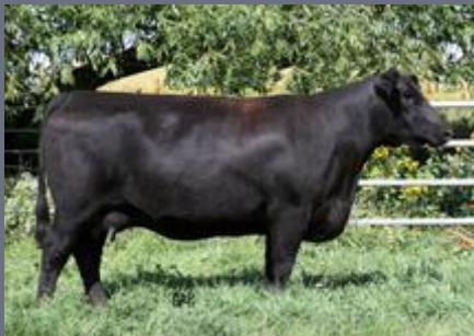
Dam SIX MILE BLACKBIRD 864U

16X is a moderate framed, easy keeping, perfect uddered female. She is a member of our founding Black Angus cow family, the Blackbirds that originated out of the Rose Hill Angus dispersal. She has a high selling son at Riverfront Angus Ranch, AB and a daughter at CowTrax Ranch, SK. Her 2014 heifer is anchoring our Black Angus show string this fall. 16X will enter our ET program in 2016 and here is your opportunity to add genetics that will put you ahead of the game. Guaranteeing a minimum of 6 embryos with all embryos going to the buyer. Flush to be done in May 2016.