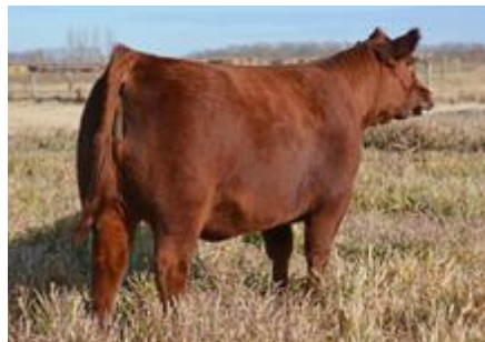
RED BLAIR'S MONIQUE 522C