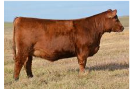
Sells as Lot 49 DAUGHTER OF LOT 9