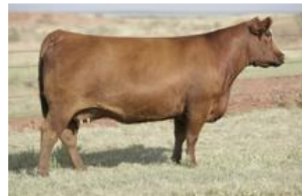
Twin to Dam SIX MILE LAKOTA 112Y