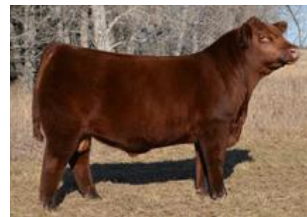
Great Grandson RED DOUBLE B BACKROAD 2C