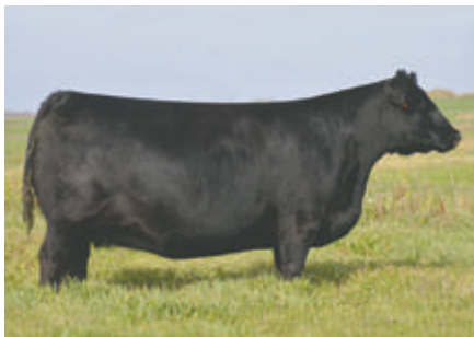
BLAIR'S UPTOWN GIRL 105X

What a way to lead off the Genetic Focus '15 event!! Uptown Girl 105X is a fascinating female that is rare combination of immense power with exceptional phenotypic quality. We challenge you to find a donor with more dimension, extension, balance and style for sale this season. Much like her Mulberry sister and stallmate, Blackbird 107X, that highlighted the Wildcat Dispersion, 105X has that same star power and can be feature donor in any type of program in North America. She's safe to the impressive Signature herd sire and may have the first calf on the ground out of this exciting young bull. Her productive dam sells as Lot 2. Black/Red Carrier . Terms to be announced sale week. Consigned with Shaneri Farms.