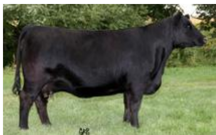
Dam SIX MILE TIBBIE 901W