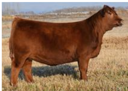
Sells a Lot 96 OUT OF A REDWOOD DAM