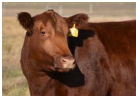
RED BLAIR'S ALICE 118Z

Here's a young, 3 year old Redwood daughter that has developed into a really impressive cow. She's smooth, well balanced, and really powerful for her age. The Redwood daughters have proven to be excellent producers as a couple of their progeny are standouts in the show prospect pen. A lot of potential and future in this awesome female. Since we haven't had an opportunity to flush this special female, we'd like to work with the new owner of Alice 118Z in future embryo production. Terms to be announced sale week.