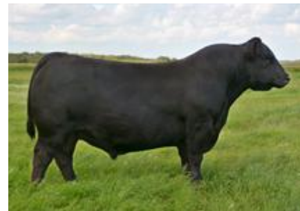
Service Sire OSU FINAL EXAM 3139