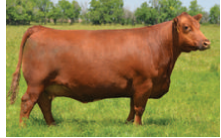
Summer 2014 RED SPAERMAN COOKIE QUEEN 713P

If you're looking for a low maintenance, easy fleshing, moderate designed donor with exceptional volume and substance, Cookie is the female for you. This truly unique female was purchased from the Shane Cadieux dispersion and features functional Canadian outcross genetics. She's still very sound and fresh and probably looks as good now as she ever has.