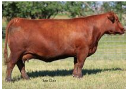
Grand-Dam RED LPC SOAPY'S LOGAN 41K