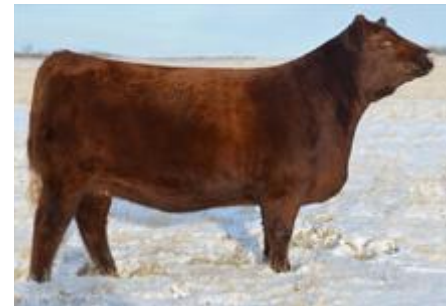
Paternal Sister RCRA LACEY 3Z

A full sib to Lot 38 that is a Cutting Edge out of our Riverdale donor, 340L. A can't miss mating to Bingo, our powerful Kargo son.