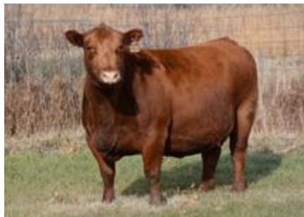
RED SIX MILE FAVORITE 890S