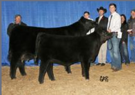
2015 National Champion Female BAR-E-L ERICA 74A

Here's a fabulous opportunity to purchase an embryo package from the reigning 2015 National Champion Angus Female, Bar-E-L Erica. This awesome 2 yr old has created quite a buzz in Canada by winning Brandon, Lloyd and recently Edmonton. This package is sired by the powerful Styles son, GQ, a crowd favorite in Denver last year. Consigned with Blairs West Land & Cattle.