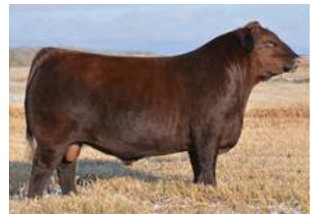
Service sire SIX MILE SIGNATURE 295B

Here's a stout, powerful dark red Mambo daughter that could be carrying her best calf to date as she's bred early to the extraordinary young sire, Six Mile Signature. She's not a showoff, but she's typical of the Mambo daughters... they're functional, sound and do a good job every year.