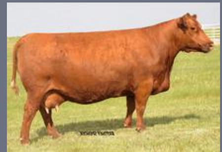
Dam RED BKT LARKEISA M288 CK