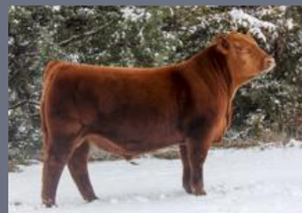
Lot 60 Sire AHL FLASHBACK 446B

Embryos sired by the $102,000 high selling bull at the 2015 Denver Western Heritage sale, and out of the 2014 Agribition champion female sired by Indeed. 169Z has an amazing udder as expected and has done a great job on her calves. This is a fresh exciting combination.