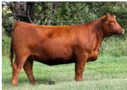
Maternal Sister RED SIX MILE LASSIE 417X