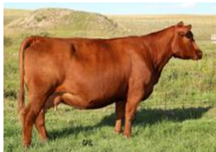
Dam RED GLESBAR LAKIMA 112T

EXPOSED Red L83 Super Duty 244Z › May 25 to July 1 (Favorable to pasture exposure)