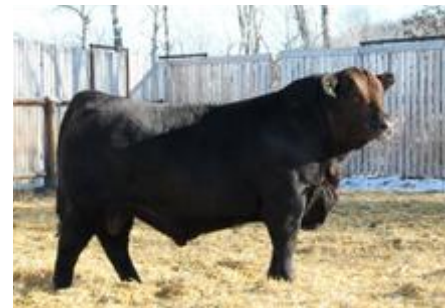
Sire PEAK DOT ELIMINATOR 100Z

A unique, super capacity brood cow prospect. Dixie is an outcross daughter of the black sire, Peak Dot Eliminator whose first calf crop has really caught our attention. Her dam came from the solid Sunberry Valley herd . She raised the $14,500 herd bull, Ruff Ride, for Spittalburn Farms on her first try.