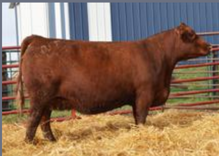
Maternal Sister W7

North Dakota 27B was the lead off Red Angus bull at the Rust Mountain View bull sale this past spring. What caught our attention was a total package of performance, muscle, conformation, fleshing ability, scrotal size and more. A total outcross pedigree to our programs only added to the attraction. His dam is a 2002 model that has definitely stood the test of time and has excelled as one of Rust's leading donors. This lot will be the last package to be offered for the 2016 breeding season. Co-owned with SSS Red Angus and Rust Mountain View Ranch.