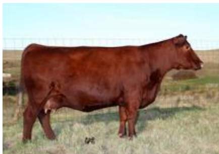
Dam RED U6 ALANA 13X