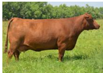
Grand-Dam RED TIDE MARTINI 25W