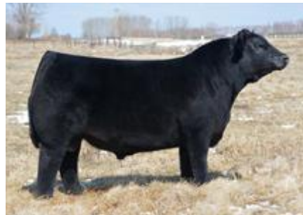
Service Sire SC WHEATLAND HIGH CLASS 401B