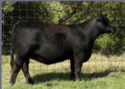
Daughter SIX MILE BLACKBIRD 644A