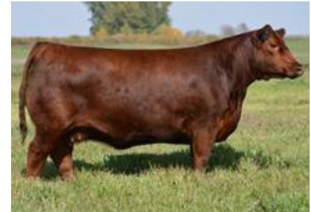
Dam RED BLAIR'S NICE 25Y

This female is a tank! Deep, big middle, easy fleshing and going to have some power to her like her Latitude dam that is pictured. She's bred early to calve to Bingo. We guessing that's really going to work. Consigned with Gary Thiessen.