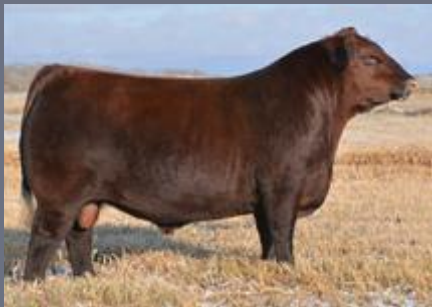
Lot 58 Sire RED SIX MILE SIGNATURE 295B

3 Embryos out of 35W and the $47,000 Reckoning making full siblings to Lot 101.