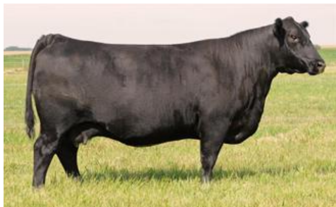
Dam of Lot 84 CARRUTHERS MAYFLOWER 43N

Lots of power here... I'm not sure how we missed her in the picture pen. Check out the strength of pedigree.