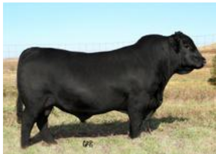
Service Sire BAR H CROSSFIRE 63A