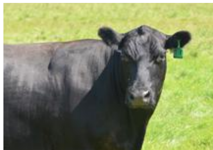
NORSEMAN EULA 11'05