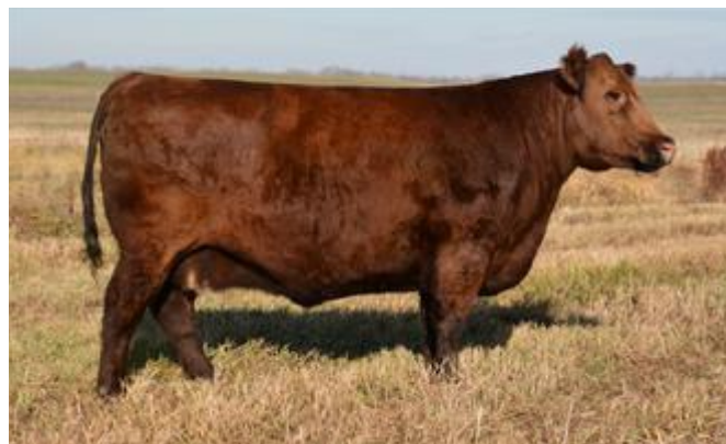
Dam RED BRYLOR NIKITA 70W

EXPOSED Red Blair's Iron Hide 630B › June 20 to 28; Red Rust North Dakota 27B › June 28 to July 22