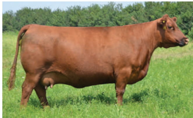
Dam RED JCC ROXIE 20S

EXPOSED Red Blair's Iron Hide 630B › June 20 to 28; Red Rust North Dakota 27B › June 28 to July 22