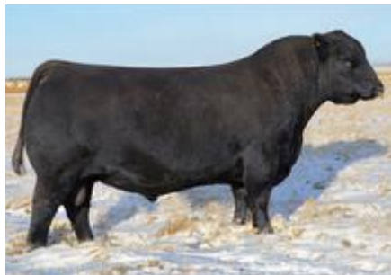
Sire LEES LATEST VERSION 002