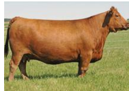
Dam MONIQUE 2K