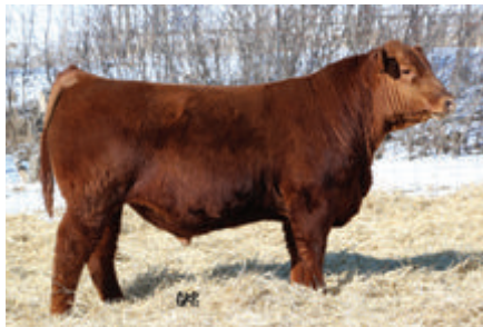
Maternal brother RED SIX MILE PLATINUM 494B

These heifer calves are right off the top of our herd and our show string- nothing is held back. Therefore, we are pairing these two March beauties giving buyers the best of the best and still allowing us to keep one in our herd. Sexy is a great word to describe this female that will be tough in the March calf division. The Syringa name is synonymous with quality and maternal ability. Lot 98's dam is a prolific female who produced the $30,000 calving ease sire, Platinum, for Scott Stock Farm, AB.