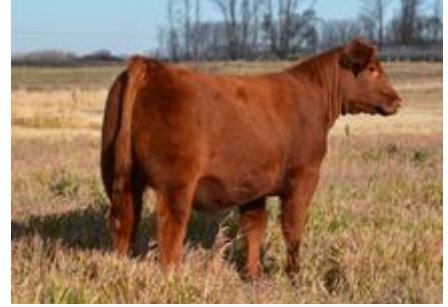
RED BLAIR'S FAY 38C

You can't miss this super stylish Kargo show prospect. She has an awesome design and tremendous eye appeal. A real standout from any angle.