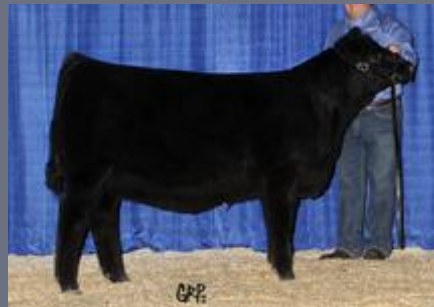
As the Agribition Calf Champion BAR-E-L ERICA 74A