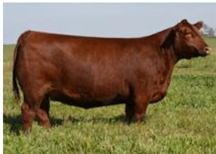
RED BLAIR'S FAITH 74Y