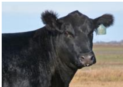
OK BELLE POWER 69X