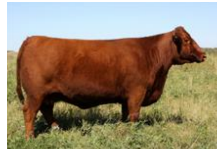
Dam RED BLAIR'S FAITH 74Y

Here's a direct daughter of the top producing Faith 8L donor that features the pattern, soundness and overall eye appeal that has made the Faith family so valuable. This Integrity daughter has developed into a super attractive female that should really click well with the powerful mating of Signature.