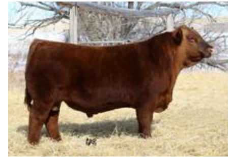
Service Sire RED SIX MILE GAME FACE 164Y

Queen is rocket fronted, deep ribbed, and dark red with an exceptional hair coat. Her dam is a direct daughter of Indeed who has always adds a little extra frame and class to her progeny. Mated early to the masterful breeding sire, Game Face.