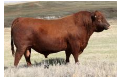
Sire RED SIX MILE TIMBERLINE 880W