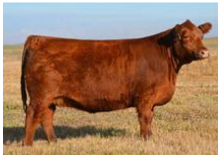
Sells as lot 28 DAUGHTER OF SOAPY 5269