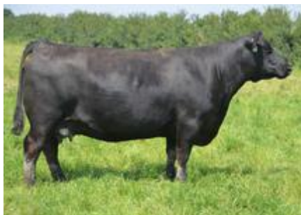
Summer 2014 NORSEMAN EULA 11'05