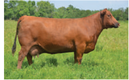
Dam RED TOWAW DARLINE 15R