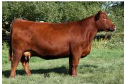
Grand-dam RED SIX MILE LAKOTO 16W

Ms Lakota is sired by the powerhouse 2014 Agribition and Farmfair Grand Champion bull, Tuff Enuff. Her dam is a twin sister to Christy Collins' champion donor, 112Y. Seven heifer calves out of 112Y averaged $19,888.00 and were sired by 3 different sires. Lot 97's grand dam, 16W, produced a $42,000 high selling female for Polzin Cattle Co to Duff Cattle Co. that went on to be crowned Senior Calf Champion at the 2015 National Western. Maternal magic with sure fire genetics