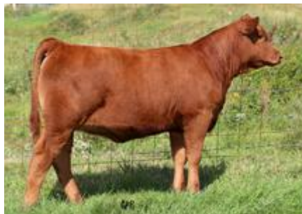
As a Calf RED SIX MILE LAKIMA LEE 493B