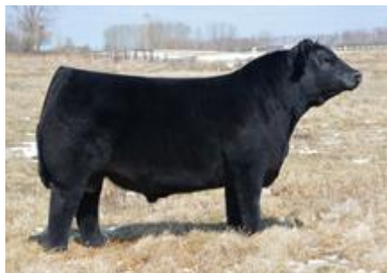
Service Sire SC WHEATLAND HIGH CLASS 401B

A lot of early visitors have this exceptional Net Worth granddaughter on their buy list. She's very complete, nice patterned and just entering the prime of her productive life. She's one of the only females in the country to be carrying the service of High Class. Exciting opportunity here.