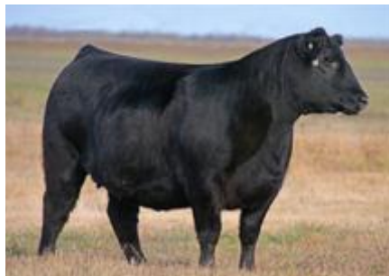
BLAIR'S TIBBIE 444A