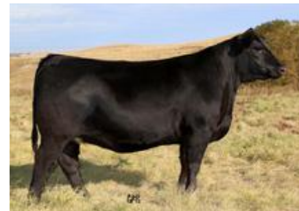
SIX MILE SUSIE 288B