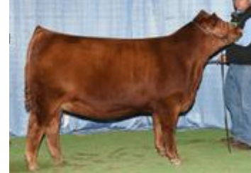
Maternal sister RED BLAIR'S BONITA 179A

We really like the job that Iron Hide is doing for us and here's the only daughter in the sale that deserves your attention. This heifer was the last natural calf out of the recently deceased donor, Bonita 204T. "37B" possesses a lot of the same qualities and traits of her fantastic mother. Bingo should really work with this one.