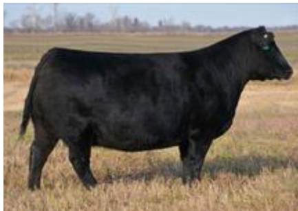
NLC UPTOWN GIRL 19U

If you want to make more Uptown Girls, here's your opportunity to own the production factory. This fantastic MC 2500 daughter adds a tremendous amount of look and quality to all of her progeny. Check out Lot 1 and Lot 66 for proof of her productivity. Lot #2 is a sister to the fantastic Fatal Attraction donor we own together with Nexera Land & Cattle. "19U" is moderate, easy keeping, neat patterned and better yet, she's safe in calf one of the most popular Angus prospects to sell last spring in "High Class."