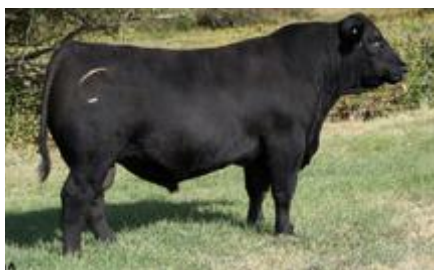
Sire CONNEALY COMPLETE