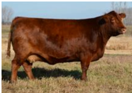
RED SOO LINE SOAPY 5269