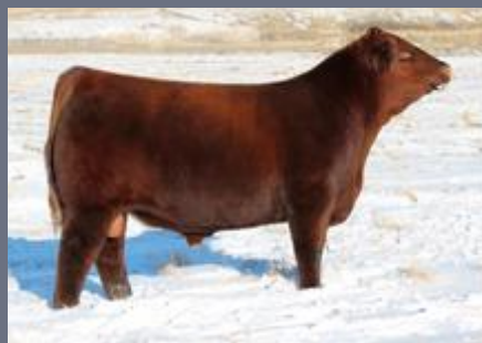
As a calf RED SIX MILE SIGNATURE 295B

One of the most extraordinary bulls to come along in some time. Signature is a rare combination of power and performance with remarkable phenotype and structure. He was awesome as a calf, winning championships at the Agribition and National Western. He continued to develop and amaze us as a yearling bull running with cows this summer. And now, we believe that you'll be even more impressed with him as an 18 month old herd sire at the upcoming winter shows. We welcome Niobrara Red Angus in Nebraska as a partner in Signature to headline their new program.