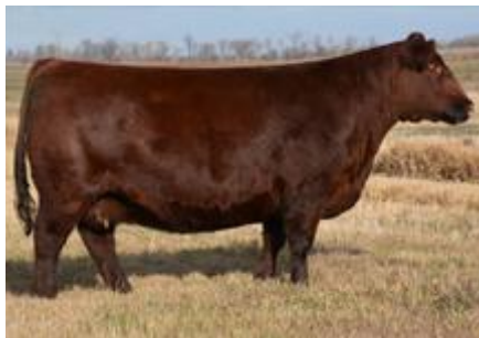
Great Grand-dam RED BLAIRS LARKABA 17T