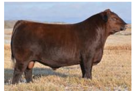
Service sire SIX MILE SIGNATURE 295B

The Smash daughters are hard to beat and this dark red powerful brood cow is one to consider. A Smash daughter was recently the top seller at the Wildcat Dispersal commanding $41,000. This girl has extra size and amazing depth of body. Her mating to Signature could be the combo that really works.