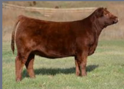
Full sib to Lot 59 Embryos SELLS AS LOT 101