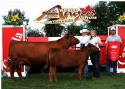
World Angus Forum 2009 CHAMPION MATURE COW

Terms to be announced. Sells with 2 Units of semen on the highly valued Towaw Indeed 104H. Six Mile is willing to manage 890S if the new owner wishes. Six Mile retains the right to 12 embryos in the future at buyers convenience, and our expense.