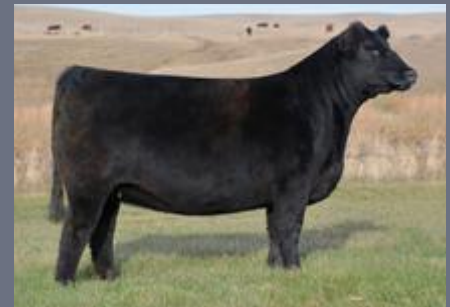
Daughter SIX MILE BLACKBIRD 149B