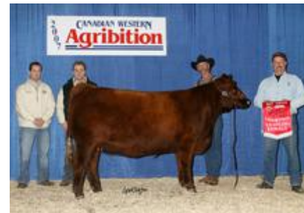
As the Agribition Junior Champion RED JCC ROXIE 20S