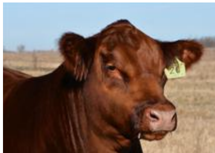
RED DOUBLE B BACKROAD 2C