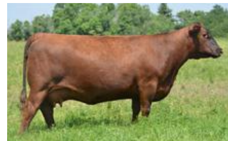
Dam RED JET FAYETTE KURUBA 8804

Another tremendous Cash daughter to add to your list. Her dam, 4U, was selected by Brylor Ranch as one of the top cows in the 2014 sale.