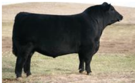
Sire SANKEYS JUSTIFIED 101

ECD March 7 to 17 (Favorable to pasture service)