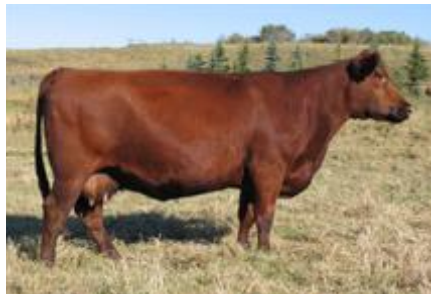
Grand-dam RED GLESBAR SYRINGAS 046S