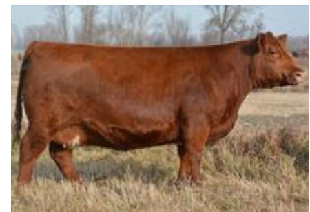
Dam RED BLAIR'S LASS 221W