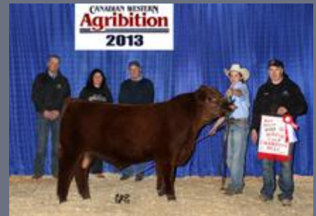
Son by Intensity PURCHASED BY TER-RON