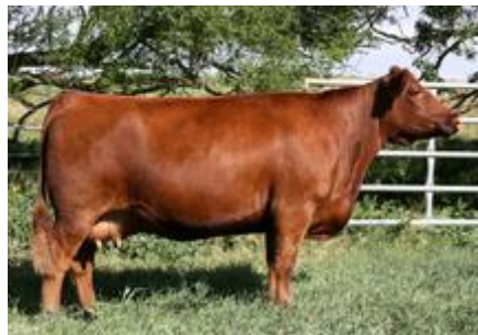
Dam RED SIX MILE LASSIE 377P

This fabulous female is a daughter of our $35,000 half interest, donor, Lassie 377P. She combines her dam's phenomenal udder structure and production ability, with her sire's explosive performance. Her first bull calf weaned with an index of 116, and is now a $16,000 calving ease sire for Red Rock Red Angus, AB. Her 2015 bull calf is one of our best. Her EPD's rank her in the top 1% of the breed for MILK, TM, MCE and MAR and top 35% for most other traits. Mated to the impressive sire Signature – this female is one you simply need to own. Terms To Be Announced – Please Call For Details.