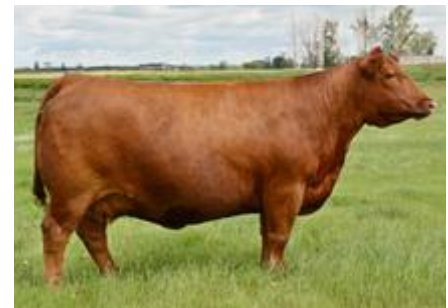
Dam of Lot 29 & 30 RED WSF MS YANKEE 13T 12W

Take your pick of these high caliber females. We're not sure which heifer is better, so we are offering them both. They are very similar in type and kind and both excel with exceptional quality and overall completeness. They are both safe to 630B, our calving ease Iron Hide x Darline heifer bull.