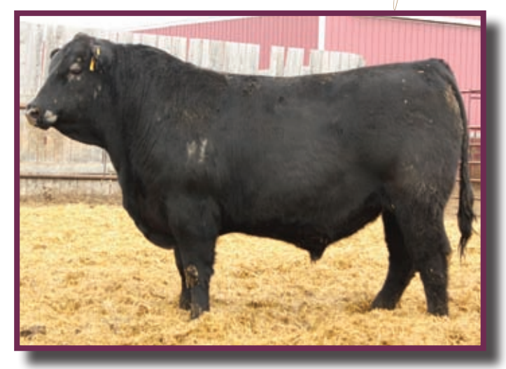
2012 High selling bull and maternal brother to Lot 18 sold to Les Schick, Ormiston, SK.