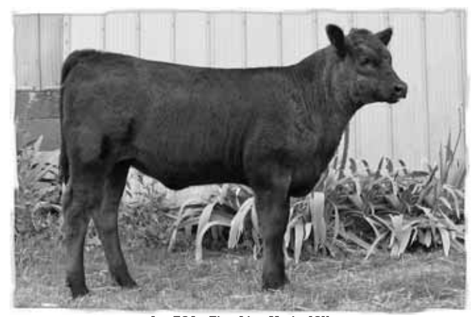
Lot 59A - First Line Marie 40Y