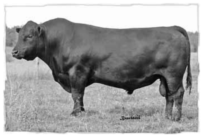
Harprey Slugger IIU

Exposed to Harprey Bando 6X from May 24 to July 31/11.