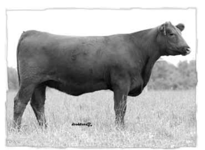
Lot 13 - Red Harprey Julie 35X