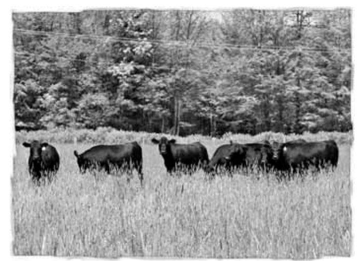
Heifers on pasture

Bred A.I. April 11/11 to Allencroft Illini 01 144J and exposed to JPD Cortachy Boy 12X April 28/11