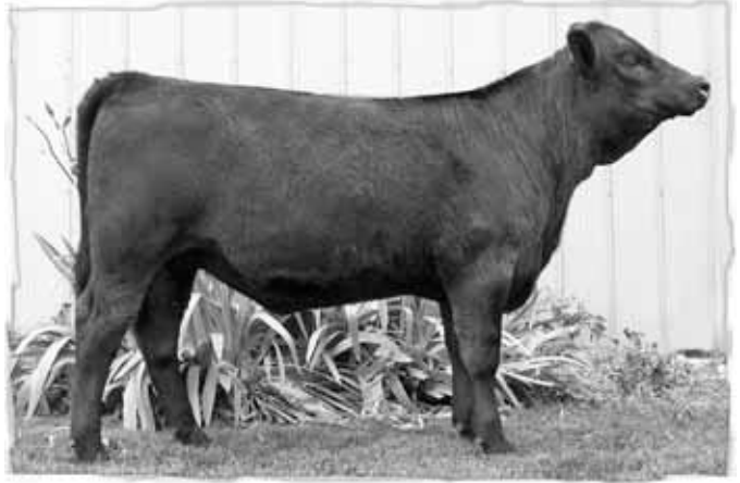
Lot 56A - First Line Wendy Lady 18Y

These Bob calves have a shorter gestation, averaging 7 days shorter, and 18Y was 6 days early with a healthy birth weight. She is already taking on her dam's appearance of broodiness and volume. 18Y is eligible for the $250 rebate if successfully completed as a 4-H project in 2012.