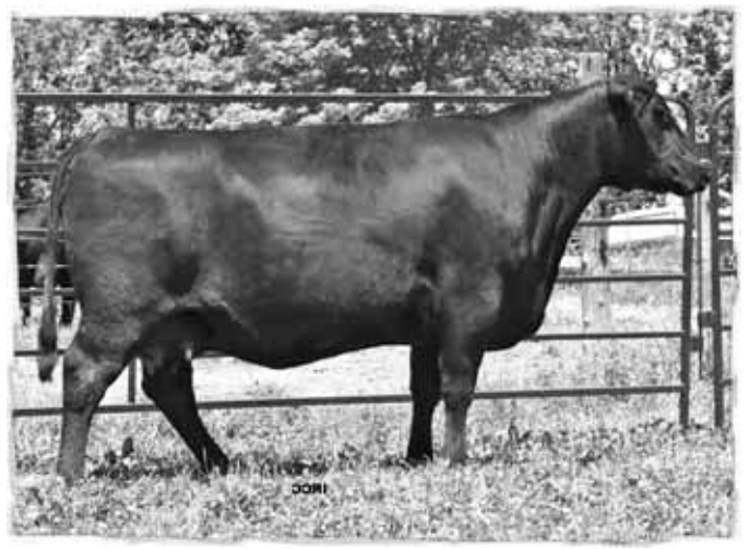
Lot 21 - Angus Acres Royal Lady 46P