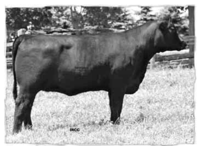
Lot 64 - Heatherlea Barbara 17X