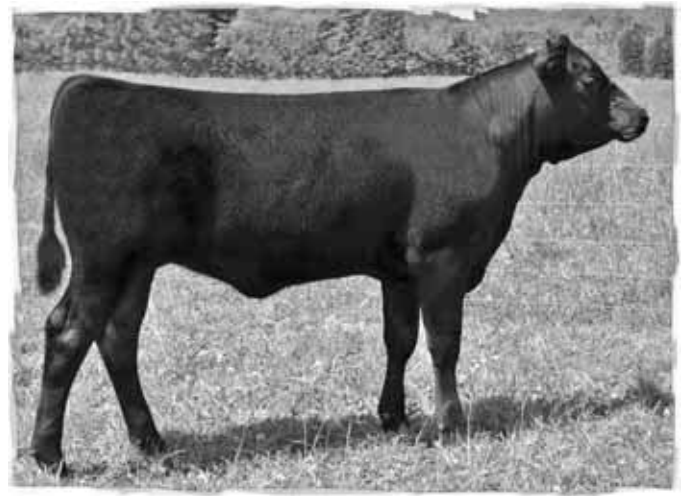
Lot 37 - JPD Cinderella 8Y

In 2009 we purchased the dam of this heifer from Domaine Trevallon as well. She is a direct descendant of 54B Blackcap, the foundation cow of our herd. We showed her dam and she stood 3rd in her class at the Royal in 2009. We are very pleased to be able to offer this sound heifer for sale and know that she will produce.