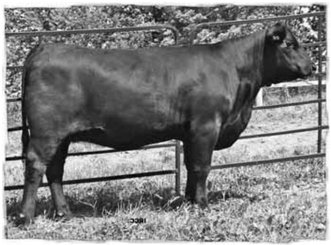
Lot 27 - Glen Islay Magic 27X