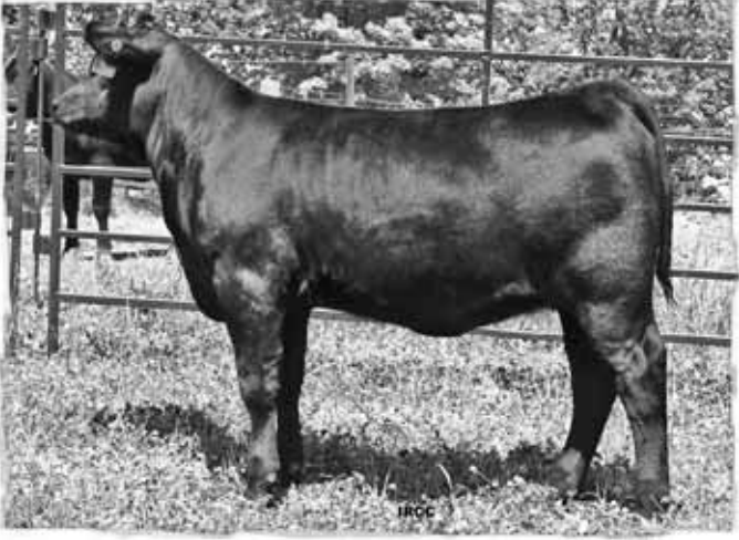
Lot 23 - Glen Islay Erica 19Y

Bred: April 6/11to Brookside Bandolier 12U.