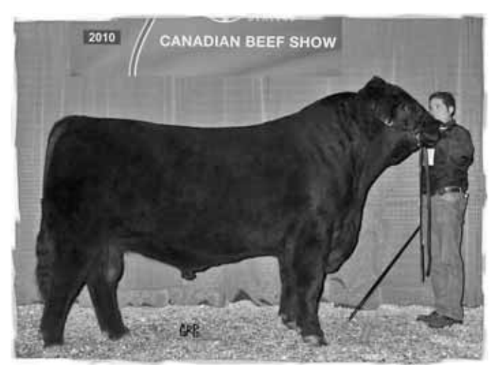
TJF Freedom 127U - Sire of Lot 38