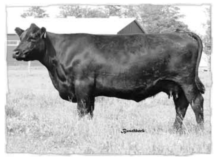
Lot 18 - Harprey Flora 37T