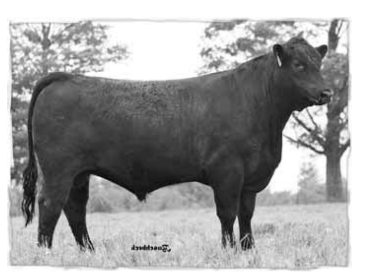
Harprey Bando 6X

Bando 6X's dam is one of Harprey's very productive females our of a noted Glen Islay flush cows.