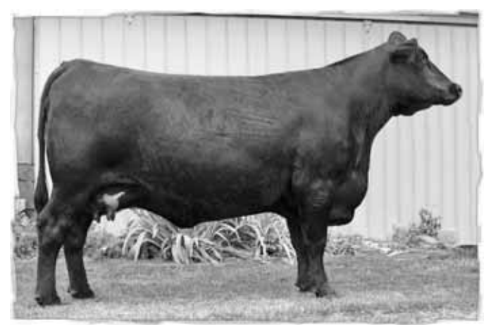
Lot 56 - Atlasta Wendy Lady 470