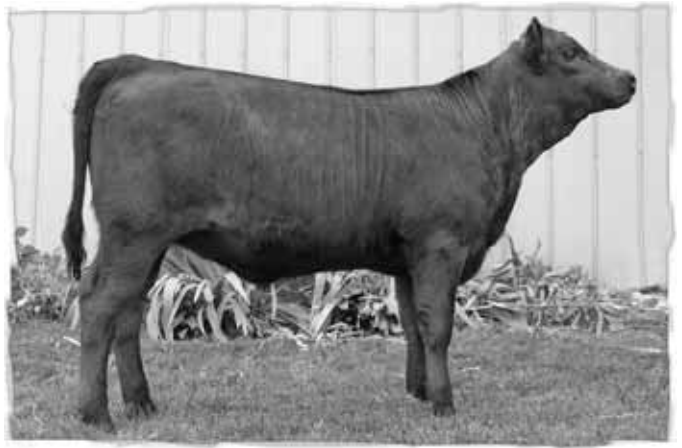
Lot 57A - First Line Juno 27Y

Another of these very good Salt Creek Bob heifer calves. They are all similar in kind, easy calving and then start putting on the pounds. 27Y is a very sound structurally correct calf. 27Y is eligible for the $250 rebate if successfully completed as a 4-H project in 2012.