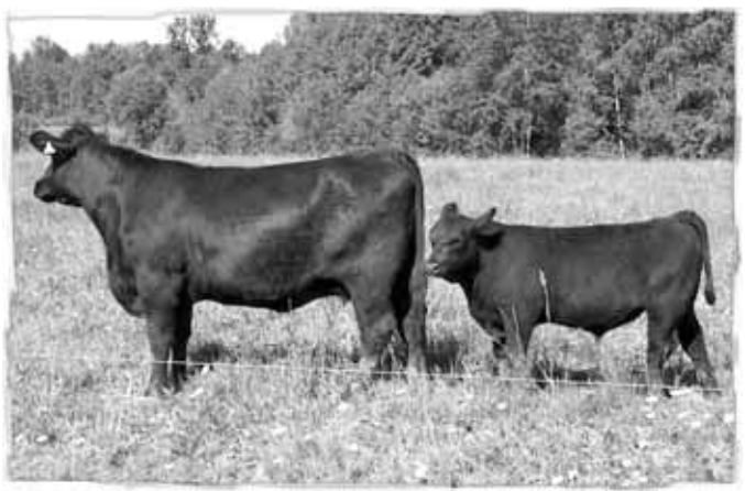
Lot 47 & 47A - Trev Flora 7W & Trev Final Chance IOY

A mid March bull calf out of Locust Grove World Angus 7W. One of our youngest calves but certainly not the lightest. Should make a good herd bull. Good bloodlines on both sides of his pedigree.