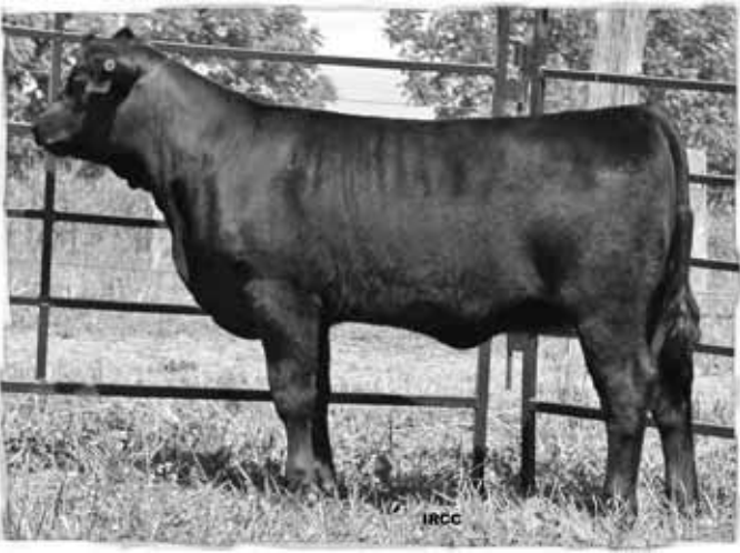
Lot 24 - Glen Islay Magic 22Y