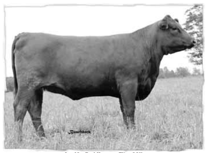
Lot 12 - Red Harprey Flint 29X