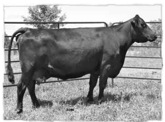
Lot 20 - Double AA Oakleaf 408'04