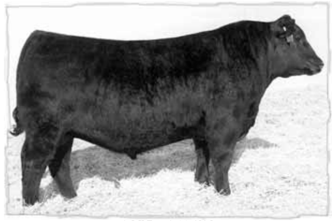
S A V Free Spirit 8164

S A V Free Spirit's offspring have exceptional muscle, eye appeal, phenotypic balance and moderate birth weights. He is one of the highest ranking bulls ever tested with the Pfizer HD 50K Genomic Test for $MVPFL.