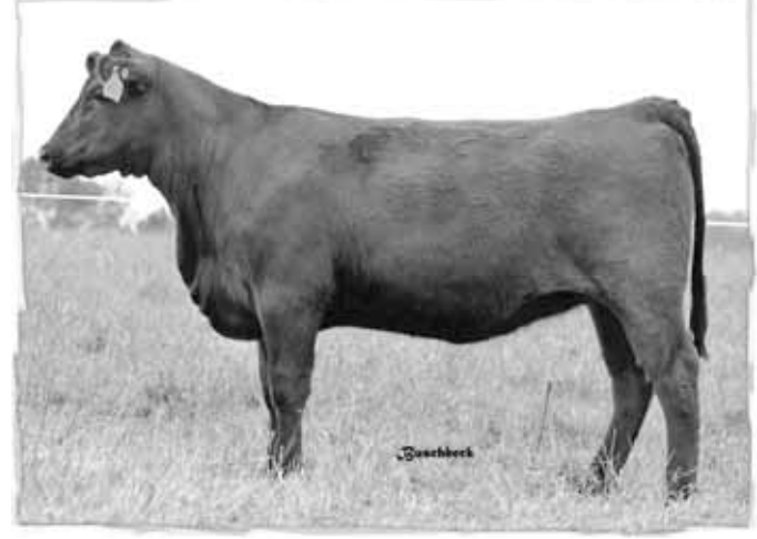
Lot 15 - Red Harprey Lindo 67X

Bred: May 11/11 to Red Glacier Chateau and exposed to Harprey Sakic 40X from June 1 to July 25/11.