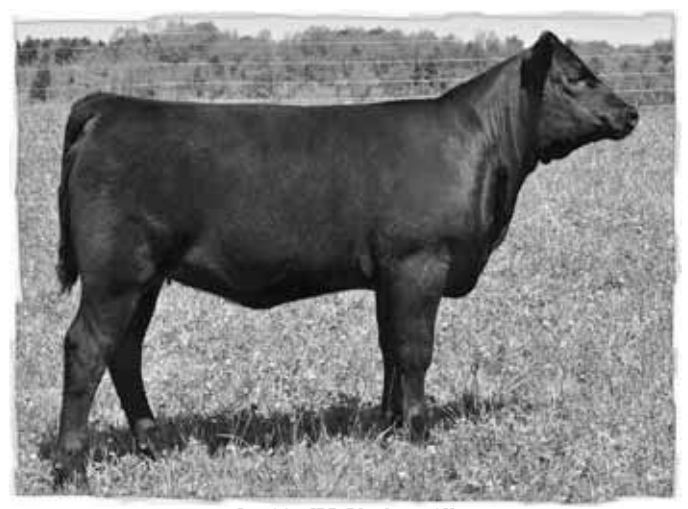
Lot 36 - JPD Blackcap 3Y

JPD Janalynne is also a Blackcap. Her grandmother was one of our all-time top producers, having had 2 sets of twin heifers and registering 15 calves in total at our farm. We are still in possession of both 3 year old twins. This heifer is sure to carry on her mother's and grandmother's consistent production.