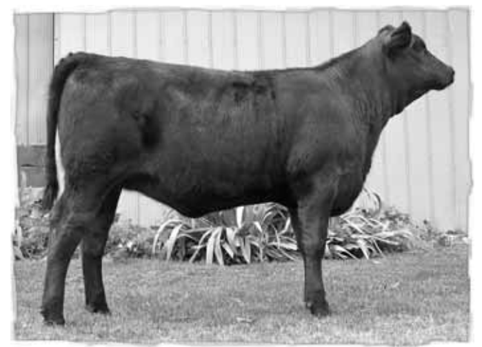
Lot 53 - First Line Countess 21Y