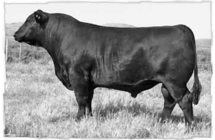
Peak Dot Resolute 37W