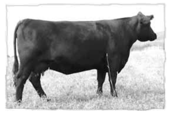
Glen Islay Erica 7G - Dam of Glen Islay Trailblazer 9T

We went to the Double AA Bull Sale in March 2009 and bought our choice of their bulls, Double AA Bardolier 119U. He is line bred Bardolene and Annie K on both sides of his pedigree and was the youngest bull in the sale. He only weighed 73 lbs at birth, but at exactly eleven months of age he weighed 1140 lbs, had 35 cm testicles and passed the semen test. He has a great hair coat, ideal structure, thick butted, big wide muzzle and absolutely perfect feet. He has maintains his condition amazingly, has a nice temperament. We are extremely pleased with his offspring and plan to continue to use him in our breeding program.