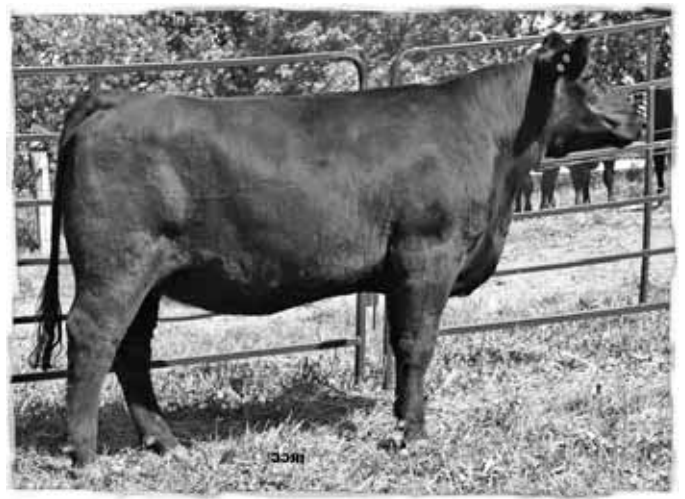
Lot 26 - Glen Islay Barbara 21X