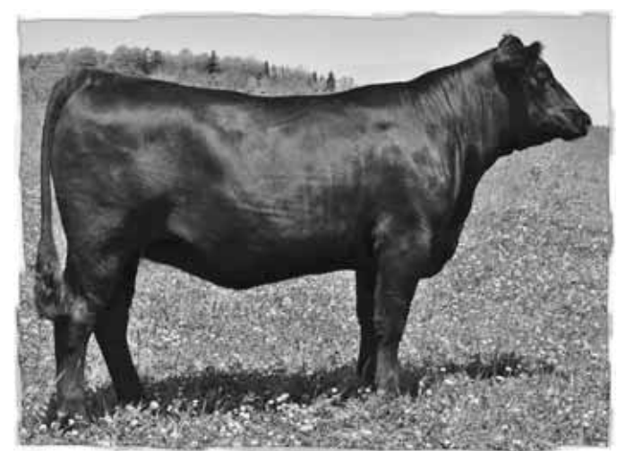
Lot 41 - Tambri Errolline I6X