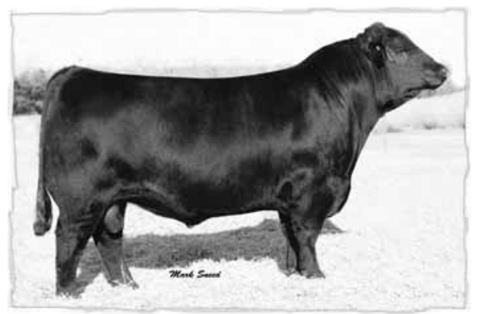
Salt Creek Bob 7003

Bred April 21/11 to SAV Pioneer and exposed June 21/11 to First Line Kodiak 8X a Kodiak 5R grandson out of an Atlasta Wendy cow.