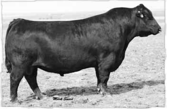
Styles Upgrade J59

Resolute is the $20,000 high selling yearling bull from the April 2010 sale to Black Ridge Angus and later leased to Semex Beef. Resolute is a high performance calving ease bull with a strong maternal heritage.