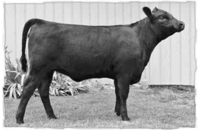
Lot 58A - First Line Miss Blackcap 17Y

This is a fault free daughter of SAV Heavy Hitter. Like her mother, she profiles nice with an exceptional length of side and real clean front. Every year when you halter break calves there is always one or two that are so good to work with, and 17Y is one of these. 17Y is also eligible for the $250 rebate if successfully completed as a 4-H project.