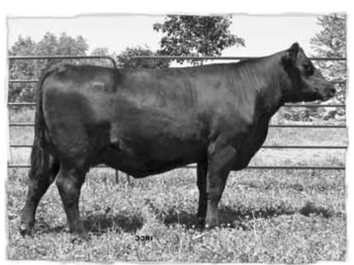
Lot 22 - Glen Islay Maggie 77U