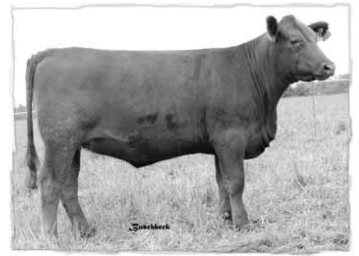
Lot 14 - Red Harprey Bonniebelle 45X

Bred: May 7/11 to Red Glacier Chateau and has been exposed to Harprey Sakic 40X from June 1 to July 25/11.