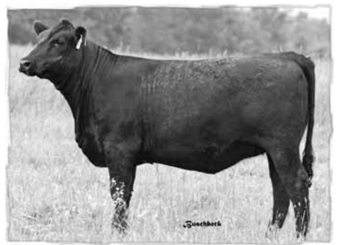
Lot - Harprey Barbara 47X

Bred April 29/11 to Peak Dot Resolute 37W and exposed to Harprey Bando 6X from May 24 to August 28/11.