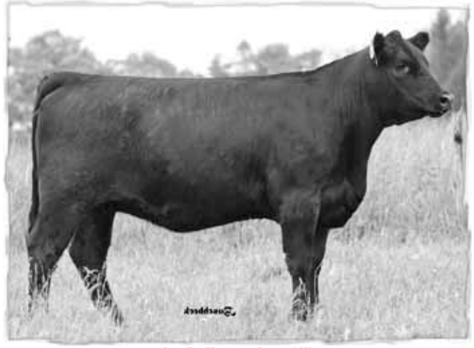
Lot 5 - Harprey Betty 8IX