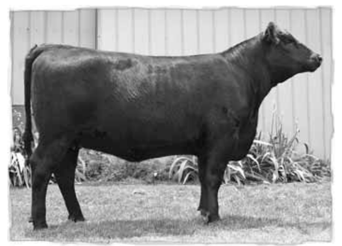
Lot 54 - First Line Rosebud IOX

Countess 21Y's dam is the last of the Basin Prime Cut cows in our herd. Countess 6N produces excellent herd bulls and solid females like this SAV Heritage daughter. 21Y is already exhibiting a lot of shape and design, just like her mother. She is very long sided, with an angular front end, sound feet and legs. 21Y is eligible for the $250 rebate if successfully completed as a 4-H project in 2012.