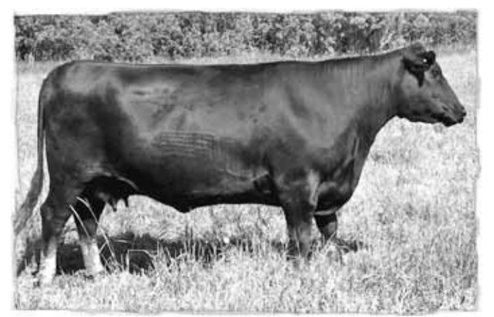
Lot 46 - Allencroft Rita 02 195P

10Y is a Final Answer 0035 bull calf that weighed 52 lbs at birth. Look at him now, his mama is doing a wonderful job as a first calf heifer. Retained show rights for Quebec gold show (trio bulls).