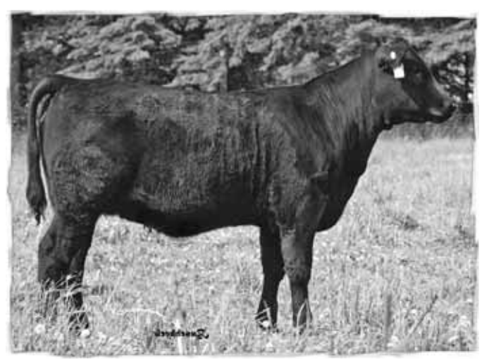
Lot 17 - Harprey Flora 14Y

A January 2, 2011 daughter of Red Fineline Mulberry 26P, who is the #1 Red Angus bull in Canada and was number 2 overall for registrations in 2010. This heifer will be a contender in the show ring both as a calf and a bred female. Her dam descends from the maternal powerhouse Red YY Red Knight 640F, who has sired some of the best Red Angus females the breed has ever seen. Sells open.