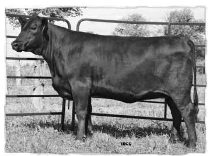
Lot 31 - Glen Islay Miss Middlebrook 29X