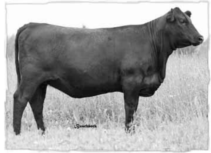
Lot 2 - Harprey Stormy Duke 34X