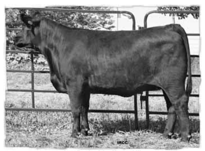
Lot 25 - Glen Islay Maggie 14X