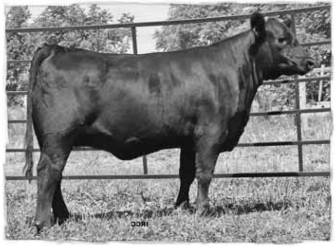
Lot 33 - Glen Islay Pride 69X