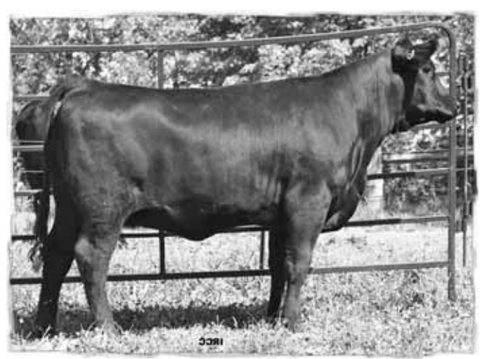
Lot 34 - Glen Islay Maggie 78X