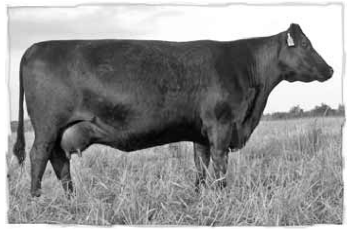
Lot 59 - First Line Marie 5R