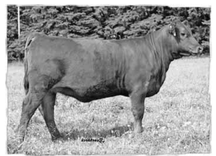
Lot 16 - Red Harprey Ruby 4Y