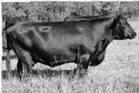
Lot 49 - LUCK Black Poulette

Probably our best looking bull calf this year in the field. He is very stylish and eye appealing with good muscle shape. Sired by the legendary Grid Maker bull recognized for performance of his progeny, and this calf is no exception. Grid Maker 16Y should be halter broke by sale day and has good potential in the show ring!