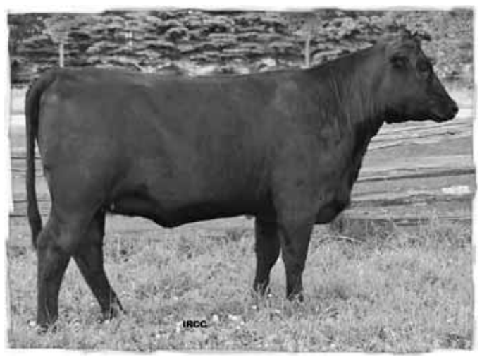
Lot 65 - Heatherlea Maggie 16X