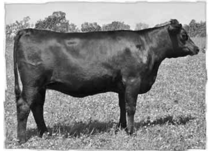
Lot 44 - Powells Erroline 4X

Michaela Chalmers Intermediate Grand Aggregate Champion Showdown 2011 in Weyburn, SK