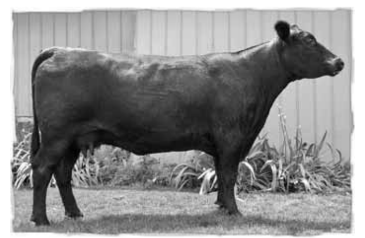
Lot 58 - Melmac Miss Blackcap 17T

MELMAC MISS BLACKCAP 17T Female MRK 17T 1377026 February 15 2007