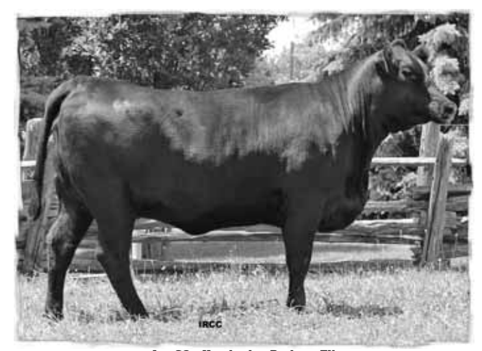
Lot 63 - Heatherlea Barbara 7X