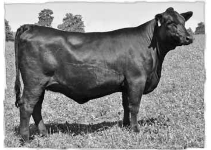
Lot 43 - Allencroft Karama Ol 282X

Exposed April 28th to JPD Cortachy Boy 12X and observed bred on May 3/11.