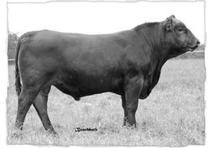
Red Harprey Sakic 40X