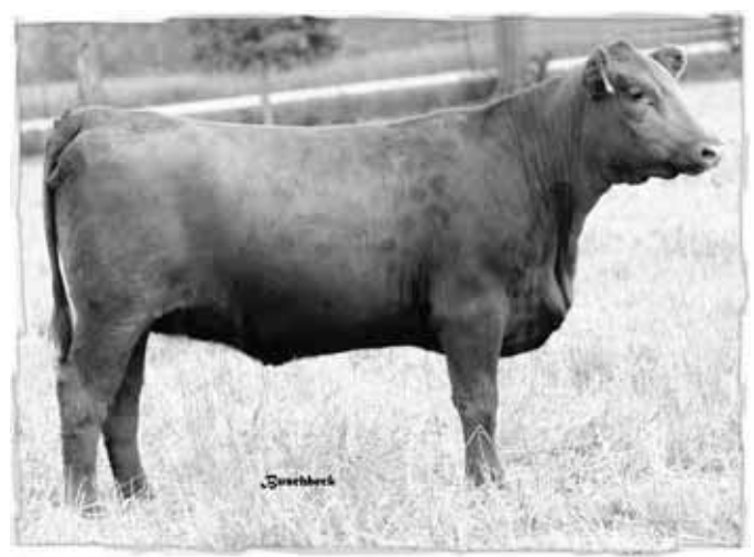
Lot II - Red Harprey Jackie 22X