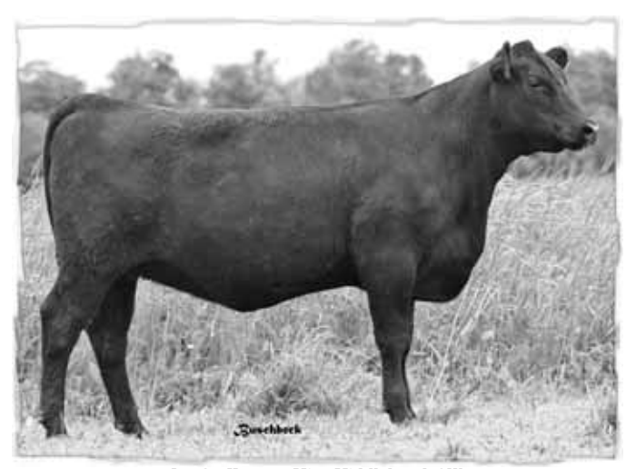
Lot 6 - Harprey Miss Middlebrook 31X