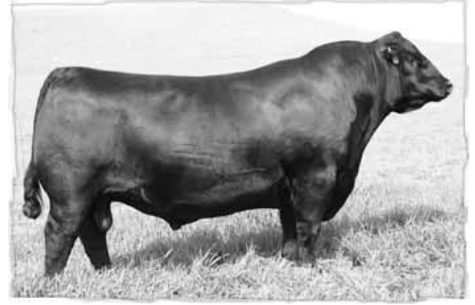
S A V Heavy Hitter 6347

S A V Heavy Hitter was the $57,500 top selling bull from the 2007 SAV Sale, a powerful phenotype and performance bull, loads of muscle, dimension and power.