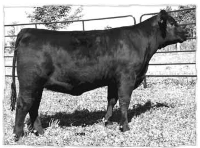
Lot 28 - Glen Islay Jennifer 43X