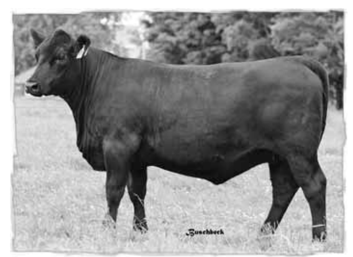
Lot 3 - Harprey Miss Middlebrook 48X