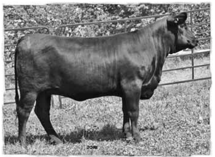
Lot 32 - Glen Islay Maggie 64X